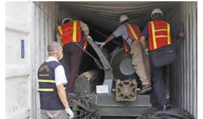
Panama forensic workers work in a container holding a missile-shaped object seized from the North Korean flagged ship "Chong Chon Gang" at the Manzanillo Container Terminal in Colon City on 17 July, 2013.