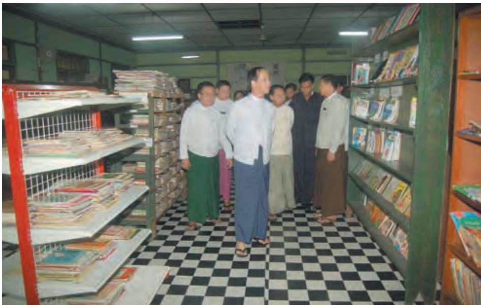
Vice-President Dr Sai Mauk Kham visits No. 4 BEHS library in Ahlon.