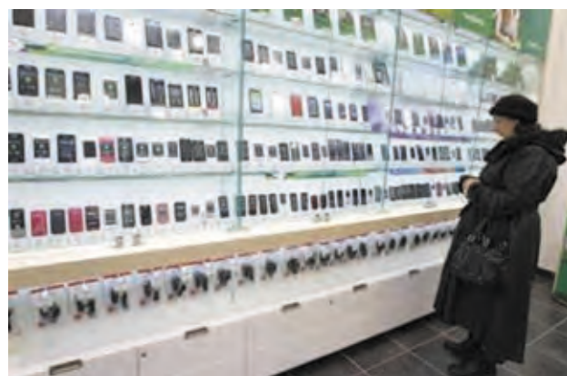
A customer looks at a display of handsets for sale inside a MegaFon shop in St Petersburg on 15 Nov, 2012.

Apple, which has a 4.5 percent share of the Russian smartphone market, can still sell in Russia through its own resale stores and other mobile phone retailers, the Financial Times reported.—Reuters