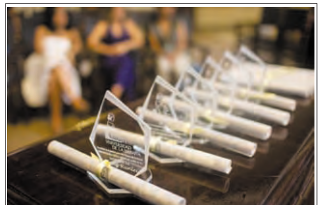
Photo taken on 16 July, 2013 shows graduation certificates of Chinese students at their graduation ceremony in the University of Havana, in Havana, capital of Cuba. According to Chinese embassy, more than 5,000 Chinese students sponsored by bilateral governments finished their study here in the past years.

More than 20,000 residents of the capital have subscribed to the service, amounting to more than 36,000 individual rides each week, a weekly increase of 7 percent.—Xinhua