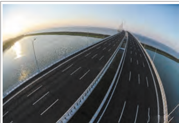
Photo taken on 17 July, 2013 shows the completed Jiashao Bridge which connects Jiaxing and Shaoxing in east China's Zhejiang Province. As the second cross-sea bridge spanning across the Hangzhou Bay, the Jiashao Bridge will be officially opened to traffic on 19 July. It will halve the travel time from Shaoxing to east China's Shanghai.

The firing is still continuing now and India's Central Reserve Police Force joined the fight. The Maoists are reportedly falling back.