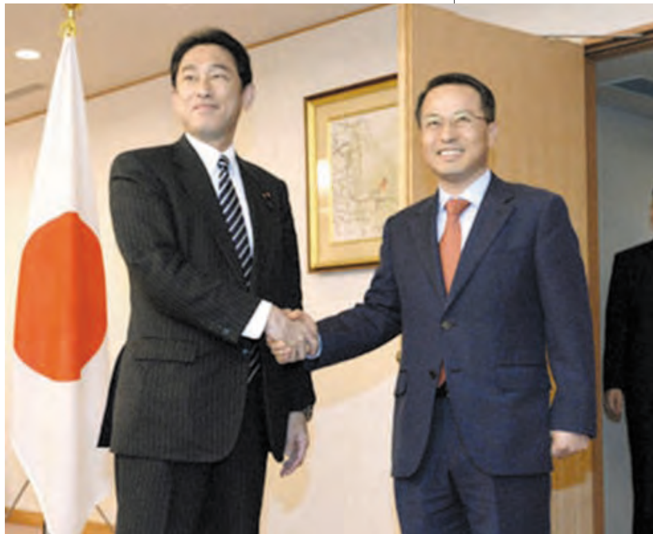
Japanese Foreign Minister Fumio Kishida (L) and South Korean First Vice Foreign Minister Kim Kyou Hyun shake hands in Tokyo on 18 July, 2013.

“difficult problems,” they are able to have a future together if they can combine their forces to resolve the