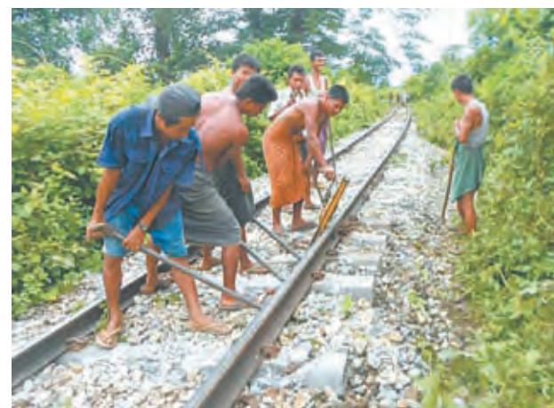
Workers seen at worksite to repair rail trucks in Indaw Township after the train had derailed.

of Myanma Railways, the railroad was reopened on 16 July morning.— MMAL-Khin Maung Swe (Mawlu)