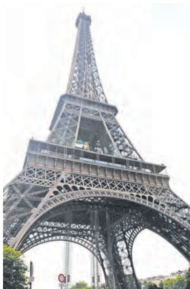
Photo shows Eiffel Tower.