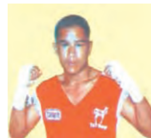
Thar Thar (T&T).

The entry fees will range from K 6000 to