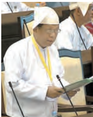
Deputy Health Minister Dr Win Myint answering questions.