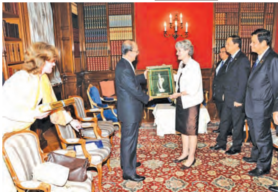
President U Thein Sein presents gift to UNESCO Director-General Mrs. Irina Bokova at Raphaen Hotel in Paris.