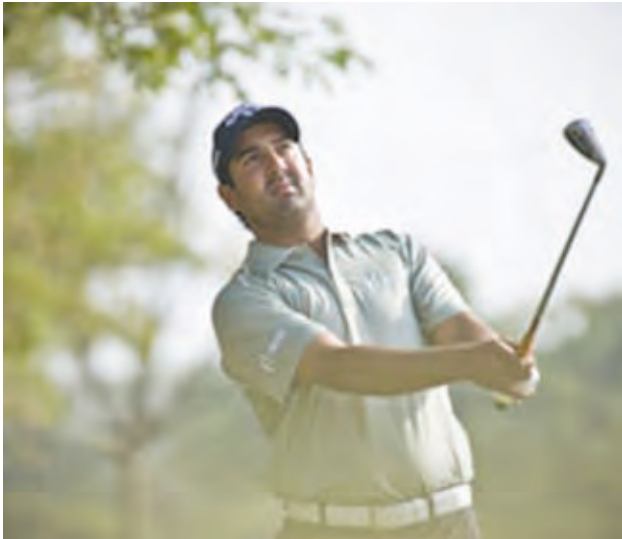
Indian golfer Shiv Kapur

MUIRFIELD, 18 July—Indian golfer Shiv Kapur went through the paces one final time today before he tees off in the first round of the world’s oldest Major, the British Open here on Thursday.