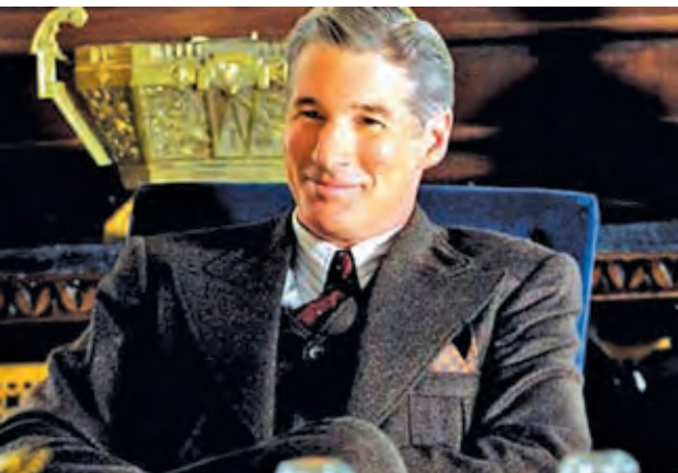
The Chicago actor is married to former Bond girl Carey Lowell.

LOS ANGELES, 18 July—Hollywood star Richard Gere says he is a tough guy on film sets, but his wife takes control when it comes to home. The 63-year-old actor, whose career has spanned