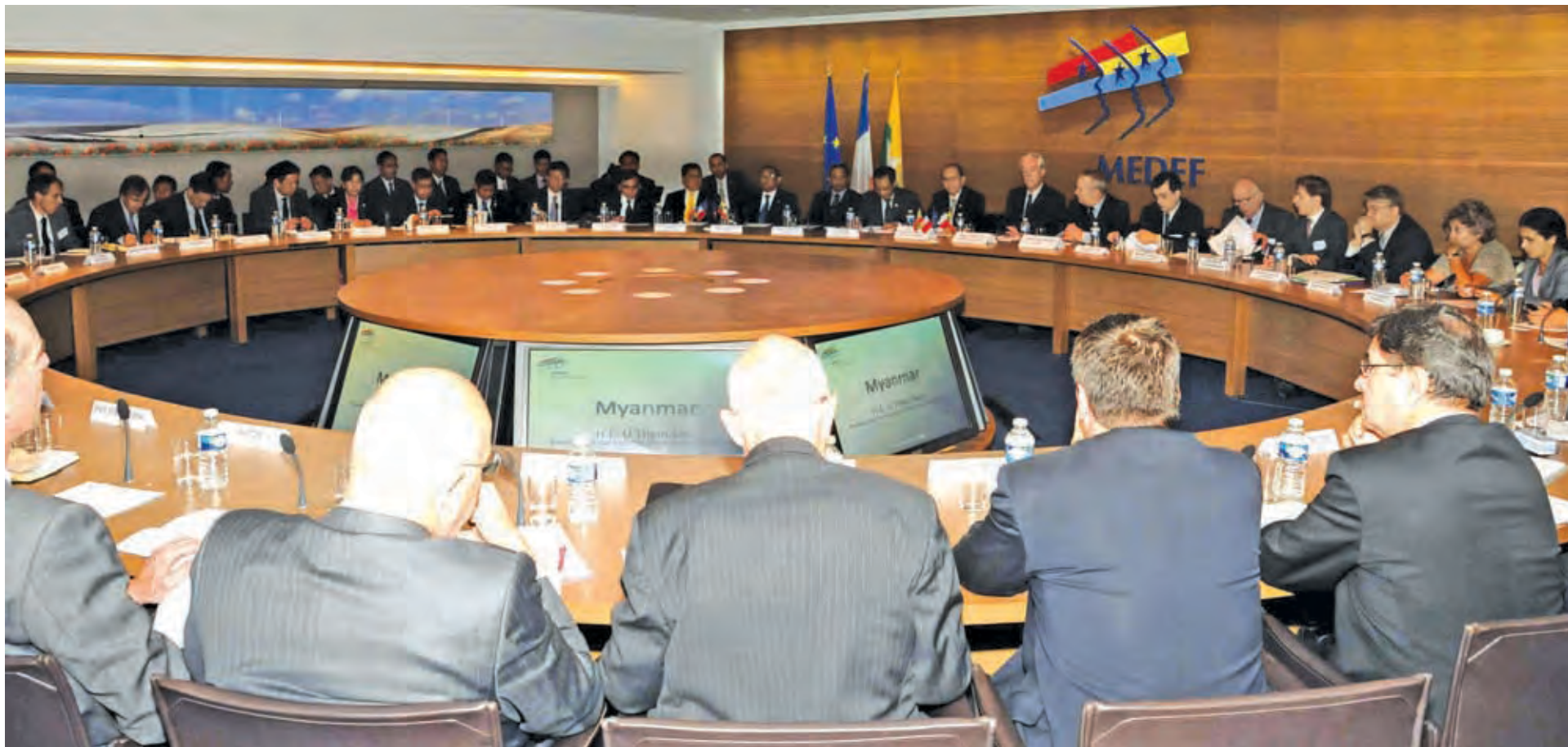
President of the Republic of the Union of Myanmar U Thein Sein meets French business community at MEDEF International.

PARIS, 18 July — President U Thein Sein met French business community at MEDEF International in Paris at 8.30 am LST yesterday.