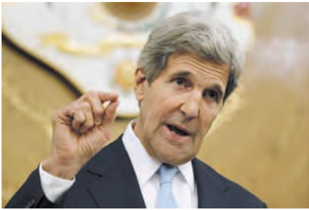
US Secretary of State John Kerry speaks during a joint news conference with Jordan's Foreign Minister Nasser Judeh (not seen) at the Ministry of Foreign Affairs in Amman on 17 July 2013.

Abbas, whose peace strategy is routinely censured by the Palestinian Islamist rivals ruling the Gaza Strip, has in the past sought support Arab League support to engage the Jewish