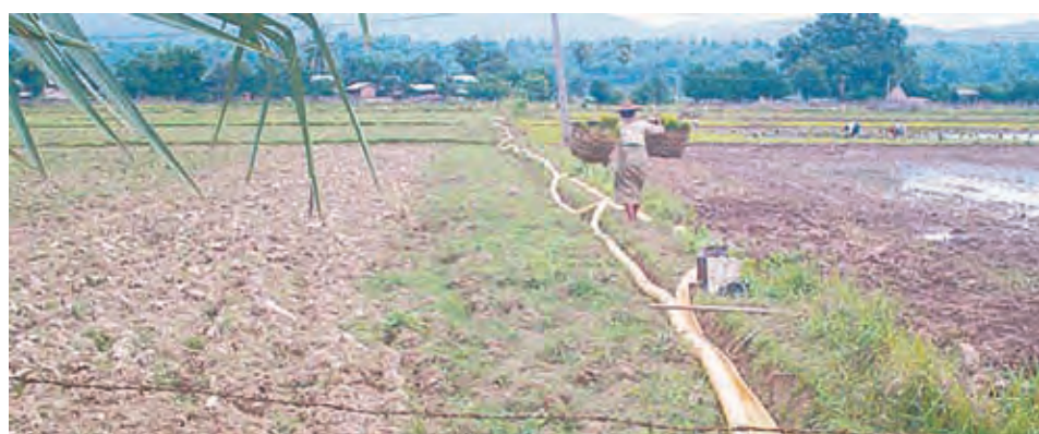
Farmers in Mawlu Township face dilemma of poor rainfall in mid-July.