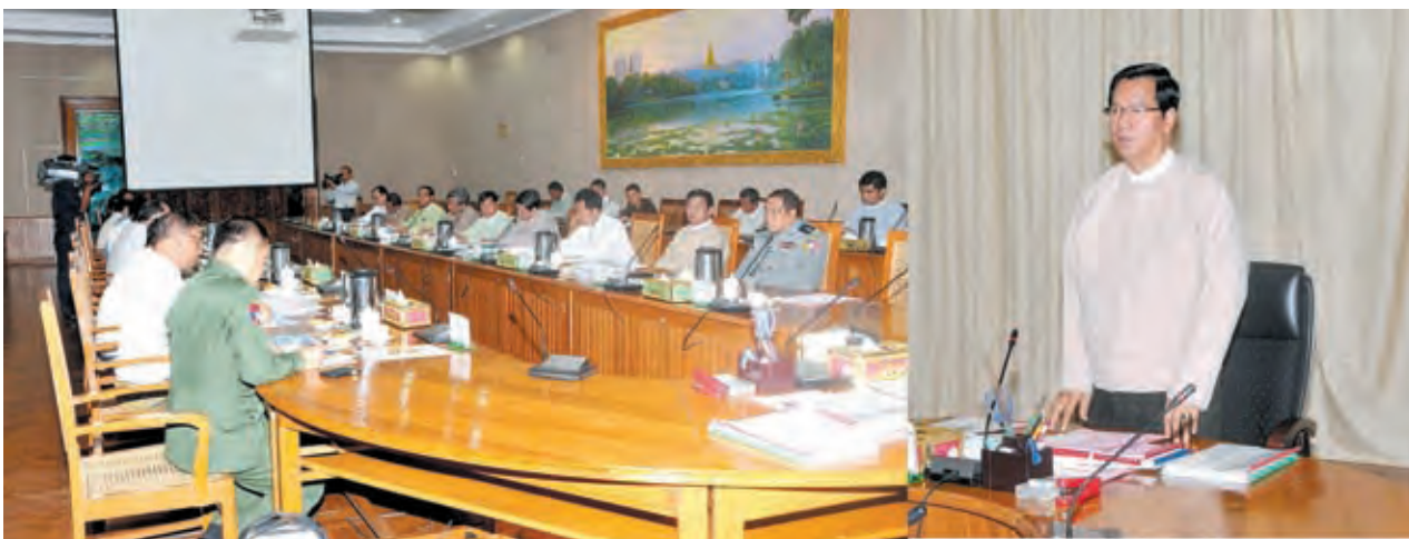
Meeting on new contract for the Latpadaungtaung copper-mine project in progress.

chairman called for the members of the committee to carry on the tasks in accordance with the law and with tolerance and to carry out