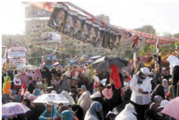
Supporters of deposed Egyptian President Mohamed Mursi gather as they rest in their sit-in area around Rabaa Adawiya mosque, east of Cairo on 17 July 2013.

CAIRO, 18 July—European Union (EU) foreign policy chief Catherine Ashton on Wednesday met with interim leaders of Egypt and urged the release of ousted President Mohamed Morsi if there are no charges against him.