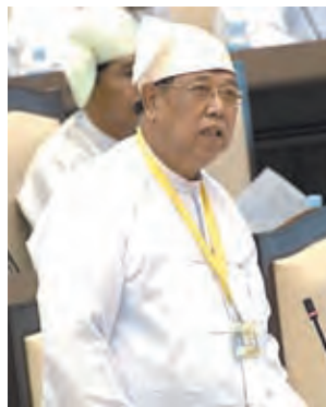
Deputy Construction Minister U Soe Tint answering queries.