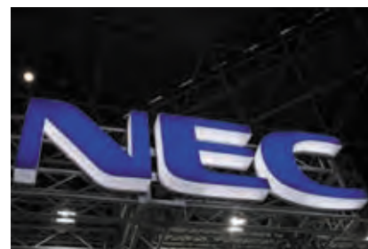
A logo of NEC Corp is seen at Wireless Japan 2012, a smartphone and mobile phone technology exhibition, in Tokyo on 31 May, 2012.