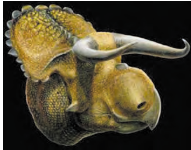
An artist's version of the newly discovered horned dinosaur Nasutoceratops titusi , discovered in the Grand Staircase-Escalante National Monument in southern Utah, is shown in this image released by the Natural History Museum of Utah on 17 July, 2013.