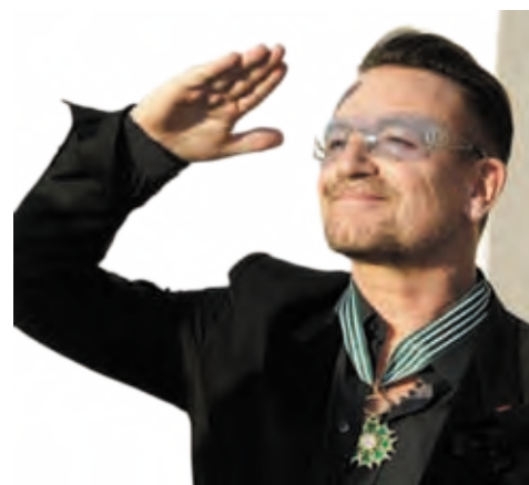
Musician Bono, lead singer of the band U2, reacts after being awarded as Commandeur des Arts et lettres (Commander in the Order of Arts and Letters) by French Culture Minister Aurelie Filippetti during a ceremony at the ministry in Paris on 16 July, 2013.

Bono, 53, has received a list of awards for his music and campaigning since form-