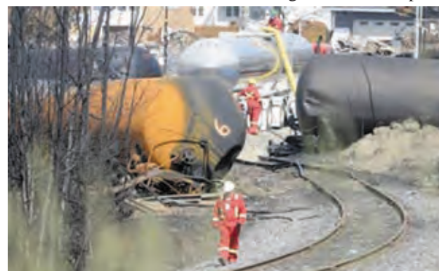
A worker walks near the railway track on the site of the train wreck in Lac Megantic, on 16 July, 2013.