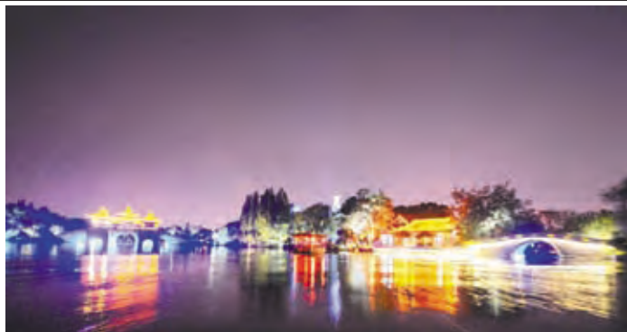
Photo taken on July 17, 2013 shows the night view of the Slender West Lake in Yangzhou, east China's Jiangsu Province. The night tour for visiting the Slender West Lake opened here on Wednesday.

During last election in July 2008, Hun Sen's party won 90 seats out of the 123 seats in the National Assembly, the opposition group gained a total of 29 seats, and the royalist group four seats.—Xinhua