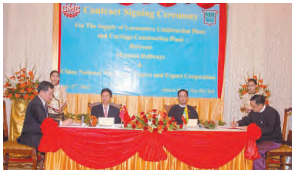
Agreement signing for construction of locomotive and coach factories between Myanma Railways and CMC from PRC in progress.