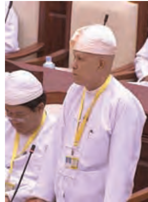
Deputy A&I Minister U Khin Zaw replying to queries.