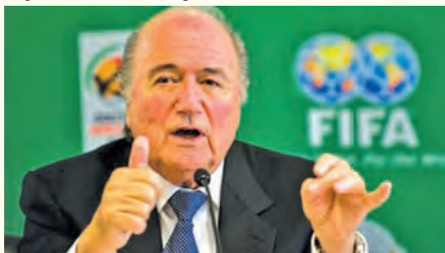
FIFA President Sepp Blatter

always important, especially losing the first set makes things difficult. You're not allowed to make many more unforced errors in crucial moments and I was