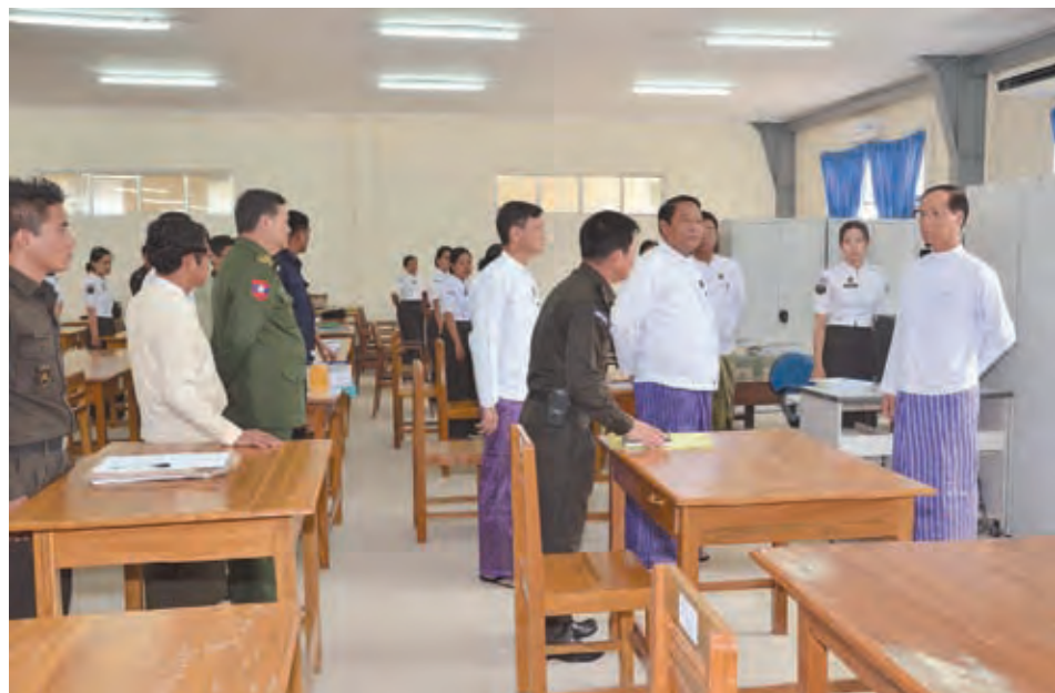
Vice-President Dr Sai Mauk Kham meets staff from the Ministry of Immigration and Population.