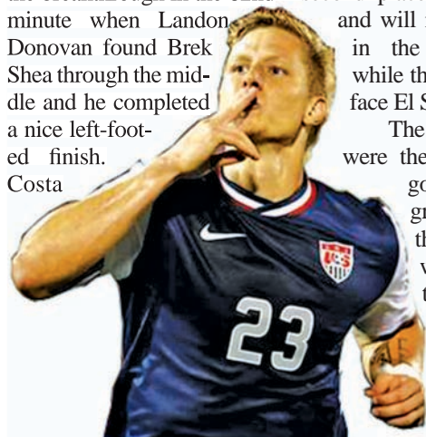
Brek Shea of the US celebrates scoring against Costa Rica during their CONCACAF Gold Cup soccer match in Hartford, Connecticut on 16 July, 2013.

most of the match and got the breakthrough in the 82nd minute when Landon Donovan found Brek Shea through the middle and he completed a nice left-footed finish. Costa