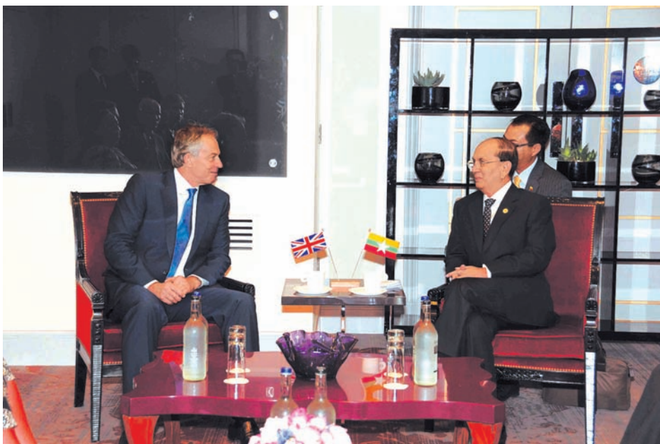
President U Thein Sein holding talks with former British Prime Minister Mr. Tony Blair.

LONDON, 17 July — President U Thein Sein received former British Prime Minister Mr. Tony Blair at Sofitel St. James Hotel at 9 am LST