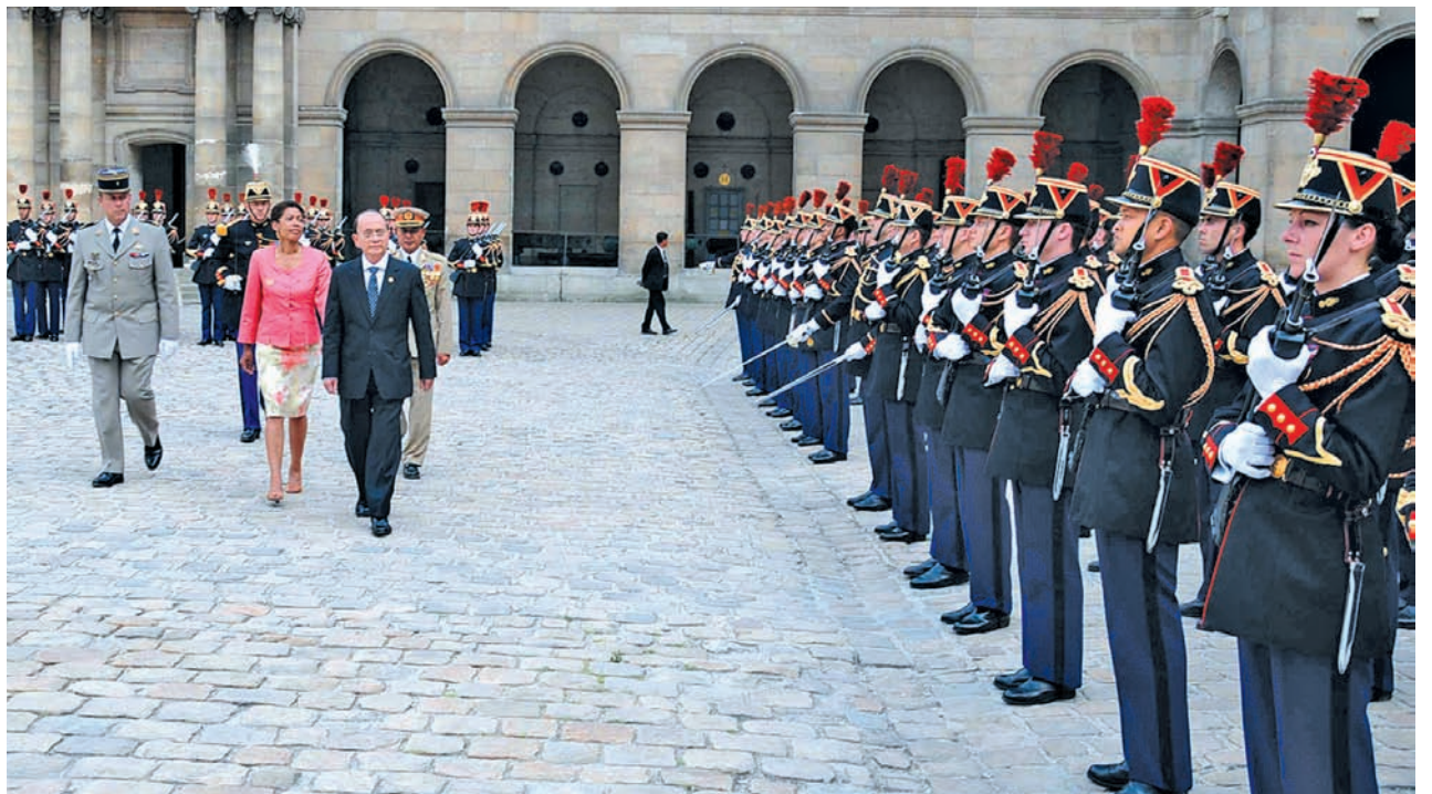
President U Thein Sein inspects the Guard of Honour at welcoming ceremony at Les Invalides.