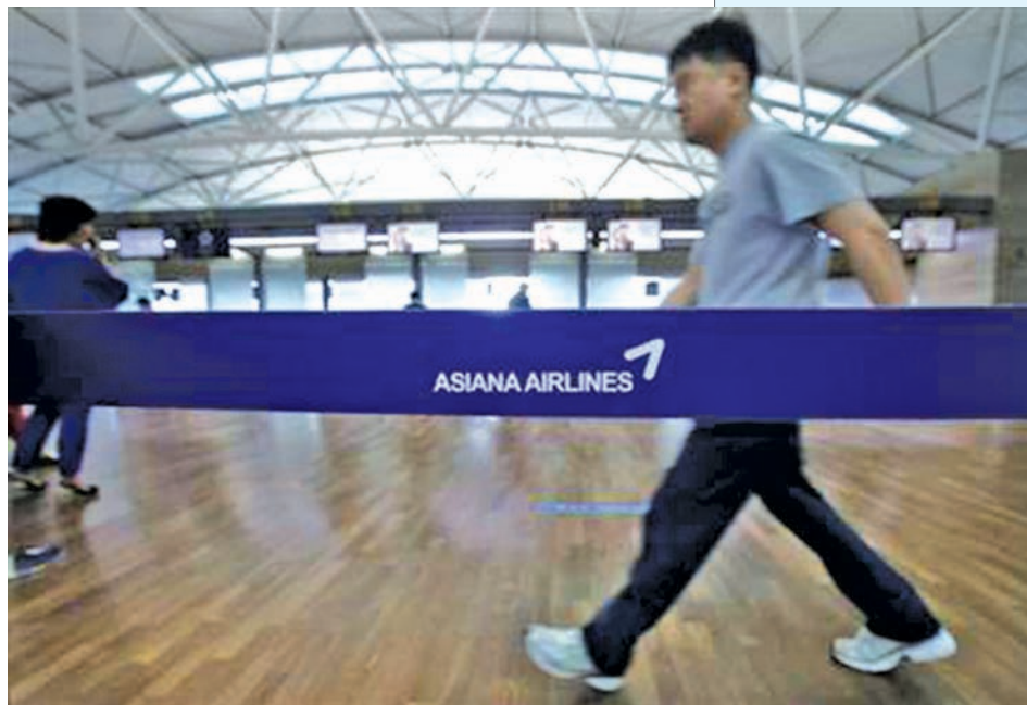
A passenger walks past a logo of Asiana Airline at the Incheon Airport in Incheon, west of Seoul on 7 July, 2013.

The incident came nine days after a Boeing 777 operated by Asiana crash-landed on 6 July at San Francisco International Airport, resulting in the deaths of three teenage girls and injuring over 180 other pas-