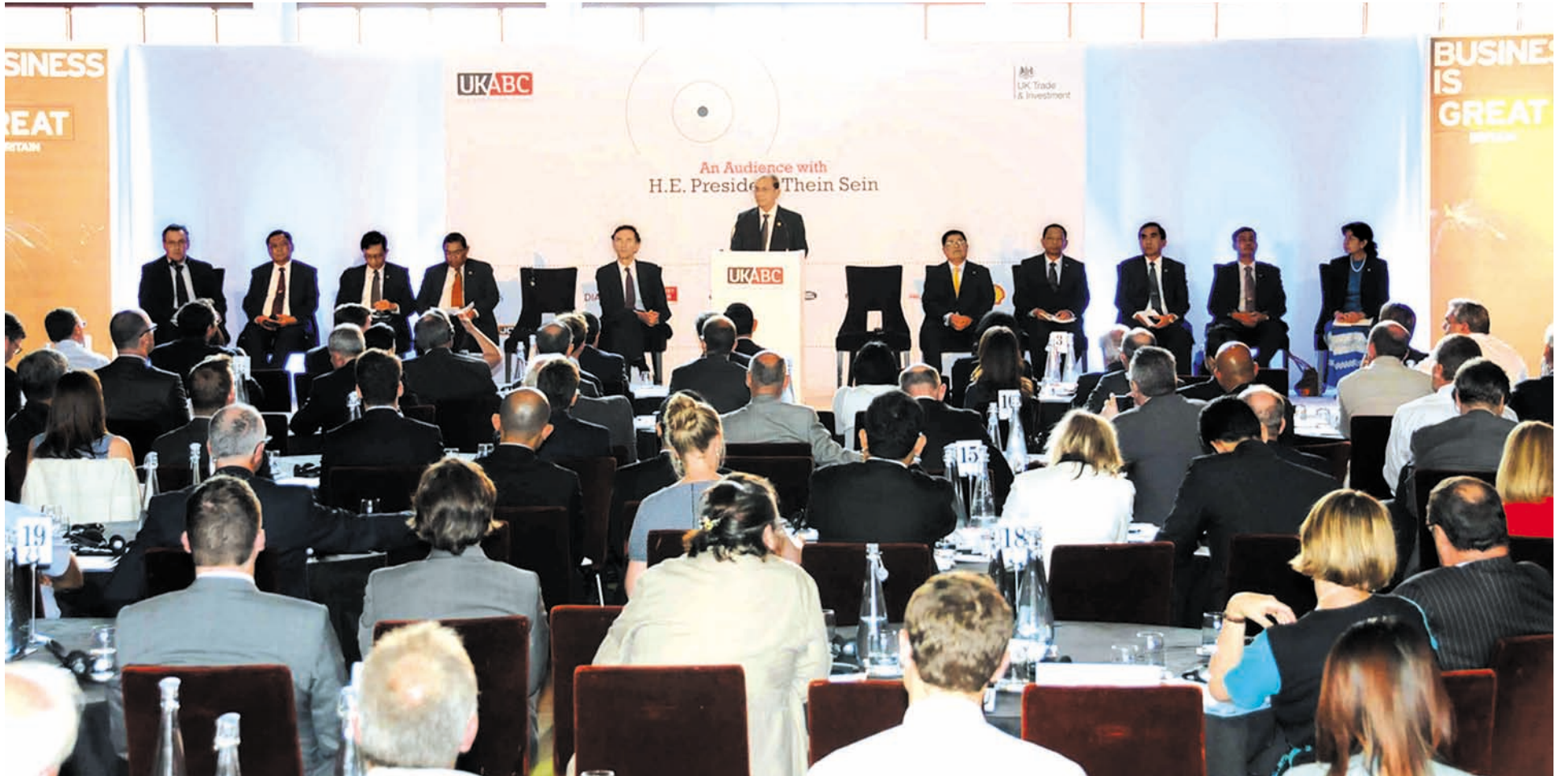
President of the Republic of the Union of Myanmar U Thein Sein delivers a speech in meeting with businessmen in Britain.

LONDON, 17 July—President of the Republic of the Union of Myanmar U Thein Sein held discussions with businessmen in Britain over breakfast at Sofitel St James Hotel in London yesterday.