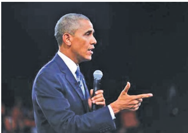
US President Barack Obama participates in a town hall-style meeting with young African leaders at the University of Johannesburg Soweto, on 29 June, 2013.