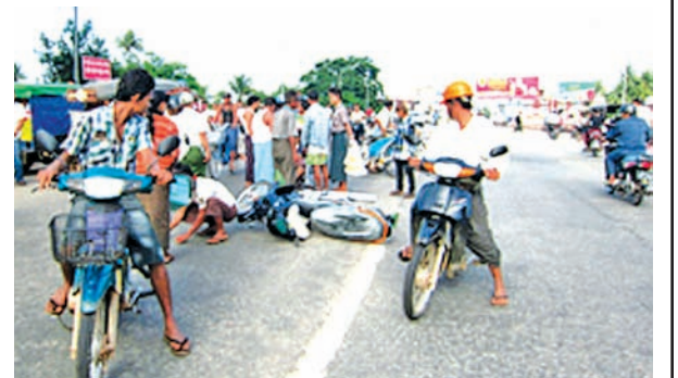
Photo shows a road accident in which a motorbike knocked down a woman who was trying to cross the road while the road near Bago market was clogged with traffic on 16 July. The accident left the pedestrian injured and the victim was taken to Bago hospital.