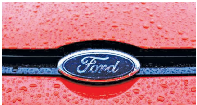
The Ford logo is seen on a vehicle at Ford car plant in Craiova, 230km (143 miles) west of Bucharest, on 29 Oct, 2012.