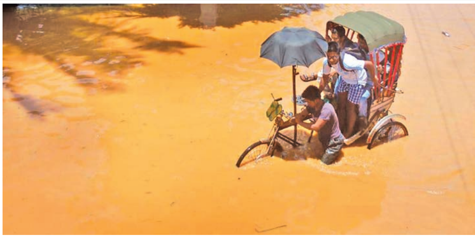
A rickshaw puller pushes his vehicle through a waterlogged street in Gauhati, capital city of Assam, India, on 16 July, 2013. Heavy showers flooded some areas in the city on Tuesday.—XINHUA