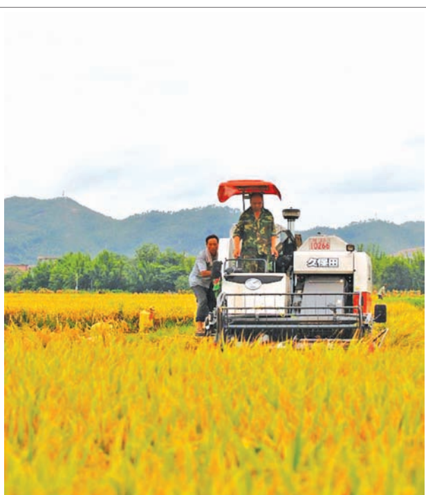
Farmers harvest the rice in Butou Township of Xingguo County, east China's Jiangxi Province, on 16 July, 2013. According to the local agricultural department, the total output of early rice in Jiangxi will increase 200 million kilograms, reaching 8.6 billion kilograms.—XINHUA

The accident forced the railway service from Phrae up north to be temporary out of service. The State Railway of Thailand is now investigating the cause of the accident.—Xinhua