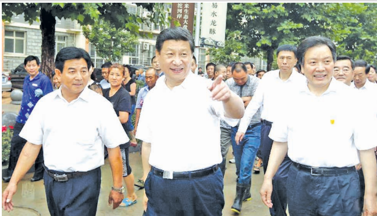
Chinese President Xi Jinping (C front) visits cadres and villagers of Tayuanzhuang Village in Zhengding County, north China's Hebei Province. China's top leadership has called on local officials to vigorously promote the "mass line" education campaign and apply it to boosting development and people's livelihoods. "Mass line" refers to a guideline under which CPC officials and members are required to prioritize the interests of the people and persist in representing them and working on their behalf.