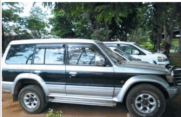
Unlicensed vehicles seized in PyinOoLwin.

PYINOOLOWIN, 17 July— PyinOoLwin police seized three luxury cars in the township recently.