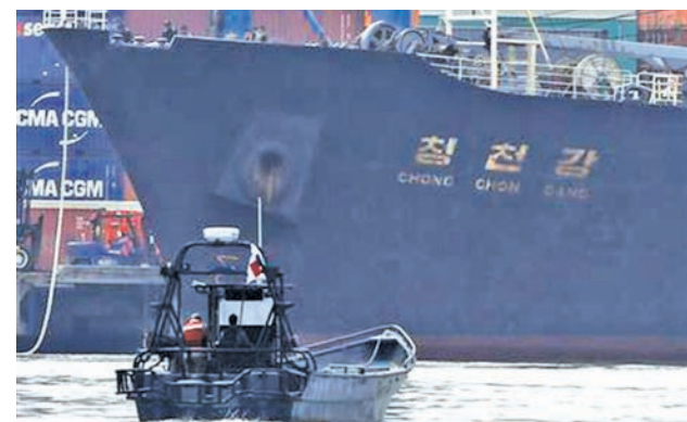
North Korean container ship "Chong Chon Gang" docks at the Manzanillo International Container Terminal in Colon City on 16 July, 2013.

Cuba said on Tuesday evening that the ship was loaded at one of its ports with 10,000 tons of sugar and 240 tons of "obsolete defensive weaponry," according to a statement by the Cuban Foreign Ministry. Cuba said the weapons were being sent