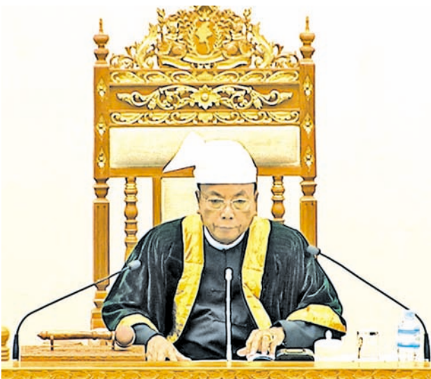
Speaker of Amyotha Hluttaw presides over today's session of Amyotha Hluttaw.

NAY PYI TAW, 17 July—The First Amyotha Hluttaw seventh regular session continued today.