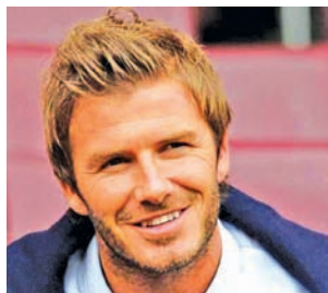
David Beckham admits he will be ecstatic if the royal baby is named after him.

LONDON, 17 July — Soccer star David Beckham thinks the royal baby should be named after him