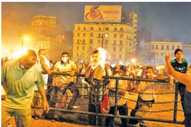
Supporters of deposed Egyptian President Mohamed Mursi hold up a Mursi poster during clashes with riot police in Ramsis square area in central Cairo on 15 July, 2013.

The ministers took up their posts hours after seven people were killed and more than 260 wounded