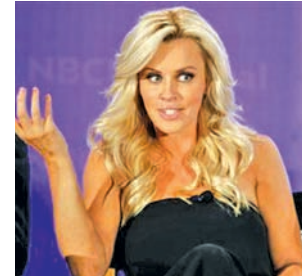
Actress Jenny McCarthy, host of the new reality series "Love in the Wild" takes part in a panel discussion at the NBC Universal Summer Press Day 2012 introducing new television shows for the Summer season in Pasadena, California on 18 April, 2012.

"Jenny brings us intelligence as well as warmth and humour. She can be serious and outrageous," said Walters, who created the show in 1997 and has said she planned to retire next summer.