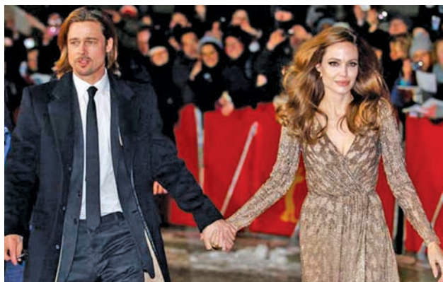
Brad Pitt partied with friends in France and Italy.