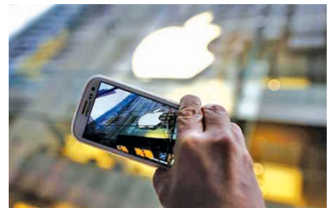
A passerby photographs an Apple store logo with his Samsung Galaxy phone on the morning iPhone 5 goes on sale to the public in central Sydney on 21 Sept, 2012.

A new free iPhone app called TheLadders takes a different approach and sends a list of job opportunities to users based on their employment profile