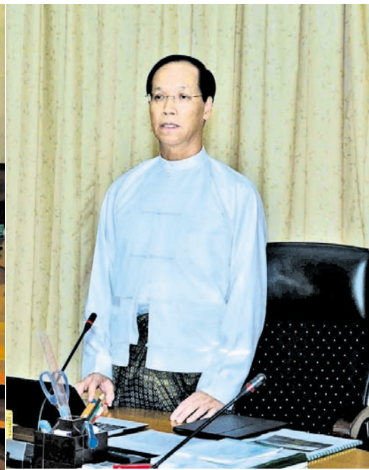
Vice-President Dr Sai Mauk Kham addresses meeting of Central Committee for Implementation of Peace and Stability and Development of Rakhine State.

NAY PYI TAW, 17 July—Vice-President Dr Sai Mauk Kham addressed the coordination meeting (4/2013) of Central Committee for Implementation of Peace and Stability and Development of Rakhine State held at the Ministry of