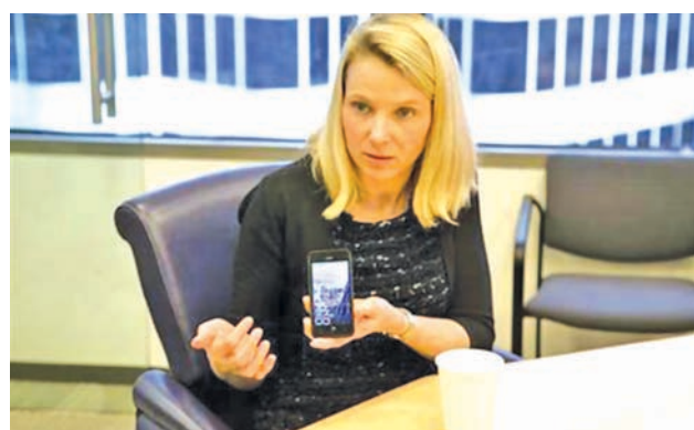
Marissa Mayer, President and CEO of Yahoo, answers questions during the Reuters Global Technology Summit in the Thomson Reuters offices in San Francisco, California, on 20 June, 2013.

Marketers increasingly prefer to buy online adver-