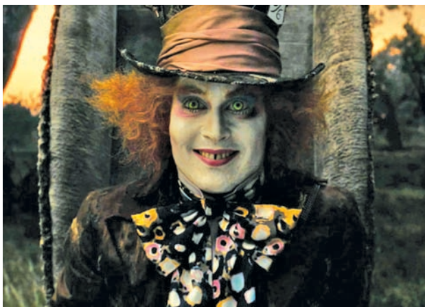
Johnny Depp will sign a new deal with Disney to feature in Alice In Wonderland 2.

LOS ANGELES, 17 July — Actor Johnny Depp will return as the Mad Hatter in Alice In Wonderland 2 after negotiating a deal with Disney.