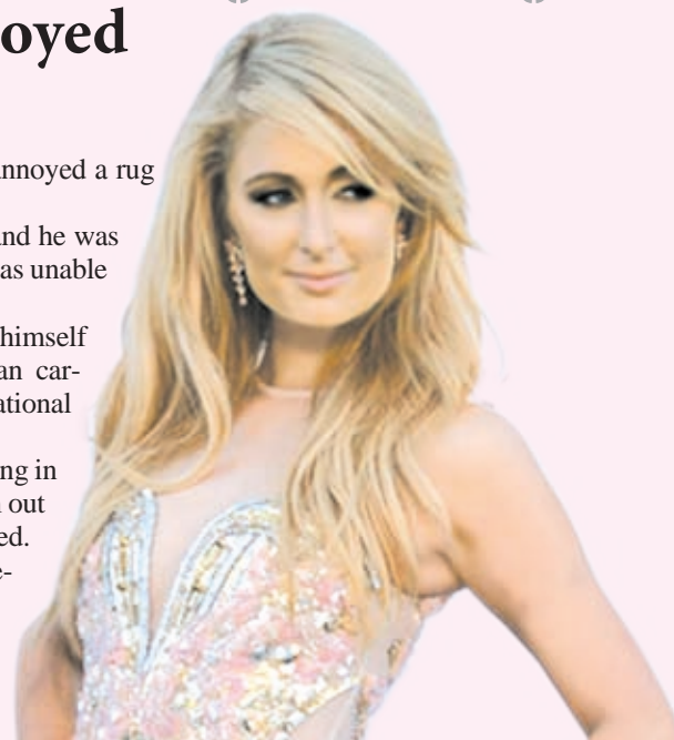
The socialite was driving at almost twice the speed limit.

“Suddenly he snapped out of it, jumped up and said, ‘I’ll take it,’” the source said.—PTI