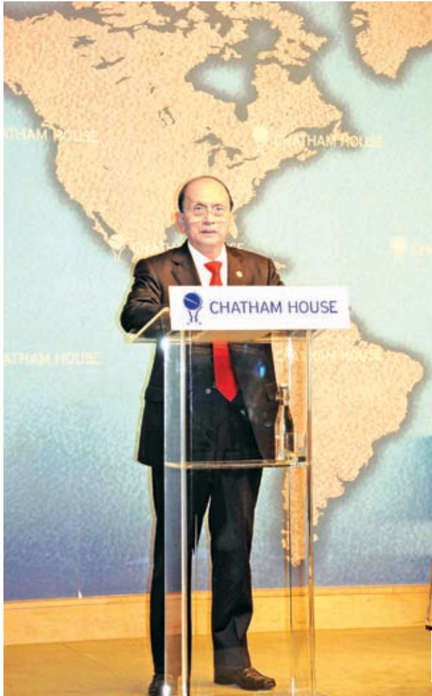
President of the Republic of the Union of Myanmar U Thein Sein delivers speech at roundtable discussion on Myanmar's complex transformation at Chatham House in London. —MNA

LONDON, 16 July— President U Thein Sein addressed the roundtable discussion on Myanmar's complex transformation: prospects and challenges held at the Chatham House in London yesterday.