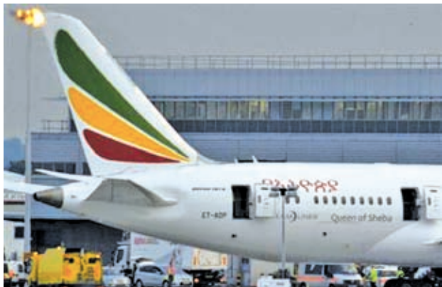
Emergency services attend to a Boeing 787 Dreamliner, operated by Ethiopian Airlines, after it caught fire at Britain's Heathrow airport in west London on 12 July, 2013.

WASHINGTON, 16 July—Investigators are looking into whether a fire on a Boeing (BA.N) Dreamliner in London last week was caused by the battery of an emergency locator transmitter built by Honeywell International Inc (HON.N), according to a source familiar with the probe.