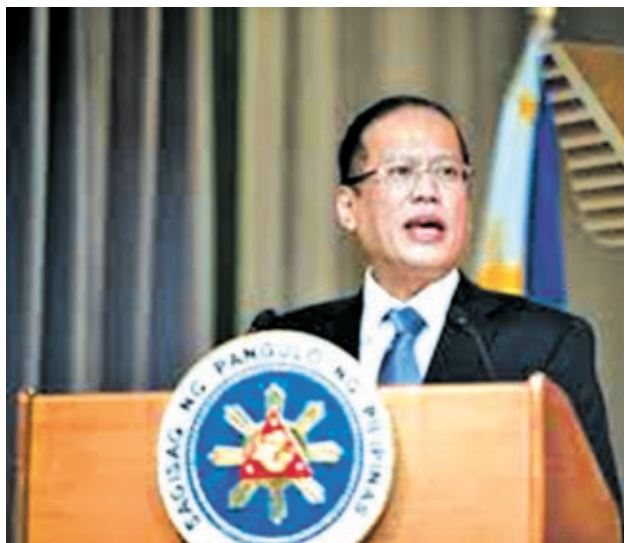
Philippine President Benigno S Aquino III