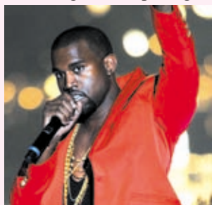
Kanye West has also been arrested in the past for smashing up a paparazzo’s equipment.

West also reportedly tried to grab the photogra-