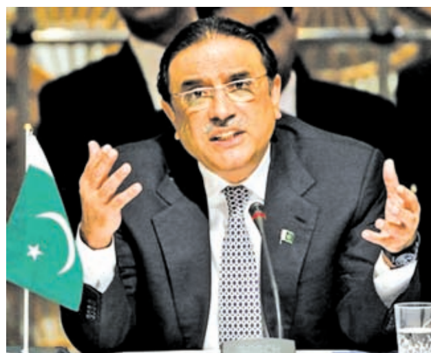
Pakistani President, Asif Ali Zardari

The spokesman denied Pakistani media reports that the president will not return to the country before the