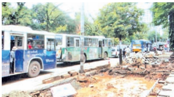
Recent photo shows nose-to-tail buses moving at a snail's pace near a traffic lights on Theinbyu street on which passengers are always caught in the rush hour snarl-up.