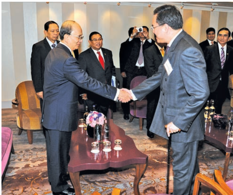
President U Thein Sein greets entrepreneur of Britain at Sofitel St James Hotel.—MNA

The briefing was attended by the German Ambassador to Myanmar and media men.—MNA