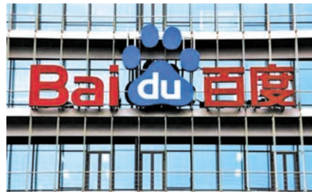
The company logo of Baidu can be seen on its headquarters located in Beijing on 24 March, 2010.

China's mobile Internet market is expected to double to about 300 billion yuan ($48 billion) in