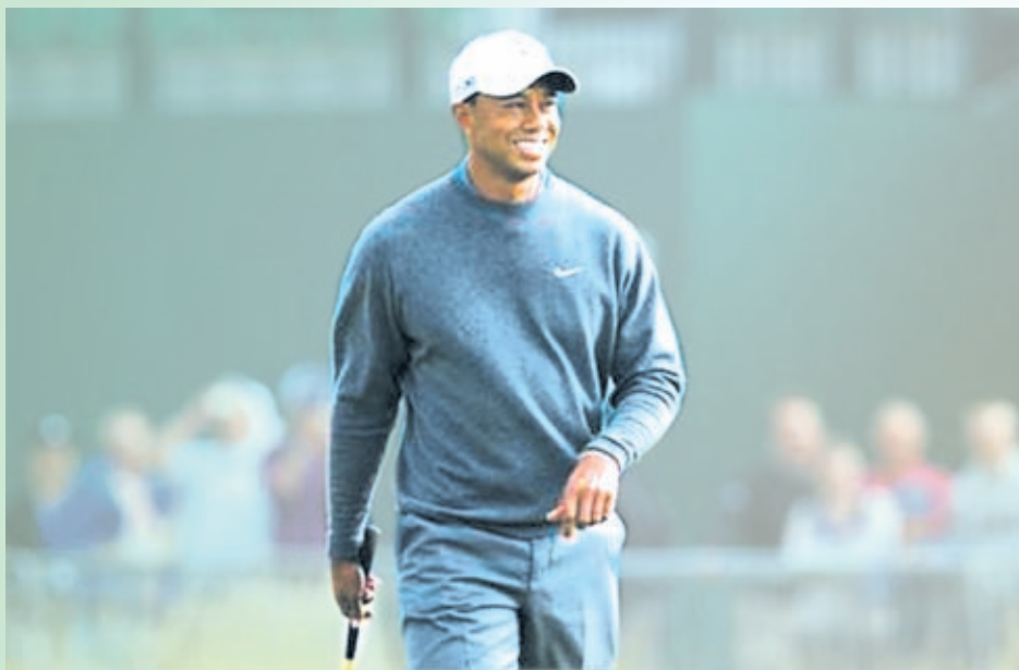
Tiger Woods of the US walks across the 18th green during a practice round ahead of the British Open golf championship at Muirfield in Scotland on 15 July, 2013.