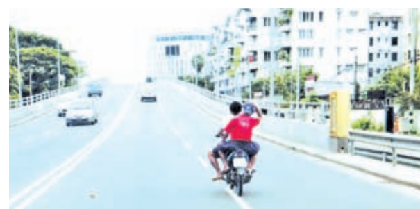
Photo shows two men with no crash helmets on a motorbike passing through Hledan overpass in Kamayut Township in Yangon where motorbike ride is banned on 12 July morning. (Punitive action should be taken against traffic rules violators by officials concerned).