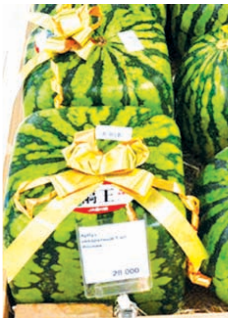
Photo taken at a exclusive supermarket in Moscow, Russia, on 14 July, 2013, shows cubic watermelons from Japan's Kagawa Prefecture sold for 28,000 rubles ($857) each.

Ordinary watermelons each weighing about 6 kilograms, about the same as cubic watermelons, will be sold at about 100 rubles apiece in Moscow during the season in August.—Kyodo