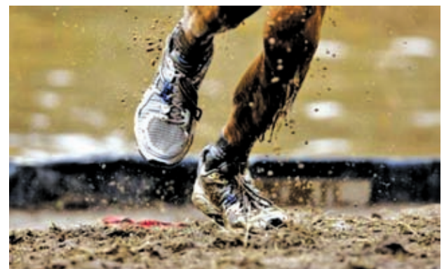
Mud flies off a competitor's shoes as he runs out of an obstacle during the Tough Mudder at Mt Snow in West Dover, Vermont on 15 July, 2012.