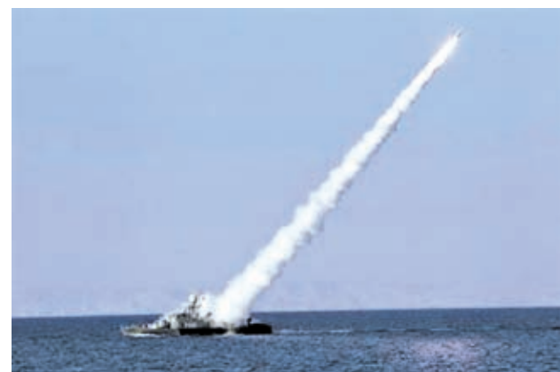
A new medium-range missile is fired from a naval ship during Velayat-90 war game on Sea of Oman near the Strait of Hormuz in southern Iran on 1 Jan, 2012.