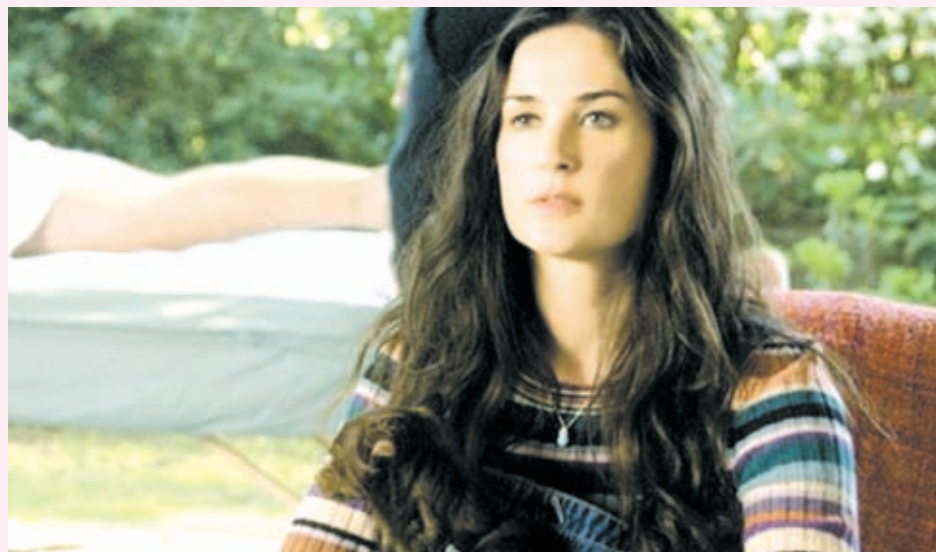
Demi Moore is practising tantric yoga with her daughter.

The exercise is said to help people become aware of their senses and build trust with others. The actress is reportedly heartbroken after her split with estranged husband Ashton Kutcher in 2011.—PTI