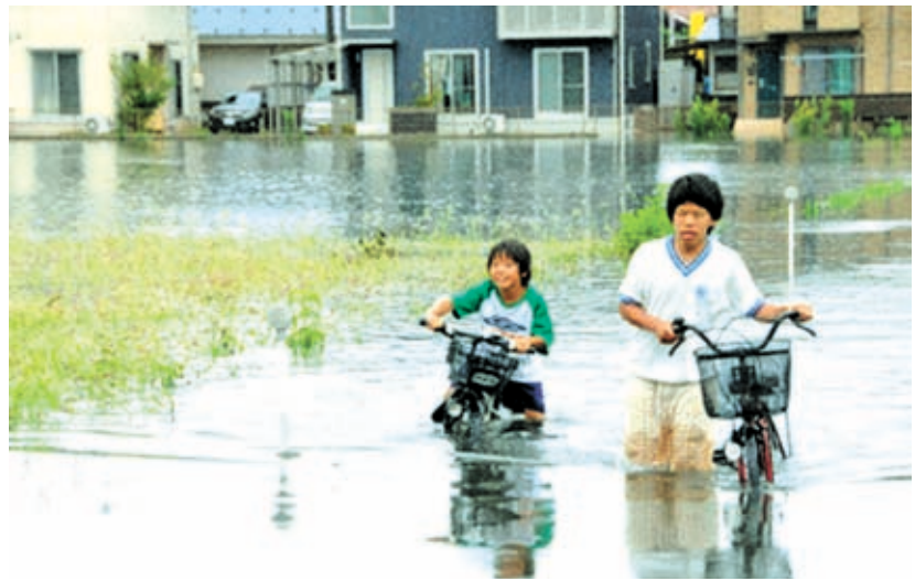
Children try to ride bikes in a flooded area after a down-pour in Yonago, Tottori Prefecture, western Japan, on 15 July, 2013.