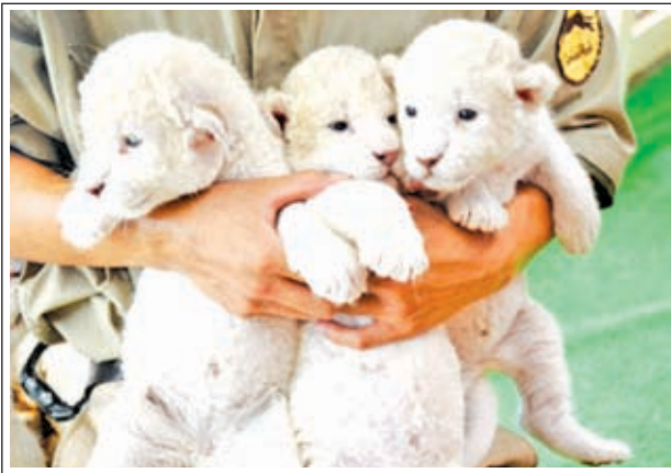
Photo shows white lion cubs being shown to public on 13 July, 2013, at Himeji Central Park in Hyogo Prefecture, western Japan.

He added: “The government should mount one last rescue effort and see — may be people are still stuck in the far reaches of the hills, waiting to be rescued.” So far, more than 120,000 people have been evacuated from the difficult terrains of the hilly state by the Indian army and air force. Monsoon floods swept away Uttarakhand on 16 June, killing thousands and washing away towns and roads.—Xinhua