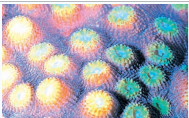
Living Stones: close-up photos of coral rocks.

AGENT FOR: M/S G. LINK EXPRESS PTE LTD Phone No: 256924/256914