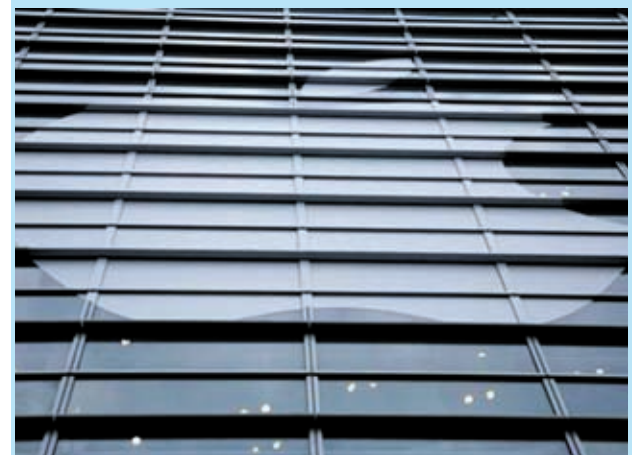
An Apple logo is seen at the Apple Worldwide Developers Conference (WWDC) 2013 in San Francisco, California on 10 June, 2013.