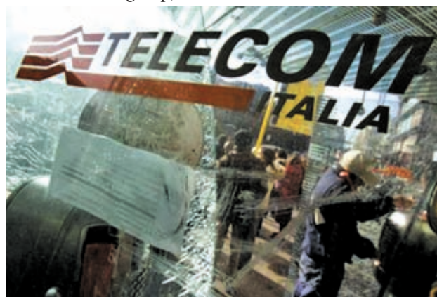
A man uses a Telecom Italia phone booth at a bus stop in Rome on 3 Dec, 2008.