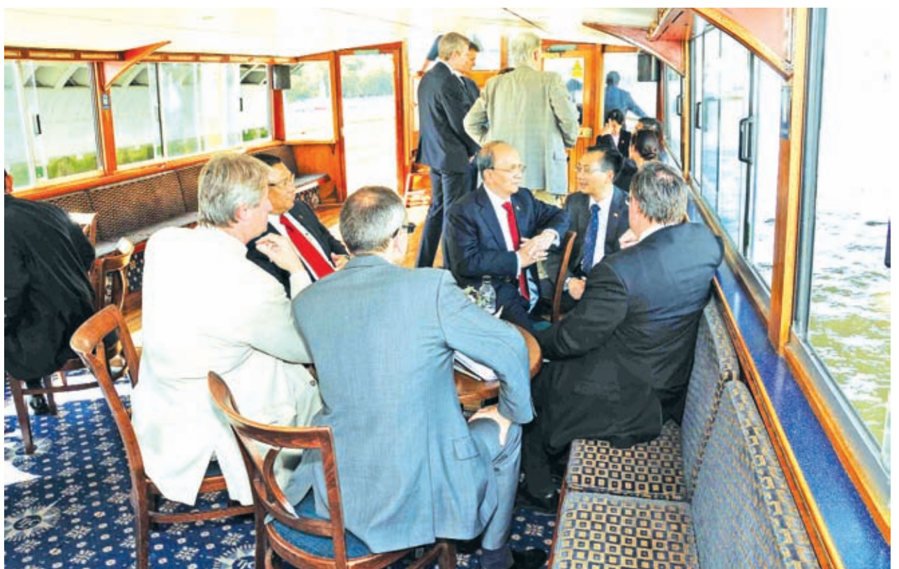
President U Thein Sein goes sightseeing on Thames River.

Later, the President met embassy staff and Myanmar families at the residence of the Myanmar Ambassador. He explained promotion of Myanmar's international relations and reform process in political, economic, administration and private sectors in building a new democratic nation and presented gifts to them.