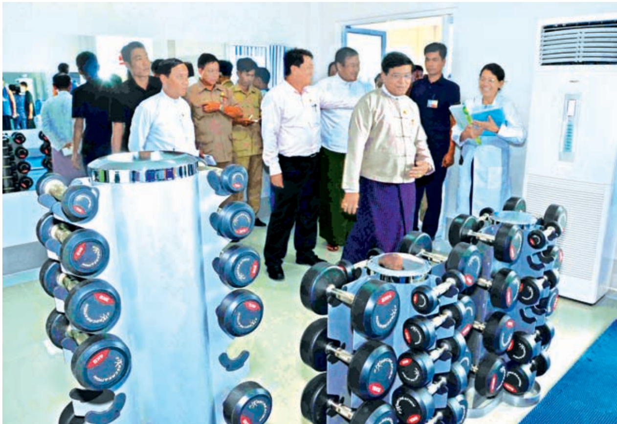
Vice-President U Nyan Tun inspects sports equipment at gymnasium for 27th SEA Games.—MNA

NAY PYI TAW, 16 July— Patron of leading Committee for Organizing the 27 th SEA Games Vice-President U Nyan Tun inspected progress of construction of Stadiums and gymnasiums for the 27 th SEA Games and encouraged the trainees under intensive training at 2 pm today.