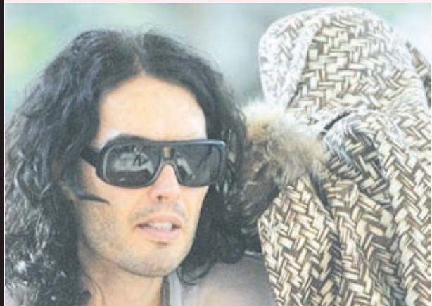
Russell Brand eventually bought a rug too.