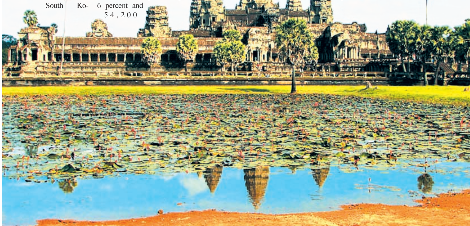
Cambodia's Angkor Wat temples

ological park, inscribed on the World Heritage List in 1992, is the kingdom's largest cultural tourism destination, which is located about 315 kilometres northwest of Phnom Penh, the capital of Cambodia.— Xinhua