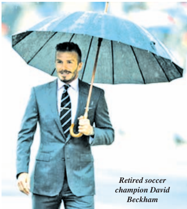
Retired soccer champion David Beckham

LONDON, 16 July—Retired soccer champion David Beckham says he is in no mood to either coach any team or even manage it.