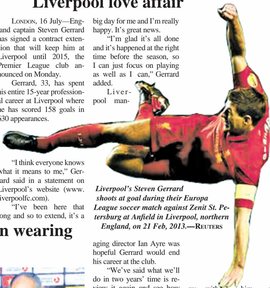
Liverpool's Steven Gerrard shoots at goal during their Europa League soccer match against Zenit St. Petersburg at Anfield in Liverpool, northern England, on 21 Feb, 2013.

aging director Ian Ayre was hopeful Gerrard would end his career at the club.