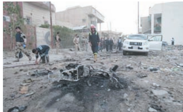
Iraqi security forces and firefighters inspect the site of bombs attacks in Basra, 420 km (260 miles) southeast of Baghdad, on 14 July, 2013. A string of bomb blasts in predominantly Shi'ite Muslim provinces of Iraq killed at least 24 people on Sunday, police and medics said.