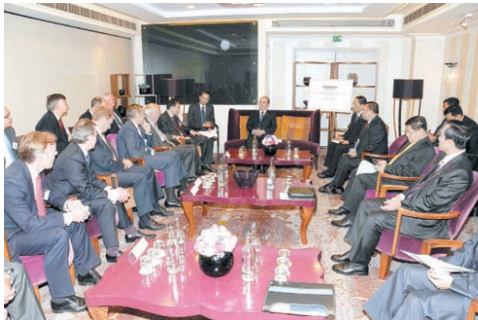
President of the Republic of the Union of Myanmar U Thein Sein receives businessmen of British at Sofitel St James Hotel in Britain.