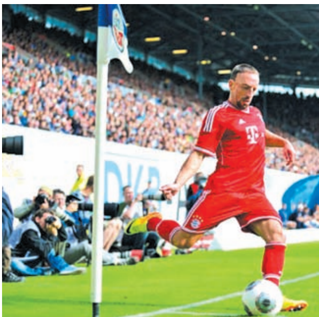
Bayern Munich's French midfielder Franck Ribery takes a corner during the pre-season football match Hansa Rostock vs FC Bayern Munich on 14 July, 2013 in Rostock, northern Germany.—PTI

Bayern play Dortmund in the German Super Cup final on 27 July with the Bundesliga to resume on 9 August, while Guardiola's team also play in a four-team tournament, which includes Dortmund, in Moenchengladbach next weekend.—PTI