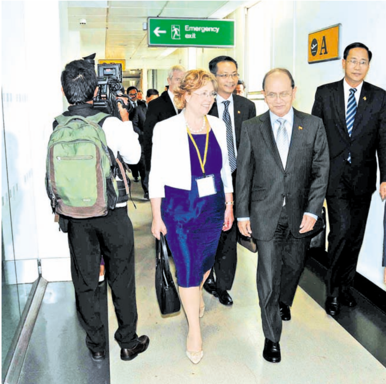
President U Thein Sein being welcomed by officials at Heathrow International Airport.