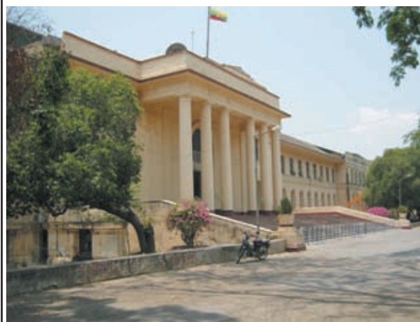
A file photo shows Mandalay University.

MANDALAY, 15 July—The 5 th ASEAN Universities Network Conference was held at Traders Hotel in Yangon on 3 July, attended by professors of ASEAN countries.