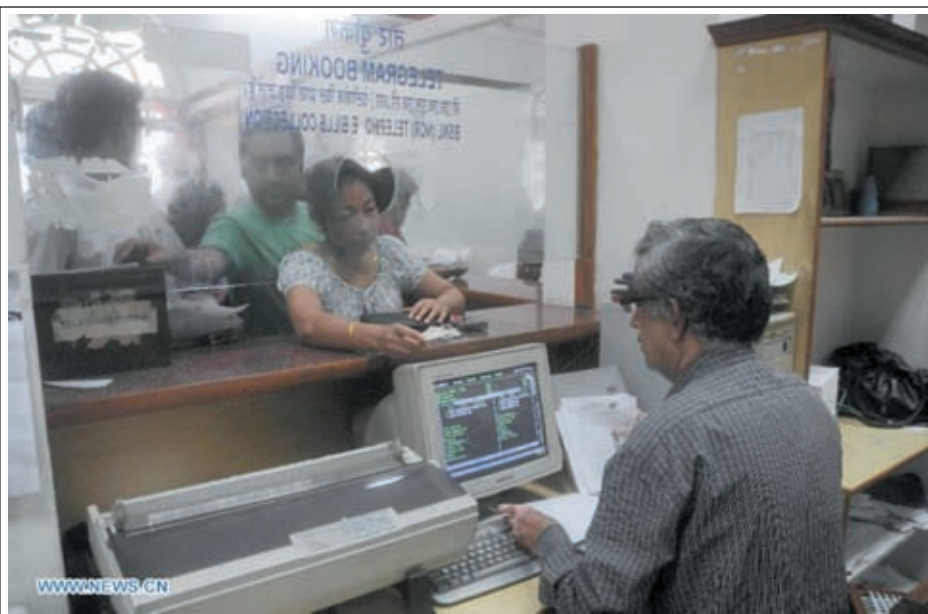
Indians wait to send telegrams on the last day of the 163-year-old service at a telegraph office in New Delhi, India, on 14 July, 2013. At the stroke of 9 pm (local time) last Sunday, India ended its 163-year-old telegram service in the country.