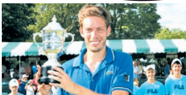
France's Nicolas Mahut holds his trophy

The Australian, bidding for his first singles title since he beat Roger Federer in the final at Halle in June, 2010, also played in the morning, blunting the booming serve of twice defending champion John Is-