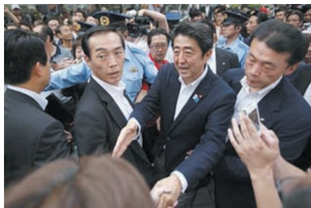
Japan’s Prime Minister Shinzo Abe (2nd R), who is also leader of the ruling Liberal Democratic Party, shakes hands with voters during his stumping tour in Tokyo on 4 July, 2013, at the start day of campaign the 21 July Upper house election.