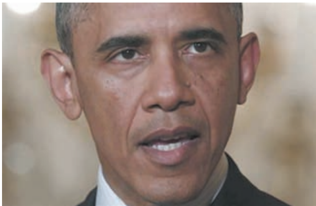
US President Barack Obama delivers a statement from the East Room of the White House in Washington on 15 May, 2013.

WASHINGTON, 15 July—The acquittal of George Zimmerman in the shooting death of unarmed black teenager Trayvon Martin left President Barack Obama trying to dial down tensions on Sunday while reassuring supporters he still stands against discrimination and gun violence.