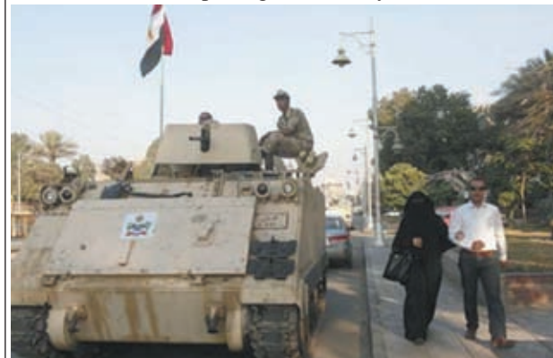
A couple walks past an Egyptian soldier keeping watch from atop a military vehicle in front of the presidential palace in Cairo on 14 July, 2013.