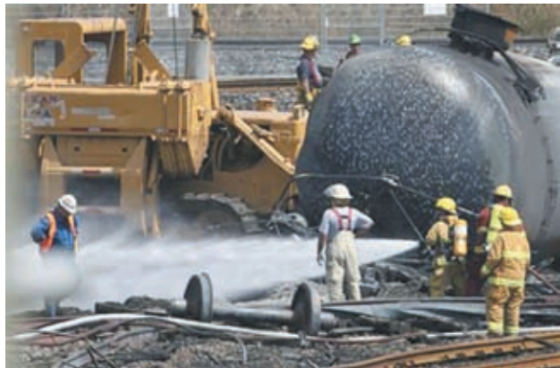
Firefighters spray wagons at the site of the train wreck in Lac-Mégantic on 14 July, 2013. It was a runaway train that caused this month's deadly inferno in Lac-Mégantic, but the Canadian town's leaders, business owners and many of its residents see the railway as crucial to their survival and want it operating again as soon as possible.

LAC-MEGANTIC, (Quebec), 15 July—It was a runaway train that caused this month's deadly inferno in Lac-Mégantic, but the Canadian town's leaders, business owners and many of its residents see the railway as crucial to their survival and want it operating again as soon as possible.