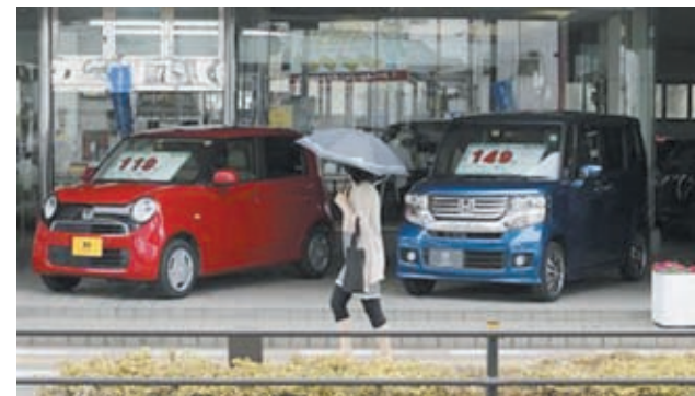
A woman walks past Honda Motor Co's N Box (R) and N One minicars outside at a Honda dealer in Tokyo on 13 July, 2013.

Rising fuel costs and a fast growing middle class in the world's second and fourth most populous states make them likely to be the first microcar customers. As a first step, companies