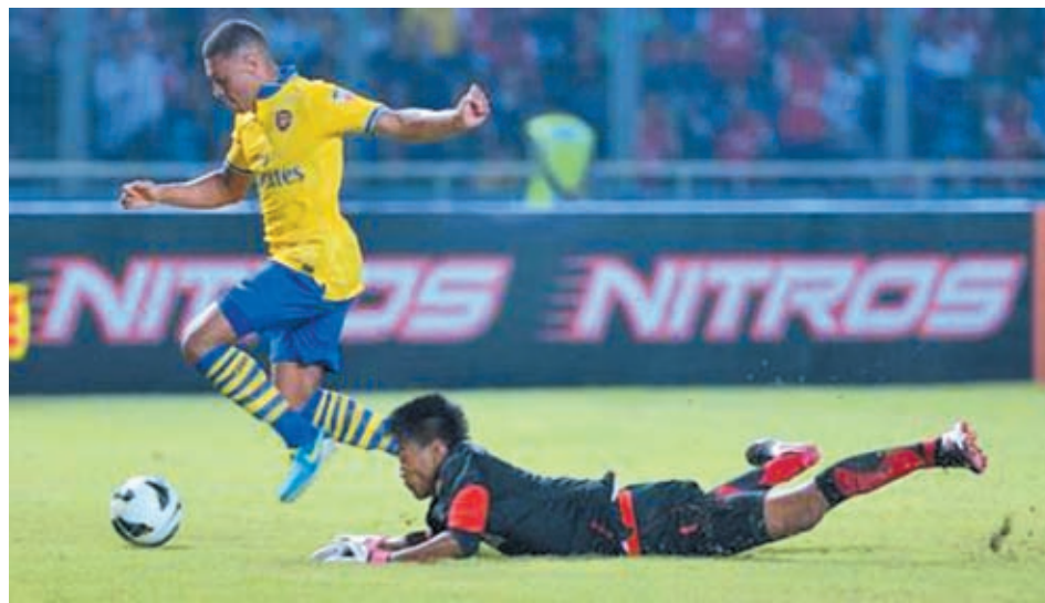
Arsenal's striker Alex Oxlade-Chamberlain (left) vies with Indonesia's goalkeeper Kurnia Meiga during a friendly football match Arsenal FC vs Indonesia Dream Team in Jakarta on 14 July, 2013.