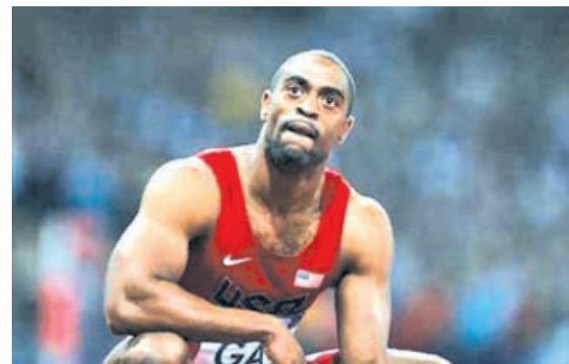
Tyson Gay of the US reacts after finishing fourth in the men's 100m final during the London 2012 Olympic Games at the Olympic Stadium on 5 Aug, 2012.