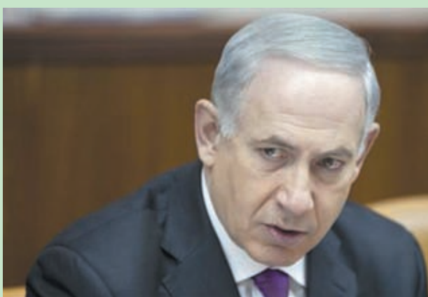
Israel’s Prime Minister Benjamin Netanyahu attends the weekly cabinet meeting in Jerusalem on 7 July, 2013.

US Secretary of State John Kerry has in recent months mounted shuttle visits in the hope of reviv-