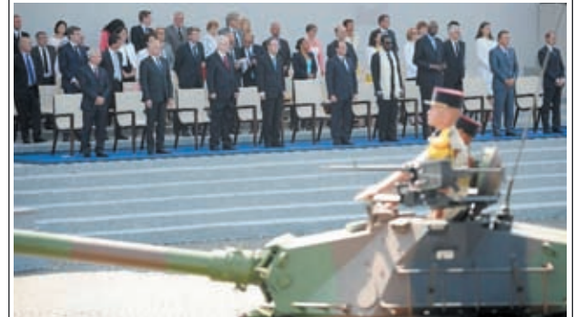
Soldiers attend the Bastille Day military parade in Paris, France, on 14 July, 2013.