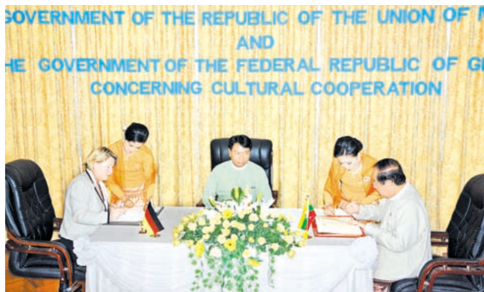
Deputy Minister for Culture U Than Swe and Deputy Minister of State at the Federal Foreign Office of Germany Mrs. Cornelia Pieper sign agreement on cooperation in the sectors of culture, education, film and IT, youths and sports.—MNA

NAY PYI TAW, 15 July—A ceremony to sign an agreement on cooperation in the sectors of culture, education, film and IT, youths and sports between Myanmar and Germany took place at the meeting hall of the Ministry of Culture, today.