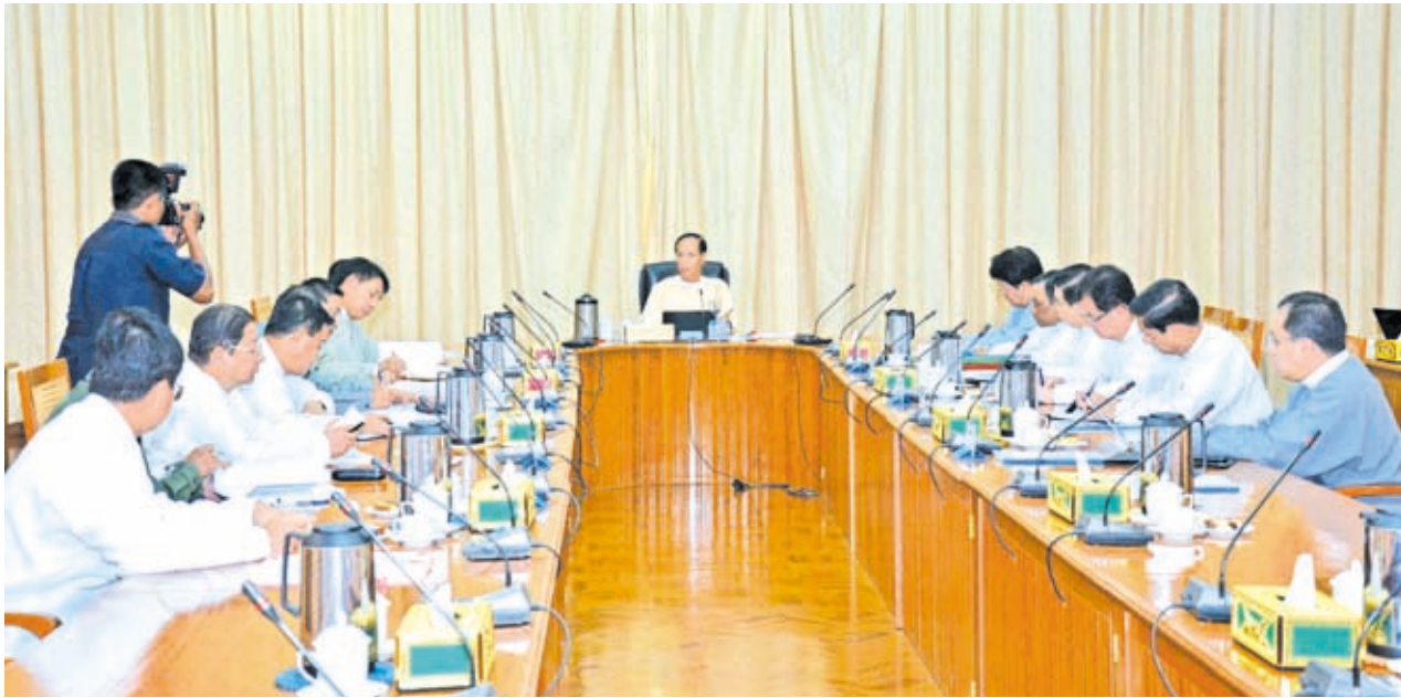
Vice-President Dr Sai Mauk Kham addresses the meeting of central committee for holding the 66 th Anniversary of Martyrs' Day.

NAY PYI TAW, 15 July—Vice-President Dr Sai Mauk Kham addressed the Meeting of central committee for holding the 66 th Anniversary of Martyrs'