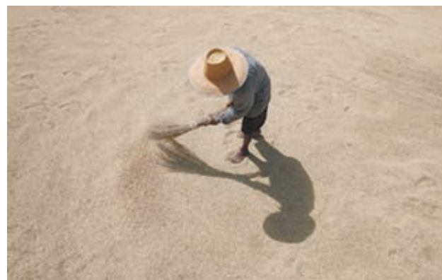
A farmer dries rice grains in Buriram Province, 410 km (255 miles) northeast of Bangkok, in this 17 Nov, 2007 file photo.

It is the desire of the government to ensure that the abundant natural resources in the state are harnessed to boost development and create employment opportunities, she said.— Xinhua