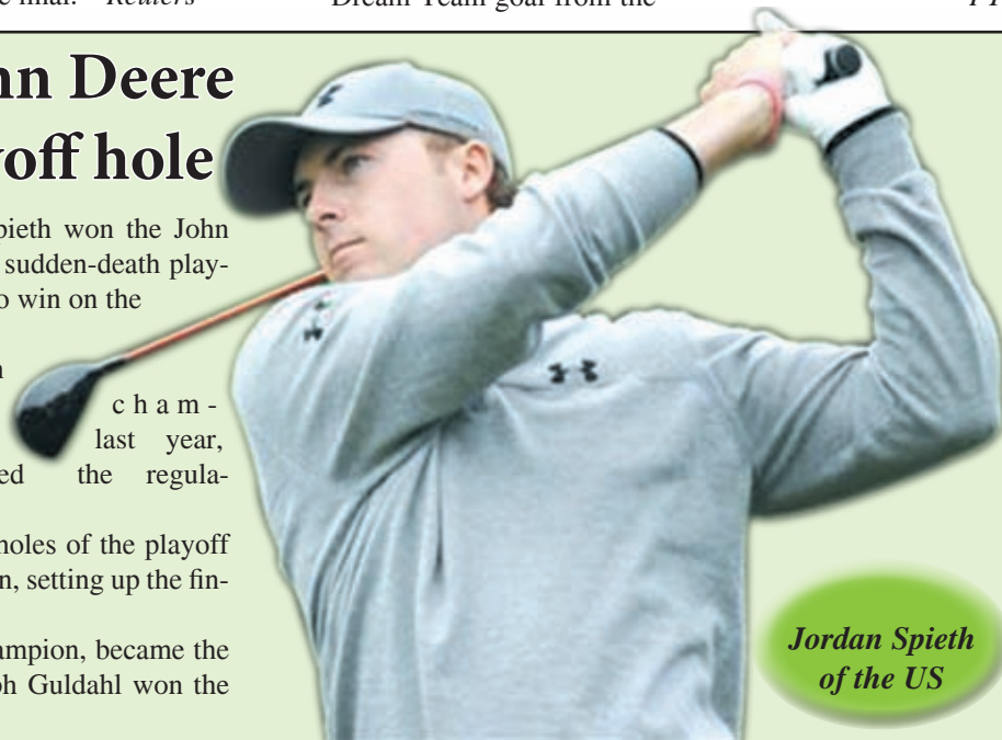
Jordan Spieth of the US

Spieth, a two-time US Junior Amateur champion, became the youngest player to win on the tour since Ralph Guldahl won the Santa Monica Open 82 years ago.—Reuters