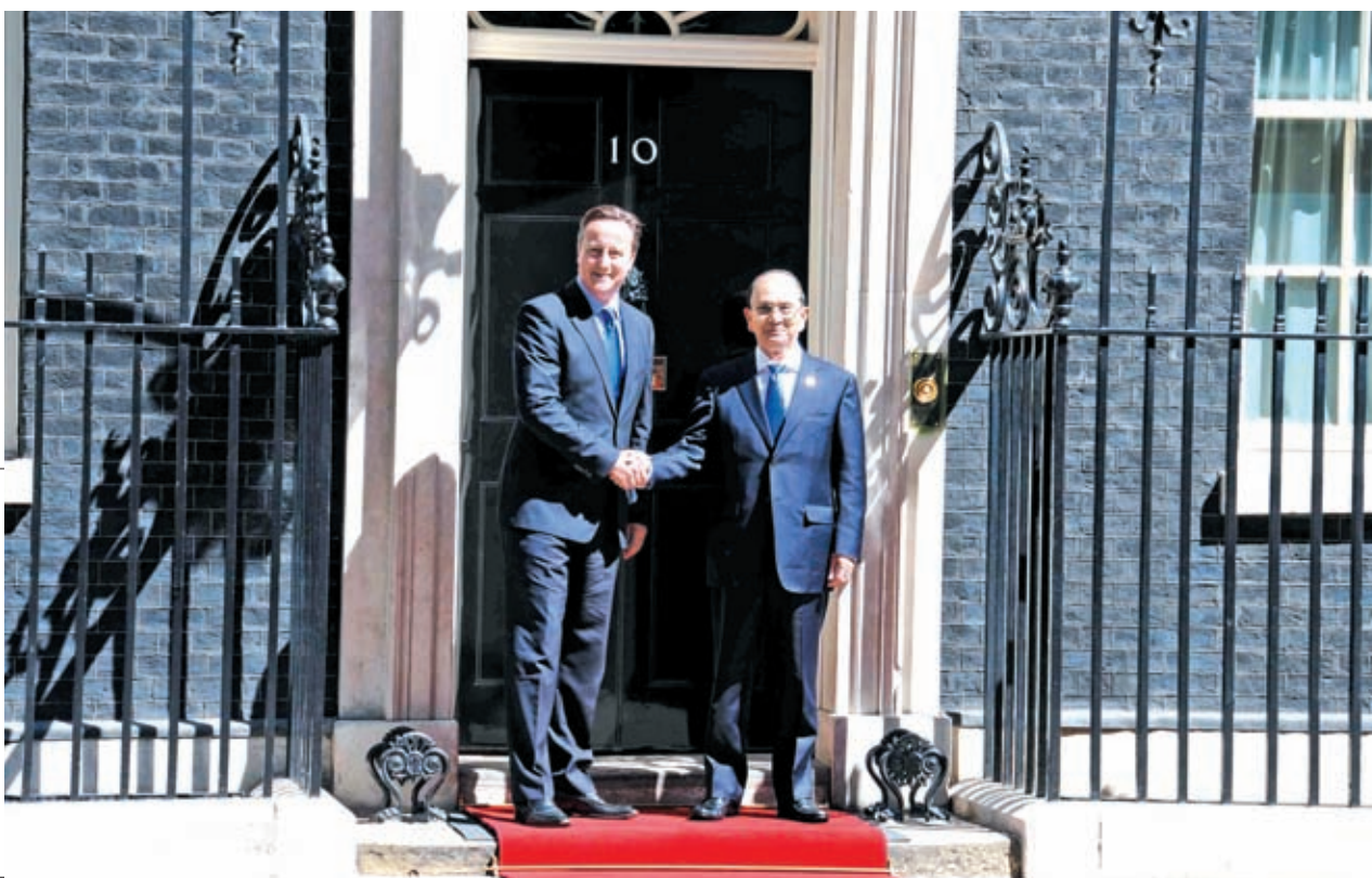
President U Thein Sein shaking hands with Rt. Hon David Cameron, British Prime Minister, at the Whitehall on No. (10), Downing Street, London.—MNA