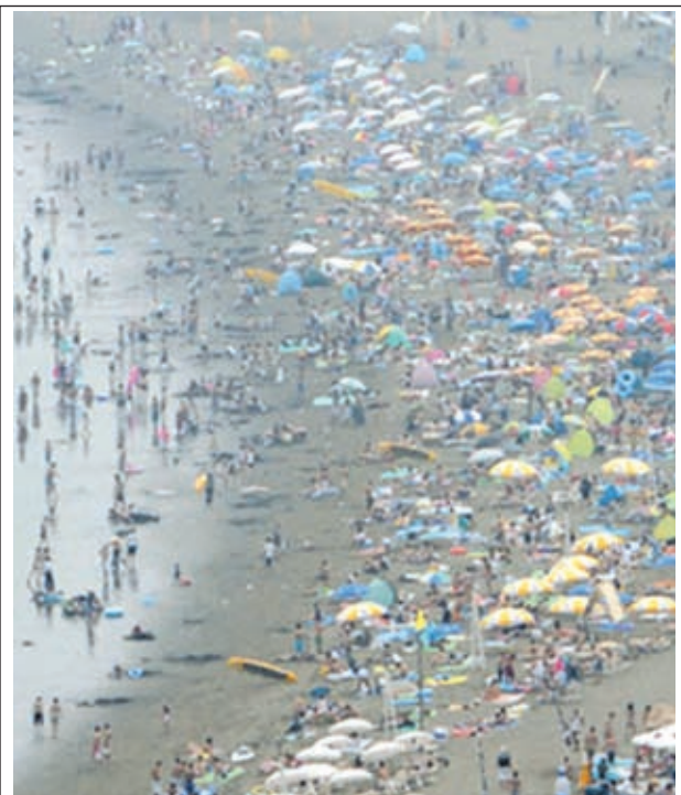
Photo taken from a Kyodo News helicopter shows Katase Higashihama beach in Fujisawa, Kanagawa Prefecture, crowded with people on 14 July, 2013, a day before the Marine Day national holiday in Japan.