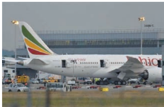
Emergency services attend to a Boeing 787 Dreamliner, operated by Ethiopian Airlines, after it caught fire at Britain's Heathrow airport in west London on 12 July, 2013.

LONDON, 15 July—Airlines expressed confidence in the safety of Boeing's 787 Dreamliner on Sunday as investigators searched for the cause of a fire on one of the advanced jets and billions were wiped off the company's market value.