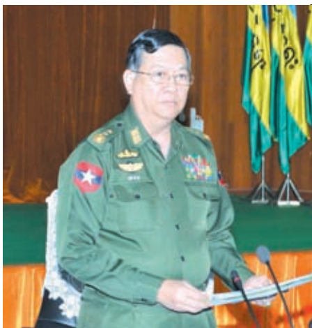
Union Minister for Home Affairs Lt-Gen Ko Ko addresses CCDAC Meeting 1/2013.

NAY PYI TAW, 15 July— “Our mission could not be accomplished if alternative development program met with failure in the fight against narcotic drugs, no matter Security, Anti-corruption & Civil Rights Commission, Seoul Museum, Hyundai Motors Co., Hyundai Heavy Industries Co., Multifunctional Administrative City Construction Agency, cultural and historical sites during their stay in ROK.