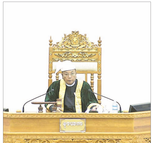
Today's session of Pyidaungsu Hluttaw in progress.