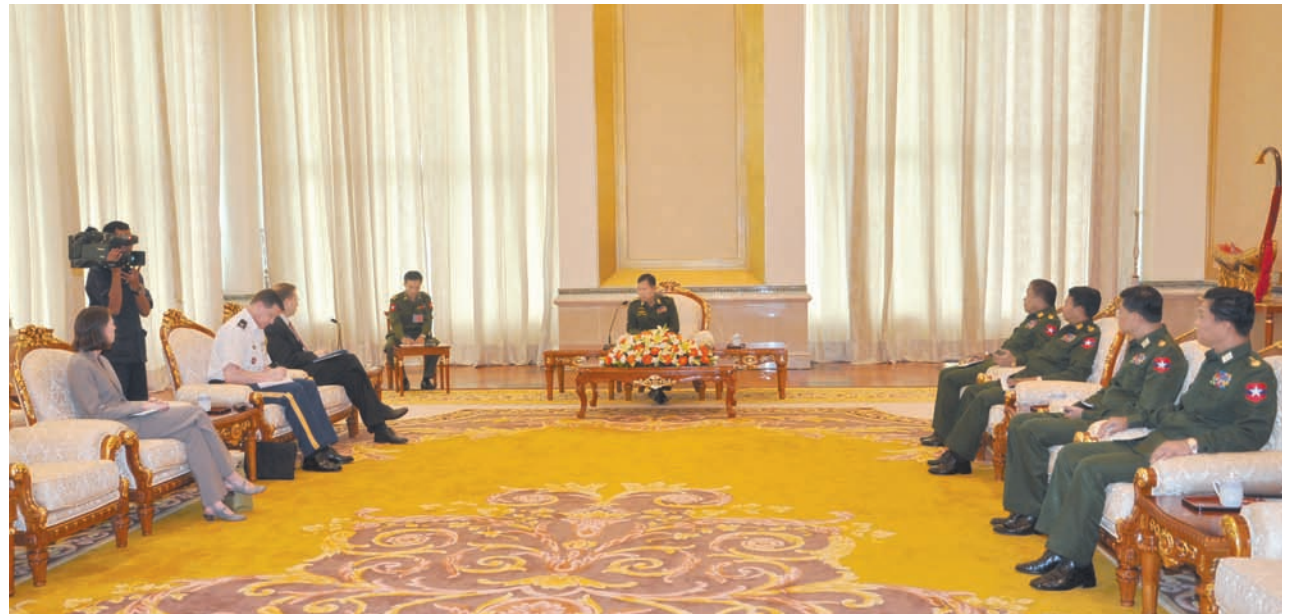
Vice-Senior General Soe Win receives US Ambassador to Myanmar Mr. Derek J. Mitchell at Zeyathiri Beikman.

NAY PYI TAW, 11 July— Deputy Commander-in-Chief of Defence Services Commander-in-Chief (Army) Vice-Senior General Soe Win attended opening of the four-country Tatmadaw Golf Friendly at Yepyar Golf Course, here, this morning.