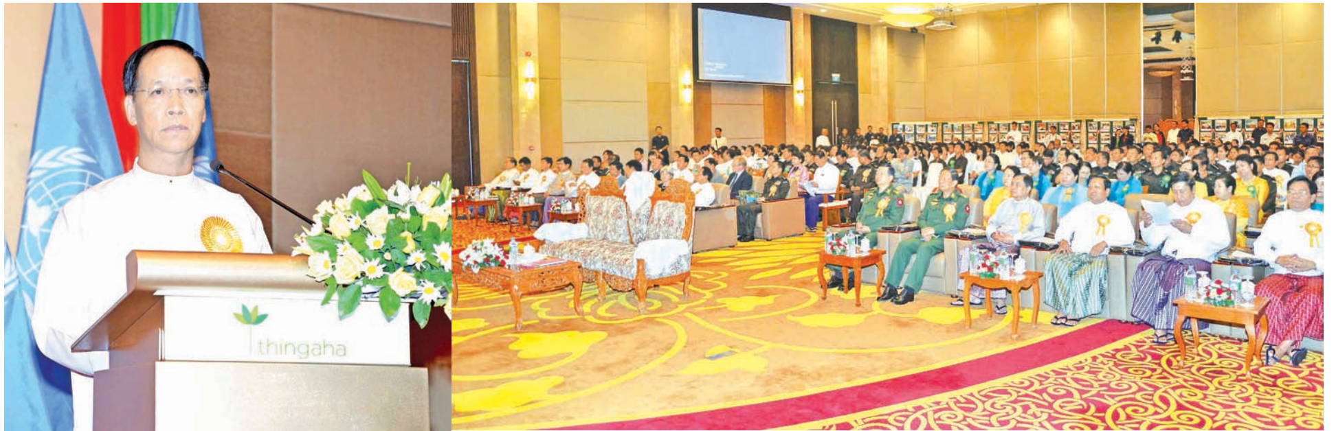
Vice-President of the Republic of the Union of Myanmar Dr Sai Mauk Kham addresses ceremony to mark World Population Day.

NAY PYI TAW, 11 July—Vice-President Dr Sai Mauk Kham has called for taking measures to prevent marriage under 18-year and having pregnancy before 20 years old and for assisting in reducing unwanted pregnancies in attempts to prevent teenage pregnancies.