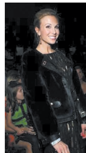
Elisabeth Hasselbeck attends the Milly by Michelle Smith Fall/Winter 2011 collection show during New York Fashion Week on 16 Feb, 2011.