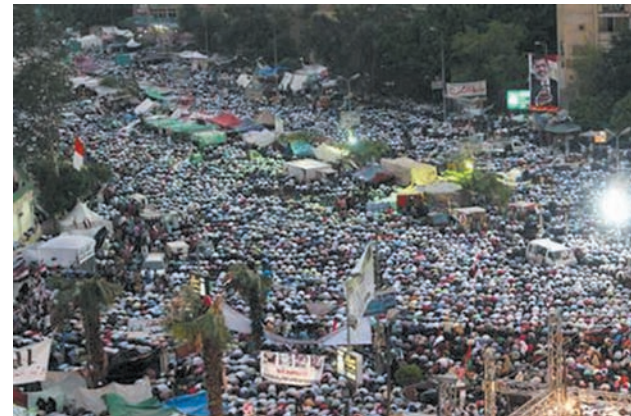
Supporters of deposed Egyptian President Mohamed Mursi perform evening prayers at the Rabaa Adaweya square where they are camping in Cairo on 9 July, 2013.

In addition to Badie, prosecutors ordered the arrest of others including his deputy, Mahmoud Ezzat, and outspoken party leaders Essam El-Erian and Mohamed El-Beltagi. The new interim prime minister on Wednesday reached for liberals to revive a shattered economy as he began forming a government to try to heal the bitterly divided nation. Egyptians had hoped the start of the Ramadan Muslim fasting month would cool passions but it has been overshadowed by rancour.—Reuters