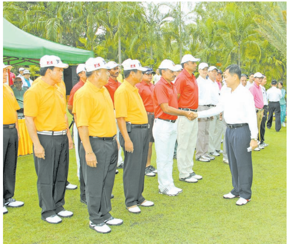
Vice-Senior General Soe Win greets golfers from four countries before golf friendly.—MNA

The meeting focused on bilateral cooperation between the two armed forces.—MNA