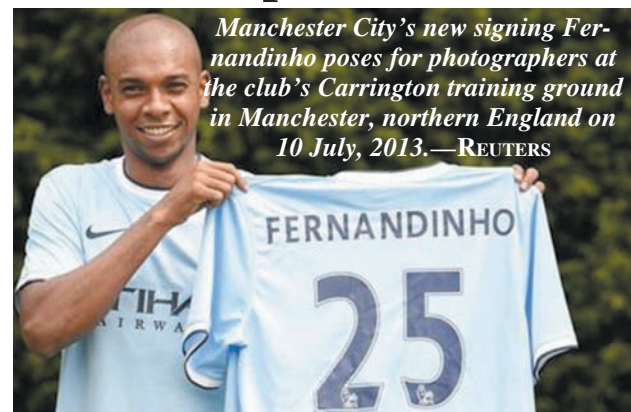
Manchester City's new signing Fernandinho poses for photographers at the club's Carrington training ground in Manchester, northern England on 10 July, 2013.

MANCHESTER, (England), 11 July—Brazil midfielder Fernandinho is hoping to catch the eye of his national team manager before next year's World Cup on home soil by shining for his new club Manchester City.