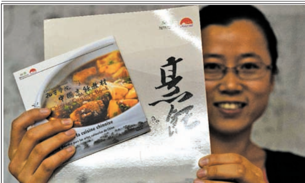
A volunteer heading for America presents the Chinese cuisine book of Confucius Institute in Beijing, capital of China, on 9 July, 2013. Chinese cuisine book written by Confucius Institute and Lee Kun Kee Food Co, Ltd was officially released on Tuesday.