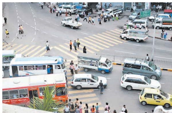
Photo shows undisciplined passenger buses and private cars blocking a pedestrian crossing near Sule Pagoda at the time when they were stopping at Sule traffic lights on 9 July.

Sense of duty makes a person strong and tall.