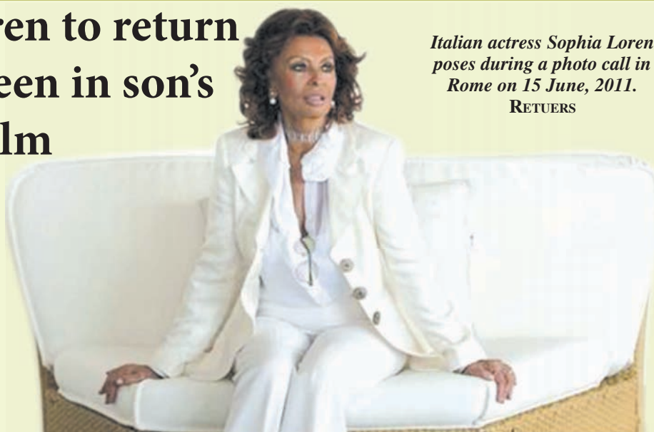
Italian actress Sophia Loren poses during a photo call in Rome on 15 June, 2011.

ROME, 11 July—Italian actress and long-time Hollywood star Sophia Loren is set to return to the big screen in a short film directed by her son, which they are shooting in Naples this week.