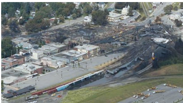
A aerial view of the wreckage of the crude oil train is seen in Lac Megantic, on 8 July, 2013.

But the first legal salvo will likely be fired over where the cases would be heard. While the catastrophe took place in Canada, the rail company is based in Maine, its parent is headquartered in Rosemont, Illinois, near Chicago, and the