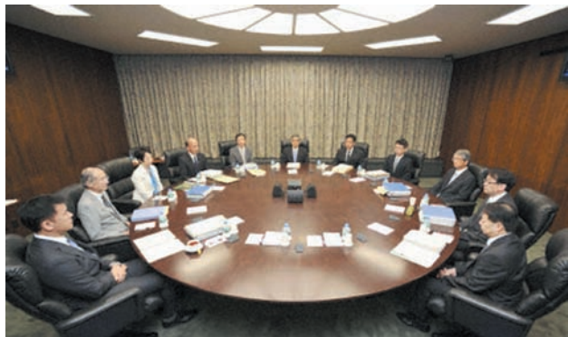
The Policy Board of the Bank of Japan holds a meeting at the BOJ head office in Tokyo on 11 July, 2013. The central bank decided to upgrade its assessment of the Japanese economy for the seventh consecutive month during the meeting.

TOKYO, 11 July—The Bank of Japan on Thursday upgraded its assessment of the Japanese economy for the seventh consecutive month, stating it is “starting to recover moderately” amid improvement in corporate sentiment and solid consumer spending.