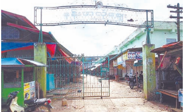
Nant Falon market in Tamu temporarily closed for three days for security reasons.