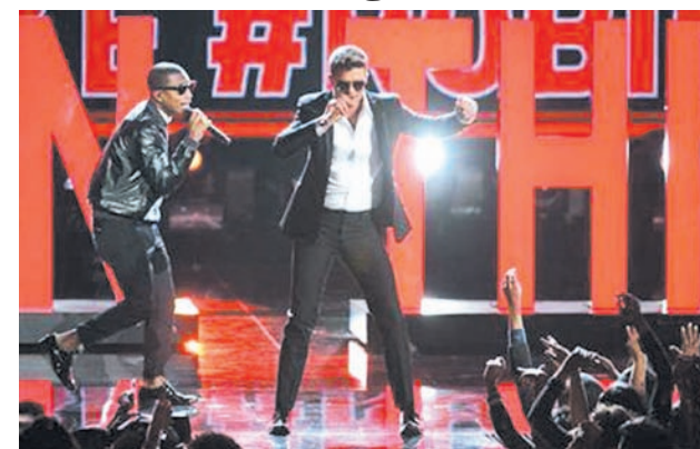
Pharrell Williams (L) and Robin Thicke perform at the 2013 BET Awards in Los Angeles, California on 30 June, 2013.

LONDON, 11 July—This year looks set to be the biggest ever for sales of single records in Britain, thanks in part to smash hits like "Get Lucky" by Daft Punk and Robin Thicke's "Blurred Lines," according to the Official Charts Company.