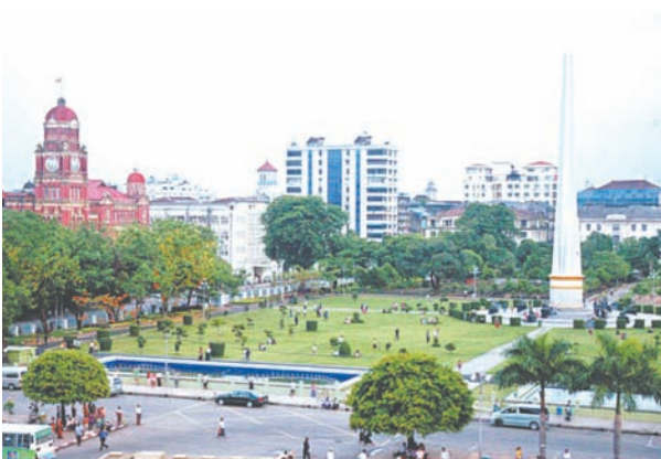
Photo shows a bird's eye view of newly-upgraded Maha Bandoola Park packed with people and children for recreation purpose on 9 July.