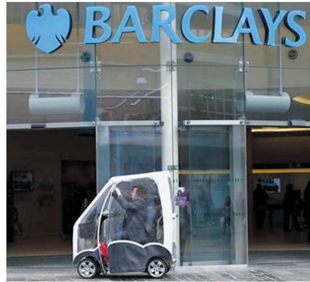
A woman sits in her mobility scooter outside a Barclays Bank in Leicester, central England on 24 April, 2013.

The cases are National Credit Union Administration Board v. Barclays Capital Inc et al, US District Court, District of Kansas, No. 12-02631; and National Credit Union Administration Board v. Credit Suisse Securities (USA) LLC et al in the same court, No. 12-02648.—Reuters