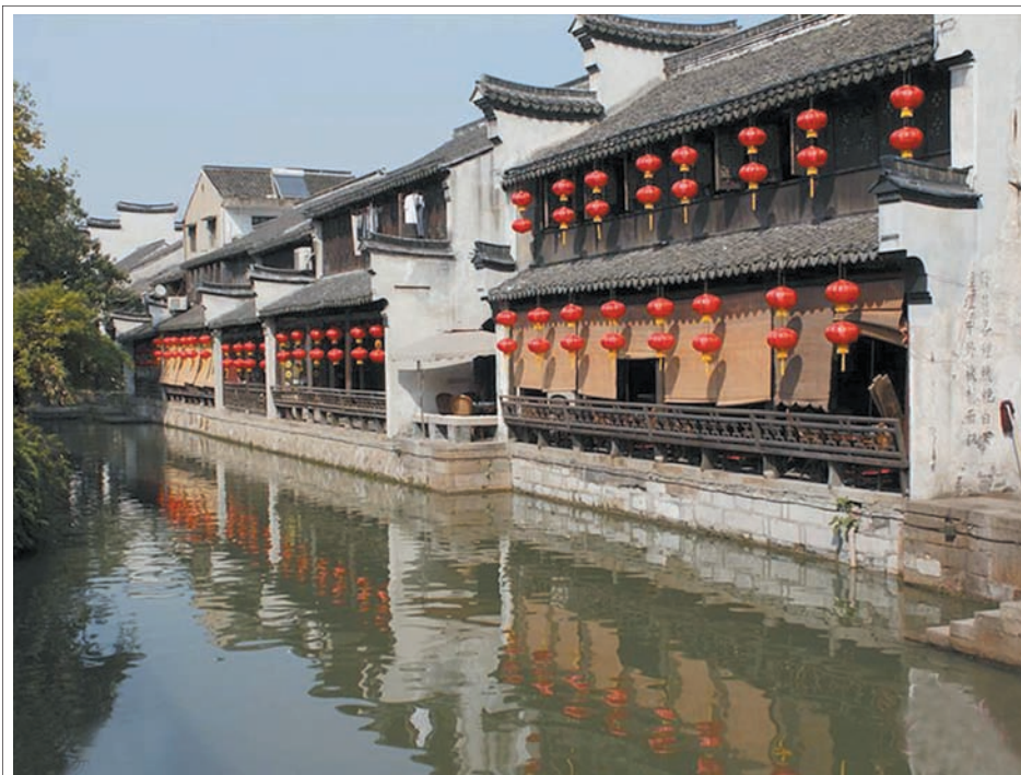
Located 30 kilometres (18.64 miles) east of Huzhou, Zhejiang Province, the Ancient Town of Nanxun is a well-known for its rich cultural heritage, boasting a history that dates back 760 years. It was founded in 1252, towards the the end of Emperor Chunyou’s reign in the Southern Song Dynasty (1127-1279). As one of the most well-preserved old towns in the region, Nanxun Ancient Town is now among the top six ancient towns situated in southern China.

In lifting the assessment of the domestic economy, the bank used the word “recover” for the first time in two and a half years since January 2011. In the previous meeting on 11 June, the BOJ said the economy “has been picking up.”—Kyodo News