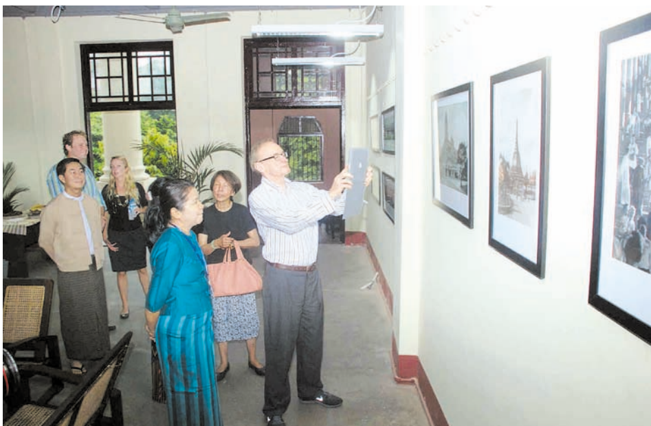
Senator The Hon Bob Carr, Foreign Affairs Minister of the Commonwealth of Australia visits Yangon Heritage Trust Office. MNA

YANGON, 11 July—A visiting delegation led by Senator The Hon Bob Carr, Foreign Affairs Minister of the Commonwealth of Australia visited Yangon Heritage Trust Office on Pansodan Road in Kyauktada Township. They observed the functions and buildings this morning. The visiting delegation left here by air this evening. They were seen off by the Australian Ambassador and officials at Yangon International Airport. MNA