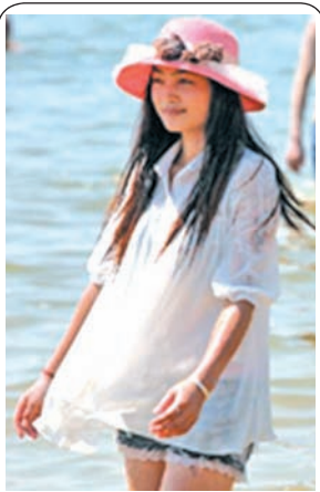
Tourists cool off on the beach in Shanghai, east China, on 11 July, 2013. The highest temperature in Shanghai reached 38.4 degrees Celsius on Thursday.