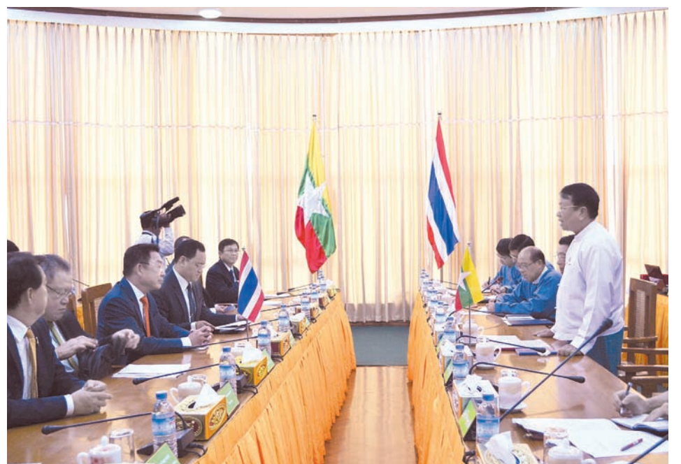
Union Minister for Electric Power U Khin Maung Soe holds talks with Thai Minister of Energy Mr. Pongsak Ruktapongpisal.—MNA

The Thai Minister on his part explained that cooperation in development of electrical sector in Myanmar and sending back necessary natural gas for gas power plants.—MNA