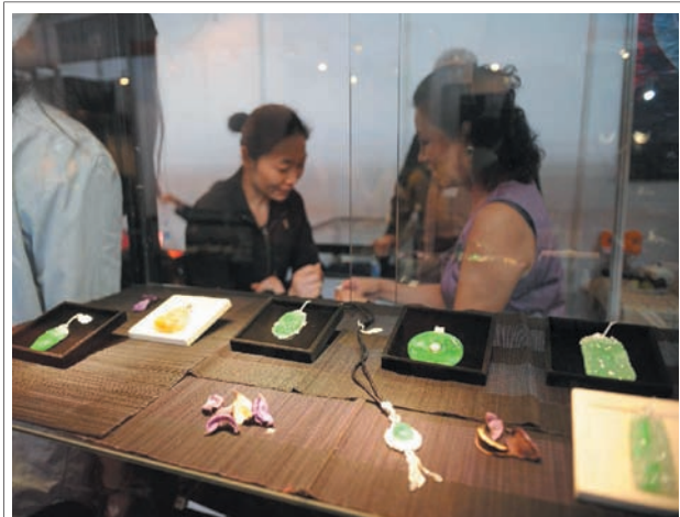
Visitors select jade accessories at the 2013 China Pan-Asia Stone Expo in Kunming, capital of southwest China’s Yunnan Province, on 10 July, 2013. The eight-day expo kicked off on Wednesday at the Kunming International Convention and Exhibition Centre.

Aquino has yet to disclose the result of the investigation. But De Lima earlier said that part of the recommendations was the filing of criminal and administrative charges against the PCG personnel involved in the tragedy.—Xinhua