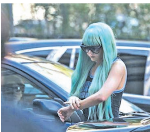
Actress Amanda Bynes arrives for a court hearing at Manhattan Criminal Court in New York on 9 July, 2013.