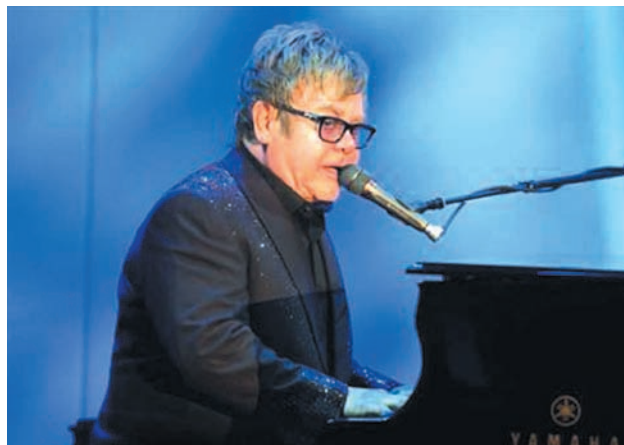
Musician Elton John performs at the 20th Annual Race to Erase MS benefit gala in Los Angeles on 3 May, 2013.

LONDON, 11 July— has postponed a summer British singer Elton John tour because he is suffer-