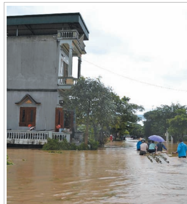
Photo taken on 10 July, 2013 shows a flooded area in north Vietnamese Province Ha Giang. Heavy rains and floods hit many parts of Ha Giang Province this month, killing two people and causing huge damage to crops.