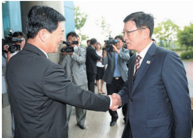
Suh Ho (R) of South Korea arrives at a joint industrial zone in the North Korea's border town of Kaesong and shakes hands with Park Chol Su of the North on 10 July, 2013. The North and South Korean officials started working-level talks to discuss ways to reopen the suspended operations of the industrial zone.