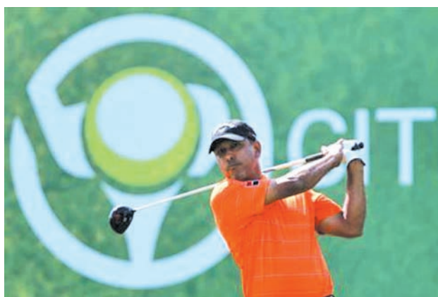
Jeev Milkha Singh of India watches his shot from the second tee during the fourth and final round of the Dubai Desert Classic at the Emirates Golf Club, on 3 Feb, 2013.

"I don't want to diminish it, because it takes