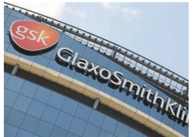
Signage is pictured on the company headquarters of GlaxoSmithKline in west London on 21 July, 2008.