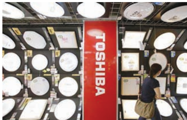
The logo of Toshiba Corp is seen at an electronics store in Yokohama, south of Tokyo, on 25 June, 2013.