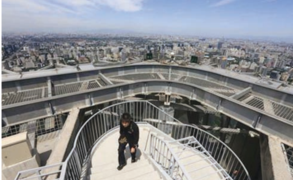
A hotel waiter climbs stairs towards the roof of China World Trade Centre Tower III, which stands at 330 m (1083 ft), one of the tallest buildings in Beijing's central business district, on 3 July, 2013.