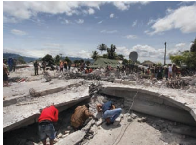
Residents and rescue teams search for victims in Ketol, Aceh Tengah, Indonesia, on 2 July, 2013.