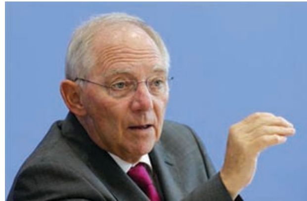
German Finance Minister Wolfgang Schaeuble gestures as he addresses a news conference to present 2014 federal budget bill in Berlin on 26 June, 2013.—REUTERS