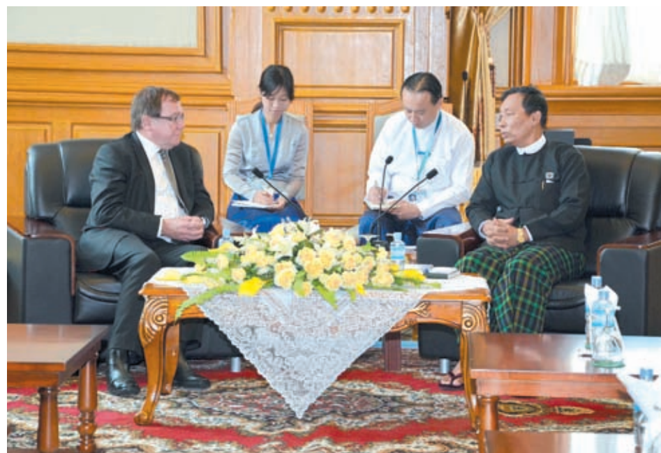
Pyithu Hluttaw Speaker Thura U Shwe Mann holds discussion with Honourable Murray McCully, Minister of Foreign Affairs of New Zealand.

At the call, they frankly discussed strengthening bilateral relations and cooperation between Myanmar and New Zealand and promoting amity and cooperation between the two