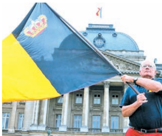
A man waves a flag in front of the royal palace in Brussels, Belgium, on 3 July, 2013. Belgium's 79-year-old King Albert II on Wednesday announced he would abdicate in favour of his son Philippe on 21 July, the country's national day, in a televised address to the nation.