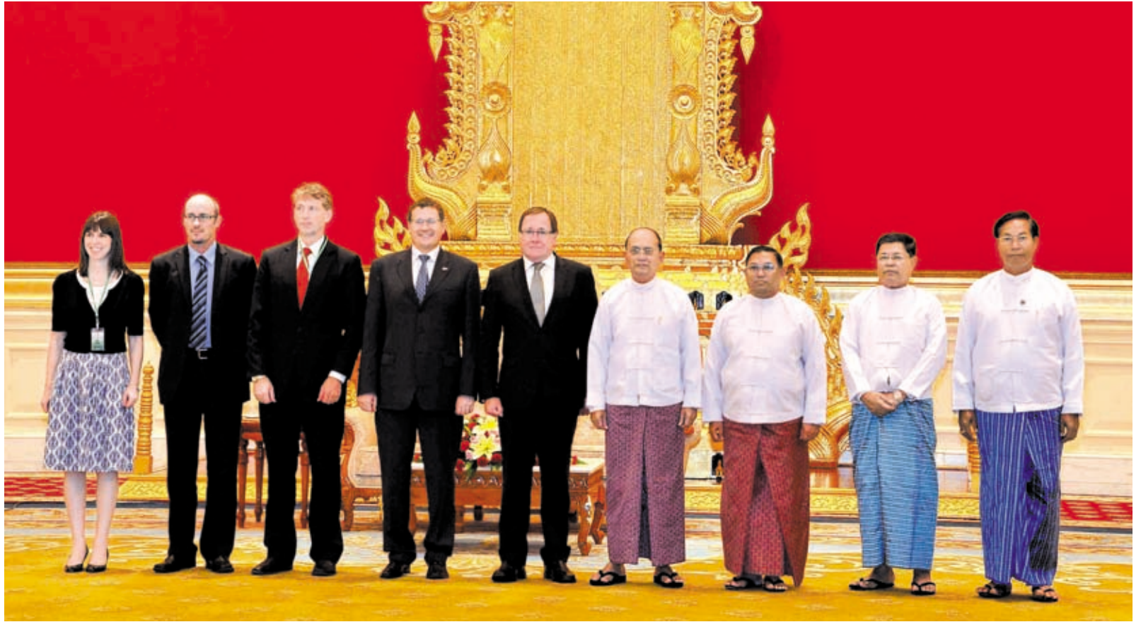
President U Thein Sein poses for documentary photo with Honourable Murray McCully, Foreign Affairs Minister of the New Zealand and party.

The New Zealand Foreign Minister pledged that New Zealand would continue to support Myanmar's reform processes, especially for the development of agricultural sector. He saw the challenges Myanmar government is facing during his visit to Rakhine State. He also reaffirmed that New Zealand would