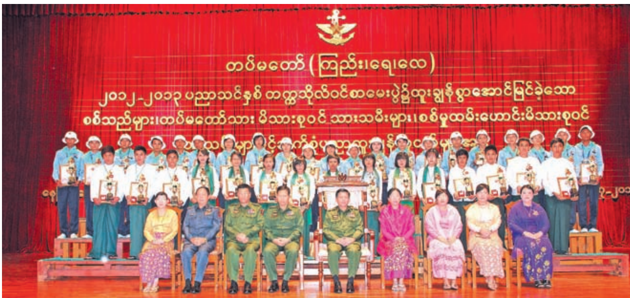
Senior General Min Aung Hlaing poses for documentary photo together with awarding winning students at the prize presentation for outstanding students of servicemen for 2012-2013 academic year.