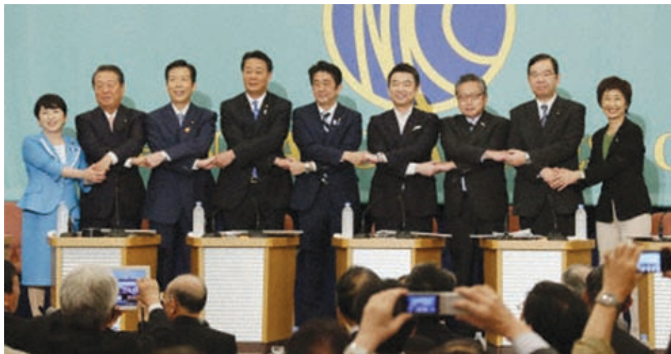
Political party chiefs join hands before a debate on their policies in Tokyo on 3 July, 2013, ahead of the on 21 July House of Councillors election.

TOKYO, 4 July—Official campaigning started on Thursday for an upper house election later this month that will be a key test of Prime Minister Shinzo Abe's leadership over the past seven months.