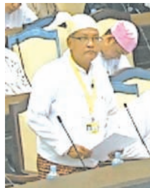
Deputy Minister U Win Than replies to proposal.

Region Constituency No.9. Deputy Minister for Foreign Affairs U Zin Yaw explained that arrangements would be made for submission on more establishments of consulates-general and honorary consuls.