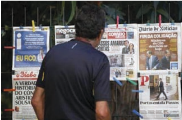
A man reads the front pages of various newspapers in Lisbon on 3 July, 2013.

LISBON, 4 July—Portugal's prime minister and his junior coalition partner in the government attempted on Wednesday to cool tempers in a political crisis that could derail Lisbon's efforts to emerge from its international bailout.