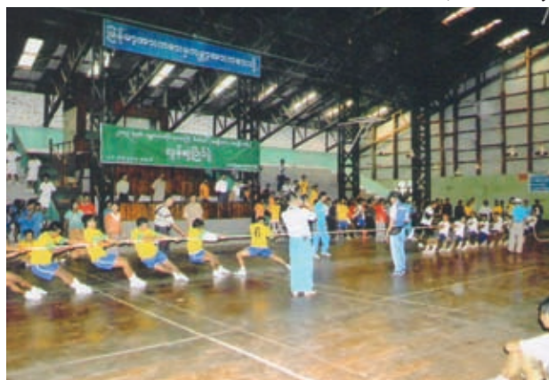
Photo shows athletes making vigorous efforts in tug-of-war contest.