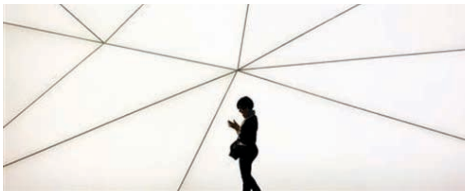
A woman looks her mobile phone as she walks past a Samsung stand at the Mobile World Congress in Barcelona on 25 Feb, 2013.