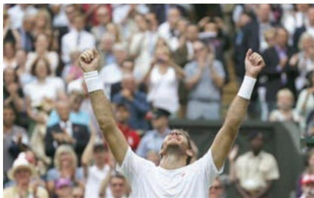
Juan Martin del Potro

to plan, would have been between Roger Federer and Rafa Nadal. The youngest of the eight quarter-finalist will now set his sights on Murray, hoping to wreck the second seed's hopes of becoming Britain's first men's Wimbledon champion since Fred Perry in 1936. "Right now I'm the most happy person in the world," said the 22-year-old Janowicz, who launched 30 aces past Kubot to surpass the feat of compatriot Wojtek Fibak who lost four grand slam quarter-finals.