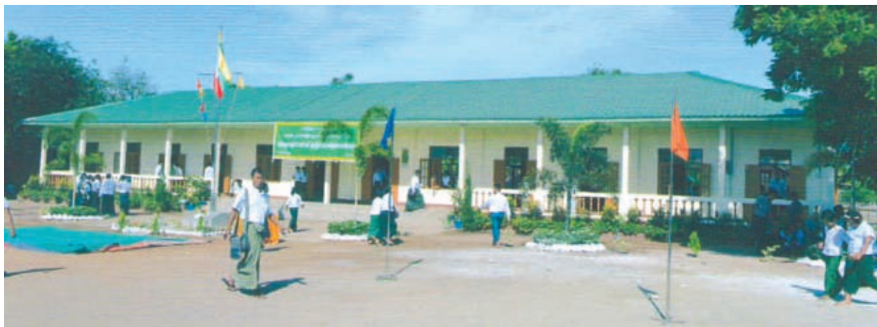
New school building of Basic Education Middle School in Dahattaw village in Patheingyi Township in Mandalay Region.

MANDALAY, 4 July—A Ministry of Education ceremony to hand over a school building to the Township in Mandalay