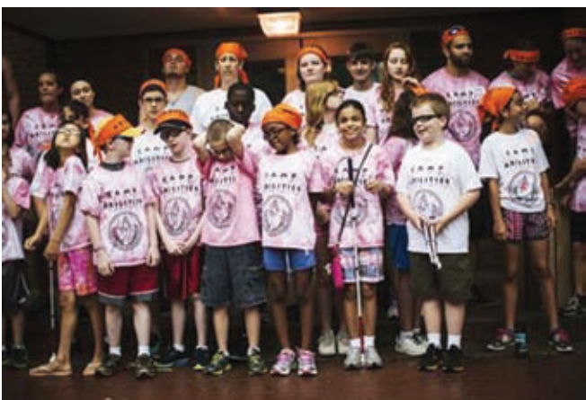
Children pose for their group photograph at Camp Abilities in Brockport, New York, on 25 June, 2013. Camp Abilities is a not-for-profit week-long developmental camp using sports to foster greater independence and confidence in children who are blind, visually impaired, and deaf-blind.