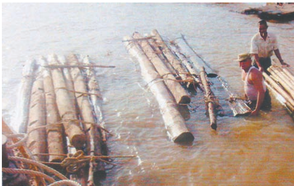
Illegal logs seized at Ayeyawady River in Singu Township of Mandalay Region.