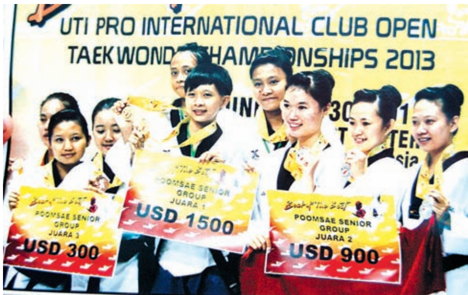
Myanmar selected Taekwondo athletes seen with winning awards.