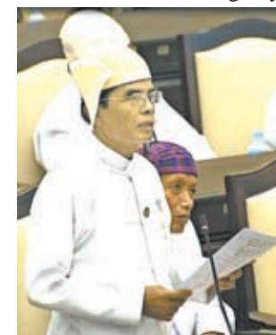
U Nu of Yangon Region Constituency No.10 submits withdrawal of his proposal.—MNA

Region Constituency No.12 submitted the proposal to allot the unimplemented land plots to local and foreign investors from various companies that could really develop their projects on the lands. U Thein Naing of Sagaing Region Constituency No.8 seconded it. The Hluttaw decided to discuss it.