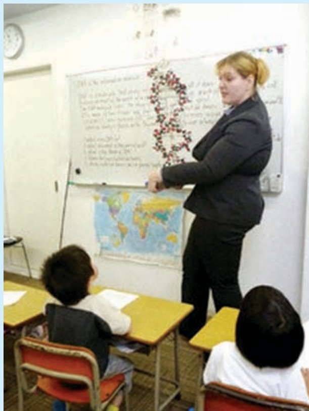
An instructor teaches young children in English, using a DNA model, at S&S International School in Yokohama, Kanagawa Prefecture on 29 May, 2013.