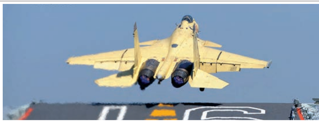
Photo shows a J-15, China's first-generation multi-purpose carrier-borne fighter jet, taking off from the deck of the Liaoning, China's first aircraft carrier, on 29 June, 2013.