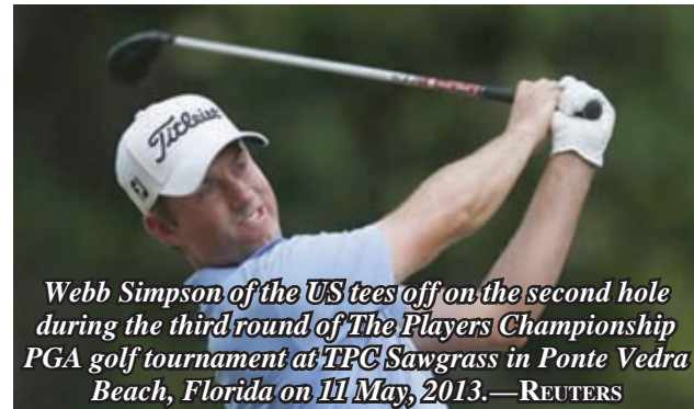
Webb Simpson of the US tees off on the second hole during the third round of The Players Championship PGA golf tournament at TPC Sawgrass in Ponte Vedra Beach, Florida on 11 May, 2013.

72 holes. "You can't really afford a bad nine when you win. I think it's just me continuing to keep playing well, and hopefully I'm in that position on Sunday where I do have a chance to win." Simpson has not tasted victory on the PGA Tour since claiming his first major title at last year's US Open but he has come close this season, posting four top-10s in 16 starts on the US circuit. His best