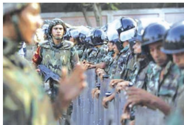
Army soldiers take their positions in front of protesters who are against Egyptian President Mohamed Morsi, near the Republican Guard headquarters in Cairo on 3 July, 2013.—REUTERS

At least 11 people were killed and more than 500 injured in clashes between the supporters and opponents of the ousted president Morsi Wednesday overnight.—Xinhua