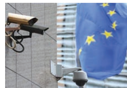
Security cameras are seen near the main entrance of the European Union Council building in Brussels on 1 July, 2013.

The Guardian newspaper reported last month that Britain's eavesdropping agency GCHQ had tapped fibre-optic cables carrying international phone and In-