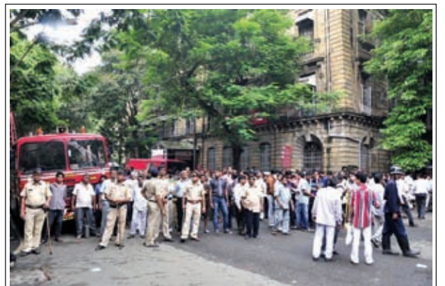
Police and residents gather near the scene of fire in Ballard Pier Estate Exchange building, Mumbai, India, on 3 July, 2013. The big fire, which broke out on Wednesday morning in a government building in south Mumbai, is under control.