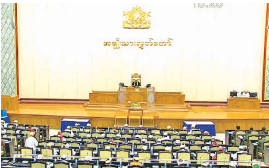
The sixth-day seventh regular session of first Amyotha Hluttaw in progress.