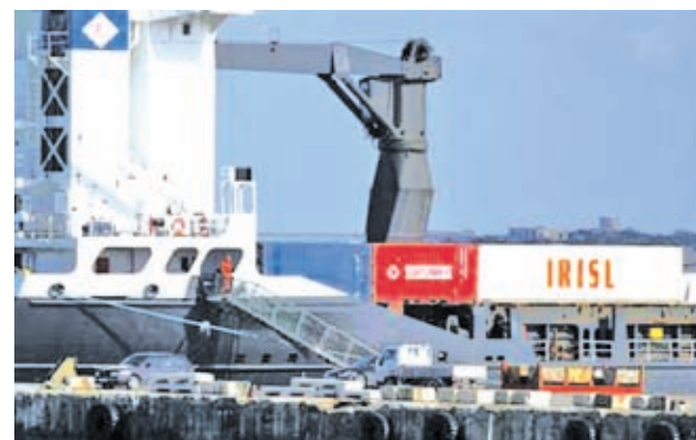
A Islamic Republic of Iran Shipping Lines (IRISL Group) container is seen on the German-owned cargo vessel "Smaragd" at Malta Freeport in the Port of Marsaxlokk outside Valletta on 10 Feb, 2012.