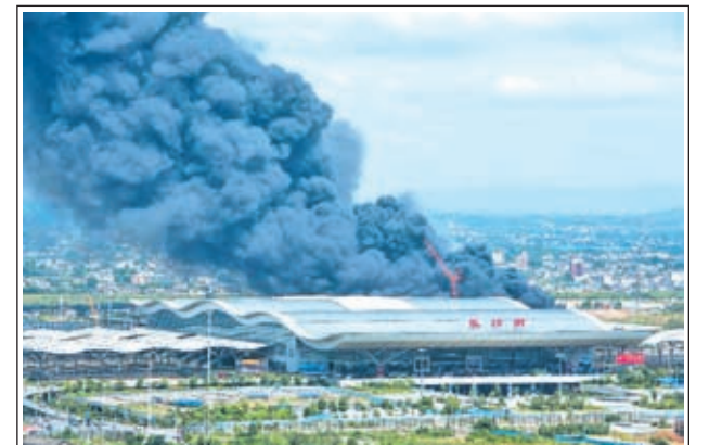
Heavy smoke billows from a warehouse near the Changsha South Railway Station in Changsha, capital of central China's Hunan Province, on 2 July, 2013. A fire engulfed the warehouse Sunday without injuring anyone. Local fire department took more than two hours to douse the fire.—XINHUA

Described by Moscow as a "valuable source in need of particular protection", the Dutch man was arrested in March 2012 and jailed for 12 years.— Reuters