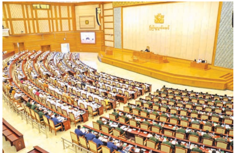
The sixth-day seventh regular session of first Pyithu Hluttaw in progress.