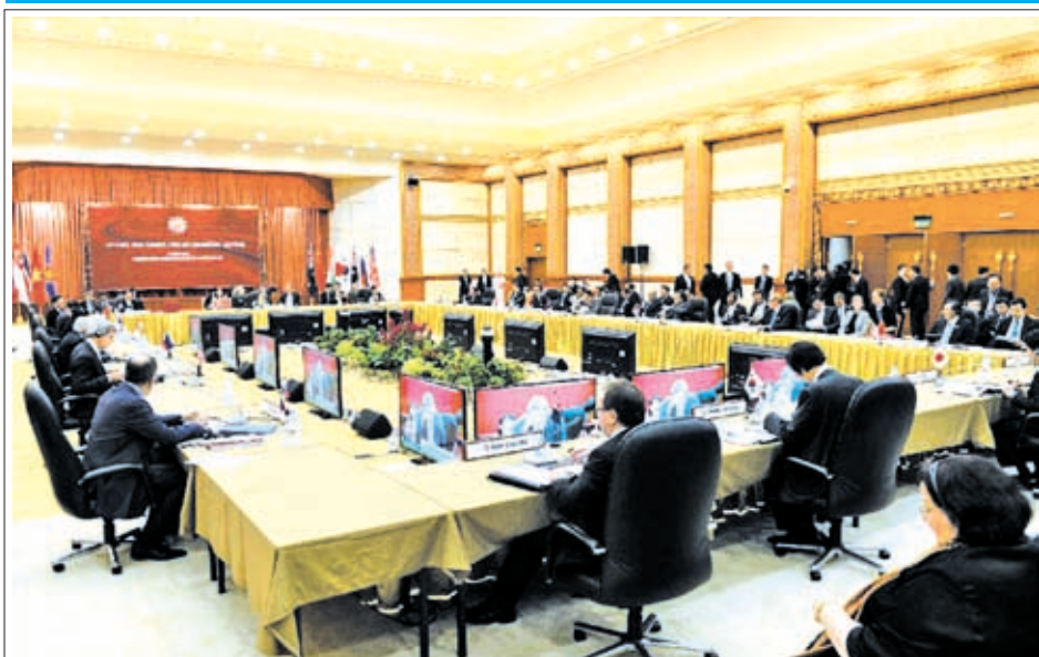
Photo taken on 2 July, 2013 shows the scene of the 3 rd East Asia Summit Foreign Ministers meeting in Bandar Seri Begawan, Brunei.