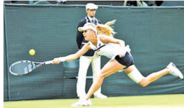
Agnieszka Radwanska of Poland reaches to hit a return to Li Na of China during their women's quarter-final tennis match at the Wimbledon Tennis Championships, in London on 2 July, 2013.

She secured a double break but spurned two match points at 5-1 up and another five in the next