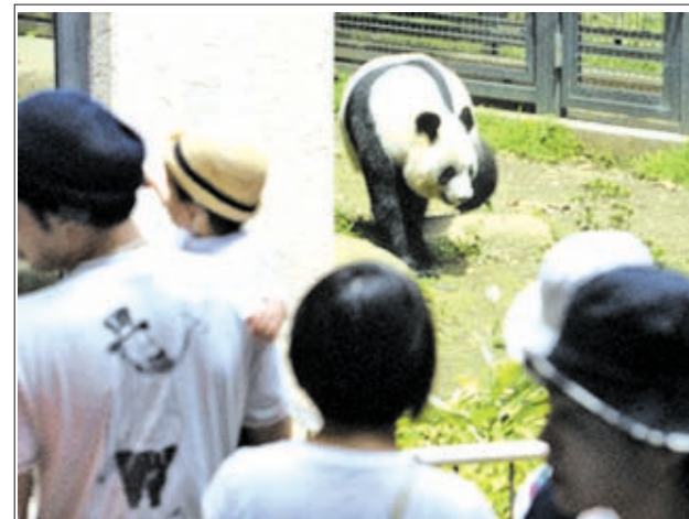
Visitors view giant panda Shin Shin back on public display at Tokyo’s Ueno Zoo on 2 July, 2013. She was removed for observation the previous month for a condition later found likely to be a “false pregnancy.”