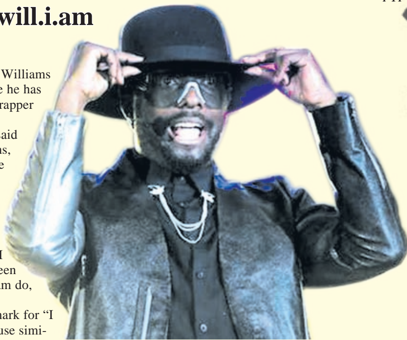
Recording artist will.i.am performs at the 2013 Wango Tango concert at the Home Depot Center in Carson, California on 11 May, 2013.

The case is I Am Other Entertainment, LLC v William Adams, US District Court for the Southern District of New York, No 13-4547.—Reuters