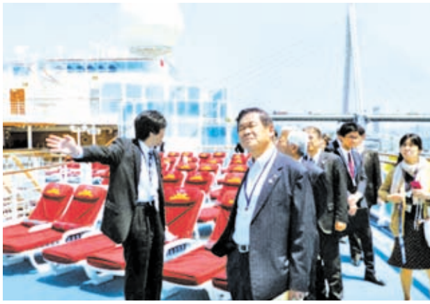
Officials from the Osaka city government and the Osaka Chamber of Commerce and Industry inspect the cruise ship Diamond Princess on 8 May, 2013 at Osaka port in western Japan.

On the morning of 8 May, the 116,000-ton