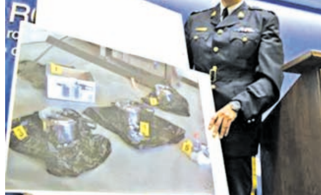
Royal Canadian Mounted Police Assistant Commissioner Wayne Rideout displays a picture of pressure cookers used by two individuals arrested while conspiring to commit an attack in Surrey, British Columbia on 2 July, 2013.

SURREY, 3 July—Canadian police said on Tuesday they foiled an al-Qaeda-inspired plot to detonate three pressure-cooker bombs during Monday's Canada Day holiday outside the parliament building in the Pacific coast city of Victoria, arresting a Canadian man and woman and seizing their home-made explosive devices.