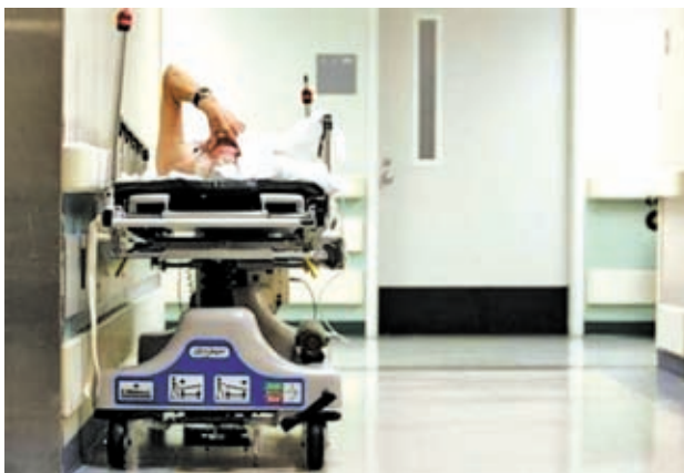
A patient waits in the hallway for a room to open up in the emergency room at Ben Taub General Hospital, Texas, on 27 July, 2009.

WASHINGTON, 3 July—The Obama administration said on Tuesday it would not require employers to provide health insurance for their workers until 2015, delaying a key provision of President Barack Obama's healthcare reform law by