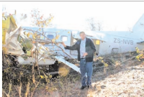
An accident investigator stands by the wreckage of a South African registered cargo aircraft that crashed on Saturday 7km northwest of the Francistown International Airport in the northeastern part of Botswana just before it landed, on 2 July, 2013. Botswana's Aircraft Accident Investigating Unit within the country's Ministry of Transport and Communications on Tuesday announced that investigations into last Saturday's plane crash in the northeastern part of Botswana are ongoing.