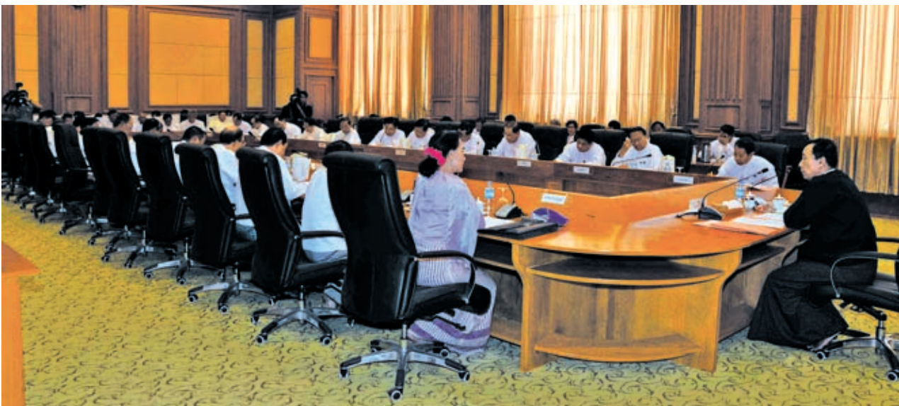
Work coordination meeting between Pyithu Hluttaw Speaker Thura U Shwe Mann and Committee chairmen, secretaries, commission members in progress.

NAY PYI TAW, 3 July—Work coordination meeting between Pyithu Hluttaw Speaker Thura U Shwe Mann and Committee chairmen, secretaries, commission members, took place at Zabuthiri Hall of Hluttaw Complex, here, this afternoon.