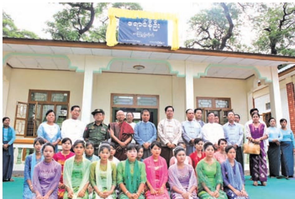
Union Minister U Hla Tun and party pose for documentary photo in front of Yaung Ni Oo library.

The new building of the rural health department and “Yaung Ni Oo” Library were constructed with the contribution of donors U Soe Hlaing and