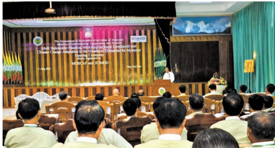
Union Minister U Win Tun addresses Multi Stakeholder Planning Workshop on Rural Livelihoods and Climate Change Adaptation in Himalayas (Himalica) for Myanmar.—MNA

It was also attended by officials of the ministries concerned, Pa-O Self-Administered Zone and members of leading bodies of Danu Self-Administered Zone, Inn-thar Literature,