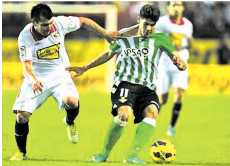
Sevilla's Gary Medel (L) and Real Betis' Alejandro Pozuelo fight for the ball during their Spanish First Division soccer match at Ramon Sanchez Pizjuan stadium in Seville on 18 Nov, 2012.

LONDON, 3 July—Swansea City have signed midfielder Alejandro Pozuelo from Real Betis on a three-year deal, the Premier League club said on Tuesday.