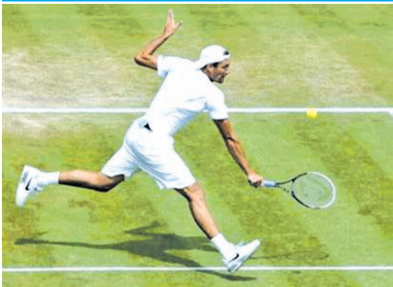
Lukasz Kubot of Poland hits a return to Benoit Paire of France during their men's singles tennis match at the Wimbledon Tennis Championships, in London on 29 June, 2013.