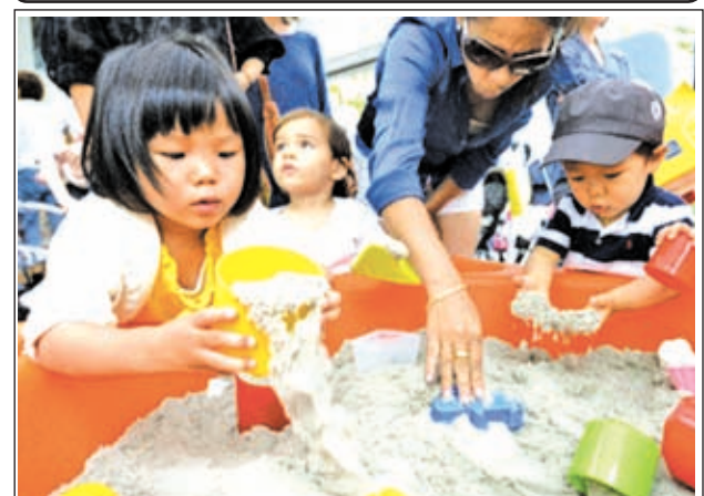
Children play with the "Dancing Sand" kit specifically for indoor use during a promotion event on 11 June, 2013 in Tokyo's Shibuya Ward.

the Philippine Embassy has "advised our citizens in Egypt to stay away from areas where protests are held and to exercise caution in public areas at all times." He said the Embassy there will also regularly issue public advisories regarding developments on the peace and order situation in that country.—Xinhua