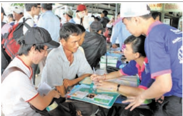
Volunteers help students ahead of the Vietnam’s national university entrance examination in Ho Chi Minh City, Vietnam, on 2 July, 2013. Over 1.71 million Vietnamese students will sit for the exam.

Vietnam is seeking to sign bilateral anti-human trafficking cooperation agreements with at least three countries and territories by 2015.—Xinhua