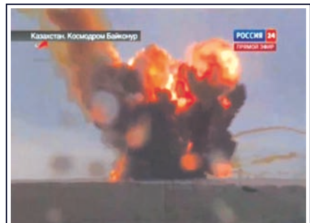
The TV grab taken from Russia 24 state TV channel on 2 July, 2013 shows the Proton-M rocket crashing after blasting off from the Baikonur Cosmodrome in Kazakhstan. A Proton-M rocket crashed one minute after blasting off from the Baikonur Cosmodrome in Kazakhstan, Russia’s federal space agency Roscosmos said on Tuesday.—XINHUA

The study identified five growth potential for increase mobile usage video calling, Wi-Fi at home, watching live TV shows, blogging and streaming video like YouTube. The sale of smartphone in the Philippine market is seen to increase significantly in the next few years as prices go down. The TNS study also revealed that most Filipinos living in Metro Manila own “multiple screens” or more than just one device. A typical household owns at least four of the following devices : a mobile phone (89 percent), smartphone (53 percent), tablet (14 percent), desktop (39 percent), laptop/netbooks (37 percent) and smart TV (4 percent.)—Xinhua