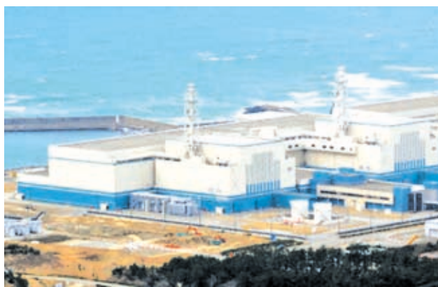
File photo taken in March 2012 shows the buildings containing the No 7 reactor (L) and the No 6 reactor at Tokyo Electric Power Co's Kashiwazaki-Kariwa nuclear power plant in Niigata Prefecture.

Obama noted that the countries he has visited have demonstrated to him that Africa is ready to unleash its potential to full prosperity, committing his country to assist the continent realize the dream.—Xinhua