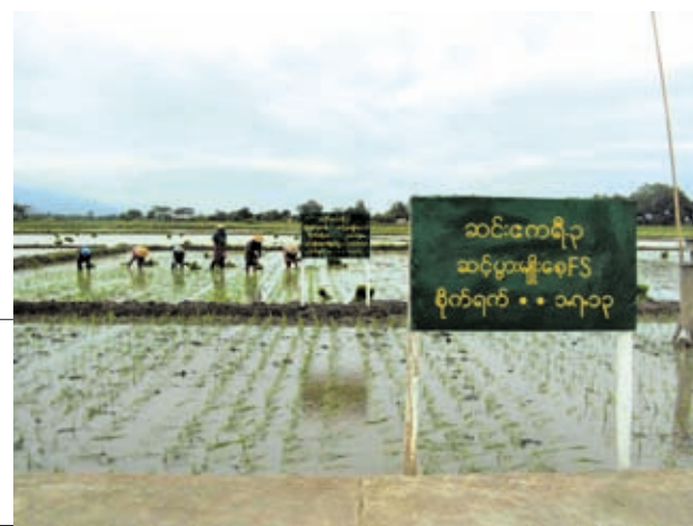
Test-growing of Hsin Akari-3 quality paddy strain seen at Agriculture Research Farm.