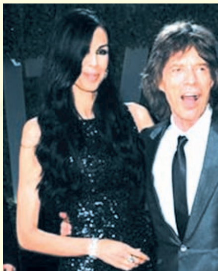
Mick Jagger is dating L'Wren Scott since the last 12 years.

"He likes having someone around he can trust," the source said.—PTI