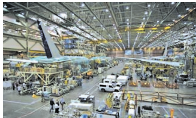
Several Boeing 777s sit on the assembly line at the company’s plant in Everett, Washington, on 18 Oct, 2012.—REUTERS