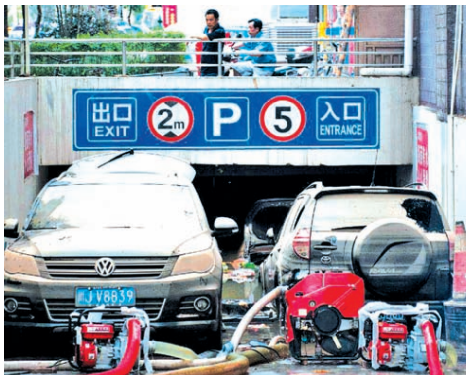
Vehicles park at the entrance to a flooded underground parking lot in Suining, southwest China's Sichuan Province, on 2 July, 2013. Torrential rains hit Suining from 29 June to 2 July, leaving six people dead, two missing and some 1.62 million affected.—XINHUA

In neighboring Chongqing Municipality, nearly 900,000 people have been affected by heavy rain since 30 June. Xinhua