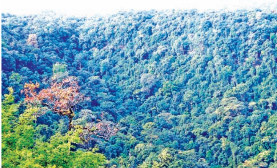
Chin State surrounded by mountain ranges is a region which is seen as representing the mountain ecosystem and providing a natural habitat for hundreds of species of plants and animals. Forest Department is

trying hard to extend natural habitats offering protection for forest depletion, environmental degradation and endangered species which are in danger of becoming extinct.