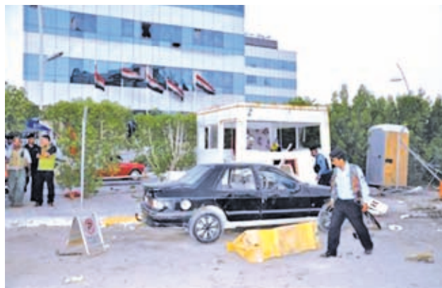
Iraqi security forces inspect the site of a car bomb attack in Basra, 420 km (260 miles) southeast of Baghdad, on 2 July, 2013.—REUTERS

Further south, a car bomb in Amara Province killed four people and in the city of Basra, three blasts hit a hotel frequented by foreigners working in the oil industry, wounding three guards.—Reuters