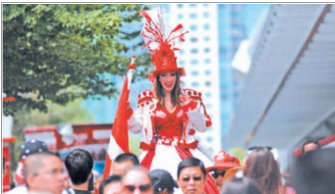
A performer dressed in Canadian colors entertains the public during the Canada Day celebrations in Vancouver, Canada, on 1 July, 2013. Tens of thousands of spectators flooded the streets of Vancouver to participate in Canada Day festivities.

Guan noted that the lesson of the European debt crisis was that many economic entities with high ratings ended up in the credit crisis due to erroneous ratings, and thus it became a strategic issue how to change the situation where the European economy was highly dependent on the US-provided ratings.— Xinhua