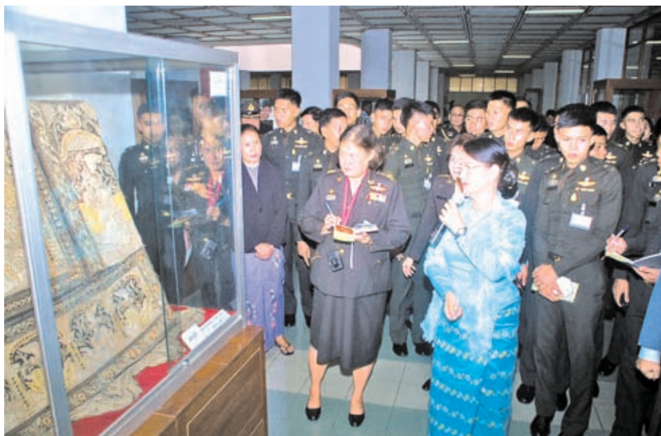
Princess Maha Chakri Sirindhorn of Thailand and cadets of Royal Thai Armed Forces visit National Museum in Yangon.

On the occasion, Union Minister for Sports U Tint Hsan said that today's awarding ceremony is meant to encouraging next generation students and staff. The ministry has