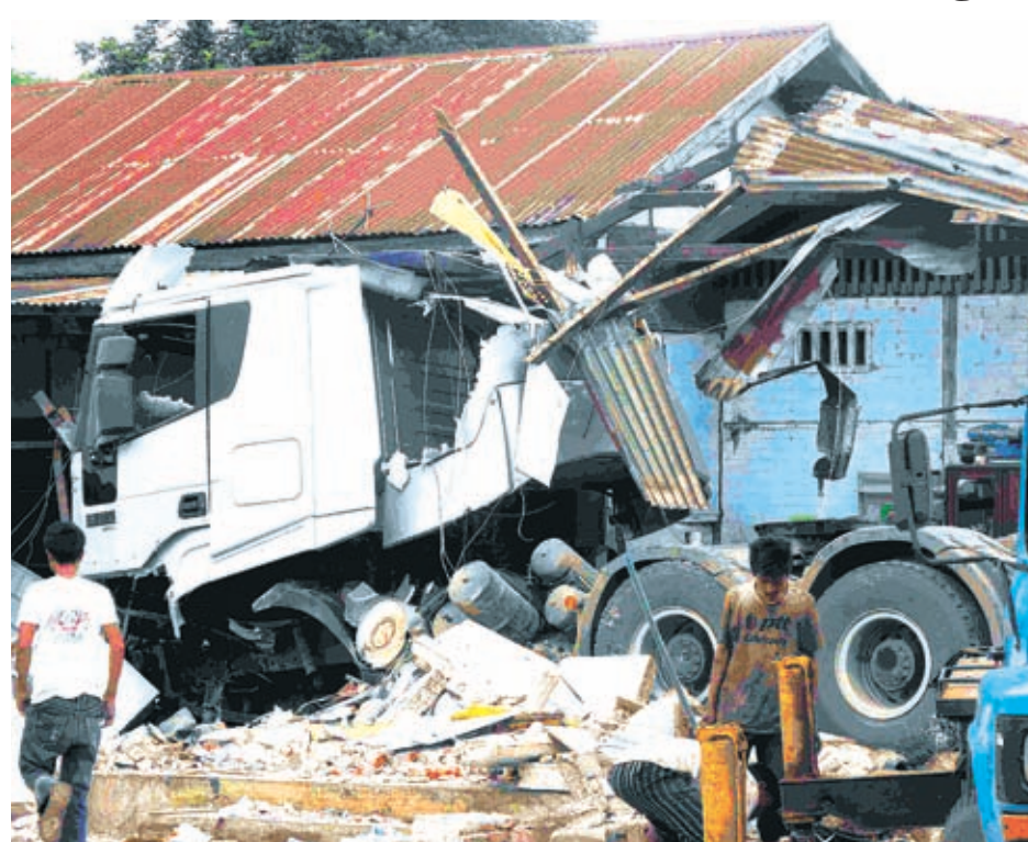
Truck bound for Muse hits a building in Lashio.