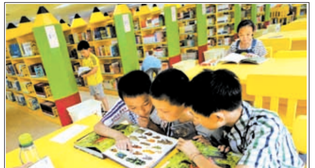
Children read books at the Henan Provincial Children's Library in Zhengzhou, capital of central China's Henan Province, on 1 July, 2013. Many children enjoy reading during their summer vacation.