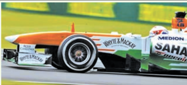
Force India Formula One driver Paul Di Resta of Britain takes a curve during the second practice session ahead of the British Grand Prix at the Silverstone Race circuit, central England, on 28 June, 2013.

Force India had both their cars in the points at a controversial Silverstone race punctuated by tyre fail-