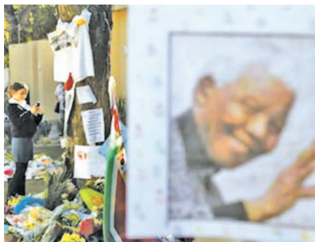
A child views messages of support outside the home of ailing former President Nelson Mandela in Houghton, Johannesburg, on 1 July, 2013.

Obama met the Mandela family on Saturday, offering words of comfort and praising the retired statesman as one of history's greatest figures.