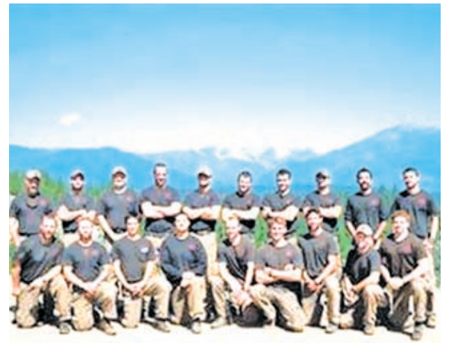
The Granite Mountain Interagency Hotshot Crew is shown in this undated handout photo provided by the City of Prescott in Arizona on 1 July, 2013.—REUTERS