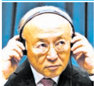
International Atomic Energy Agency (IAEA) Director General Yukiya Amano adjusts his headphones during a conference on nuclear safety at the IAEA headquarters in Vienna on 1 July, 2013.