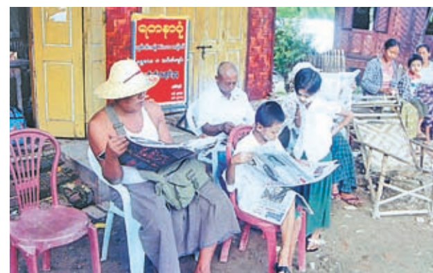
Newspaper readers in Mandalay Region can now read dailies earlier than before.

with the improvement in the distribution which enables them to read daily papers right on the day of printing.