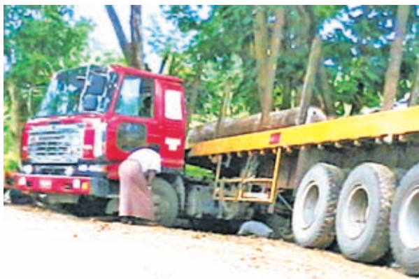
A truck bound for Pynmana from Thaikchaung Junction plunged into the roadside on Yangon-Mandalay Highway in Zeyathiri Township in Nay Pyi Taw before arrival at Safari Park on 30 June.