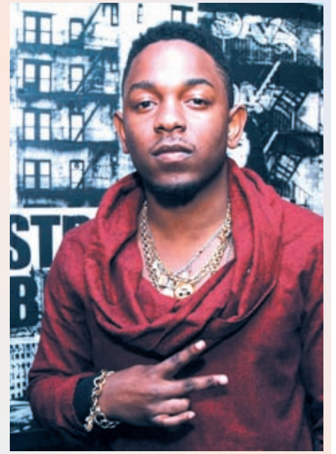
Rapper Kendrick Lamar

The Sportsman of the Year honour went to NBA and Mi-