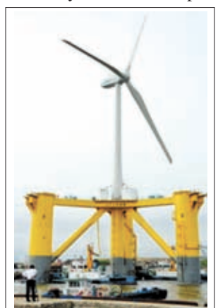
Photo shows a wind turbine on a floating wind power mill at Onahama port in Iwaki, Fukushima Prefecture, on 1 July, 2013. The 2-megawatt plant is scheduled to begin operation in October 2013 off Naraha, Fukushima Prefecture.