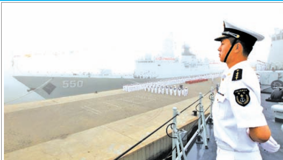
Chinese naval personnel take part in a ceremony for the departure of a fleet in the port of Qingdao, east China's Shandong Province, on 1 July, 2013. A Chinese fleet consisting of seven naval vessels departed from east China's harbour city of Qingdao on Monday to participate in Sino-Russian joint naval drills scheduled for 5 to 12 July. The eight-day maneuvers will focus on joint maritime air defence, joint escorts and marine search and rescue operations.