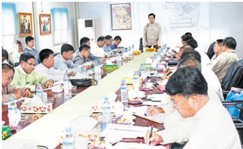
Union Minister at the President Office U Hla Tun addresses coordination meeting of the Committee for Implementation of the Investigation Commission's report on Lapadaungtaung Copper Mine Project.

In his address, Chairman of the committee Union Minister at the President Office U Hla Tun called on four subcommittees to make more efforts to accomplish the mission, targeting a win-win situation in implementing their