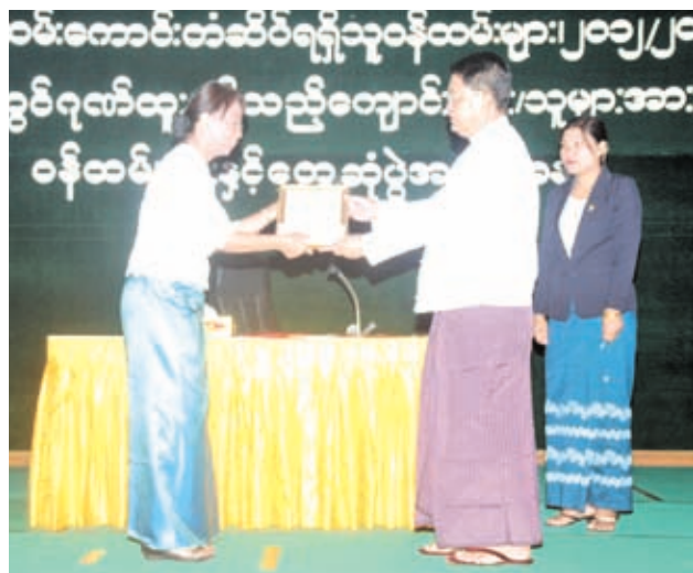
Union Minister for Sports U Tint Hsan presents award to an outstanding staff.

NAY PYI TAW, 2 July— The Ministry of Sports honoured the outstanding students who passed the matriculation examination for 2012-13 academic year and presented outstanding staff excellent public service medals at the assembly hall of the ministry, here, today.