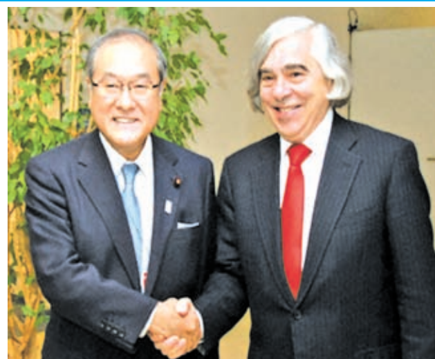
US Energy Secretary Ernest Moniz (R) and Japanese Senior Vice Foreign Minister Shunichi Suzuki shake hands in Vienna, Austria, on 1 July, 2013.