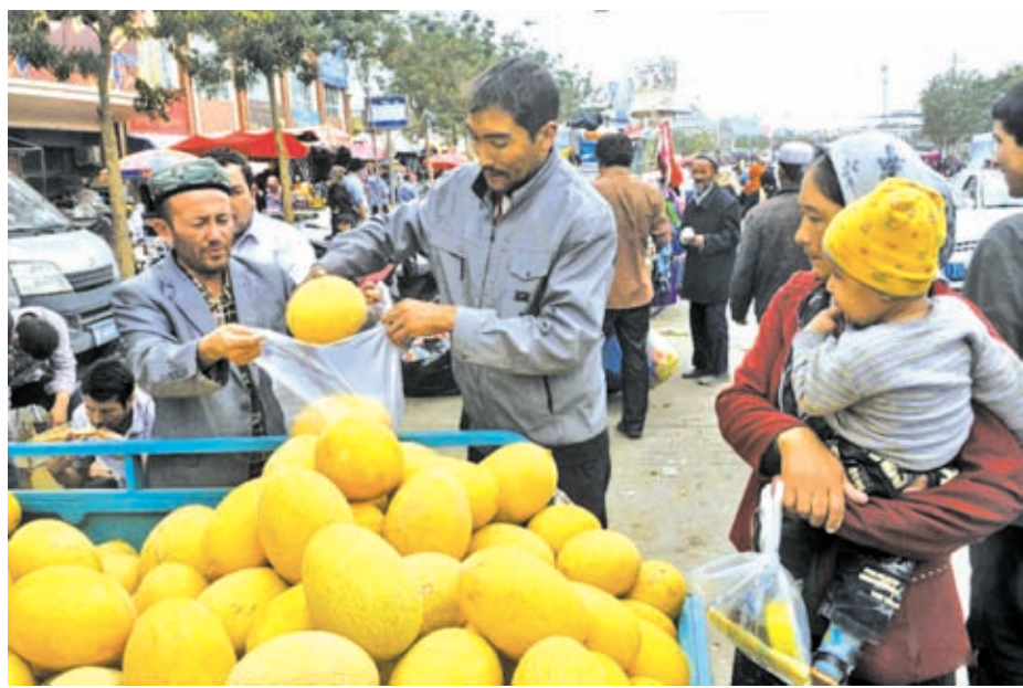
Locals buy melons at the Id Kah Bazaar in the city of Hotan, northwest China's Xinjiang Uygur Autonomous Region, on 1 July, 2013.