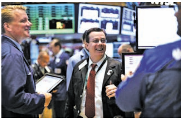
Traders work on the floor at the New York Stock Exchange, on 27 June, 2013.