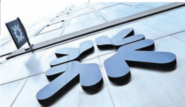
A logo at a Royal Bank of Scotland (RBS) branch is seen in the City of London on 6 March, 2013.

LONDON, 2 July—The British government is set to name Rothschild to advise on a potential break-up of Royal Bank of Scotland (RBS.L),