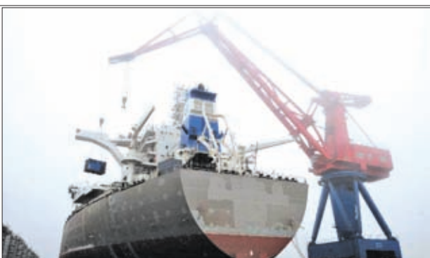
Photo taken on 1 July, 2013 shows a shipyard in Qingdao, east China's Shandong Province. The purchasing managers' index (PMI) for the manufacturing sector fell to 50.1 percent in June from 50.8 percent in May, according to data issued by the China Federation of Logistics and Purchasing (CFLP) on 1 July.

The intensity of the quake was believed to be 3 to 4 MMI (Modified Mercally Intensity) at Banda Aceh, Takengon, and Lhoksemawe, and 2 MMI at Medan the provincial capital of North Sumatra, he said.—Xinhua