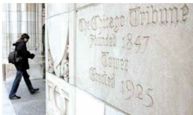
A man enters the Tribune Tower in Chicago, on 2 April, 2007.