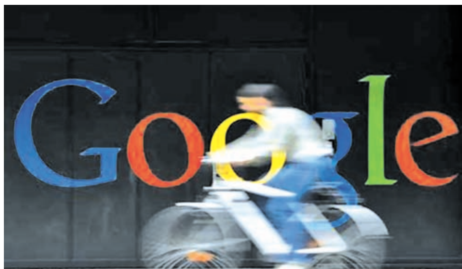
An employee rides her bike past a logo next to the main entrance of the Google building in Zurich on 9 July, 2009.

The Xperia Z Ultra comes with new and updated Sony Media Applications including new apps for Walkman, Movies and Album.