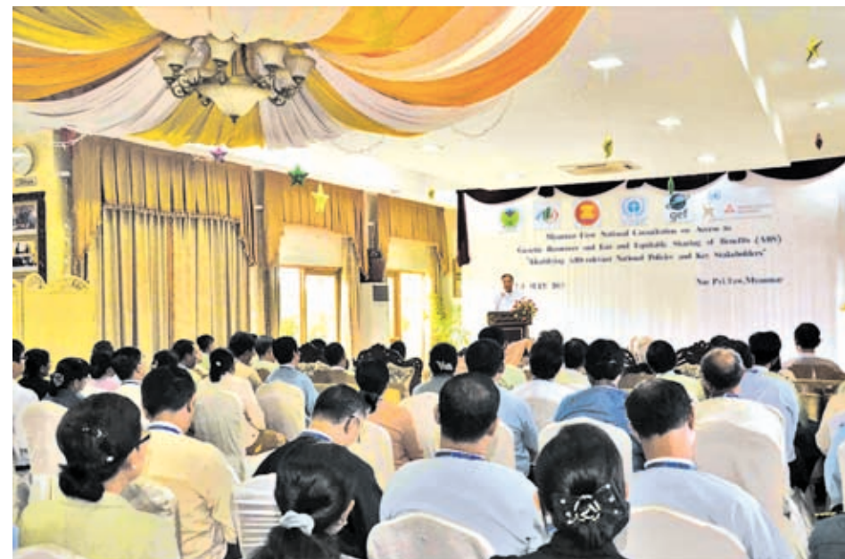
Union Minister U Win Tun delivers an address at First Myanmar National Consultation on Access to Genetic Resources and Fair and Equitable Sharing of Benefits-ABS.—MNA

In his address, Union Minister U Win Tun spotlighted depletion of natural habitats of biodiversity in Myanmar and impacts of excessive exploitation of forest resources, deforestation, transformation of natural forests to the lands for other purposes, traditional slash-and-burn farming in hilly regions, dumping of chemical waste in rivers and creeks, unsystematic fishing, import of alien species that can