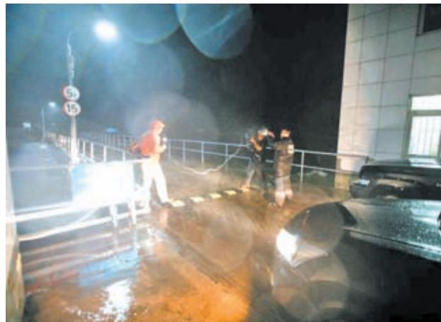
Journalists cover the tropical storm at a dock when tropical storm Rumbia lands on Zhanjiang, south China's Guangdong Province, on 2 July, 2013. Tropical storm Rumbia landed on Zhenjiang on Tuesday morning and brought torrential rain and gales to some areas in Guangdong Province.— XINHUA

Guangxi's provincial meteorological department has upgraded severe weather alerts in the region, saying the storm may enter the city of Yulin and continue to move northwest as it loses power.— Xinhua