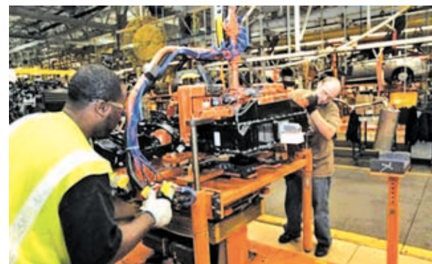
Ford Assembly workers install a battery onto the chassis of a Ford Focus Electric vehicle at the Michigan Assembly Plant in Wayne, Michigan on 7 Nov, 2012.