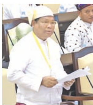
Union Minister U Win Myint discusses proposal.