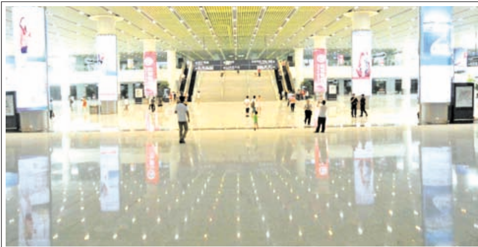
People walk inside the newly-opened Hangzhou East Station in Hangzhou, capital of east China's Zhejiang Province, on 1 July, 2013. With the building area of 1.13 million square metres, the Hangzhou East Station, China's largest railway terminal, officially opened on Monday.