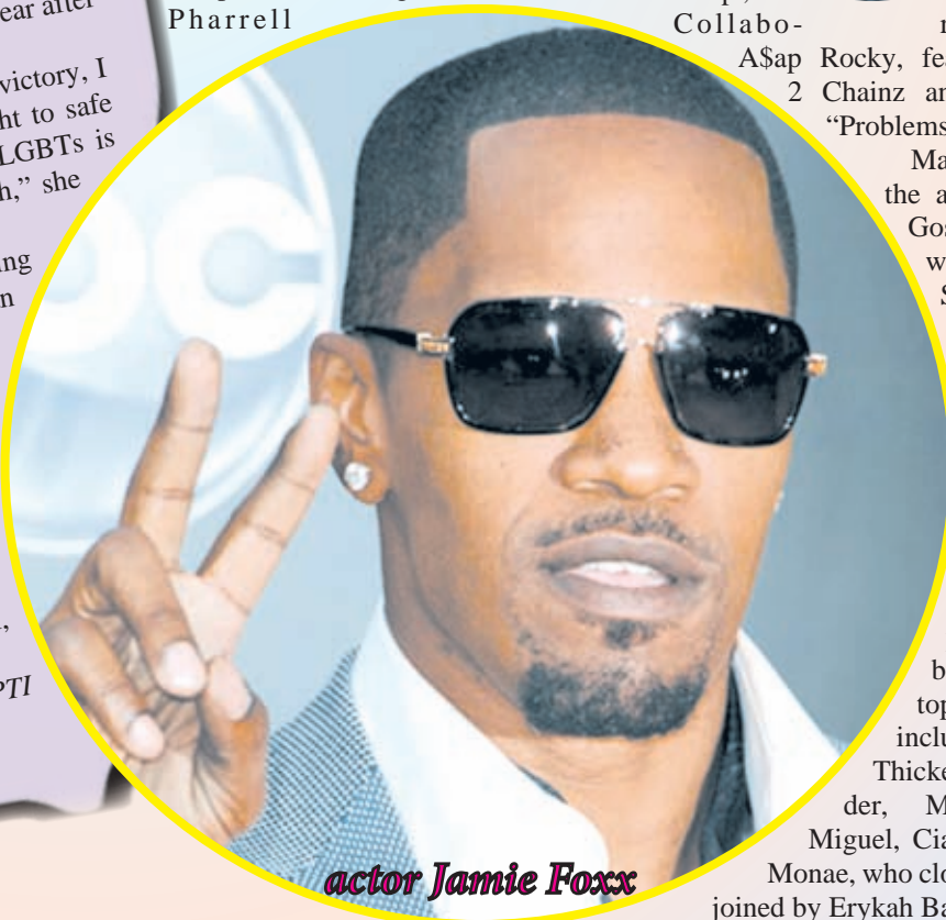
actor Jamie Foxx

The show featured performances by a host of top performers including Robin Thicke, Stevie Wonder, Mariah Carey, Miguel, Ciara and Janelle Monae, who closed the awards joined by Erykah Badu.