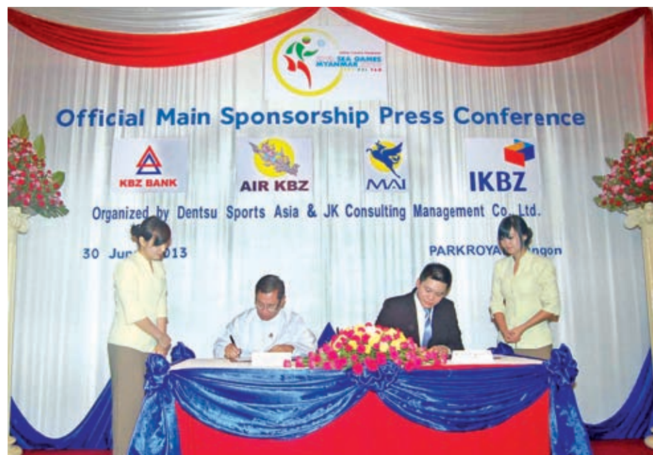
MoU signing for official main sponsor in 27 th SEA Games in progress.—MNA