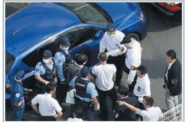
Photo from a Kyodo News helicopter shows police officers in Miyoshi, Saitama Prefecture, on 28 June, 2013, surrounding a man (C) suspected of attacking three elementary school boys with a knife in Tokyo earlier in the day. The children suffered non life-threatening injuries.

"When he (Snowden) arrives on Ecuadorean soil, if he arrives ... of course, the first opinions we will seek are those of the United States," Correa said.