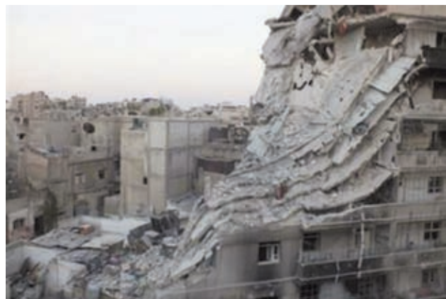
A general view shows buildings damaged by what activists said was shelling by forces loyal to Syria's President Bashar al-Assad in the Al-Khalidiya neighbourhood of Homs on 28 June, 2013.

BEIRUT, 30 June—Syrian President Bashar al-Assad's forces launched a major offensive on Saturday against rebels in Homs, a centre of the two-year-old uprising, in their latest drive to secure an axis connecting Damascus to the Mediterranean.