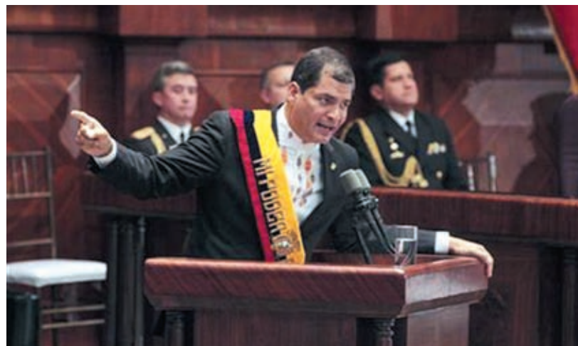
Ecuador's President Rafael Correa addresses the National Assembly during his inauguration ceremony in Quito on 24 May, 2013.