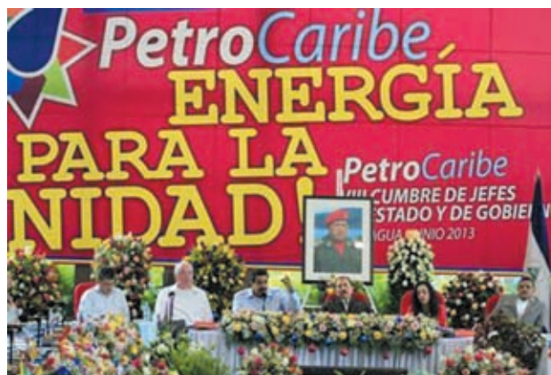
Besides Ortega and Maduro, Bolivian President Evo Morales also attended the summit, as did Cuban Vice President Miguel Diaz-Canel and Ecuadorean Foreign Minister Ricardo Patino.

MANAGUA, 30 June— Delegations from over a dozen countries that are members of the Venezuelan-led oil alliance Petrocaribe agreed on Saturday to adopt a framework for promoting trade within the block.