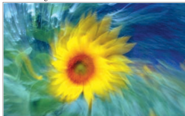
A sunflower blossoms at the Olympic Forest Park in Beijing, capital of China, on 29 June, 2013.