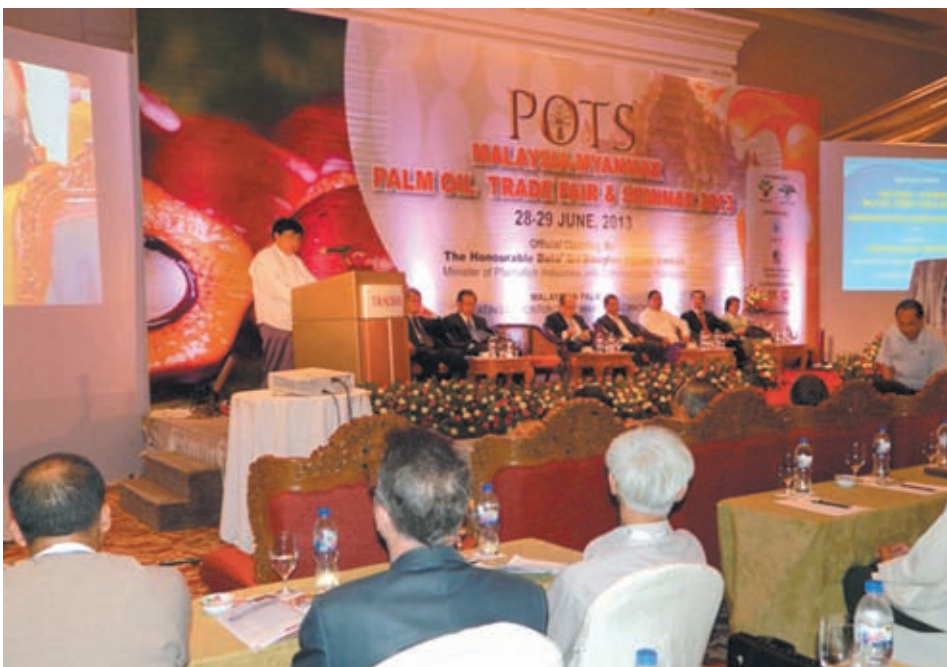
YANGON, 30 June—A ceremony to open Malaysia Palm Oil Exhibition,

organized by Malaysia Palm Oil Council (MPOC) and Malaysia Palm Oil Board (MPOB) was held at Traders Hotel, here yesterday in conjunction with paper reading session.