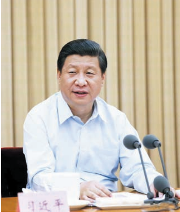
Chinese President Xi Jinping, also general secretary of the Central Committee of the Communist Party of China (CPC) and chairman of the Central Military Commission (CMC), addresses a meeting attended by delegates from the Party's Organization Department in Beijing, capital of China, on 28 June, 2013.

BEIJING, 30 June—Chinese President Xi Jinping on Saturday noted that China would never assess the performance of an official simply based on his record of boosting economy.