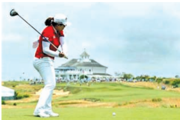
Inbee Park of South Korea hits her 2nd tee shot during the third round of the 2013 US Women's Open golf championship at the Sebonack Golf Club in Southampton, New York on 29 June, 2013.

The UN has voted to put Iraq under chapter seven after the Iraqi invasion of Kuwait in 1990.