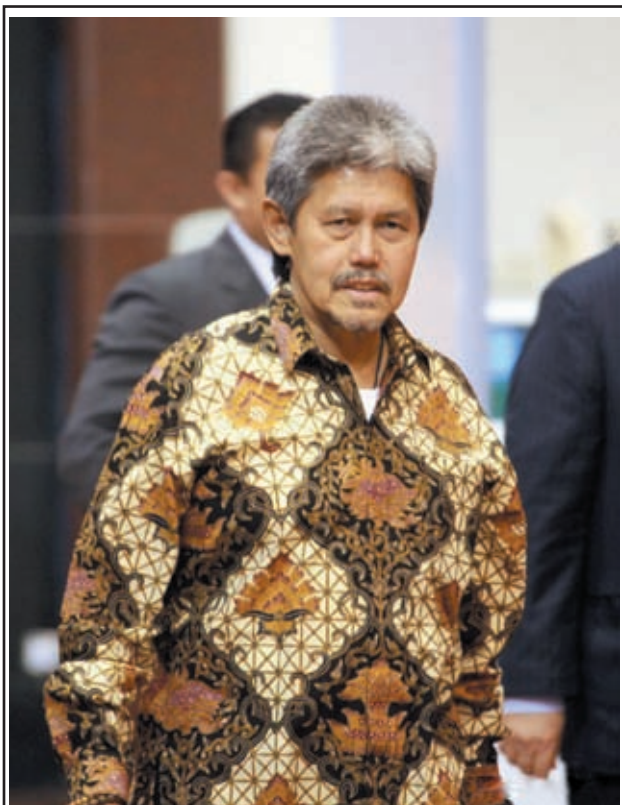
Brunei's Prince Mohamed Bolkiah attends a welcome dinner in Bandar Seri Begawan on 29 June, 2013. The 46th ASEAN Foreign Ministers' Meeting (AMM) will be held on Sunday at the International Convention Centre, Brunei Darussalam.