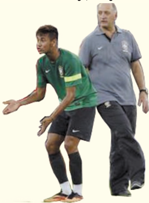
Brazil's Neymar and coach Luiz Felipe Scolari take part in a training session at Maracana stadium in Rio de Janeiro on 29 June, 2013. Brazil will play against Spain in their Confederations Cup final soccer match on Sunday.

prove it to the Brazilian crowds who have been fantastic and supported us so much." Scolari guided Brazil to their fifth World Cup final success over Germany in Yokohama on 30 June, 2002, and, although he said he did not live in the past or know the dates of all his successes, he would natu-