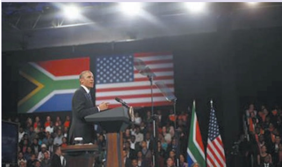
US President Barack Obama participates in a town hall-style meeting with young African leaders at the University of Johannesburg Soweto, on 29 June, 2013.

PRETORIA, 30 June—The United States does not feel threatened by the growth of trade and investment in Africa by China