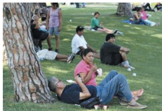
People gather in the shade at Belvedere Lake Park as a potentially dangerous heat wave grips the western US, in Los Angeles, California, on 29 June, 2013.

Triple-digit temperatures extended as far east as Texas, with Corpus Christi shattering its all-time high with a reading of 107 Fahrenheit (42 Celsius).