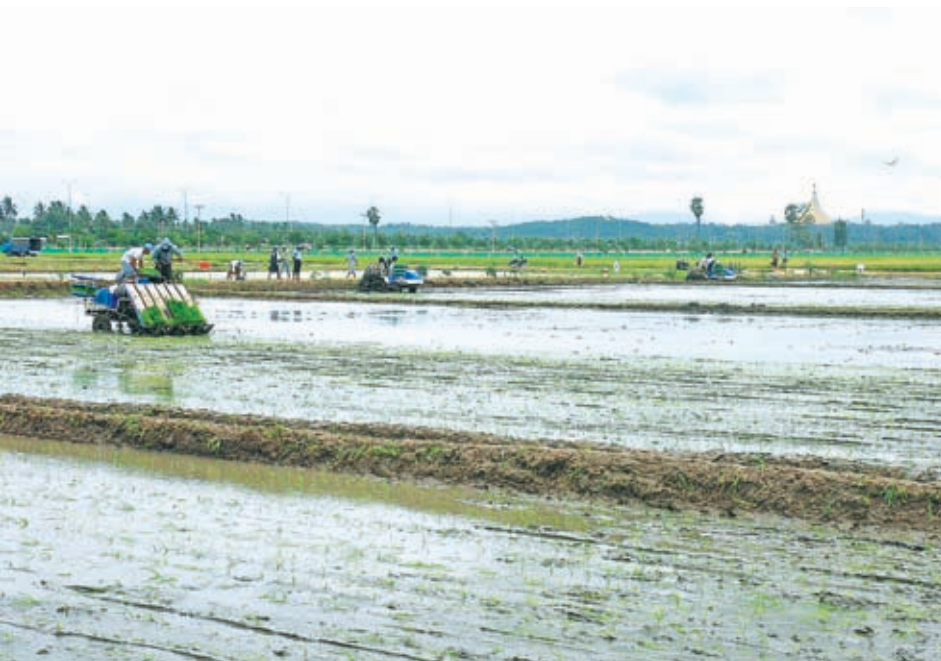
Paddy saplings being cultivated with the use of paddy transplanting machine at Rice Research Farm in Tegyikon Village of Zabuthiri Township. —MNA

NAY PYI TAW, 30 June — On his inspection tour of Satake Rice Mill construction site of Alliance Stars Company near Aung Thukha Village