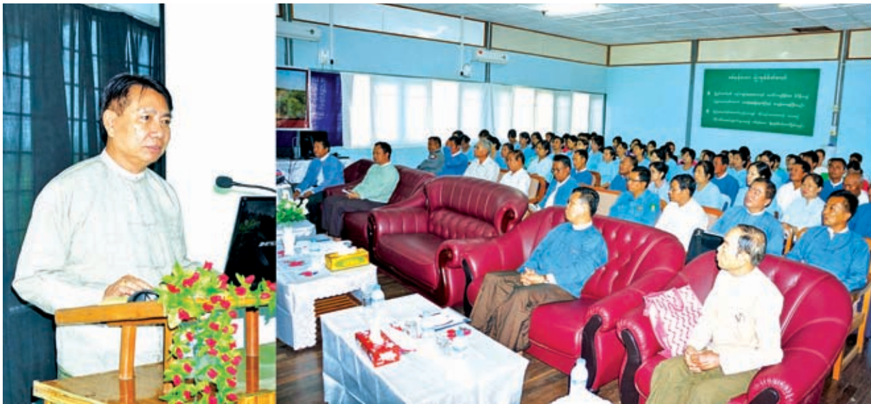
Union Minister U Aye Myint Kyu makes a speech at the meeting with staff of Archaeology, National Museum and Library Department and officials at Archaeology Technological Training School (Pyay).—MNA

NAY PYI TAW, 30 June—Union Minister for Culture U Aye Myint Kyu met staff of Archaeology, National Museum and Library Department and officials at Archaeology Technological Training School (Pyay) in Hmawza Village-tract of Pyay Township yesterday morning.