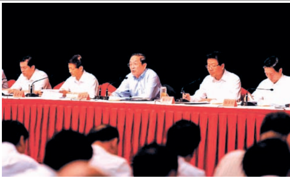
Yu Zhengsheng (C), member of the Standing Committee of the Political Bureau of the Communist Party of China (CPC) Central Committee, addresses a meeting attended by local officials in Urumqi, capital of northwest China's Xinjiang Uygur Autonomous Region, on 29 June, 2013.