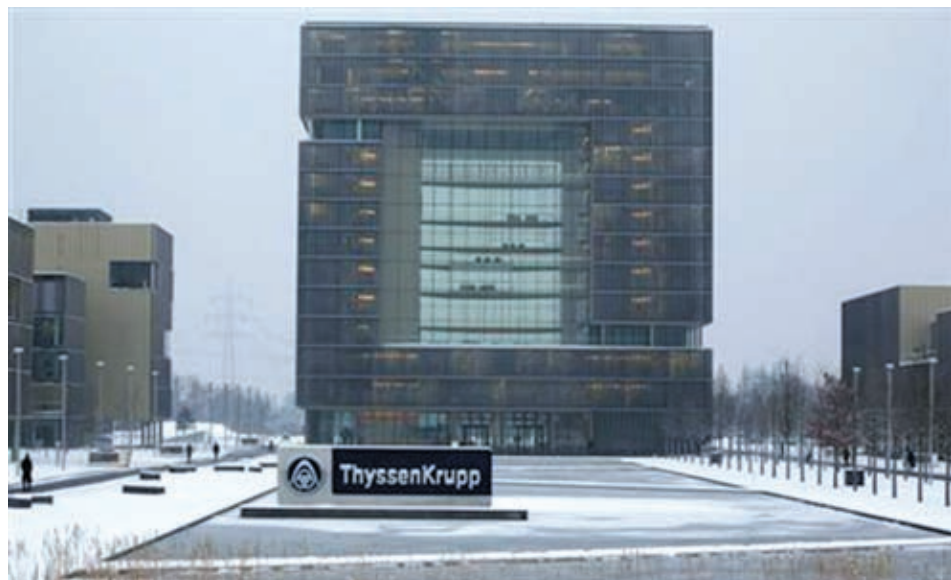
The headquarters of Germany's industrial conglomerate ThyssenKrupp AG are pictured in Essen on 16 Jan, 2013.