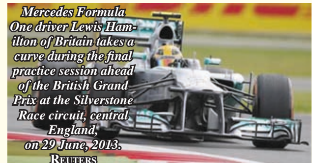
Mercedes Formula One driver Lewis Hamilton of Britain takes a curve during the final practice session ahead of the British Grand Prix at the Silverstone Race circuit, central England, on 29 June, 2013.