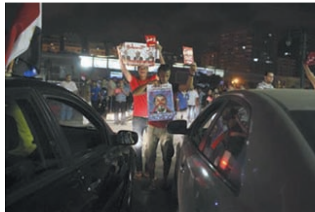
Volunteers from the opposition movement, carrying a crossed-out picture of President Mohamed Mursi and banners reading “Get out”, stop traffic to campaign for a major protest during the day, in Alexandria on 30 June, 2013.

CAIRO, 30 June—Mass demonstrations across Egypt on Sunday may determine its future, two and half years after people power toppled a dictator they called Pharaoh and ushered in a democracy crippled by bitter divisions.