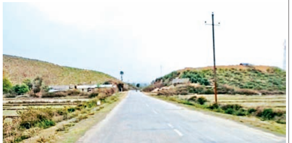
Photo shows Tamu-Imphal road section of Asia Highway.