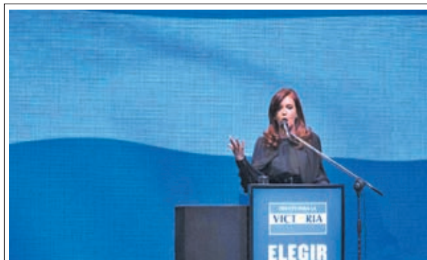
Argentina’s President Cristina Fernandez makes a speech during the event of presentation of candidates for the Primaries, Open, Simultaneous and Obligatory elections (PASO, for its acronym in Spanish) which will take place on 11 August, in Buenos Aires, capital of Argentina, on 29 June, 2013.