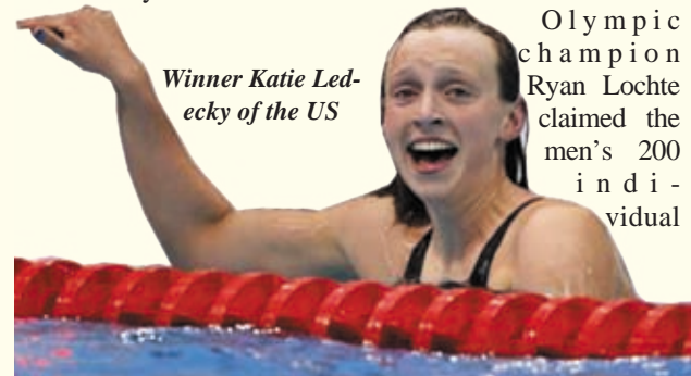
Winner Katie Ledecky of the US

and see what I could do and I'm looking forward to seeing what the US can do in Barcelona."