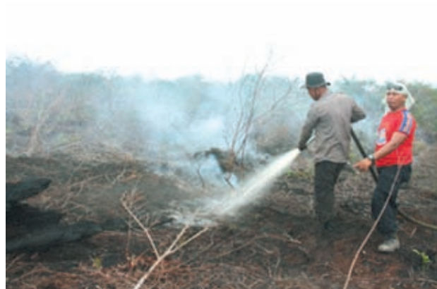
Firefighters spray water to put out a fire that has continued smoldering under peatland at an oil palm plantation in Bengkalis Regency, Riau, in Indonesia on 26 June, 2013. Fires on Sumatra have caused haze not only in Indonesia but also in Singapore and Malaysia.