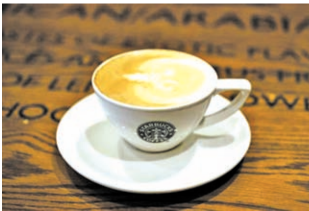
A cup of coffee sits on a table in Starbucks' Vigo Street branch in Mayfair, central London on 11 Jan, 2013.

The UK unit also paid 2 million pounds in interest to affiliated companies, the accounts showed.