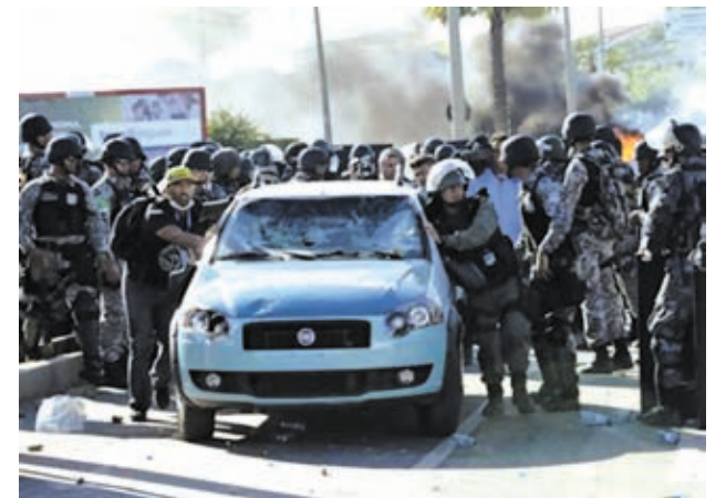
Riot policemen help to push a vehicle belonging to a local news media after it was attacked by demonstrators during a protest near the Estadio Castelao, where the Confederations Cup semi-final match between Spain and Italy is being played, in Fortaleza on 27 June, 2013.