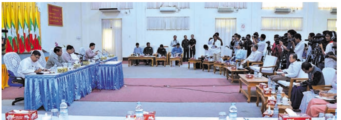
Regular press meet between the cabinet members of the Union Government and local and foreign media in progress.—MNA

press meet will be held twice a month. But it is over two months. Press meet should be held occasionally. I think that it will be quicker when spokespersons from the ministries explain their respective matters.