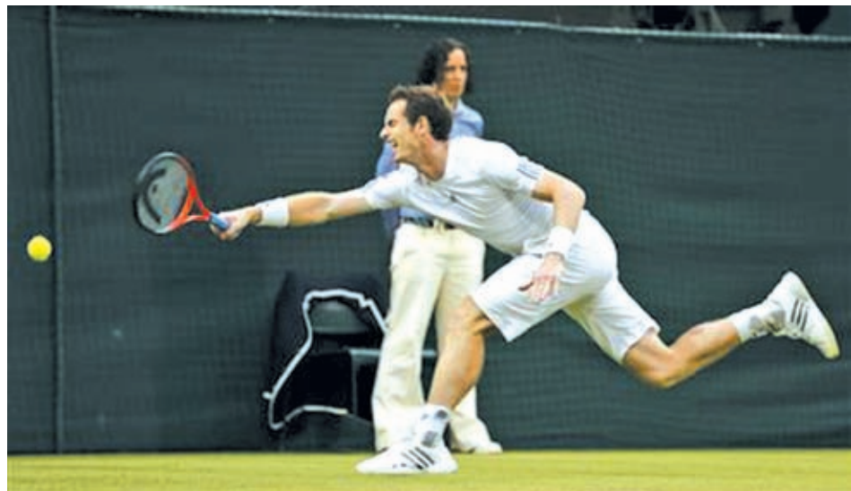
Andy Murray of Britain hits a return to Tommy Robredo of Spain in their men's singles tennis match at the Wimbledon Tennis Championships, in London on 28 June, 2013.

As if the hopes of a nation looking for a British man to end a 77-year barren run at Wimbledon were not enough of a millstone for Murray to carry, there is now the added weight of him being expected to at least reach the final.