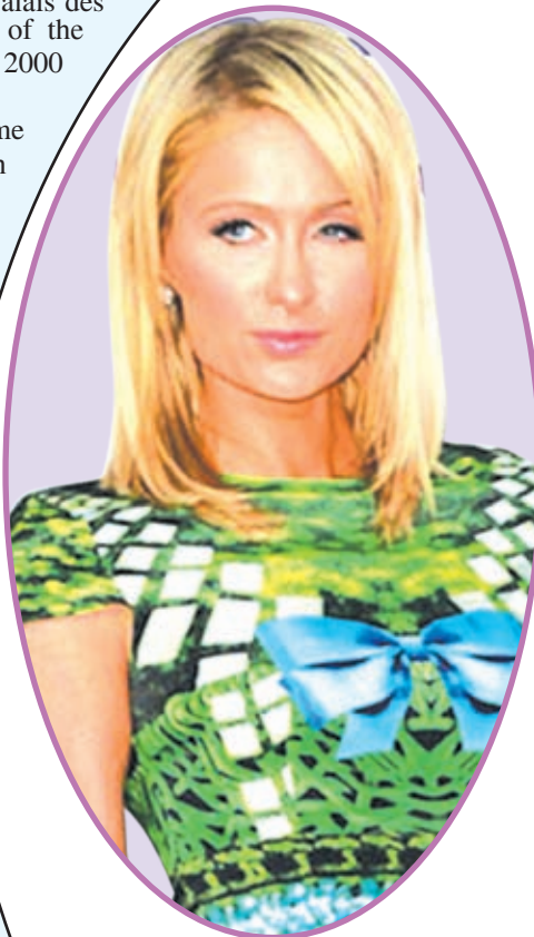
Paris Hilton and Harry Potter actress Emma Watson