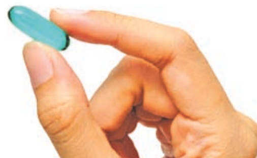
Rixubis, Hemophilia B Drug, Approved By FDA

guilt, according to the US Department of Veterans Affairs. The symptoms tend to start shortly after a person experiences a traumatic event, such as combat, terrorist attacks, serious accidents, natural disasters and personal violence or abuse. Physically, PTSD sufferers are known to often have raised levels of stress hormones and other chemicals signaling overactivation in the fight-or-flight pathways of the nervous system.—Reuters