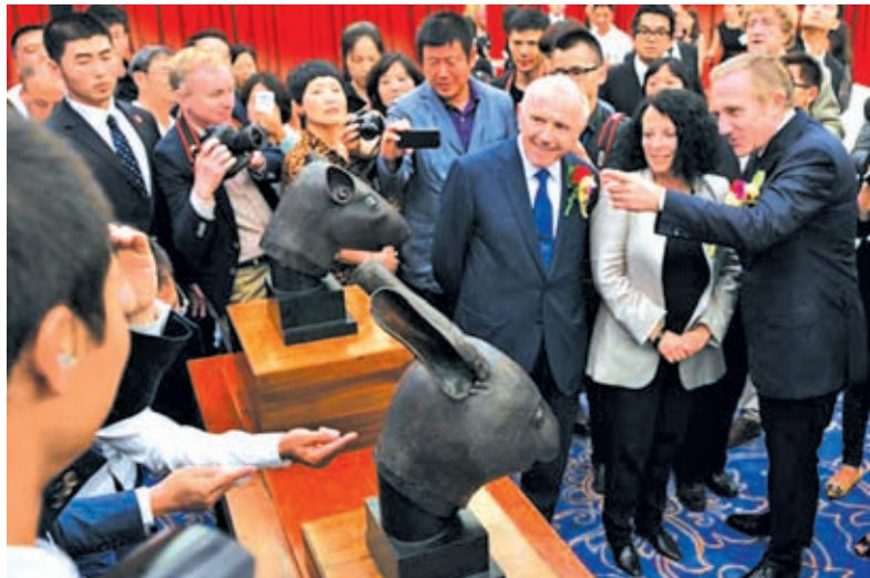
Two imperial bronze sculptures, looted from Beijing's Yuanmingyuan Garden in 1860, are handed over to the National Museum of China during a donation ceremony on Friday. XINHUA

BEIJING, 29 June—Two imperial bronze sculptures that were looted from Beijing's Yuanmingyuan Garden were handed over to the National Museum of China during a donation ceremony held on Friday.