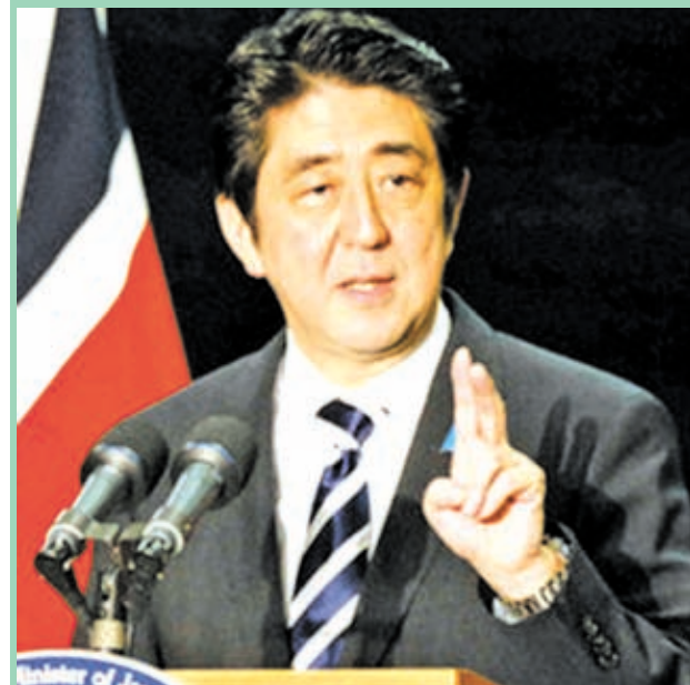
Japanese Prime Minister Shinzo Abe holds a news conference in Belfast on 18 June, 2013, after the closing of the Group of Eight nations summit at the Lough Erne golf resort near Enniskillen in Northern Ireland.

TOKYO, 29 June—Prime Minister Shinzo Abe expressed his resolve Friday to put an end to the divided Diet by winning the election for the opposition-controlled upper house next month.