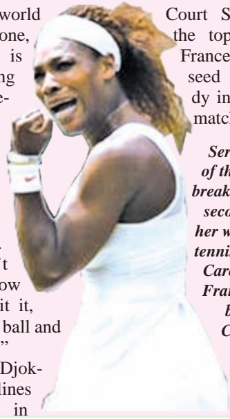
Serena Williams of the US reacts to breaking serve in the second set during her women's singles tennis match against Caroline Garcia of France at the Wimbledon Tennis Championships, in London on 27 June, 2013.