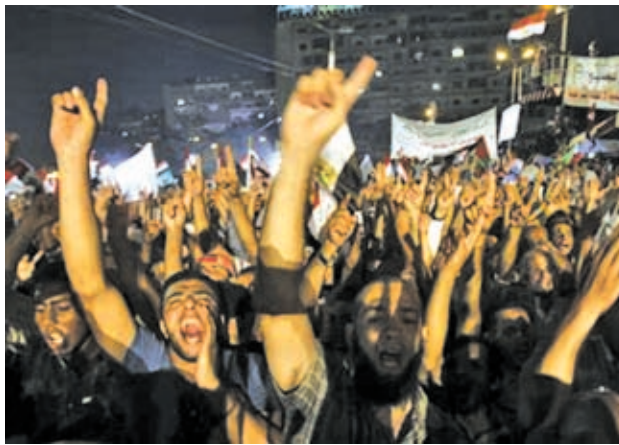
Supporters of Egyptian President Mohamed Mursi shout slogans with brotherhood's flag during a protest in the suburb of Nasr City, Cairo, on 28 June, 2013.

The US embassy said in a statement it was evacuating non-essential staff and family members and renewed a warning to Americans not to travel to Egypt unless they had to. The Muslim Brotherhood said eight of its offices had been