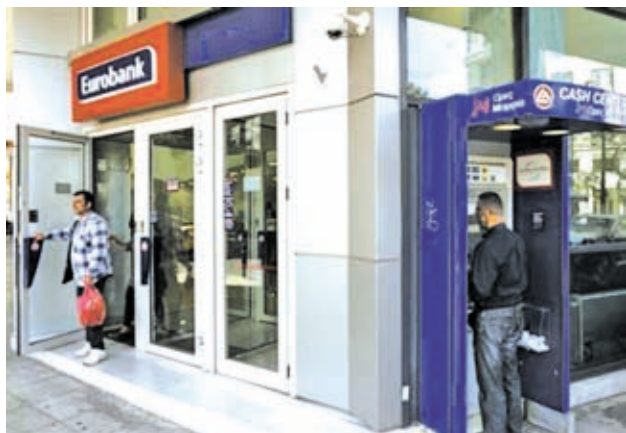
A customer leaves a Eurobank branch in Athens on 10 April, 2013.

ATHENS, 29 June— Greece's fourth-largest lender Eurobank (EFGAT) must follow an independent course, its new chief executive said on Friday, casting further doubt on whether a suspended merger with peer