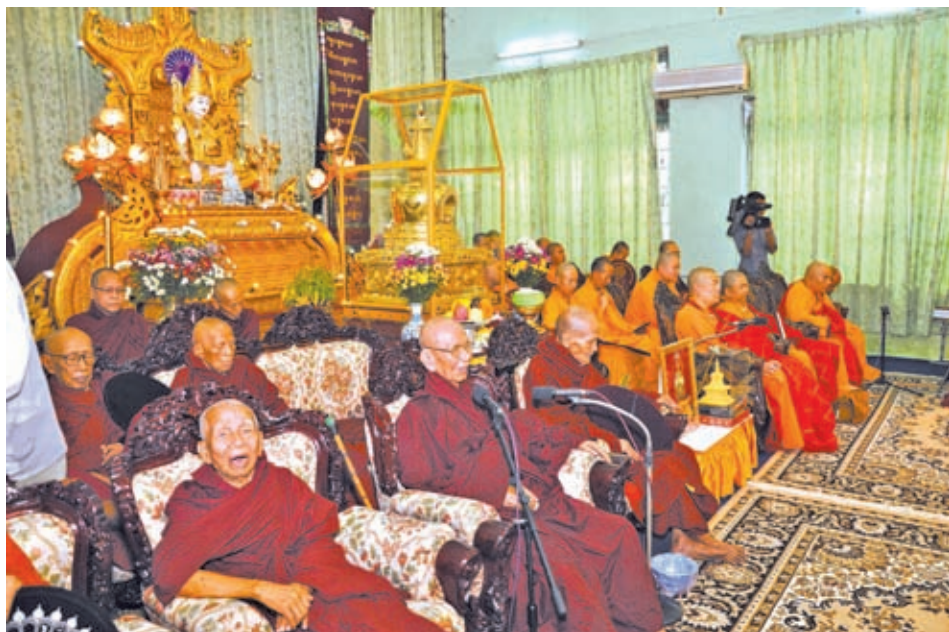
Consecration of Buddha Tooth Relic and Golden Shrine to be kept at Maha Muni Buddha Image in Mandalay in progress.

NAY PYI TAW, 29 June — A ceremony to hand over Buddha Tooth Relic and