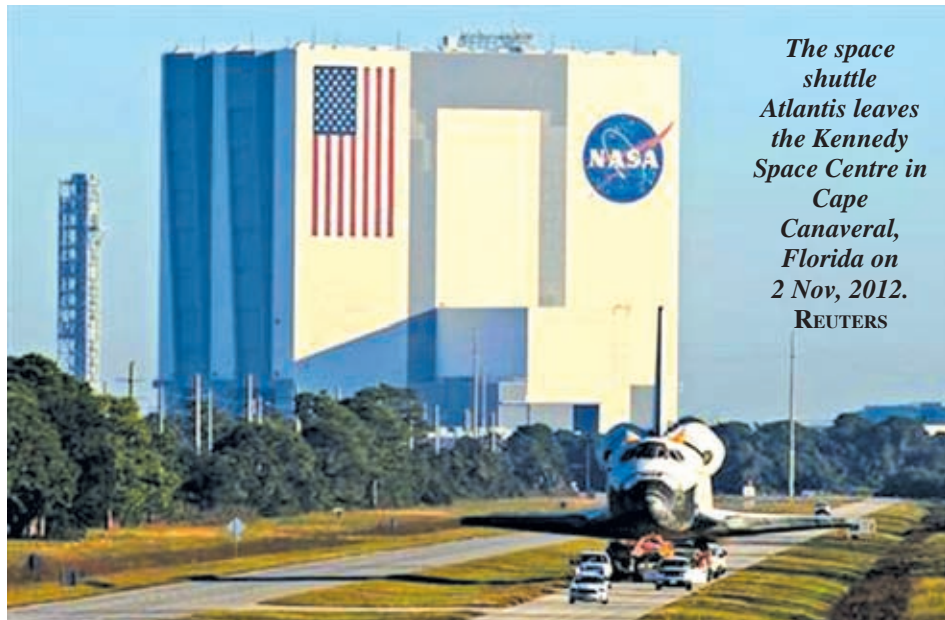
The space shuttle Atlantis leaves the Kennedy Space Centre in Cape Canaveral, Florida on 2 Nov, 2012.

The so-called CST-100 is one of three space-ships under development in partnership with NASA to fly astronauts to the International Space Station , a permanently staffed,