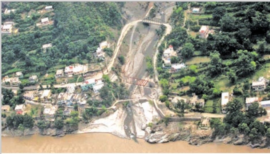
Aerial photo taken on 23 June, 2013 shows the Rudraprayag and Srinagar town ravaged by recent torrential rain and flash flood in northern Indian state of Uttarakhand. More than 7,000 people are still stranded in the mountains of Uttarakhand, nearly nine days after monsoon floods swept through the northern Indian state.

2. For more details please contact the following phone numbers during office hours: 067-411135, 067-411053, 067-411136.