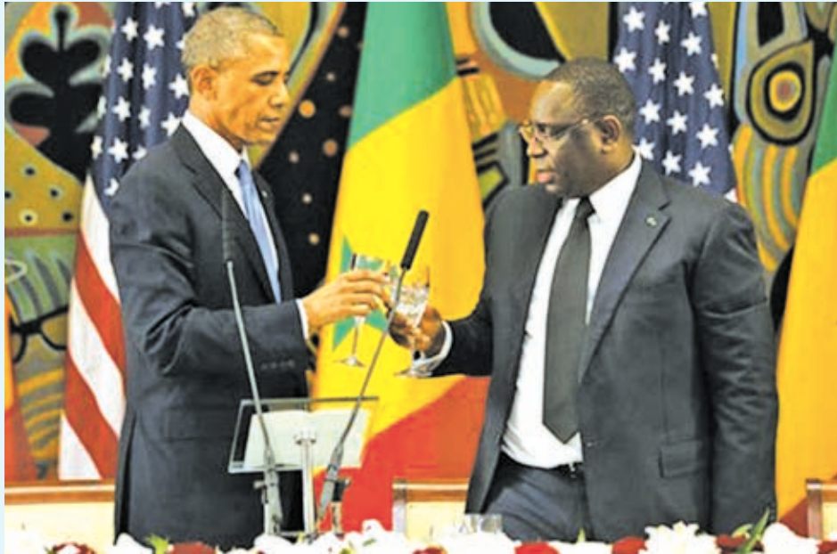
US President Barack Obama and Senegal's President Macky Sall.

ABOARD AIR FORCE ONE, 29 June—US President Barack Obama paid tribute to anti-apartheid hero Nelson Mandela as he flew to South Africa on Friday but played down expectations of a meeting with the ailing black leader during an Africa tour promoting democracy and food security.