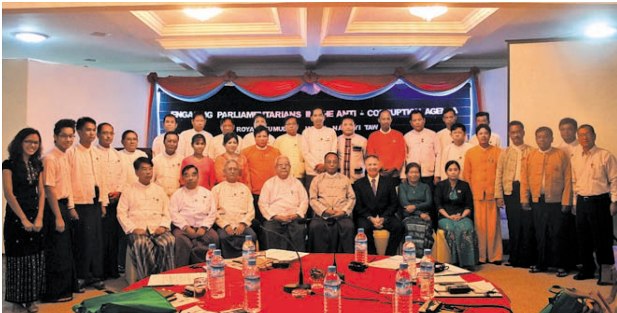
Speaker of Pyidaungsu Hluttaw and Amyotha Hluttaw U Khin Aung Myint poses for documentary photo with those present at the opening of workshop on Engaging Parliamentarians in the Anti-Corruption Agenda.

NAY PYI TAW, 29 June—A regular press meet between the cabinet members of the Union Government and local and foreign media was held at the assembly hall of the Ministry of Industry, here, this afternoon.