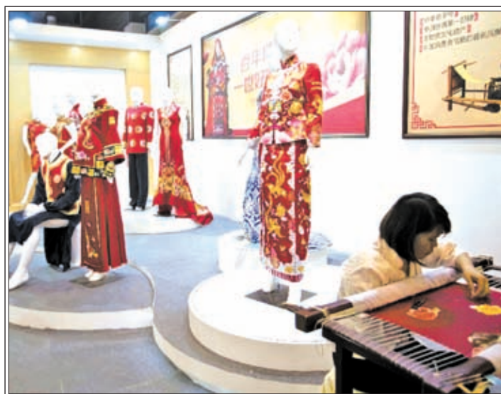
Wedding dresses designed by Chinese silk and fabric store Ruifuxiang are seen at the wedding expo in Beijing, capital of China, on 28 June, 2013. The three-day 2013 China (summer) wedding expo kicked off here on Friday. Some 3,000 exhibitors from over 30 countries and regions participated in the exposition.