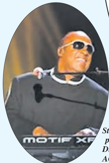
Stevie Wonder performs "Sir Duke" at the 48th ACM Awards in Las Vegas, on 7 April, 2013.

The actress wants to celebrate a year from freedom after her split with actor Tom Cruise.