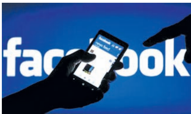
A smartphone user shows the Facebook application on his phone in the central Bosnian town of Zenica, in this photo illustration, on 2 May, 2013.

Facebook said on Friday that it would expand the scope of pages and groups on its website that should be ad-restricted and promised to remove ads from the flagged areas of the website by the end of the coming week.—Reuters