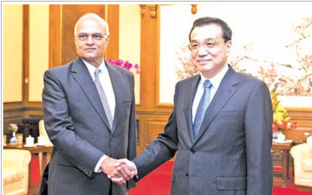
Chinese Premier Li Keqiang (R) meets with Indian National Security Adviser Shiv Shankar Menon in Beijing, capital of China, on 28 June, 2013. Shiv Shankar Menon is here attending the 16th round of China-India special representatives talks on border.