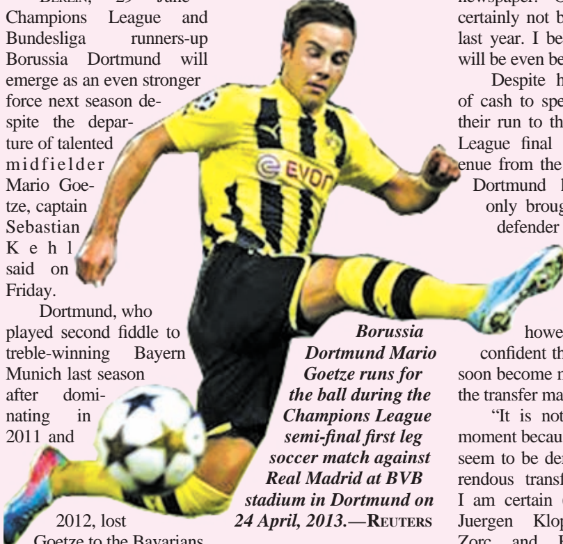
Borussia Dortmund Mario Goetze runs for the ball during the Champions League semi-final first leg soccer match against Real Madrid at BVB stadium in Dortmund on 24 April, 2013.

2012, lost Goetze to the Bavarians, who signed the Germany