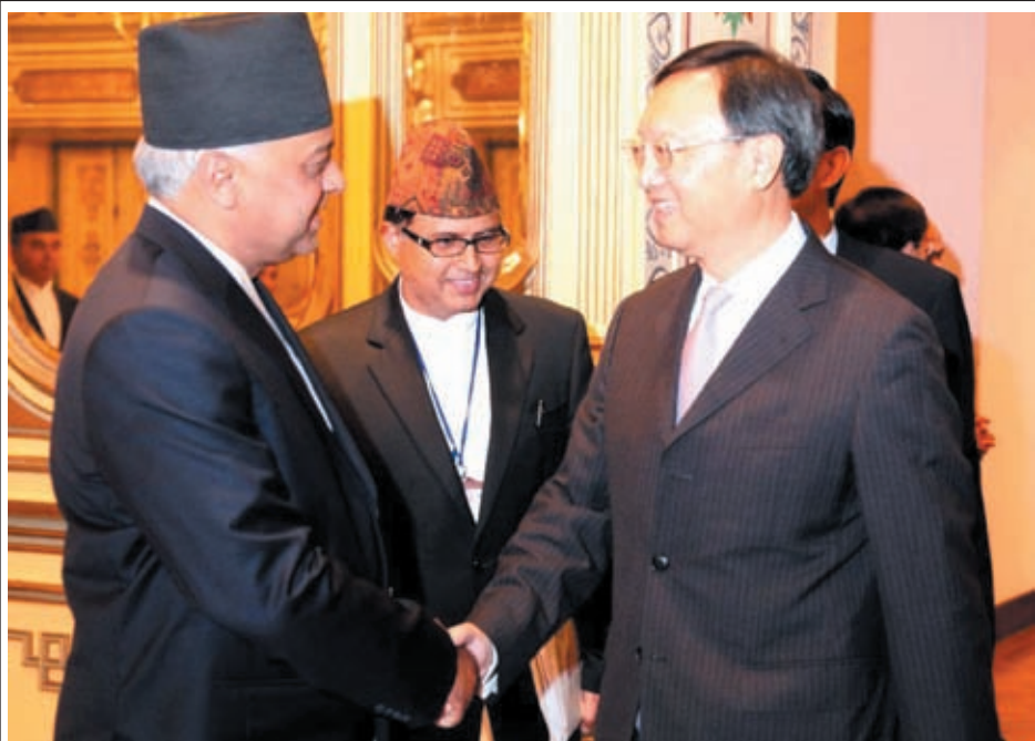
Chinese State Councilor Yang Jiechi (front, R) shakes hands with Nepali Foreign Minister Madhav Ghimire (front, L) during a meeting in Kathmandu, capital of Nepal, on 24 June, 2013.