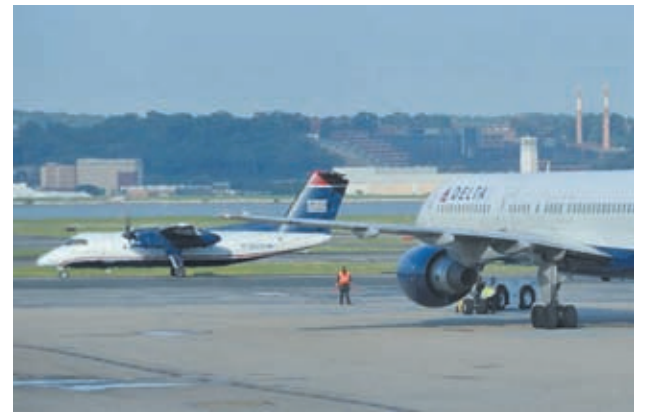
Ground service personnel direct a plane of Delta airlines to a runway at Ronald Reagan National Airport in Washington, capital of the United States, on 24 June, 2013.