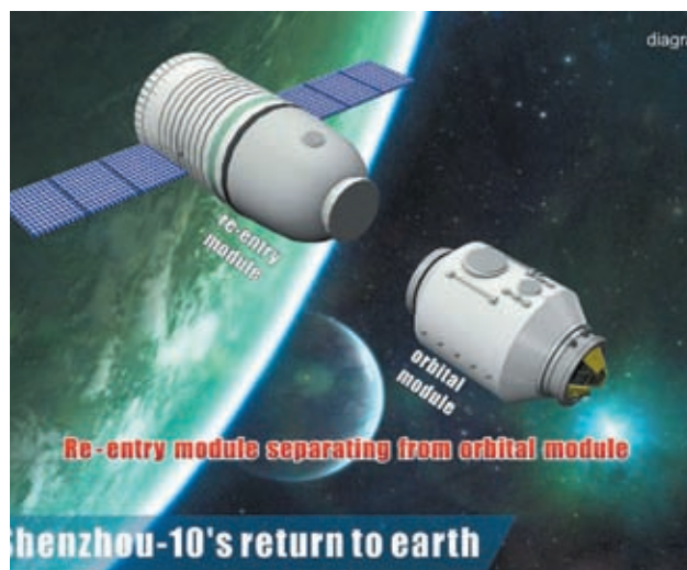
The graphics shows the procedure of Shenzhou-10 spacecraft's return to earth on 25 June, 2013.