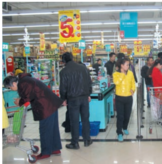
Customers at the checkout counters of Carrefour supermarket in Changfeng Street, Taiyuan, Shanxi Province, on Monday.