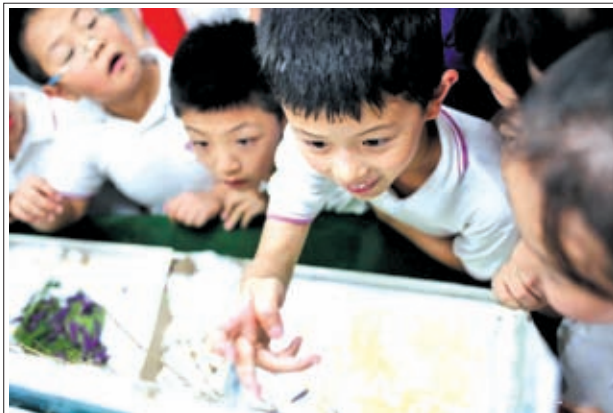
Students observe the silkworms in a lab of Huiwen No 1 primary school in Beijing, capital of China, on 24 June, 2013. The Huiwen No 1 primary school provided its students with the opportunity to cultivate and observe the life process of silkworms every semester.

SHIPPING AGENCY DEPARTMENT MYANMA PORT AUTHORITY AGENT FOR: M/S LAND & SEA LOGICTICS Phone No: 256908/378316/376797