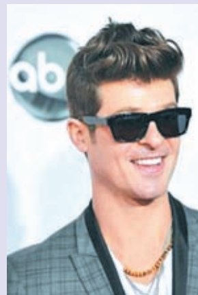
Singer Robin Thicke