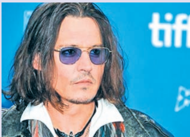
Hollywood superstar Johnny Depp

Depp worked closely with the community to make his role as Tonto in the controversial film as authentic as possible.