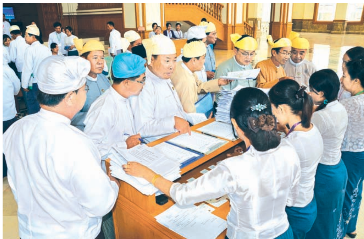
Hluttaw representatives sign attendance book at the seventh regular session of First Pyithu Hluttaw.

With respect to the question, Deputy Minister