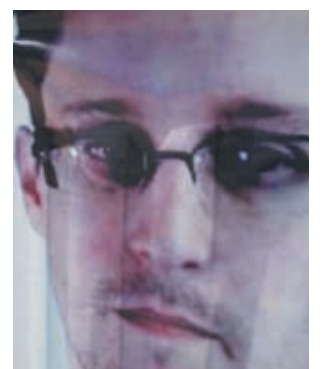
A banner supporting Edward Snowden, a former contractor at the National Security Agency (NSA), is displayed at Hong Kong's financial Central district on 21 June, 2013, the day marking Snowden's 30th birthday.