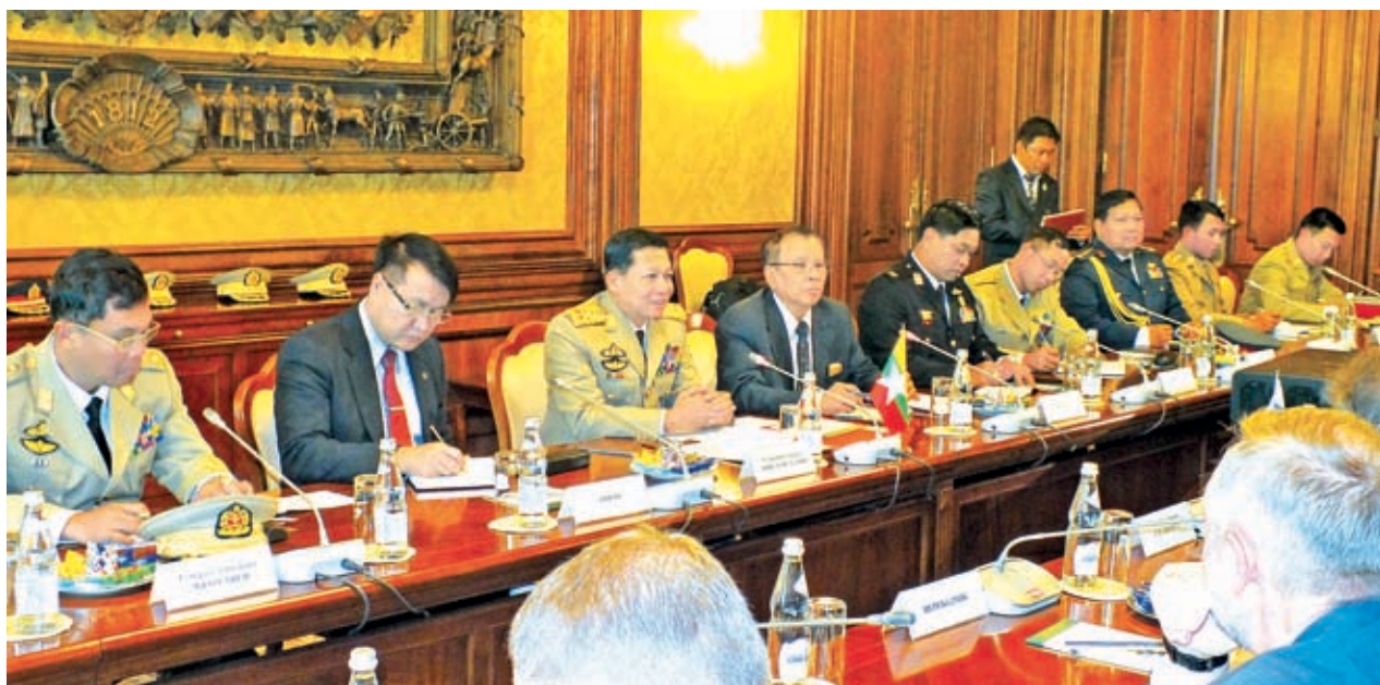
Commander-in-Chief of Defence Services Senior General Min Aung Hlaing holds talks with Russian Defence Minister General of the Army Sergey K Schoigu.

NAY PYI TAW, 25 June—Commander-in-Chief of Defence Services Senior General Min Aung Hlaing held talks with