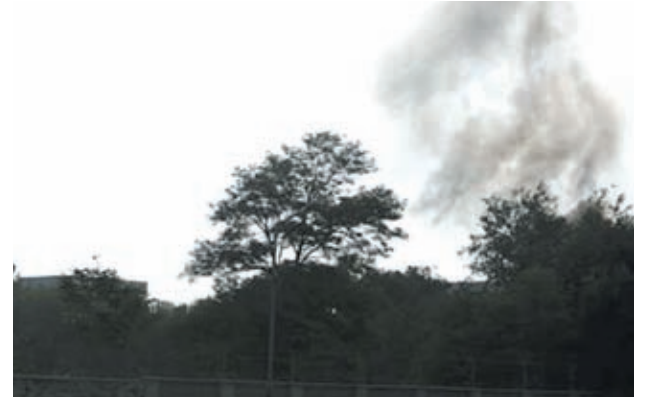
Smoke rises from the site of an attack in Kabul on 25 June, 2013.