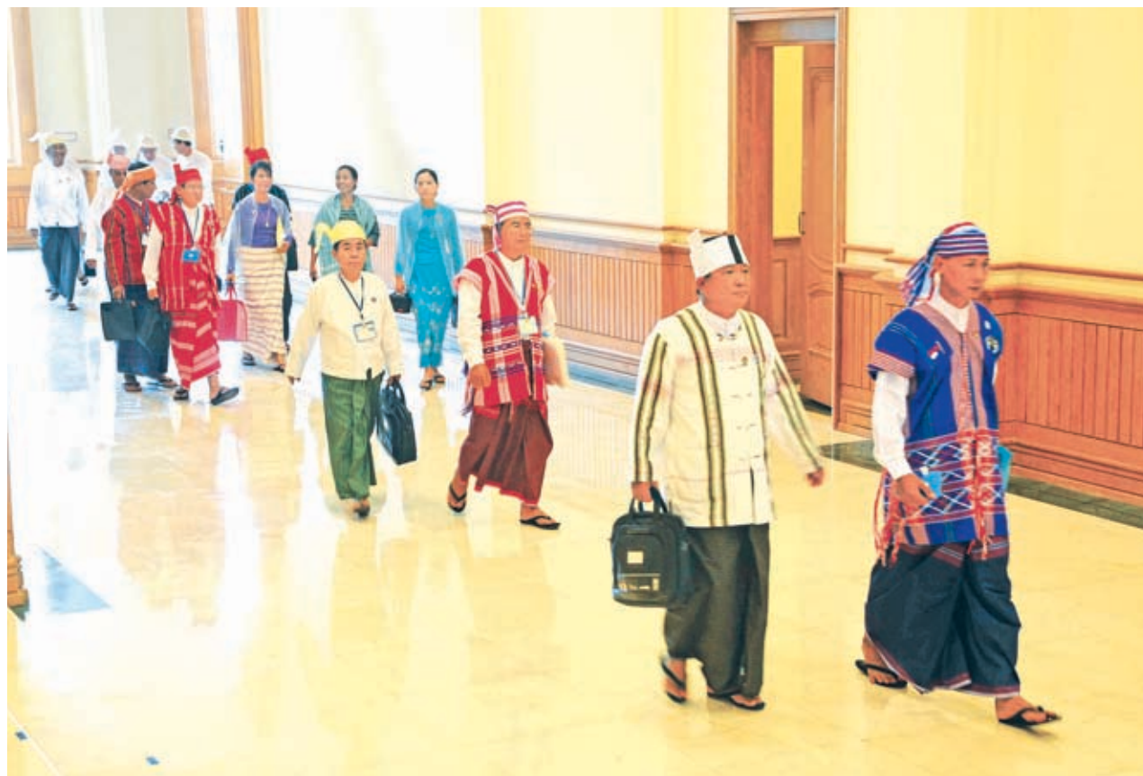
Hluttaw representatives seen at the first day seventh regular session of First Amyotha Hluttaw.

Speaker by nine Amyotha Hluttaw Defence Services