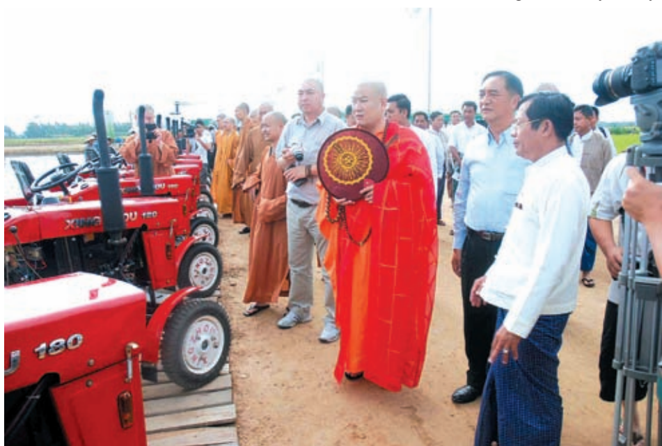
Venerable Shi Chang Zang of Beijing Buddha Tooth Relic Temple views farm equipment.—MNA

During Myanmar visit, the Buddha Tooth Relic Temple Sayadaw enjoyed three Buddha tooth relics and Golden Chamber consecration ceremony in Mandalay, Nay Pyi Taw and Yangon. He also donated religious edifices in Mandalay and renovation of ancient pagodas in Bagan. He then undertook the task of donating water in Ayeyawady Region.—MNA