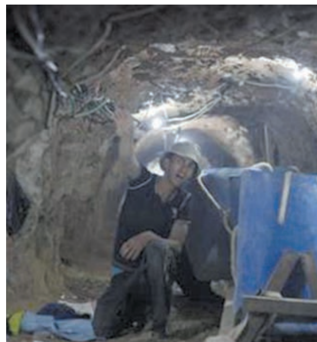
A Palestinian man calls on smugglers as he works inside a smuggling tunnel beneath the Gaza-Egypt border in Rafah in the southern Gaza Strip on 24 June, 2013.

Egypt’s military, struggling to fill a security vacuum in the Sinai since autocrat Hosni Mubarak was swept from power in