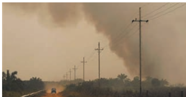
A car drives past fire from burning trees planted for palm oil, during haze at Bangko Pusako District in Rokan Hilir, on Indonesia's Riau Province, on 24 June, 2013.

SINGAPORE/JAKARTA, 25 June—Air quality in Singapore improved significantly to "moderate" pollution levels on Saturday, as Indonesian planes waterbombed raging forest fires and investigators scrambled to determine the cause of one of Southeast Asia's worst air pollution crises.