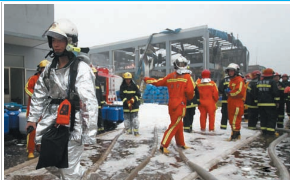
Fire fighters work to put out a fire caused by an explosion at a chemical plant in the Jinshan District of east China's Shanghai, on 24 June, 2013. Six people were injured in the accident at about 2:15 pm. The fire has been extinguished as of 3:30 pm.