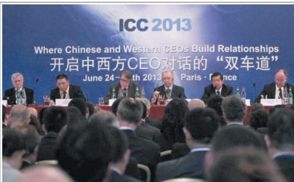
Delegates attend the 4th International Capital Conference in Paris, France, on 24 June, 2013. ICC 2013 was held here on 24 and 25 June with the theme of "Where Chinese and Western CEOs Build Relationships".