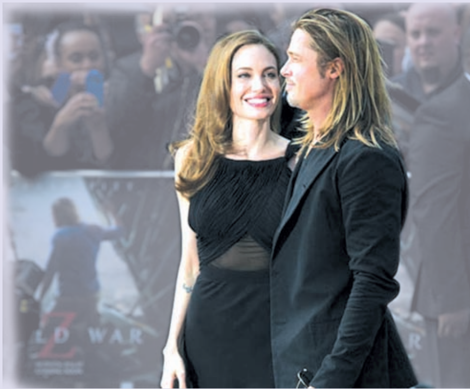
Actress Angelina Jolie and actor Brad Pitt

The watch, which is said to be worth $30,000, was given by Jolie, 38, along with their kids Maddox, eleven, Pax, nine, Zahara, eight, Shiloh, six, and four-year-old twins Knox and Vivienne, reports contactmusic.com. “The kids were excited