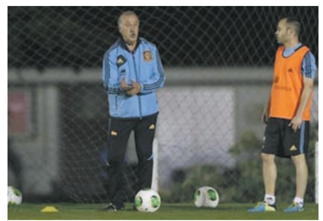
Spain's coach Vicente del Bosque talks with player Andres Iniesta (R) during a training session ahead of the Confederations Cup, in Recife on 14 June, 2013.

times sheer brilliance, than a year ago.