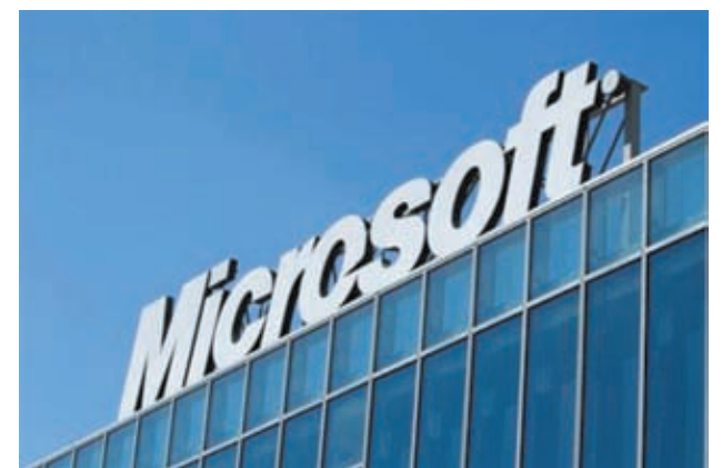
The Microsoft logo is seen at their offices in Bucharest on 20 March, 2013.