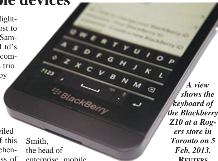
A view shows the keyboard of the BlackBerry Z10 at a Rogers store in Toronto on 5 Feb, 2013.

"With an integrated management console, our clients can now see all of the devices they have on their network, manage those devices and connect to them securely," David