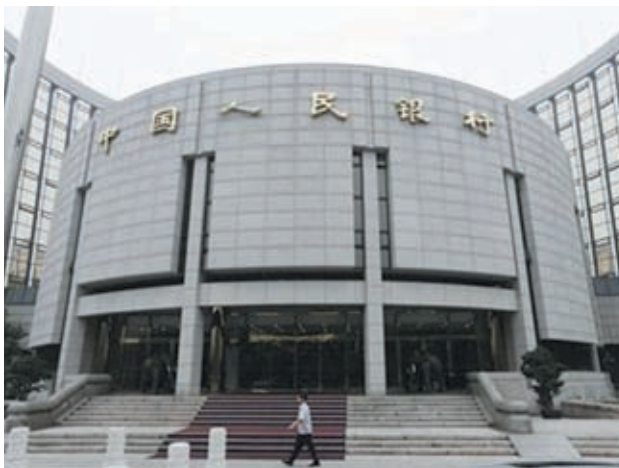
A staff member walks in front of the headquarters of the People's Bank of China (PBOC), the central bank, in Beijing, on 25 June, 2013.

SHANGHAI, 25 June—China's central bank said on Tuesday that it would guide market rates to reasonable levels, and it expected seasonal factors that caused a recent spike in interbank market rates would gradually fade.