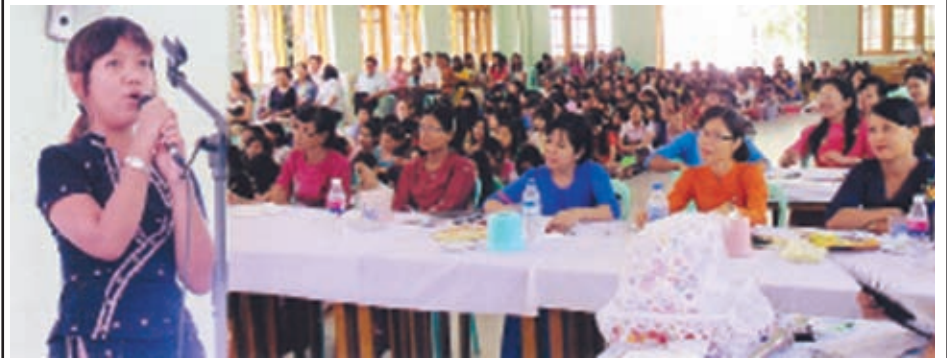
Mandalay University of Pharmacology organizes second extempore talks contest.

MANDALAY, 25 June—The second extempore talks contest was organized in University of Pharmacology (Mandalay) on 21 June afternoon at the hall of the university.