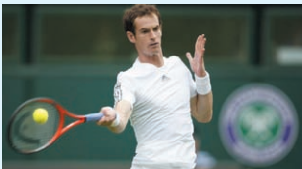
Andy Murray of Britain returns a shot during the first round of the men's singles against Benjamin Becker of Germany at the Wimbledon Lawn Tennis Championships in the All England Lawn Tennis and Croquet Club in London, Britain, on 24 June, 2013.