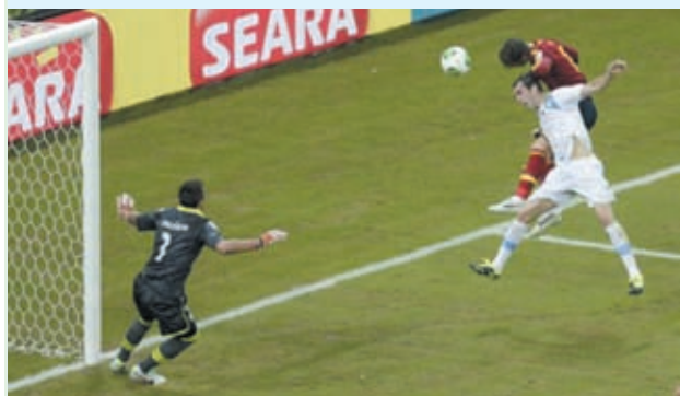
Spain's Sergio Ramos (R top) heads the ball next to Uruguay's Diego Godin (R bottom) during their Confederations Cup Group B soccer match at the Arena Pernambuco in Recife on 16 June, 2013.

Godin said his team's heralded strike force — which includes Luis Suarez, Edinson Cavani and Diego Forlan, could ill afford to waste goalscoring chances against Brazil's miserly defence. "We have to make the most of the chances that come our way," the 27-year-old said. "It's going to be special to play Brazil in such an important match, and even more so in front of their own fans. It will be like a final for us."—Xinhua