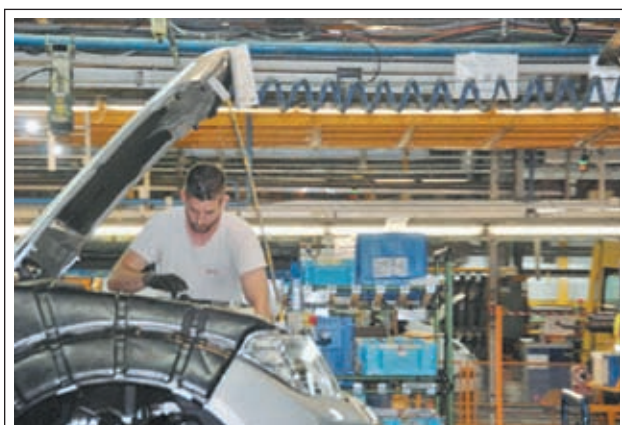
An employee works at an assembly plant operated by Nissan Motor Co in Barcelona, Spain, on 18 June, 2013.

of the level in the United States and Scandinavian countries. According to the white paper, the rate of male employees working more than 60 hours a week in 2012 stood at 18.2 percent for those in their 30s, 17.5 percent for those in their 40s and 12.9 percent for those in their 50s.