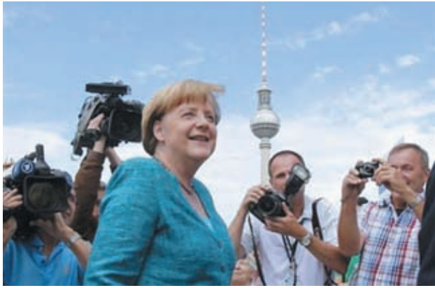
German Chancellor and leader of the Christian Democratic Union (CDU) Angela Merkel (C) arrives for a party meeting with the Christian Social Union (CSU) in Berlin on 23 June, 2013.

BERLIN, 25 June—German Chancellor Angela Merkel launched her re-election campaign on Monday with promises her coalition partners dismissed as unaffordable and even one party ally said would never see the light of day.