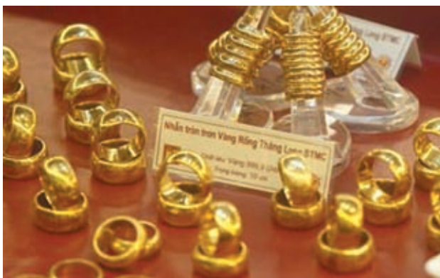
Gold rings are displayed for sale at a Bao Tin Minh Chau gold shop in Hanoi on 21 June, 2013.

* Fears of a credit crunch in China's banking system eased on Monday as short-term interest rates fell.