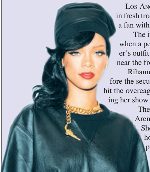
R&B singer Rihanna

LOS ANGELES, 25 June—R&B singer Rihanna is in fresh trouble, as she was caught on camera hitting a fan with a microphone during a concert.