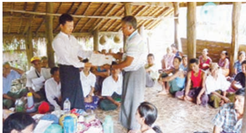
Farming rights certificates presentation ceremony for farmers in Nantkin village-tract in Indaw Township in progress.