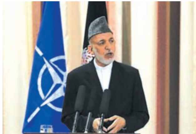
Afghan President Hamid Karzai speaks during a joint news conference with NATO Secretary General Anders Fogh Rasmussen following a security handover ceremony at a military academy outside Kabul on 18 June, 2013.

KABUL/WASHINGTON, 20 June—Revived Afghan peace talks hit their first roadblock on Wednesday, a day after they were announced, as Afghan