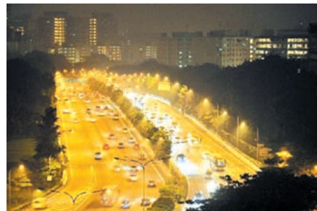
Vehicles are seen on the highway in Singapore, on 19 June, 2013.

The index has stayed above 100 most of the time since Monday, when the haze started to visibly affect the air quality and shroud the landmarks in the city state. The haze was largely