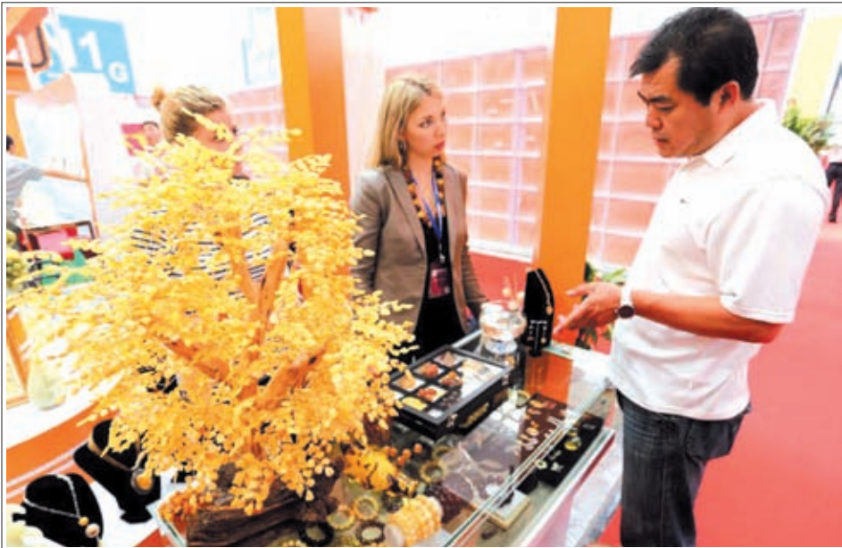
A man takes a look at the beeswax handicrafts during the 2 nd China (Tianjin) International Stone Blocks, Products & Equipment Exposition in Tianjin, north China, on 18 June, 2013. The exposition, opened here on Tuesday, has attracted more than 800 related enterprises both at home and abroad.