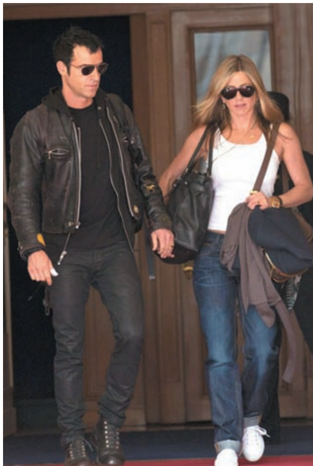
Jennifer Aniston and Justin Theroux