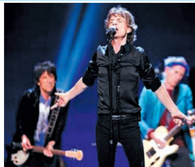
Mick Jagger (2nd L) performs with Ronnie Wood (rear L-R), Keith Richards and Charlie Watts of the Rolling Stones at a concert during the band's "50 and Counting" tour in Chicago May 28, 2013.

SHIPPING AGENCY DEPARTMENT MYANMA PORT AUTHORITY AGENT FOR: M/S HANJIN SHIPPING LINE Phone No: 256908/378316/376797