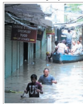
People ride boat to higher ground after floodwaters inundated homes along the banks of the Yamuna River in New Delhi, India, on 19 June, 2013. The Indian capital has been put on flood alert after its main Yamuna river breached the danger mark following incessant rainfall since on 16 June.