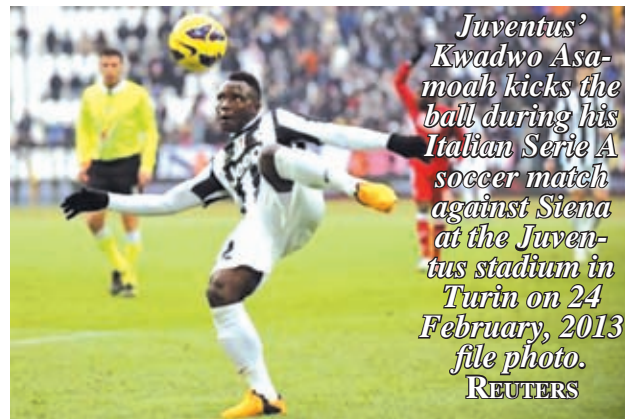
Juventus' Kwadwo Asamoah kicks the ball during his Italian Serie A soccer match against Siena at the Juventus stadium in Turin on 24 February, 2013 file photo.

ROME, 20 June—Juventus have bought Ghana international Kwadwo Asamoah outright on a four-year deal after ending their co-ownership deal with Udinese for the midfielder, the Serie A club said on Wednesday.