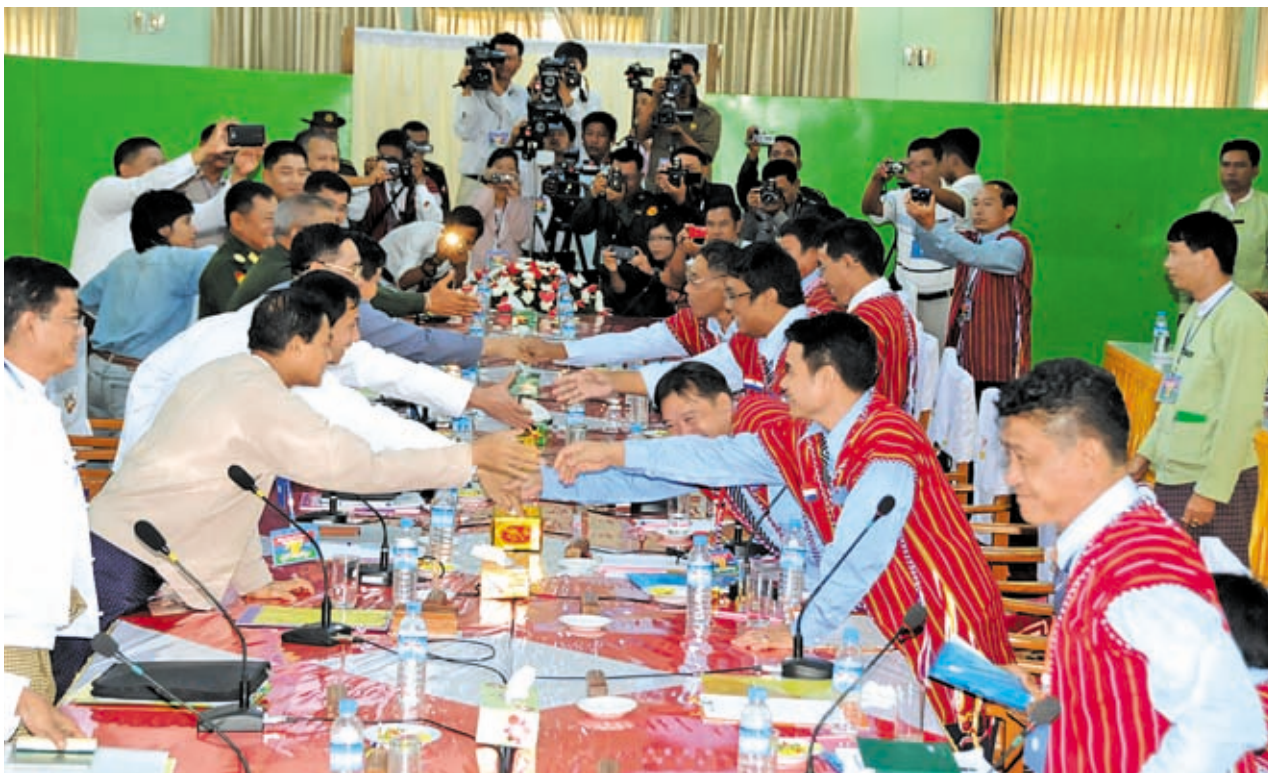
Second round of Union-Level Peace Talks between a delegation led by Union Minister U Aung Min and Karenni National Progressive Party (KNPP) at Loikaw local station in Kayah State in progress. —MNA

Lt-Gen Aung Than Htut Kayah State Chief Minister U Khin Maung Oo (a) U Commander-in-Chief (Army), Bu Yal, the Eastern Com- mand Commander, the Myanmar Peace Center and Deputy Attorney-General, responsible persons from officials from KNPP. MNA