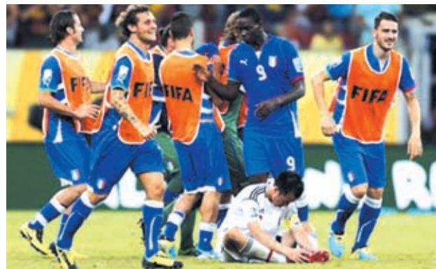
Italy's Mario Balotelli (9) celebrates with teammates as Japan's Shinji Okazaki reacts after their Confederations Cup Group A soccer match at the Arena Pernambuco in Recife on 19 June, 2013.

Coach Alberto Zaccheroni worried his side might be overawed by the four-times world champions but they began confidently and had their first goal in the 21st minute when Keisuke Honda slotted home a penalty kick after Buffon was adjudged to have brought down Okazaki.