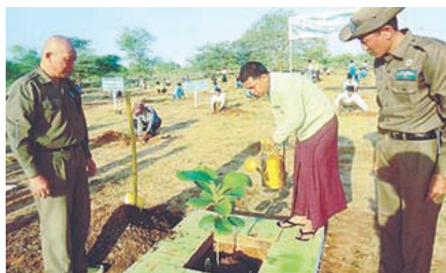
Monsoon tree planting ceremony organized by Ayadaw Township Management Committee in Monywa by Myinmu-Ayadaw-Naunggyiaing road.

AYADAW, 20 June—Under the arrangement of Ayadaw Township Management Committee of Monywa District, the monsoon tree planting ceremony was held near Langwa Thidinton Lake in Htangyi Village at mile post 25/5 on Myinmu-Ayadaw-Naunggyiaing Road in Ayadaw Township on 15 June.