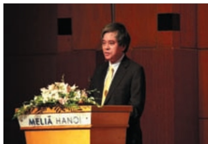
Pham Quang Vinh, Vietnamese Deputy Minister of Foreign Affairs, speaks during a workshop in Hanoi, Vietnam, on 19 June, 2013.