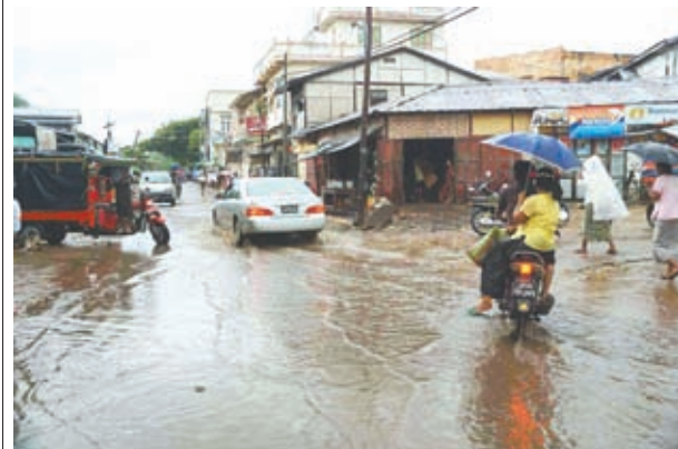
Meiktila market circular road inundated after heavy rains.

MEIKTILA, 20 June—Heavy rains inundated road circling the market in Meiktila, causing difficulties for residents and shopkeepers.