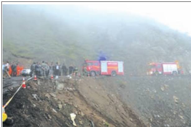
Rescuers work at the accident site in Changji City, northwest China’s Xinjiang Uygur Autonomous Region on 18 June 2013. The death toll has risen to 15 in an accident in which a tourist bus fell into a valley on Tuesday in Changji, according to the local government. Four people died at the scene, while another 11 people died after hospital treatments failed. The other 21 passengers sustained injuries and are still being treated. Heavy fog that reduced visibility has been blamed for the accident.