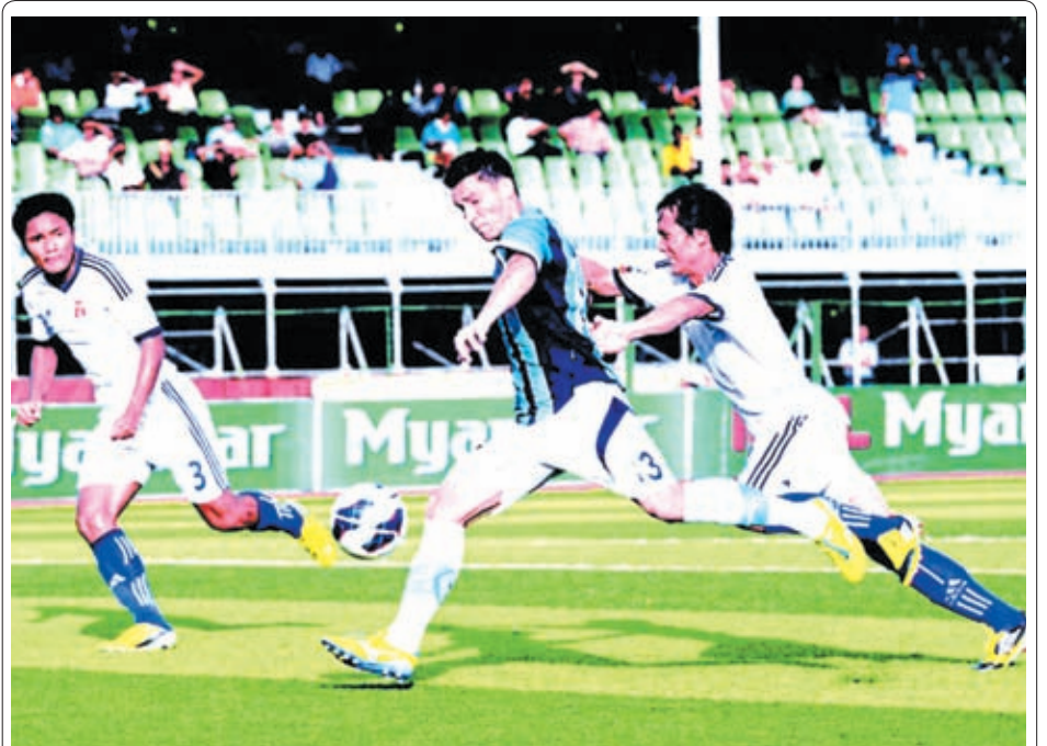
Photo shows a Yangon FC striker trying to get a score after passing through a defender of Ayeyawady United FC in the match between the two teams on 19 June evening. The match ended 2-1, allowing defending champion Yangon United FC to lead the table.

Milk makes you smarter, healthier and more intelligent