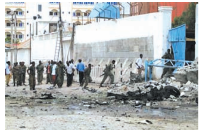
Somali government soldiers arrive to secure the United Nations compound following a suicide bomb attack in the capital Mogadishu, on 19 June 2013.

UN Secretary-General Ban Ki-moon said he was "outraged by the despicable attack" in a telephone call to Somali President Hassan Sheikh Mohamud. Al Shabaab accused the United Nations of serving US interests.—Reuters