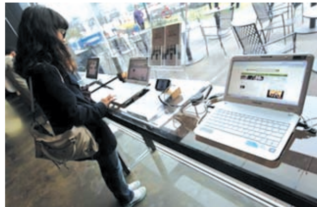
A woman surfs the Internet on a computer for visitors at a registration desk at South Korean mobile carrier KT’s headquarters in Seoul on 2 Dec, 2011.