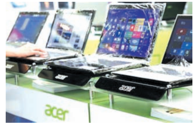
Acer laptops are displayed in a computer mall in Taipei on 19 March, 2013.

of fewer than 300 people being targeted is part of a push by officials to allay privacy concerns following recent disclosures of National Security Agency surveillance programmes that collect massive amounts of data in an effort to thwart terrorist attacks, The Washington Post reported. The “metadata” collected includes phone numbers dialed and length of call but not call content, caller identity or location