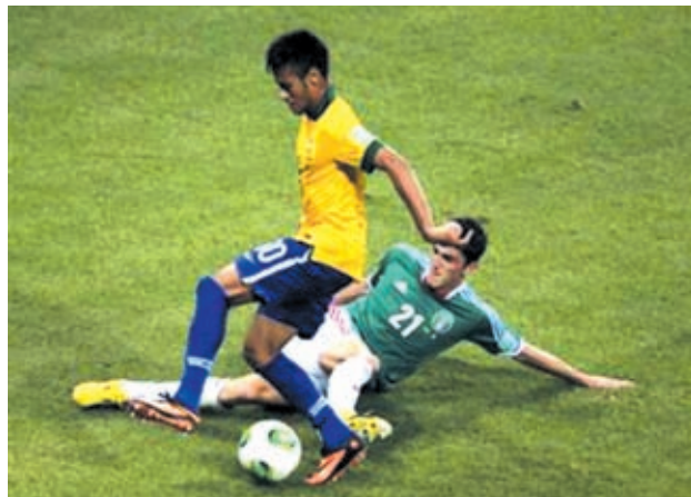
Brazil's Neymar fights for the ball with Mexico's Hiram Mier (R) during their Confederations Cup Group A match at the Estadio Castelao in Fortaleza on 19 June, 2013.