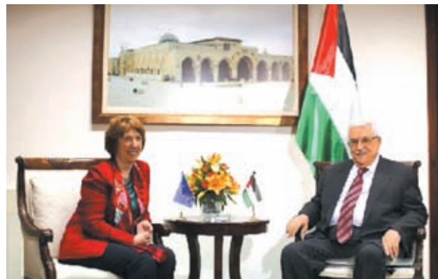
The EU's High Representative for Foreign Policy Catherine Ashton (L) meets with Palestinian President Mahmoud Abbas at his office in the West Bank city of Ramallah on 19 June, 2013.

According to the statement, Ashton also asserted that the EU is backing the US efforts, adding that the EU stance is clear in its issued statements concerning its support to the peace process and to the two-state solution.—Xinhua