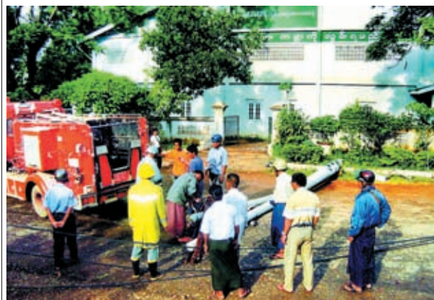
Authorities clearing debris after stormy wind in Kyaukme that fell trees and damaged buildings.

KYAUKME, 20 June—Stormy wind that accompanied heavy rain in northern Shan State town Kyaukme brought down trees and lamp-posts and ripped off roofs of some buildings including a primary school on 18 June afternoon.