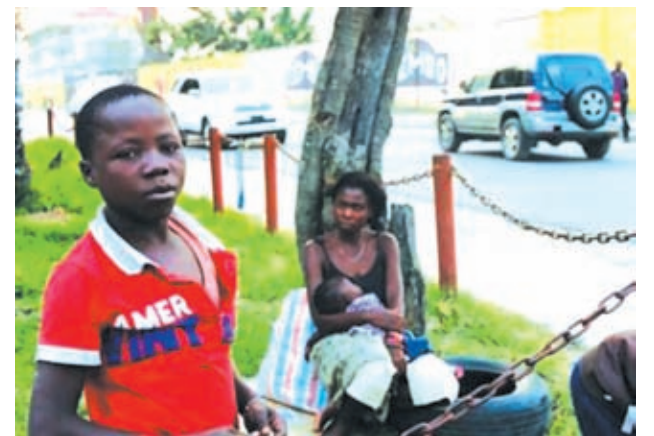
A homeless child stands along a street in the Democratic Republic of Congo (DRC) in capital Kinshasa on 16 June 2013.