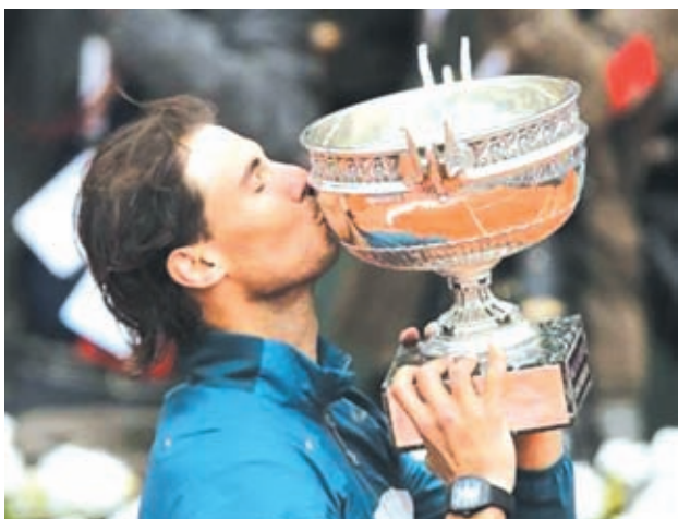
Rafael Nadal of Spain kisses the trophy after defeating compatriot David Ferrer in their men's singles final match to win the French Open tennis tournament at the Roland Garros stadium in Paris on 9 June, 2013.