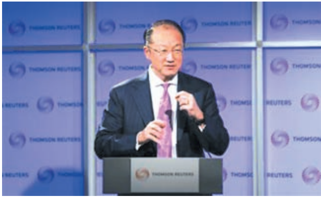
World Bank President Jim Yong Kim speaks at a Thomson Reuters Newsmaker event, at Canary Wharf in east London on 19 June 2013.

LONDON, 20 June — The world should stop arguing about whether humans are causing climate change and start taking action to stop dangerous temperature rises, the president of the World Bank said on Wednesday.