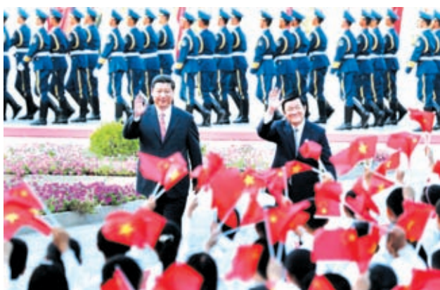
Chinese President Xi Jinping (L) and Vietnamese President Truong Tan Sang wave during a welcoming ceremony in Beijing, capital of China, on 19 June, 2013.

Xi emphasized that China is striving for the goals and tasks set by the 18th National Congress of the Communist Party of