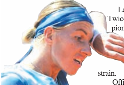
Svetlana Kuznetsova of Russia wipes her face during their women's singles quarter-final match against Serena Williams of the US at the French Open tennis tournament at the Roland Garros stadium in Paris on 4 June, 2013.

LONDON, 20 June—Twice grand slam champion Svetlana Kuznetsova pulled out of Wimbledon on Wednesday with an abdominal strain.