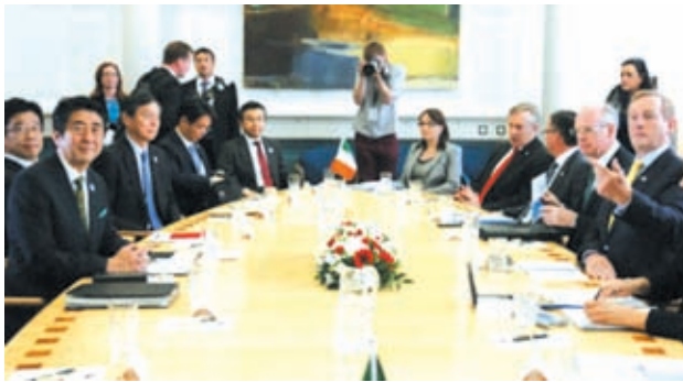
Japanese Prime Minister Shinzo Abe (far L) and Irish Prime Minister Enda Kenny (far R) are seen before their talks in Dublin on 19 June, 2013, during the first visit to Ireland by a sitting Japanese premier.

"Asia and Europe are closely linked and we share responsibility for and benefits of the world's peace and stability," Abe said at a joint Press conference after his meeting with Kenny. "We will strengthen cooperation and policy dialogue with the European