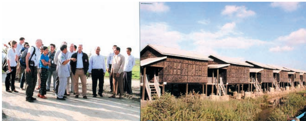
British Minister of State for International Development Right Honourable Alan Duncan MP and party view shelters for victims in Sittway.

NAY PYI TAW, 20 June—The visiting British Minister of State for International Development Right Honourable Alan Duncan MP and party, accompanied by Secretary of Rakhine State Peace and Development Implementation Central Committee Deputy Minister for Border Affairs Maj-Gen Zaw Win and officials concerned, arrived at Sittway Airport via Yangon on 18 June evening, to