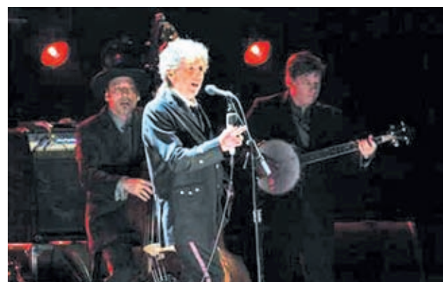
Bob Dylan performs during a segment honouring Director Martin Scorsese, recipient of the Music + Film Award, at the 17th Annual Critics' Choice Movie Awards in Los Angeles.

The announcement follows the September release of Dylan's latest studio album, "The Tempest", described by Rolling Stone magazine as "one of his weirdest albums ever". Dylan was made an honorary member of the American Academy of Arts and Letters in May this year and awarded the top US civilian honour last year, the Presidential Medal of Freedom.