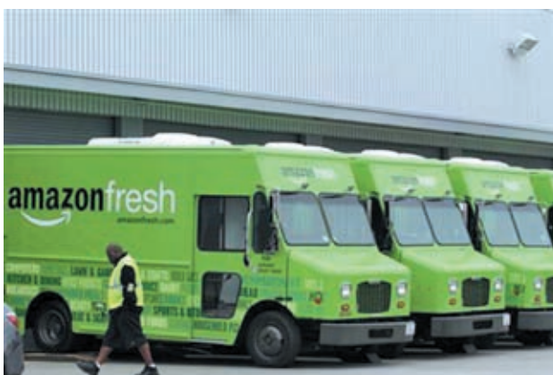
An Amazon Fresh delivery van moves down Pico Boulevard in Los Angeles, California, on 14 June, 2013.

SAN FRANCISCO, 17 June—The online grocery start-up Webvan may have been the single most expensive flame-out of the dot-com era, blowing through more than $800 million in venture capital and IPO proceeds in just over three years before shutting its doors in 2001. Twelve years later, though, Webvan is rising from the dead—in the form of an online grocery business called AmazonFresh.