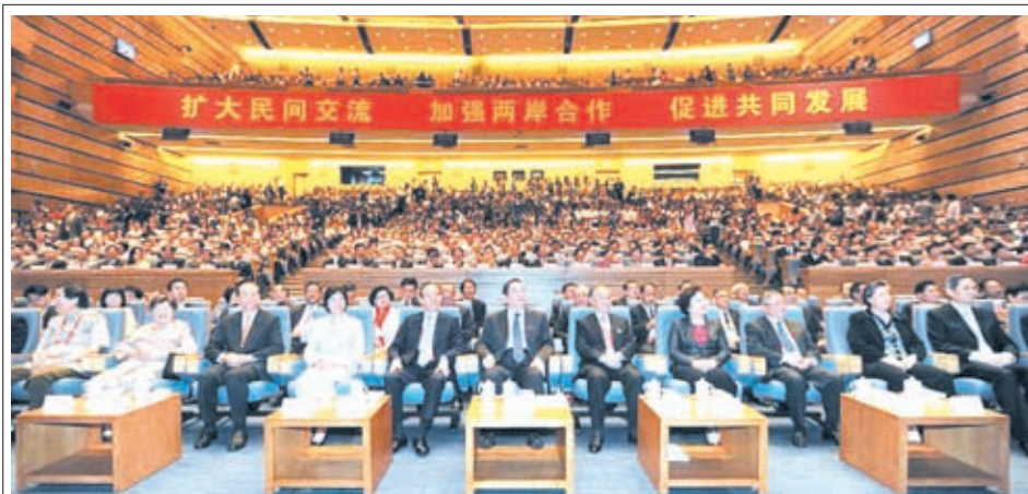
Yu Zhengsheng (C, front), member of the Standing Committee of the Political Bureau of the Communist Party of China (CPC) Central Committee and chairman of the National Committee of the Chinese People's Political Consultative Conference, attends the conference of the 5th Straits Forum in Xiamen of southeast China's Fujian Province, on 16 June, 2013.