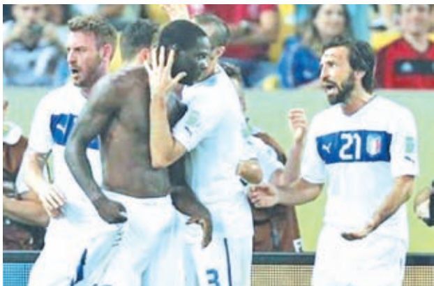
Italy's Mario Balotelli (2nd L) celebrates with his teammates after scoring a goal during their Confederations Cup Group A soccer match against Mexico at the Estadio Maracana in Rio de Janeiro on 16 June, 2013.