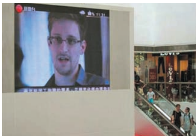
Edward Snowden, a former contractor at the National Security Agency (NSA), is seen during news broadcast on a screen at a shopping mall in Hong Kong on 16 June, 2013.