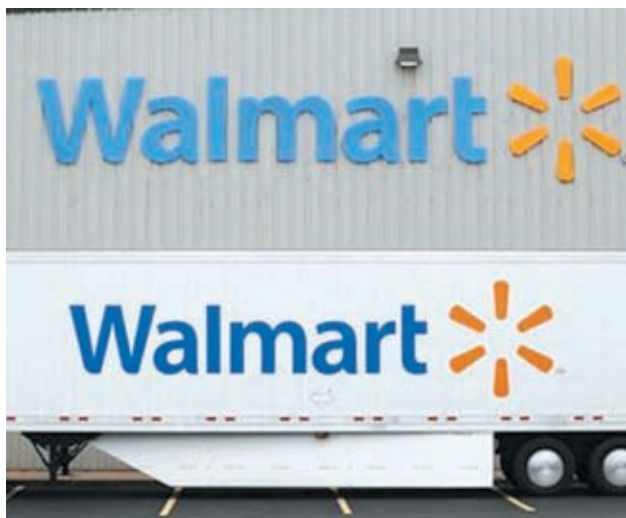
A Wal-Mart Stores Inc company distribution centre in Bentonville, Arkansas on 6 June, 2013.