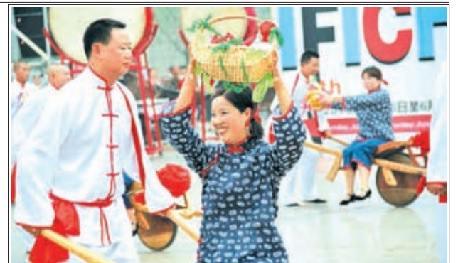
Local performers perform a folklore show at a parallel activity site of the 4th China Chengdu International Festival of Intangible Cultural Heritage in Pengzhou City, southwest China's Sichuan Province, on 16 June, 2013. The nine-day festival kicked off on Friday in Chengdu.—XINHUA

SHIPPING AGENCY DEPARTMENT MYANMA PORT AUTHORITY AGENT FOR: M/S T.S LINES Phone No: 256908/378316/376797