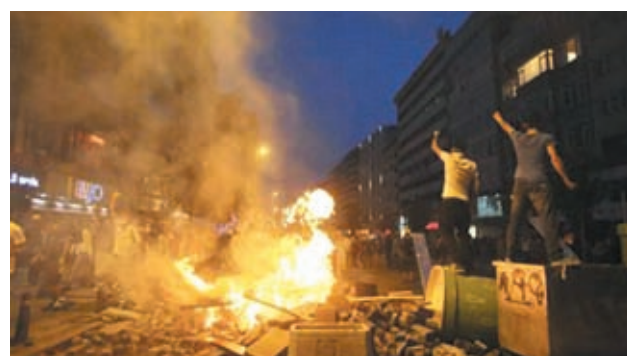
Anti-government protesters shout slogans as they stand on barricades in Istanbul on 16 June, 2013.

According to the report, Blackhawk utility