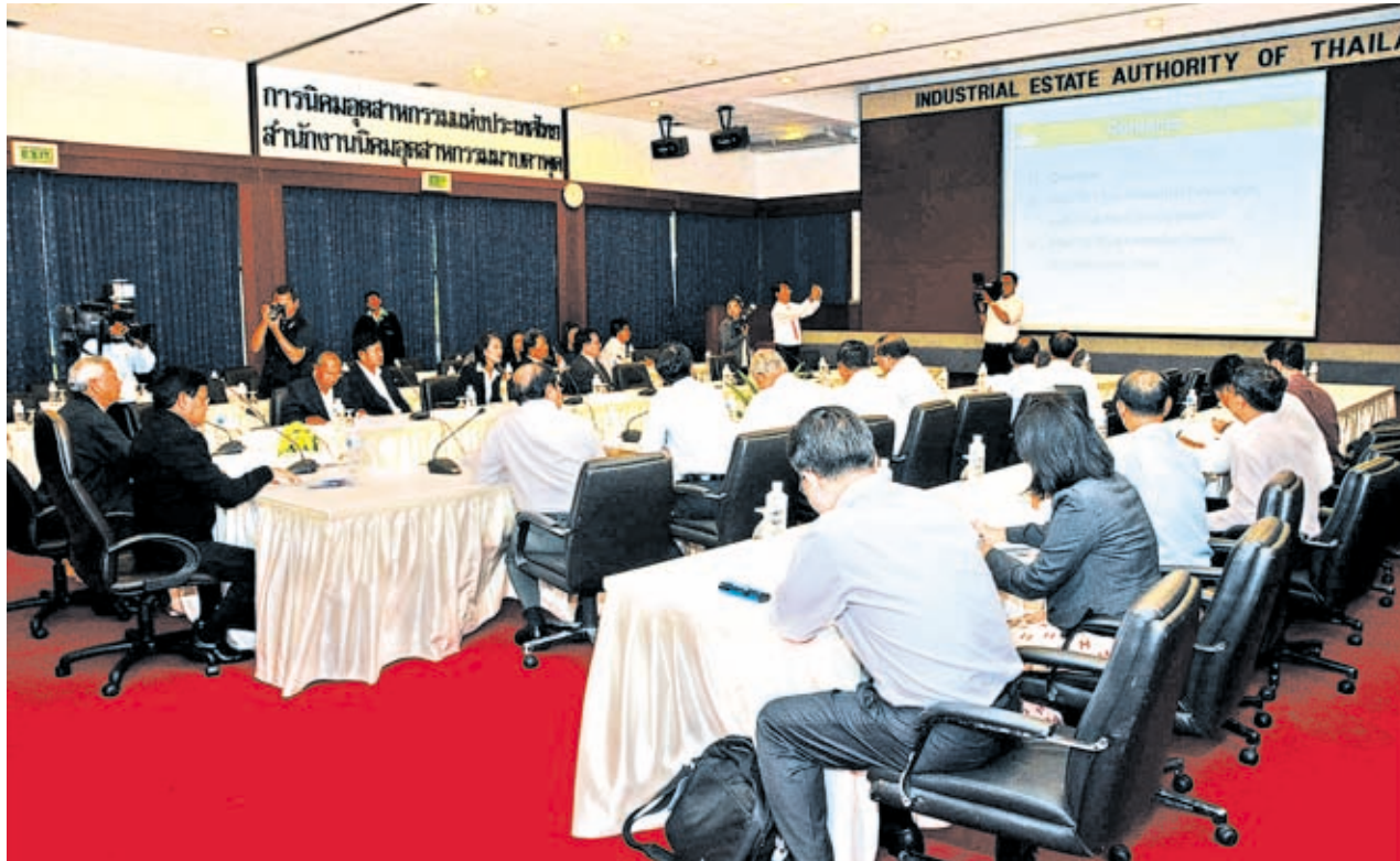
Vice-President U Nyan Tun attends the meeting at Map Ta Phut industrial estate in Rayong Province of Thailand.