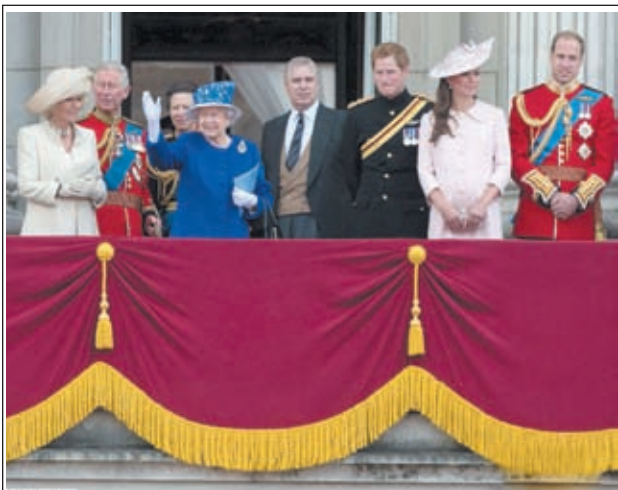
The royal parade known as "Trooping the Colour" was held on 15 June, 2013, in London to celebrate the official birthday of Queen Elizabeth II.

There is no available information about the suspect who is still at large. Police are questioning witnesses and conducting an investigation. This is the second nightclub shooting in Houston in as many days. Four people were shot, including one fatally, at a club in southwest Houston on Saturday.—Xinhua