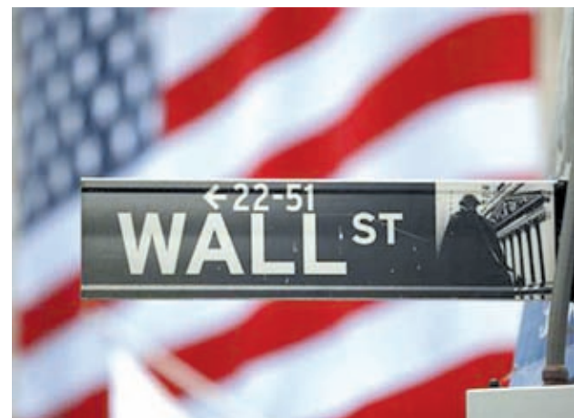
The Wall Street sign is seen outside the New York Stock Exchange, on 26 March, 2009.