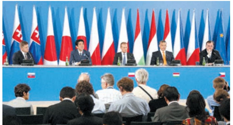
The prime ministers of five countries — (from L) Robert Fico of Slovakia, Shinzo Abe of Japan, Donald Tusk of Poland, Viktor Orban of Hungary and Petr Necas of the Czech Republic — issue a joint statement in Warsaw, Poland, on 16 June, 2013.

Polish Prime Minister Donald Tusk said at the Press conference that Japan is expected to become a very important partner as a country that possesses nuclear power generation and renewable energy technology.—Kyodo News