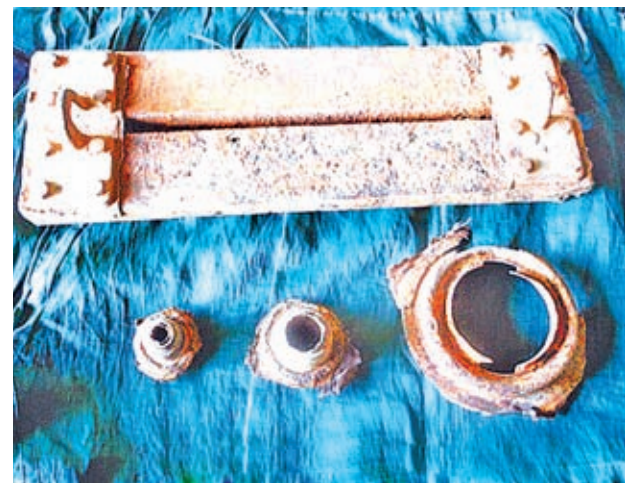
Photo shows some rusty pieces found in a wrecked aircraft.