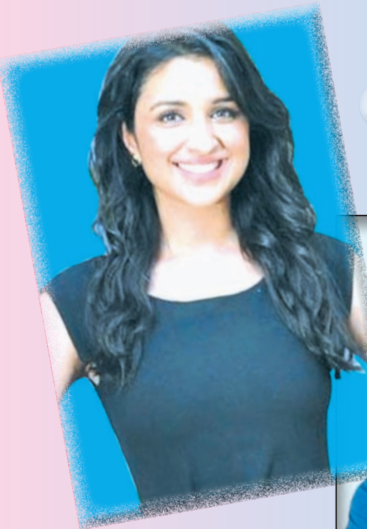
The movie is written by Jaideep Sahni and produced by Aditya Chopra.

The movie, releasing 13 Sept, is written by Jaideep Sahni, and produced by Aditya Chopra. Its music is by Sachin-Jigar, with lyrics by Sahni.—PTI