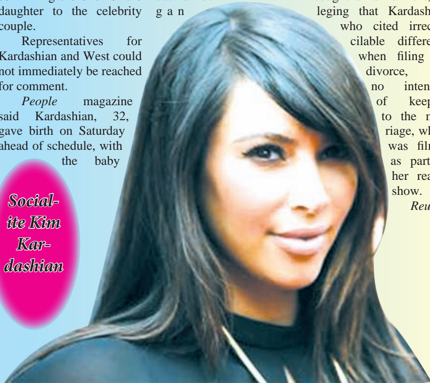
Socialite Kim Kardashian