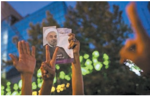
Supporters of moderate cleric Hassan Rohani hold a picture of him as they celebrate his victory in Iran's presidential election on a pedestrian bridge in Teheran on 15 June, 2013.

US President Barack Obama's chief of staff Denis McDonough said: "If he (Rohani) is interested in, as