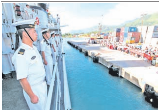
Local residents welcome the missile destroyer "Harbin" of the 14th Escort Taskforce of the Chinese Navy on Victoria Harbour, Seychelles, on 16 June, 2013. 65 soldiers of the 14th Escort Taskforce of the Chinese Navy will participate in the National Day Parade of Seychelles on 18 June.