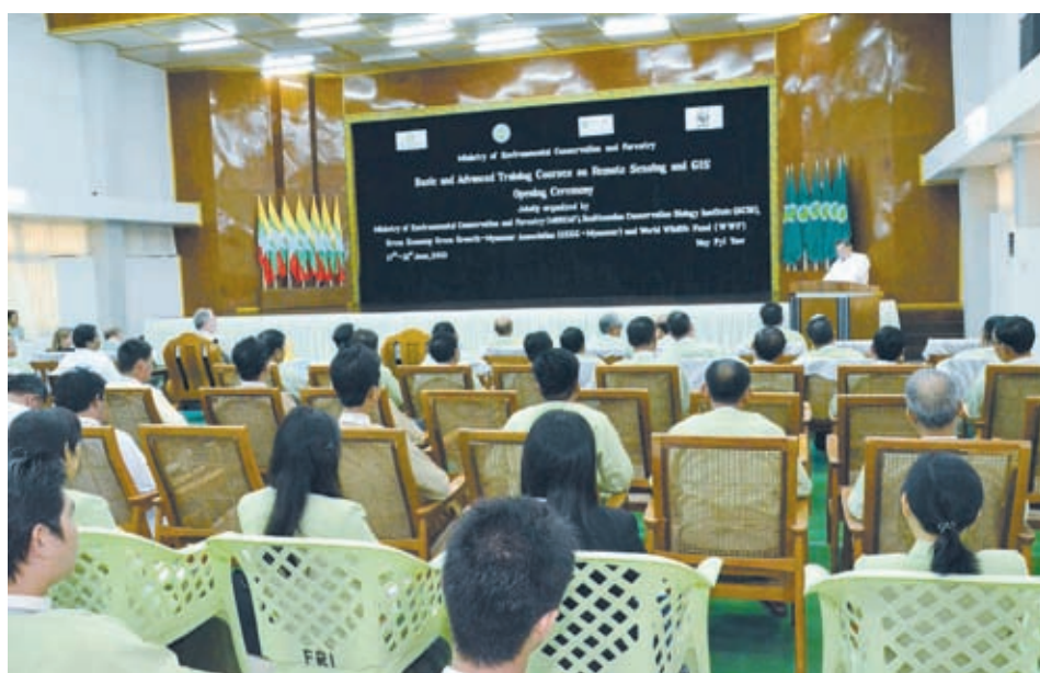
The opening ceremony of basic and advanced courses on Remote Sensing and Geographic Information System (GIS) in progress.

and NGOs are taking a five-day course that will cover reading satellite imageries related to Remote Sensing technology, data analysis of satellite imageries through GIS technology and monitoring and conservation methodologies.