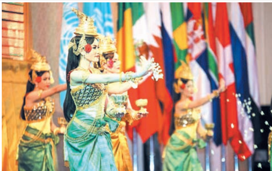
Cambodian artists perform at the opening ceremony of the 37th session of the World Heritage Committee at the Peace Palace in Phnom Penh, capital of Cambodia, on 16 June, 2013. The 37th session of the World Heritage Committee kicked off at the Peace Palace in Cambodian capital Phnom Penh on Sunday evening aiming to consider the inscription of new sites onto the UNESCO's World Heritage list.