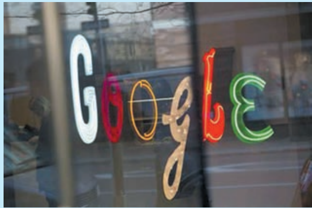
The Google signage is seen at the company's headquarters in New York on 8 Jan, 2013.

Those vehicles are beginning to gain support from lawmakers in places like California, where a bill legalizing their operation on state roads was signed into law last by Governor Jerry Brown.