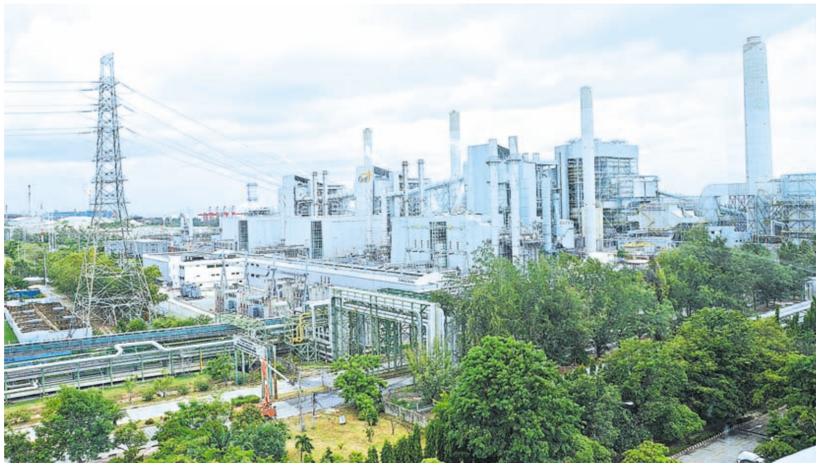
Photo shows Map Ta Phut industrial estate in Rayong Province of Thailand.