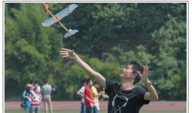
A student sets off a model aeroplane in southwest China's Chongqing Municipality, on 16 June, 2013. A competition for aeroplane model making was held here on 16 June, attracting some 100 students from six nearby universities and colleges.

However, the Yemen-based al-Qaeda wing, the most active terrorist network in the Middle East, is still holding a Saudi diplomat.