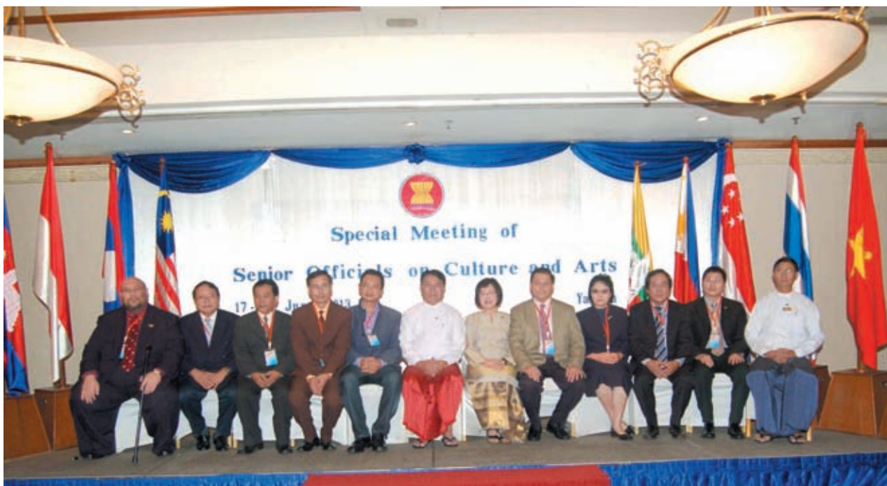
Union Minister U Aye Myint Kyu and delegates from ASEAN countries pose for documentary photo at the Special Meeting of ASEAN Senior Officials on Culture and Arts.

YANGON, 17 June—Special Meeting of ASEAN Senior Officials on Culture and Arts kicked off here today with an opening address by Union Minister for Culture U Aye Myint Kyu.