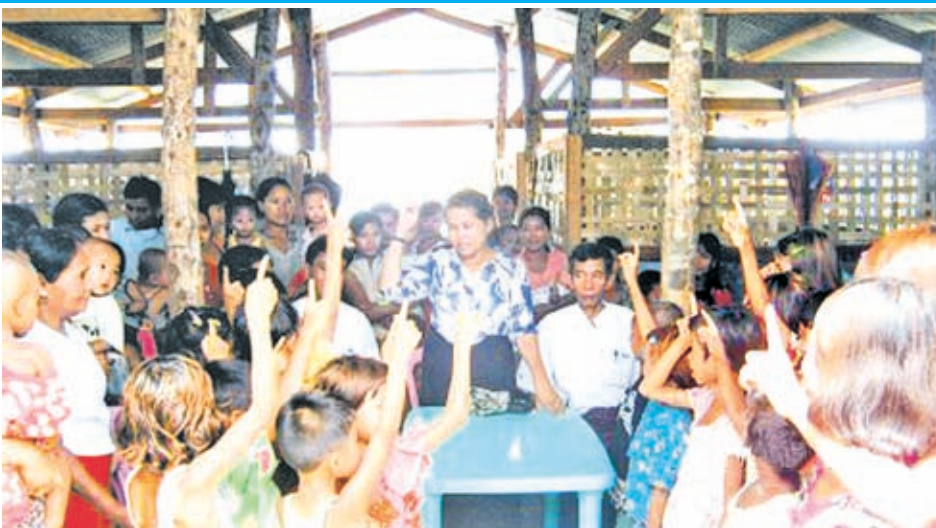
A team of healthcare and education authorities visit relief camps in Sittway Township in Rakhine State.