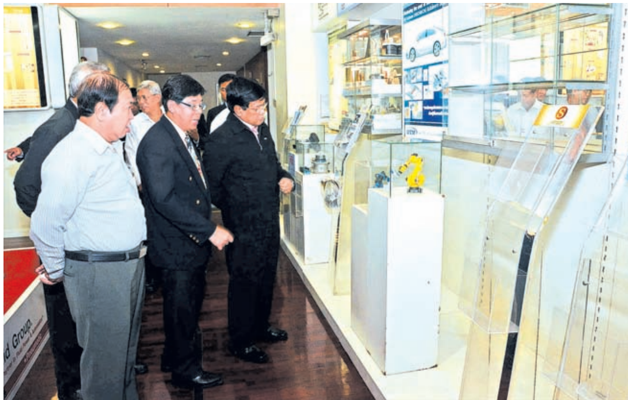
Vice-President U Nyan Tun and party visit Thai-German Institute.