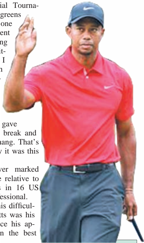
Tiger Woods of the US reacts after putting on the first green during the final round of the 2013 US Open golf championship at the Merion Golf Club in Ardmore, Pennsylvania, on 16 June, 2013.

"I was trying to hit the ball in certain spots, give myself uphill looks