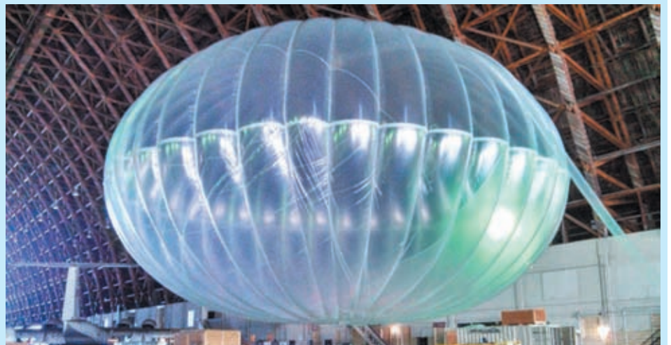
Google is experimenting with balloons that beam the Internet from the sky.