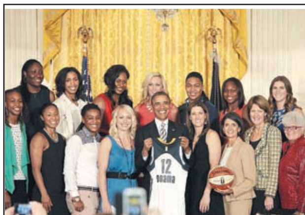
US President Barack Obama (below C) poses for group photos with Indiana Fever players during the welcome ceremony of WNBA champion Indiana Fever at the White House in Washington DC on 14 June 2013.