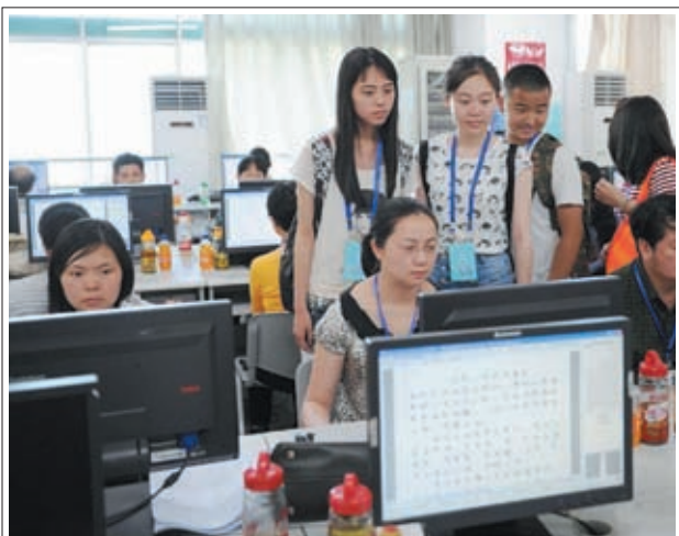
Examinees view the college entrance exam paper marking work at a paper marking room in Guizhou Normal University in Guiyang, capital of southwest China’s Guizhou Province, on 14 June, 2013. The paper marking work in Guizhou opens to several examinees and their parents on Friday.