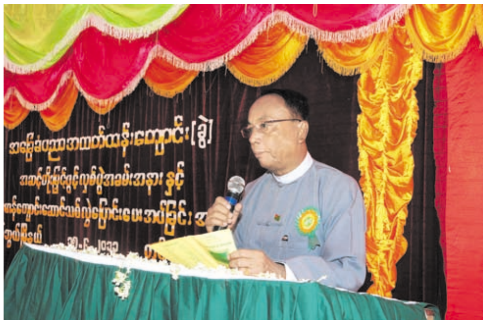
Speaker of Pyidaungsu Hluttaw and Amyotha Hluttaw U Khin Aung Myint makes a speech at the opening of two upgraded schools in Pyawbwe Township.

At a ceremony to mark the upgrading the Basic Education Middle School to the high school and handing