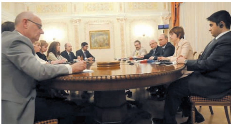
Russian President Vladimir Putin (3rd R) meets with representatives of the G20 Civil Summit in the Novo-Ogaryovo resi- dence in Moscow, Russia, on 14 June, 2013.

Now, it is a good time for new Myanmar generations to enjoy all nice things of the past and to participate in regional games and sports. The writer wishes them all the best.