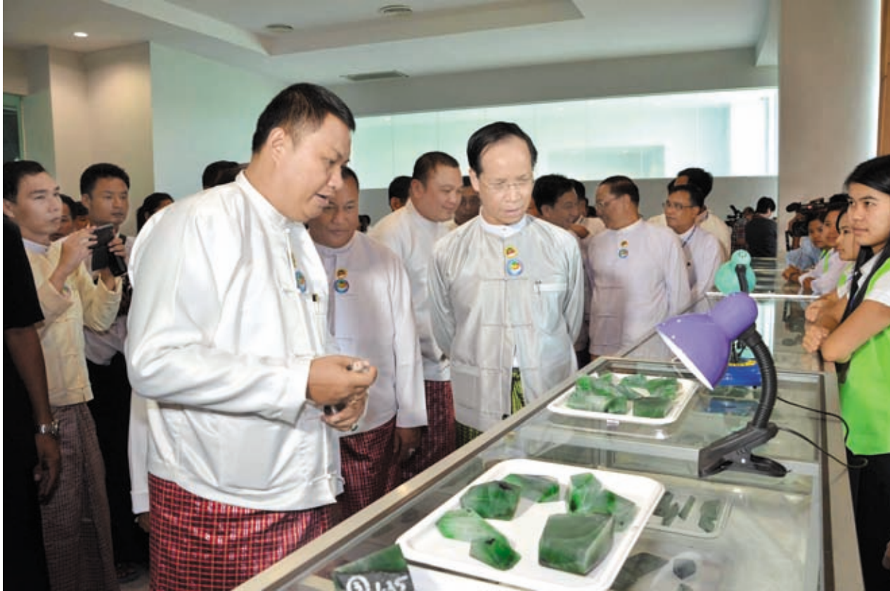
Vice-President Dr Sai Mauk Kham views jade lots displayed at the opening ceremony of Golden Jubilee Myanma Gems Emporium.

NAY PYI TAW, 15 June — Vice-President Dr Sai Mauk Kham attended opening ceremony of Golden Jubilee Myanma Gems Emporium at Mani Yadana Jade Hall, here, this morning.