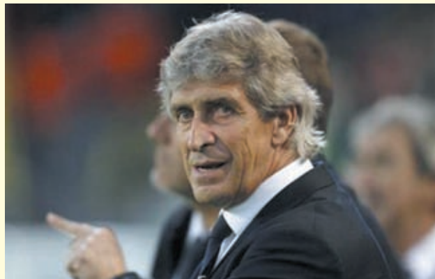
Malaga's coach Manuel Pellegrini

"I am delighted to accept this hugely exciting opportunity. The club has a clear vision for success both on and off the pitch and I am committed to making a significant contribution," Pellegrini, 59, said on the club's