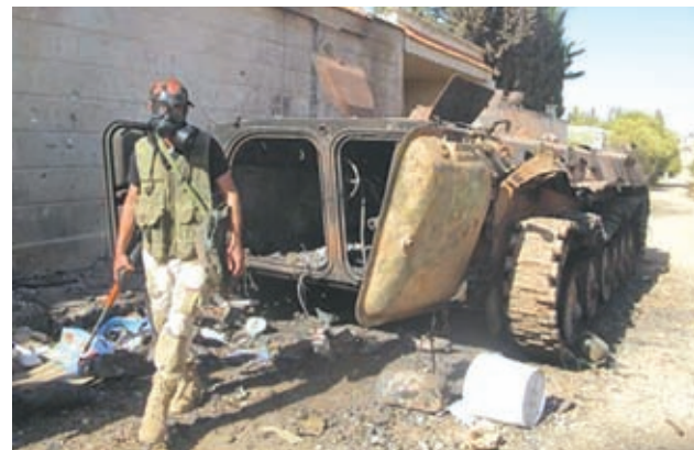
A Free Syrian Army fighter wearing a gas mask, carries his weapons as he walks past a damaged tank, after seizing a government military camp used by forces loyal to Syria's President Bashar al-Assad, near Idlib, on 13 June 2013.

Two senior Western diplomats said the United States was looking into a limited no-fly zone close to Syria's southern border with Jordan. "Washington is considering a no-fly zone to help Assad's opponents," one diplomat said. Imposing a no-fly zone could require the United States to destroy Syria's sophisticated Russian-built air defences, thrusting it into the war with the sort of action NATO used to help topple Muammar Gaddafi