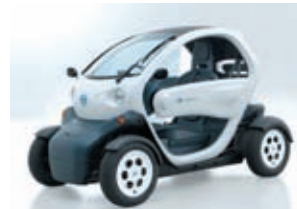
File photo shows an ultracompact car produced by Nissan Motor Co Japan’s transport ministry gave the green light on 14 June, 2013, for the two-seat ultracompact electric vehicle to run on public roads on a trial basis in parts of Kanagawa Prefecture from July.

Vehicle Law did not have clear regulations for the vehicles.—Kyodo News