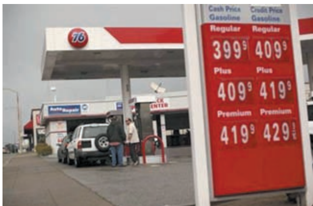
Customers fill their tanks with gasoline at an automobile service station as prices are displayed on a signboard in San Bruno, California.

WASHINGTON, 15 June—Producer prices rose more than expected in May as gasoline and food prices rebounded, but underlying inflation pressures remained muted, which could argue against