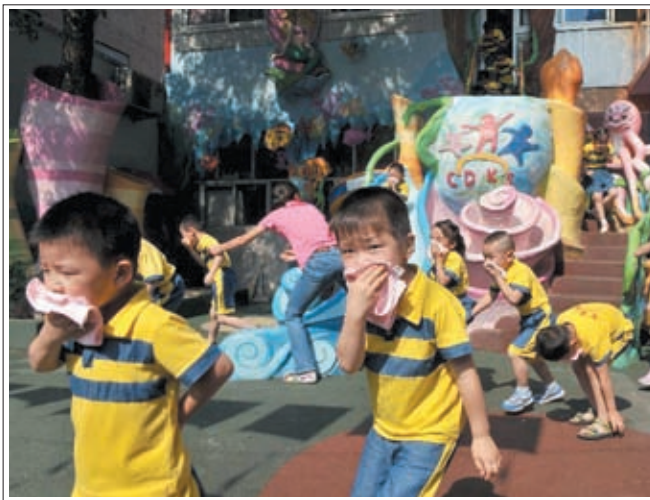
Children take part in an emergent evacuation drill in a kindergarten in Huaiyin District of Jinan, capital of east China's Shandong Province, on 14 June, 2013. Kindergartens in Huaiyin District held emergent fire fighting drills on Friday, in an aim to improve children and staff's ability to prevent fires, save themselves and cooperate with others.