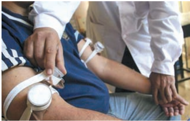
A man undergoes a medical examination to prevent Chagas disease in the Argentine province of Corrientes in this picture taken on 16 Sept, 2008.

NEW YORK, 15 June—Healthcare has improved in many countries in the last five years, but patients in South Korea, Argentina and Japan are the most satisfied with their medical care, according to an Ipsos poll released on Tuesday.