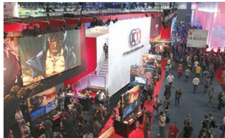
An overview of the West Hall, one of the exhibit floors at E3, the Electronic Entertainment Expo, is seen in Los Angeles, California, on 12 June, 2013.