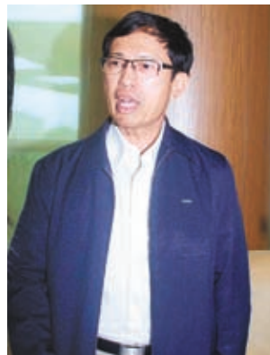
Deputy Minister U Zin Yaw

remains were buried there. According to Malaysian police's report, four were killed in the incidents. But one died at Hospital. So, the number of those killed has reached five. Names