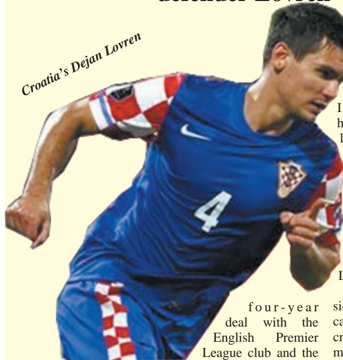
Croatia's Dejan Lovren