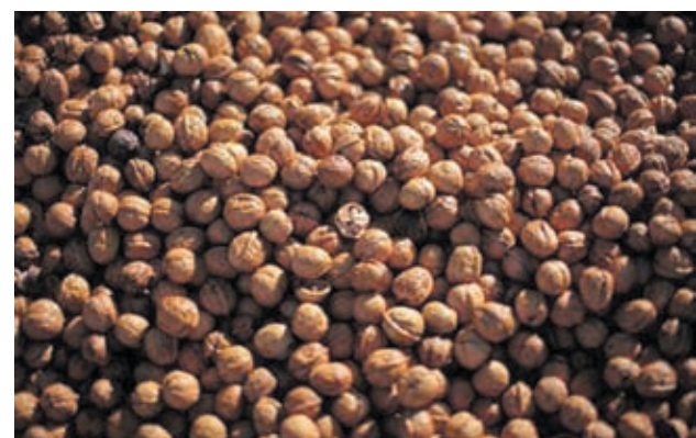
Walnuts sit in a trailer after being harvested in Lompoc, California.