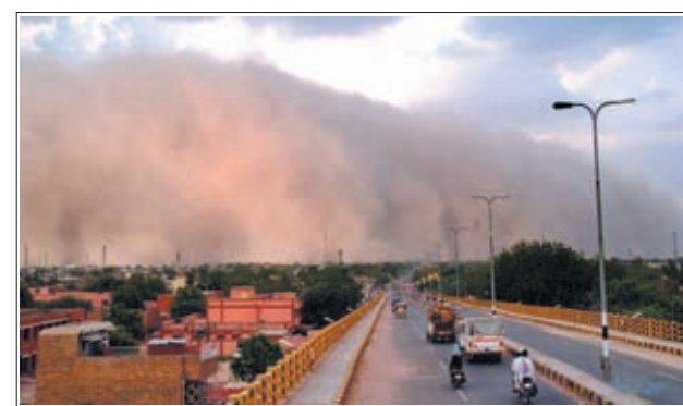
Vehicles move on a road during a dust storm in Bikaner of Rajasthan, India, on 13 June, 2013.