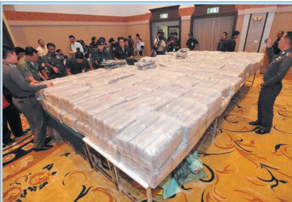
Thai police officers display confiscated drugs during a Press conference at the police headquarters in Bangkok, capital of Thailand, on 14 June, 2013. Thai police seized 2,500 kilograms of marijuana worth about 28 million Thai baht (about 915,768 US dollars) in Ubon Ratchathani in northeastern Thailand.