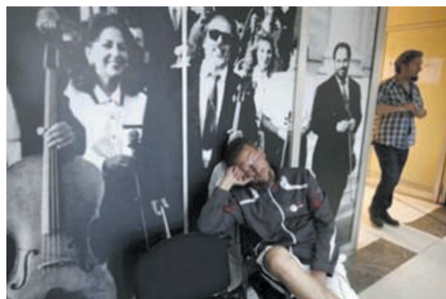
A man sleeps outside a music studio in the Greek state television ERT headquarters in Athens on 14 June 2013.

On Friday, the coordinating committee of media associations (ETER) unanimously decided to continue a strike by all radio and TV media against