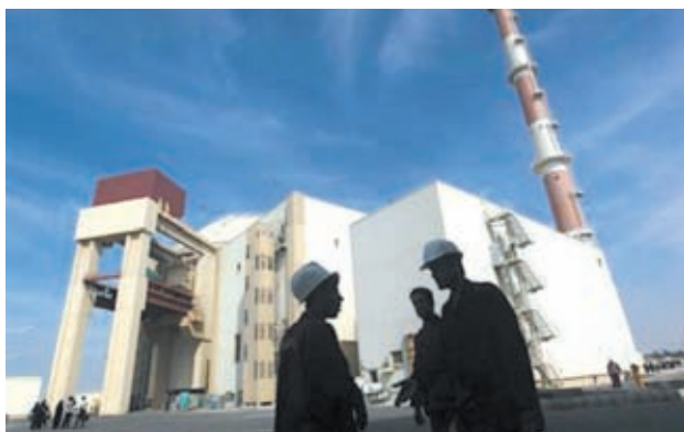
Iranian workers stand in front of the Bushehr nuclear power plant, about 1,200 km (746 miles) south of Teheran on 26 Oct, 2010.—REUTERS

Putin said that concerns about Iran's nuclear programme, which Teheran says is purely for peaceful purposes including power generation, must be addressed.— Reuters