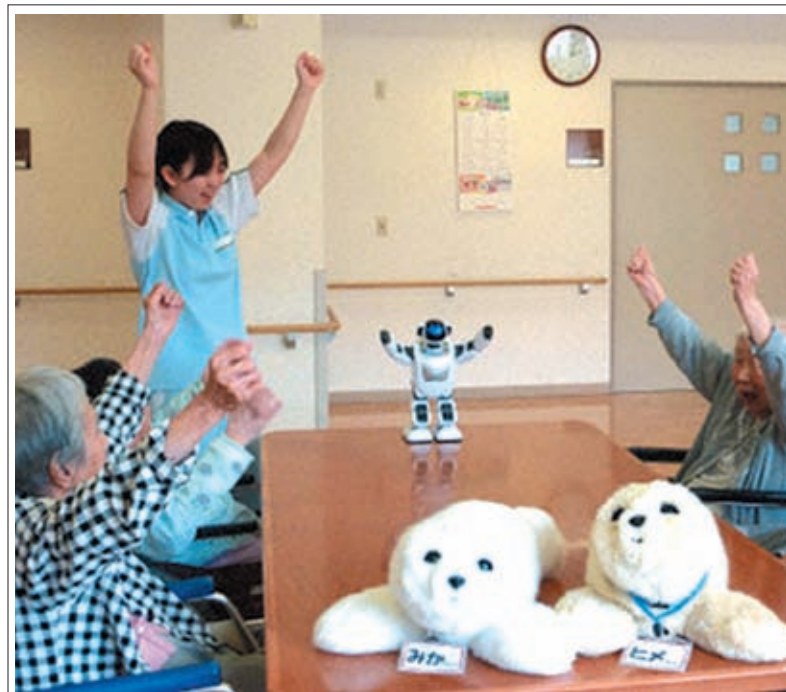
Residents at the Fuyouen senior citizen's home in Yokohama, Kanagawa Prefecture, interact with Palro, a humanoid robot, on 10 May, 2013. Seen in front are two baby seal-like Paro therapy robots.