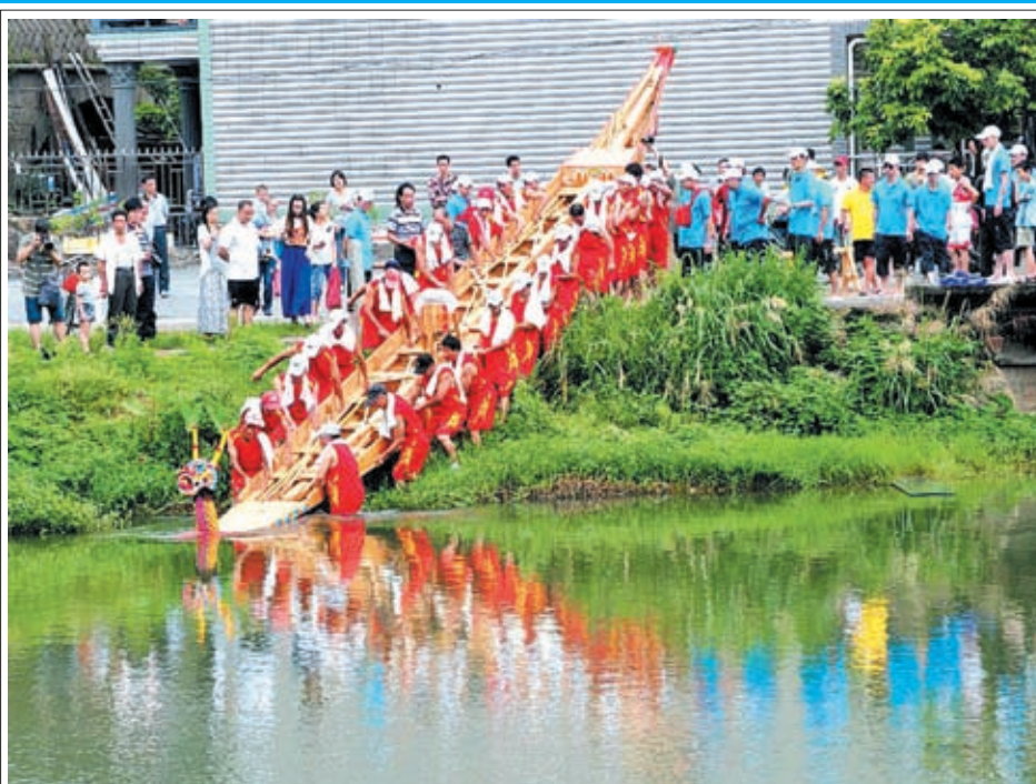
Participants push a boat into water for a boat race held to mark the annual Dragon Boat Festival in Sanxi Village, Jiangtian Town, Changle, southeast China's Fujian Province, on 10 June, 2013. This year's Dragon Boat Festival falls on 12 June.