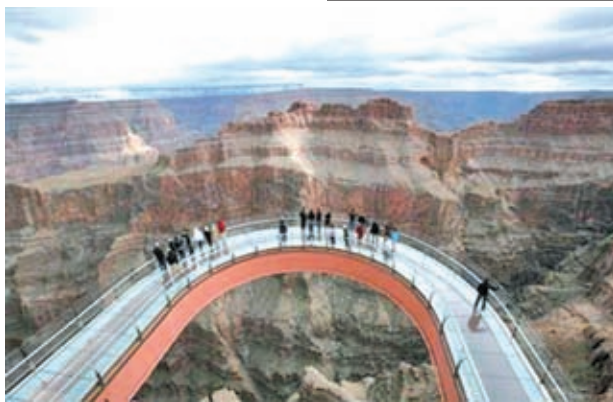
A skywalk extends out over the Grand Canyon in this view from the incomplete building that houses the skywalk, on the Hualapai Indian Reservation, Arizona in this on 28 Feb, 2012 file photo.

"For two weeks, thousands of people have been coming to the Grand Canyon to enjoy their vacations and have either been faced with an armed man collecting money from them