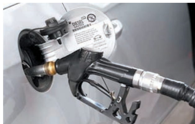
A view shows a petrol nozzle refuelling a car at a petrol station in Viterbo, north of Rome, on 25 Sept, 2012.