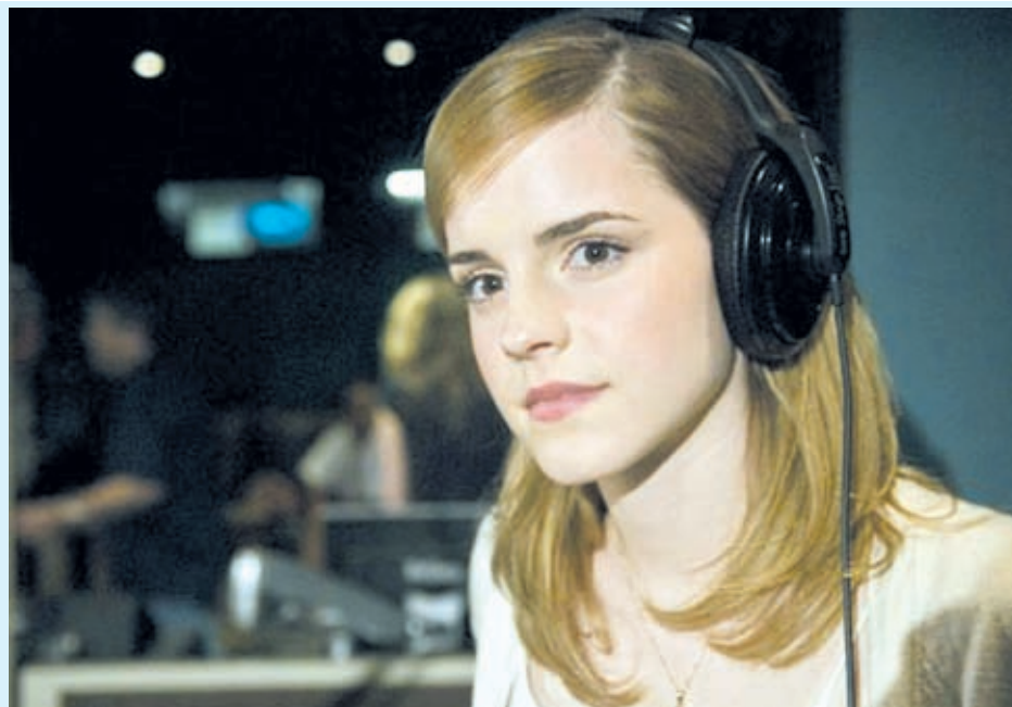
Emma Watson will portray a larger than life character in the film.