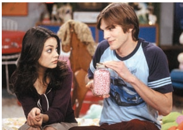
The couple have not announced a wedding date yet.

LOS ANGELES, 12 June—Actors Mila Kunis and Ashton Kutcher are reportedly planning to get married in Britain. They are also said to be considering venues like Royal Pavilion in Brighton and Stonehenge the ceremony.