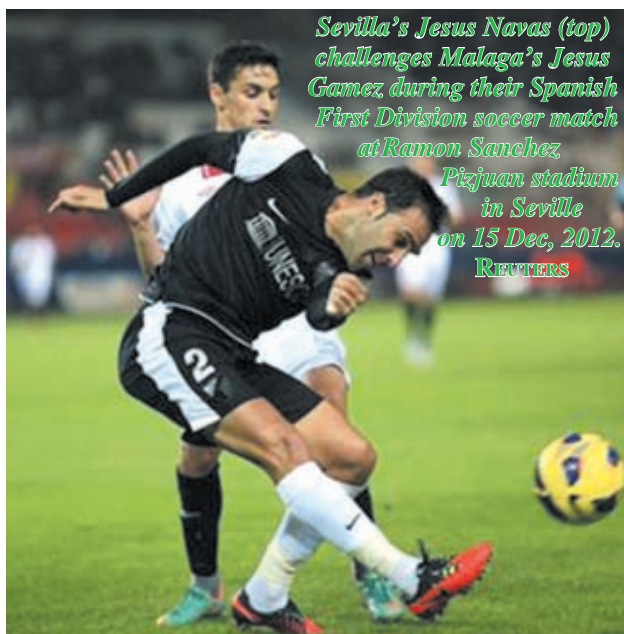
Sevilla's Jesus Navas (top) challenges Malaga's Jesus Gamez during their Spanish First Division soccer match at Ramon Sanchez Pizjuan stadium in Seville on 15 Dec, 2012.

MANCHESTER, 12 June—Spain winger Jesus Navas completed his move to Manchester City from Sevilla on Tuesday with the managerless Premier League club tying up their second bit of big transfer business since the end of the season.