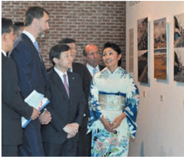
Japanese Crown Prince Naruhito (2nd from R in front) views the exhibition in Madrid on 11 June, 2013, of photos depicting Japanese citizens' recovery efforts from the 2011 Great East Japan Earthquake.