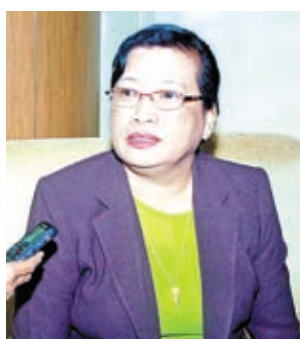
Deputy Minister Daw Win Maw Tun.

workers. Authority concerned seized and scrutinized all illegal migrant workers including Myanmar workers. We will make coordination with Ministry of Foreign Affairs, Ministry of Home Affairs and Ministry of Labour in Malaysia to deal with the issues and to help Myanmar people. We are to do our best Myanmar workers after the deputy minister for Labour, Employment and Social Security and the Myanmar Ambassador to Malaysia hold talks with Myanmar community there. Our government does not turn a blind eye to the violence