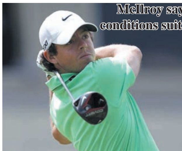
Rory McIlroy of Northern Ireland watches his tee shot on the 10th hole during the final round of the Memorial Tournament at Muirfield Village Golf Club in Dublin, Ohio on 2 June, 2013.

ARDMORE, 12 June—Rory McIlroy is one of the few top golfers pleased to see the heavy rain falling at Merion, the site for this week's US Open.