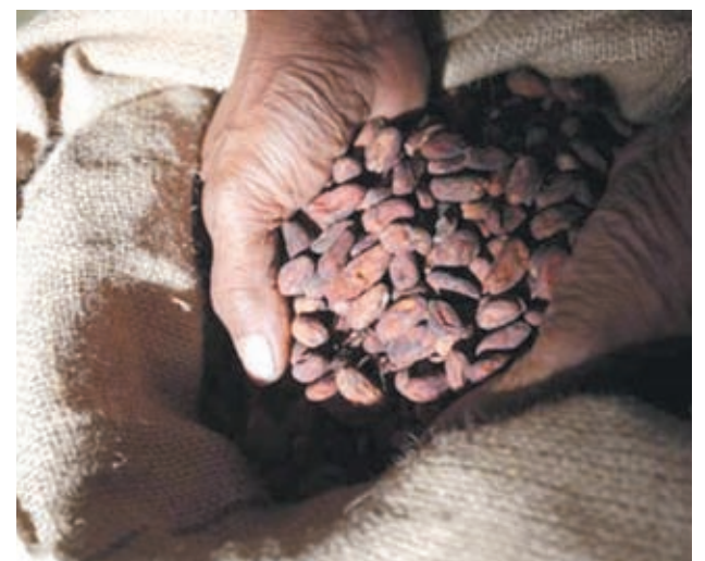
A worker at Dole Food Company scoops up cocoa beans at the company's Waialua coffee and cocoa farm on the North Shore of Oahu, in Hawaii on 9 Nov, 2011.

Dengue fever is an illness caused by infection with a virus transmitted by the Aedes mosquito, with the symptoms including fever, fatigue as well as joint and muscle pains.—Xinhua