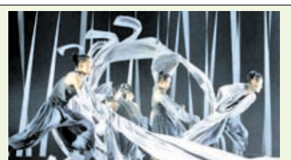
Dancers from Dragon Style Kung Fu Performance Troupe perform in the Kungfu Dance "The Door" at the Peking University Hall in Beijing, capital of China, on 10 June 2013.