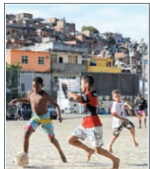
Barefooted children play soccer in an area called favela in Rio de Janeiro, Brazil, on 25 May, 2013

It is not immediately known how long he will stay in the Central Clinical Hospital.— Xinhua