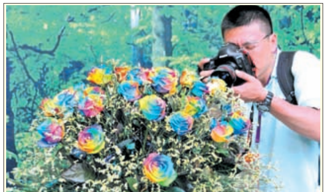
A visitor takes photos of a bunch of colourful roses on display in the main pavilion of the 9th China (Beijing) International Garden Expo in Beijing, capital of China, on 10 June, 2013. Cultivated by artificial methods, those unusual roses attracted many visitors.—XINHUA

Chicago Mayor Rahm Emanuel said in a statement that the data indicate the city "is well on its way to meeting and exceeding my goal of 50 million annual visitors by 2020."—Xinhua