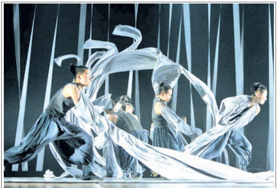
Dancers from Dragon Style Kung Fu Performance Troupe perform in the Kungfu Dance "The Door" at the Peking University Hall in Beijing, capital of China, on 10 June, 2013.

The proposal comes months after a decision by the US National Institutes of Health to "retire" many of the over 400 chimps that it supports at primate facilities.—Xinhua