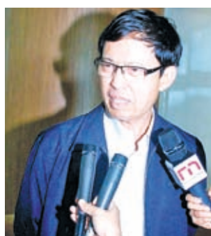
Deputy Minister U Zin Yaw.

A: We are making cooperation with Malaysian government on violence against Myanmar migrant workers. Our trip is aimed at providing more effective protection to Myanmar workers there. Moreover, we want to give encouragements to warded Myanmar