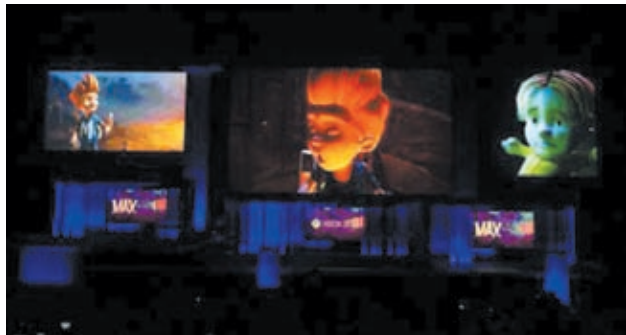
Scenes from the game "Max: The Curse of Brotherhood" are displayed on screens during the Xbox E3 Media Briefing at USC's Galen Centre in Los Angeles, California on 10 June, 2013.