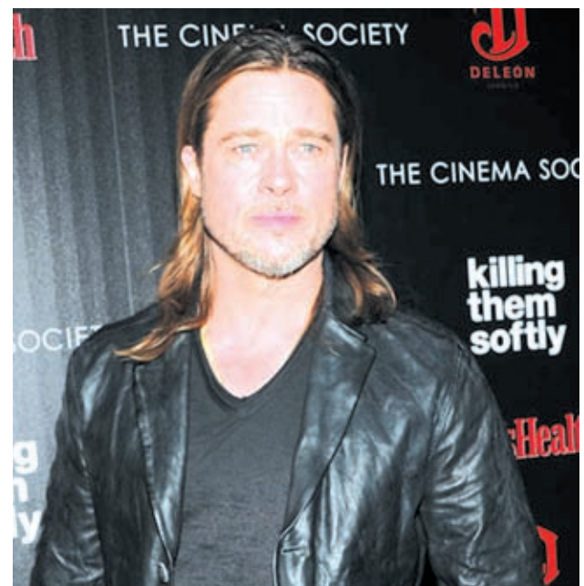
Brad Pitt’s latest flick World War Z is an apocalyptic horror movie about zombies.

Pitt is currently busy attending the premieres of the apocalyptic horror movie across the globe.—PTI