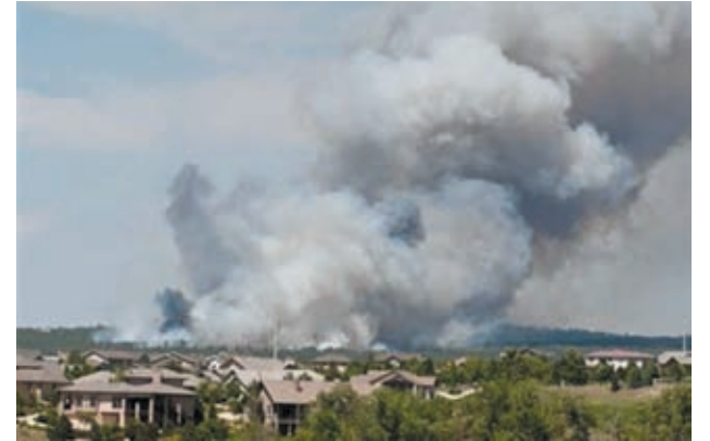
Large plumbs of smoke from a wildfire burning in the Black Forest stretch the horizon threatening homes north east of Colorado Springs, Colorado on 11 June, 2013.

world's highest suspension bridge, stretches nearly 1,000 feet above the Arkansas River for a quarter-mile and is one of Colorado's most visible tourist destinations. The bridge itself is not threatened by the flames.