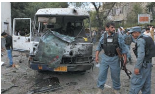
Afghan policemen stand at the site of a suicide car bomb attack in Kabul on 11 June, 2013.