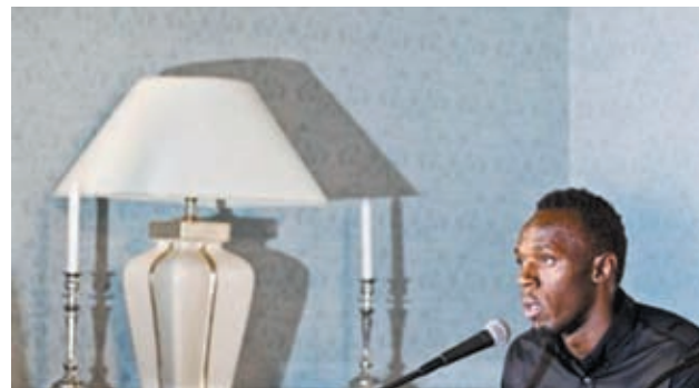
Sprinting champion Usain Bolt of Jamaica speaks during a news conference at the Russian Embassy on 11 June, 2013.