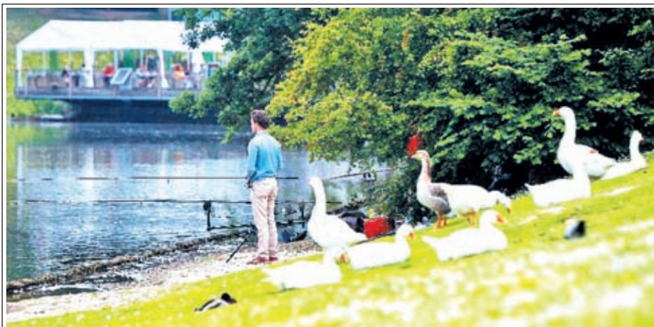
A man fishes at a park in the eastern suburbs of Brussels, capital of Belgium, on 11 June, 2013. Local residents go to parks to enjoy the sunshine after experiencing a long and gloomy spring this year.—XINHUA

In April, the unemployment rate in Japan was close to its pre-crisis level while, but it reached a new peak in several European countries, including France at 11.0 percent, Greece at 27 percent (in February, the latest month available), Italy at 12 percent, Portugal at 17.8 percent and Spain at 26.8 percent.—Xinhua