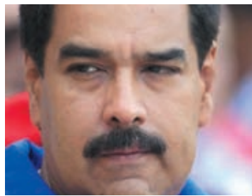
Venezuelan President Nicolas Maduro reacts while attending a mass at the mausoleum of late President Hugo Chavez to mark three months after his death in Caracas, on 5 June, 2013.