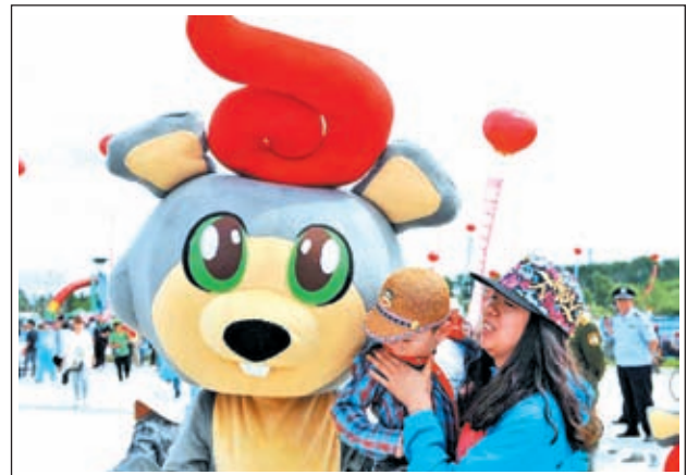
The volcano mascot of the traditional "Holy Water Festival" poses for photo with tourists in Wudalianchi, northeast China's Heilongjiang Province, on 11 June, 2013. The festival was listed as the National Intangible Cultural Heritage in 2010.