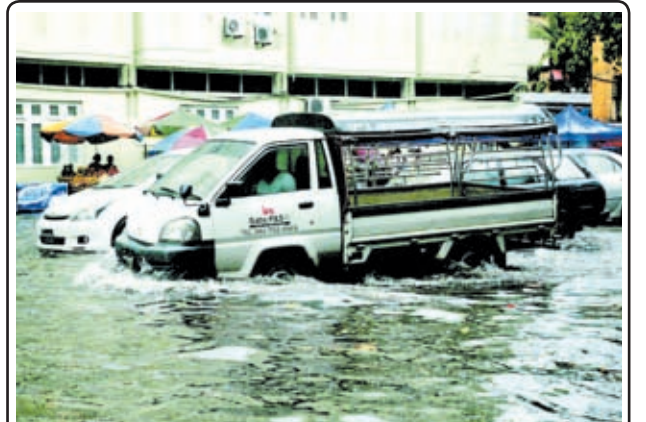
Photo shows inundation on Maha Bandoola Street at downtown Yangon on 9 June evening due to heavy rains.