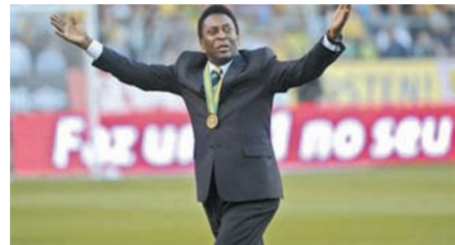
Brazil's soccer legend Pele acknowledges cheers from the audience as he enters Rasunda stadium in Stockholm, ahead of the friendly match between Sweden and Brazil, on 15 Aug, 2012.

The eight-team Confederations Cup takes place