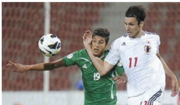
Japan's Mike Havenaar (R) fights for the ball with Iraq's Dhurgham Ismael Dawood during their 2014 World Cup qualifying soccer match in Doha on 11 June, 2013.