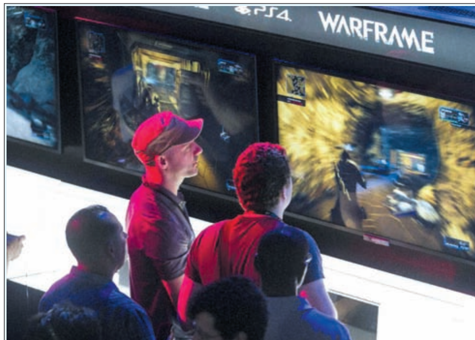
People play games at the 2013 Electronic Entertainment Expo (E3) that takes place at the Los Angeles Convention Centre in Los Angeles, California, the United States on 11 June, 2013.—XINHUA

Government officials say Capriles has failed to present evidence of election-day irregularities and have accused him of fomenting post-vote violence that the government says killed 11 people.— Reuters