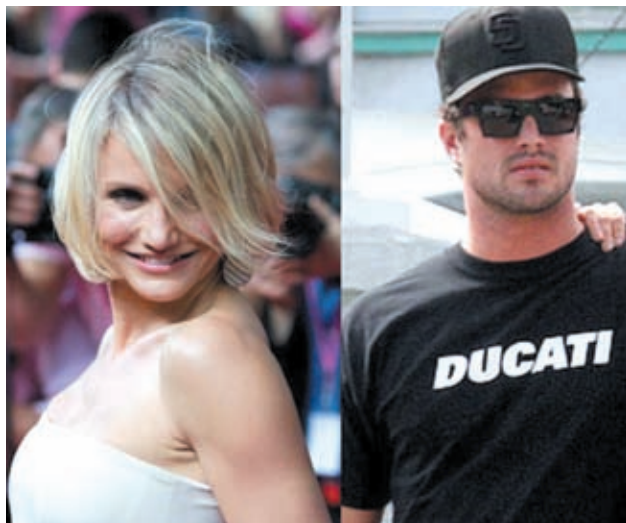
Cameron Diaz and Taylor Kinney share a great camaraderie.