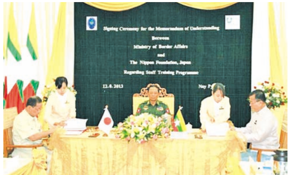
Signing ceremony of MoU for opening staff training programme between Ministry of Border Affairs and The Nippon Foundation, Japan in progress.