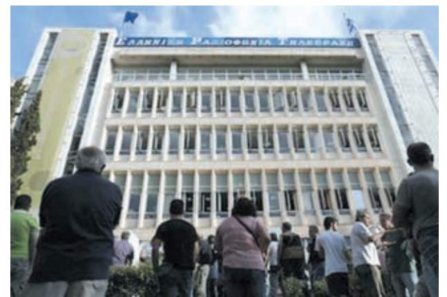
People stand in front of Greek state television ERT headquarters after the government's announcement that it will shut down the broadcaster in Athens on 11 June, 2013.