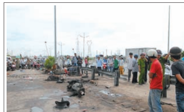
People look at the blast site after an explosion in Ho Chi Minh City, Vietnam, on 4 June, 2013. One boy was confirmed dead after an air compressor exploded in a shop in Ho Chi Minh City early on Tuesday, according to Vietnamese state-owned news agency VNA.