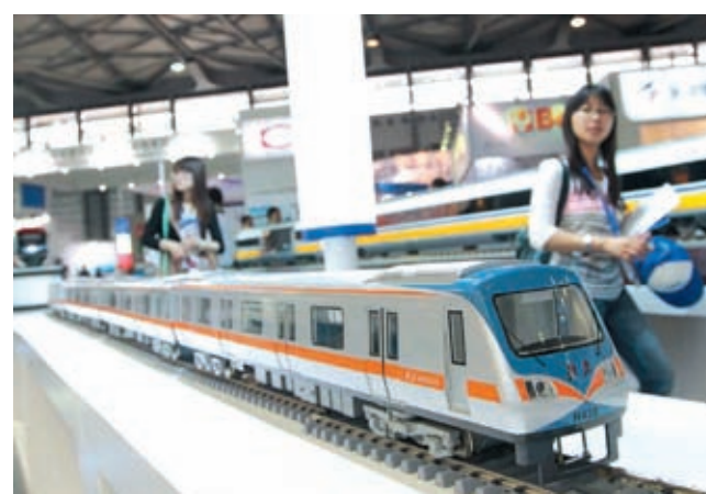
A train model for subway is displayed on the exhibition "Rail + Metro China 2013" in Shanghai, east China, on 4 June, 2013. The exhibition, showcasing metro and rail-related technologies and products worldwide, kicked off here on Tuesday.