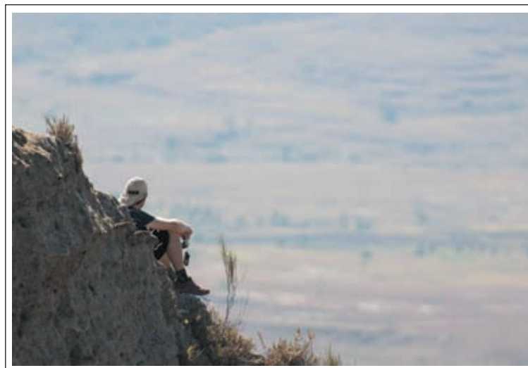
Photo taken on 30 May, 2013 shows a tourist visiting Isalo National Park in the Ihorombe region, southwestern Madagascar. Isalo National Park was known for a variety of physiognomies and species of birds, frogs and mammals.

He did not provide any other details of the fire. It remains unclear how the tank caught fire and how much damage it caused to the plant.—Xinhua