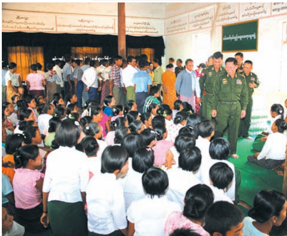
Senior General Min Aung Hlaing meets local people in NyaungU where mobile team gives medical treatments.