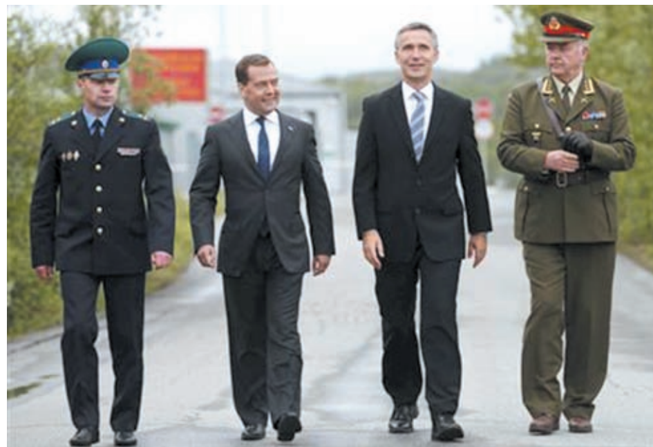
Russian Prime Minister Dmitry Medvedev (2nd L) and his Norwegian counterpart Jens Stoltenberg are pictured flanked by military representatives from Russia and Norway, at Boris Gleb, a crossing point on the border between Norway and Russia near Kirkenes, in the extreme north-east of Norway, on 4 June, 2013.

Danish planes flying from a NATO base in the