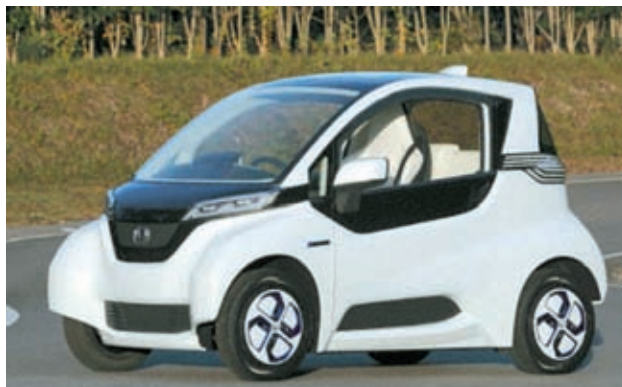
Photo taken in Tokyo shows a two-seat ultracompact electric vehicle from Honda Motor Co as the automaker said on 4 June, 2013, it will begin experimental use of the vehicle from the fall of 2013 in Kumamoto Prefecture and a city in Okinawa Prefecture.

Kumamoto Prefecture plans to utilize the EV to attract more tourists, while the city of Miyakojima in Okinawa will check the