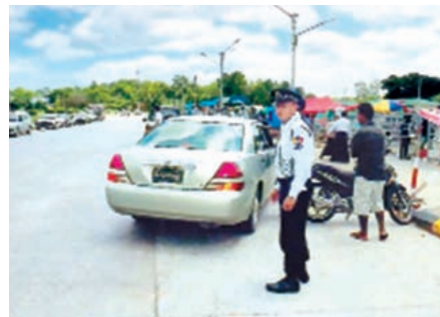
Under Supervision of Nay Pyi Taw Council, Traffic Police Corps and Development Committee officials checking whether vehicles systematically parked in Nay Pyi Taw Myoma Market on 31 May.