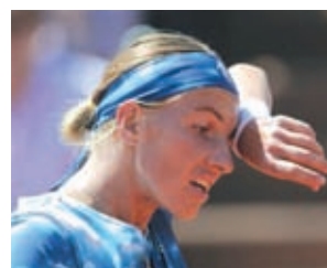
Svetlana Kuznetsova of Russia wipes her face during their women's singles quarter-final match against Serena Williams of the US at the French Open tennis tournament at the Roland Garros stadium in Paris on 4 June, 2013. Kuznetsova lost the match to Williams.

"Against Serena, it's a bit complicated to play like