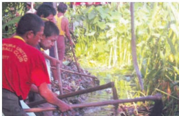
Local people at sanitation tasks.

On 2 June, workers of Township Development Affairs Committee and Engineering Department (Roads and Bridges), students and local people from 19 wards of the township participated in carrying out sanitation tasks