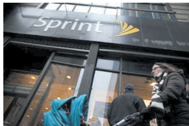
People walk past a Sprint store in New York on 17 Dec, 2012.

impossible to fulfill because approval is required from all shareholders including Sprint, which said it would not give up any of its rights with regards to Clearwire’s governance. Sprint said Dish’s demand for the right to nominate three Clearwire board members runs roughshod over Clearwire’s equity holder agreement, which includes a director selection process.