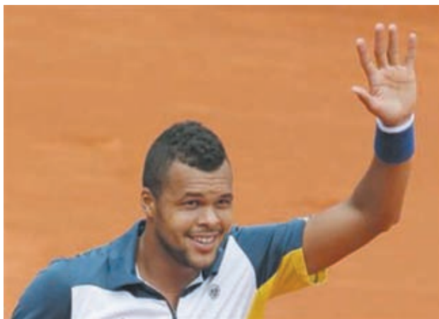
Jo-Wilfried Tsonga of France

Federer has suffered at the hands of Tsonga before, notably at Wimbledon in 2011 when the Frenchman, who has a