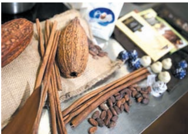
Chocolate beans and pods are displayed in New York on 17 Nov, 2012.

A surprising turnaround was seen in the first quarter when “grindings”, the term for processing cocoa beans which is shorthand for commercial demand, rose nearly 6 percent in North America, the biggest annual jump in nearly two years. In Europe and Asia, first quarter grindings tumbled. Also included in the supposedly better-for-you chocolate segment are