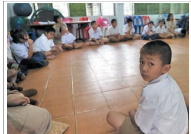
Autistic children attend a training class at Watklang municipal school in Khon Kaen, Thailand's north province, on 3 June, 2013. Khon Kaen initiated a participation of medical staff in Khon Kaen hospital. Autistic children's parents and local schools produced a holistic package for autistic children. According to a report released by Thai autism experts, at least 200,000 children in the country suffer from autism, and the number is still growing.

However the government of Nepal (GoN) has no specific plan and programs to mitigate such risks stimulated by the climate change including the melting down of snow level in the mountainous region, experts say. Nepal, on 5 June, is marking WED as an annual event for positive environmental action on the theme of "Think. Eat. Save." as set by the United Nations Environment Programme (UNEP), an anti-food waste and food loss campaign targeted to limit the devastating effects on the environment due to the drain on natural resources by food waste.—Xinhua