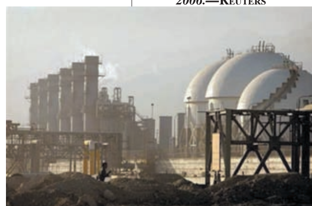
A view of a petrochemical complex in Assaluyeh on Iran's Persian Gulf coast on 28 May, 2006.

Critics of the sanctions say that more diplomatic efforts are necessary to avoid pushing Iran's leaders to