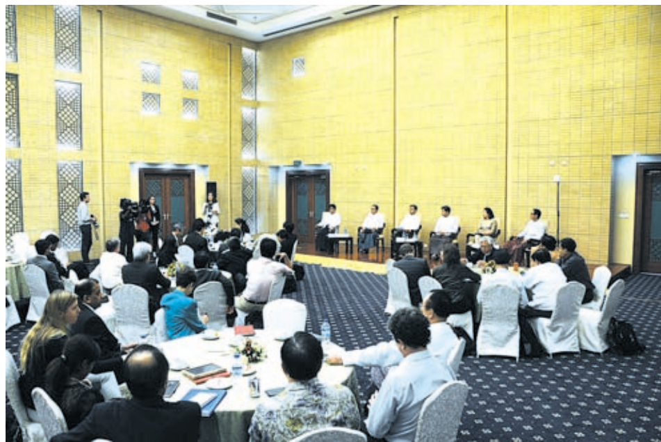
The official inauguration of Myanmar's first global nation-branding campaign at MICC at the World Economic Forum on East Asia 2013.

foreign countries would attend the forum and about 27 titles would be discussed during the three-day forum. So, the forum benefited Myanmar a lot because experts from Myanmar would also participate in the forum and we could learn from ideologies of the heads of international