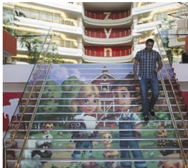
Player avatars from Zynga’s FarmVille 2 are seen on a stairway at the entrance to Zynga headquarters in San Francisco, California on 23 April, 2013.