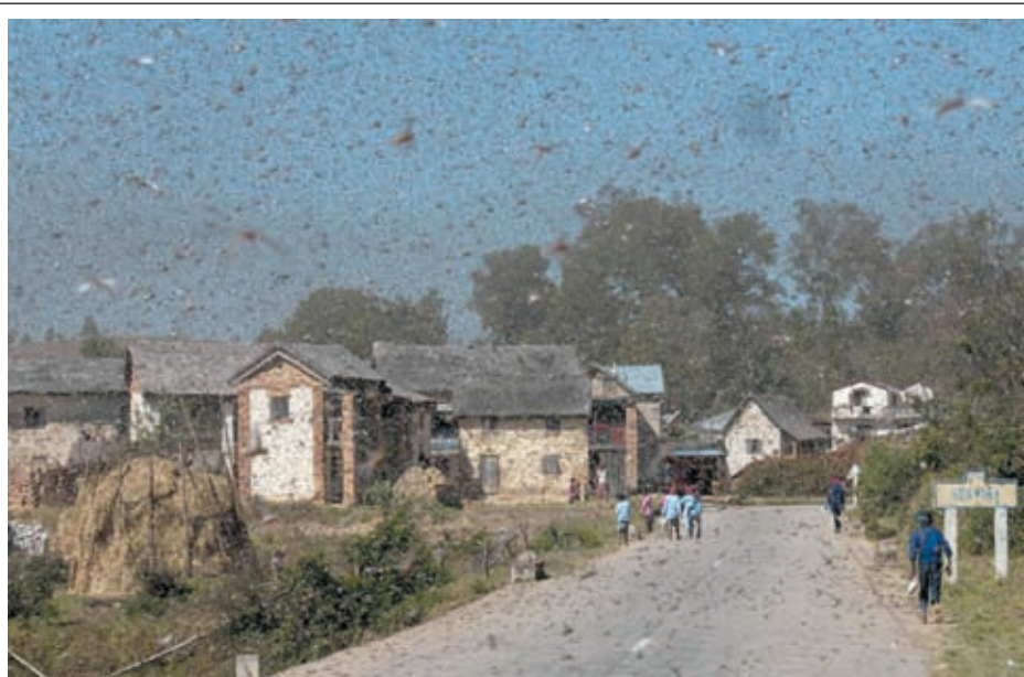
Locusts fly across Itaka Centre Village, Soavina County of Ambositra District, around 225 km south of Madagascar's capital Antananarivo on 28 May, 2013. Locust plague is threatening the livelihoods of people in Madagascar, more than 90 percent of whom earn a living from agriculture. Madagascar's transition presidency said recently it will unlock two billions Ariary (about one million US dollars) to fight against locust plague, while according to the Food and Agriculture Organization (FAO), the fight against the locust in Madagascar requires 22 million US dollars and an additional fund of 19 million US dollars. If no action is taken, at least 1.5 million hectares covering two-thirds farmland of the country would be infested by locusts by September 2013.