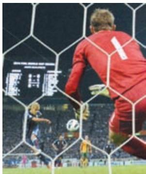
Japan midfielder Keisuke Honda (L) scores an injury-time penalty past Australia goalkeeper Mark Schwarzer in a World Cup soccer qualifier against Australia at Saitama Stadium in Saitama, north of Tokyo, on 4 June, 2013.

Matt McKay handled a ball from Honda in the dying seconds and awarded Japan