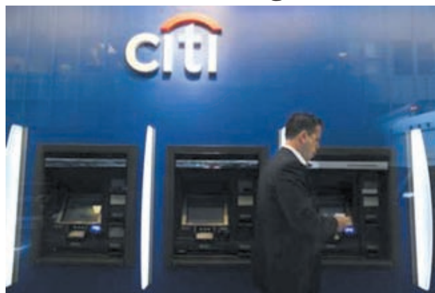
A man walks past a Citibank branch in lower Manhattan, New York on 16 Oct, 2012.