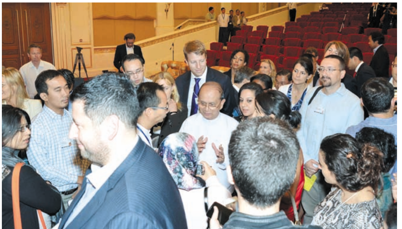
President U Thein Sein meets with Young Global Leaders who are in Myanmar to attend the 22 nd World Economic Forum on East Asia.

million people sits at the new crossroads of Asia. With China to our northeast, India and Bangladesh to our west, the other nations of ASEAN to our south and east, we border more than two billion people and the fastest growing markets in the world. Our country, once isolated not just by physical barriers, is now poised to break those barriers. We are becoming the door to Asia. In undertaking democratic reforms and development programs in our country, we are focusing on working to the betterment of the 60 million citizens of the country. We want to adopt