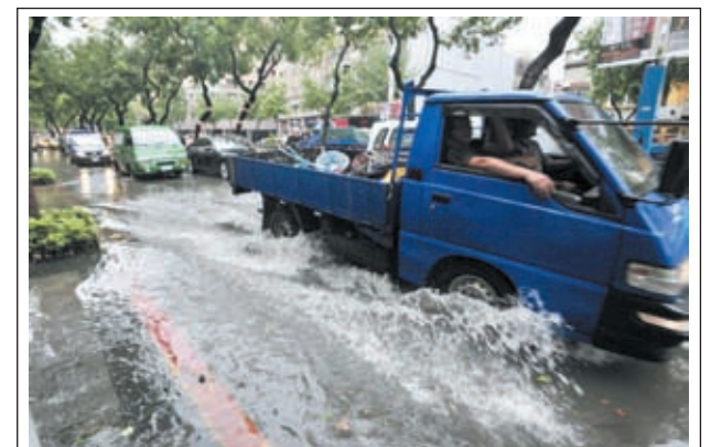
Vehicles move on waterlogged road in Taipei, south-east China's Taipei, on 4 June, 2013. A rainstorm and hail hit the city on Tuesday.