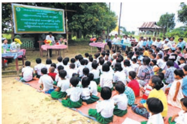
NAY PYI TAW, 5 June—The 27 th SEA Games Environmental Conservation Committee

held talks in townships of Nay Pyi Taw Council Area.