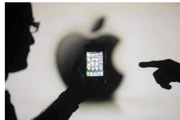
Men are silhouetted against a video screen with an Apple logo as they pose with an Apple iPhone 4 smartphone in this photo illustration taken in the central Bosnian town of Zenica, on 17 May, 2013.

Apple is also in talks for music rights with Sony Music Entertainment and Sony’s separate publishing arm Sony/ATV, the newspapers said. Apple may find it difficult to launch a streaming music service at its developer conference, which begins on 10 June in San Francisco, without a deal with Sony.—Reuters