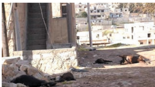
Animal carcasses lie on the ground, killed by what residents said was a chemical weapon attack on Tuesday, in Khan al-Assal area near the northern city of Aleppo, on 23 March, 2013.—REUTERS

Those hoping to save themselves were faced with the agonising choice of digging holes in the ground to escape the bombing or embarking on a perilous cross-country trek to neighbouring Lebanon.— Reuters