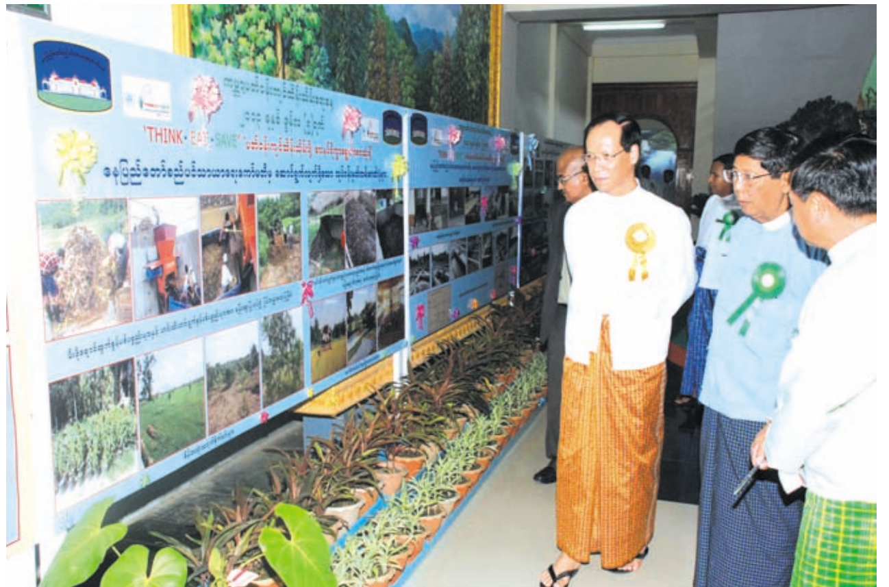
Vice-President Dr Sai Mauk Kham and party look around booths displayed at Forest Department to mark World Environment Day (WED).

raises awareness of people to be visionary in production and consumption of food. The loss of food means the loss of labour, capital and natural resources, thereby resulting in global warming and climate changes.