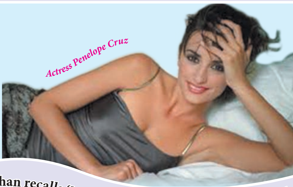
Actress Penelope Cruz