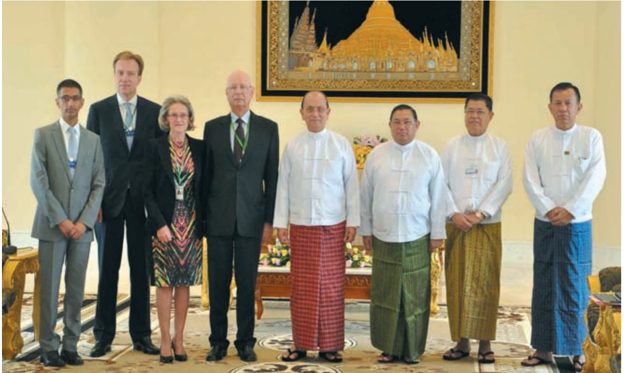
President U Thein Sein poses for documentary photo with Founder and Executive Chairman Professor Klaus Schwab of WEF on East Asia and party.

NAY PYI TAW, 5 June—President of the Republic of the Union of Myanmar U Thein Sein received Founder of World Economic Forum on East Asia and Executive Chairman Professor Klaus