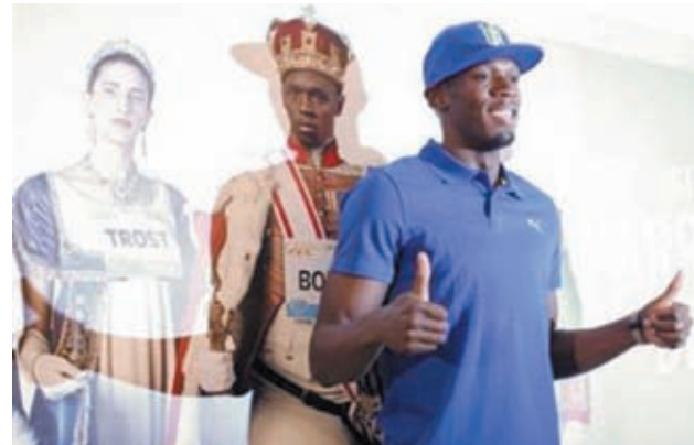
Jamaican sprinter Usain Bolt poses during a news conference in Rome on 4 June, 2013. Bolt will be competing at the Golden Gala World Challenge Rome meeting on Thursday.

and said he would not relax his hold over a sport he has dominated since his triumph at the Beijing Olympics of 2008. "It is going to take hard work and I really look forward to the competition because it drives me and it helps the sport. I am