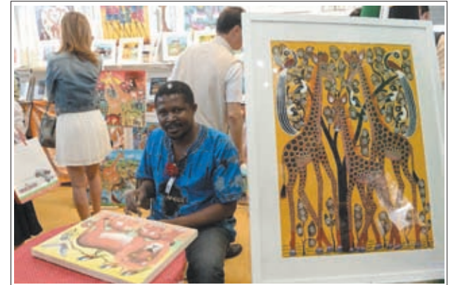
An African artist draws during the African Fair 2013 in Yokohama, Japan, on June 1, 2013. More than 300 companies from 46 African countries participated in the African Fair 2013, an official event sponsored by Japan's trade ministry and the Japan External Trade Organization (JETRO) under the TICAD V.