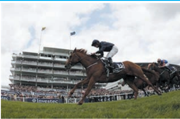
Ruler of the World ridden by Ryan Moore (L) races for the finish line to win The Derby during the Epsom Derby festival in Epsom, southern England on 1 June, 2013.

Every season O'Brien has the offspring of flat racing's top stallions at his disposal thanks to the Coolmore breeding empire