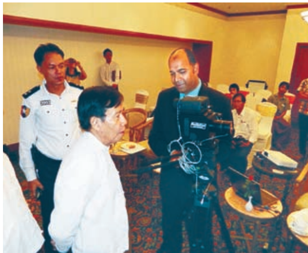
US technology company Laser Technology Inc introduces its Traffic Over Speed Enforcement Laser that can record over-speed cars on busy roads and highways.