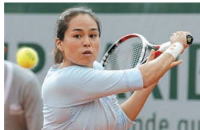
Jamie Hampton of the US hits a return to Petra Kvitova of Czech Republic during their women's singles match at the French Open tennis tournament at the Roland Garros stadium in Paris on 1 June, 2013.