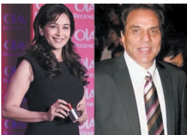
Madhuri says she is a huge fan of Dharmendra's dancing style.

MUMBAI, 2 June—In her about three-decade career Bollywood dancing star Madhuri Dixit has worked with many good looking and talented actors like Salman Khan, Akshay Kumar, and Sanjay Dutt, but she finds yesteryear star