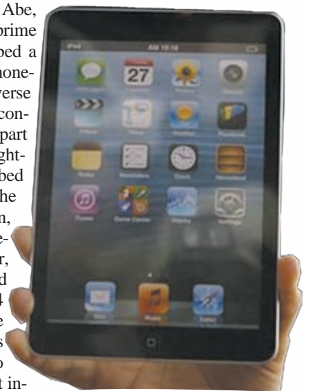
A man holds up a mock model of Apple's new iPad mini as he waits for the release of the tablet in front of the Apple Store Ginza in Tokyo on 1 Nov, 2012.

Price rises are rare in Japan, which has suffered 15 years of low-grade deflation. A few other foreign brands have also raised prices on products, providing an early sign of inflation for Abe and an indication that these companies feel consumer demand is strong enough to withstand the increases. Still, price rises would have to spread much more widely, especially to lower-end discretionary goods, to show that Abe's aggressive policies are helping reinvigorate the economy.—Reuters