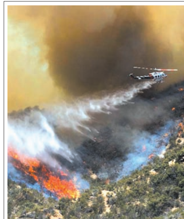
A water bomber helicopter battles a brush fire at Green Valley as the fire has burned more than 1,400 acres since Thursday in the Angeles National Forest just north of Castaic, in California, the United States, on 31 May, 2013.

President Vladimir Putin made an unscheduled inspection of troops from the Southern Federal District and Airborne Forces on 13 May and urged the army to be prepared around the clock.