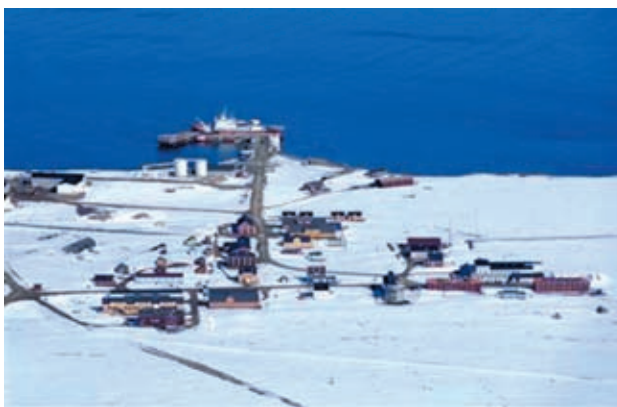
The town of Ny-Aalesund in Norway's high Arctic as seen from the top of the nearby Zeppelin mountain, on 28 May, 2013.

little damage and no spill, but it was a big lesson for firms looking for Arctic resources.