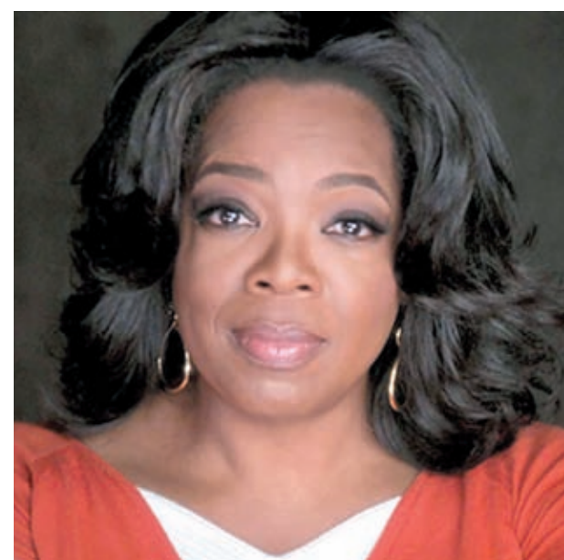
Oprah Winfrey shot to fame with The Oprah Winfrey Show.

Winfrey also told the Class of 2013, "You now have a chance to better your life, the life of your