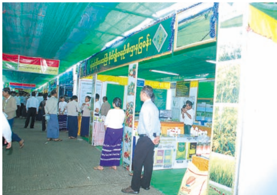
Photo shows booths of equipment, farming input and technologies required in promoting the cooperative societies displayed at the ceremony.