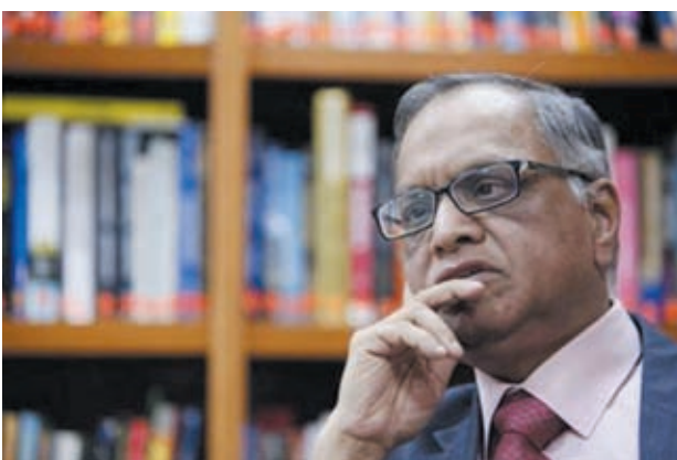
N R Narayana Murthy, founder and chairman of Infosys, listens to a question during an interview with Reuters at the company's office in Bangalore on 28 Feb, 2012.