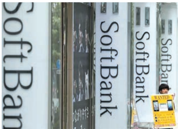
A clerk works in front of a SoftBank Corp branch in Tokyo on 29 May, 2013.

NEW YORK, 2 June — Proxy advisory firm Institutional Shareholder Services said that Sprint Nextel (S.N) shareholders should vote for SoftBank Corp's (9984.T) proposed $20.1 billion purchase of the No 3 US mobile provider, potentially dealing a blow to a $25.5 billion rival bid from Dish Network (DISH.O).