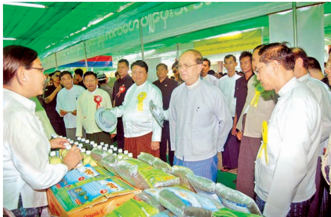
President U Thein Sein views display of farming equipment and agricultural input for the cooperative societies.