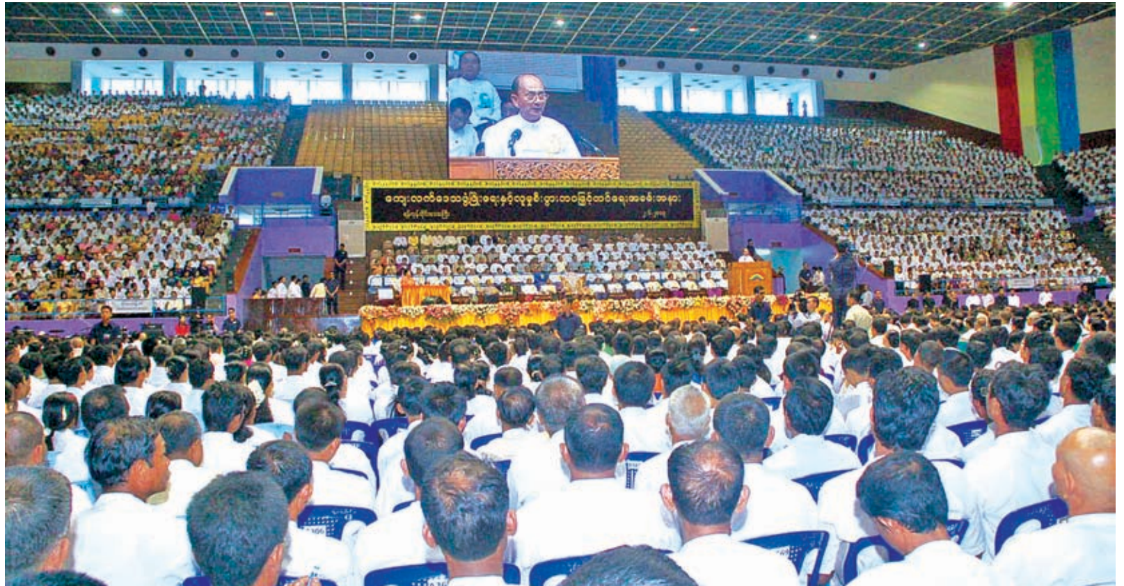
President U Thein Sein addresses the ceremony of Rural Region Development and Socio-economic Improvement in Yangon Region at National Indoor Stadium (1).—MNA

The President pointed out that only when political stability, can economic development be realized and only when the country sees socio-economic