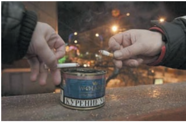
Men tap ash from their cigarettes while smoking on the balcony of an office building in Russia's Siberian city of Krasnoyarsk on 24 Jan, 2013.

But opponents say it will not work and infringes on the rights of smokers.