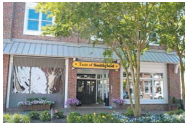
The Taste of Smithfield restaurant and gourmet market is seen in Smithfield, Virginia on 30 May, 2013.