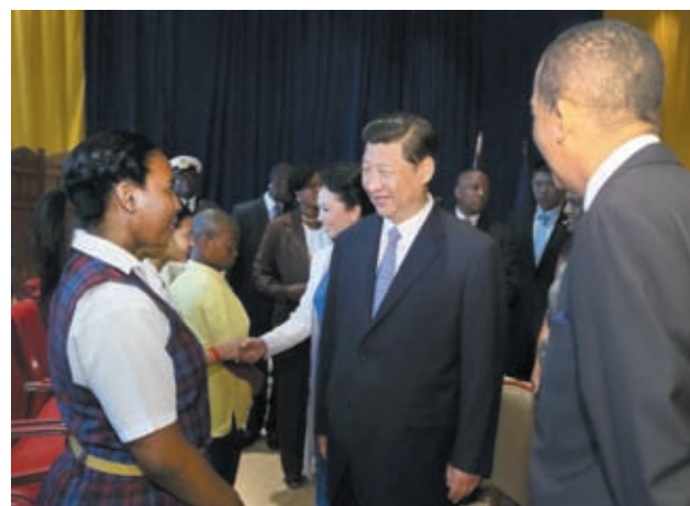
Chinese President Xi Jinping (C front) and his wife Peng Liyuan meet with representatives of middle school students of Trinidad and Tobago accompanied by President of Trinidad and Tobago Anthony Carmona and his wife during their visit in Port of Spain on 1 June, 2013, the International Children's Day.