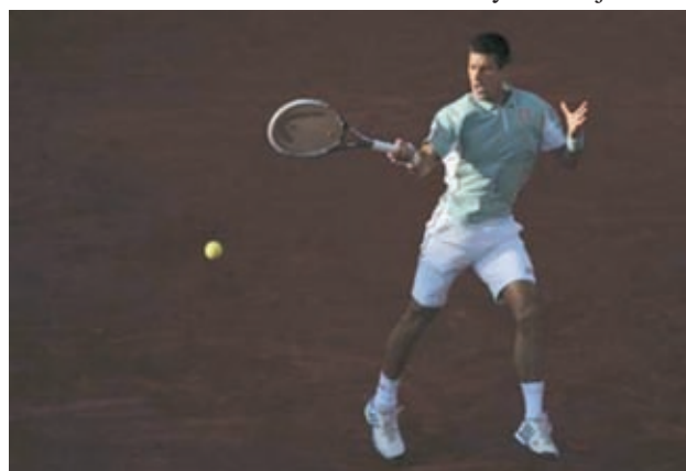
Novak Djokovic of Serbia hits a return to Grigor Dimitrov of Bulgaria during their men's singles match at the French Open tennis tournament at the Roland Garros stadium in Paris on 1 June, 2013.—REUTERS

Perhaps the only concern during an emphatic display was an injury timeout in the third set, when the trainer was called on court to massage a problematic shoulder. That was overshadowed, however, with the news that followed. It was the second time Djokovic had found out about the death of someone close to him in the middle of a tournament.—Reuters