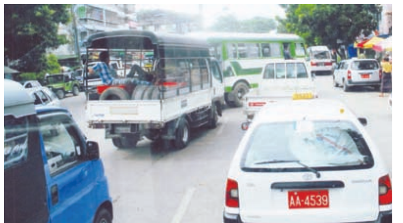
Photo shows a line of vehicles stuck in traffic caused by undisciplined road users on a downtown road in Yangon recently.