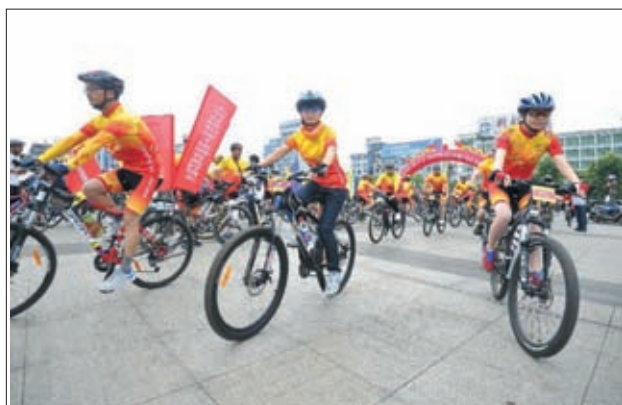
Bicycle fans ride on the street during a publicizing activity for the World Environment Day in Xinyu City, east China's Jiangxi Province, on 1 June, 2013. More than 300 bicycle fans from 9 bicycle clubs in the city rode on the streets on Saturday in celebration of the World Environment Day that falls on 5 June.