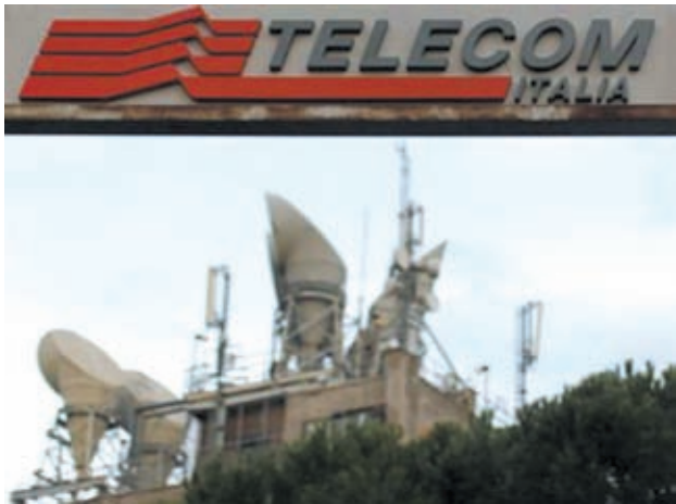
A Telecom Italia antenna booster is seen in northern Rome on 12 Nov, 2012.

MILAN, 2 June—The board of Telecom Italia (TLIT.MI) will not make a decision on a possible tie-up with Hutchison Whampoa (0013.HK) at its next meeting on Wednesday, the Italian group's chief said in a newspaper interview on Saturday.