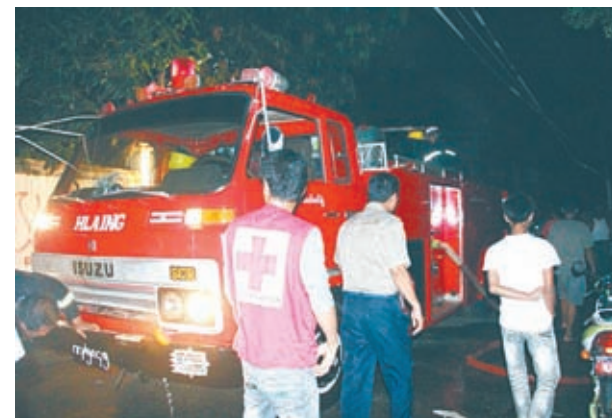
A fire engine fighting fire at the paper warehouse in Hline Township in Yangon.