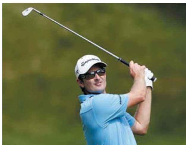
Justin Rose of England watches his second shot on the 15th hole during the third round of the Memorial Tournament at Muirfield Village Golf Club in Dublin, Ohio on 1 June, 2013.

DUBLIN, (Ohio), 2 June—Former champion Justin Rose had a sense of deja vu after battling through tricky, gusting winds to end Saturday's third round at the Me-