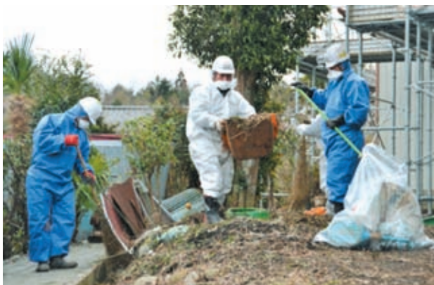
File photo taken in February 2013 shows workers decontaminating a residential area in Okuma, Fukushima Prefecture, near Tokyo Electric Power Co's crisis-hit Fukushima Daiichi nuclear power plant. The Environment Ministry is considering filing a lawsuit against TEPCO, seeking payment of about 16.5 billion yen in decontamination expenses since the 2011 Fukushima nuclear disaster, sources close to the matter said on 1 June, 2013.

Under the law, the government is supposed to cover decontamination expenses first and ask TEPCO to reimburse the sum later. Although there is no deadline for the payment, TEPCO's failure to pay the expenses means that the government continues to use taxpayer money for decontamination projects. If the court orders TEPCO to pay the decontamination costs, the utility will also have to pay interest. Therefore, the Environment Ministry believes that TEPCO will soon agree to the payment, the sources said, adding that the ministry is now discussing the matter with