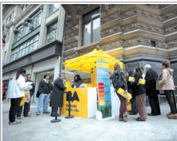
Residents wait to be subjected to a medical test of carbon monoxide in their lungs at a stand placed by the Buenos Aires city's government on the Florida pedestrian walkway, in Buenos Aires, capital of Argentina, on 31 May, 2013. The campaign was held under the framework of the World No Tobacco Day.