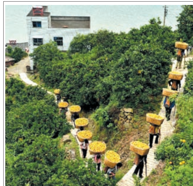
Farmers carry oranges at Chenjiawan Village of Xietao Township in Zigui County, central China's Hubei Province, on 1 June, 2013.