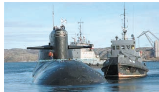
The crew of Russia's nuclear-powered submarine Yekaterinburg line up on its deck as it returns to Gadjievo base in Murmansk region, in this file photo taken on 26 Sept, 2006.

MOSCOW, 2 June—Russia plans to resume nuclear submarine patrols in the southern seas after a hiatus of more than 20 years following the break-up of the Soviet Union, Itar-Tass news agency reported on Saturday, in another example of efforts to revive Moscow's military.