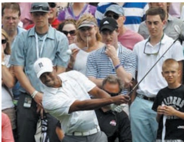
Tiger Woods of the US hits his third shot on the ninth hole during the third round of the Memorial Tournament at Muirfield Village Golf Club in Dublin, Ohio on 1 June, 2013.

Woods, a five-times winner at Muirfield Village Golf Club where he is the defending champion, once again struggled with his putting on lightning-fast greens to finish well down the leaderboard at eight-over 224. He recorded a bogey, two doubles and a triple to reach the turn in eight-over 44, his worst nine as a professional, and declined to speak to reporters after bogeying his final hole, the par-four ninth, to come home in one-under 35. Woods's 79 matched his second round score at the 2010 Quail Hol-