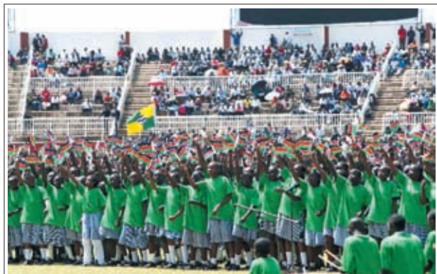
Kenyan children chorus during a military parade to celebrate the 50th Madaraka Day in Nairobi, capital of Kenya, on 1 June, 2013. Kenya formed its self-government and attained the right to manage its own affairs from British colonialists on 1 June, 1963.