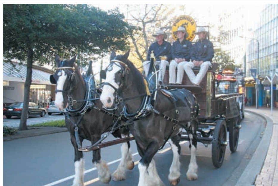
A street parade is held to celebrate the 150th birthday of the oldest department store "Kirkcaldie and Stains" in New Zealand's capital of Wellington, 1 June, 2013.