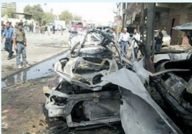
Iraqi security personnel inspect the site of a bomb attack in Baghdad, on 30 May, 2013.