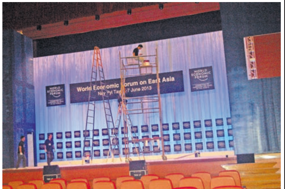
Workers prepare for 22 nd World Economic Forum on East Asia 2013 at MICC in Nay Pyi Taw.