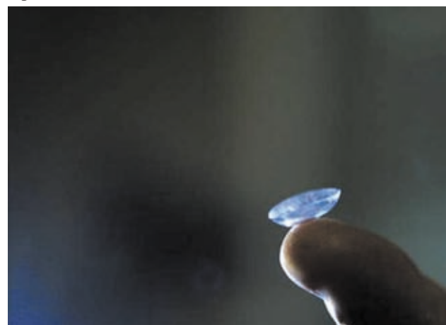
A contact lens is seen in Somerville, Massachusetts on 10 June, 2008.