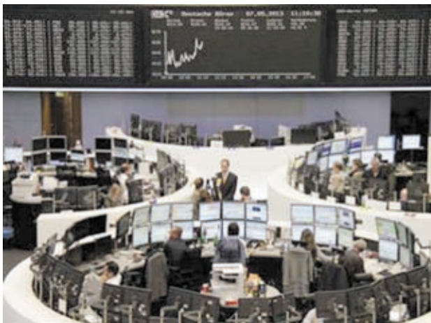
Traders work at their screens in front of the DAX board at the Frankfurt stock exchange on 7 May, 2013.

The recovery in Tokyo stocks spurred further yen selling, leaving the dollar up 1.2 percent against the Japanese currency at