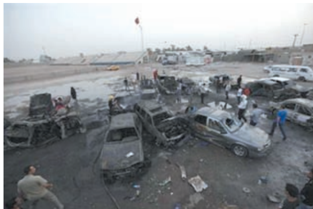
Residents gather at the site of bomb attacks in Baghdad on 27 May, 2013.

More than a dozen blasts tore into markets and shopping areas in districts