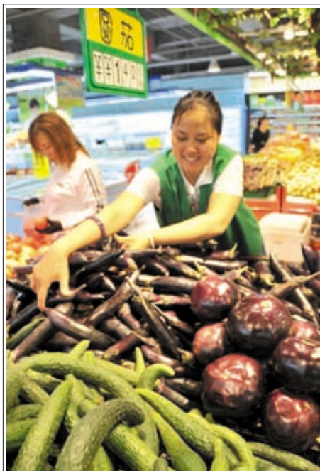
A staff member arranges vegetables at a supermarket in Xingtai, north China's Hebei Province, on 27 May, 2013. Prices of edible farm produce in 36 major Chinese cities declined for five consecutive weeks, the Ministry of Commerce said on 27 May.