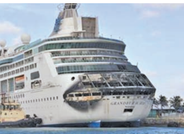
Damage on the Royal Caribbean ship Grandeur of the Seas is pictured as the ship is docked in Freeport on 27 May, 2013.— REUTERS

nesses unloaded by the Wayuu —the bulk of it legitimate — will make its way to the desert town of Maicao, a Wild West type of place that sells cheap designer perfumes and whiskey at half the retail price, alongside knock offs of Prada and Giorgio Armani label goods.— Reuters