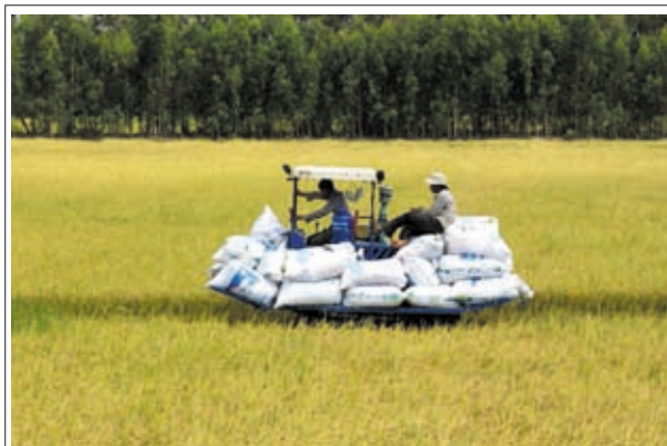
Farmers harvest the early summer-autumn rice crop in Vi Thuy District of Hau Giang Province, southern Vietnam, on 27 May, 2013. The Mekong Delta is considered as the largest rice granary in Vietnam, contributing nearly half of Vietnam's total rice output and about 90 percent of rice export volume. The Mekong Delta's total rice output is expected to reach 9.3 million tons in the 2013 summer-autumn crop, said the Ministry of Agriculture and Rural Development (MARD).

While the Central Education Council, an advisory body to the education minister, will examine the proposals, submitted to Prime Minister Shinzo Abe, they will still face challenges, such as how to secure teachers who can teach English at elementary level.—Kyodo News