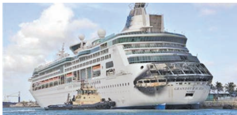
Damage on the Royal Caribbean ship Grandeur of the Seas is pictured as the ship is docked in Freeport on 27 May, 2013.

"Royal Caribbean International is deeply sorry for this unexpected development in our guests' vacation," the company said.