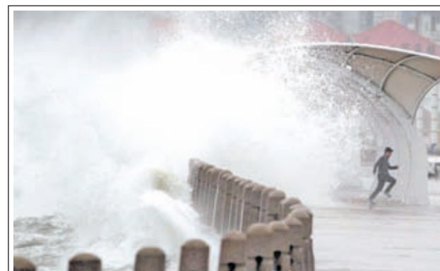
A man runs away from the wave in Yantai City, east China's Shandong Province, on 27 May, 2013. Shandong will witness frequent thunderstorms and downpours from Monday to Tuesday, according to the local meteorological authority.