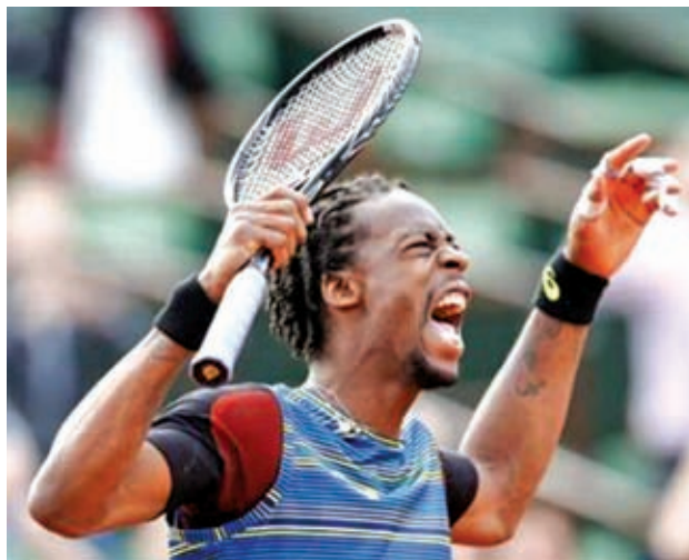
Gael Monfils of France reacts during his men's singles match against Tomas Berdych of Czech Republic at the Roland Garros stadium in Paris on 27 May, 2013.

PARIS, 28 May—Wild card Gael Monfils confirmed there is never a dull moment when he takes part in the French Open by upsetting Czech fifth seed Tomas Berdych in a first-round marathon at Roland Garros on Monday. The Frenchman, whose career has been recently plagued by a knee injury, prevailed 7-6, 6-4, 6-7, 6-7, 7-5 in front of