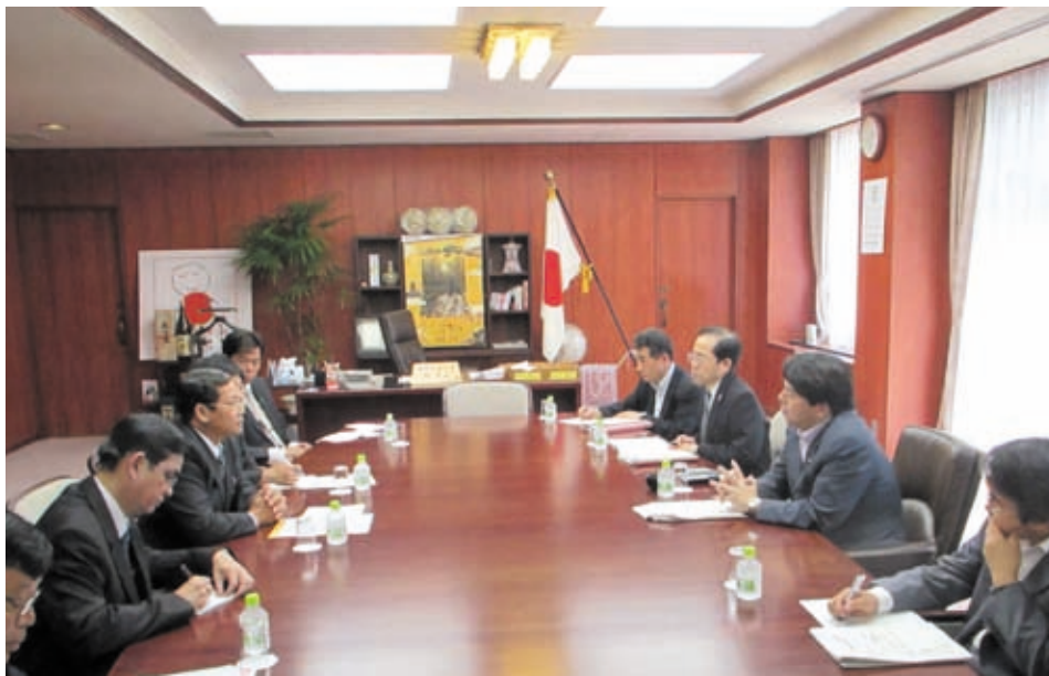
Union Minister U Myint Hlaing and party hold talks with officials from the Ministry of Agriculture, Forestry and Fisheries and Japan International Cooperation Agency (JICA).

NAY PYI TAW, 28 May—A Myanmar delegation led by Union Minister for Agriculture and Irrigation U Myint Hlaing visited Tokyo and Kyoto Cities of Japan from 20 to 27 May. They met officials from the Ministry of Agriculture, Forestry and Fisheries and Japan International Cooperation Agency (JICA) and held talks on development of agricultural sector and ground observations.