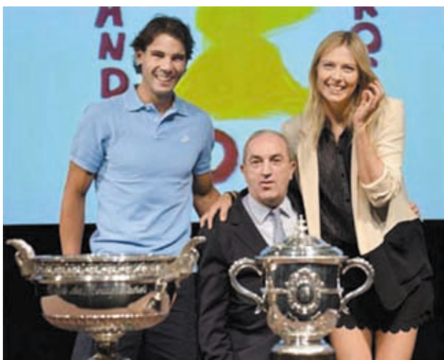
Seven-time champion Rafael Nadal and women's title holder Maria Sharapova