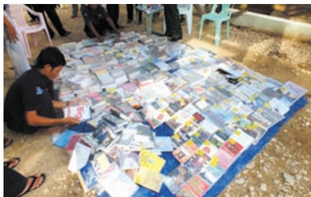
Photo shows books on various subjects including books on making arms in English version.