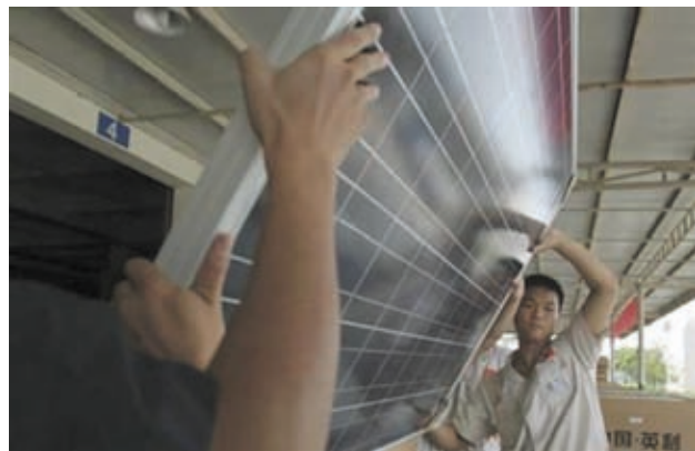
Employees examine newly-made solar panels before boxing for shipment at a factory of Yingli Solar in Baoding, Hebei Province on 2 Aug, 2012.

BRUSSELS, 28 May —A majority of EU governments oppose a plan to impose hefty duties on solar panel imports from China, a survey of member states showed on Monday, undermining efforts by Brussels to pressure Beijing over its trade practices. The European Commission, the EU’s executive, accuses Chinese firms of selling solar panels at below cost in