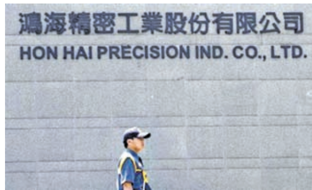
A security guard patrols at Hong Hai headquarters in Tucheng, Taipei county, on 8 June, 2010.— REUTERS

Congress in February that it was working with manufacturers Alcatel (TCL Communication Technology), LG Electronics and ZTE Corp to build the first Firefox OS devices, with Huawei Technologies to follow later in the year, all powered by the Qualcomm Snapdragon mobile processors.— Reuters