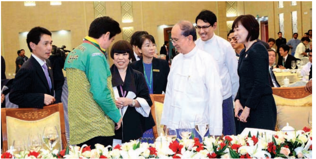
Photo shows Japanese Prime Minister Mr. Shinzo Abe wearing sportswear donated by Japan for the XXVII SEA Games at luncheon on 26 May in Nay Pyi Taw.

She was appointed as an Ambassador for Tourism of Japan on 2008.