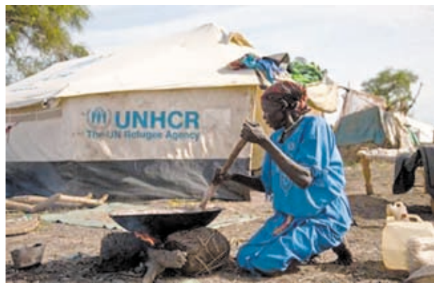
A woman prepares food in Jamam refugee camp in Upper Nile, South Sudan, on 2 July, 2012.