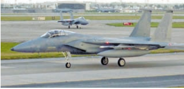
File photo shows an F-15 fighter jet at the US Kadena Air Base in Okinawa Prefecture in February 2010. The Japanese government received information that an F-15 plunged into waters east of the southwestern Japan island prefecture on 28 May, 2013. There were no casualties in the incident.

Local residents voiced concerns as the crash was not the first of its kind in Okinawa, which is home to the bulk of US bases in