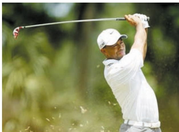
Tiger Woods of the US tees off on the second hole during the third round of The Players Championship PGA golf tournament at TPC Sawgrass in Ponte Vedra Beach, Florida on 11 May, 2013.