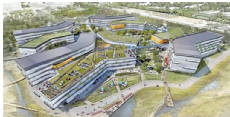
The proposed Google corporate headquarters in Mountain View, California, is pictured in this artist's rendering courtesy of NBBJ.