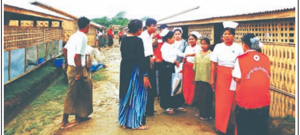
Health Department of Sittway Township provides healthcare services to victims at relief camps in the township.

The department says it will continue to provide healthcare services to all the victims regardless of race or religion.—Myanma Alinn