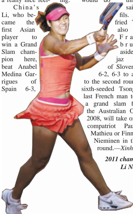
2011 champion Li Na

"There was the adrenaline and the match and the crowd, but I didn't think I would do this well," said Monfils. Jo-Wilfried Tsonga, also from France, brushed aside Aljaz Bedene of Slovenia 6-2, 6-2, 6-3 to advance to the second round. The sixth-seeded Tsonga, the last French man to reach a grand slam final at the Australian Open in 2008, will take on either compatriot Paul-Henri Mathieu or Finn Jarkko Nieminen in the next round.—Xinhua