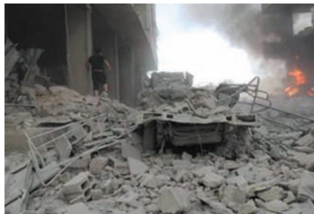
A civilian walks on rubble as he inspects the damage after what activists said was shelling by forces loyal to Syria’s President Bashar al-Assad in Arbaeen, near Damascus, on 23 May, 2013.

They describe men coughing violently, their eyes burning, their pupils shrinking.