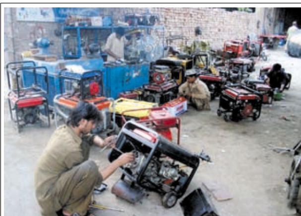
Workers repair electric generators at a workshop in Peshawar, northwest Pakistan, on 26 May, 2013. Power shortfall across the country has reached over 5,500 megawatts.