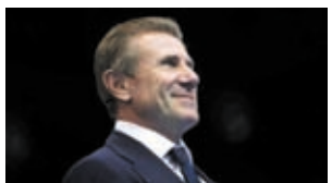
Retired Ukrainian pole vaulter Sergey Bubka

squandered a 2-0 series lead in last season's West finals, San Antonio were determined to finish the job this time around. The veteran squad took a 24-14 lead after the first quarter and did not blink when the Grizzlies made a late push.—Reuters