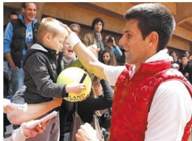
Novak Djokovic of Serbia signs autographs after a training session for the French Open tennis tournament at the Roland Garros stadium in Paris on 25 May, 2013.