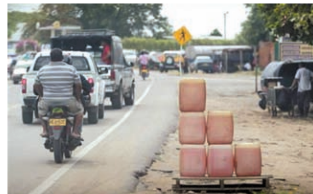
Motorists drive past containers of smuggled petrol placed along a roadside in Maicao, near La Guajira region, which is closed to the border with Venezuela on 15 Aug, 2012.