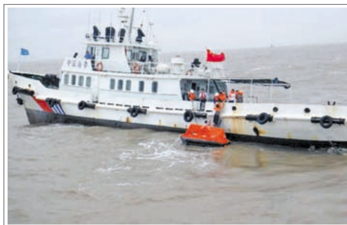
Workers of the Zhoushan Maritime Safety Administration rescue the sailors on an overturned cargo ship in Zhoushan, east China's Zhejiang Province, on 28 May, 2013. Altogether 9 people on the ship were rescued and one was missing after the three-hour rescue.

Australia also performed well in the areas of civic engagement, with a strong sense of community and high levels of civic participation, and health, having achieved "remarkable progress" in reducing the number of smokers in the population.—Xinhua