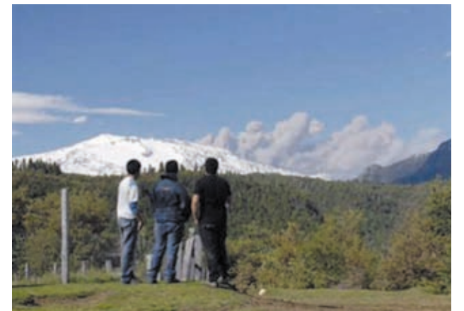
Smoke and ash rising from the Copahue volcano are seen from “Alto Biobio” place some 770 km (479 miles) southwest of Santiago in this 22 Dec, 2012 file picture.