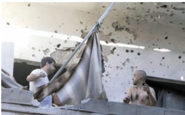
Two men inspect their damage house after two rockets hit their area in a Beirut suburbs on 26 May, 2013. Two rockets hit a Hezbollah-controlled district in the southern part of Lebanon's capital on Saturday, residents said, wounding several people.

Whether the exiled Syrian civilian opposition will take part in the envisaged peace talks — and be able to negotiate effectively, given their internal