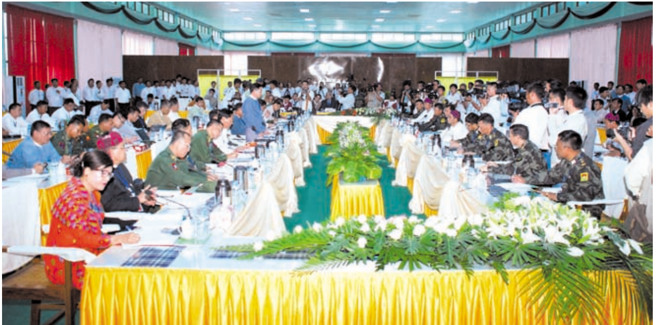
Peace talks between Union Peace-making Work Committee and KIO delegation in progress.

the two sides, thereby moving towards a perpetual peace inspired by the entire people.