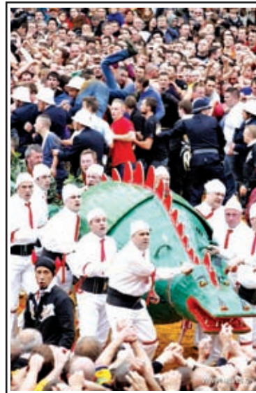
People attend the Ducasse de Mons or Doudou celebration in Mons, Belgium, on 26 May, 2013. The popular festival, originating in the Middle Ages and depicting the combat between Saint George and a dragon, is recognized by UNESCO as one of the Masterpieces of the Oral and Intangible Heritage of Humanity.