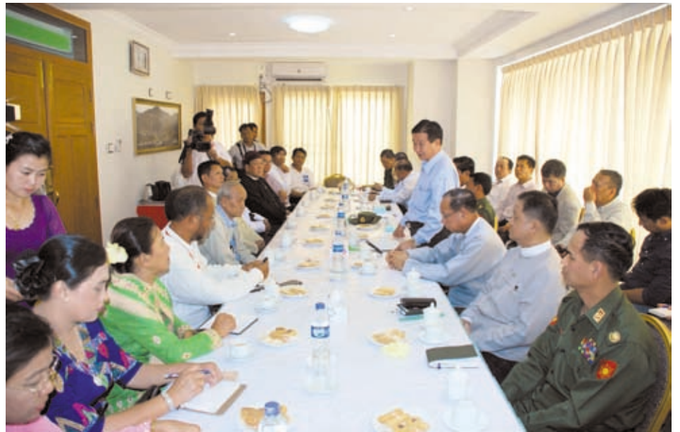
Union Minister U Aung Min and party meet townselders, local people.—MNA

Moreover, the Myanmar delegation visited the Central Officials Training Institute, Gyeongbokgung Palace, Jogyesa Temple, Cheongwadae Presidential Office (Blue House) and Sooam Biotech Research Foundation in Seoul.—MNA