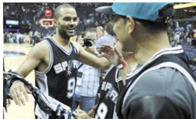
San Antonio Spurs' Tony Parker (L) celebrates after the Spurs eliminated the Memphis Grizzlies to win the NBA Western Conference final playoff basketball series in Memphis, Tennessee on 27 May, 2013.

San Antonio has earned an extended rest period as they now await the winner between Miami and Indiana in the East for a championship matchup that does not begin until 6 June. Having