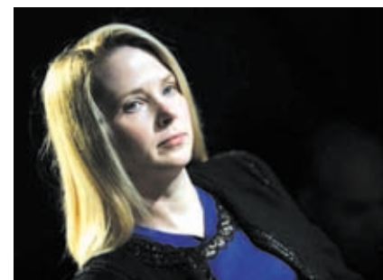
Yahoo Inc Chief Executive Marissa Mayer attends the annual meeting of the World Economic Forum (WEF) in Davos on 25 Jan, 2013.

Yahoo just this week announced a $1.1 billion acquisition of blogging service Tumblr. It now joins rival bidders for Hulu, including Time Warner Ca-