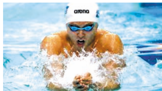
Former Olympic champion Kosuke Kitajima

Hagino made Japanese swimming history when he became the first swimmer to win five titles at the nationals. In women's action, Aya Terakawa took the 100 backstroke in 59.50, Natsumi Hoshi prevailed in the