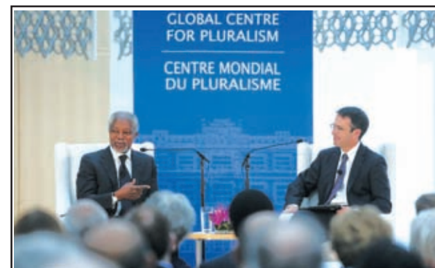
Former UN secretary-general Kofi Annan (L) speaks at the Global Centre for Pluralism in Ottawa, Canada, on 23 May, 2013. All countries must play a role in promoting pluralism and diversity to deliver peace, security and prosperity in the 21st century, says Annan.