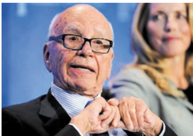
Chairman and CEO of News Corporation Rupert Murdoch talks next to Laurene Powell Jobs (R), founder of Emerson Collective and widow of the late Apple founder Steve Jobs, as they take part in a panel discussion titled "Immigration Strategy for the Borderless Economy" at the Milken Institute Global Conference in Beverly Hills, California on 29 April, 2013.

NEW YORK, 25 May—News Corp said on Friday it will write down the value of