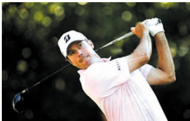
Matt Kuchar of the US tees off on the 11th hole during the second round of The Players Championship PGA golf tournament at TPC Sawgrass in Ponte Vedra Beach, Florida on 10 May, 2013.