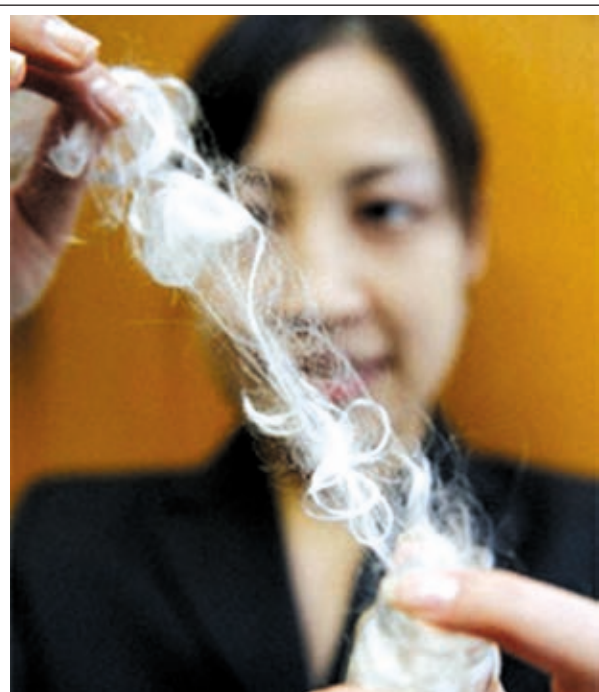
A woman in Tokyo on 24 May, 2013, holds artificially produced spider silk made by Japanese bioventure Spiber Inc. The company based in Tsuruoka in Yamagata Prefecture, northeastern Japan, said it has developed technology to mass-produce artificial spider silk for the first time.