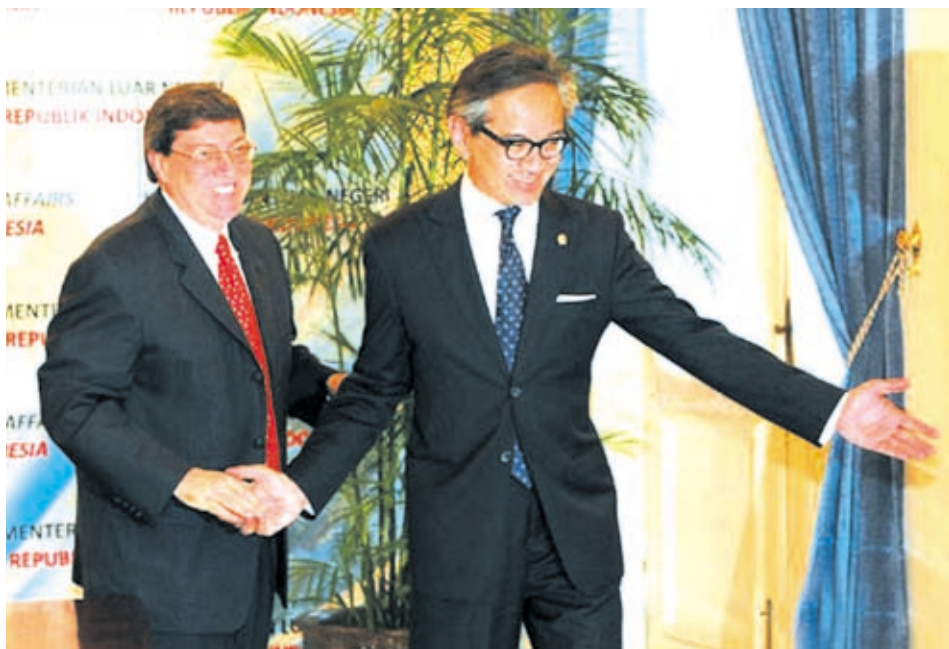
The visiting Cuban Foreign Minister Bruno Rodriguez Parrilla (L) meets with his Indonesian counterpart Marty Natalagawa in Jakarta, Indonesia, on 24 May, 2013.