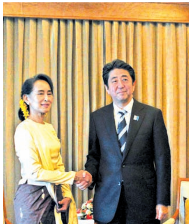
Japanese Prime Minister Mr. Shinzo Abe shakes hands with Chairperson of NLD Daw Aung San Suu Kyi.