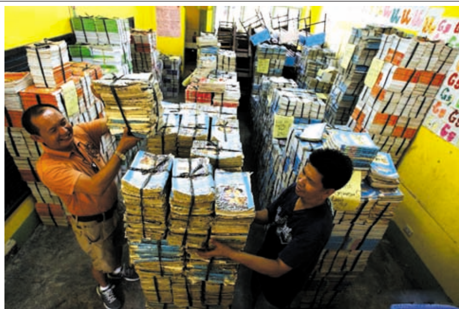
Teachers stack books to be distributed for the coming school year students in Bagong Silangan Elementary School in Quezon city, Philippines, on 24 May, 2013. The Department of Education (DepEd) of the Philippines is expecting around 23.8 million students to go into public and private elementary and high schools nationwide for the school year 2013-2014 that starts on 3 June.

Eight political parties will run in the forthcoming election, which will be voted by some 9.67 million eligible Cambodians, according to the National Election Committee. Three major parties among them are the ruling Cambodian People’s Party of Prime Minister Hun Sen, the main opposition Cambodia National Rescue Party led by self-exiled leader Sam Rainsy, and the royalist Funcinpec Party headed by Princess Norodom Arun Rasmey, the youngest daughter of late King Father Norodom Sihanouk.