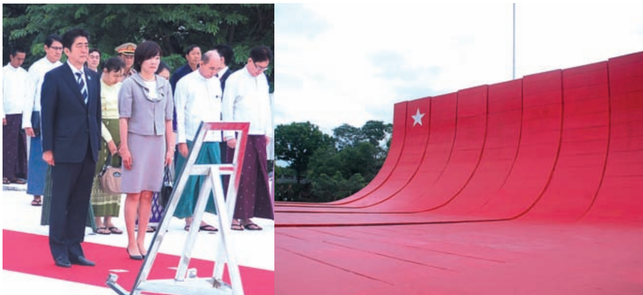
Japanese Prime Minister Mr Shinzo Abe and wife Mrs Akie Abe pay tribute to General Aung San and fallen martyrs at Martyrs' Mausoleum.