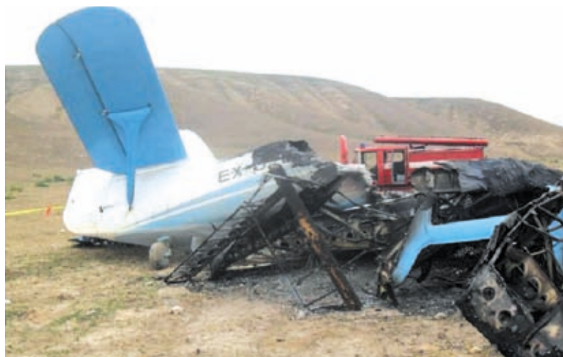
Photo taken on 24 May, 2013 shows the wreckage of an AN-2 plane crashed in Jalal-Abad region, Kyrgyzstan. The aircraft crashed here on Friday, killing three.