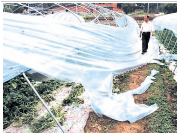
A farmer checks the greenhouses damaged by the hail in Yun County, Shiyan City, central China's Hubei Province, on 23 May, 2013. Hail and heavy rainfall hit Shiyan on 22 May, leaving 85,000 people in 15 townships and villages affected.