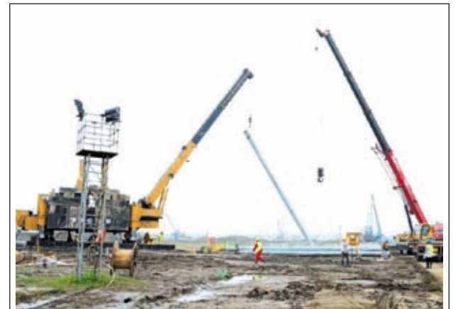
Builders lay the foundations of a castle at the Shanghai Disney Resort in Shanghai, east China, on 24 May, 2013. Intended to open at the end of 2015, the resort will initially be comprised of Shanghai Disneyland, a Magic-Kingdom-style park as well as two themed hotels, a large retail, dining and entertainment venue, recreational facilities, a lake and transportation hubs. Covering an area of 1.16 square km, the theme park inside the 3.9-square-km Shanghai Disney Resort will be the world's sixth Disney amusement park and the first on the Chinese Mainland.

Indonesia's exports rubber products, plastics, electronics, footwear and office equipment to Cuba. Meanwhile its import from the latter consists of vaccine and cigars.