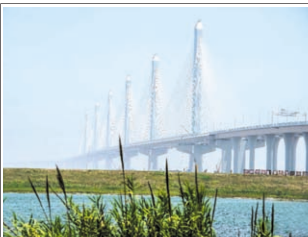
The construction of the main towers of the Jiaxing-Shaoxing Sea-crossing Bridge is finished in Shaoxing, east China’s Zhejiang Province, on 24 May, 2013. The bridge is expected to be open to traffic by the end of June this year. It will halve the driving time from Shaoxing to Shanghai in east China after it is finished.

Singh’s visit to Japan will be reciprocated by a rare gesture by the Japanese Emperor and Empress, who would for the first time visit India at the end of this year, they added.—Xinhua