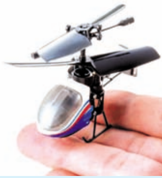
Japanese online retailer will release the world's smallest infrared remote-control helicopter. The tiny helicopter has been named Nano-Falcon and measures just 65mm in length while weighing a mere 11 grams.