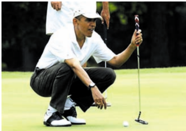
US President Barack Obama lines up a putt on the first green at Andrews Air Force Base in Maryland, on 18 June, 2011.

NEW YORK, 25 May—President Barack Obama has accepted an invitation to be honorary chairman of this year's Presidents Cup, the second time he will fulfil the role at the biennial team competition, the PGA Tour said on Friday. Obama, an avid basketball player who often escapes the pressures of the Oval Office by taking to the golf course, served as honorary chairman when the event was last played in the United States, at San Francisco's Harding Park in 2009.