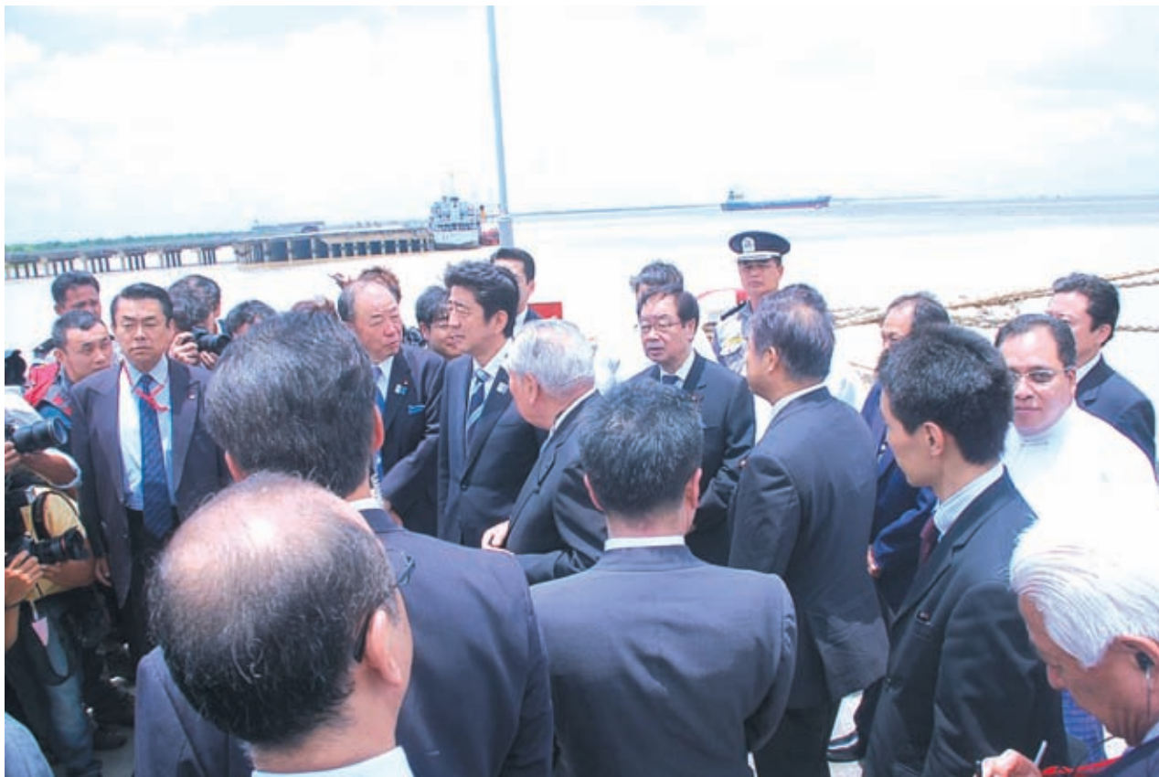
Japanese Prime Minister Mr. Shinzo Abe visits Thilawa Port.