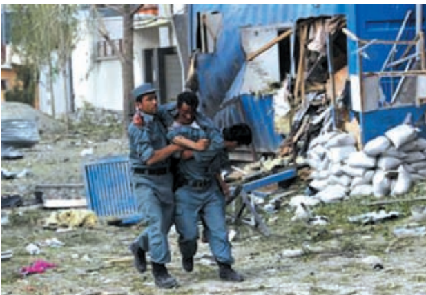
A wounded Afghan policeman (C) is helped away from the site of an explosion in Kabul on 24 May 2013. Several large explosions rocked a busy area in the centre of the Afghan capital, Kabul, on Friday with Reuters witnesses describing shooting in the area.

There were at least four large blasts during the