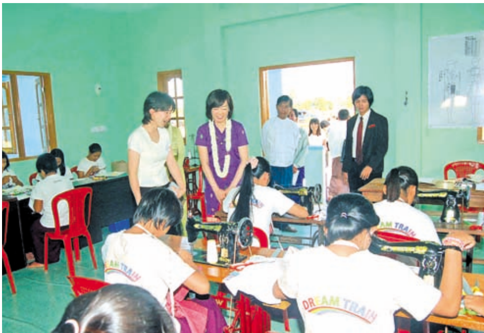
Mrs Akie Abe, wife of Japanese Prime Minister, views orphans receiving vocational training at Dream Train Orphanage.—MNA

Continuation of thundery activities in the Central Myanmar areas.—NLM