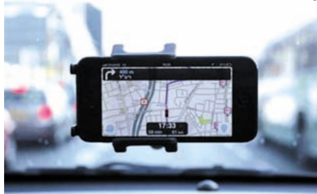
Waze, an Israeli mobile satellite navigation application, is seen on a smartphone in this photo illustration taken in Tel Aviv on 9 May, 2013.—REUTERS

Due diligence between Waze and Facebook had been under way and a term sheet signed after six months of discussions, Israeli business daily Calcalist reported this month.—Reuters