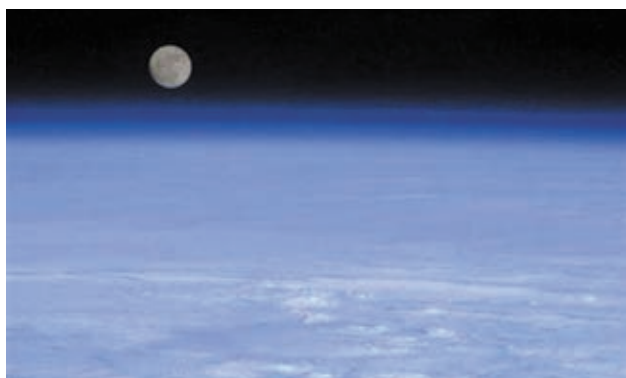
The moon is pictured above Earth in this handout photo courtesy of Col. Chris Hadfield of the Canadian Space Agency.—REUTERS