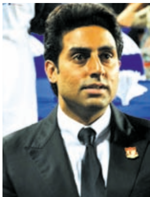
Abhishek Bachchan is an avid football fan.

Abhishek believes the Indian team will be able to make it through with hard work and determination. “I am a big football fan and I have a small dream that India’s national football team should qualify for the next world cup finals,” Abhishek told reporters here on Thursday at the Indian Football Awards 2013, where he was accompanied by football player Bhairu Chhang Bhutia.