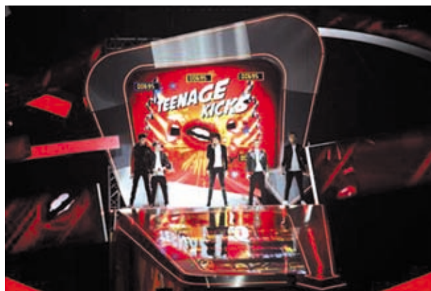
British pop band One Direction perform during the BRIT Awards, celebrating British pop music, at the O2 Arena in London on 20 Feb, 2013.—REUTERS

The awards highlight viral sensations and people who garner the most social media attention globally based on data from Singapore-based Starcount that tracks the social media activity of 1.7 billion people across 11 social media networks.—Reuters