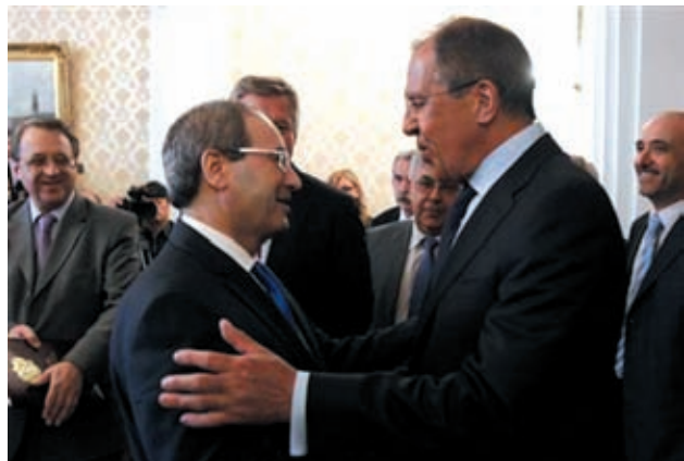
Russia's Foreign Minister Sergei Lavrov (R) welcomes Syria's Deputy Foreign Minister Faisal Mekdad during a meeting in Moscow, on 22 May 2013.

Moscow, 25 May— US Secretary of State John Kerry and Russian Foreign Minister Sergei Lavrov spoke by phone on Friday to discuss efforts to bring Syria's warring parties to a peace conference, the Russian Foreign Ministry said.