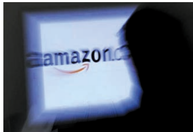
A zoomed illustration image of a man looking at a computer monitor showing the logo of Amazon is seen in Vienna on 26 Nov, 2012.

director of military satellite communications at Los Angeles Air Force Base, said during a launch webcast.