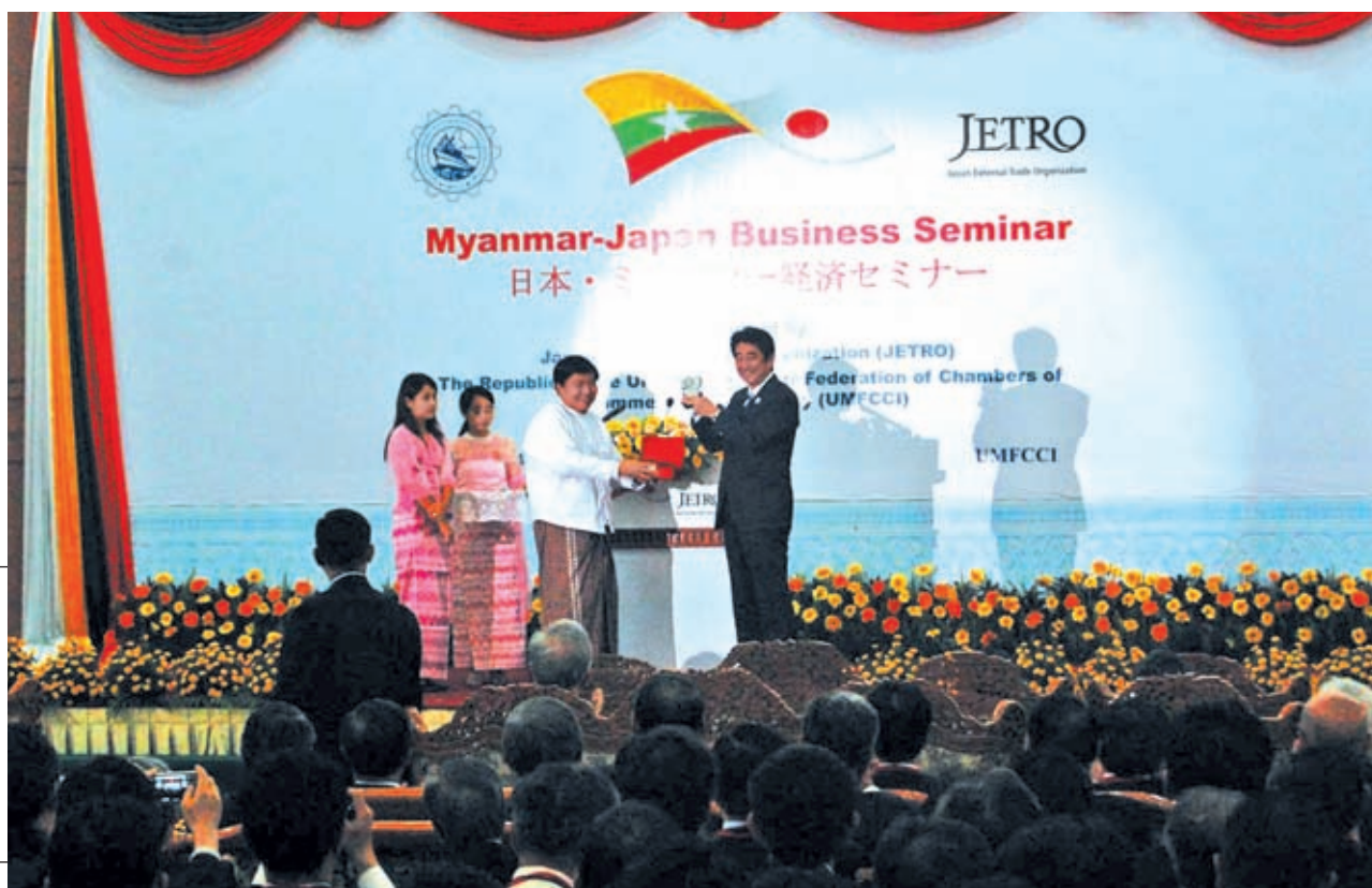
UMFCCI President U Win Aung presents gifts to Japanese Prime Minister Mr. Shinzo Abe at Myanmar-Japan Business Seminar at UMFCCI building.

Next, the Japanese Prime Minister met Chairperson of National League for Democracy (NLD) Daw Aung San Suu Kyi at Chatrium Hotel at 4.30 pm.—MNA