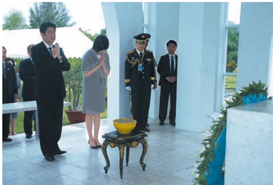
Japanese Prime Minister Mr Shinzo Abe and wife Mrs Akie Abe pay tribute at Japanese Cemetery in Yeway in North Okkalapa Township.—MNA

International Terminal Port (Thilawa). Yangon Region Chief Minister U Myint Swe and wife Daw Khin Thet Htay hosted a luncheon to the Japanese PM and wife at Kandawgyi Palace.—MNA