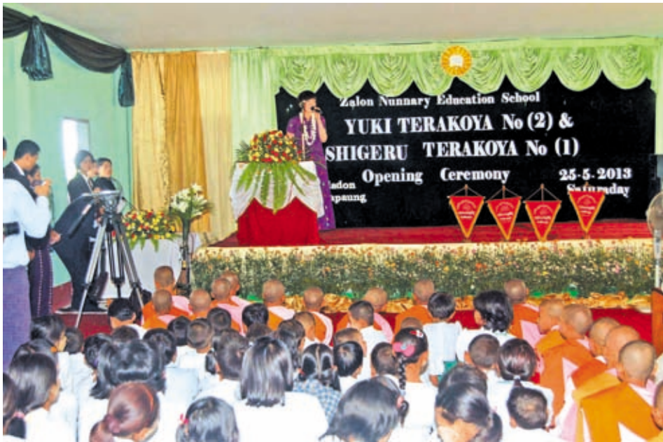
Mrs Akie Abe, wife of Japanese Prime Minister, delivers an address at ceremony to present certificate of honour to two Japanese wellwishers at Zalun Nunnery in Mingaladon Township.

NAY PYI TAW, 25 May — Mrs Akie Abe, wife of Japanese Prime Minister, attended a presentation ceremony of certificate of honour to two Japanese wellwishers at Zalun Nunnery in Mingaladon Township in Yangon this morning.