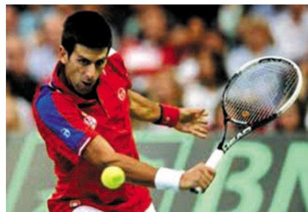
Novak Djokovic of Serbia