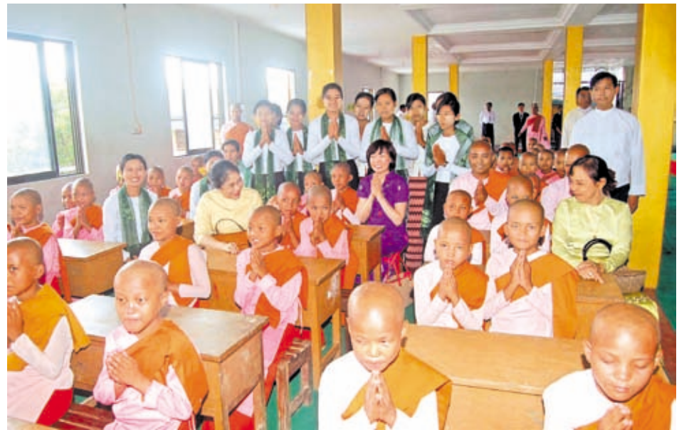
Mrs Akie Abe, wife of Japanese Prime Minister, poses for documentary photo together with nuns at Myaing Nunnery in Shwepyitha Township.