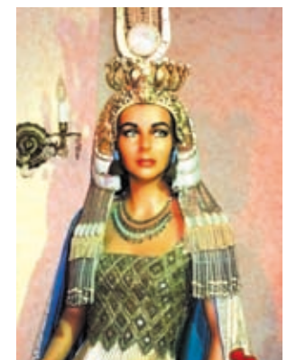
A security guard walks past an image of Elizabeth Taylor

LONDON, 25 May —The wedding dress worn by film star Elizabeth Taylor for her first marriage to hotel heir Conrad Hilton in 1950 will go up for sale next month, auction house Christie’s said on Friday.