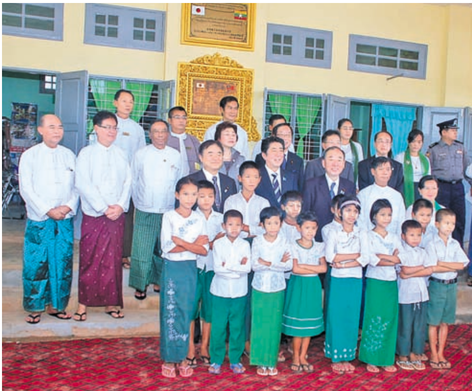
Japanese PM Mr Shinzo Abe and party pose for documentary photo with headmistress and students of Letyetsan Post Primary School in Thanlyin Township.