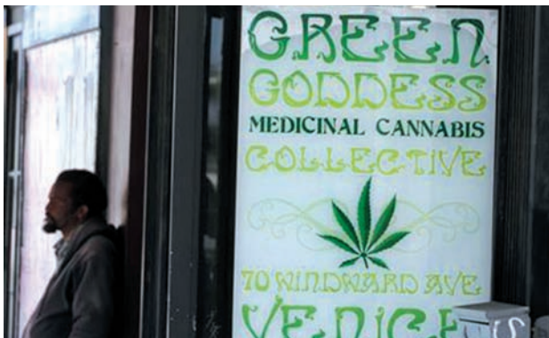
A man stands in front of a medical marijuana dispensary in Los Angeles, California, on 24 July, 2012.

Two rival measures seemed likely to be defeated, with "no" votes far surpassing "yes" votes for each. At least 800 storefront medical cannabis shops are estimated to be operating in Los Angeles, more than in any other US city, and some residents have complained that the dispensaries are a blight on their