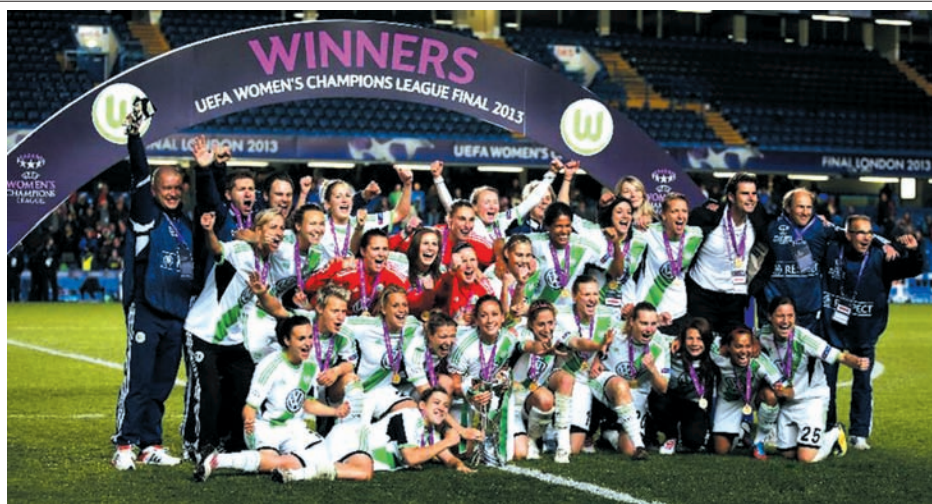
Members of German club Wolfsburg celebrate during the awarding ceremony for the UEFA Women's Champions League after the final match between Wolfsburg and Olympique Lyonnais in London, Britain, on 23 May, 2013. Wolfsburg won the match 1-0 and claimed the title.