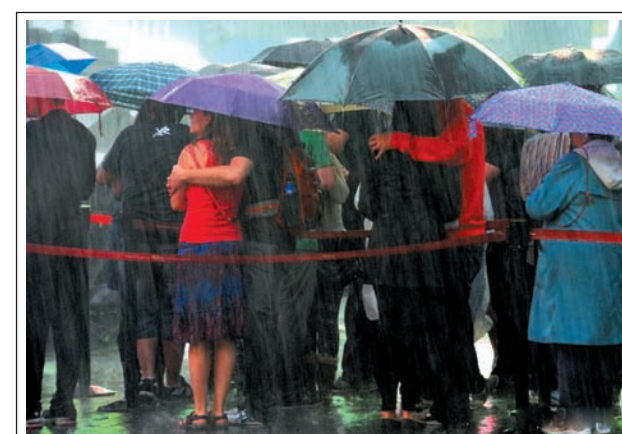
People queue up for Broadway shows tickets in rain at the Times Square in midtown Manhattan, on 23 May, 2013. In its 2013 Atlantic hurricane season outlook issued today, the US National Oceanic and Atmospheric Administration (NOAA) Climate Prediction Centre is forecasting an active or extremely active season this year with a 70 percent likelihood of 13 to 20 named storms (winds of 39 mph or higher), of which 7 to 11 could become hurricanes, including 3 to 6 major hurricanes during the six-month hurricane season beginning on 1 June.

with H7N9. Fifty-one positive samples were from 18 live poultry markets in Shanghai, Anhui, Zhejiang, Jiangsu, Henan, Shandong, Guangdong, Jiangxi and Fujian, the MOA said in a statement.