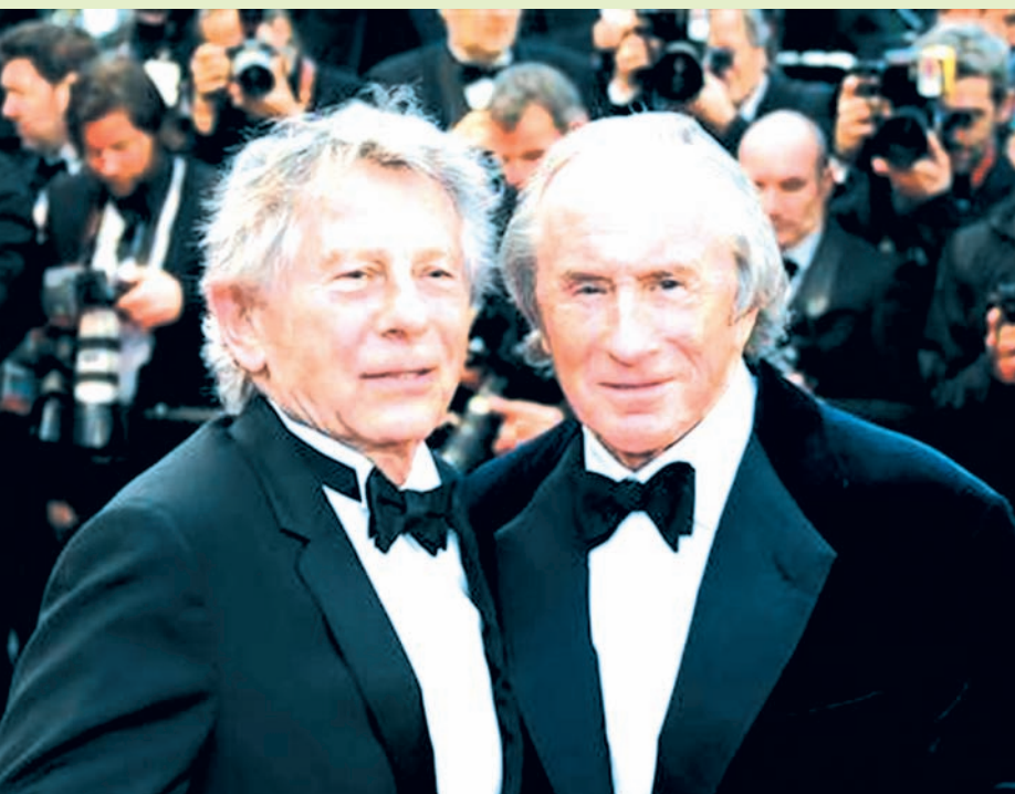
Director Roman Polanski (L) and former Formula One champion driver Jackie Stewart of Britain pose on the red carpet as they arrive for the screening of the film "All is Lost" during the 66th Cannes Film Festival in Cannes on 22 May, 2013.