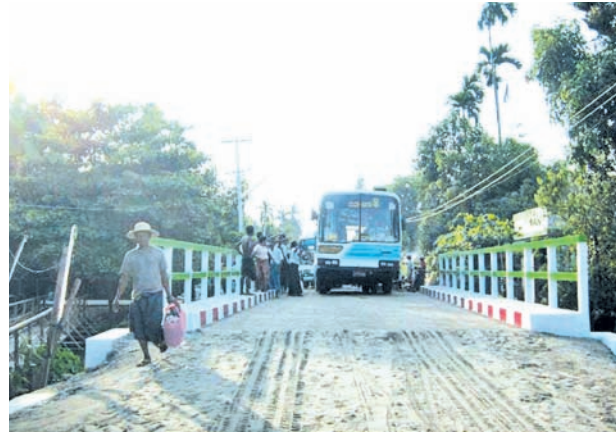
Photo shows newly-built Kyaiklat Pagoda Creek Bridge.

PYAPON, 24 May— Highway in Kyaiklat Township, Pyapon District Bridge on Pyapon-Yangon in Ayeyawady Region on