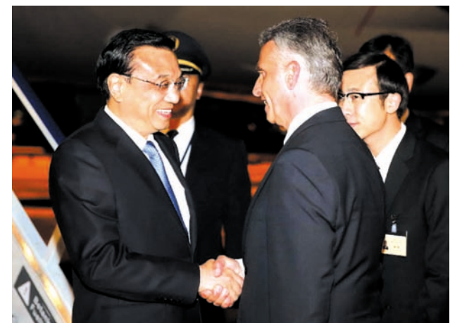
Chinese Premier Li Keqiang (L, front) is welcomed by Swiss Vice President and Foreign Minister Didier Burkhalter, upon his arrival in Zurich, Switzerland, on 23 May, 2013. Li Keqiang arrived here on Thursday evening for an official visit to Switzerland.