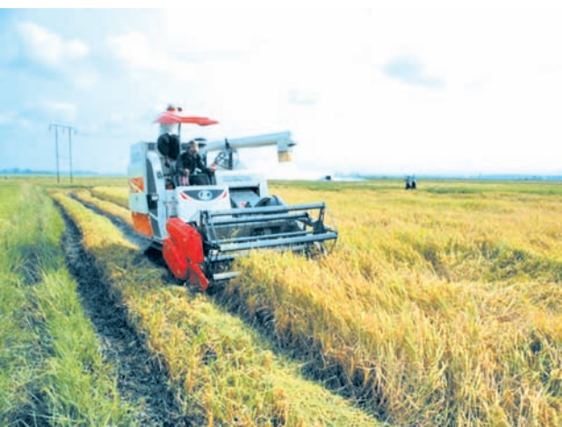
YEDASHE, 24 May— Farmers within the irrigation area of Swa Creek Dam in Yedashe Township in Bago