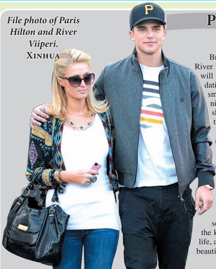
File photo of Paris Hilton and River Viiperi.