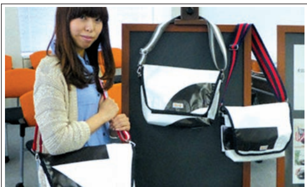
A woman poses with bags recycled from banners that had been put up on expressways during an event in Nagoya on 22 May, 2013. The products are sold by Central Nippon Expressway Co.—KYODO NEWS

Germany is the fourth largest tourism market in Europe for Mexico, behind Britain, Spain and France, according to the Integral System of Migratory Operation. The number of German visitors to Mexico in 2012 reached 172,841, an increase of 4.7 percent year-on-year.—Xinhua