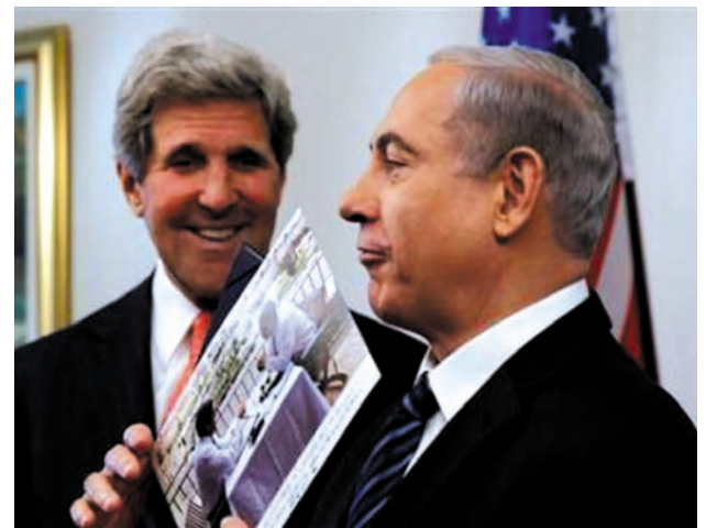
Israeli Prime Minister Benjamin Netanyahu (R) shows a present given to him by US Secretary of State John Kerry in Jerusalem on 23 May, 2013.

"It's something I hope the Palestinians want as well and we ought to be successful for a simple reason—when there's a will, we'll find a way," Netanyahu said.—Reuters