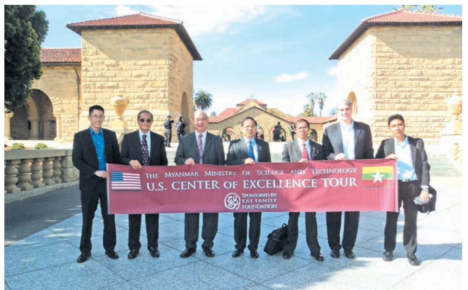
Union Minister for Science and Technology Dr Ko Ko Oo visits Centres of Excellence in western coastal areas in US.

the Union minister discussed with them cooperating in teaching and research sectors to upgrade Yangon Technological University, Mandalay Technological University, Yangon University of Computer Studies and Mandalay University of Computer Studies.