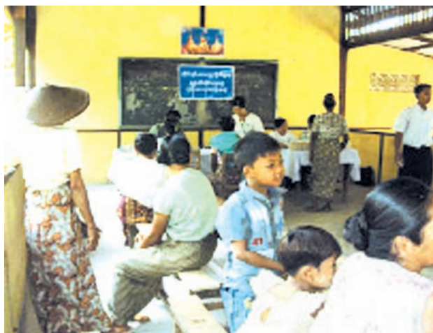
Free healthcare is provided to local people in Cheyardaw village in Monywa Township.