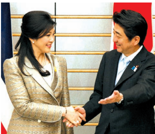
Japanese Prime Minister Shinzo Abe (R) shakes hands with his Thai counterpart Yingluck Shinawatra ahead of their talks at his office in Tokyo on 23 May, 2013.