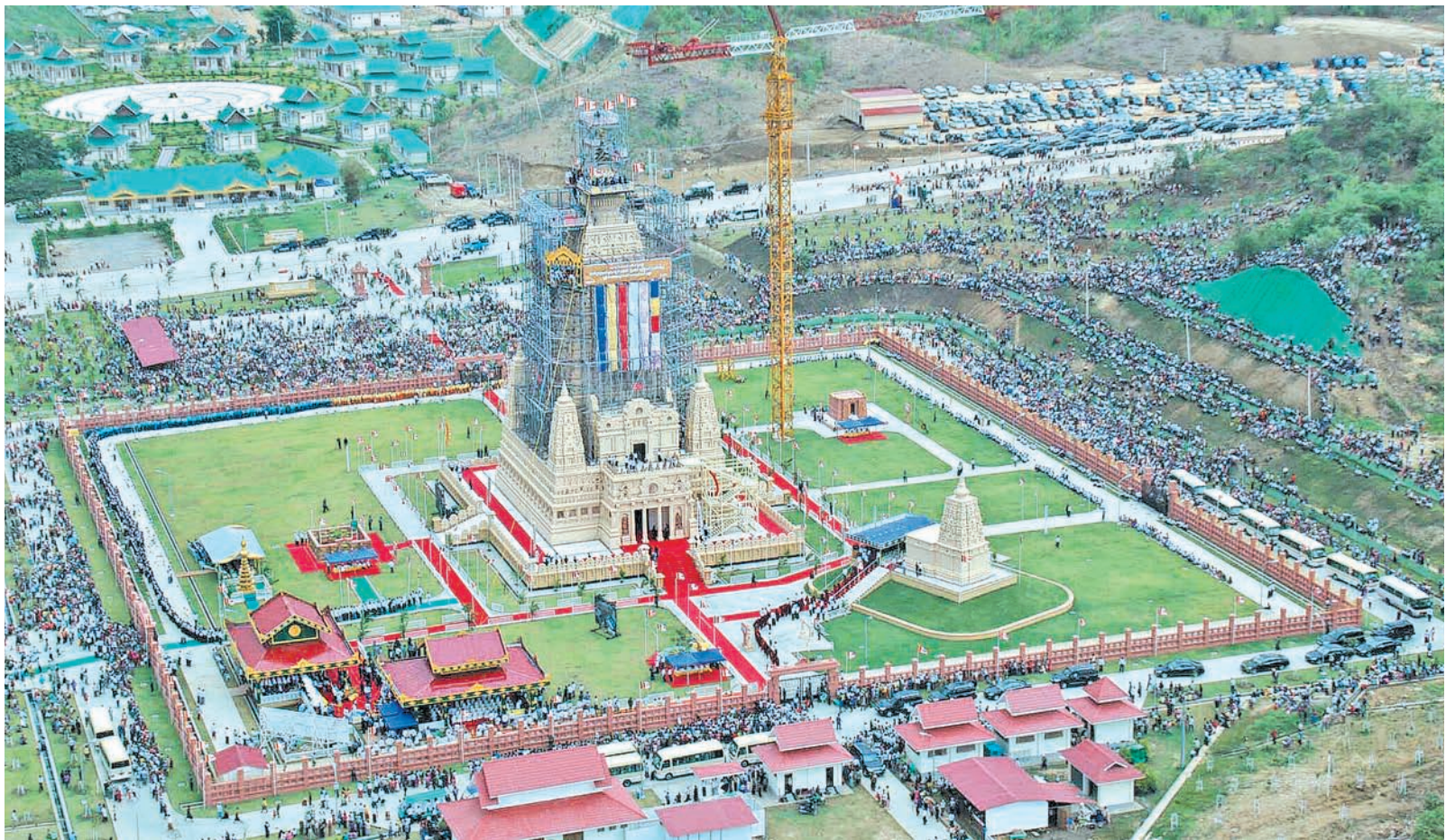
Thatta Thattaha Maha Bodhi Pagoda. (News on page 1)