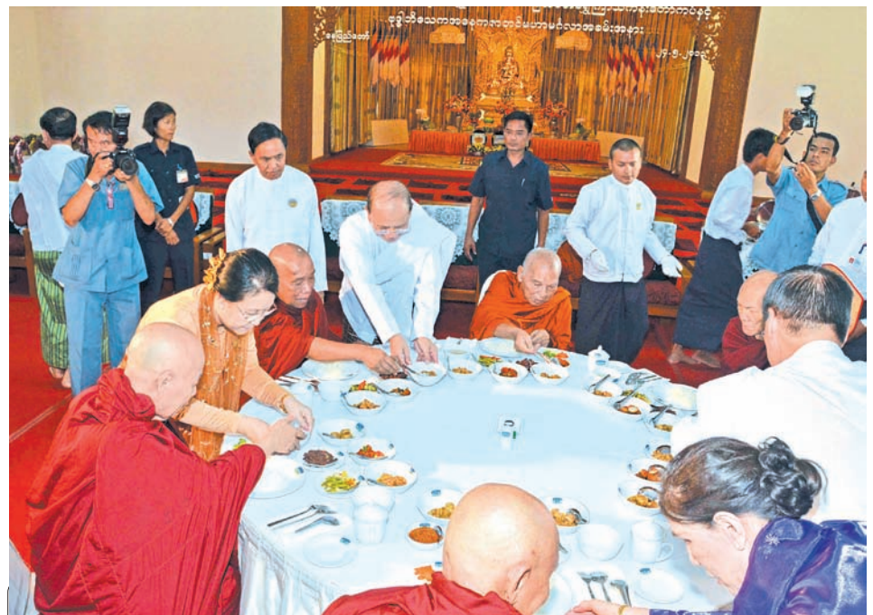
President U Thein Sein and wife Daw Khin Khin Win offer meals to members of Sangha at opening ceremony of Thatta Thattaha Maha Bodhi Pagoda.