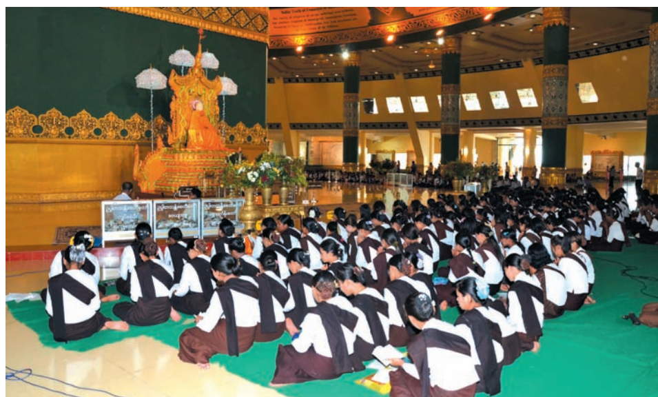
Devotees recite religious verses at the Uppatasanti pagoda on the Fullmoon Day of Kason.—MNA

All the pagodas in Zabuthiri Township and Pynmana are packed with Buddhist devotees reciting religious verses, doing meditation and pouring water on Bo trees.—MNA