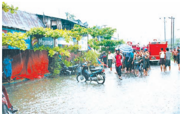
Fire engines rush to put out fire in a restaurant in Bago's Shwemawdaw Pagoda street.