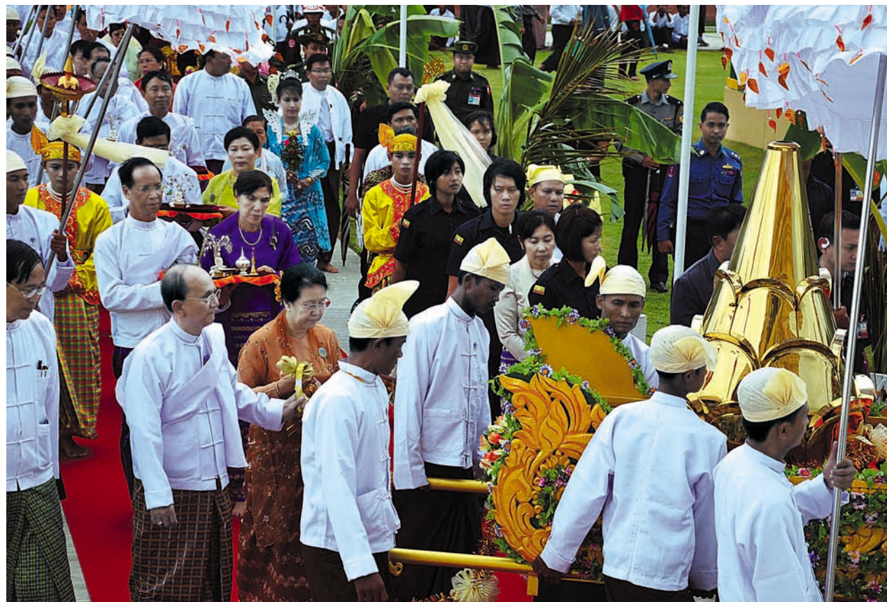
President U Thein Sein and wife Daw Khin Khin Win convey umbrella to be hoisted atop Thatta Thattaha Maha Bodhi Pagoda.

Next, the President and wife performed rituals of golden and (See page 8)