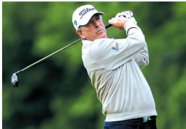
American Jay Haas

Just trying to hit the fairways was my first key and I did that a lot today." A special bonus for Haas was