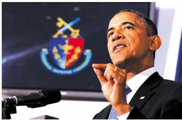
US President Barack Obama makes a point about his administration’s counter-terrorism policy at the National Defence University at Fort McNair in Washington, on 23 May, 2013.

While combating terrorism is still a high priority for the White House, polls show by large margins that Americans’ main concerns are the economy and healthcare.