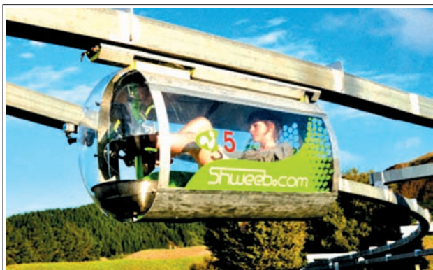
A tourist rides an attraction using Shweeb, a futuristic transportation system, at an amusement park in Rotorua, New Zealand, in April 2013. Google Inc. selected Shweeb in 2010 as among projects to invest in as ideas for change.