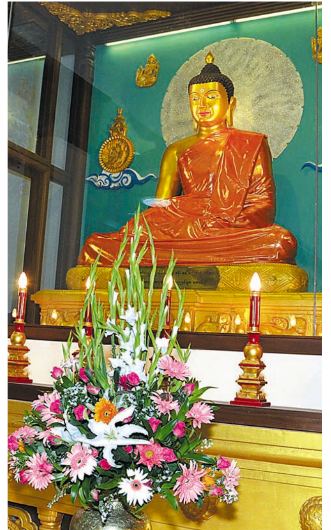
President U Thein Sein and party attend consecration ceremony of Thatta Thattaha Maha Bodhi Pagoda on Fullmoon Day of Kason.