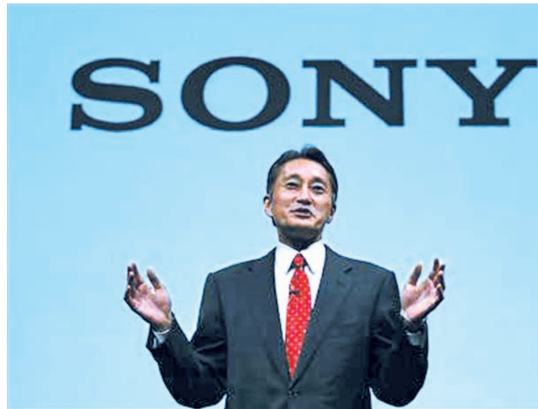
Sony Corp’s President and Chief Executive Officer Kazuo Hirai speaks during the Sony Corporate Strategy Meeting at the company’s headquarters in Tokyo on 22 May, 2013.

the revival of our electronics business remains our task,” Hirai said, pointing to strong demand for Sony’s new Xperia smartphone and mirrorless interchangeable lens cameras. He said Sony was keeping to its strategy to revive the struggling business around cameras and mobile and PlayStation gaming devices.—Reuters