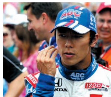
AJ Foyt Enterprises driver Takuma Sato of Japan walks down pit lane after qualifying for the Indianapolis 500 at the Indianapolis Motor Speedway in, Indiana, on 18 May, 2013.

INDIANAPOLIS, 24 May — They are the Indianapolis 500's odd couple. Crusty team owner AJ Foyt, a 78-year old American motor racing legend and his driv-