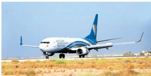
Sultanate of Oman's state-run flag carrier Oman Air

PARIS, 24 May—European aircraft manufacturer Airbus said on Wednesday it has won a new order of