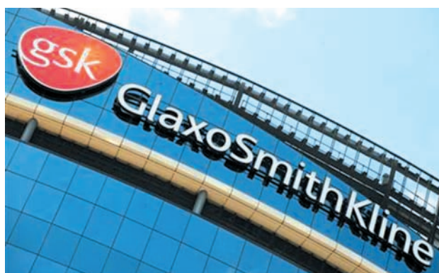
Signage is pictured on the company headquarters of GlaxoSmithKline in west London on 21 July, 2008. GlaxoSmithKline announce their half yearly results on Wednesday on 23 July.

The Prudential Regulation Authority said it would release more information when it had concluded discussions with all banks, including, where necessary, if banks need to take steps to meet any shortfalls. Lloyds and RBS each said on Wednesday they did not need to issue more equity, and would meet extra capital needs by selling assets and through retained earnings and restructuring plans that are underway.—Reuters