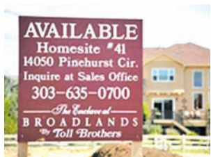
A vacant lot owned by Toll Brothers is shown for sale in a housing development in Broomfield, Colorado on 12 Aug, 2009.