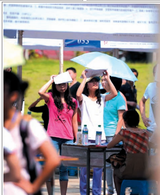
Applicants shelter sunshine with books when participating in a job fair in a college of Nanchang in Nanchang City, capital of east China's Jiangxi Province, on 23 May, 2013. Nanchang saw its highest temperature reaching 34 degrees celcius on Thursday, about 10 degrees higher than the same period in 2012.