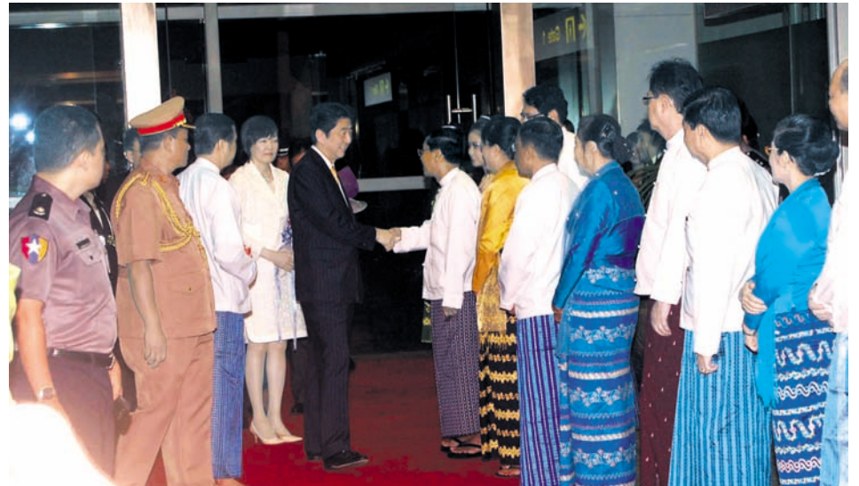
Japanese Prime Minister Mr Shinzo Abe being welcomed by Yangon Region Chief Minister U Myint Swe and officials at Yangon International Airport.—MNA