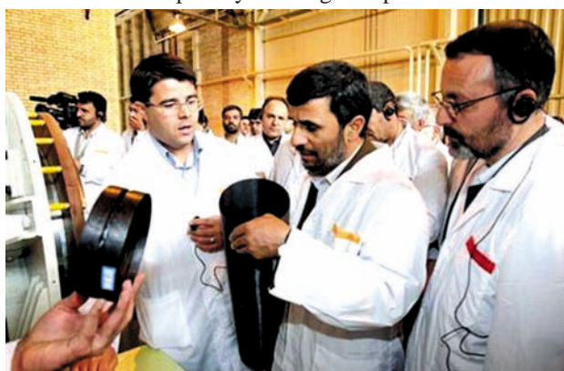
Iranian President Mahmoud Ahmadinejad (C) visits the Natanz nuclear enrichment facility, 350 km (217 miles) south of Teheran, on 8 April, 2008.

Critics say Iran is trying to achieve the capability to