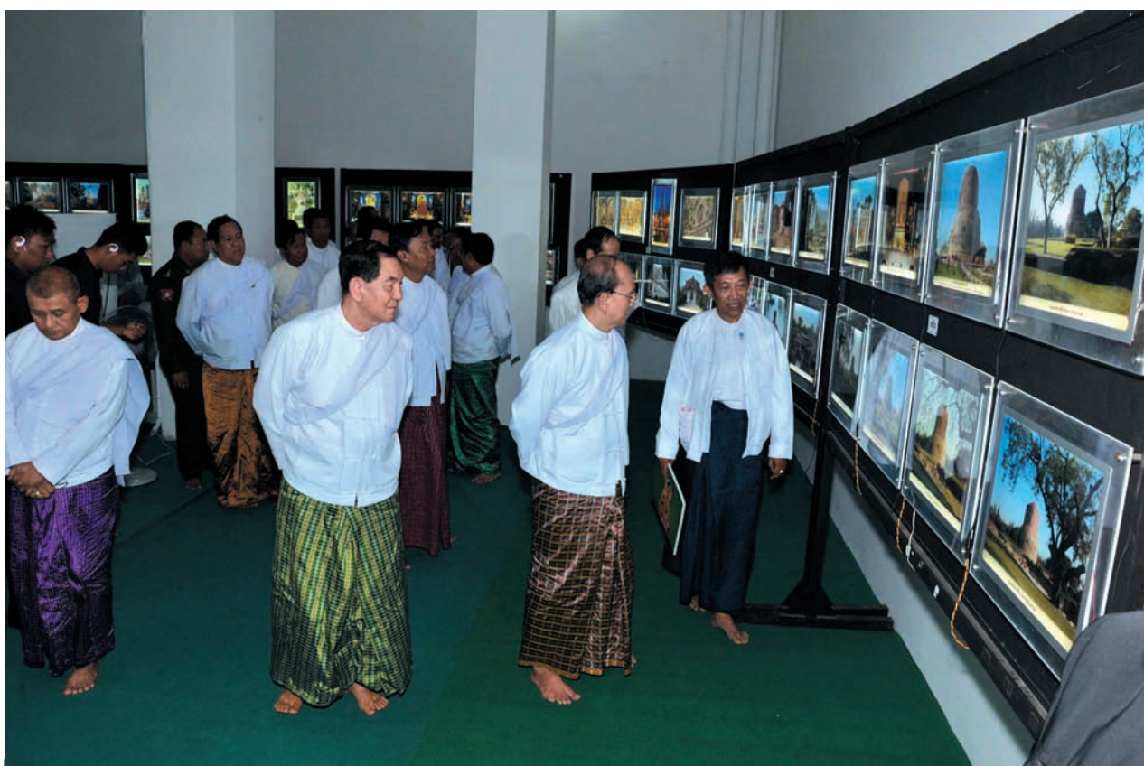
President U Thein Sein and party visit documentary photo booth of Thatta Thattaha Maha Bodhi Pagoda.