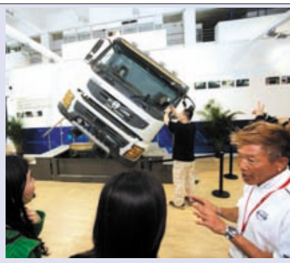
Visitors watch the product demonstration at the exhibition area of Volvo during the China International Technology Fair in Shanghai, east China recently.