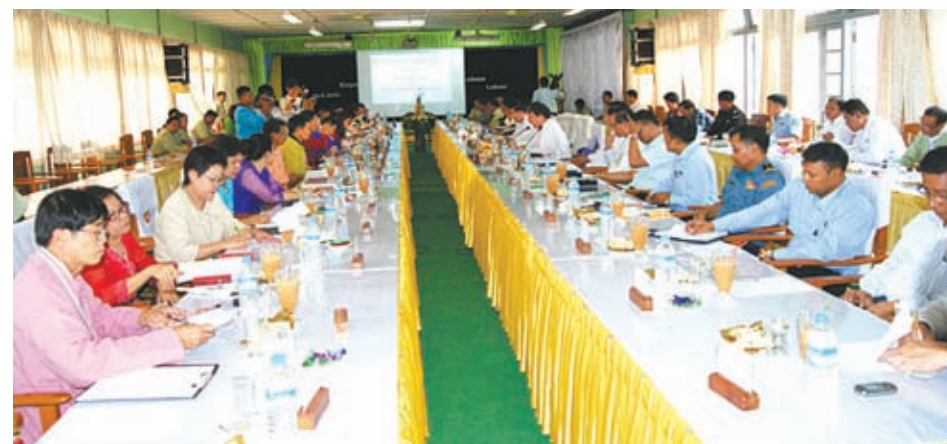
Myanmar-Thailand business consultation in Loikaw in progress.