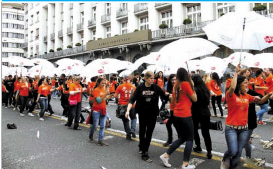
Graduate high school students dance during the 13th Quadrille Dance Parade in Ljubljana, Slovenia, on 17 May, 2013.