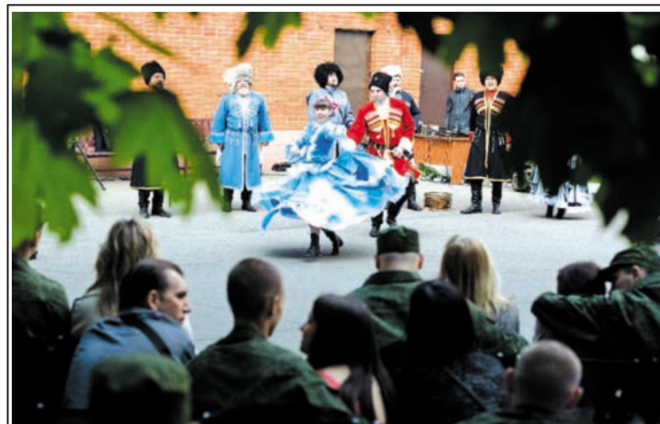
New conscripts for Russian Army and their friends and relatives attend a seeing off event at a recruiting station in Moscow, Russia, on 17 May, 2013. Russia aims to recruit 153,200 new conscripts this spring.—XINHUA

But the region is a patchwork of rebel and militia fiefdoms left over from a 1998-2003 civil war that killed millions, and the insecurity has discouraged large-scale industrial mining. Rampant poverty has pushed hundreds of thousands of Congolese to work in unregulated smaller mines, often controlled by armed groups, where fatal accidents are commonplace.— Reuters