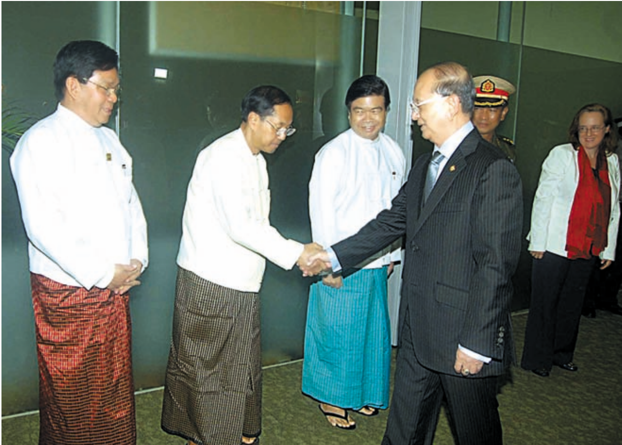
President U Thein Sein of the Republic of the Union of Myanmar being seen off by officials at Yangon International Airport before departure for United States of America.

NAY PYI TAW, 18 May—President U Thein Sein of the Republic of the Union of Myanmar left here for the United States of America by air at 11.45 pm yesterday to pay a working visit to the US.