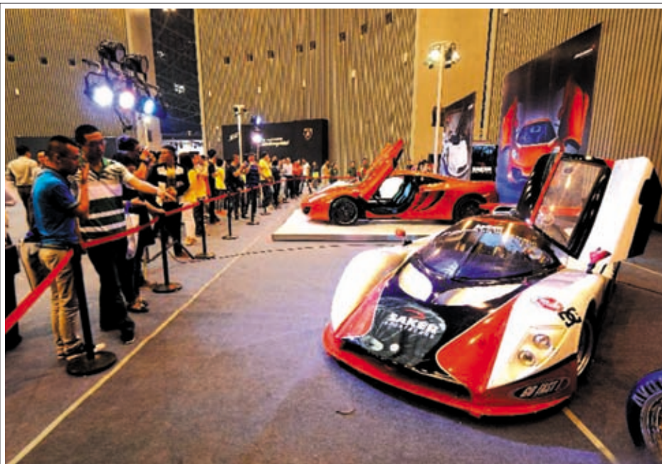
Visitors view a Saker sports car at the 2013 China (Taiyuan) International Automobile Exhibition in Taiyuan, capital of north China's Shanxi Province, on 17 May, 2013. Some 400 vehicles of 63 brands were taken to the auto show here, which kicked off on 16 May.