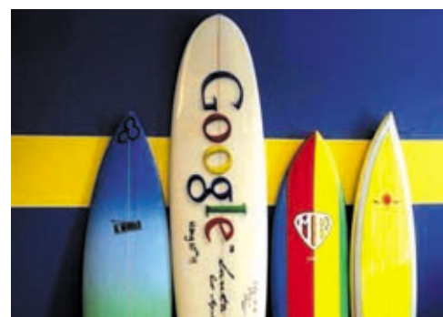
Surfboards lean against a wall at the Google office in Santa Monica, California, on 11 Oct, 2010.

According to British price comparison site Founder, Google’s offer would only reinforce its dominance. Google has more than 80 percent share of the market in Europe, according to research firm comScore. Other critics said the proposal would force rivals to compete among themselves, raising their costs and increasing merchants’ dependency on Google. If Google clinches a deal with the Commission, it would avoid a finding of infringement of competition rules and a possible fine that could be as much as $5 billion or 10 percent of its global revenue.—Reuters