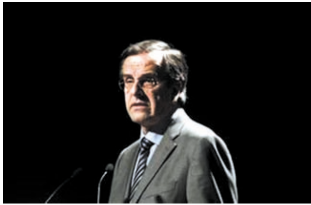
Greece's Prime Minister Antonis Samaras addresses the audience during the 12th Facility for Euro-Mediterranean Investment and Partnership (FEMIP) conference on “Mediterranean blue economy: enhancing marine and maritime cooperation” in Athens on 8 April, 2013.