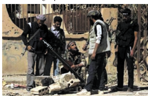
Free Syrian Army fighters adjust a rocket to be launched towards forces loyal to Syria's President Bashar al-Assad in Deir al-Zor on 15 May, 2013.