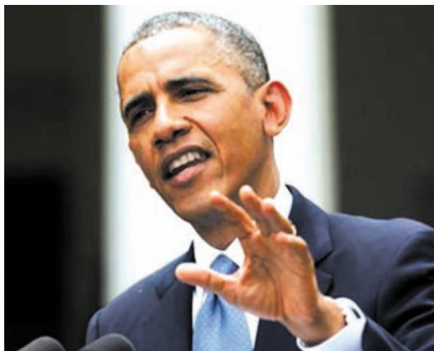
US President Barack Obama answers a question in the rain during a joint news conference with Turkish Prime Minister Recep Tayyip Erdogan in the White House Rose Garden in Washington, on 16 May, 2013.