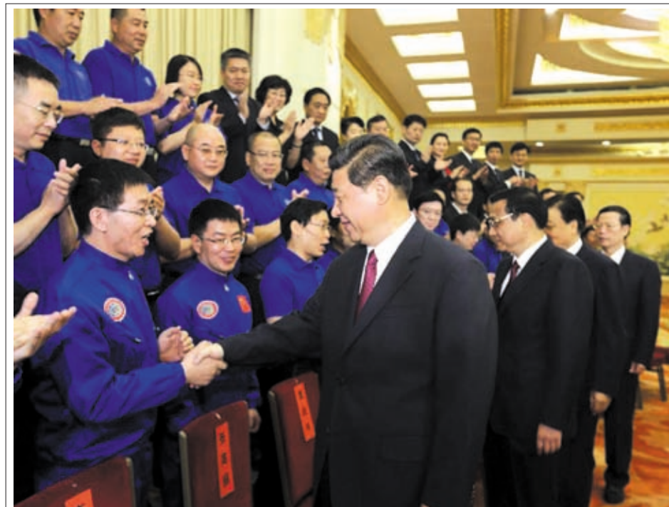
Chinese top leaders Xi Jinping, Li Keqiang, Liu Yunshan, Zhang Gaoli meet with representatives of the honoured units and individuals of China's manned submersible mission in Beijing, capital of China, on 17 May, 2013.

"Both sides agreed to strengthen cooperation to prevent and crack down on illegal activities along the border such as drug trafficking, illegal logging, and illegal border crossing," said a joint statement released by Cambodian defence ministry. "The two ministers also agreed to enhance maritime security." They also agreed to cooperate to improve livelihoods for peoples living along the border through the development of tourism, education and public health, it said.