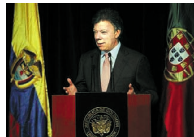
Colombia's President Juan Manuel Santos speaks during the inauguration of the 26th International Book Fair in Bogota on 17 April, 2013.