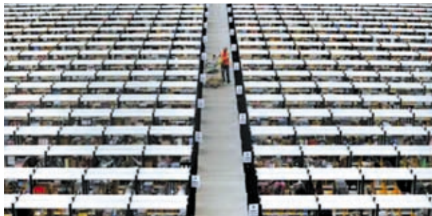
A worker collects orders at Amazon’s fulfilment centre in Rugeley, central England on 11 Dec, 2012.

However, Reuters has uncovered evidence from the company’s own statements, job advertisements, statements from three suppliers and five former employees, as well as the profiles of over 140 staff on networking website LinkedIn, which suggests the UK unit has a high degree of autonomy, with local managers deciding on many aspects of its business.