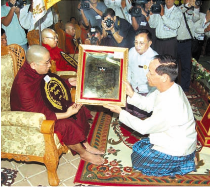
Vice-President Dr Sai Mauk Kham presents certificate to a title recipient Sayadaw.