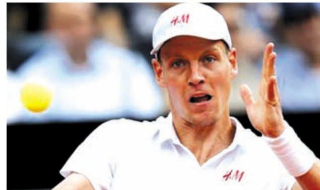
Tomas Berdych of Czech Republic hits a return to Novak Djokovic of Serbia during their men’s singles quarter final match at the Rome Masters tennis tournament on 17 May, 2013.

After easing through the first set, Federer survived a scare when he was