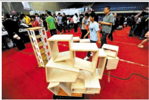
People walk past furniture made of recycled wood at the 2013 creativity fair in Taiyuan University of Technology in Taiyuan, capital of north China's Shanxi Province, on 17 May, 2013.