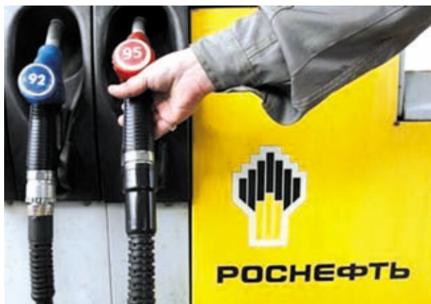
An attendant holds a gas pump at a Rosneft petrol station in St Petersburg on 23 Oct, 2012.

MOSCOW, 18 May—A rare public clash between two leading figures in Russia's state-dominated oil industry hints at a split in President Vladimir Putin's inner circle and could be intended to rein in one of his closest advisers. Igor Sechin, who has built oil company Rosneft into the world's largest with Putin's help, has pushed for an expansion of a pipeline "spur" to take more oil to China, a profitable alternative market to Europe where de-