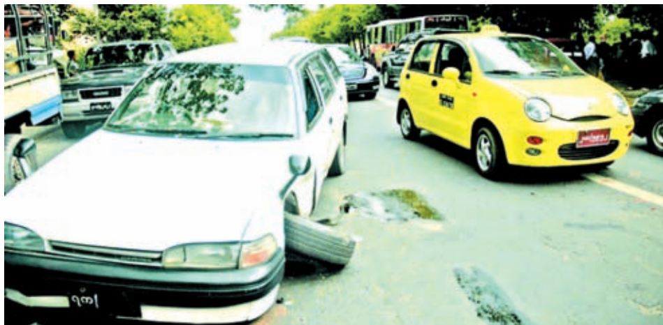
Photo shows a domino-effect car crash involving four vehicles— one passenger bus of No (182) Parami bus line and three saloons— near Bo Min Yaung traffic light on Theinbyu road in Yangon at about 3.30 pm on 17 May.