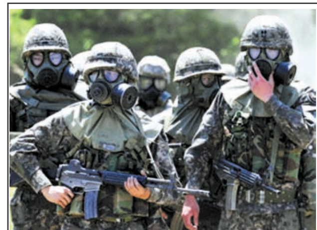
South Korean soldiers take part in a US and South Korean joint toxic gas drill in Yeoncheon, Gyeonggi Province, northern South Korea, on 16 May, 2013.

A day ago, at least 12 people were killed and 25 others injured as a suicide bomber blew himself up at a Shiite mosque in northern Iraq's Kirkuk. Violence is still common in Iraq despite the dramatic decrease since its peak in 2006 and 2007 when the country was engulfed in sectarian killings.—Xinhua