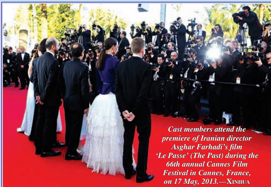
Cast members attend the premiere of Iranian director Asghar Farhadi's film 'Le Passe' (The Past) during the 66th annual Cannes Film Festival in Cannes, France, on 17 May, 2013.