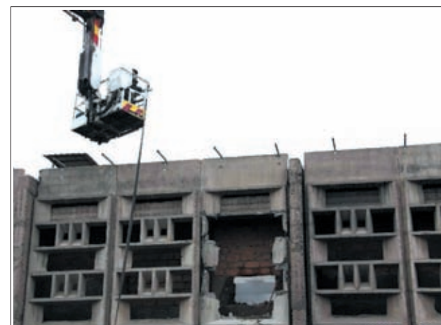
Fire fighters trys to approach the warehouse building which is still on fire in Yerevan, Armenia, on 16 May, 2013. A three-floor warehouse caught on fire at Wednesday night and fire department still failed to extinguish the fire at Thursday noon.