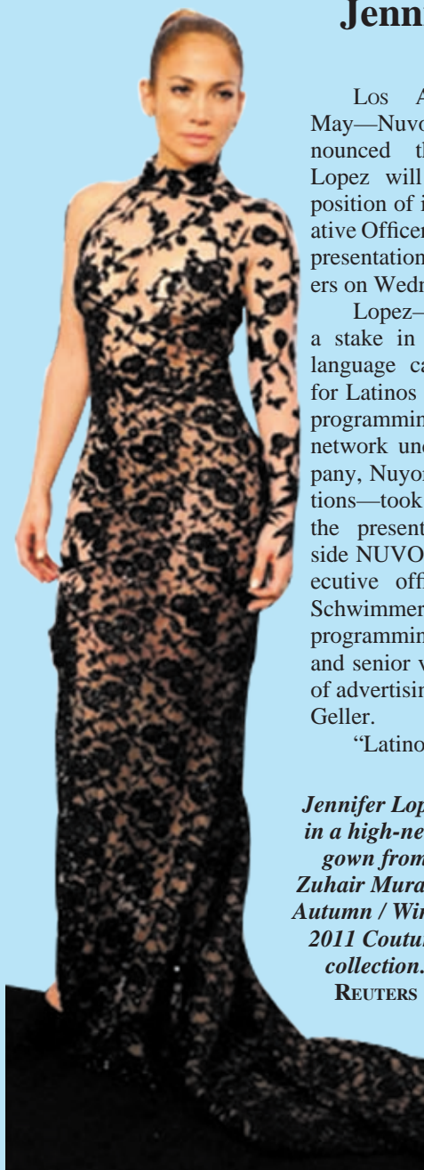
Jennifer Lopez in a high-neck gown from Zuhair Murad's Autumn / Winter 2011 Couture collection.