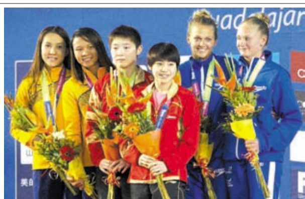
Malaysia’s Jun Hoong Cheong and Pandelega Rinong Pang, China’s Si Yajie and Liu Huixia, Britain’s Tonia Couch and Sarah Barrow (L to R) pose on the podium during the awarding ceremony after the women’s synchronized 10m platform final during the fifth stage of Diving World Series of International Swimming Federation (FINA) in Guadalajara, Mexico, on 17 May, 2013. Si Yajie and Liu Huixia claimed the title of the event.