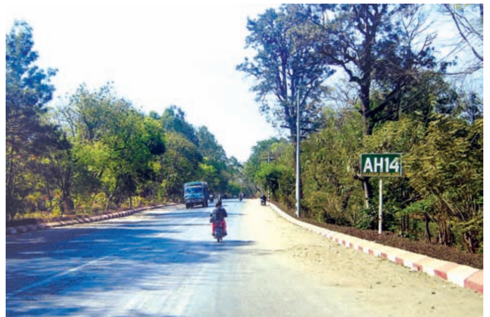
Photo shows a part of ASEAN Highway-14 (AH-14) near PyinOoLwin Township.

Byline: Maung Maung Myint Swe