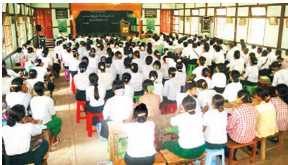
Opening ceremony of Multiplier Course on Child-Centered Approach in Thazi Township in progress.

Department, and township level departmental personnel. The course is being attended by headmasters and teachers of primary schools. The first batch course will run through 23 May—Myanma Alinn