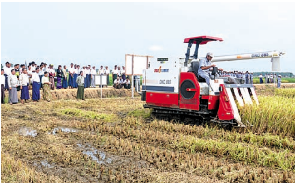
Union Minister for Agriculture and Irrigation U Myint Hlaing views harvesting Paletwe paddy in Dekkhinathiri Township.

NAY PYI TAW, 18 May—Union Minister for Agriculture and Irrigation U Myint Hlaing inspected harvesting of hybrid Paletwe summer paddy and land reclamation, at mechanized farming (3000 acres) plantation near hotel zone in Dekkhinathiri Township, here, this morning.