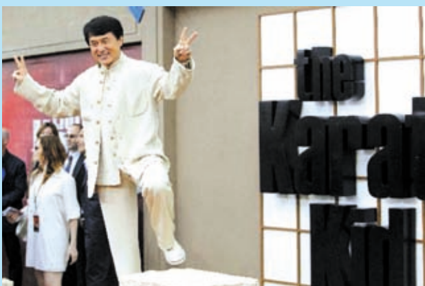
Cast member Jackie Chan poses at the premiere of "The Karate Kid" at the Mann Village theatre in Los Angeles on 7 June, 2010. The movie opens in the US on 11 June.