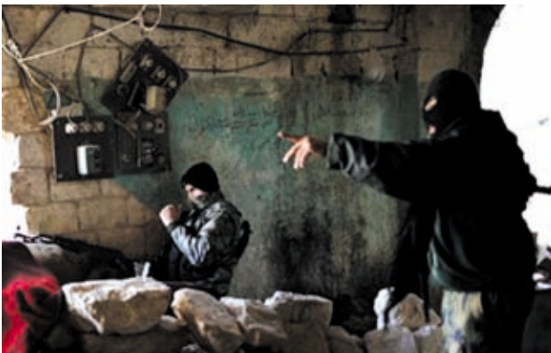
Fighters from Syrian rebel group Jabhat al-Nusra take their positions on the front line during a clash with Syrian forces loyal to President Bashar al Assad in Aleppo in this 24 Dec, 2012 file photo.

The fighting has already cost 90,000 lives. The break-up of an important part of Syria's opposition, already splintered into hundreds of armed groups, worsens the dilemma faced by the West as it debates whether intervention to support the rebels will result in arms being placed in the hands of hostile Islamist militants. And the if the West were to intervene, it may now be under pressure to attack al-Qaeda opposition forces rather than Assad. "Nusra is now two Nusras. One that is pursuing al-Qaeda's agenda of a greater Islamic nation, and another that is Syrian with a national agenda to help us