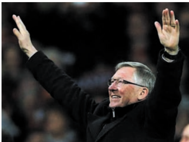
Manchester United’s manager Alex Ferguson

“When he went to America there wasn’t a person in this place who really thought he could have a career,” Ferguson added