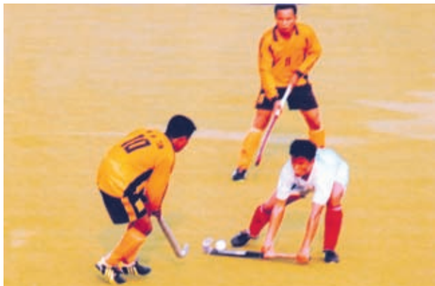
Defence Ministry (Youth) playing against Triangle Region Command in National Hockey League 2013 jointly organized by Sports Ministry and Myanmar Hockey Federation on 18 May. The former beat the latter 6-1.

A good starting point to avert mechanical failure-led tragedies is to crack down on illegal imports of motorbikes that failed to come under scrutiny and shipping of defective vehicles into the country. Construction of roads, bridges and highways meeting set standards and increased presence of traffic officers in accident hot spots are workable measures to reduce environmental conditions-related road casualties, but weather situations are unpreventable and unpredictable. Driving license should not be a license to kill. Further restrictions should be placed on driving tests to turn out safe and secure drivers. Moreover, all road users are to be alerted to punitive actions against traffic rule violations.