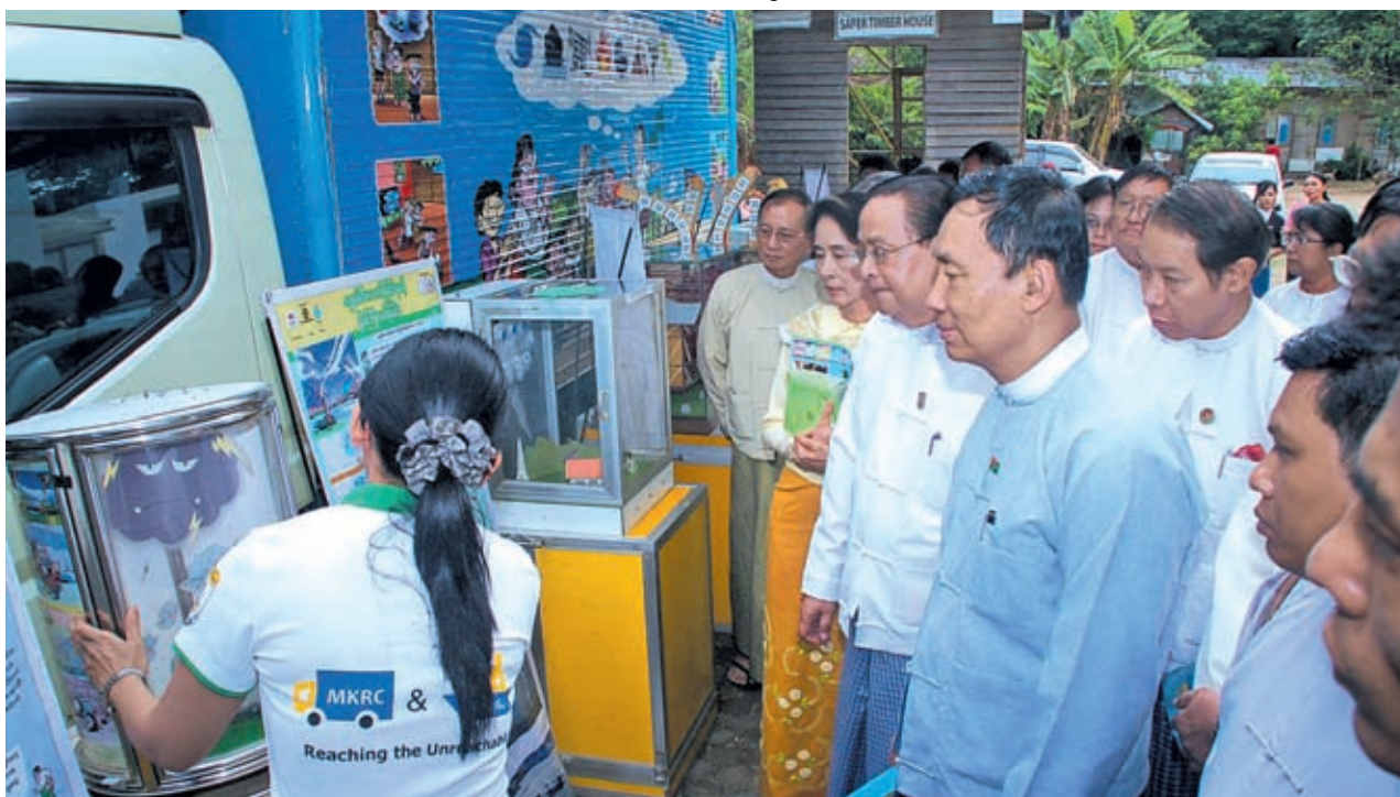
Pyithu Hluttaw Speaker Thura U Shwe Mann visits Myanmar Engineering Society in Hline Universities Campus.

YANGON, 17 May—Pyithu Hluttaw Speaker Thura U Shwe Mann stressed the crucial role of engineers and technological advancement in national development as he met the chairman and members of Myanmar Engineering Society at its office in Hline Universities Campus in Hline Township here this noon.