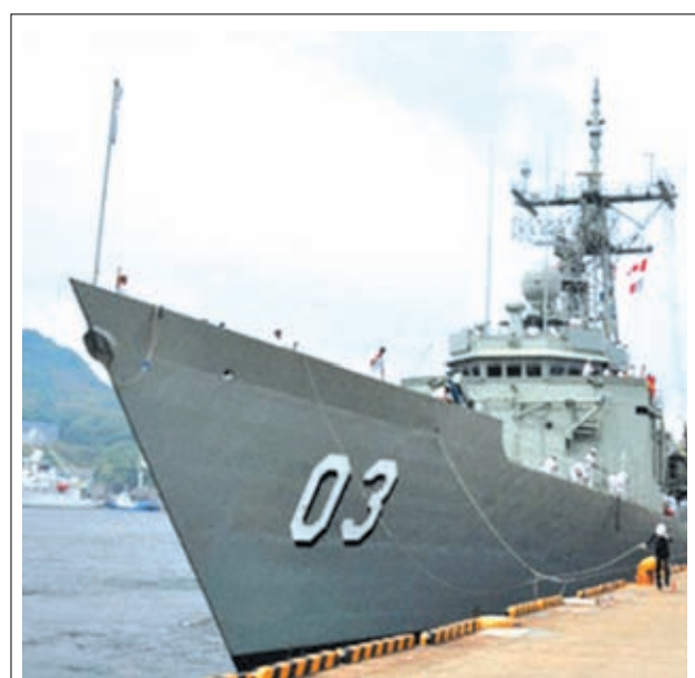
Photo shows the Australian Navy's guided-missile frigate Sydney calling at Sasebo port in Nagasaki Prefecture, southwestern Japan, on 16 May, 2013. The Australian Navy showed reporters the inside of the 4,200-ton vessel, which was in Japan to take part in an exercise of the US 7th Fleet.