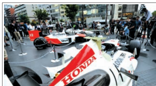
Photo shows vehicles used in past Formula One motor races on display in front of the Honda Motor Co. head office in Tokyo on 16 May, 2013. The automaker announced the same day that it will make a comeback to Formula One racing in 2015 as an engine supplier, teaming up with former partner McLaren of Britain. Honda withdrew from the racing after last taking part in 2008.—KYODO NEWS

The collection was sold off by Walpole's grandson, because he was short of money, and he raised more than 40,000 pounds, in those days a fortune, with his sale of the paintings to Catherine the Great in 1779.—Xinhua