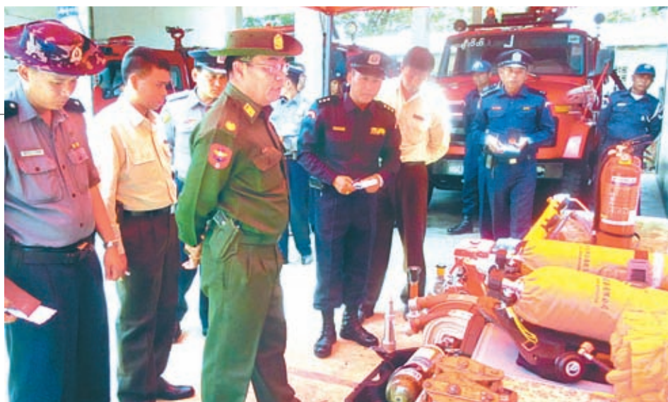
Deputy Minister for Home Affairs Brig-Gen Kyaw Zan Myint views display of fire extinguishers at Fire Station in Tachilek.

MEIKTILA, 17 May—Meiktila District Police Force warned that a breach of traffic rules might carry fines from K 30000 to K 100,000.