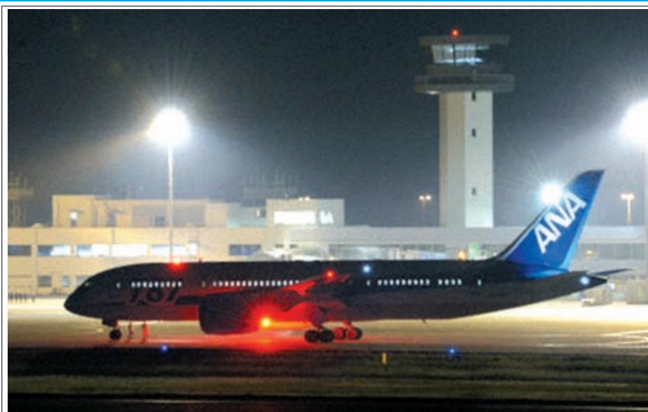
A Boeing 787 Dreamliner jet of All Nippon Airways Co leaves Takamatsu Airport in western Japan for Tokyo's Haneda Airport in a test flight on the evening of 16 May, 2013. ANA has modified the jet after it made an emergency landing at Takamatsu Airport in January 2013 due to a battery-related problem.