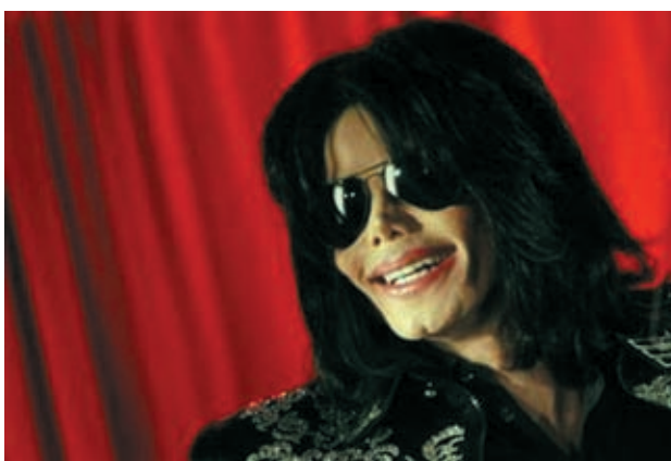
US pop star Michael Jackson gestures during a news conference at the O2 Arena in London on 5 March, 2009. Jackson said he will hold a series of final concerts in Britain later in the year.