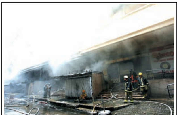
Firefighters work at the fire accident site in Manila, the Philippines, on 16 May, 2013. Two people were rescued from the fire, as firefighters estimate the fire may last for two days.