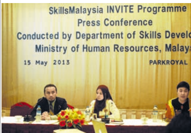
The Department of Skills Development under the Ministry of Human Resources of Malaysia together

with REXPO-JENKO introduces Skills Malaysia-Invite Programme that will enable Myanmar students to pursue specialized technical and vocational skills training courses accredited by the Malaysian Government.