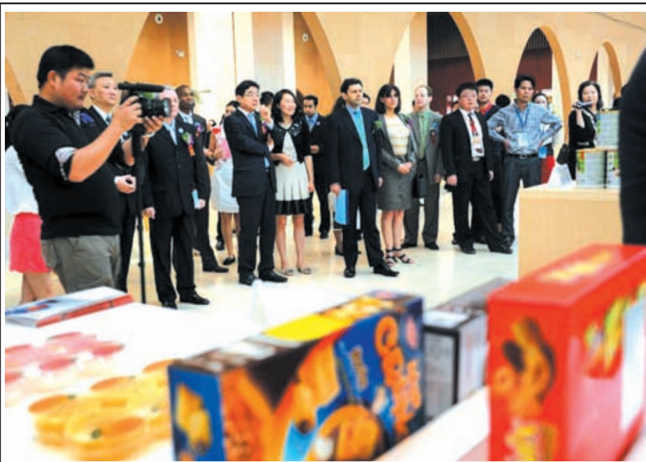
Dealers from across the world visit the newly opened Taizhou Global Commodity Purchasing Centre in Taizhou City, east China's Jiangsu Province, on 16 May, 2013. The centre, with a total investment of 200 million RMB yuan (about 32 million dollars), opened here on Friday and will provide services mainly to eastern China Provinces of Jiangsu, Shandong and Anhui.