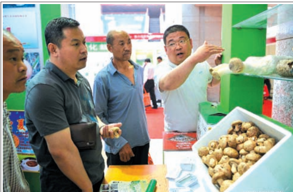
A participant gives a brief introduction of mushroom to visitors at "The Edible Fungus of New Products and New Technology Promotion and Marketing Docking Fair" held in Shijiazhuang, capital of north China's Hebei Province, on 16 May, 2013. Some 200 makers of edible fungus products took part in the three-day event, which kicked off here on Thursday.