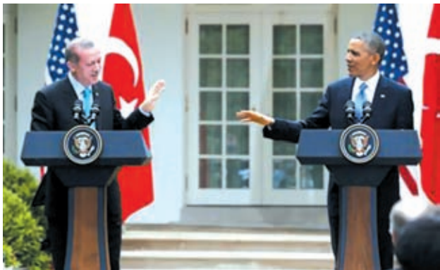
US President Barack Obama (R) and Turkish Prime Minister Recep Tayyip Erdogan hold a joint news conference in the White House Rose Garden in Washington, on 16 May, 2013.

WASHINGTON, 17 May—President Barack Obama said on Thursday he reserves the right to resort to a range of diplomatic and military options if he gets conclusive proof that the government of Syrian President Bashar al-Assad had used chemical weapons in the country's civil war.