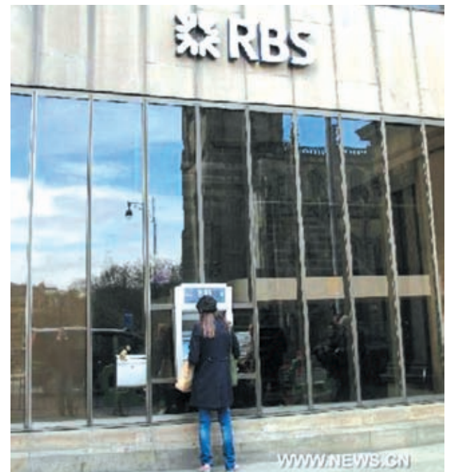
Filed photo taken on 5 May, 2013 shows a woman using ATM at Royal Bank of Scotland (RBS) in Edinburgh, Scotland, Britain. RBS on Thursday announced that it will cut 1,400 jobs over the next two years as part of plans to restructure its retail head office operations in Britain.