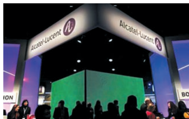
Visitors walk at the Alcatel-Lucent booth at the Mobile World Congress in Barcelona.