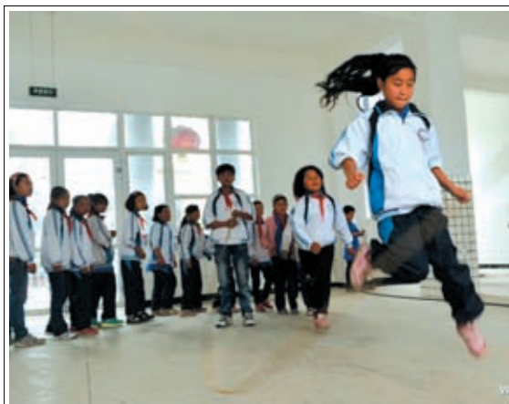
Students of the central primary school of Shangli Town play rope-skipping in a makeshift classroom in Shangli, Lushan County, southwest China's Sichuan Province, on 16 May, 2013. The schoolhouses of the Shangli Town Centre School were destroyed in the 7.0-magnitude earthquake taken place in Lushan on April 20, leaving more than 1,200 students to have classes in newly built prefab houses.—XINHUA

"This sees the NZDF capital expenditure budget increase from 318 million NZ dollars to 583 million NZ dollars for the financial year," he added.—Xinhua