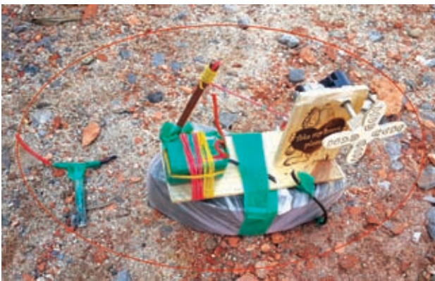
A packet of mine and its accessories.

found near the mine blast. He was apparently hit by the mine while attempting to set off the mine. Investigation into the case is under way.