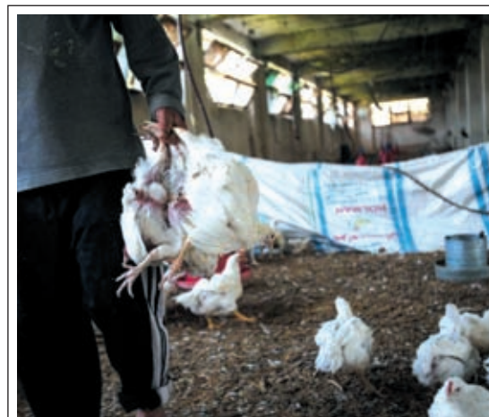
An Egyptian worker carries white chicken in a chicken farm in Sombokht village about 140 km north of Cairo, before the start of the process of selling chicken at the end of the semi-annual season for the poultry trade in Dakahleya, Egypt, on 16 May, 2013. Chicken prices have witnessed an enormous rise in the Egyptian poultry market due to the high feed prices which led the majority of Egyptians away from buying white meat in a country that suffers from severe economical problems.

To date, the Angry Birds and Bad Piggies games have been downloaded more than 1.7 billion times across different platforms and versions around the world. In recent years, the image of Angry Birds has expanded rapidly into entertainment, publishing, and licensing, turning into a popular global brand.