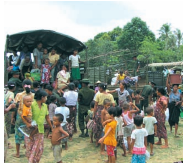
Tatmadawmen giving a helping hand to storm victims heading to their homes.—MNA

Hill in Sittway were sent back to Palinbyin Village, 445 people from 62 households, from Dhamma Yama Monastery in Kontan Ward of Sittway to Aungdai Village, 57 people from 15 households, from Ohntawlay relief camp in the local battalion of Sittway to their refugee camp, 152 people from Kanyintan Village BEPS and 263 from 4 th Mile BEMS to their respective homes.—MNA