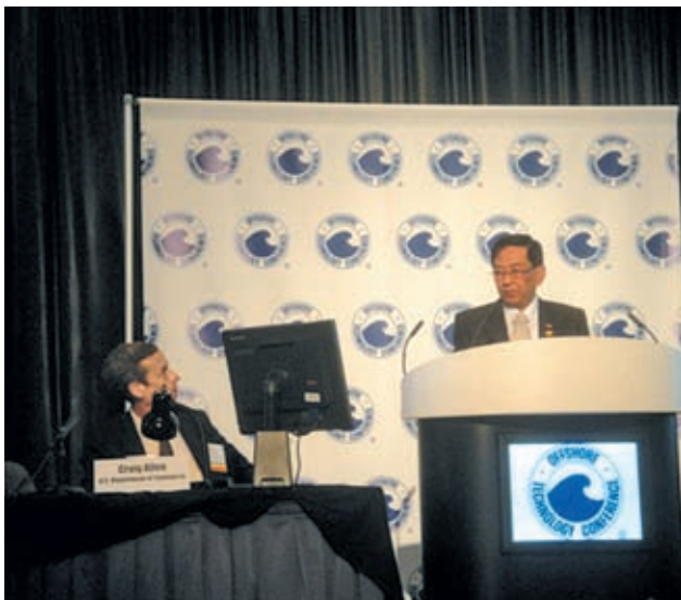
Deputy Minister for Energy U Htin Aung delivers an address at Offshore Technology Conference (OTC) in Houston in Texas of the USA.

While the advanced communication technologies and high-end communication devices have shortened the distance between the people, they somehow have lengthened the distance between family members who now pay more attention to their smart phones than their family members even when sitting together. But, never forget that it is your family who would stand by you whenever you are in trouble.