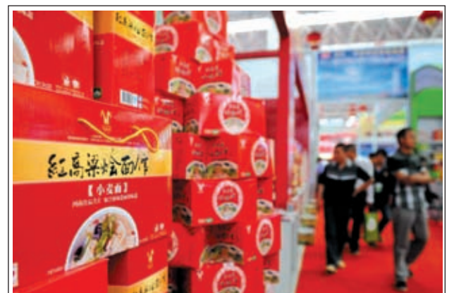
People visit the 11th China (Luohe) Food Fair in Luohe City, central China's Henan Province, May 16, 2013. The five-day food fair, with an exhibition area of 50,000 square meters and attracting more than 1,500 enterprises from 17 countries and regions, opened here on Thursday.—XINHUA

The top three contributors to the export contraction in April were the European Union, South Korea and Malaysia.—Xinhua