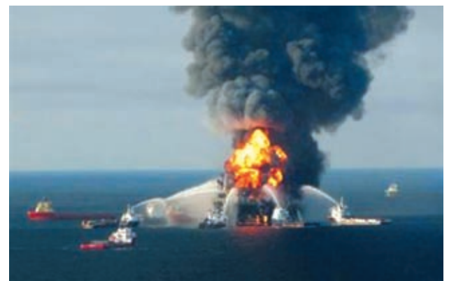
Fire boat response crews battle the blazing remnants of the offshore oil rig Deepwater Horizon, off Louisiana, in this 21 April, 2010 file handout image.