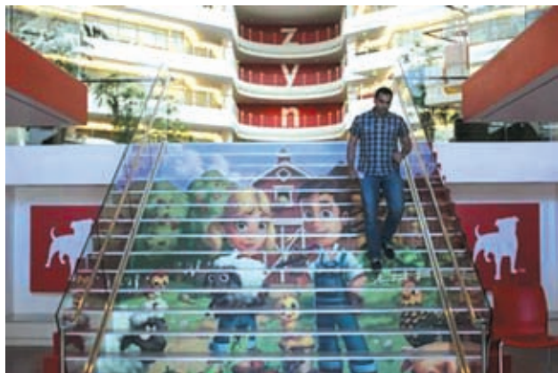
Player avatars from Zynga's FarmVille 2 are seen on a stairway at the entrance to Zynga headquarters in San Francisco, California on 23 April, 2013.