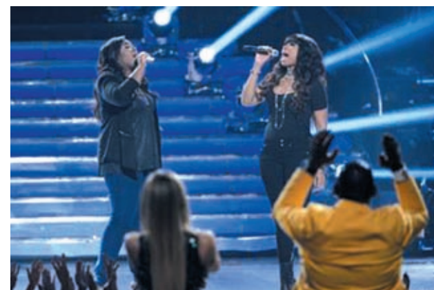
Finalist Candice Glover and singer Jennifer Hudson perform “Inseparable” during the Season 12 finale of “American Idol” in Los Angeles, California on 16 May, 2013.

He announced Glover as the winner at the end of Thursday’s two-hour show, which featured performances by judges Keith Urban and Mariah Carey, as well as Aretha Franklin, Jennifer Lopez, rapper Pitbull and South Korea’s Psy, who sang his new single “Gentleman.” Glover, the first woman to be crowned “Idol” since Jordin Sparks six years ago, won a record deal, which could help propel her to the stardom enjoyed by other women “Idol” winners such as Grammy Award winners Kelly Clarkson and Carrie Underwood.—Reuters