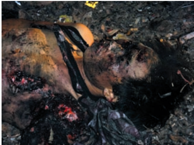
An unknown man killed by mine blast.