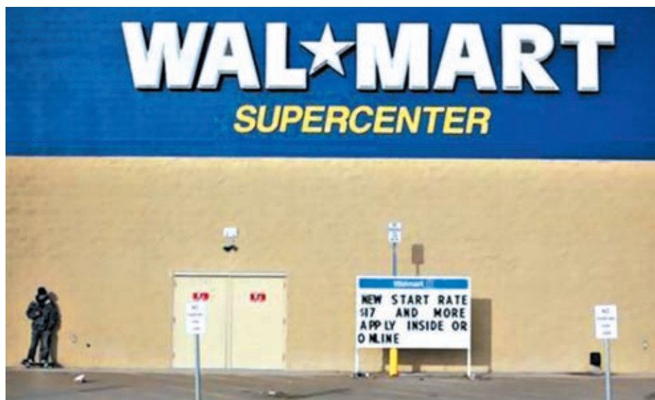
A man stands on a skateboard outside a Wal-Mart store in Williston, North Dakota on 13 March, 2013.