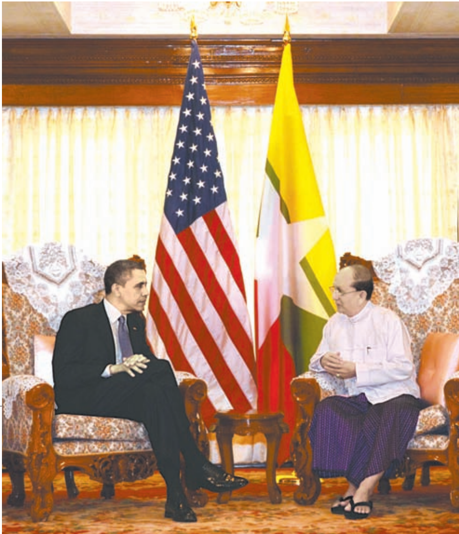
President of the Republic of the Union of Myanmar U Thein Sein holds talks with President of the United States of America Mr Barak Obama at Yangon Region Hluttaw on 19 November, 2012.