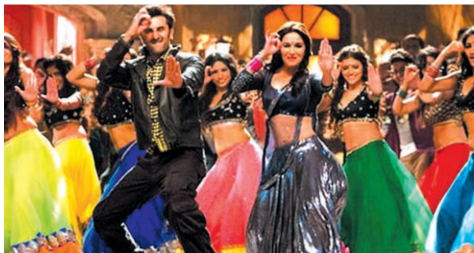
Ranbir Kapoor had fun while shooting with Madhuri Dixit.

have to try very hard to make Ranbir’s heart beat faster. The actor “bribed” director Ayan Mukherji to let him kiss Madhuri Dixit, Ranbir’s teen crush, on the cheek. Yeh Jawani Hai Deewani also features Deepika Padukone and will release on 31 May.