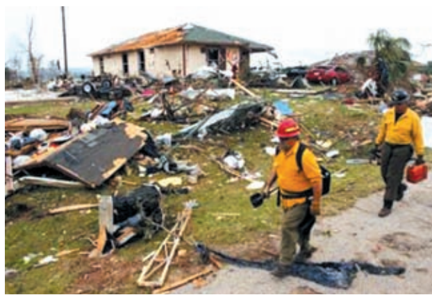
Rescue workers walk past debris on 16 May after tornadoes swept through the town of Granbury, Texas late on 15 May, 2013.

The storm blew homes from their foundations, tossed cars through the air and uprooted trees as it