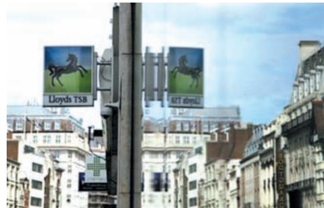
A sign from a branch of a Lloyds bank is reflected in a window in central London on 13 May, 2013.