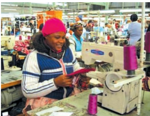
People work on machines at a clothing factory at an industrial town of Newcastle, 260 km (162 miles) southeast of Johannesburg on 8 May, 2013.

Goldfinch is spartan but appears safe and clean.