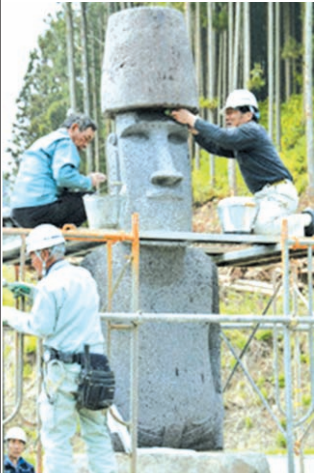
Workers install a stone replica of a Moai human figure at a temporary shopping area in Minamisanriku, Miyagi Prefecture, on 16 May, 2013. Chile has sent the replica of an Easter Island statue as a present to the northeastern Japan town hit by the 2011 Great East Japan Earthquake.

SENDAI, 17 May—A moai statue from Chile's Easter Island that was presented to Japan as a gift in the wake of the March 2011 earthquake and tsunami