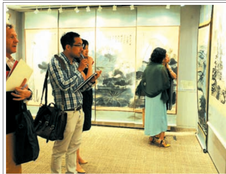
Visitors watch paintings during the preview of Christie's spring season auction in south China's Hong Kong, on 16 May, 2013. The auction will be held in Hong Kong from May 25 to 29 this year.