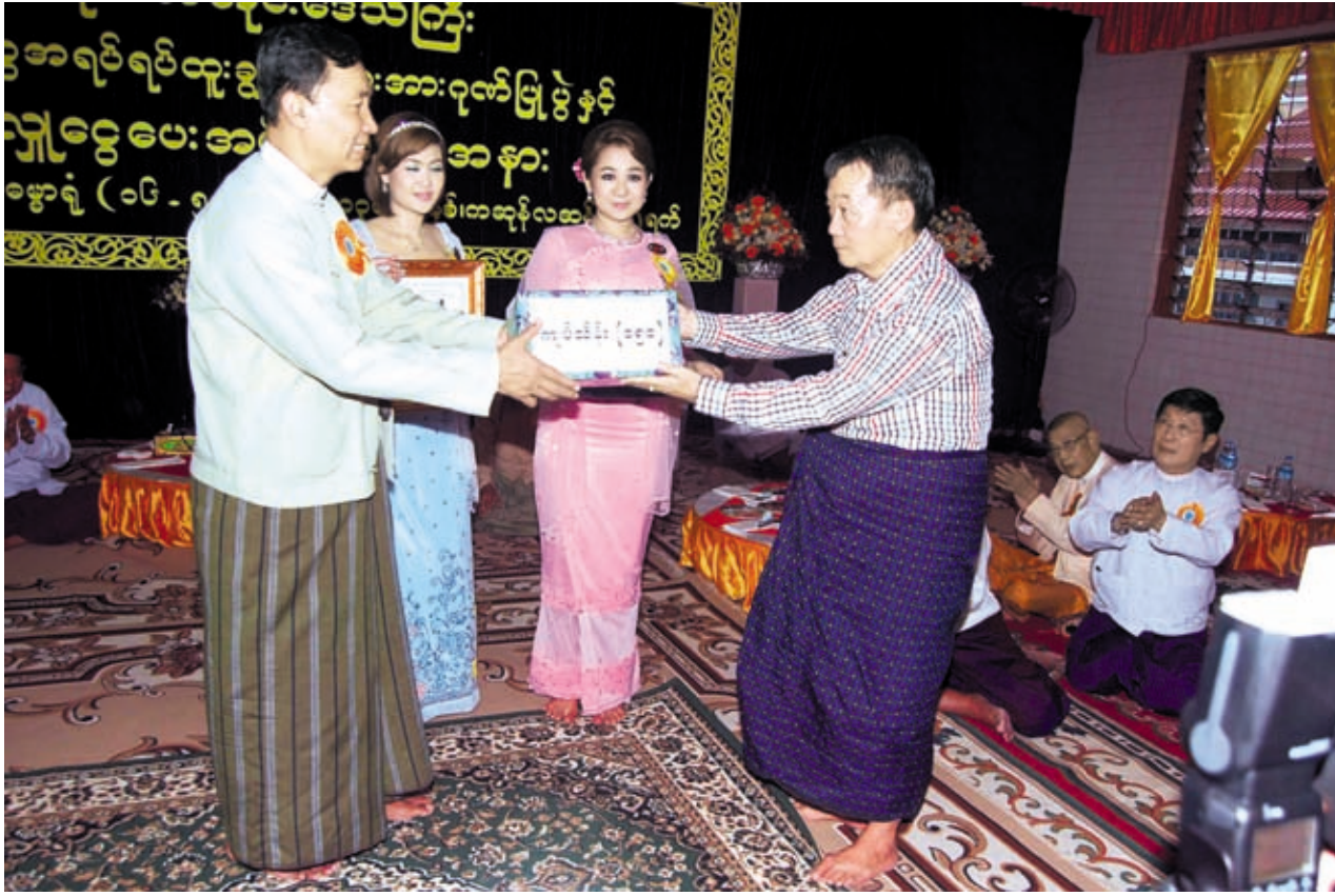
Pyithu Hluttaw Speaker Thura U Shwe Mann presents award to an outstanding person in Ayeyawady Region.

YANGON, 17 May—A ceremony to honour the winners at President's Excellence Awards, those who won honorable certificates, State/Region-level short-listed winners and top ten outstanding matriculation students in Township, here, yesterday in conjunction with cash donation ceremony for Ayeyawady Region Dhammayone.