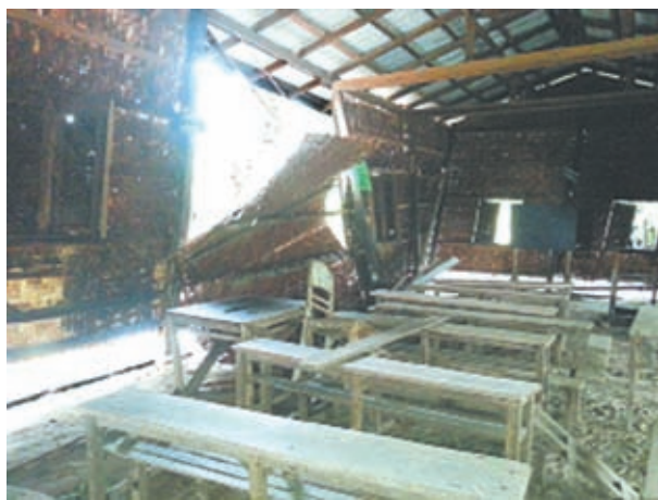
Building of Nabaung village Basic Education Primary School damaged by strong winds on 2 May. After a week, parents voiced concerns over opening of school at the start of academic year.