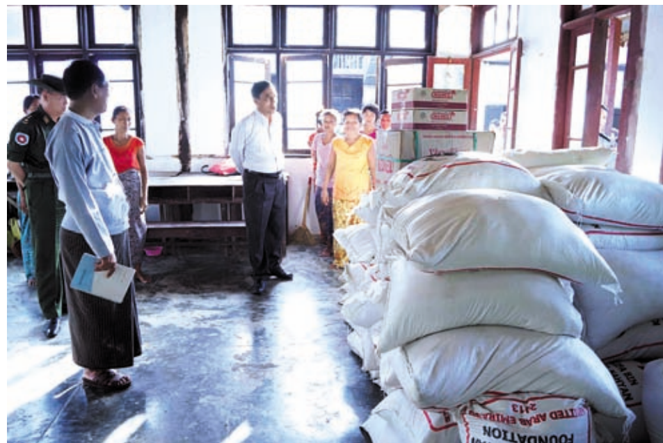
Preparations were stepped up before the cyclonic storm Mahasen hits Rakhine State.