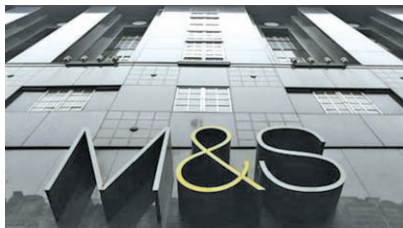
Branding is seen on a branch of Marks and Spencer on Oxford Street, central London, on 11 April, 2013.