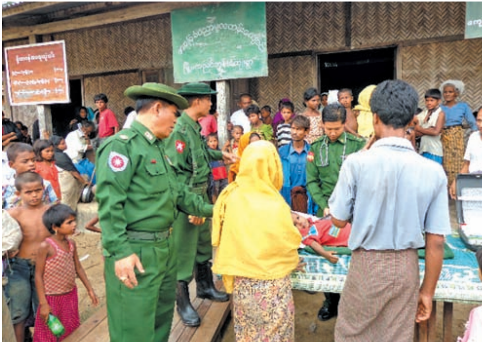
Medical teams providing health care to victims at relief camp in Sittway.