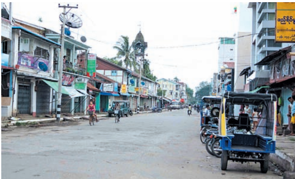
Photo shows residents in Sittway without damage after cyclonic storm Mahasen.

NAY PYI TAW, 16 May—Cyclonic Storm Mahasen fizzled out after hitting Bangladesh coast when it crossed near Chittagong and it is moving slowly northeasterly direction and weakened into a tropical storm according to observation in this evening, Meteorology and Hydrology Department said.