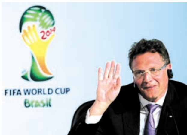
FIFA secretary general Jerome Valcke

RIO DE JANEIRO, 16 May—FIFA secretary general Jerome Valcke has guaranteed Sao Paulo's World Cup stadium will be ready on time, one day after claiming the venue could be taken off the tournament schedule due to construction delays. Valcke met with Itaquerao stadium officials on Wednesday and