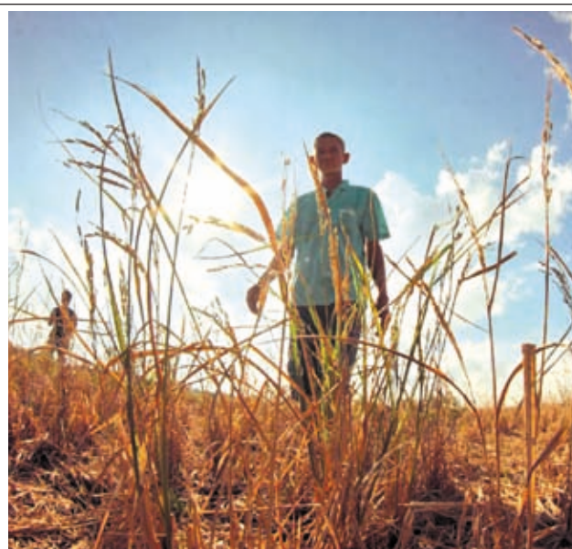
A farmer walks in the damaged rice field caused by saltwater intrusion at Thanh Phu District of Ben Tre Province in the Mekong Delta region of Vietnam, on 15 May, 2013. With an area of 3.9 million hectares and a population of about 17.5 million people, the Mekong delta is the most vulnerable location in Vietnam to impacts of climate change including long lasting and deep flood, drought, tropical storms, erosion along the sea embankments.