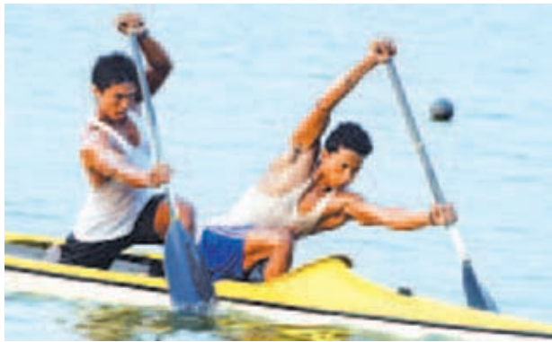
Myanmar boat race team in training in Yangon's landmark Inya Lake.

NAY PYI TAW, 16 May—As XXVII SEA Games to be hosted in Myanmar in coming December draws nearer, athletes who will represent Myanmar are undergoing camp trainings and seeking international experience abroad.