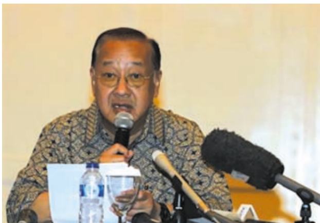
Chief Executive of PT Freeport Indonesia Rozik Soetjipto talks during a news conference in Jakarta on 15 May, 2013. The Indonesian unit of Freeport-McMoRan Copper & Gold Inc suspended operations at the world’s second-largest copper mine on Wednesday, a source with knowledge of the matter said, after a training tunnel collapsed the previous day.