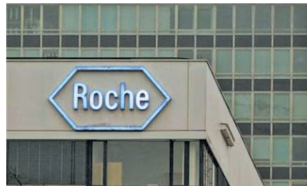
The logo of Swiss pharmaceutical company Roche is seen at the company's headquarters in Basel on 5 April, 2012.

a running start in protecting its breast cancer drug Herceptin, off patent next year, by winning approval for two new drugs against the disease, Perjeta and Kadcyla.