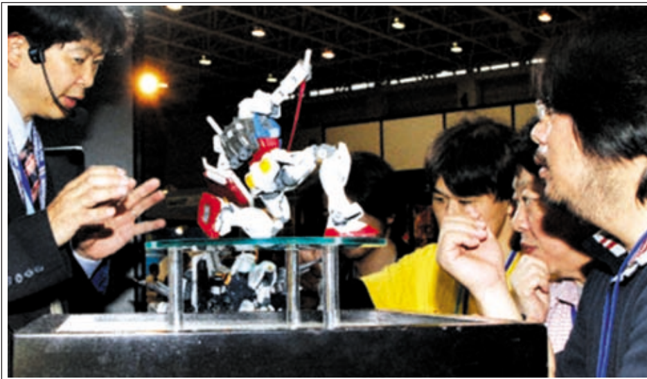
Visitors view new plastic models from the Mobile Suit Gundam robot animation series at the Shizuoka Hobby Show 2013, a major toy exhibition in the city of Shizuoka, central Japan, on 16 May, 2013.