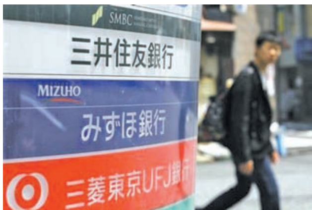
A man walks past a signboard of Japan's three mega banks, Sumitomo Banking Corporation (top), Mizuho Bank (C) and Bank of Tokyo-Mitsubishi UFJ, in Tokyo on 15 May, 2013.

TOKYO, 16 May—Japan's top three banks forecast weaker annual earnings as aggressive monetary easing squeezes them out of a profitable government bond trade and forces them to rely more on bread-and-butter lending where margins remain razor-thin. The cautious outlooks delivered by Mitsubishi UFJ Financial Group Inc (MUFG) (8306.T), Mizuho Financial Group Inc, and Sumitomo Mitsui Financial Group Inc (SMFG) (8316.T) highlight the tough transition facing the industry after the central bank's radical easing in April, including a plan to purchase 70 percent of Japanese government bonds issued each month. The Bank of Japan's emergence as a dominant buyer has sliced into a source of steady profits for banks, which for years have relied on JGB trading gains make up for weak loan demand from risk-averse corporations and individual borrowers.