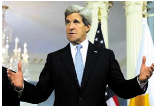
US Secretary of State John Kerry talks to the media at the State Department in Washington on 10 May, 2013.