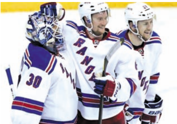
New York Rangers goalie Henrik Lundqvist (30) celebrates defeating the Washington Capitals with teammates Anton Stralman (6) and Derek Stepan (21) during Game 7 of their NHL Eastern Conference quarterfinal playoff hockey game in Washington on 13 May, 2013.

New Year's Day, which next year will pit the Detroit Red Wings and Toronto Maple Leafs at Michigan Stadium, the football venue for the University of Michigan in Ann Arbor.