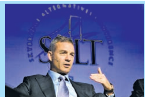
Daniel S. Loeb, founder of Third Point, participates in a panel discussion in Las Vegas.

Although Sony Entertainment, which includes artists like Beyonce and Adele and hit franchises like "Spider-Man", brought in 37 percent of the company's