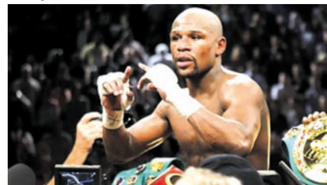
Undeclared WBC welterweight champion Floyd Mayweather Jr of the US celebrates his victory over Robert Guerrero, also of the US, at the MGM Grand Garden Arena in Las Vegas, Nevada on 4 May, 2013.