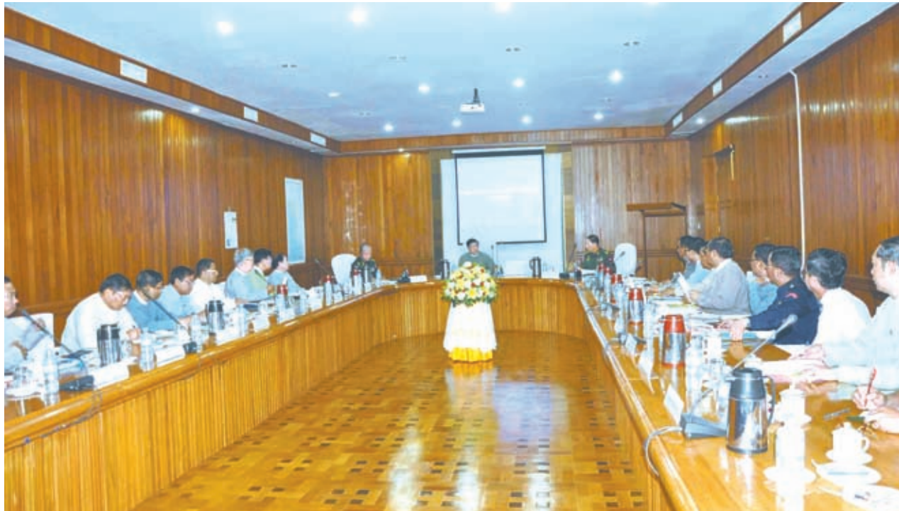
The meeting came to an end with assessment and coordination of the reports by Vice-President U Nyan Tun.

Those present presented reports on preparations for the cyclonic storm Mahasen.