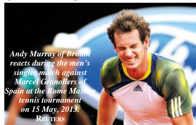
Andy Murray of Britain reacts during the men's singles match against Marcel Granollers of Spain at the Rome Masters tennis tournament on 15 May, 2013.