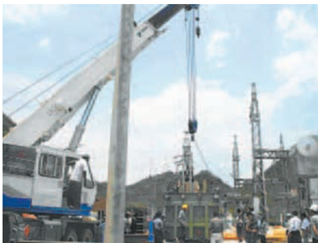
Installation of a new transformer in Lashio power plant in progress.

LASHIO, 16 May—Lashio will receive more electricity from national grid as the power plant in the northern Shan State town has installed new 66/33 KV transformer.