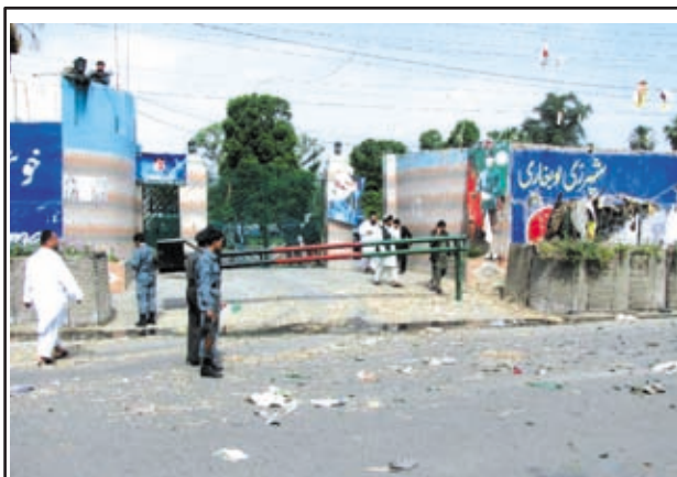
Policemen inspect the blast site in Jalalabad, capital of east Afghanistan's Nangarhar Province, on 15 May, 2013. A policeman was killed, another policeman and seven civilians were wounded when an IED went off in Jalalabad on Wednesday.—XINHUA

Between 2009 and 2011, the researchers tested nasal swabs from more than 900 marine mammals from 10 different species off the Pacific Coast from Alaska to California.—Xinhua