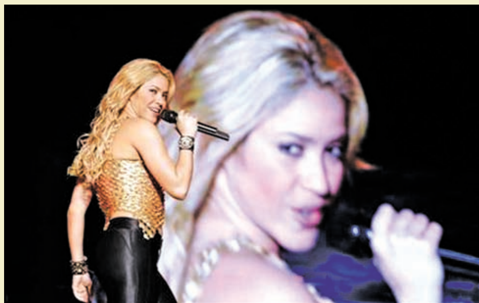
Colombian pop star Shakira performs during her concert in Caracas, on 27 March, 2011. Shakira is currently on her The Sun Comes Out World Tour.

"These are minor things, so there is no point feeling sad or ignored. Moreover, whatever is best for the film should be done," she added. She concluded by saying: "I have been working since I was 17 and have completed seven years here. So when you have that much experience, you know that films come and go. They are not everything. We do also have our own life." —PTI