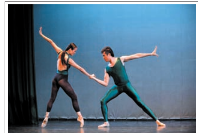
Members of the National Ballet of China perform at the Beijing Institute of Fashion Technology in Beijing, capital of China, on 14 May, 2013. The performance was part of the activity of “introducing high arts to schools”, which was started in 2006 and was aimed at improving the aesthetic faculties of the young.