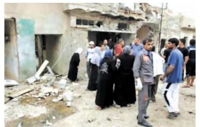
Residents gather at the site of a bomb attack in Kirkuk, 250 km (155 miles) north of Baghdad, on 15 May, 2013.