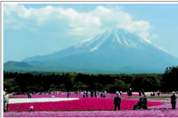
Photo taken on 14 May, 2013 shows the Fuji Mountain seen behind blossoming Shiba Sakura in Japan’s Yamanashi Prefecture. According to local media, the Fuji Mountain will likely be added to the list of UNESCO World Heritage Sites next month after an influential advisory panel to the UN cultural body made a recommendation.