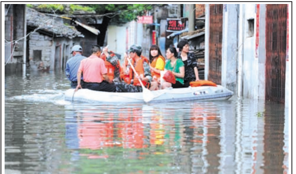
Rescuers evacuate the stranded residents on the old Jingshan Street in Nanchang City, capital of east China's Jiangxi Province, on May, 2013. A heavy rainfall hit Jiangxi Province on 14 May. The average rainfall of the Province reached 46.4 millimetres, with that of Nanchang climbing to the highest of 71 millimetres on 15 May.

Bolivia and Brazil share a 3,700-kilometer borderline and the most vulnerable points are in San Matias, Puerto Quijarro and Cobija.—Xinhua