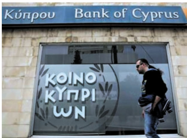
A man walks past a branch of Bank of Cyprus in Nicosia on 31 March, 2013.

WASHINGTON, 16 May —The International Monetary Fund's executive board approved a $1.3 billion, three-year loan to Cyprus on Wednesday, part of a larger international bailout to help the Mediterranean country avoid defaulting on its debt.