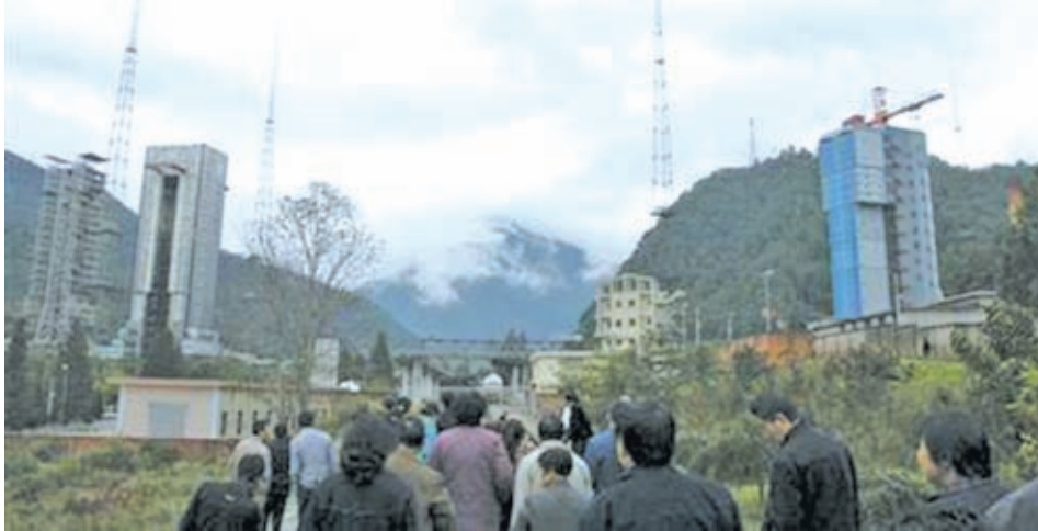
Visitors tour the Xichang Satellite Launch Centre in southwest China's Sichuan province on 18 Oct, 2007.

WASHINGTON, 16 May—China launched a large missile on Monday that reached 6,200 miles above the earth, its highest suborbital launch since 1976, according to a US scientist at Harvard University.