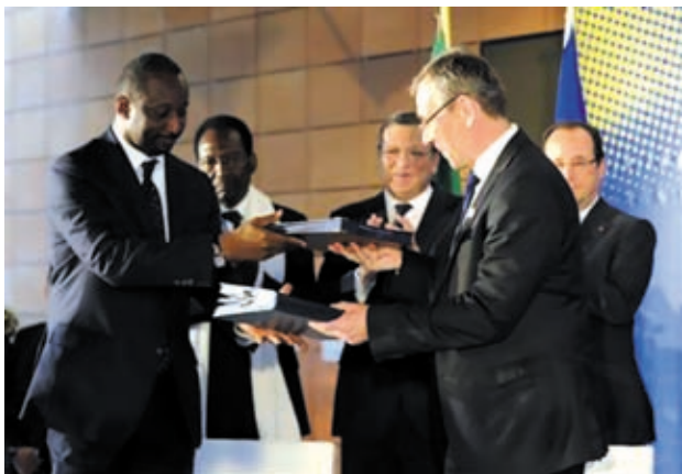
European Union Commissioner for Development Andris Piebalgs (R) exchanges documents with Mali's Foreign Minister Tieman Hubert Coulibaly (L) after signing the financial convention, as French's President Francois Hollande (back R), European Commission President Jose Manuel Barroso (back C) and Mali's interim President Dioncounda Traore observe the ceremony, at the donors' conference on the development of Mali in Brussels on 15 May, 2013.

BRUSSELS, 16 May—International donors pledged 3.25 billion euros ($4.22 billion) on Wednesday to help Mali recover from a conflict with al-Qaeda linked Islamists, exceeding the West African country's target.