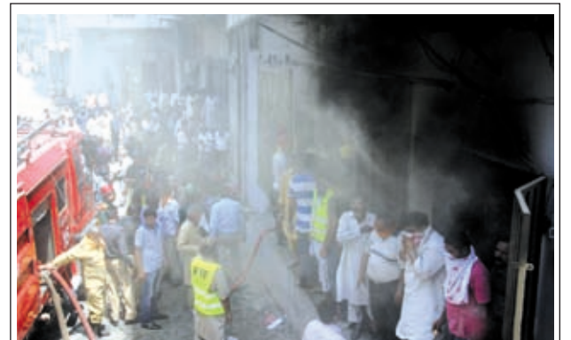
Firefighters and people gather at the fire site in eastern Pakistan’s Lahore, on 15 May, 2013. No loss of life was reported as an electronics warehouse caught fire in Lahore on Wednesday, local media reported.