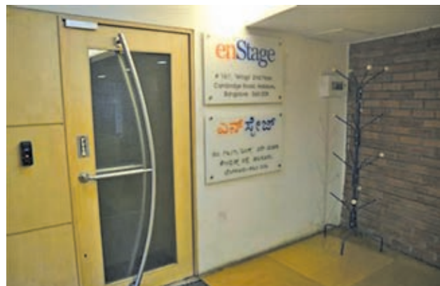
The EnStage Inc office is seen in the southern Indian city of Bangalore in this 12 May, 2013 file photo.

research, risk-management and processing of insurance claims. Lured by a tech-savvy English-speaking population and wages that can be one-fifth those in the West, more than three-quarters of global banks have a direct or third-party offshore presence in India. Indian IT firms, led by outsourcers such as Tata Consultancy Services and Infosys, argue that security breaches are rare.