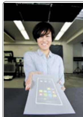
A University of Tokyo team demonstrates in Tokyo on 15 May, 2013, a system to project the screen of a smartphone on a fast-moving object such as paper or a human palm.

Thailand will set up a committee to specially study the possibility of selling essential products to Bangladesh on a government-to-government basis, he said. The two countries had also agreed to promote business and investments and abolish obstacles to boost bilateral trade, he said.—Xinhua