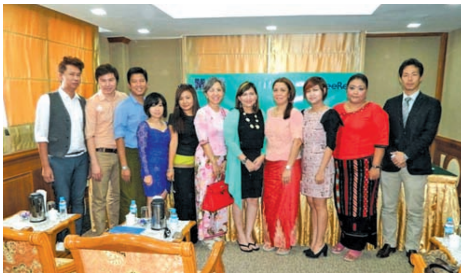
Photo shows Myanmar fashion designers who will attend 2013 ASEAN Fashion Week to be held in Kyoto of Japan.

YANGON, 16 May— Myanmar fashion designer will take part in 2013 ASEAN Fashion Week to be held in Kyoto of Japan on 28-31 May.