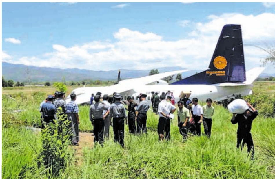
Myanma Airways' plane skids while landing on the runway of Monghsat Airport.