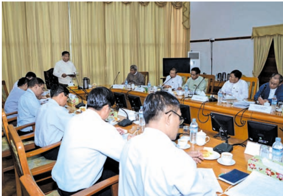
Automobile Import Supervisory Committee Meeting in progress.

NAY PYI TAW, 16 May— Vehicles with damaged bonnet and body will be confiscated in line with legal procedures and sent to foundry, according to Automobile Import