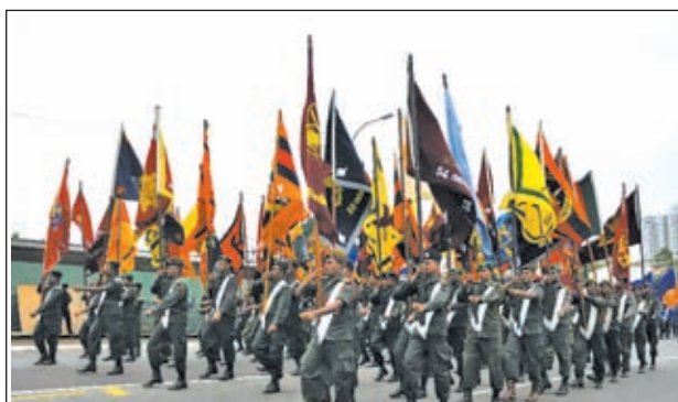
Sri Lankan army personnel march during the Victory Day parade rehearsal in Colombo, capital of Sri Lanka, on 15 May, 2013. Sri Lanka celebrates War Heroes Week with a military parade scheduled for May 18. The parade celebrates the fourth anniversary of the defeat of the Tamil Tiger rebels in May 2009, ending a 37-year long separatist conflict.