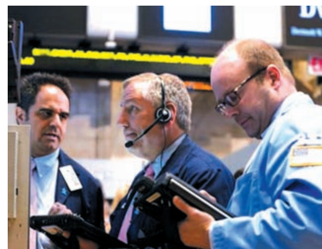
Traders work on the floor at the New York Stock Exchange, on 1 May, 2013.

The dollar extended its gains from Thursday