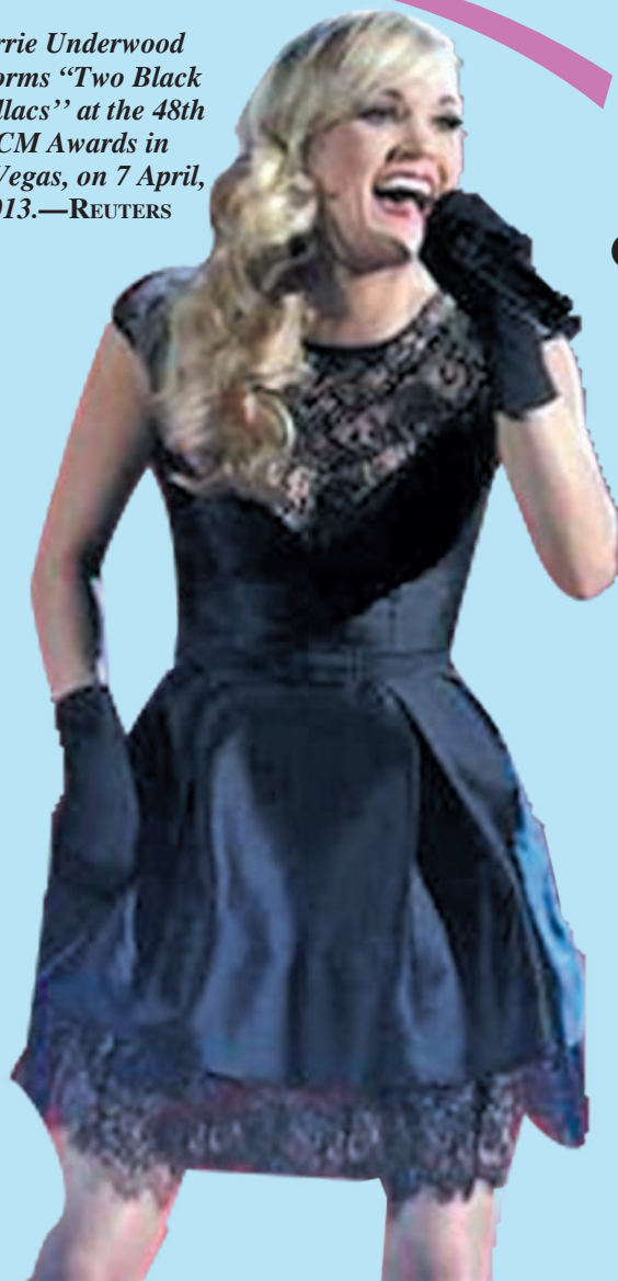
Carrie Underwood performs “Two Black Cadillacs” at the 48th ACM Awards in Las Vegas, on 7 April, 2013.