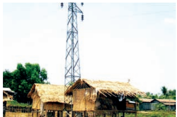
Photo shows the electric pylon seen in its original position.