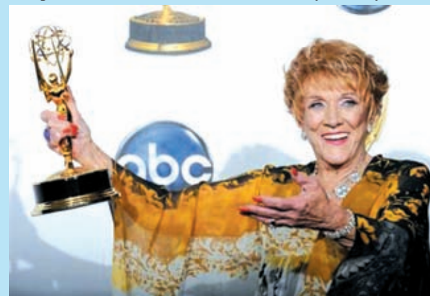
Outstanding Lead Actress Jeanne Cooper from “The Young and the Restless” poses with her award at the 35th Annual Daytime Emmy Awards at the Kodak theatre in Hollywood, California on 20 June, 2008.

Bernsen had been updating the status of Cooper’s health on Facebook and Twitter over the past few weeks. Neither the cause of Cooper’s death nor what she had been suffering from has been disclosed.