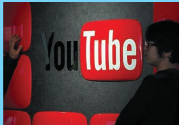
Visitors stand in front of a logo of YouTube at the YouTube Space Tokyo, operated by Google, in Tokyo on 14 February, 2013.