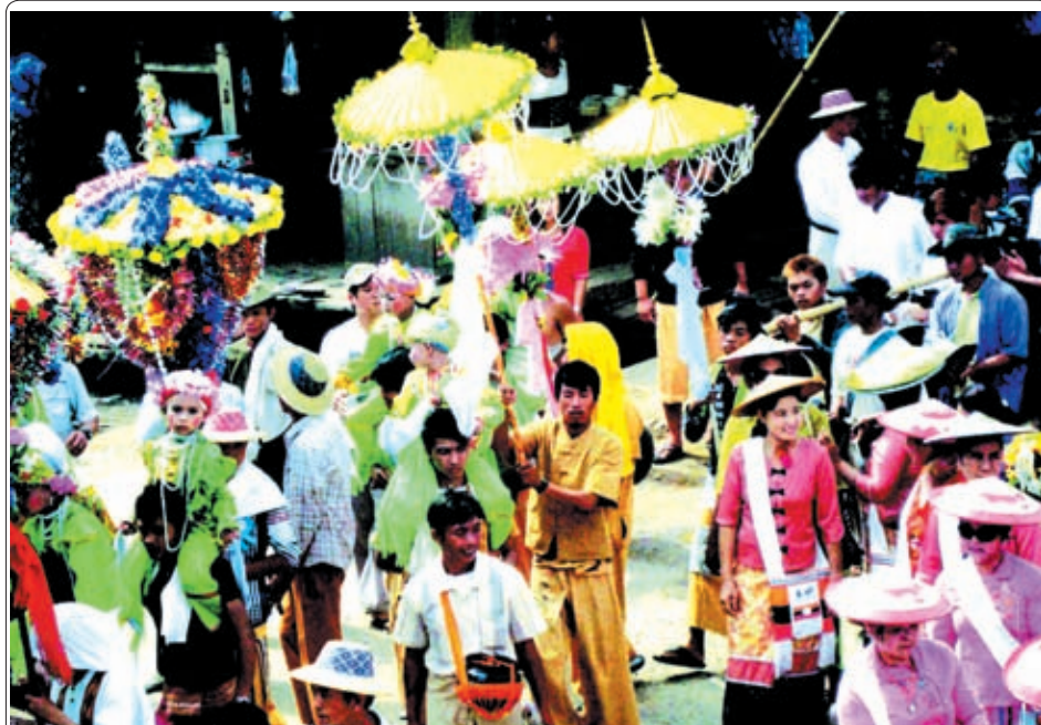
Photo shows a ceremonial round of visits with the novice-to-be ensconced in the procession in downtown Kyaukse on 6 May morning. A total of 57 boys of Shan national race farmers were initiated into the Buddhist order at Kanmein monastery in Tagundine village in accord with Shan tradition.