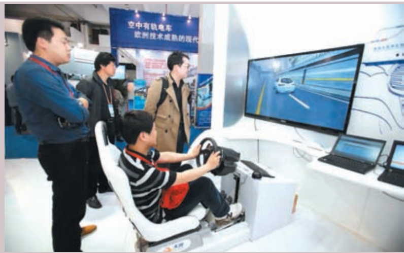
A visitor experiences the driving simulation system during the China (Shanghai) International Technology Fair in Shanghai, east China, on 8 May, 2013.