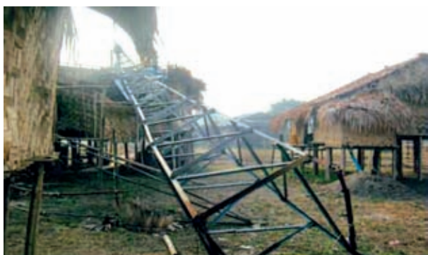
Photo shows an electric pylon falling on a house on Bo Min Yaung 7 th street in Ottha Myothit ward-7 in Bago where strong winds accompanied by light rains touched down at 7 am on 7 May. No casualties were reported.