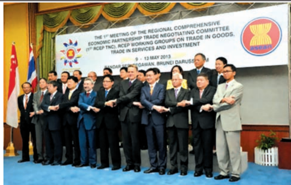
Delegates from 16 Asia-Pacific nations pose for photos in Bandar Seri Begawan, Brunei, on 9 May, 2013, prior to the first round of negotiations of the Regional Comprehensive Economic Partnership.

The ASEAN countries are Brunei, Cambodia, Indonesia, Laos, Malaysia, Myanmar, the Philippines,