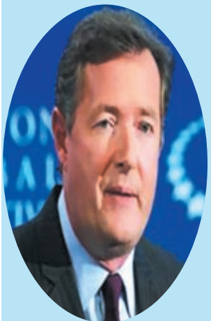
Television host Piers Morgan hosts a conversation titled “Communication by Design: Inspirational Change” during the final day of the Clinton Global Initiative 2012 (CGI) in New York on 25 Sept, 2012.

LOS ANGELES, 10 May—The world of tabloid journalism, London-style, will be showcased in a new television series executive-produced by CNN host Piers Morgan, who is also a former editor of two of Britain’s popular newspapers.