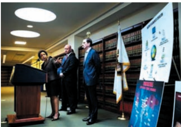
Loretta Lynch, United States Attorney for the Eastern District of New York, speaks at a news conference in New York, on 9 May, 2013.