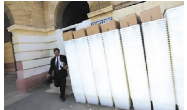
A man walks past rows of election ballot boxes, before they are transported to polling offices, in the premises of the district city court in Karachi on 8 May, 2013.

Since April, the al-Qaeda-linked Pakistani Taleban have killed more than 100