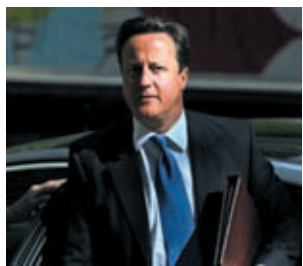
Britain's Prime Minister David Cameron arrives at the Global Investment Conference in London on 9 May, 2013.

LONDON, 10 May — British Prime Minister David Cameron took on critics in his own Conservative party on Thursday, saying it would be wrong for Britain to leave the European Union. Some pessimists