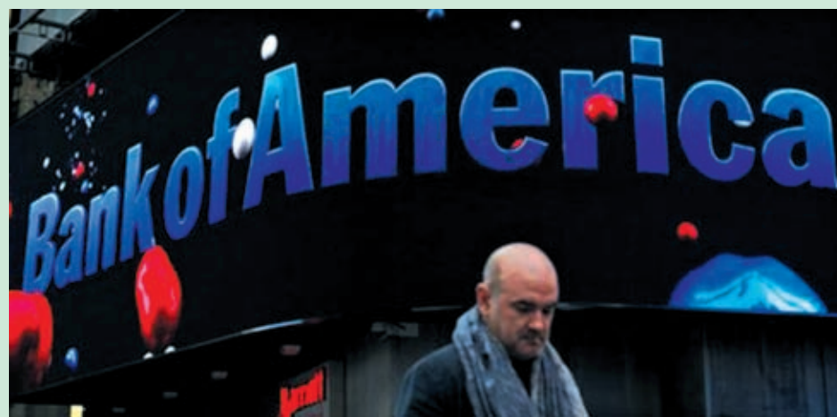
A man walks next to a Bank of America branch in New York on 24 Oct, 2012.

KeyBank Real Estate Capital said in a statement it will more than double its servicing portfolio to $205 billion with the acquisition, which includes about $14