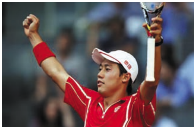
Kei Nishikori of Japan

Nishikori will play another Spaniard, wild card Pablo Andujar, for a place in Saturday's semi-finals, while a chastened Federer heads back to the practice court ahead of next week's Rome Masters.