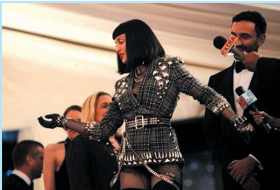
Singer Madonna arrives at the Metropolitan Museum of Art Costume Institute Benefit celebrating the opening of “PUNK: Chaos to Couture” in New York, on 6 May, 2013.

The mother of four, including two adopted children from Malawi, is planning to build 10 schools in the African nation.