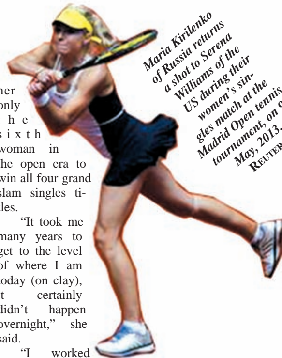
Maria Kirilenko of Russia returns a shot to Serena Williams of the US during their women's singles match at the Madrid Open tennis tournament, on 9 May, 2013.