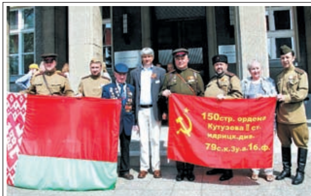
Delegates from Russia and Belarus and veterans of former Soviet Red Army hold banners and flags in front of the German-Russian Museum in Karlshorst, Berlin, Germany, on 8 May, 2013. People from across Europe commemorated on Wednesday, in one way or another, the 68th Victory in Europe Day (VE Day) that marks the end of the Second World War (WWII) in Europe.