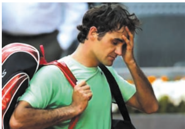
Roger Federer of Switzerland

MADRID, 10 May — Roger Federer's hopes of claiming a second straight Madrid Open title were dashed when the world number two suffered a surprise 6-4, 1-6, 6-2 third-round defeat to Japanese young gun Kei Nishikori on Thursday.