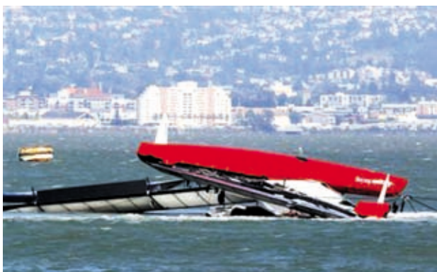
The Artemis Racing yacht is towed to shore after capsizing in the San Francisco Bay, California on 9 May, 2013.