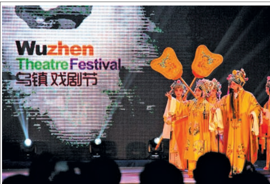
Artists from Suzhou Kunqu Opera Theatre perform during the opening ceremony of the Wuzhen Theatre Festival in Wuzhen, east China's Zhejiang Province, on 9 May, 2013. The festival which will last till 19 May kicked off on Thursday.

AGENT FOR: VAN BLOOM SHIPPING LTD Phone No: 256924/256914