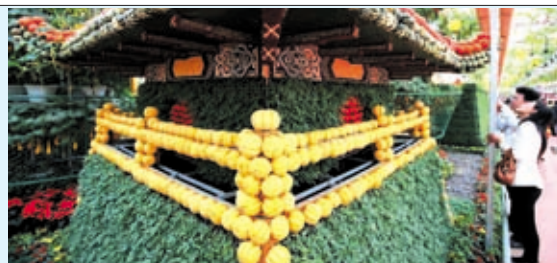
Visitors watch a “sculpture” formed by vegetables during the 14 th China (Shouguang) International Vegetable Fair in Shouguang, east China’s Shandong Province, on 8 May, 2013.