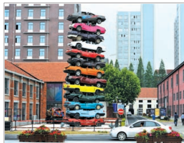
Car pyramid sculpture unveiled in C China.

Vietnamese staff hold scissors for a ribbon-cutting ceremony at Hanoi station prior to the departure of a Japan-Vietnam friendship train on 8 May, 2013. The train service between Hanoi and Ho Chi Minh City began operating the same day to celebrate Japan-Vietnam friendship year, as 2013 marks the 40th anniversary of the establishment of diplomatic relations between the two countries.