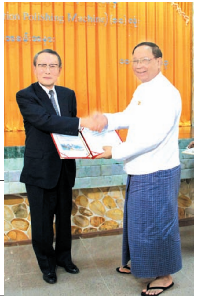
Handing over ceremony of ten polishing machines by Mitsubishi Corporation to Mines Ministry in progress.