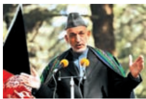
Afghan President Hamid Karzai

KABUL, 10 May — Afghan President Hamid Karzai on Thursday put pre-conditions for inking the Bilateral Security Agreement (BSA) with the United States, saying one of conditions is to ensure durable peace in the militancy-plagued country.”