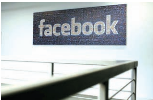
The Facebook logo is pictured in the Facebook headquarters in Menlo Park, California on 29 Jan, 2013.

The four-year-old Waze, which has 47 million users, has raised $67 million in funding to date