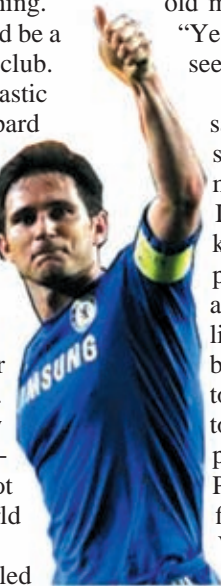
Chelsea's Frank Lampard celebrates after winning against FC Basel in their Europa League semi-final second leg soccer match at Stamford Bridge in London on 2 May, 2013.

Chelsea to two Premier League triumphs in his previous spell at Stamford Bridge from 2004-07 before moving on to Inter Milan and then Real.