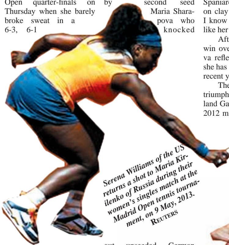
Serena Williams of the US returns a shot to Maria Kirilenko of Russia during their women's singles match at the Madrid Open tennis tournament, on 9 May, 2013.

fourth title of the year and the 50th of her career, was joined in the quarter-finals by second seed Maria Sharapova who knocked