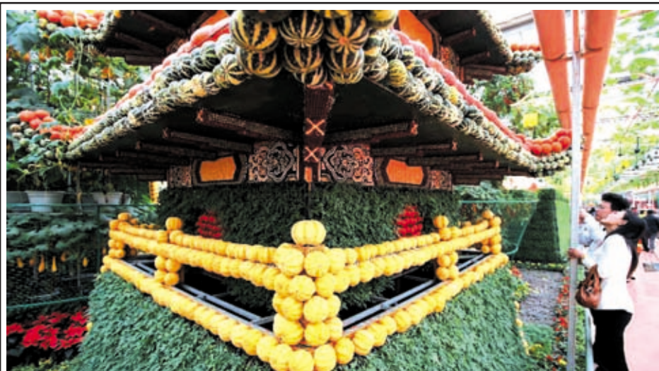
Visitors watch a “sculpture” formed by vegetables during the 14th China (Shouguang) International Vegetable Fair in Shouguang, east China’s Shandong Province, on 8 May, 2013.—XINHUA