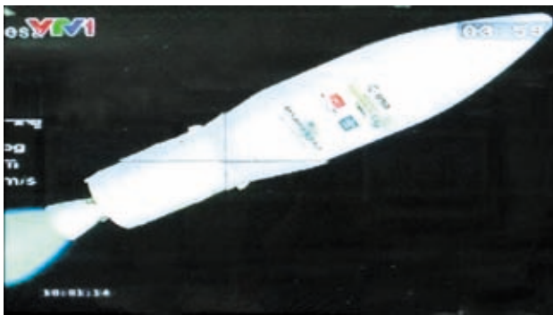
A TV screen grab taken on 7 May, 2013 shows the launching of Vietnam's first remote sensing satellite, VNRED Sat-1 , in Hanoi, Vietnam. After three days of delay due to the bad weather, Vietnam's first remote sensing satellite, VNRED Sat-1 , was successfully launched on Tuesday morning by Arianespace from the Guiana Space Centre, French Guiana, local media reported.

VNRED Sat-1 will provide high-resolution satellite images that will serve social and economic development purposes, such as natural resources management, environmental protection, and natural disaster detection and control.