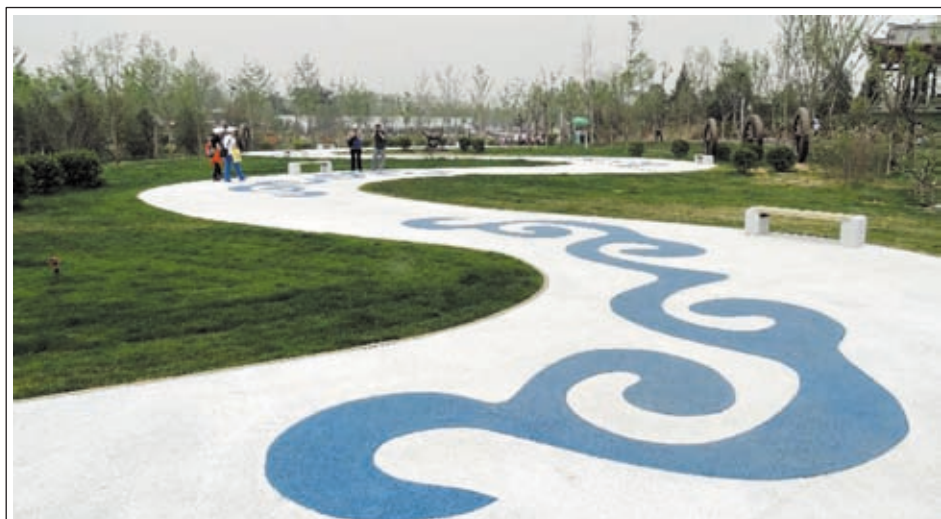
Photo taken on 7 May, 2013 shows a road with designs in style of Mongolian ethnic group at the Beijing Garden Expo Park in Beijing, capital of China. The 9th China (Beijing) International Garden Expo will open on 18 May.