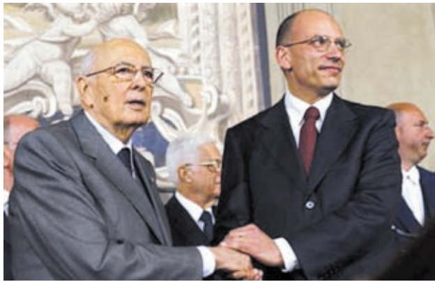
Italian Prime Minister-designate and deputy leader of the centre-left Democratic Party (PD) Enrico Letta (R) shakes hands with President Giorgio Napolitano at the Quirinale Palace in Rome in this 27 April, 2013 file photo.—REUTERS

No group claimed responsibility for the attack yet. Political gatherings are frequently being attacked in the country as general elections are approaching on 1 May.—Xinhua