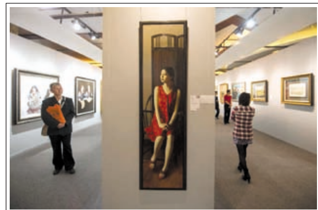
People visit the preview of China Guardian 2013 Spring Auctions in Beijing, capital of China, on 7 May, 2013. The three-day preview that opened on Tuesday displayed some 3,900 treasures to be auctioned on Friday.