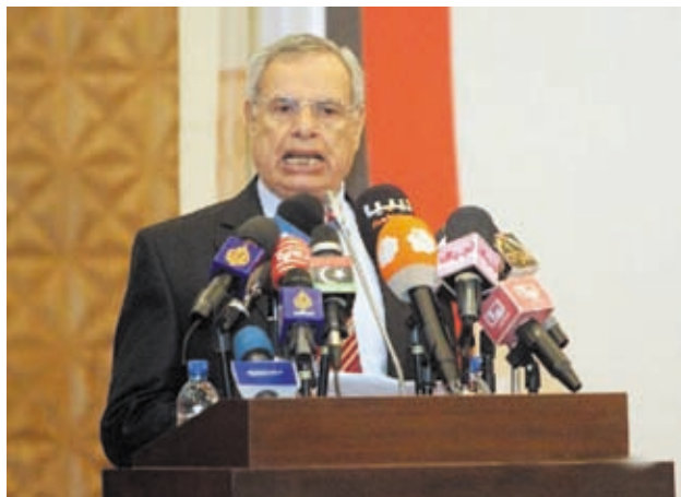
The file photo taken on 20 April, 2013 shows Libyan Defence Minister Mohamed al-Bargathi speaks during an event. Mohamed al-Bargathi tendered his resignation to the Libyan Prime Minister on Tuesday, state-run Libyan news agency reported.

TRIPOLI, 8 May—Libyan Defence Minister Mohamed al-Bargathi tendered his resignation to the Libyan Prime Minister on Tuesday, state-run Libyan news agency reported.