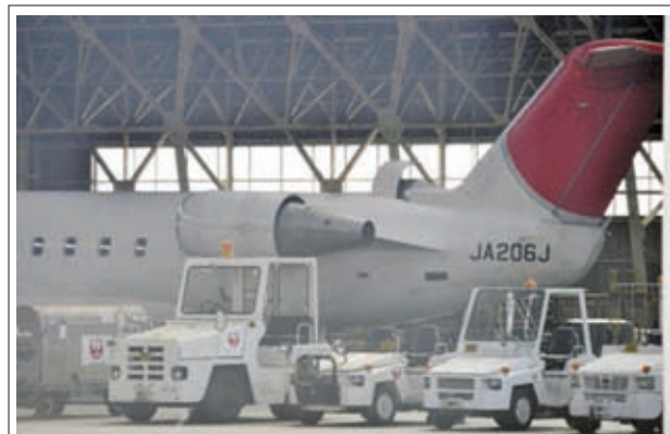
A Bombardier CRJ200 operated by J-Air Corp, a Japan Airlines Co group firm, is parked at Osaka airport in western Japan on 7 May, 2013, after one of its engines caught fire after landing at the airport the previous day.