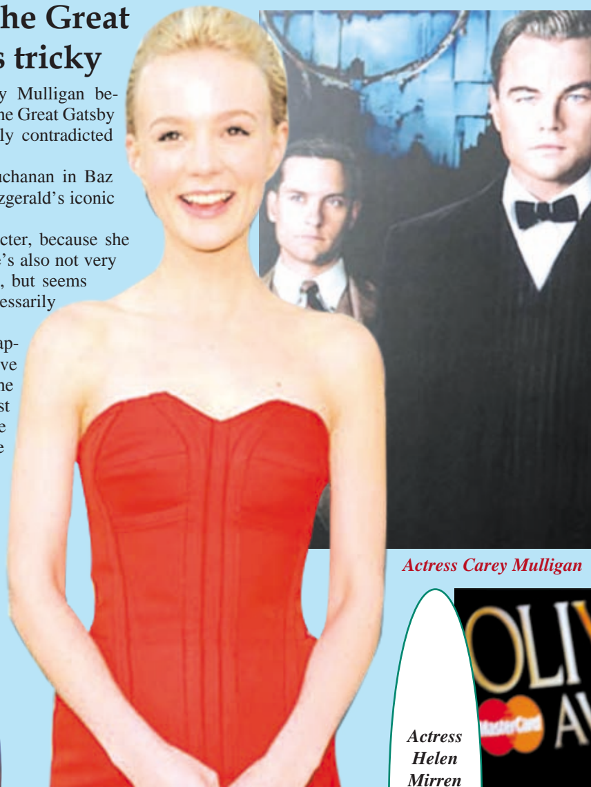
Actress Carey Mulligan

The Great Gatsby is slated for a release in the US on 10 May and in UK on 16 May.—PTI