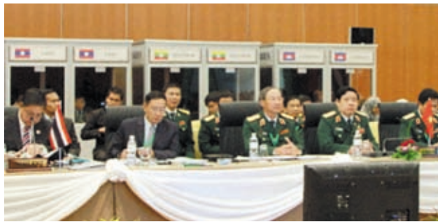
Photo shows participants at an ASEAN defence ministers' meeting in Bandar Seri Begawan, Brunei, on 7 May, 2013, its second and final day.

BANDAR SERI BEGAWAN, 8 May—China vowed on Tuesday to strengthen defence and security cooperation with ASEAN countries and seek peaceful solutions to territorial disputes in the South China Sea.