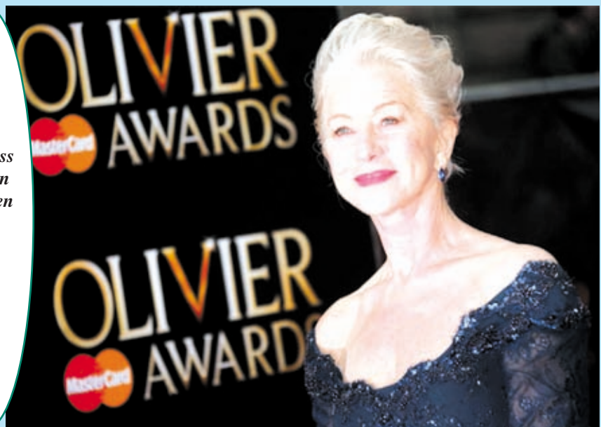
Actress Helen Mirren

Usher, who first recorded the song as a demo for his 2010 album "Raymond v Raymond," later recorded a remix version with Bieber singing backing vocals on the song. The lawsuit lists 19 defendants, including record label Universal Music Corp, a unit of French media company Vivendi.—Reuters