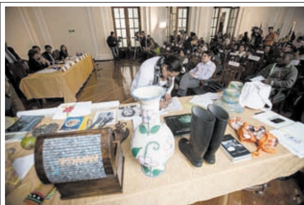
A resident participates in the second phase of the Regional Tables for Peace at Republic’s Congress, in Bogota, capital of Colombia, on 6 May, 2013. During the opening session called by congress commissions for peace and supported by United Nations (UN), armed conflict victims participated with objects and testimonies to be exposed during the dialogues between Colombian government and Colombia’s Revolutionary Armed Forces (FARC, for its acronym in Spanish), in Havana, capital of Cuba.