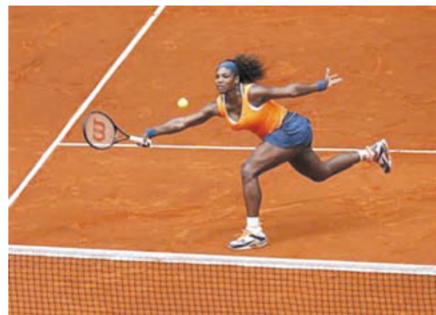
World number one and defending champion Serena Williams

Sharapova, a former number one who won her 29th career title in Stuttgart last month, will play Sabine Lisicki for a place in the last eight. The unseeded German upset 15th seed Dominika Cibulkova