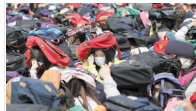
Elementary school students participate in an earthquake drill in Seoul, South Korea, on 7 May, 2013.

was a precursor to Exercise Southern Katipo later in the year, which would have an even greater international contribution, said the statement without giving details.—Xinhua