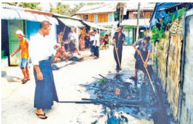
Photo shows dredging of drains for proper flow of water ahead of rainy season being carried out by ward dwellers and auxiliary fire brigade members led by the ward administrator at Ywama (west) ward in Insein Township of Yangon.— KYEMON

Moreover, plans are underway to install 66 KV Mawlamyine-Chaungzon power line and 66 KV Mawlamyine-Thanyuayay power line in order to supply more electricity to Mon State.— Kyemon