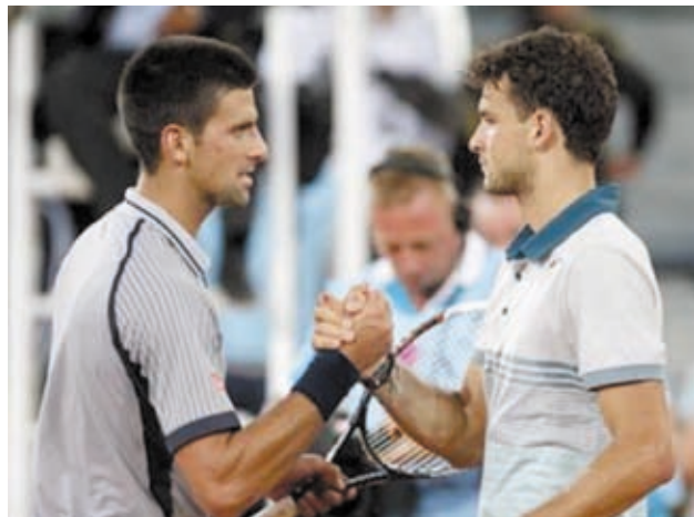
Novak Djokovic of Serbia (L) congratulates Grigor Dimitrov of Bulgaria on his victory at the end of their men's singles match at the Madrid Open tennis tournament on 7 May, 2013.

After a lengthy medical timeout, he managed to break back and saved a match point on the way to