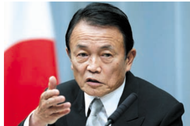
Japanese Finance Minister Taro Aso