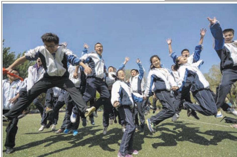
Students cheer for their coming-of-age ceremony at Bayi Middle School in Urumqi, capital of northwest China’s Xinjiang Uygur Autonomous Region, on 7 May, 2013. More than 800 senior high school students in Bayi Middle School attended their coming-of-age ceremony on Tuesday.