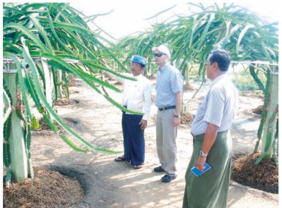
Union Minister for Agriculture and Irrigation U Myint Hlaing and Israeli Ambassador to Myanmar Mr. Hagay Moshe Behar visit Dragon fruit plantation in irrigated area of Ngaleik Dam.—MNA

Then they proceeded to Ahlyinlo village in Pinyin Township where they viewed round 440-acre Palethwe summer paddy plantation, farmer educative farmland, paddy strain booth, dragon ball plantation, cattle breeding farms, farm equipment