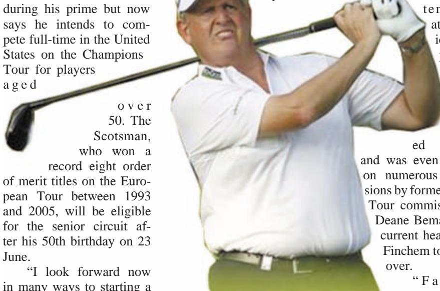
Colin Montgomerie of Scotland

my life to come over here now," Montgomerie told reporters on Monday be-