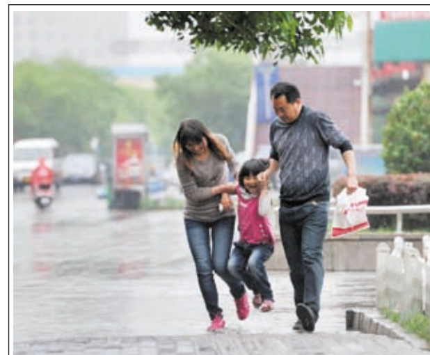
A family cross a water hole formed by rainwater in Yinchuan, capital of northwest China's Ningxia Hui Autonomous Region, on 7 May, 2013. The local meteorological observatory issued a yellow alert on thunderstorm on Tuesday as a thunderstorm hit Yinchuan the same day.