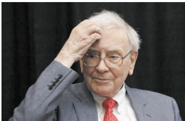
Berkshire Hathaway CEO Warren Buffett pauses during a bridge game in Omaha on 5 May, 2013 the day after company's annual meeting.