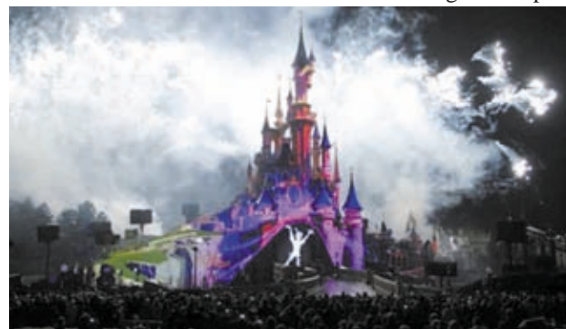
The crowd watches the premiere of the new Disney Dreams show as part of the 20th anniversary celebrations of Disneyland Resort in Marne-la-Vallee, outside Paris on 31 March, 2012.

"The product that we recently put online really worked, like California Adventure and Fantasyland, and the product we had online for years and years in many respects looked better to consumers," Iger told analysts on a conference call. Profit rose 8 percent at the media networks unit, the company's largest division, helped by higher advertising and fees from cable operators at sports network ESPN.—Reuters