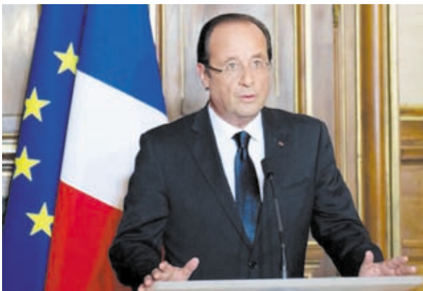
French President Francois Hollande