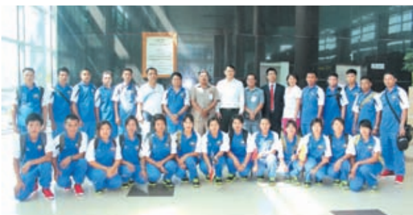
Members of Myanmar shooting team seen at Yangon International Airport before their departure for China.

With amity China would bare every expense in the joint training between Myanmar and Chinese athletes.