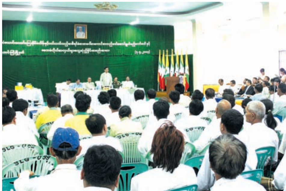
Chairman of the Committee for implementation of Letpadaungtaung Copper Mine Project Report Union Minister at President Office U Hla Tun meets local people in Salingyi Township.—MNA

After that, the Union minister and party attended coordination meeting with Committee members for implementation of Letpadaungtaung Copper Mine Project Report and local representatives at Garment Factory in Salingyi Township.