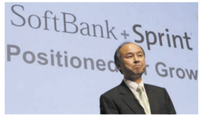
Softbank Corp President Masayoshi Son speaks during a news conference in Tokyo on 30 April, 2013.

The executive for the Japanese mobile operator may have a tough time selling the deal, as several