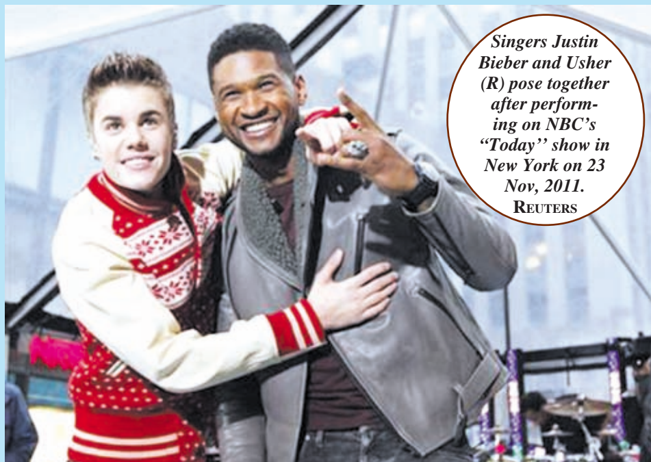
Singers Justin Bieber and Usher (R) pose together after performing on NBC's "Today" show in New York on 23 Nov, 2011.

"It was sunny day without a cloud in the sky. There were cheers of 'Well done, Keira' when she came out, but there were so few people present so they didn't make much noise. "It was amusing to see them being driven away in a battered old Renault Clio — it certainly looked as though