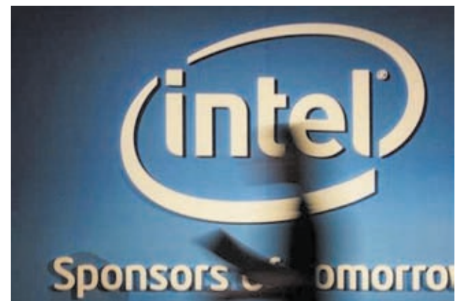
A woman walks past an Intel logo at the 2012 Computex in Taipei on 5 June, 2012.