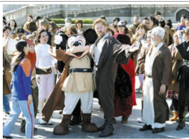
Guests dress as characters from Star Wars as a revamped Star Tours attraction begins operation at Tokyo Disneyland in Urayasu, Chiba Prefecture, on 7 May, 2013. The attraction, inspired by the “Star Wars” movie franchise, reopened following a 7 billion yen makeover, its first since opening in 1989.—KYODO NEWS

Any of the prohibited devices or articles found in a luggage can be used as grounds to arrest the person in possession of such devices or articles,” the DFA said.—Xinhua