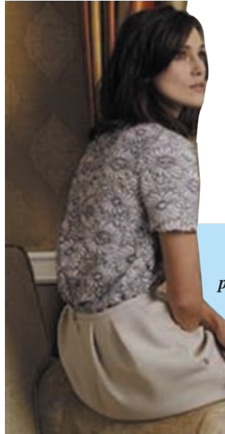
Cast member Keira Knightley poses for a portrait while promoting the upcoming movie "Anna Karenina" in Los Angeles, California on 13 Nov, 2012.