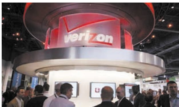
Showgoers visit the Verizon booth on the first day of the Consumer Electronics Show (CES) in Las Vegas.

“I think shareholders would be willing to accept a price as high as $130 billion because it would still be accretive to Verizon. But the preference would be a lower price like $120 billion,” Leopold said. Verizon declined to comment on what it might be willing to pay for full ownership of Verizon Wireless, and it is not clear if the company would be willing to go beyond $100 billion, which would already be the third-largest deal on record.—Reuters