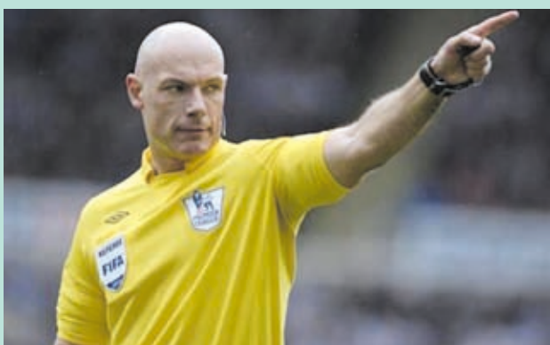
Referee Howard Webb points during the English Premier League soccer match between Newcastle United and Sunderland in Newcastle, northern England on 14 April, 2013.—REUTERS

“We talked about the limitations because you are not always aware of what’s happening in the stands,” he said.— Reuters