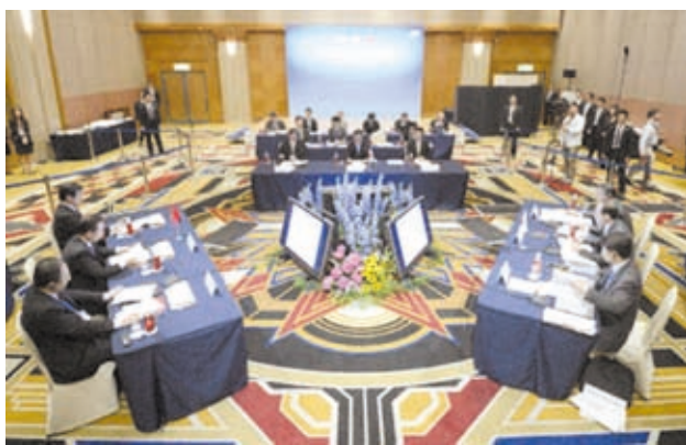
A meeting of Japan, China and South Korea environment ministers is held at a hotel in Kitakyushu, Fukuoka Prefecture, on 6 May, 2013.

The panel will convene regularly to focus on air pollution-related issues, also including reduction of nitrogen oxide, according to the source. Concern in