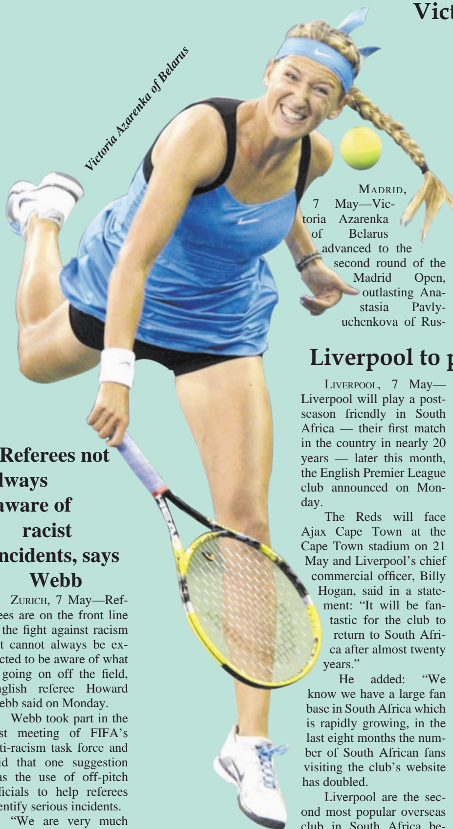
Victoria Azarenka of Belarus

MADRID, 7 May—Victoria Azarenka of Belarus advanced to the second round of the Madrid Open, outlasting Anastasia Pavlyuchenkova of Russia 7-6 (8), 7-6 (3).