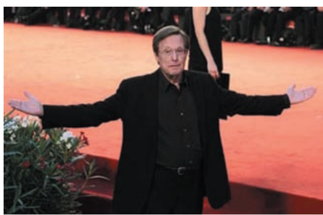
Director William Friedkin gestures during a red carpet for his film "Killer Joe" at the 68th Venice Film Festival on 8 Sept, 2011.

Venice film festival director Alberto Barbera said that Friedkin had made major contributions to US