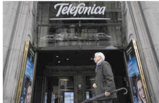
A man walks past Telefonica's building in central Madrid on 26 March, 2013.

selling the service as part of packages with television, internet and home phone offerings. Fixed line specialist Jazztel has also recently made gains in Spain's mobile market. While virtual players still have only a small share of the market, they are attracting new clients as Telefonica and No 2 player Vodafone shed customers.—Reuters