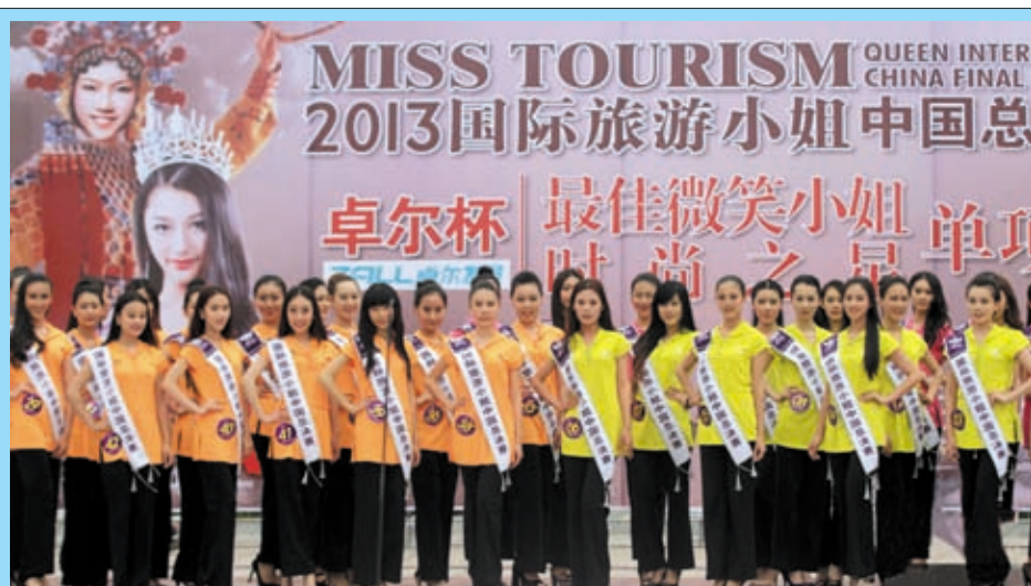
The China Final of 2013 Miss Tourism International rang down the curtain in Huangpi District of Wuhan, capital of central China's Hubei Province, on 5 May, 2013.