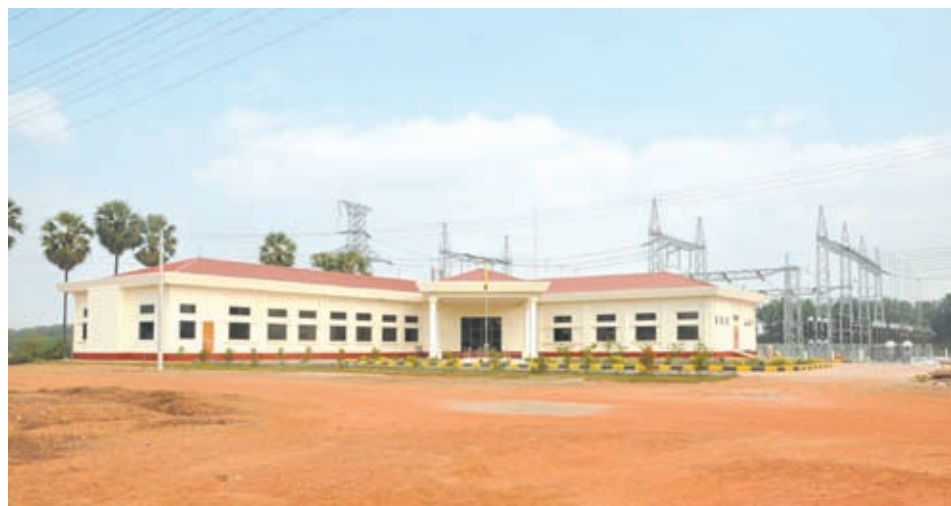
Photo shows newly-opened 230/66/11 KV 100 MVA Mawlamyine Main Sub-Power Station in Mawlamyine.