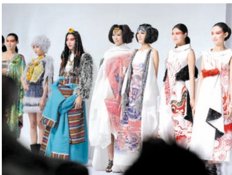
Models present traditional ethnic fashion creations during the 2013 China (Qingdao) International Fashion Week in Qingdao, a coastal city in east China's Shandong Province, on 5 May, 2013.