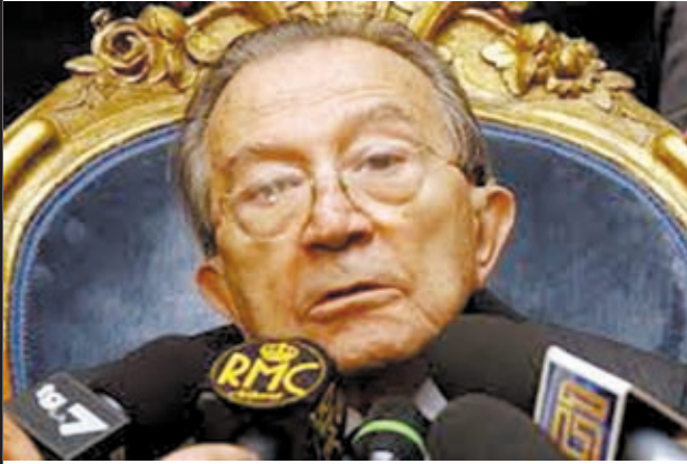
Seven-time Italian prime minister Giulio Andreotti

ROME, 7 May — Seven-time Italian prime minister Giulio Andreotti, one of the central figures of Italian politics for decades, died on Monday at the age of 94.