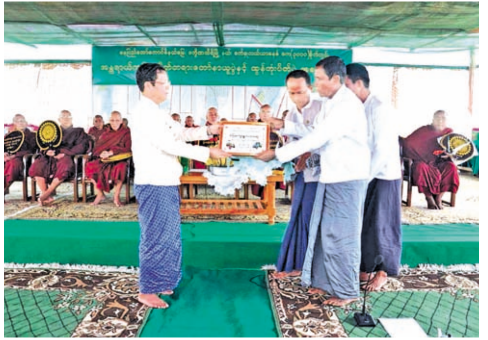
Union Minister U Myint Hlaing presents gifts to outstanding farmers.—MNA

NAY PYI TAW, 7 May—Paritta recitation and finishing of harrowing were