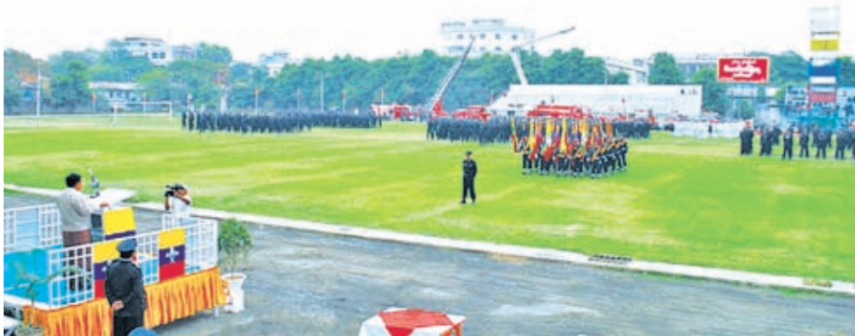
Fire Brigade Day commemorative ceremony in Mandalay in progress.

MANDALAY, 7 May—Mandalay Region observed 67 th Fire Brigade Day at Aungmyay Mandalay Sports