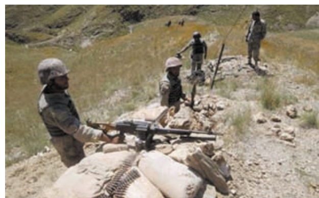
Afghan border policemen take their positions at the Goshta district of Nangarhar Province border, where Afghanistan shares borders with Pakistan, on 2 May, 2013. — REUTERS

Many Afghan leaders say Pakistan is still helping the militants, seeing them as a tool to counter the influence of its old rival, India, in Afghanistan. Pakistan denies helping the Taliban and says it wants peace and stability in its western neighbour.— Reuters