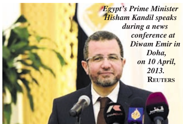
Egypt's Prime Minister Hisham Kandil speaks during a news conference at Diwan Emir in Doha, on 10 April, 2013.

When Kandil's security guards tried to force the vehicle away from the convoy, one of the men fired two shots at their car. The police gave chase and caught the five men, the Interior Ministry said. The incident had no "political motives or other dimensions", it added. The five men were aged between 18 and 29, the Interior Ministry statement said.—Reuters