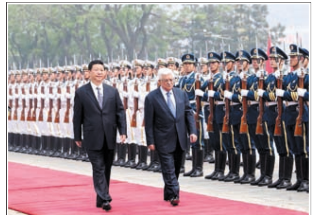
Chinese President Xi Jinping (L) and Palestinian President Mahmoud Abbas review an honour guard during a welcoming ceremony held for Abbas in Beijing, capital of China, on 6 May, 2013.

The meeting was addressed by two JUI-F candidates in adjoining constituencies. Police said one of the candidates was slightly injured. It was first time since the start of the campaign for Saturday's general election that a public meeting of the JUI-F has been attacked. The JUI is seen as a pro-Taliban party.— Kyodo News