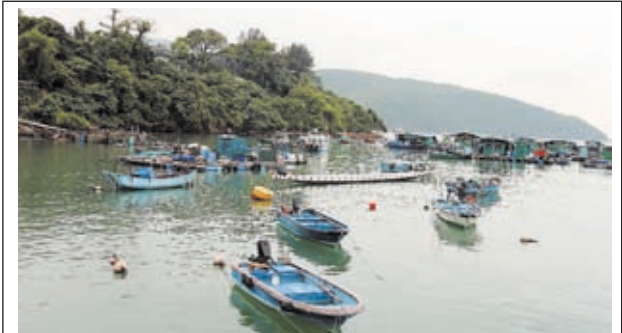
Photo taken on 5 May, 2013 shows the scenery of Ma Wan, an island in south China's Hong Kong. Ma Wan, which got the name from Mazu, the goddess of sailors, used to be a fishing village. Now the Ma Wan Park and Noah's Ark Museum here attract many tourists.