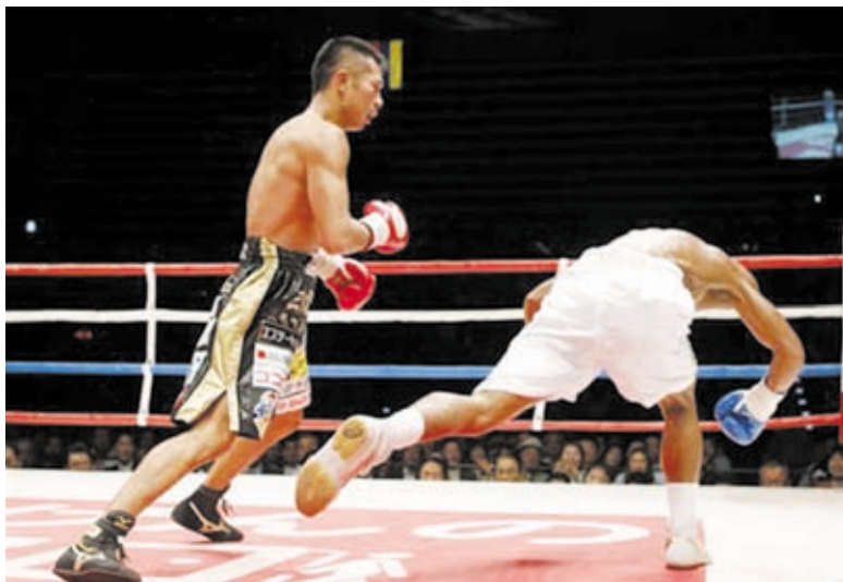
Japanese champion Takashi Uchiyama, left, rushes Venezuelan challenger Jaider Parra in the fourth round of their WBA super featherweight boxing title bout in Tokyo on 6 May, 2013.