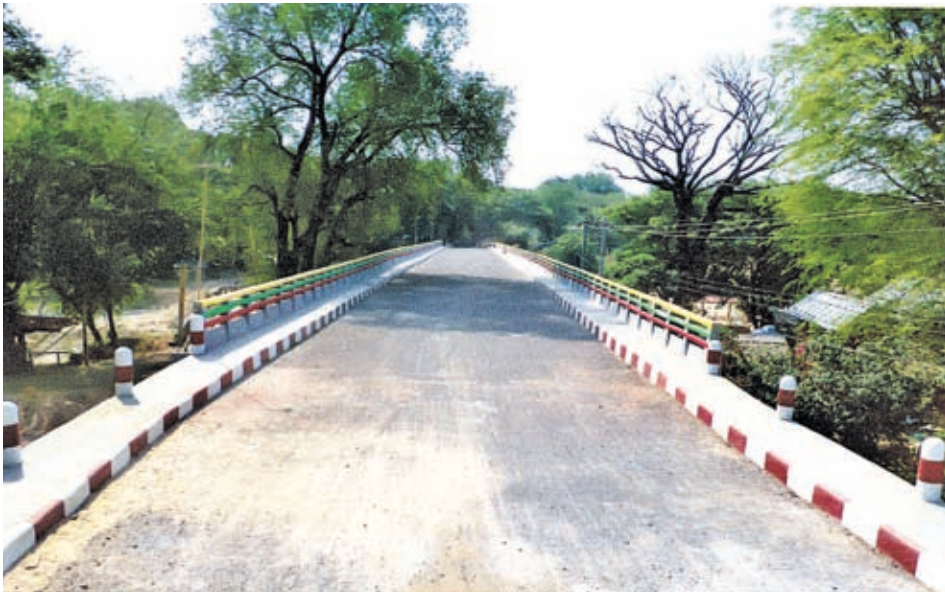
Newly constructed Hsinza bridge will be opened soon.