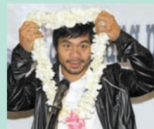
Filipino boxing icon Manny Pacquiao removes his garland of flowers before he delivers his speech upon his arrival at the Ninoy Aquino International Airport in Manila on 12 Dec, 2012.