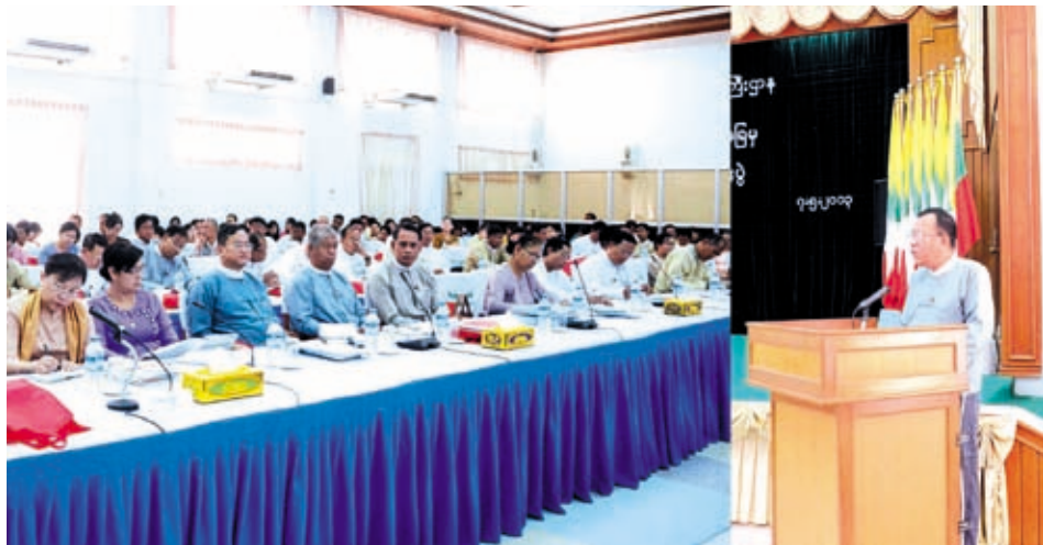
Union Minister Dr Kan Zaw delivers a speech at workshop on drawing bottom-up public participation project.—MNA

NAY PYI TAW, 7 May—Workshop on drawing bottom-up public participation project was held at the Ministry of National Planning and Economic Development,