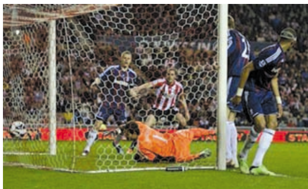
Sunderland's John O'Shea (C) shoots to score against Stoke City during their English Premier League soccer match in Sunderland, northern England on 6 May, 2013.

LONDON, 7 May—John O'Shea scored a second-half equaliser as 10-man Sunderland rescued a 1-1 draw at home to Stoke City on Monday that moved them three points clear of the Premier League relegation zone.