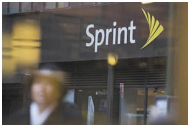
People walk past a Sprint store in New York on 17 Dec, 2012.

“The Clearwire board has unanimously concluded that the proposed transaction with Sprint is the best strategic alternative for stockholders ... especially in light of the company's limited alternatives and the well-known constraints of its liquidity position,” Clearwire said. Four shareholders