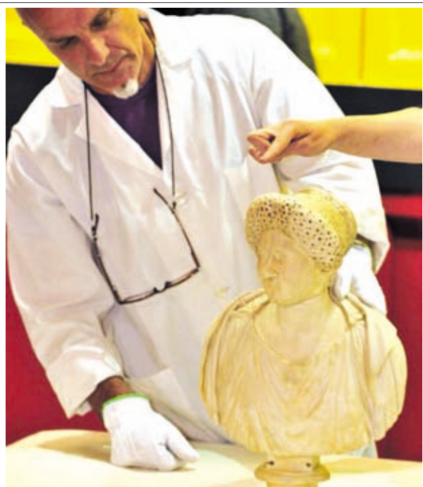
Photo taken on 6 May, 2013 shows a female portrait from the Flavian period during a media preview of the exhibition "A Splendid Time—The Heritage of Imperial Rome" in Taipei, southeast China's Taiwan. About 300 pieces of authentic artworks from the National Archaeological Museum of Florence in Italy will be displayed in the exhibition from 11 May to 18 August.