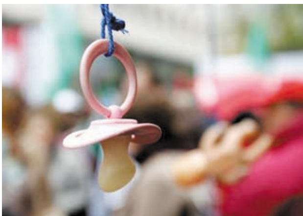
A baby pacifier hangs from an umbrella as part of the props used by union workers in a non-profit sector march in Brussels.

For the new study, researchers recruited pregnant women at one Swedish hospital and followed them and their children through phone calls and exams over three years. The 184 infants