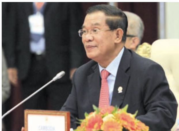
Cambodian Prime Minister Hun Sen

Cambodia is to hold a general election for the 123-seat parliament on 28 July. Political analysts predicted that the CPP of Prime Minister Hun Sen will dominantly win the election. In