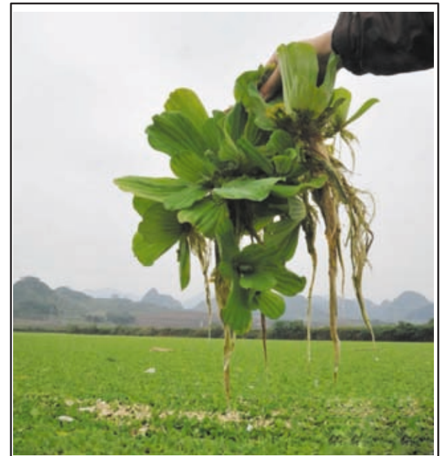
Invasive water plants clog S China river.