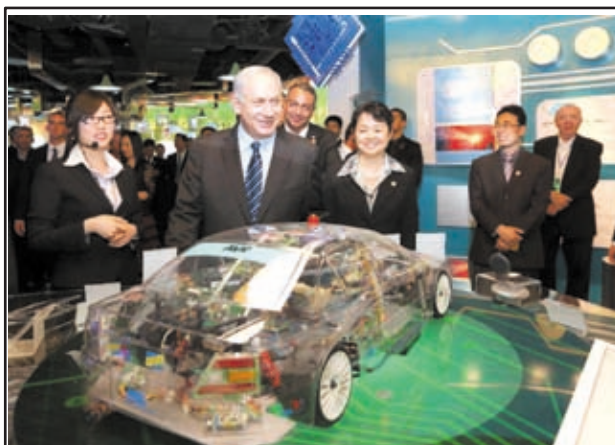
Israeli Prime Minister Benjamin Netanyahu visits the Caohejing Hi-tech Park in east China's Shanghai, on 6 May, 2013. Netanyahu arrived in Shanghai for a visit on Monday.

As one of the French overseas frigates, Vendemiaire has been designed to carry out surveillance missions as well as humanitarian action. It also helps foster maritime cooperation with other countries. The visit is the sixth to the port city by the 20-year-old vessel. During its stay, Vendemiaire will be opened to Vladivostok residents for a close look at the 93.5-metre-long warship.—Xinhua