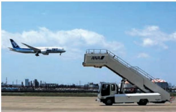
An All Nippon Airways' (ANA) Boeing Co 787 Dreamliner plane lands after a test flight at Haneda Airport in Tokyo on 28 April, 2013.