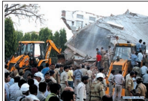
Rescuers work at a collapsed hospital in Bhopal, India, on 26 April, 2013. Around 15 of nearly 20 people trapped under the debris were rescued after ceiling of a hospital collapsed on Friday in Bhopal in north India, according to local news channel CNN-IBN.