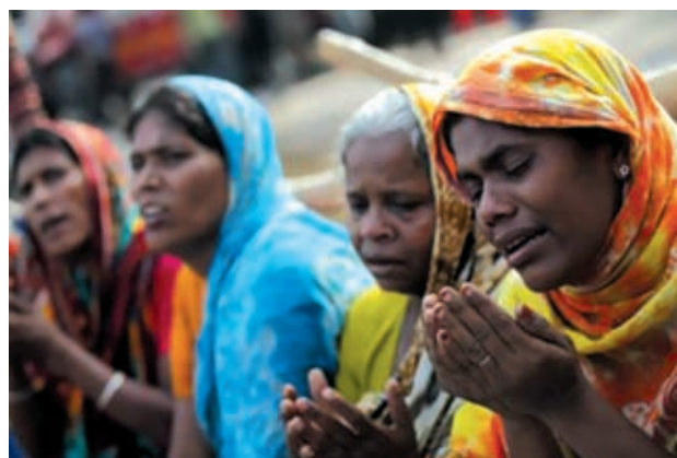
Relatives mourn for missing garment workers in front of the rubble of the collapsed Rana Plaza building, in Savar, 30 km (19 miles) outside Dhaka on 27 April, 2013.

The owner of the eight-storey building that fell like a pack of cards around more than 3,000 mainly young women workers was still on the run. Police said several of his relatives were detained to compel him to hand himself in, and an alert had gone out to airport and border authorities to prevent him from fleeing the country. Officials said Rana Plaza, on the outskirts of the capital, Dhaka, had been built on spongy ground without the correct permits, and the workers were sent in on Wednesday despite warnings the previous day that it was structurally unsafe. Anger at the negligence has sparked