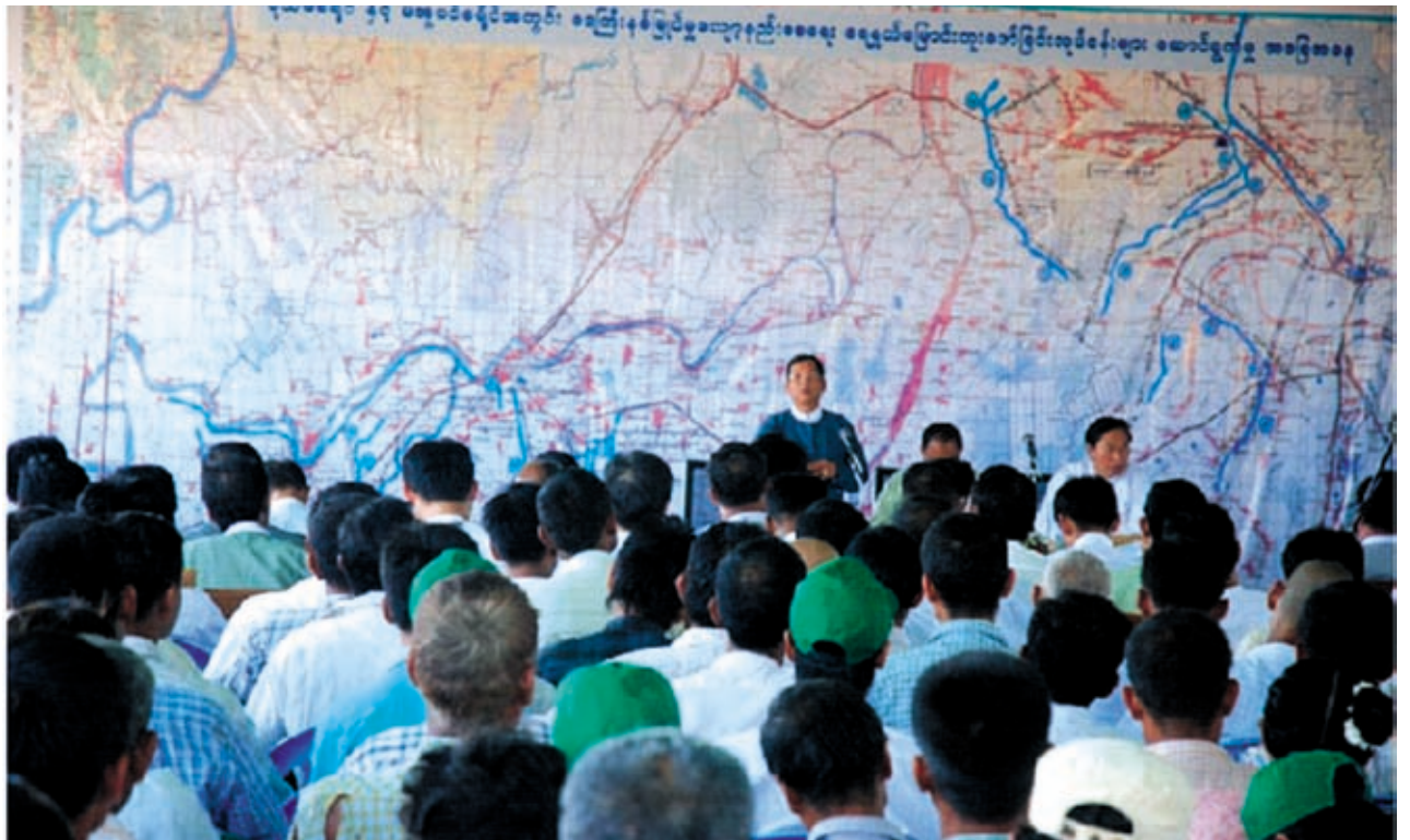
Union Minister for Agriculture and Irrigation U Myint Hlaing meeting with local farmers in Ayeyawady Region.—MNA