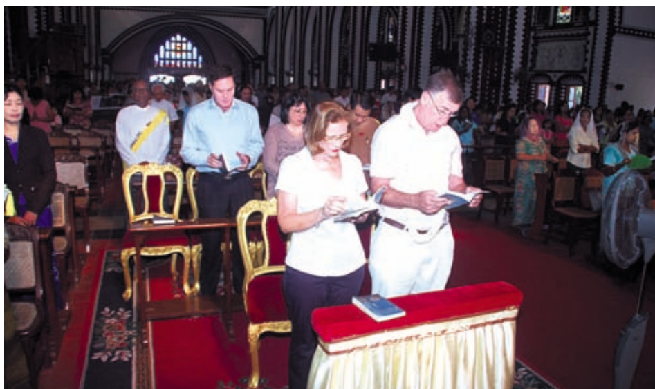
President of Australian Senate Senator Hon John Joseph Hogg and party at St Mary's Cathedral in Bo Aung Kyaw Street.

YANGON, 28 April—A delegation led by President of the Australian Senate Senator Hon John Joseph Hogg this morning visited St Mary's Cathedral in Bo Aung Kyaw Street. They signed in the visitor's book and joined in prayer there.