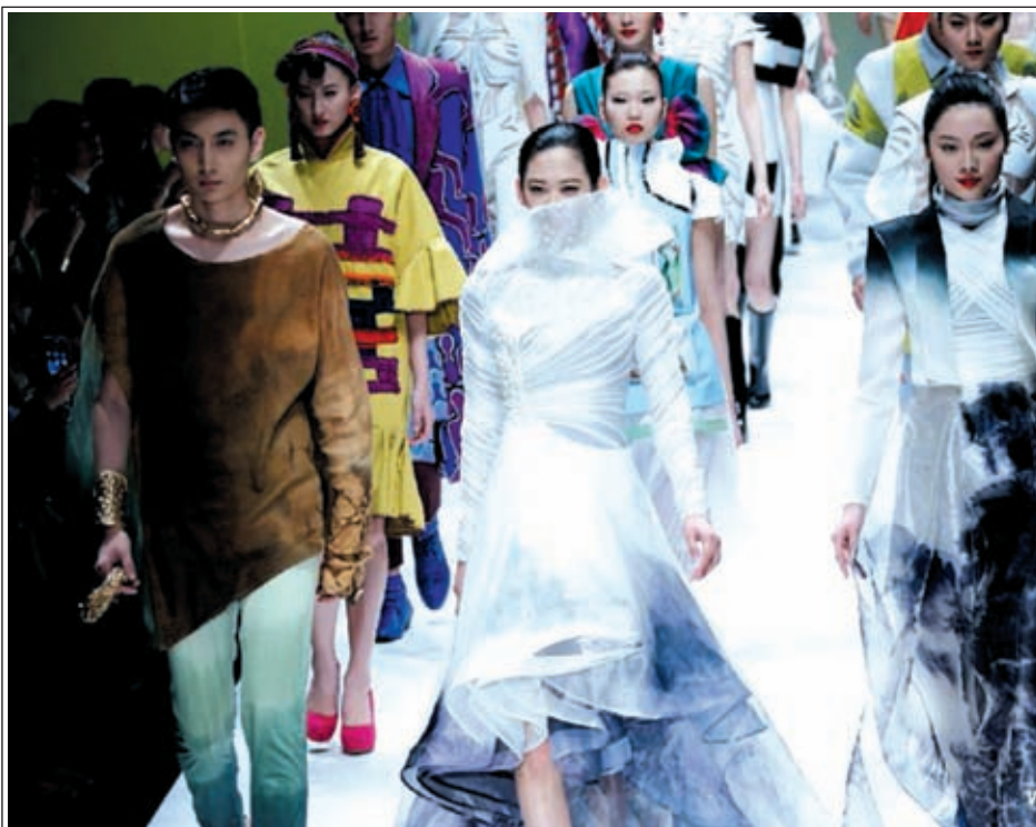
Models present creations designed by graduates from School of Fashion Art and Engineering of Beijing Institute of Fashion Technology during the China Graduate Fashion Week in Beijing, capital of China, on 27 April, 2013.

Militants allied to al-Qaeda took advantage of Yemen’s political chaos and splits in the military during mass Arab Spring protests to seize control of some southern cities. The protests unseated President Ali Abdullah Saleh and installed an interim government which, with the help of tribal militias, pushed the militants from cities they had captured. However, fighting between militants and pro-government forces continues throughout rural areas of southern Yemen.—Reuters