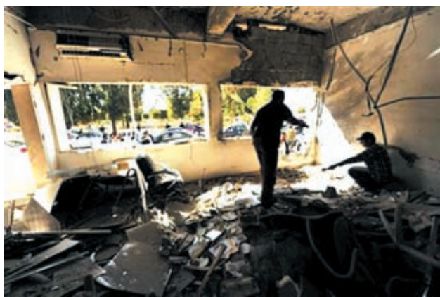
Policemen search for clues inside an office after a bomb explosion at a police station in Benghazi, on 27 April, 2013.