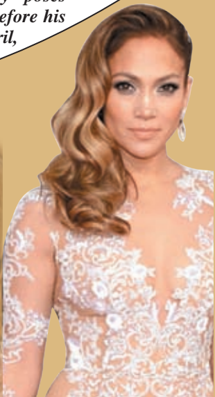
The makers of the show were worried about the ratings of American Idol going down.