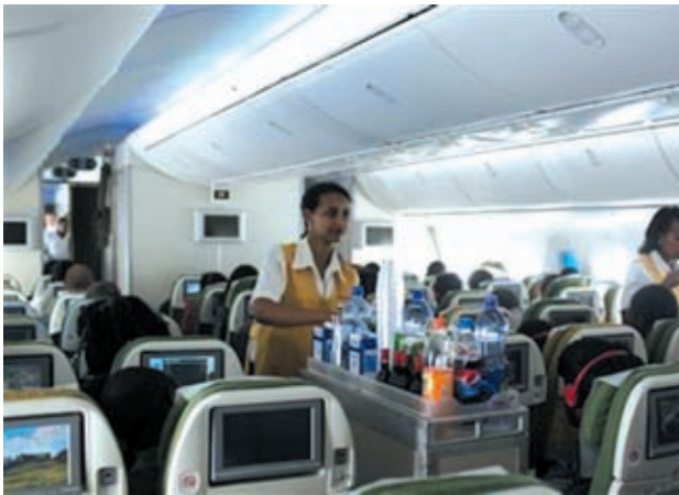
Crew members serve lunch on board an Ethiopian Airlines' 787 Dreamliner from Addis Ababa en-route to Jomo Kenyatta international Airport in Kenya's capital Nairobi on 27 April, 2013.

The grounding of the Dreamliner fleet has cost Boeing an estimated $600 million, halted deliveries