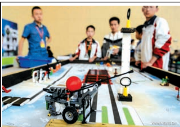
A robot designed by local middle school students is seen during a robot competition in Karamay, northwest China's Xinjiang Uygur Autonomous Region, on 27 April, 2013. Over 200 competitors in Xinjiang took part in the robot competition held here on Saturday.

"We are very excited to be welcomed into the heart of the Maori community of Auckland. This is a unique opportunity to meet the tribal people who first invited other cultures to settle here, and to learn about our city," he added.—Xinhua