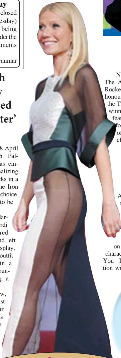
Gwyneth wore a revealing Antonio Berardi column dress at the Hollywood premiere of Iron Man 3.