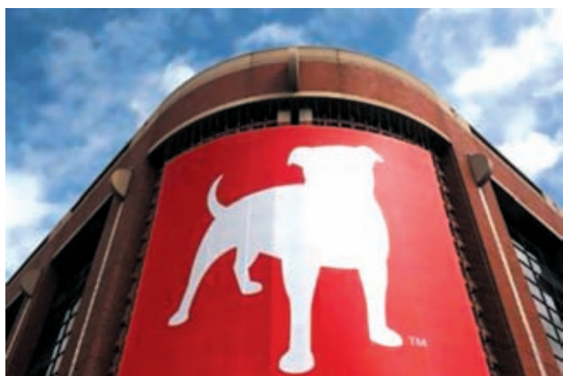
The corporate logo of Zynga Inc, the social network game development company, is shown at its headquarters in San Francisco, California on 26 April, 2012.

NEW YORK, 28 April— Shares of Zynga Inc fell 10 percent in early trading on Thursday after the online game maker forecast a bigger-than-expected second-quarter loss on concerns about its slow transformation into a gaming company focused on mobiles.