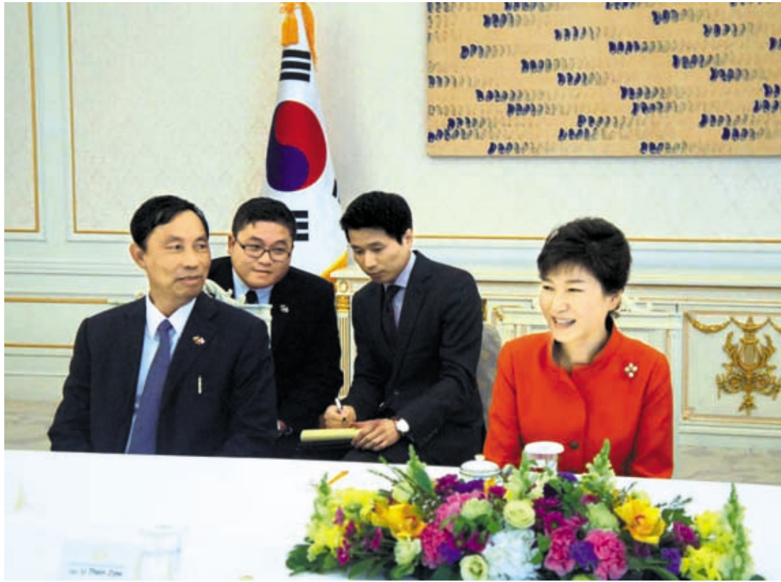
Pyithu Hluttaw Speaker Thura U Shwe Mann holding talks with President of the Republic of Korea Ms. Park Geum Hye.

NAY PYI TAW, 28 April—Accompanied by delegation members, Pyithu Hluttaw Speaker Thura U Shwe Mann, who was in the Republic of Korea at the invitation