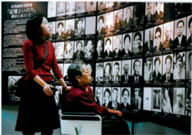
Visitors see pictures of deceased victims of Minamata mercury-poisoning disease during the Minamata Exhibition held in the city of Chiba in 2008.