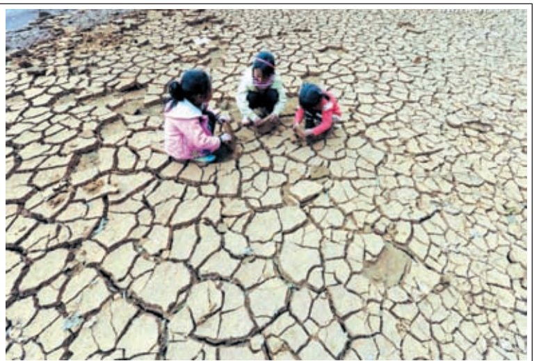
Children play at a dried-up pond in Duomaga Village of Kunming City, capital of southwest China's Yunnan Province, on 26 March, 2013. Over 12 million people were affected by the lingering drought in the province.

known as Sons of Iraq, consists of armed groups, including some powerful anti-US Sunni insurgent groups, who turned their rifles against the al-Qaeda network after the latter exercised indiscriminate killings against both Shiite and Sunni Muslim communities.—Xinhua