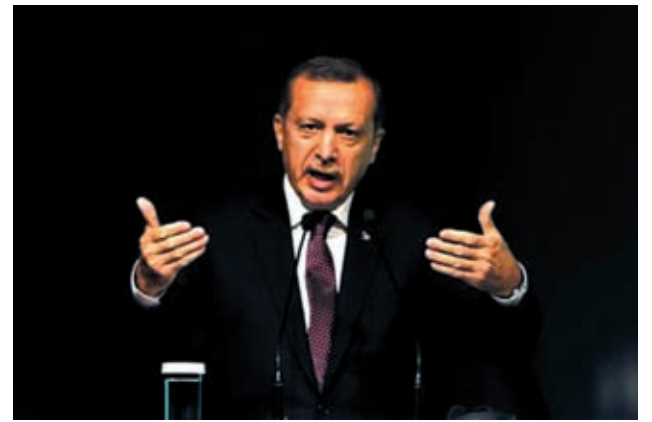
Turkey’s Prime Minister Tayyip Erdogan makes a speech during the Global Alcohol Policy Symposium in Istanbul on 26 April, 2013.