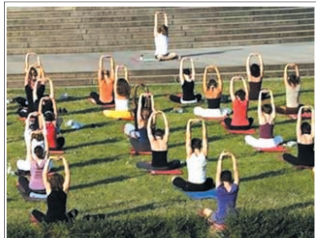
Yoga enthusiasts perform an open air class in front of victory column 'Siegestaule' in Berlin on 1 July, 2008.