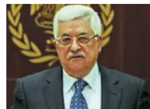
Palestinian President Mahmoud Abbas