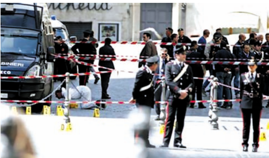
Carabinieri police stand as they patrol around the area where gunshots were fired, in front of Chigi Palace, in Rome on 28 April, 2013.—REUTERS

A probe has been ordered into the incident, the official added. The Sivakasi District is the state's fire cracker producing hub. But many illegal fireworks factories also operate in the area which do not adhere to basic fire safety norms and thus vulnerable to explosions.—Xinhua