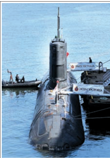
Canadian submarine "Victoria" docks at Canada Place in Vancouver, Canada, on 25 April, 2013. The four-day Vancouver Port visit event showcases several vessels from the Royal Canadian Navy and United States Navy which are opened for public tour.