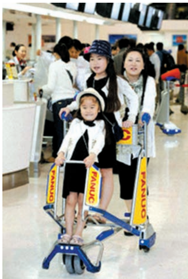
Sisters look happy as they are carried aboard a luggage cart at Narita Airport near Tokyo, crowded with people departing for overseas destinations, on 27 April, 2013, as Japan entered the Golden Week spring holiday season that day.

TOKYO, 28 April—Major airports, highways and railway stations in Japan were crowded with holidaymakers on Saturday as the country entered the Golden Week spring holiday season.