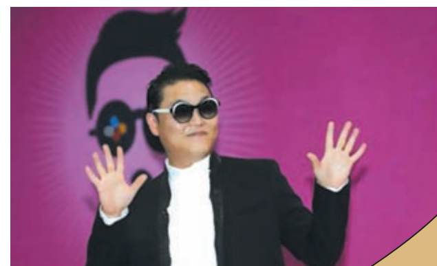
South Korean rapper Psy poses during a news conference before his concert in Seoul on 13 April, 2013.

American Idol's ratings have suffered this season, with its Wednesday show getting the worst ratings since the show began in 2001. In contrast, rival show The Voice is riding high in the ratings due in part to boasting Shakira and Usher on its judging panel. Official sources have denied any attempt to replace Mariah on the show. A Fox spokesperson said: "This is just another ridiculous 'Idol' judge rumour, likely started by talks of Jennifer performing on the finale."—Reuters