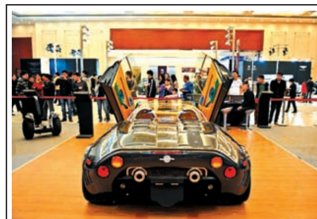
Photo taken on 27 April, 2013 shows a Spyker C8 car at the 2013 China (Tianjin) International Automobile Industry Exhibition in Tianjin, north China. The exhibition kicked off on Saturday, displaying over 500 vehicles.