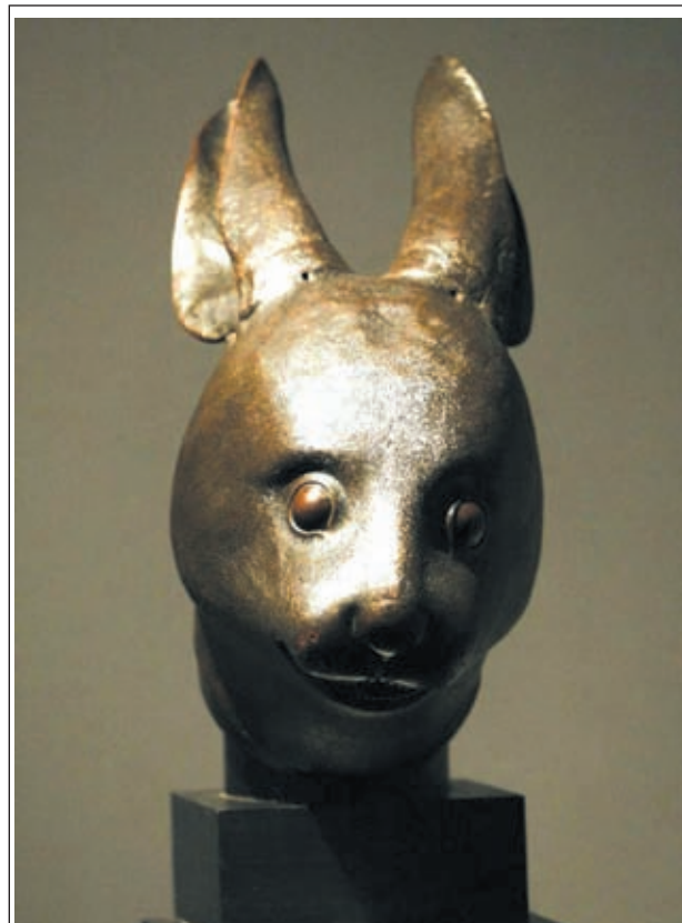
This file photo taken on 21 Feb, 2009 shows the Chinese bronze rabbit head sculpture displayed at the Grand Palais in Paris, France. The family of French luxury goods retailer Pinault announced Friday in Beijing that it will donate two pieces of Chinese cultural relics looted by Anglo-French allied forces during the Second Opium War in 1860, including the rabbit head, back to China.