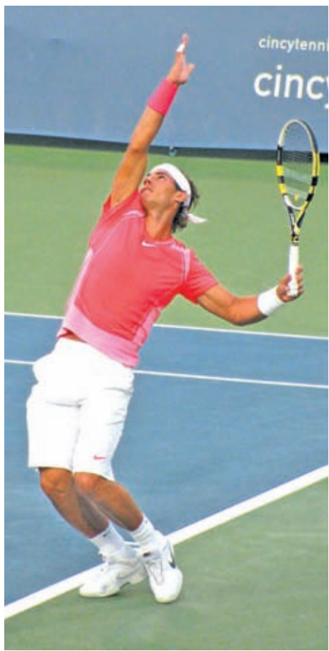
Spanish star Rafa Nadal