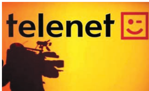
The shadow of a cameraman is seen beside the Belgian cable operator Telenet logo during a news conference in Brussels.—REUTERS

Telenet, in which U.S. cable group Liberty Global has a 58.3 percent stake, confirmed the outlook it had given in February. At that time it said it expected revenue to rise by 10-11 percent this year, supported by its growing share of mobile phone customers and a further increase in the number of customers buying more than one of its services. Capital expenditure rose to 95.8 million euros from 78.6 million euros a year earlier, a higher figure after Telenet extended its premier league soccer broadcasting rights.—Reuters