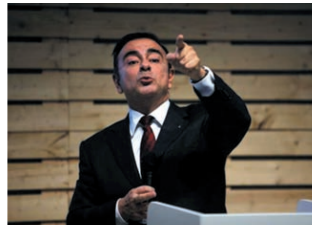
Carlos Ghosn, chairman and chief executive officer of French carmaker Renault, speaks with journalists during a meeting to promote the new electric car Renault Zoe in Lisbon on 14 March, 2013.

"Renault already has a plan for China, which is ready, and currently being negotiated with the Chinese government, and I hope we will have all agreements before the summer," Ghosn told French radio Europe 1. He added that French