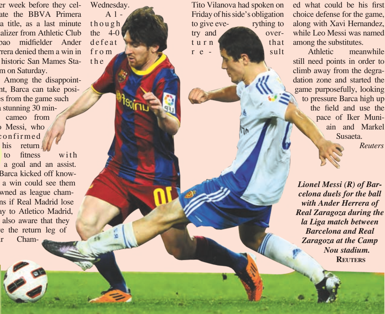
Lionel Messi (R) of Barcelona duels for the ball with Ander Herrera of Real Zaragoza during the La Liga match between Barcelona and Real Zaragoza at the Camp Nou stadium.