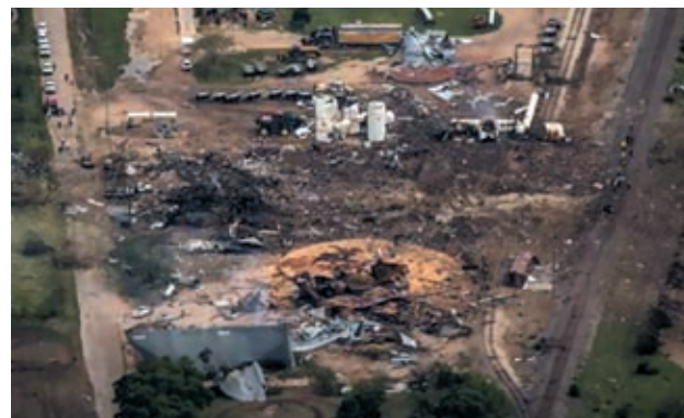
An aerial view shows the aftermath of a massive explosion at a fertilizer plant in the town of West, near Waco, Texas on 18 April, 2013.