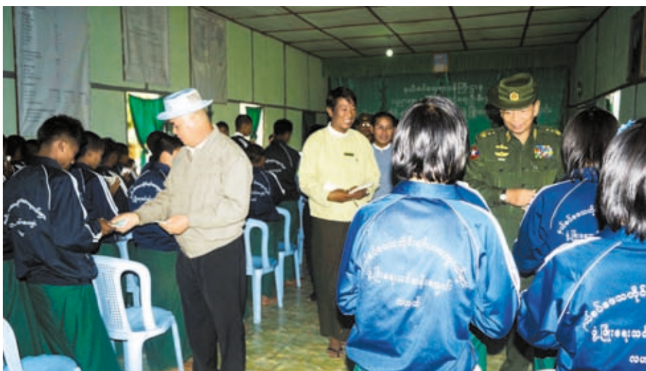
Union Minister for Border Affairs Lt-Gen Thet Naing Win presents cash assistance to a trainee.

NAY PYI TAW, 24 April—Chairman of the Work Committee for Progress of Border Areas and National Races