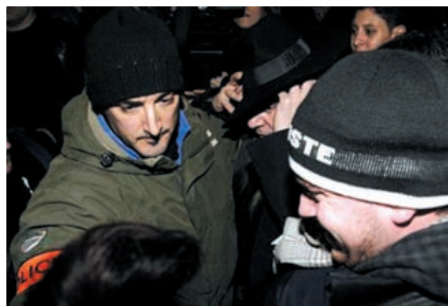
Fashion designer John Galliano surrounded by policemen leaves after a hearing in a police station in Paris on 28 Feb, 2011.

NEW YORK, 24 April — Disgraced fashion designer John Galliano is continuing his public image rehabilitation with an upcoming stint teaching a master class at