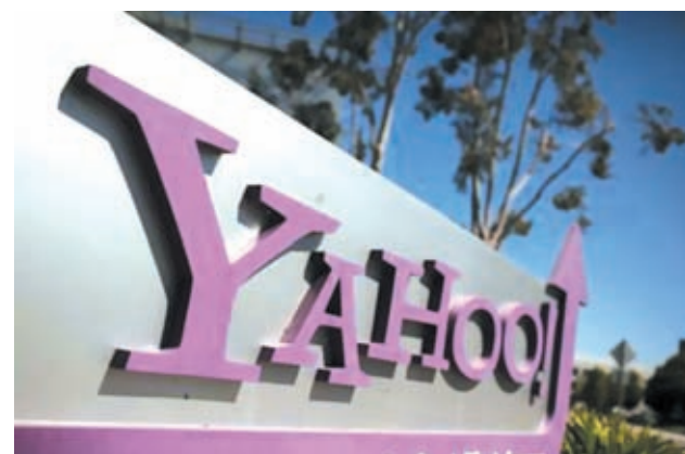
The Yahoo logo is shown at the company's headquarters in Sunnyvale, California on 16 April, 2013. The company will release its quarterly results on Tuesday.

In November, Babylon filed for an initial public offering on Nasdaq, with the aim of raising up to $115 million this year.