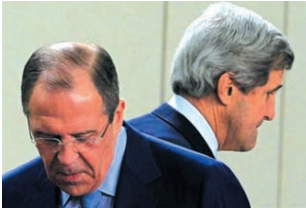
US Secretary of State John Kerry (R) walks behind Russian Foreign Minister Sergei Lavrov (L) at the start of a NATO —Russia foreign ministers meeting at the Alliance's headquarters in Brussels on 23 April, 2013.