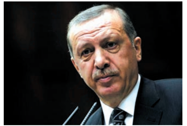
Turkey’s Prime Minister Tayyip Erdogan addresses members of parliament from his ruling AK Party (AKP) during a meeting at the Turkish parliament in Ankara on 16 April, 2013.

Persuaded by Obama, Israeli Prime Minister Benjamin Netanyahu apologized last month and an Israeli delegation traveled to Ankara on Monday to discuss compensation to the victims’ families.