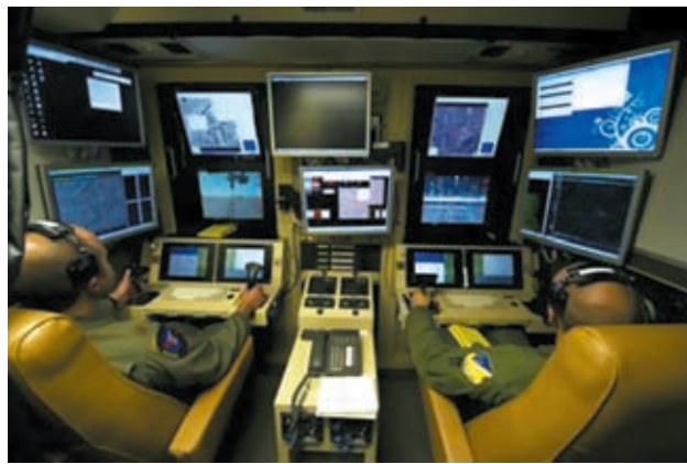
Drone operators fly an MQ-9 Reaper training mission from a ground control station at Holloman Air Force Base, New Mexico, in this US Air Force handout photo taken on 3 Oct, 2012.

“With the growth of the RPAs being what it