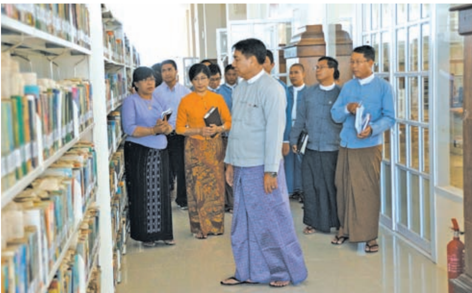
Union Minister for Culture U Aye Myint Kyu inspects bookshelves.