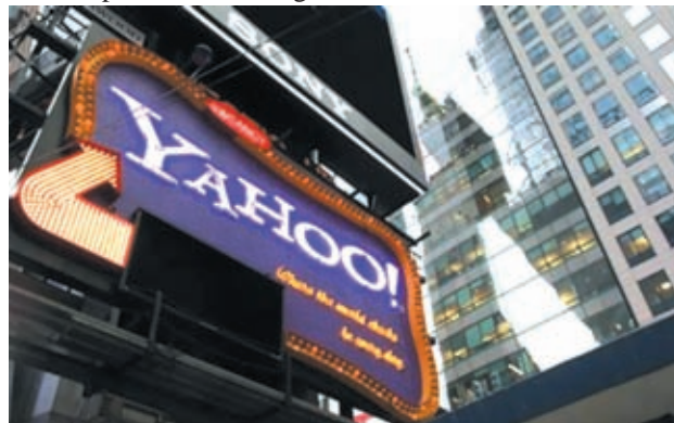
Logo of Yahoo