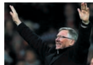
Manchester United's manager Alex Ferguson celebrates after his team clinched the English Premier League soccer title with a win against Aston Villa at Old Trafford in Manchester, northern England, on 22 April, 2013.