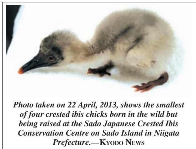
Photo taken on 22 April, 2013, shows the smallest of four crested ibis chicks born in the wild but being raised at the Sado Japanese Crested Ibis Conservation Centre on Sado Island in Niigata Prefecture.