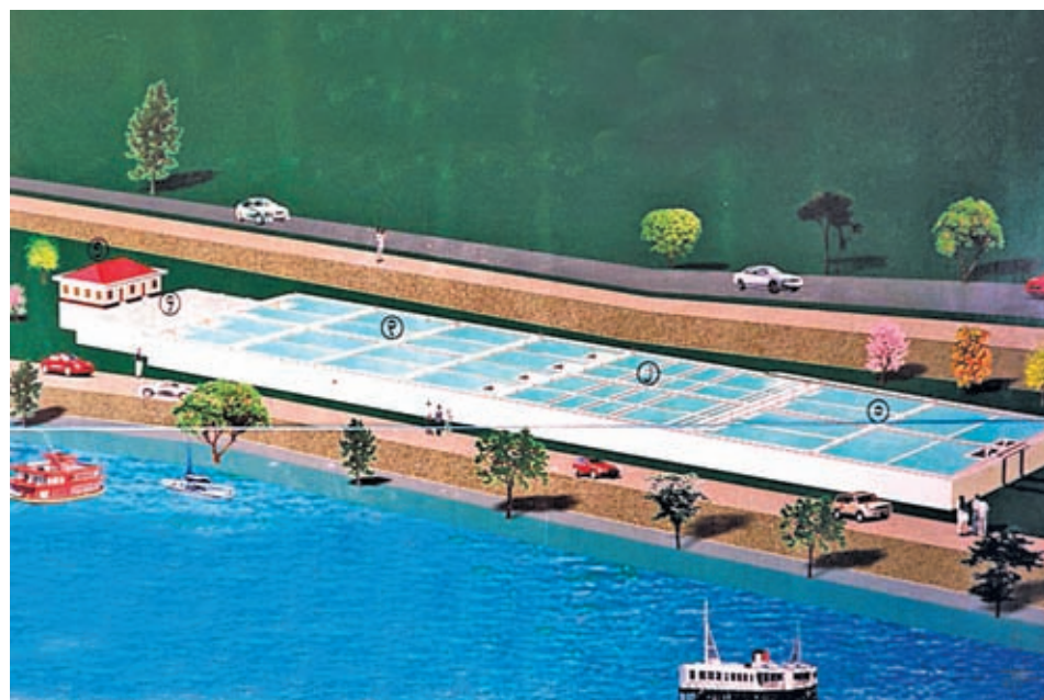
Scale model of water treatment plant to be built by MCDC.