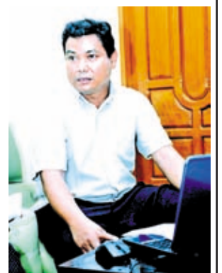
Director U Win Naing Tun

WNT: The transportation will improve and job opportunities will increase upon completion of the project, leading to economic boom. In addition, it will also facilitate to better