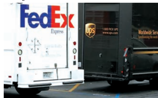
A Federal Express truck is parked next to a UPS truck as both drivers make deliveries in downtown San Diego, California on 5 March, 2013.