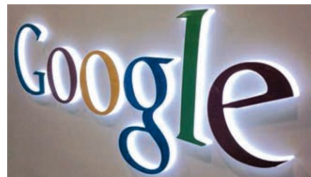
A Google sign is seen at a Best Buy electronics store in this photo illustration in Encinitas, California on 11 April, 2013.

SAN FRANCISCO, 24 April—Google Inc has acquired Wavii, the Seattle-based startup behind a news summarization app, for roughly $30 million in cash, a person with knowledge of the matter said on Tuesday.