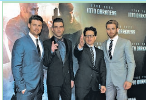
Actor Karl Urban (1st L), Zachary Quinto (2nd L), Chris Pine (1st R) and Director J.J. Abrams pose for photos as they arrive for the Australian premiere of film "Star Trek Into Darkness" in Sydney, Australia, on 23 April, 2013.