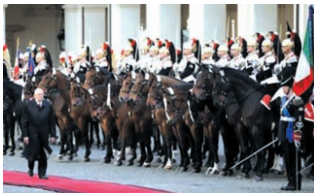
Italy's newly re-elected President Giorgio Napolitano inspects a guard of honour during a welcoming ceremony at the Quirinale palace in Rome, on 22 April, 2013.

ROME, 24 April—Italy's President launched urgent talks on Tuesday that could lead to a Prime Minister quickly being named after two months of post-electoral stalemate that has weighed on a stagnant economy and alarmed Rome's partners in the euro zone. After an angry and emotional blast of impatience on Monday at the very parliament which handed him an unprecedented — and heartily unwanted — second term as head of state