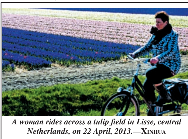
A woman rides across a tulip field in Lisse, central Netherlands, on 22 April, 2013.