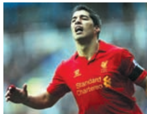
Liverpool's Luis Suarez reacts during their English Premier League soccer match against Reading at the Madejski Stadium in Reading, on 13 April, 2013.

An independent regulatory commission will hear the case on Wednesday. Suarez has already apolo-