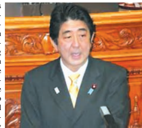
Prime Minister Shinzo Abe