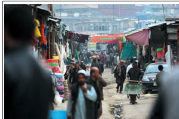
Afghans are seen at a market in Kabul, Afghanistan on 22 April, 2013.

Meanwhile, Vernigora noted there were no plans to increase the num-