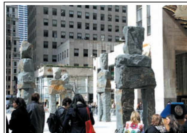
People visit the sculptures which called Human Nature in New York, on 22 April, 2013. Human Nature, created by artist Ugo Rondinone, is a public art exhibition made up of nine 16-to-20-foot-tall human-shaped stone figures, and weigh 30,000 pounds each.