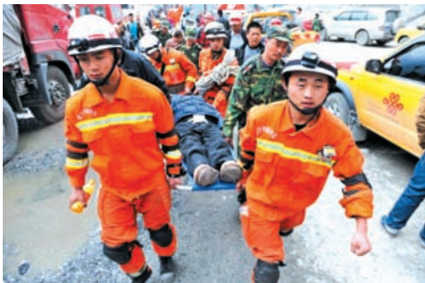
Rescuers carry an injured person in the quake-hit town of Muping, Baoxing County in southwest China's Sichuan Province, on 22 April, 2013.