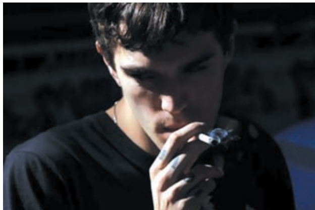
A model smokes before the Edun Spring 2011 collection show during New York Fashion Week on 11 Sept, 2010.

NEW YORK, 24 April—New York City took the first step on Monday in outlawing sales of cigarettes to anyone under age 21, in an effort to reduce smoking among the age group in which most smokers take up the habit. The bill, which was introduced by the City Council and has the backing of Mayor Michael Bloomberg, would make New York City, which already has the highest