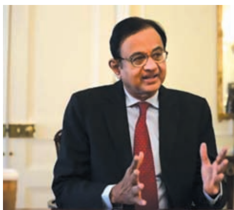
Finance Minister P. Chidambaram speaks during a news conference in New York, on 17 April, 2013.

The fiscal deficit for 2012/13 is expected to be at around 5 percent of gross domestic product, government sources said earlier this month.—Reuters