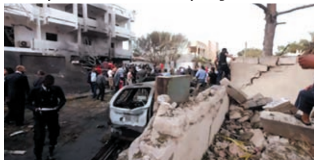
People stand among debris outside the French embassy after the building was attacked, in Tripoli on 23 April, 2013.

In Paris, Foreign Minister Laurent Fabius condemned what he called a heinous attack and said everything would be done