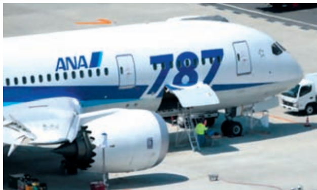
Photo taken from a Kyodo News helicopter on 22 April, 2013, shows an All Nippon Airways Co Boeing 787 Dreamliner jet parked at Okayama airport in western Japan. ANA and Japan Airlines Co began modifying the same day their grounded Boeing 787 jets due to battery-related incidents, exchanging their batteries for modified ones.

The Ministry of Land, Infrastructure, Transport and Tourism will officially announce the lifting after