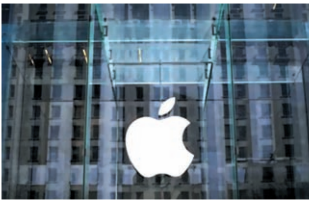
The Apple logo hangs inside the glass entrance to the Apple Store on 5th Avenue in New York City, on 4 April, 2013.

Google acquired the patents in the case — and the lawsuit — when it purchased Motorola Mobility for $12.5 billion in 2012, partly for its library of telecommunications patents.