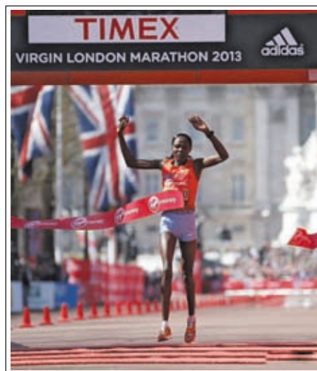
Priscah Jeptoo crosses the finish line during 2013 London Marathon in London, Britain on 21 April, 2013. Priscah Jeptoo claimed the title of Women Elite Race with 2:20:15.