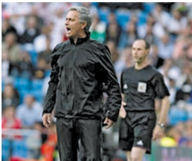
Real Madrid coach Jose Mourinho

The injury is given extra significance given that Fabio Coentrao, who has been first choice at left back in recent weeks, missed on Saturday's game with muscle prob-