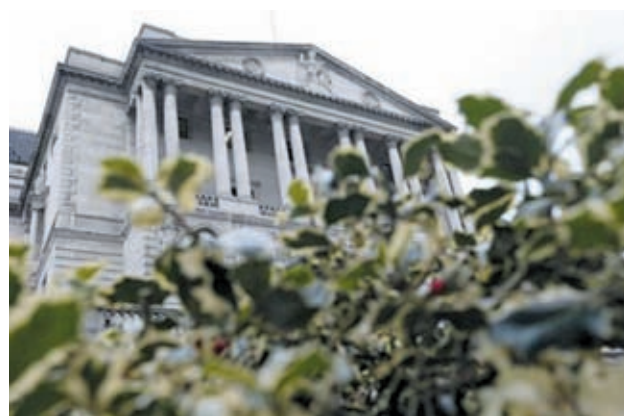
The Bank of England is seen behind holly bushes in the City of London on 15 March, 2013.

LONDON, 22 April—A scheme to get more credit flowing in Britain's stagnant economy will be expanded to include specialist lenders and will run for a year longer than planned, the Sunday Telegraph newspaper reported.