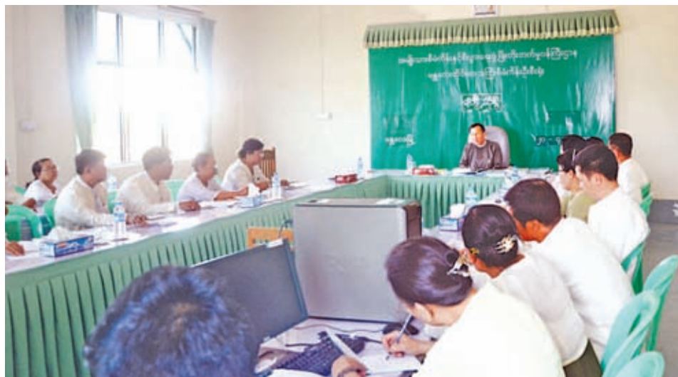
Union Minister for National Planning and Economic Development Dr Kan Zaw meets planning officers in Mandalay Region.

He said the plans might envisage emerging economic opportunities, employment opportunities,