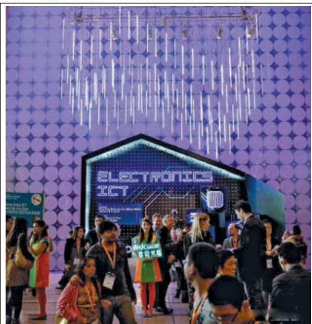
People visit the 10th Hong Kong Electronics Fair (Spring Edition) in south China's Hong Kong, on 13 April, 2013. The four-day fair, which kicked off on Saturday, attracted 3,250 enterprises from 24 countries and regions.