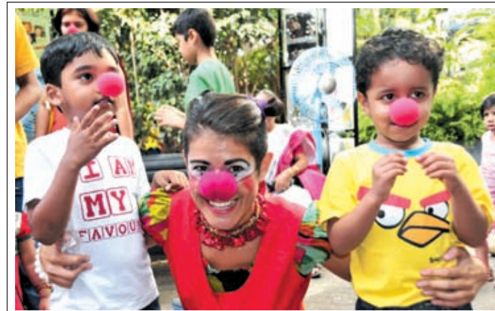
An actress dressed as a clown poses for pictures with local kids in Bombay, India, on 20 April, 2013. The local circus group offered performances on the World Circus Day that falls on the third Saturday every April.