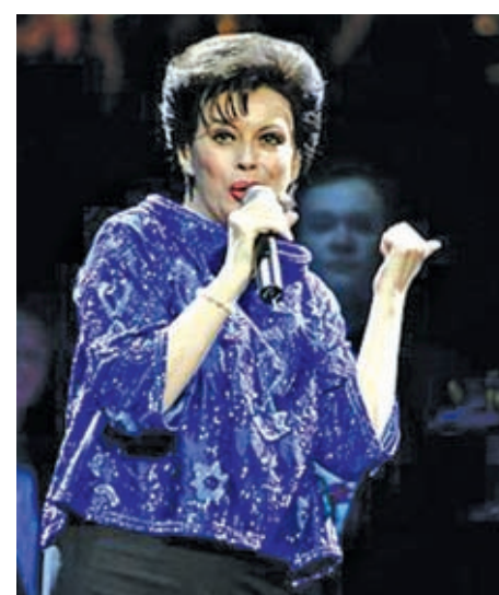
Australian actress-singer Chrissy Amphlett performs as Judy Garland during a photo call for the musical "The Boy from Oz" in Sydney, in this on 2 Aug, 2006 file picture.

Aashiqui 2 is releasing on April 26.—PTI