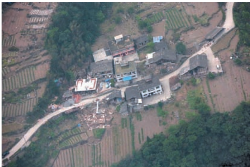
Aerial photo taken on 21 April, 2013 shows damaged buildings in quake-hit Baoxing County of Ya'an City, in southwest China's Sichuan Province.

As of 4 pm Sunday, health workers with Sichuan's local health departments had treated 8,761 people injured in the quake, with 1,397 hospitalized, according to the National Health and Family Planning Commission. According to the commission, a total of 1,125 medical workers have been dispatched to the quake-hit region, and the treatments of the wounded has been conducted mainly in seven neighboring cities including Ya'an and Chengdu.—Xinhua