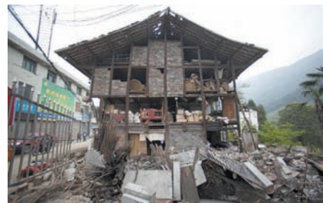
A house is damaged by a strong earthquake in Taiping Town, Lushan County, southwest China's Sichuan Province, on 21 April, 2013.

In a joint message, Lao President Choummaly Sayson and Prime Minister Thongsing Thammavong said they believed the Chinese people would once again demonstrate their traditional virtues, such as industriousness and bravery, in the face of natural disas-