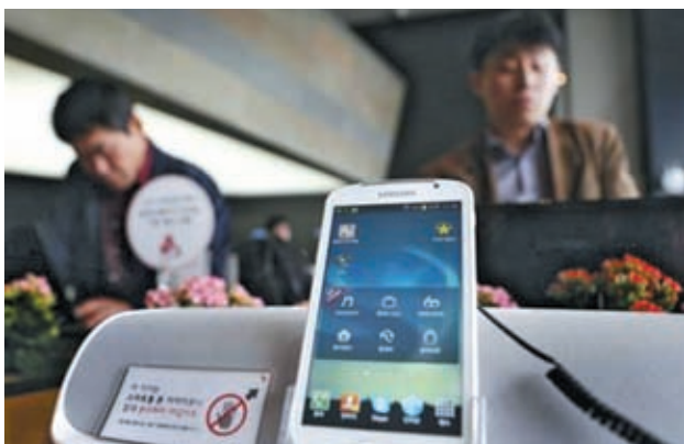
Shoppers look at Samsung smartphones in a shop in Seoul, on 5 April, 2013.