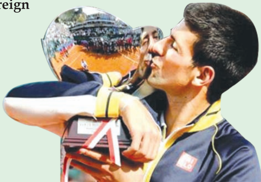
Novak Djokovic of Serbia kisses his trophy after winning the final match of the Monte Carlo Masters in Monaco on 21 April, 2013.

set. The match had little in common with last year's Monte Carlo final, when Nadal overwhelmed Djokovic 6-3, 6-1 in the