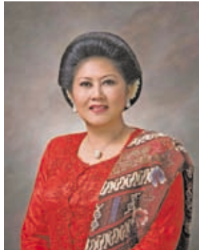
Mrs. Hajjah Ani Bambang Yudhoyono

He was commissioned as Second Lieutenant (Infantry) in 1973. From then on he had 27 years of service in the military, combined with