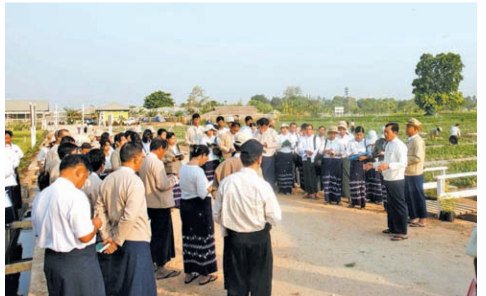
Union Minister for Agriculture and Irrigation U Myint Hlaing meets officials at mechanized farming (acre 500).

NAY PYI TAW, 22 April—Union Minister for Agriculture and Irrigation U Myint Hlaing this morning attended the work coordination meeting on successful launching “Farmer Channel”, held at mechanized farming (acre 500) with Ngalai irrigation system.