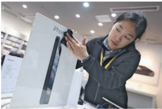
An employee cleans an advertisement plate at an Apple dealership on the eve of iPhone 5's release, in Wuhan, Hubei province December 13, 2012. —REUTERS

TOKYO, 22 April—Apple Inc marketing chief Phil Schiller let slip during last August's courtroom battle with Samsung that when setting forecasts for new iPhones, the inside joke was that people should assume sales would equal all previous versions combined.