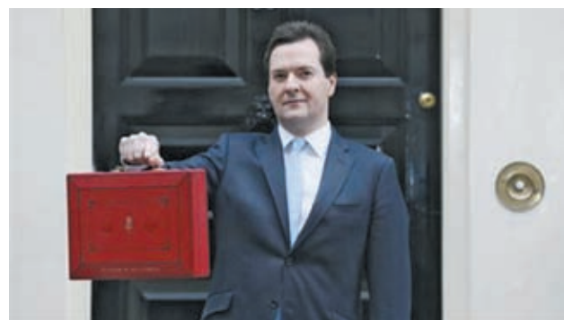
Britain's Chancellor of the Exchequer, George Osborne, holds up his budget case for the cameras as he stands outside number 11 Downing Street, before delivering his budget to the House of Commons, in central London in this 20 March, 2013 file photo.