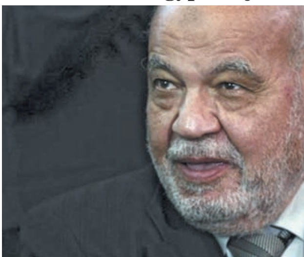
Egypt's Justice Minister Ahmed Mekky

CAIRO, 22 April — Egypt's Justice Minister Ahmed Mekky has re-