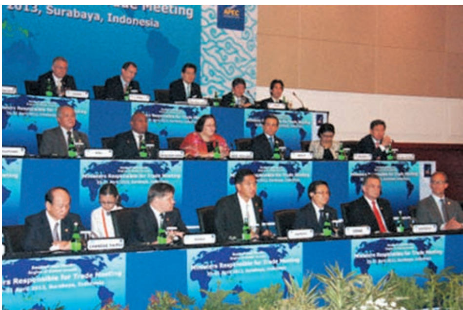
Participants hold a Press conference after a meeting of trade ministers of the Asia-Pacific Economic Cooperation forum in Surabaya, Indonesia, on 21 April, 2013.