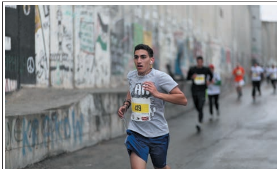
A Palestinian takes part in the Palestinian Marathon and passes part of the Israeli separation barrier in the West Bank city of Bethlehem, on 21 April, 2013.