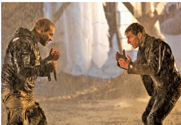
A still from Tom Cruise's movie Jack Reacher