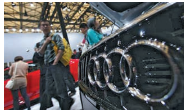
People look at Audi cars during the 15th Shanghai International Automobile Industry Exhibition in Shanghai on 21 April, 2013.

should consider slowing the pace of its deficit-cutting programme.