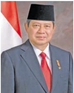
Dr. Susilo Bambang Yudhoyono

Dr. Susilo Bambang Yudhoyono was born on 9 September 1949 at Pacitan, East Java, Indonesia. He graduated from Infantry Military Academy of Indonesia in 1973 and from 1982 to 1983 he attended the Infantry Officer's Advanced Course in USA.