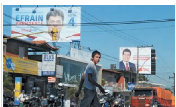
A young man walks past electoral posters in Asuncion, capital of Paraguay, on 20 April, 2013. Around 3.5 million Paraguayans will vote in the presidential election on 21 April.