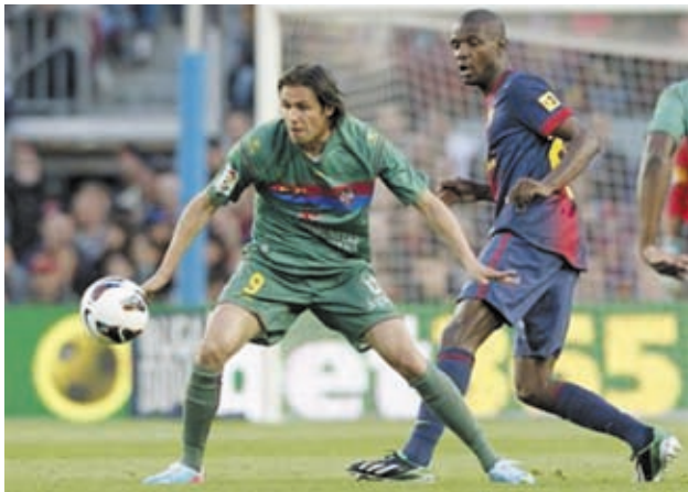
Barcelona's Eric Abidal (R) fights for the ball against Levante's Robert Acquafresca during their Spanish First division soccer league match at Camp Nou stadium in Barcelona, on 20 April, 2013.

MADRID, 22 April—As well as putting Barcelona a step closer to winning La Liga, Saturday's 1-0 home win over Levante showed that defender Eric Abidal is fit enough to play a full match after making a remarkable recovery from a liver transplant.