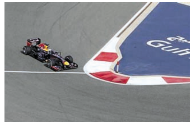
Red Bull Formula One driver Sebastian Vettel of Germany drives during the Bahrain F1 Grand Prix at the Sakhir circuit, south of Manama on 21 April, 2013.