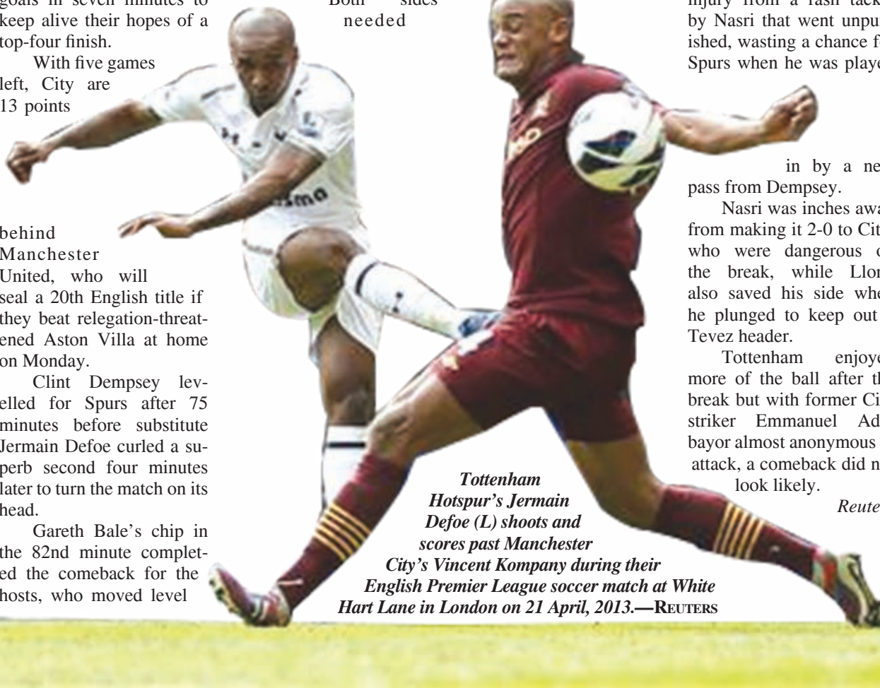
Tottenham Hotspur's Jermain Defoe (L) shoots and scores past Manchester City's Vincent Kompany during their English Premier League soccer match at White Hart Lane in London on 21 April, 2013.