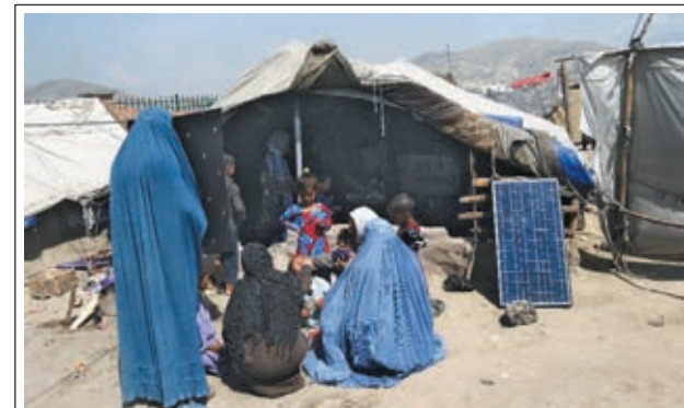
A child receives polio vaccination drops on the first day of a vaccination campaign in Nangarhar Province, eastern Afghanistan, on 21 April, 2013. A three-day nationwide anti-polio campaign started in Afghanistan on Sunday. The war-hit country is one of the four countries in the world which is still suffering serious polio disease.

after a year-long unrest weakened the control of the central government and allowed the militants to take over swaths of territory in the south.