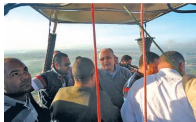
The photo taken on 21 April, 2013 shows Governor of Luxor Province Ezzat Saad (C) on a balloon flight in Luxor, Luxor Province, Egypt. —XINHUA

with different nationalities took part in the first flight in two months that lasted for 45 minutes above Luxor's landscape. The balloon tours had been scheduled to resume on 17 April, but it was postponed due to the strike of workers of the Egyptian Airports Company who protested against the detention of their colleague Al-TaHER Mahmoud, a supervisor of balloon flights, over February's crash. —XINHUA