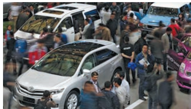
People look at Toyota cars during the 15th Shanghai International Automobile Industry Exhibition in Shanghai on 21 April, 2013.