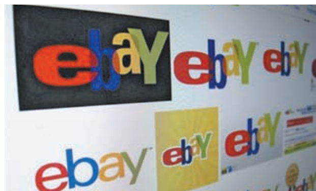
The results of a Google image search on Ebay are shown on a monitor in this photo illustration in Encinitas, California, on 16 April, 2013.

EBay has tapped its users in a major way once before. In 2006, when Meg Whitman was CEO, she emailed users about the issue of net neutrality and the need to keep the Internet open. In that effort, Whitman emailed fewer than 10 million users.— Reuters