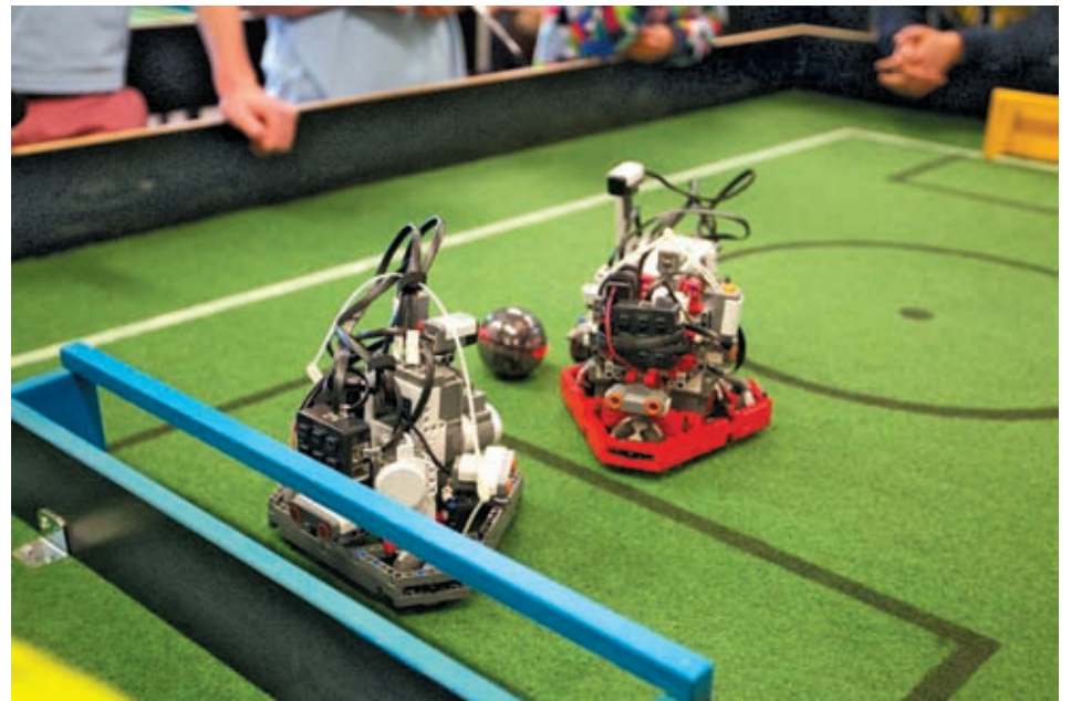
Players control their robots to play football at the Dutch national robot cup in Delft, the Netherlands, on 20 April, 2013.

The legislation, due to be voted on by the Senate