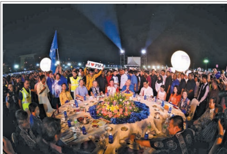
A large number of people attend a mega dinner in the state of selangor, Malaysia, on 20 April, 2013. About 60,000 Chinese residents joined a mega dinner held by local Chinese community here on Saturday together with Malaysian Prime Minister Najib Razak, making a new record of the biggest dinner in Malaysia.

A 12-year-old girl and her three-year old brother of the nomad family from Andhra Pradesh presently living here were reported missing from 17 April and based on a complaint from their mother, a case was registered by police.