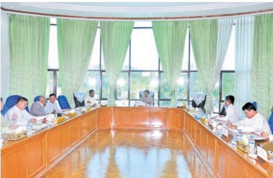
Union Minister for Education Dr Mya Aye attends meeting of the textbooks printing and publishing subcommittee.

NAY PYI TAW, 22 April—Union Minister for Education Dr Mya Aye called for utilizing of woodfree papers for high quality of textbooks, print-