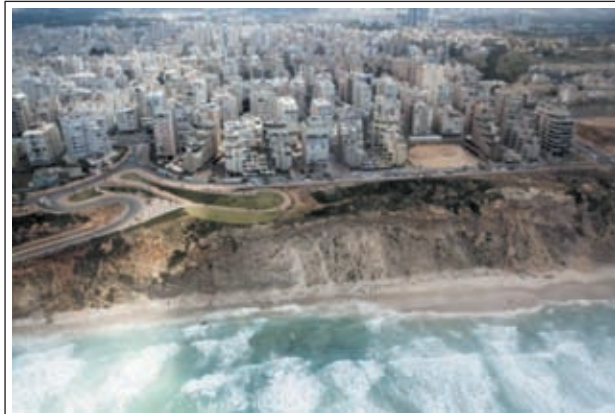
The central city of Netanya on the Mediterranean coast is seen during a flight as part of an aerial show for Israel's Independence Day, marking the 65th anniversary of the creation of the state, on 16 April, 2013.