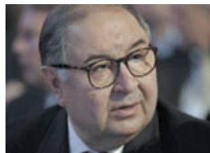
Russia's richest man Alisher Usmanov attends the annual meeting of the World Economic Forum (WEF) in Davos on 23 Jan, 2013.

Mittal, the chief executive of the world's largest