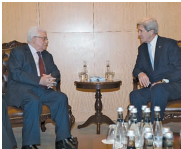
Palestinian President Mahmoud Abbas (L) meets with US Secretary of State John Kerry in Istanbul, Turkey, on 21 April, 2013. Kerry is wrapping up a 24-hour visit to Istanbul with talks aimed at improving ties between Turkey and Israel and pushing ahead with Mideast peace efforts.