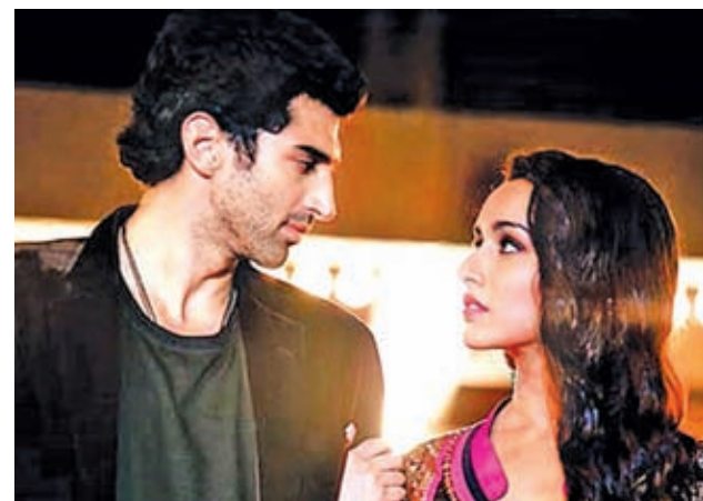
Shraddha says she is very comfortable working with Aditya