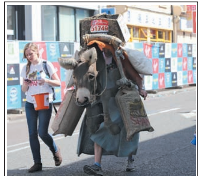
A runner dressed up as a donkey takes part in the London Marathon in Greenwich, London, capital of Britain, on 21 April, 2013.