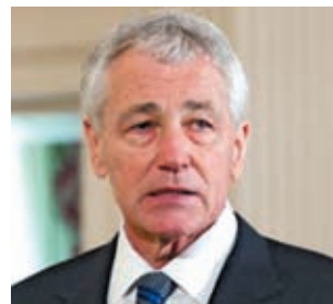
US Secretary of Defence Chuck Hagel

JERUSALEM, 22 April —US Secretary of Defence Chuck Hagel arrived in Israel early Sunday for talks expected to feature Iran's nuclear programme, the Syrian civil war and a major arms deal to ensure Israel's military edge. This is Hagel's first visit to the country since entering his post in February, and the first leg of a week-long regional tour that includes Jordan, Egypt, Saudi Arabia and the United Arab Emirates (UAE).