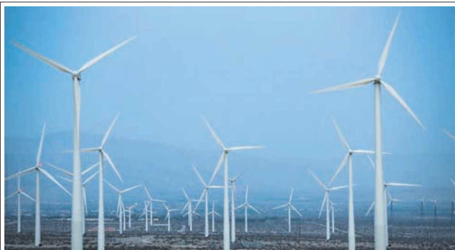
Photo taken on 17 March, 2013 shows the wind turbines at Palm Springs in California State, the United States. The American Wind Energy Association (AWEA) released its annual report on 11 April, saying that the US has become the world's largest wind energy market.