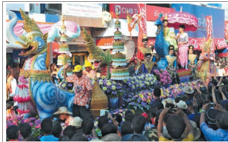
People take part in a parade in Phra Pradaeng, Thailand, on 21 April, 2013. The Phra Pradaeng Songkran Festival falls on 19-21 April this year. XINHUA

The NPA, an armed wing of the Communist Party of the Philippines, has been waging war against the government for over four decades. —Xinhua