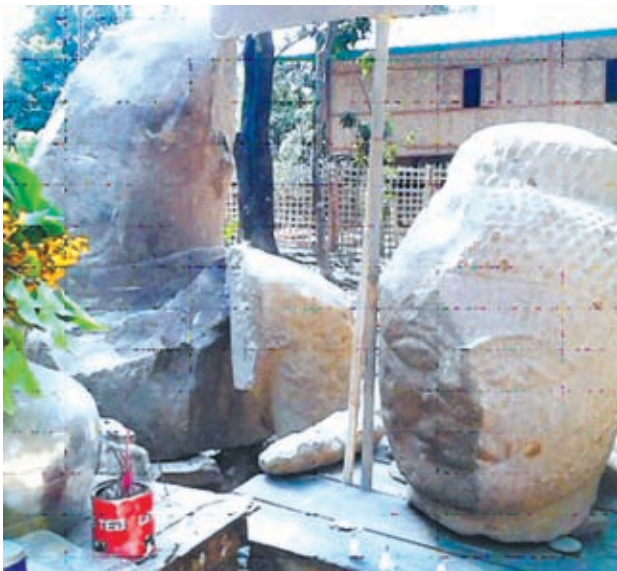
being kept in the precinct of the monastery for public obeisance.