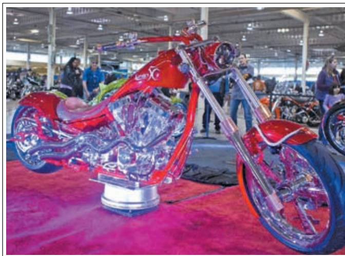
People visit the 32nd Annual National Motorcycle show at the Canadian National Exhibition in Toronto on 14 April, 2013. As the longest running spring motorcycle event in Toronto, the two-day event attracted hundreds of new and modified motorcycles to celebrate the coming of the motorcycle season.