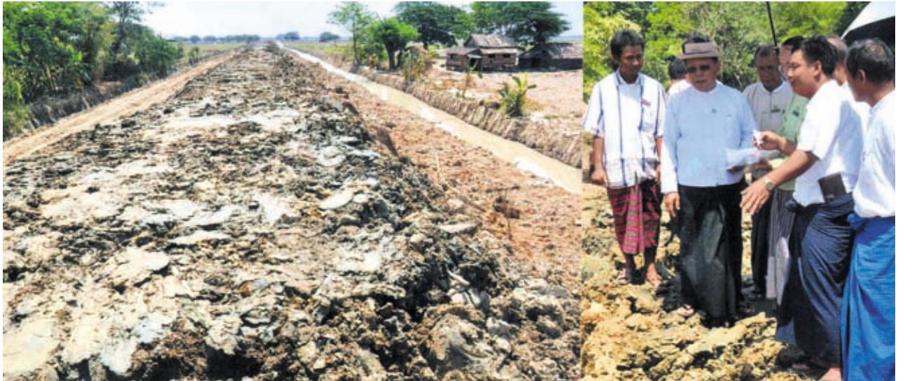
Chief Minister of Ayeyawady Region U Thein Aung inspects digging of drains in Kyatkon and Yaylesu villages in Kangyidaunt Township.—MNA

NAY PYI TAW, 21 April—The opening ceremony of new school building