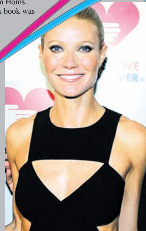
Gwyneth Paltrow will next be seen in Iron Man 3 opposite Robert Downey Jr.