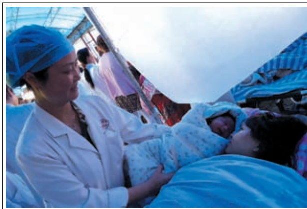
A mother (R) views her newly-born baby in the quake-hit Ya'an City, southwest China's Sichuan Province, on 20 April, 2013. The baby was born in an ambulance in Ya'an, almost two hours after a 7.0-magnitude earthquake hit Lushan county of Ya'an City on Saturday.