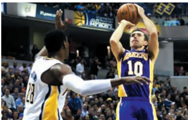
Los Angeles Lakers guard Steve Nash (10) of Canada shoots the basketball over Indiana Pacers centre Ian Mahinmi of France during the first half of an NBA basketball game in Indianapolis, Indiana on 15 March, 2013.

told reporters. "I'm very optimistic that I'll play on Sunday. I just don't want to over-promise and get ahead of myself." Nash, who has not played for the Lakers in almost three weeks, had an epidural injection three days ago. Though not yet pain-free, he said he felt less inhibited in his movement. "I was able to play halfcourt today, and there were a couple of situations where it was pretty close to a sprint so it's coming," he said. "In some ways, I want to give myself as much time as possible but at the same time you can't wait forever. I'm just hoping to be able to play, get out there and contribute. "That's the bottom line. I'm just really hopeful and working hard — pretty much twice a day the last few weeks — to get back. Hopefully the time has come."—Reuters