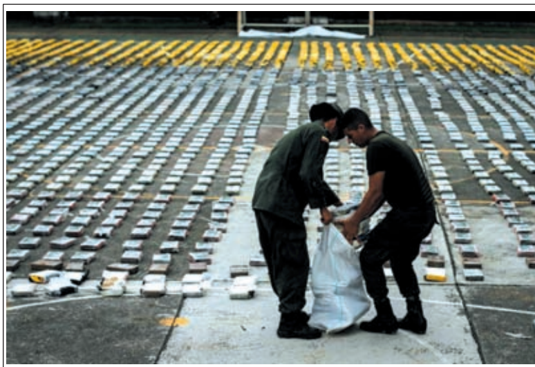
Police agents pick up packs of cocaine hydrochloride seized during an operation in the township of Turbo, Antioquia department, Colombia, on 20 April, 2013.