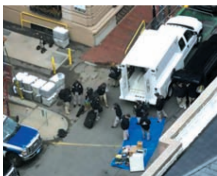
Law enforcement officials investigate the scene of the Boston Marathon bombings in Boston, Massachusetts, on 20 April, 2013.

BOSTON, 21 April—The surviving suspect in the Boston Marathon bombings lay seriously wounded and unable to speak in a hospital on Saturday as investigators worked to determine a motive and whether the two ethnic Chechen brothers accused of the attack acted alone. Dzhokhar Tsarnaev, 19, was captured late on Friday after a gunfight with police that ended a daylong manhunt and sent waves of relief and jubilation throughout Boston. His brother, Tamerlan, 26, died on early Friday after a shootout with police.