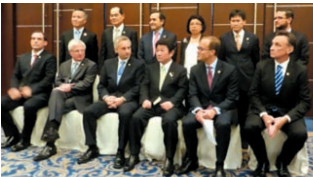
Japanese Economy, Trade and Industry Minister Toshimitsu Motegi (front, 3rd from R) attends a photo session in Surabaya, Indonesia, on 20 April, 2013, with ministers of 11 countries involved in the Trans-Pacific Partnership free trade negotiations. All 11 countries already involved in the TPP talks officially announced they have agreed to Japan's joining the rule-making process.

The United States, for its part, needs to give a 90-day notice to Congress in order to start TPP negotiations with Japan. "Japan's entry (to TPP talks) was effectively approved," said Japanese Economy, Trade and Industry Minister Toshimitsu Motegi after attending a ministerial meeting of TPP members, held on the sidelines of a weekend meeting of the Asia-Pacific Economic Cooperation forum. "From this moment, we are taking a new step" in the negotiations, said Motegi, adding Japan is starting talks on which its national interest depends.