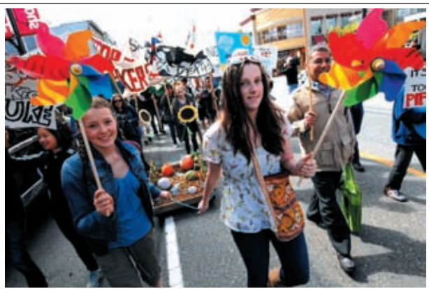
Students take part in annual Earth Day Parade and march through the streets of Vancouver, Canada, on 20 April, 2013. This year's Earth Day Parade is organized by a group of high school students who call themselves "Youth 4 Climate Justice Now" in order to bring government attention to the environmental issues and to do more to leave youth with a sustainable world to inherit. — XINHUA