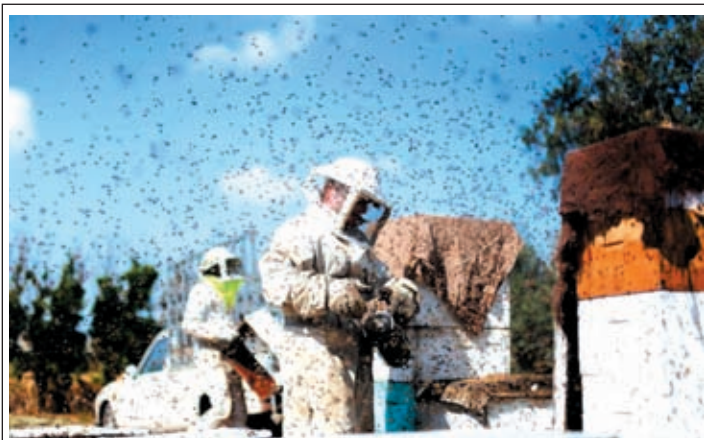
Palestinian beekeepers inspect hives at the honey-bee farm in Gaza city, on 20 April, 2013. The apiary's 450 bees produce about 4,000 kilos of honey every year, which is sold only in the Gaza Strip.