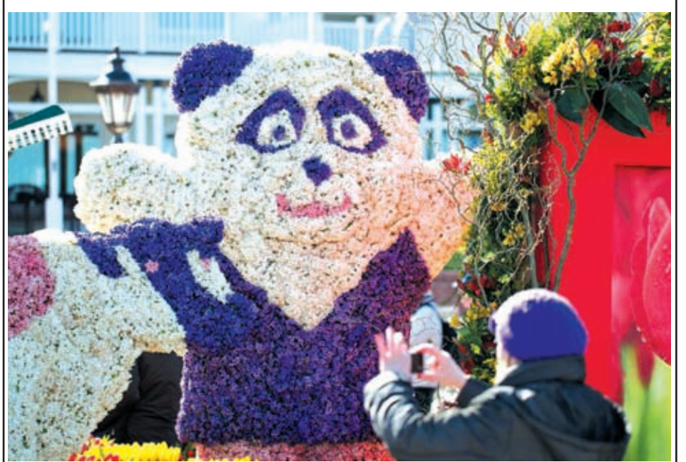
A Dutch takes photos of a float during the 66th flower parade with the theme "Bon Appetit" this year in Nordwijk, the Netherlands, on 20 April, 2012. The very famous event with 20 floats opulently decorated with spring flowers started from Nordwijk and ended in Haarlem following a 40-km route.