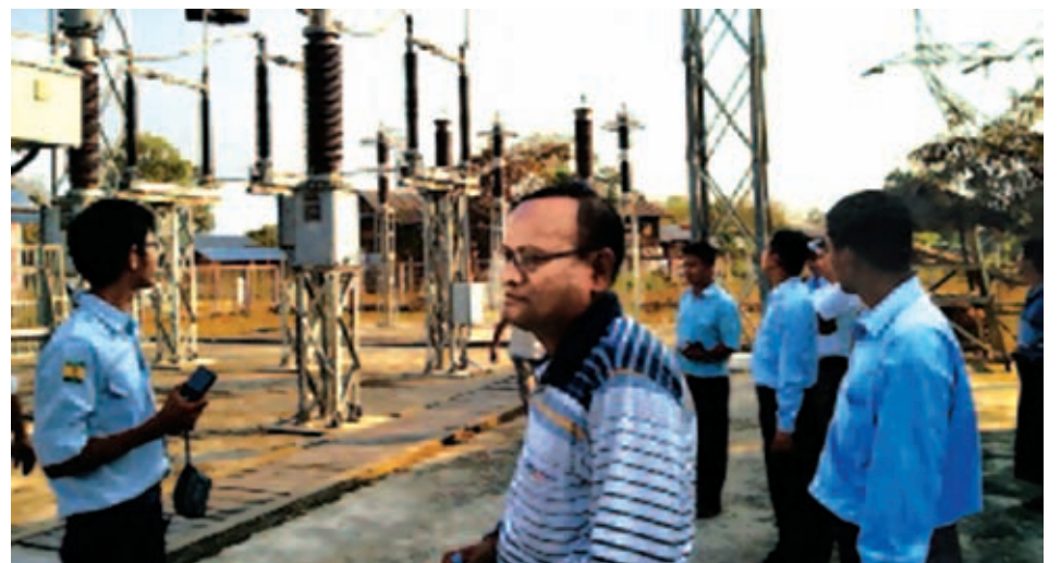
Officials inspect power lines at Tarpein (1) Hydropower Plant in Bhamo District in Kachin State.