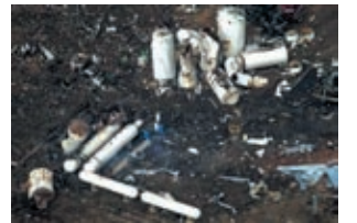
Investigators stand amid the aftermath of a massive explosion at a fertilizer plant in the town of West, near Waco, Texas on 18 April, 2013.

Company officials did not return repeated calls seeking comment on its handling of chemicals and