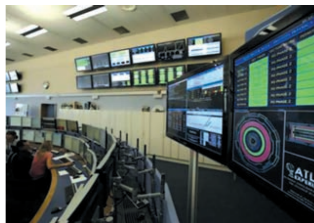
Technicians look at computer screens during the preparation of the beam in the Control Room of the Large Hadron Collider (LHC) at the European Organization for Nuclear Research (CERN) near Geneva on 5 April, 2012.