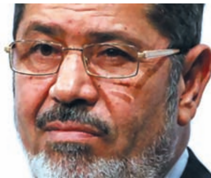
Egyptian President Mohamed Mursi.

"The programmes that serve (this) interest are not in accordance with what the