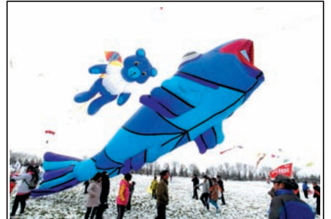
Participants fly kites at the 30th Weifang International Kite Festival in Weifang, east China's Shandong Province, on 20 April, 2013. Kite-making in Weifang, known as "Kite Capital," can be traced back to the late 16th century and the early 17th century.

capture the assailants. The cause of the incident is still unclear. —Xinhua