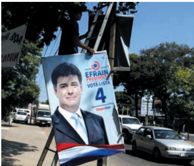
A man handles a campaign billboard of Paraguay's presidential candidate Efraim Alegre of the ruling Liberal Party in Asuncion, on 20 April, 2013. Paraguayans will vote for a new president on Sunday.

Security personnel work at the Mall, the finishing line of the London Marathon, in London, capital of Britain, on 20 April, 2013. London's Metropolitan Police have reinforced security for the competition scheduled for 21 April, in the wake of the Boston Marathon bombings.