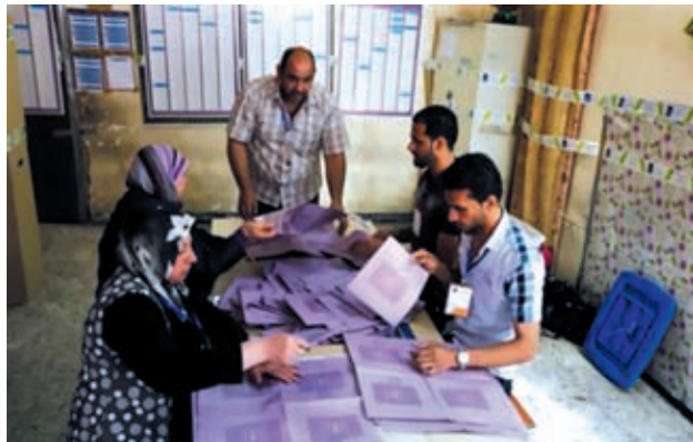
Employees of the Independent High Electoral Commission (IHEC) count ballots at a polling station in Baghdad on 20 April, 2013.

BAGHDAD, 21 April — Bomb attacks and mortar fire failed to prevent Iraqis voting on Saturday in the