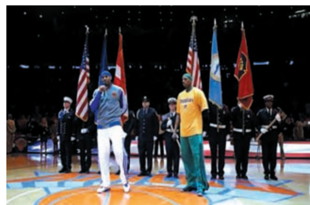
New York Knicks forward Carmelo Anthony and Boston Celtics forward Paul Pierce (R) speak to the crowd about the Boston Marathon bombings before Game 1 of their NBA Eastern Conference Quarterfinals basketball playoff series in New York, on 20 April, 2013.

Some fans of the second seed Knicks were still moved to jeer the sight of the seventh-seeded Celtics on the Broadway hardwood, before thousands of fans shushed them into silence. Wearing a T-shirt that read "boston stands as one", the Celtics' Paul Pierce expressed gratitude for the show of support and vowed, "Boston will rise and run again."—Reuters