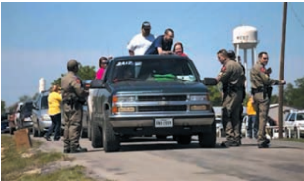
Residents line-up in their vehicles to gain clearance from police officers to return to their homes, three days after a fertilizer plant explosion, in the town of West, near Waco, Texas on 20 April, 2013.