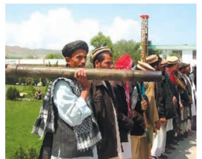
14 anti-government militants attend a surrender ceremony in Baghlan Province of northern Afghanistan, on 20 April, 2013. More than a dozen armed militants laid down arms and resumed normal life in Baghlan Province 160 km north of Kabul on Saturday.

These people, he said had linked with the radical Islamic party the Hekmatyar-led Hizb-e-Islami and