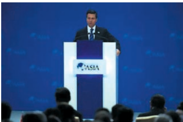
Mexican President Enrique Pena Nieto speaks at the opening ceremony of the annual Boao Forum in Boao, in southern China's Hainan province, on 7 April, 2013.