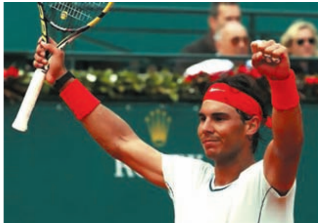
Rafael Nadal of Spain reacts after defeating Grigor Dimitrov of Bulgaria during the Monte Carlo Masters in Monaco on 19 April, 2013.

MONTE CARLO, 21 April—Eight-times champion Rafael Nadal will lock horns with world number one Novak Djokovic for third time in the Monte Carlo Masters final after both sailed through their semi-finals with relative ease on Saturday. Nadal was given a fight by Frenchman Jo-Wilfried Tsonga before the Spaniard won 6-3, 7-6 but Djokovic was dominant in a