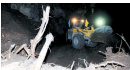
Workers of Sichuan Road and Bridge (Group) and China Railway Group rush to repair the only road heading to Lingguan Township of Baoxing County, which was badly hit by the earthquake, in Lushan County of Ya'an City, southwest China's Sichuan Province, at the midnight of 21 April, 2013.