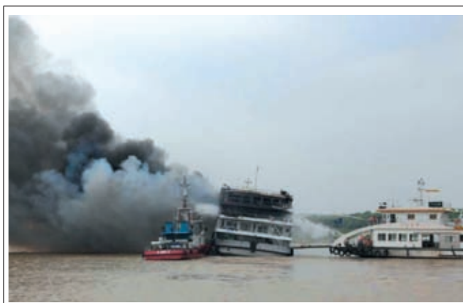
A rescue boat puts out a fire on a passenger ship near Tianxingzhou Bridge across the Yangtze River in Wuhan, capital of central China's Hubei Province, on 20 April, 2013. The fire started around 11:00 am on Saturday Beijing Time. All 415 people aboard have been transferred safely.—XINHUA

In addition to the Southeast Asian countries, Japan will also consider expanding the issuance of multiple-entry visas for Chinese nationals that had been limited to those staying in Iwate, Miyagi, Fukushima and Okinawa prefectures, to visitors staying elsewhere in Japan in a bid to attract more visitors from the country, they said. The number of visitors from China has declined due to soured relations between Beijing and Tokyo due to a territorial dispute. According to the tourism agency, Japan had 8.37 million foreign visitors in 2012.— Kyodo News