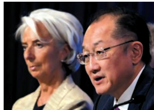
World Bank President Jim Yong Kim (L) speaks next to International Monetary Fund (IMF) Managing Director Christine Lagarde at a news conference during the Spring Meeting of the IMF and World Bank in Washington, on 20 April, 2013.