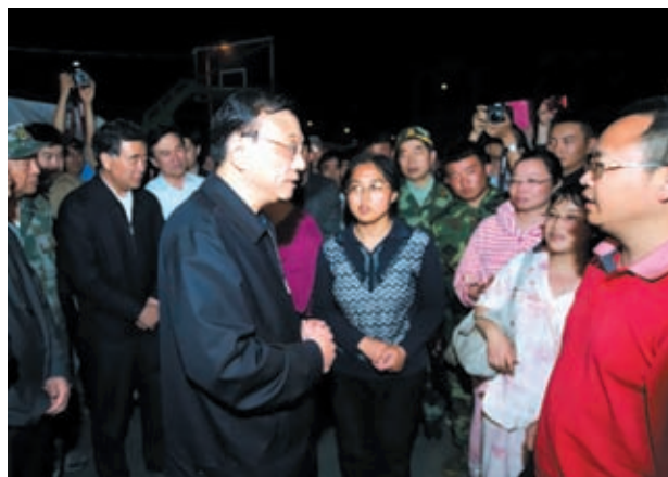
Chinese Premier Li Keqiang (L, front), also a member of the Standing Committee of the Political Bureau of the Communist Party of China Central Committee, visits quake-affected people at a relocation site in a middle school of the quake-hit Lushan County, southwest China's Sichuan Province, on 20 April, 2013. Li Keqiang arrived in Sichuan Saturday afternoon to deploy quake relief work.

The earthquake hit Lushan County at 8:02 am Beijing time on Saturday. Authorities said at least 160 people have been killed and more than 6,700 injured as of 0:40 am Sunday Beijing Time. As the electricity supply had not yet been resumed, Li had to hold a meeting late Saturday night with flashlights in a tent in the epicentre Lushan Coun-