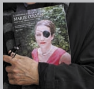
A man holds a sign honouring Sunday Times journalist Marie Colvin after a memorial service, outside St Martin in the Field in London on 16 May, 2012.