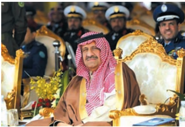
Saudi's Prince Khaled bin Sultan bin Abdul-Aziz, the assistant minister for defence and aviation, attends the graduation ceremony of Saudi Air Force cadets at King Faisal military college in Riyadh on 4 Jan, 2011.

The Defence Minister is Crown Prince Salman, King Abdullah's named successor. He oversees multi-billion-dollar arms purchases that cement Saudi Arabia's alliances with Western nations. Unlike in European monarchies, the Saudi ruling family suc-