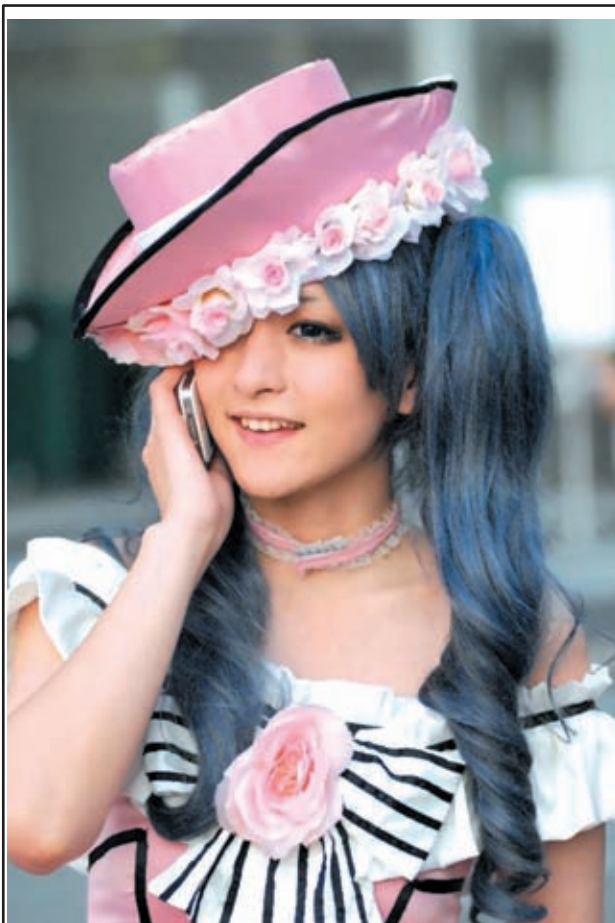
A woman dressed as her favourite character poses at the 2013 Fan Expo in Vancouver, Canada, on 20 April, 2013. This year's event has about 130 exhibitors for comic books, anime, science fictions and video games.