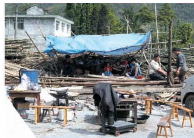
Residents rest in a makeshift tent after a 7.0-magnitude earthquake occurred in Longmen Township, Lushan County, Ya'an City of southwest China's Sichuan Province, on 20 April, 2013.

Chen said disaster relief materials such as blankets, tents and sleeping bags have been packed for delivery, and rescue gear such as life detectors and excavating equipment will be included if necessary. Meanwhile, rescue teams arranged by the island's fire agency are also