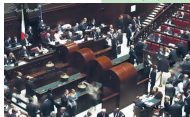
An overhead view during the second day of the presidential election in the lower house of the parliament in Rome on 19 April, 2013.

to form a government. A broad coalition has so far been rejected by the centre-