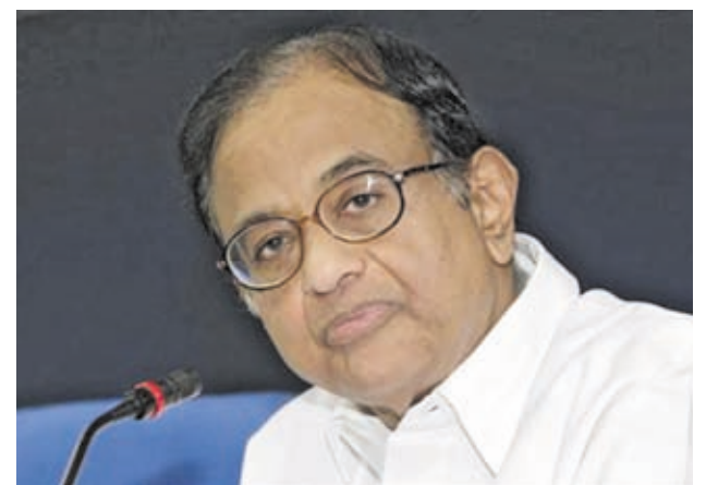
India's Finance Minister Palaniappan Chidambaram speaks during a news conference in New Delhi on 20 March, 2013.

The measures are still being formulated and have not been approved, the officials stressed. Chidambaram, aiming to take advantage of a wave of cheap global funds, will meet foreign investors in New York, Ottawa and Toronto, the latest stops in a global roadshow to talk up India as an investment destination. The new push for foreign investment is seen as part of an important but potentially risky shift in how India