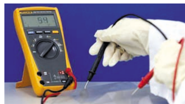
A Cima NanoTech employee tests the conductivity of a piece of folded SANTE Film in their lab in Singapore in this 12 April, 2013 picture.

Screen technology—and the global small display market is seen more than doubling to around $72