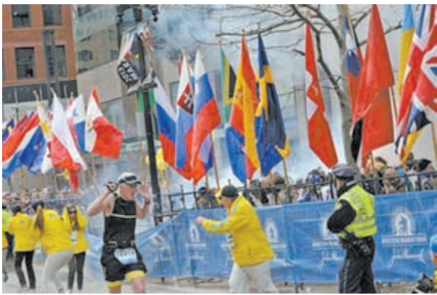
Police and runners react to an explosion during the Boston Marathon finish area in Boston, Massachusetts, on 15 April, 2013.

BOSTON, 16 April—Two bombs ripped through the crowd at the finish line of the Boston Marathon on Monday, killing three people, maiming others and injuring more than 100 in what a White House official said would be treated as an “act of terror.”