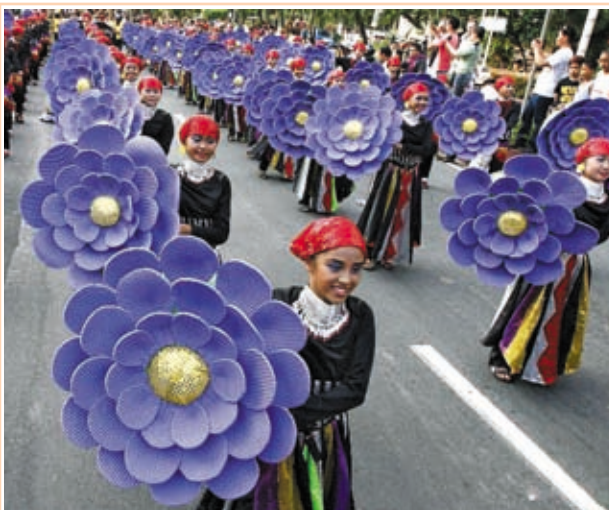
Street dancers perform during the Aliwan Festival in Manila, the Philippines, on 13 April, 2013. More than 5,000 participants from all over the Philippines took part in the annual event.