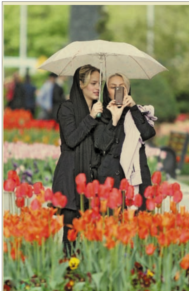
Women take photos of flowers at Mellat park in northern Teheran, Iran, on 14 April, 2013. Spring flowers blossom here as the temperature keeps rising recently. XINHUA

The Marshal Shaposhnikov warship, along with sea tanker Irkut and the rescue tugboat Alatau completed a long anti-piracy mission in the Gulf of Aden and returned to its base at the port of Vladivostok on March. The crew of the warship includes marine units and the aviation group with two deck helicopters for reconnaissance missions.—Xinhua