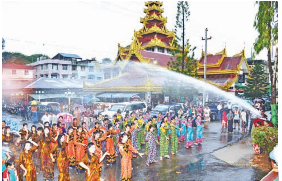
Opening ceremony of Central Water Throwing Pandal in progress at Seikkantha Park of An-nawa Ward in Kawthoung on 13 April.