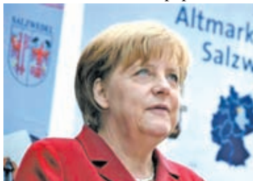
German Chancellor Angela Merkel visits the public transport company PVGS Personenverkehrsgesellschaft mbH in Salzwedel, eastern Germany, on 12 April, 2013.

published a story saying Merkel might step down in 2015 if she were to win re-election in September. The year 2015 would mark 10 years in power for Merkel and she would be 60 in 2015.