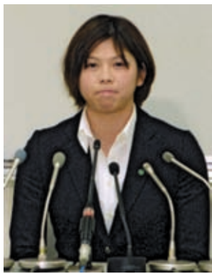
Judoka Tomoko Fukumi, who won the 2009 world championship in the women's 48-kilogram class, announces her retirement at a press conference in Urayasu, Chiba Prefecture near Tokyo, on 15 April, 2013.

"Because of the challenge of getting past Tani, I was able to develop to an amazing degree," Fukumi said at a press conference in Chiba Prefecture. "I improved a lot through my time with her (Tani). I