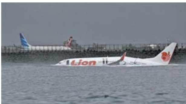
The body of a Lion Air plane is seen in the water after it missed the runway in Denpasar, Bali on 13 April, 2013.