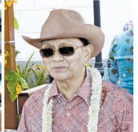
President U Thein Sein

Myanmar people celebrate New Year Festival on a grand scale at the time when the old year ended in Tabauung, the last month of Myanmar lunar calendar, and the new year has started in Tagu, the first month of the calendar. Thingyan water festival is held across the nation at the beginning of Tagu.