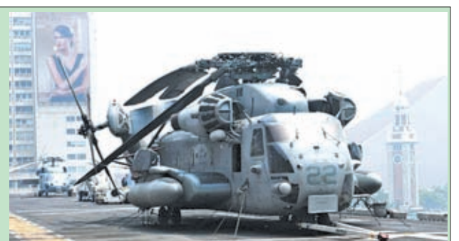
A US Navy helicopter is pictured on the USS Peleliu , the flagship of the Amphibious Squadron Three, in Hong Kong, south China, on 15 April, 2013.