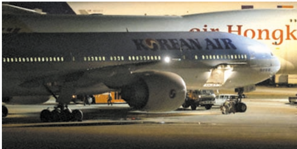
Photo shows a Korean Air passenger jet, en route from South Korea to the United States, which made an emergency landing at Narita international airport near Tokyo on 14 April, 2013, after smoke was reported in the cockpit.

NARITA, 16 April—A Korean Air passenger jet en route from South Korea to the United States made an emergency landing on Sunday at Narita international airport after smoke was reported in the cockpit, the transport ministry