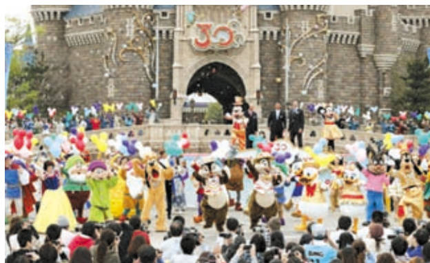
Popular characters assemble in front of Cinderella Castle at Tokyo Disneyland in Urayasu, Chiba Prefecture, on 15 April, 2013, in a commemorative ceremony to mark the 30th anniversary of the theme park. — KYODO NEWS

DisneySea park in 2001 to a location adjacent to Tokyo Disneyland. Cumulative visitors to the parks eclipsed 500 million people in 2010.—Kyodo News