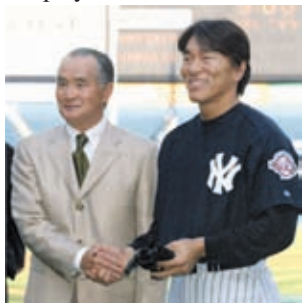
Former Yomiuri Giants manager Shigeo Nagashima (L) and New York Yankees outfielder Hideki Matsui shaking hands.

Nagashima, 77, a legendary former third baseman for Yomiuri Giants nicknamed "Mr Baseball," was a superstar symbolic of post-World War II Japan. Matsui, 38, played for Yomiuri under