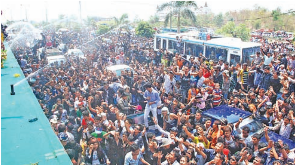
Thingyan merry-makers and revellers participate in water festival at Sky Net Family pandal in Nay Pyi Taw Hotel Zone on Akya Day.