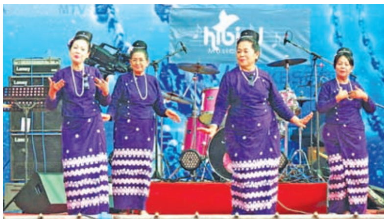
Members of Moms Troupe perform traditional dances to Thingyan lovers.