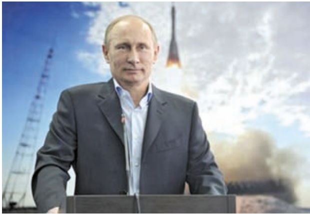
Russian President Vladimir Putin holds a communication session with the crew of the International Space Station (ISS) on Cosmonautics Day during his visit to the Amursk Region, on 12 April, 2013.

VOSTOCHNY COSMODOROME, 16 April — President Vladimir Putin told astronauts on Friday that Russia will send up the first manned flights from its own soil in 2018, using a new launch pad he said will help the once-pioneering space power explore deep space and the moon. Speaking by video