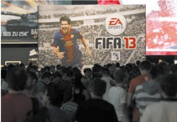
Visitors walk past an advertising placard of FIFA13 during the Gamescom 2012 fair in Cologne on 16 Aug, 2012.

The company, known for its “FIFA” and “Sims” games, declined to divulge