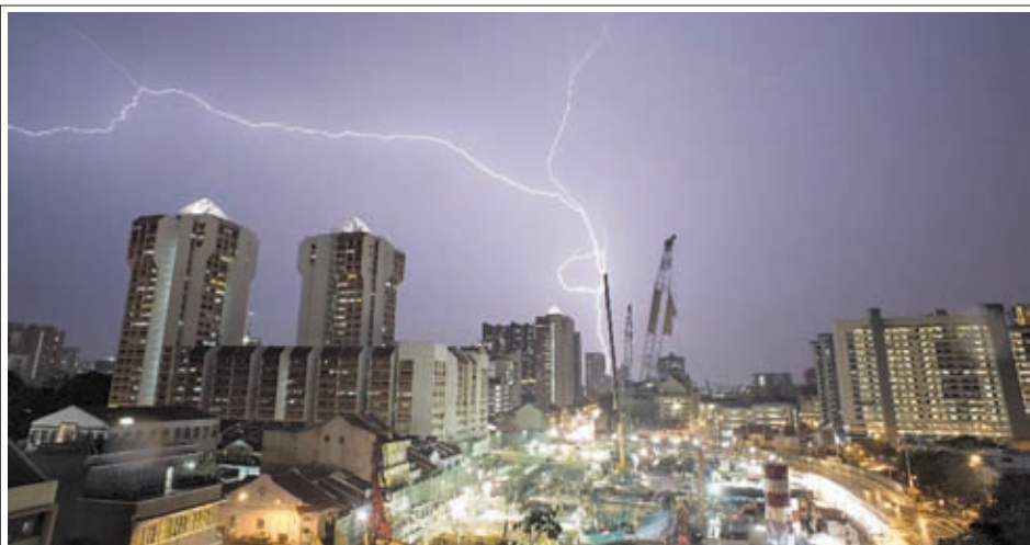
Lightning flashes across the night sky over Singapore on 13 April, 2013.