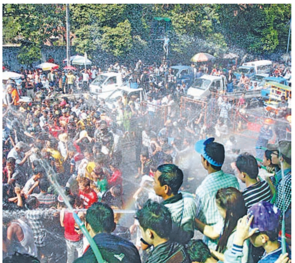
People happily participate in water dousing festival at Sky Net and Shwe FM pandal at the corner of Anawrahta and 19th Street in Latha Township of Yangon Region.