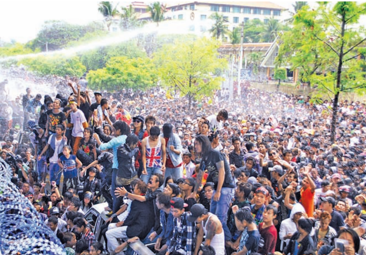
Thingyan revellers enjoying water throwing festival at Alpine pandal on southern moat in Mandalay on Maha Thingyan Akya Day.