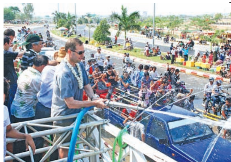
Diplomats together with local people enjoying Maha Thingyan Festival in Nay Pyi Taw Hotel Zone.