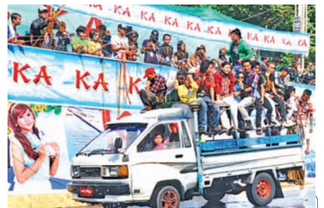
Young people joyfully participate in water festival of 1374 ME Maha Thingyan in Pyinmana.