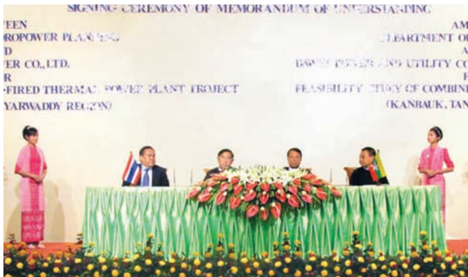
Signing ceremony of MoUs on power plants in progress.