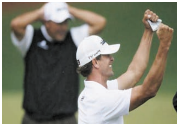
Adam Scott of Australia (L) celebrates winning the 2013 Masters golf tournament on the second playoff hole in front of Angel Cabrera of Argentina at the Augusta National Golf Club in Augusta, Georgia, on 14 April, 2013.

AUGUSTA, (Georgia), 16 April—Adam Scott's dramatic playoff victory on Sunday provided a perfect exclamation point to the 77th Masters which had endured moments of imperfection while also offering a tantalizing glimpse into golf's future. The quality of shot-making produced by Scott and Argentina's Angel Cabrera at the business end of the tournament was extraordinarily good, and perhaps even more impressive was the high level of sportsmanship they extended to one another.