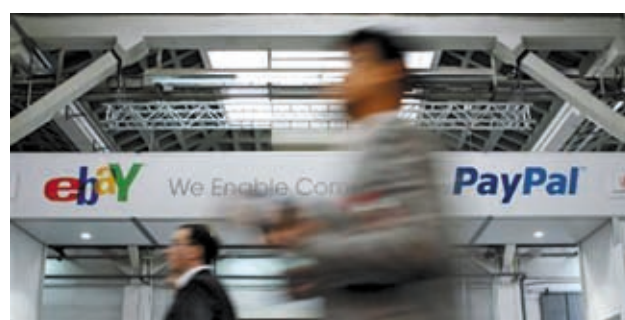
Visitors walk past an Ebay and PayPal banner at the Mobile World Congress in Barcelona on 28 Feb, 2012.