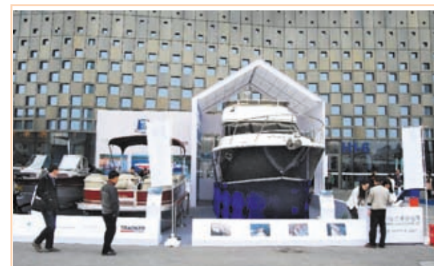
Visitors view a yacht during the 18th China (Shanghai) International Boat Show (CIBS) at the Shanghai World Expo Exhibition & Convention Centre in Shanghai, east China, on 11 April, 2013. A total of 550 real boats from 500 exhibitors were displayed at the four-day-long CIBS that kicked off on Thursday.