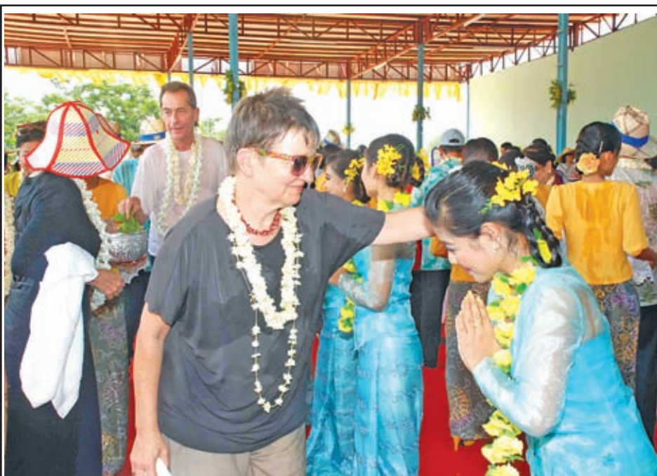
Diplomats joyfully participate in water throwing festival by pouring water at a Myanmar damsel in Nay Pyi Taw Hotel Zone on Akya Day (14-4-2013) of Maha Thingyan Festival.