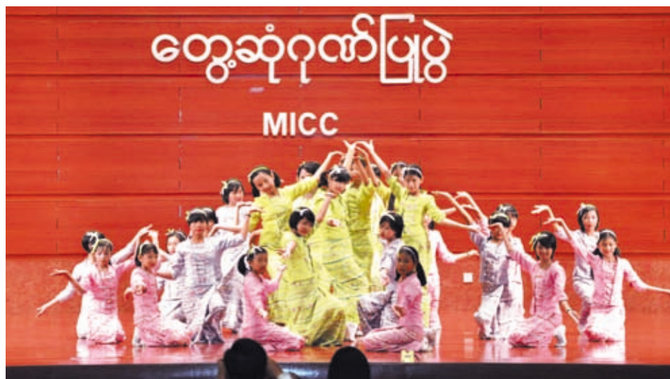
Students perform entertainment at the ceremony to honour the outstanding students and scouts.