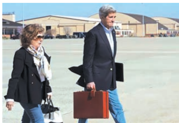
US Secretary of State John Kerry and his wife Teresa Heinz Kerry board a second plane after their original aircraft had mechanical problems at Andrews Air Force Base in Maryland on 6 April, 2013.

"This is not an interminable process," Kerry said after arriving in Istanbul on Sunday on the first leg of a