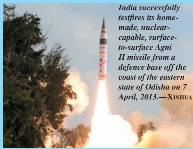
India successfully testfires its home-made, nuclear-capable, surface-to-surface Agni II missile from a defence base off the coast of the eastern state of Odisha on 7 April, 2013.—XINHUA

developed by state-owned Defence Research and Development Organization, has already been inducted in the Indian Army. The missile is 20 metres long and weighs 17 tonnes. It can carry a payload weighing 1 tonne. India plans to testfire Agni V, with a strike range of over 5,000 km, in June.—Xinhua