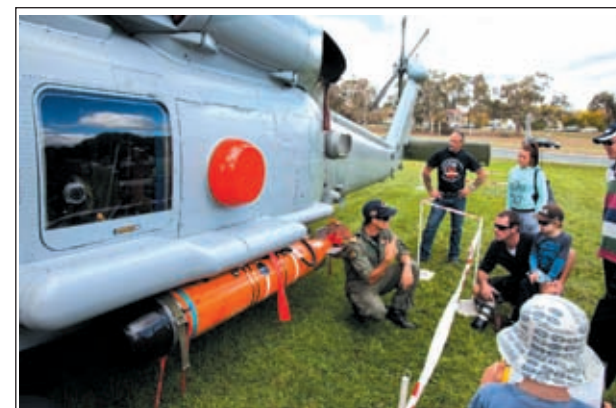
A pilot introduces the helicopter to visitors at Australian War Memorial during its Open Day in Canberra, Australia, on 6 April, 2013.