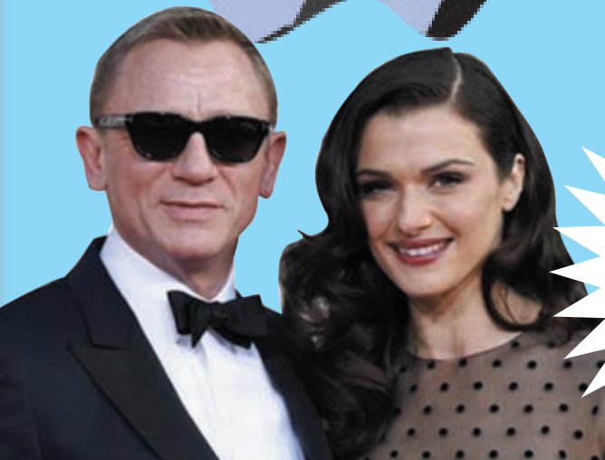
Actor Daniel Craig and his wife, actress Rachel Weisz, arrive at the 70th annual Golden Globe Awards in Beverly Hills, California, on 13 Jan, 2013.