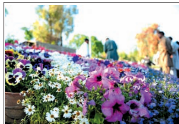
Flowers can be seen on a spring flower show in Islamabad, capital of Pakistan, on 7 April, 2013. Flowers are in full bloom as the temperature rises in Pakistan.