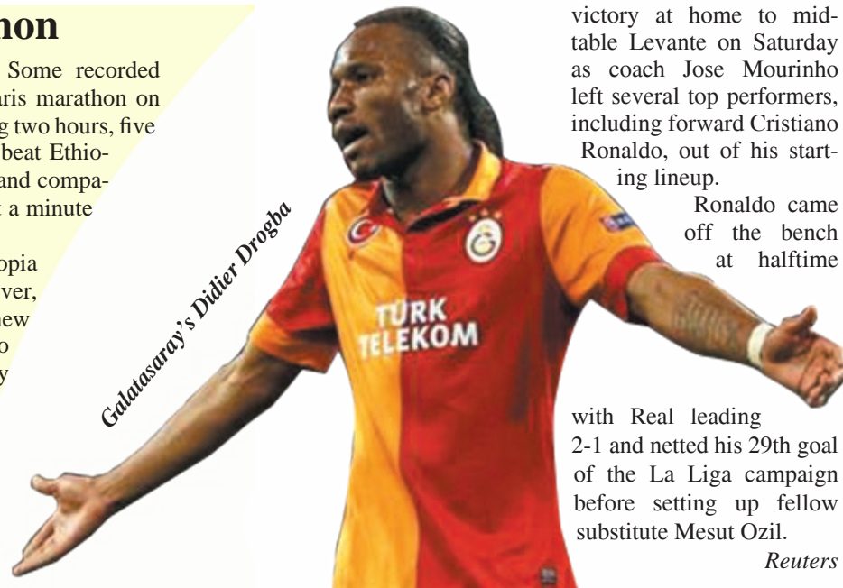
Galatasaray's Didier Drogba