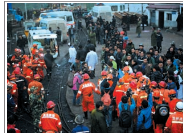
A rescued miner is carried to an ambulance at a flooded coal mine in Weng'an County, southwest China's Guizhou Province, on 8 April, 2013. Three miners trapped in the flooded Yunda Coal Mine for about 60 hours were rescued early Monday morning. Three others remained missing at the mine, which was hit by flood last Friday. Rescuers had earlier confirmed that three miners had been dead.