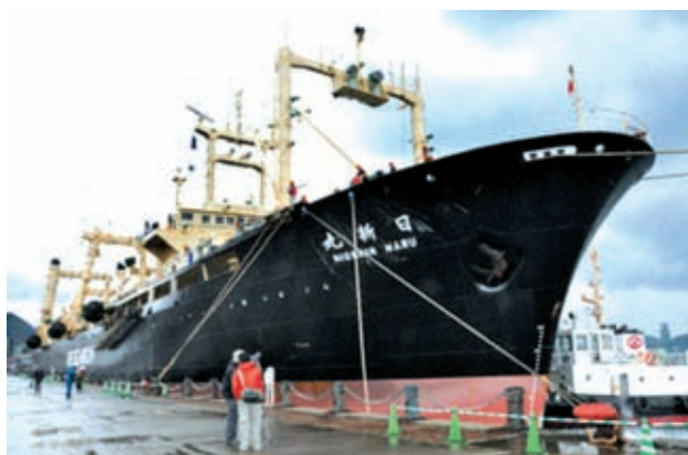
Photo shows the mother ship Nisshin Maru of Japan's three-ship whaling fleet, which returned to the port of Shimonoseki, Yamaguchi Prefecture, on 7 April, 2013, after completing the season's research whaling in the Antarctic Ocean.

Agriculture, Forestry and Fisheries Minister Yoshimasa Hayashi told a welcoming ceremony that the group's obstructive activities "amounted to piracy, as the International Whaling Commission has recognized the legitimacy of Japan's research whaling." The Nisshin Maru was making a