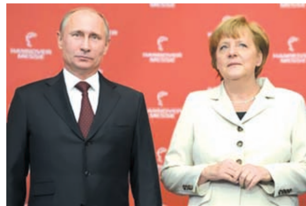
German Chancellor Angela Merkel and Russian President Vladimir Putin pose for photographers before they officially open the Hanover Messe, industrial trade fair, in Hanover on 7 April, 2013. Russia is the partner country of the Hanover fair 2013, which runs from 8-12 April.