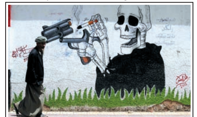
A Yemeni man passes a wall with anti-smoking graffiti in Sanaa, Yemen, on 7 April, 2013. The World Health Day is celebrated on 7 April to mark the 65th anniversary of the World Health Organization that was established in 1948. The theme for 2013 is high blood pressure. The Yemeni government has been trying to restore medical services in the country after the unrest in 2011 hit hard the cash-stripped Arab state.—XINHUA