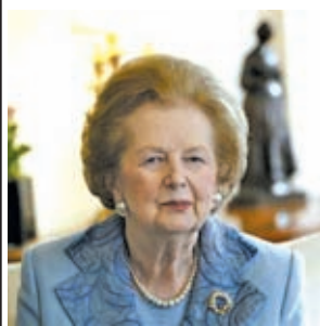
Britain's former Prime Minister Margaret Thatcher.

ness that I learned of Lady Thatcher's death,” Prime Minister David Cameron said. “We've lost a great leader, a great Prime Minister and a great Briton.”