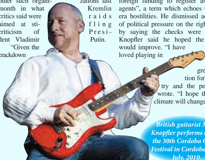
British guitarist Mark Knopfler performs during the 30th Cordoba Guitar Festival in Cordoba on 25 July, 2010.