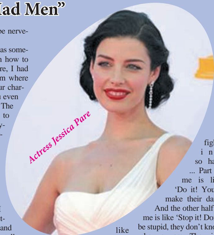
Actress Jessica Pare

A: I now love the taste of the non-alcoholic wine, the herbal cigarettes smell