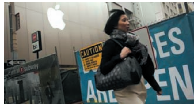
A woman walks past an Apple logo at the company's flagship retail store near signs for the central subway project in San Francisco, California on 23 Jan, 2013.

overarching conspiracy" and desire to litigate it all at once weighed "heavily" in favour of certifying a class, which the plaintiffs' lawyers have said could include tens of thousands of people.