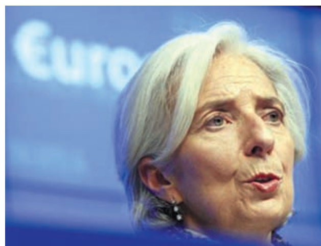
International Monetary Fund (IMF) executive director Christine Lagarde attends a news conference at the end of a Eurogroup meeting at the European Council building in Brussels, on 25 March, 2013.