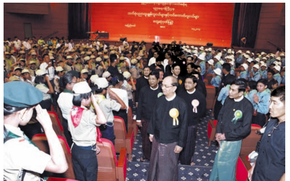
Outstanding students and scouts salute President U Thein Sein at the meeting.

scouts and outstanding students to be qualified present to be law abiding citizens who say no to undemocratic behaviours.