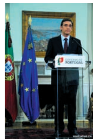
Portuguese Prime Minister Pedro Passos Coelho makes a speech at his office in Lisbon, capital of Portugal, on 7 April, 2013.