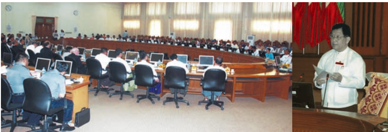
Union Election Commission Chairman U Tin Aye making a speech in meeting with those from political parties.

NAY PYI TAW, 8 April—Union Election Commission will educate the ethnic people on voting processes through its public awareness programmes in ethnic languages, Chairman of Union Election Commission U Tin Aye said in meeting with political parties this morning.