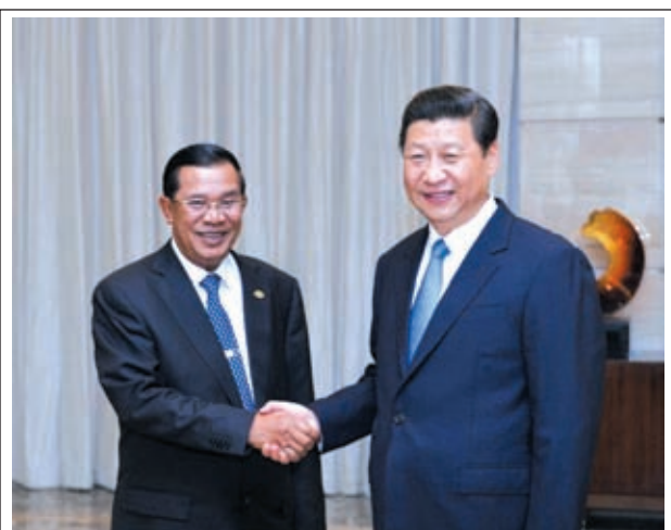
Chinese President Xi Jinping (R) shakes hands with Cambodian Prime Minister Hun Sen during their meeting on the sidelines of Boao Forum for Asia (BFA) Annual Conference 2013 in Boao, south China's Hainan Province, on 7 April, 2013.