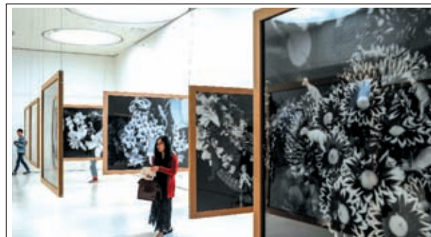
Visitors view works of Nobuyoshi Araki during an exhibition of the Japanese photographer and contemporary artist at Guangdong Times Museum in Guangzhou, capital of south China's Guangdong Province, on 7 April, 2013.