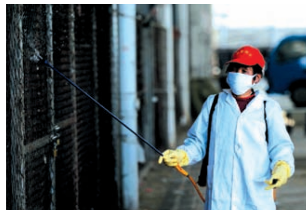
A health worker sprays disinfectant at a closed live poultry trade market in Feidong County, east China's Anhui Province, on 7 April, 2013.

An initial investigation showed that six people who have had close contact with the two have not exhibited flu symptoms.—Xinhua