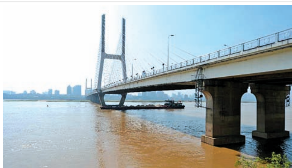
A cargo ship sails under the Bayi Bridge across the Ganjiang River in Nanchang, capital of east China's Jiangxi Province, on 7 April, 2013. The water level of the Ganjiang River in the Nanchang segment has risen to 18.53 metres by 7 April morning, five metres higher than half month earlier and two meters higher than the same period of last year, according to the Nanchang Hydrology Station. The local government has strengthened its flood surveillance and control.