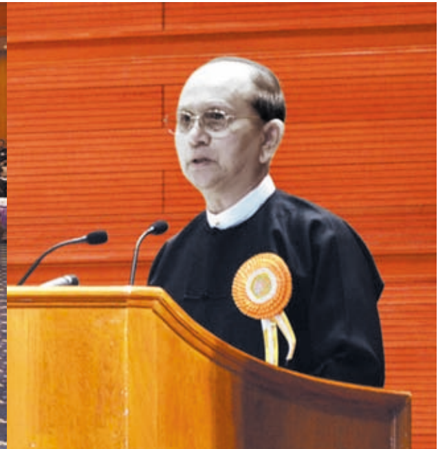
President U Thein Sein meets outstanding students and scouts at Myanmar International Convention Centre.—MNA

NAY PYI TAW, 8 April—“Learning of democratic practices should be started from the life of school children. Things they have learned must be put into practice. It is required to make a great stride in cultivating a good practice in exercise of freedom which is not harmful to others since the school days, understanding the core democratic values along with developing a sense of responsibility and accountability,” says President of the Republic of the Union of Myanmar U Thein Sein at the ceremony to honour the outstanding students and scouts at Myanmar International Convention Centre, here, this evening.