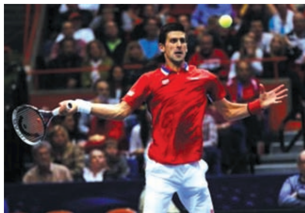
Serbia's Novak Djokovic hits a return to Sam Querrey of the US during their Davis Cup quarter-final tennis match in Boise, Idaho on 7 April, 2013.

Querrey rallied in the second set, dictating play with his big serve and fore-