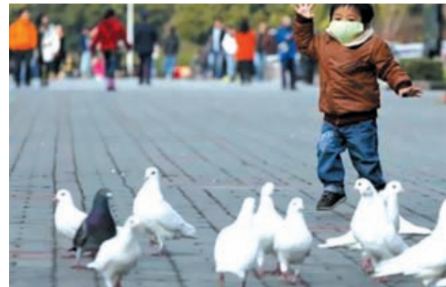
A boy looks at pigeons at a public park in People Square, downtown Shanghai on 6 April, 2013.