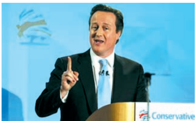
Britain's Prime Minister David Cameron speaks at the Conservative Party's annual Spring Forum, in central London on 16 March, 2013.