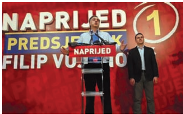
Montenegrin President Filip Vujanovic (L) declares victory based on his camp's own vote count during presidential elections in Podgorica on 7 April, 2013. Both sides claimed victory in Montenegro's presidential election on Sunday, raising the prospect of a dispute over the largely ceremonial post in the tiny Adriatic country as it bids to join the European Union.