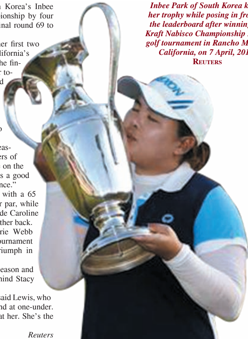
Inbee Park of South Korea kisses her trophy while posing in front of the leaderboard after winning the Kraft Nabisco Championship LPGA golf tournament in Rancho Mirage, California, on 7 April, 2013.

"I've seen Inbee do this before," said Lewis, who finished in a disappointing tie for 32nd at one-under. "When she rolls it, you just can't beat her. She's the best putter on tour."