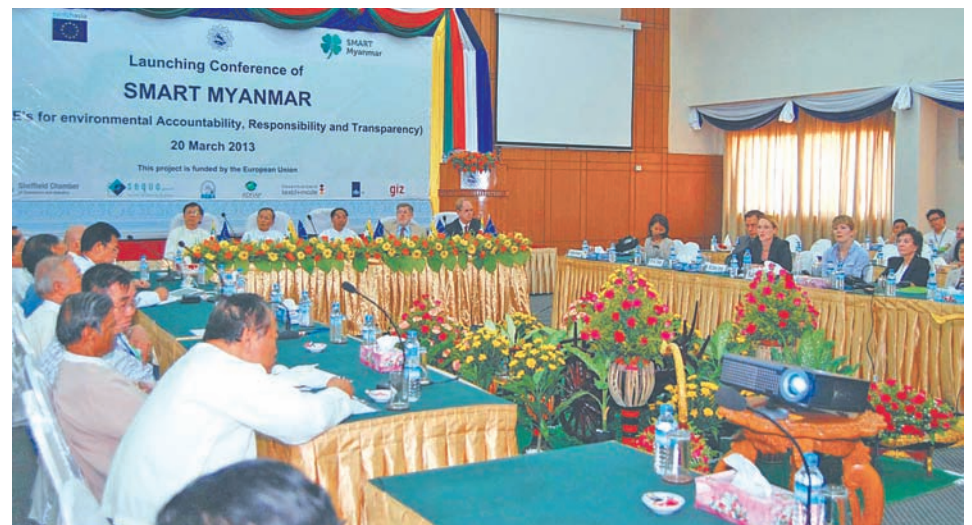
Launching Conference of Smart Myanmar Project in progress.—MNA