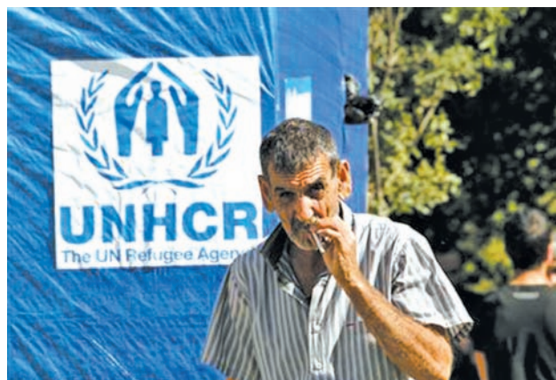
A Syrian refugee smokes during the visit of UN High Commissioner for Refugees (UNHCR) Antonio Guterres in Katermaya village in the Chouf mountains on 14 March, 2013.

The agreement requires approval of regional heads of state. Ivory Coast recorded the first in a series of hijackings targeting tankers carrying refined petroleum products in October. The ships and their crews were all released but their cargoes were stolen.—Reuters