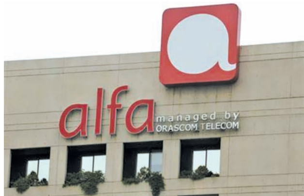
A view shows the Alfa telecommunications building in Beirut on 19 March, 2013. Lebanon is embarking on an ambitious plan to bolster its telecommunications industry with a tender to run its two state-owned mobile telephone operators, Alfa and Touch.