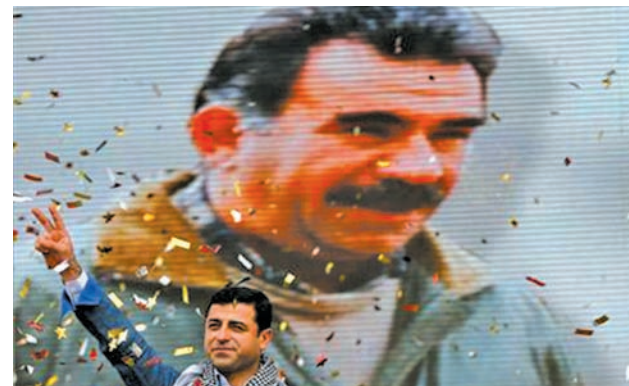
Selahattin Demirtas, co-chairman of the pro-Kurdish Peace and Democracy Party (BDP), gestures during a rally to celebrate the spring festival of Newroz in Istanbul on 17 March, 2013.

For the first time since 2001, Germany had the most claims in Europe, 64,500, a 41 percent jump from the previous year, partly due to a rise in asylum seekers from the Balkans.