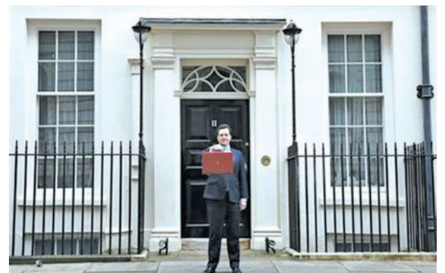
Britain's Chancellor of the Exchequer, George Osborne, holds up his budget case for the cameras as he stands outside number 11 Downing Street, before delivering his budget to the House of Commons, in central London on 20 March, 2013.

crisis, slipping into a second recession since then and now teetering on the verge of a third.