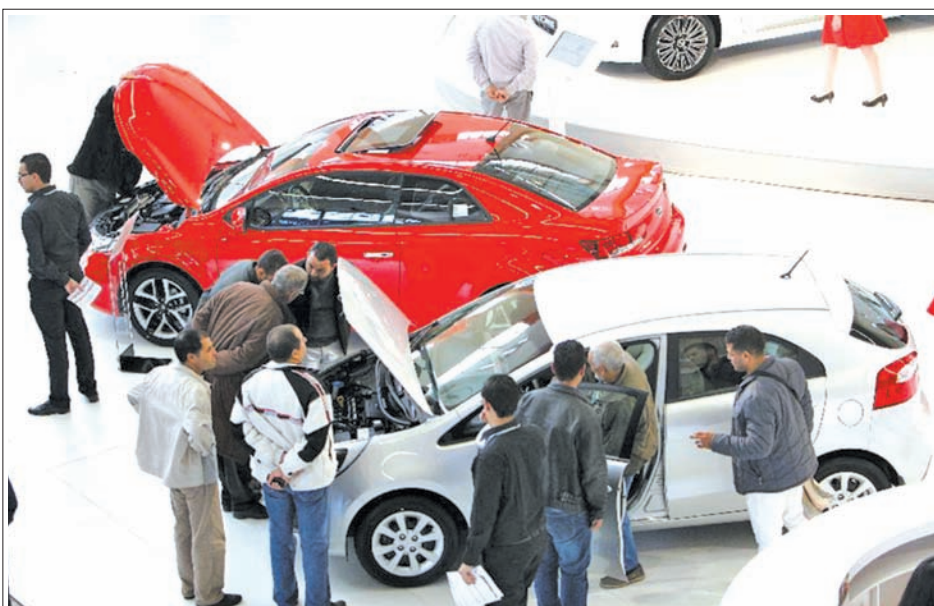
People visit the 16th International Automobile Fair of Algiers held in Algiers, Algeria, on 19 March, 2013. Thousands of Algerian car fans rushed to the 16th International Automobile Fair of Algiers, which started on Tuesday in the Exhibition Palace in Algiers with the participation of 53 exhibitors representing more than 38 worldwide car brands.