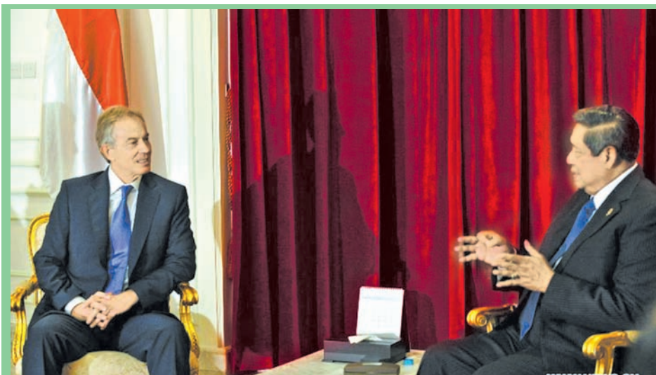
Indonesian President Susilo Bambang Yudhoyono (R) talks with visiting former British Prime Minister Tony Blair in Jakarta, Indonesia, on 20 March, 2013.