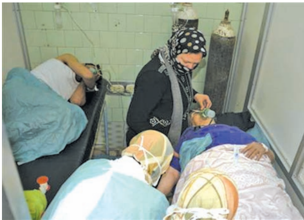
People injured in what the government said was a chemical weapons attack, breathe through oxygen masks as they are treated at a hospital in the Syrian city of Aleppo on 19 March, 2013.

But on Wednesday, Moscow’s line had softened. “There is no unequivocal