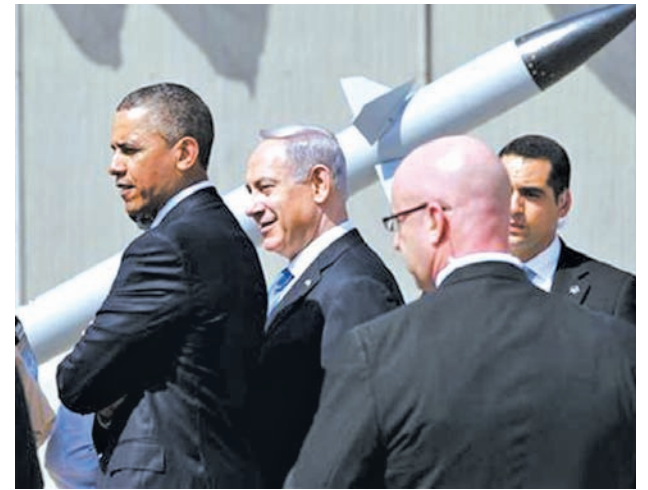
US President Barack Obama (L) and Israeli Prime Minister Benjamin Netanyahu view an Iron Dome missile defence battery at Ben Gurion International Airport in Tel Aviv on 20 March, 2013.

"If Iran decides to go for a nuclear weapon ... then it will only take them