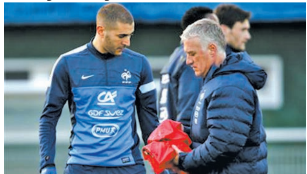
France's national team coach Didier Deschamps (R) passes by Karim Benzema (L) during a training session in Clairefontaine, near Paris, on 20 March, 2013.