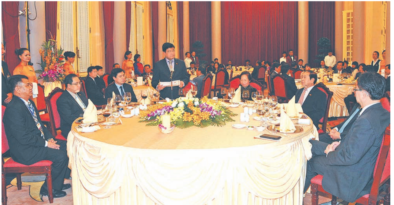
Vice-President U Nyan Tun and party seen at the dinner hosted by the Vice-President of Vietnam.