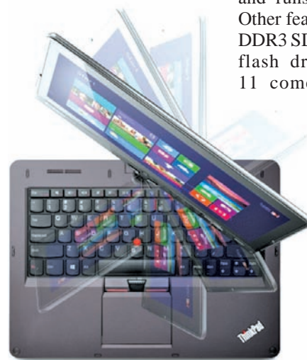
Lenovo ThinkPad. The company had launched two models—IdeaPad Yoga 13 and IdeaPad Yoga 11—in December 2012.

The device is powered by 3rd generation Intel Core i5-3317U 1.7GHz processor and runs on Windows 8. Other features include 4GB DDR3 SDRAM and 128GB flash drive. VAIO Duo 11 comes with built-in