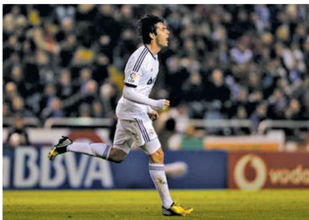
Real Madrid's Kaka celebrates his goal against Deportivo La Coruna during their Spanish First Division soccer match at the Riazor stadium in Coruna on 23 Feb, 2013.

again until last October when he performed impressively against Iraq and Japa. Scolari said Ronaldinho, whose gradual decline has been widely blamed on his partying lifestyle, would have another chance for forthcoming matches in April and May.