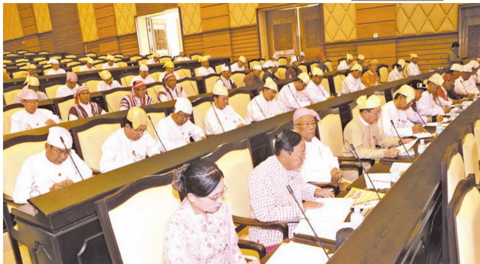
Amyotha Hluttaw representatives attend the today's session.

for categorizing the government's commitments, public petitions and complaints, and human rights cases according to their degree of immensity;