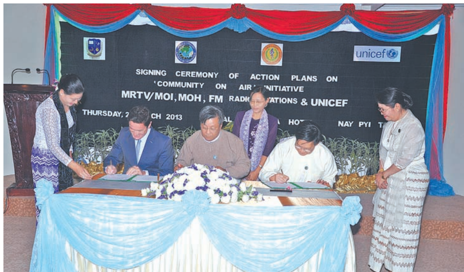
Agreement on action plans on community on air initiative signed among Myanmar Radio and Television under Ministry of Information, Ministry of Health, FM Radio Stations and UNICEF.