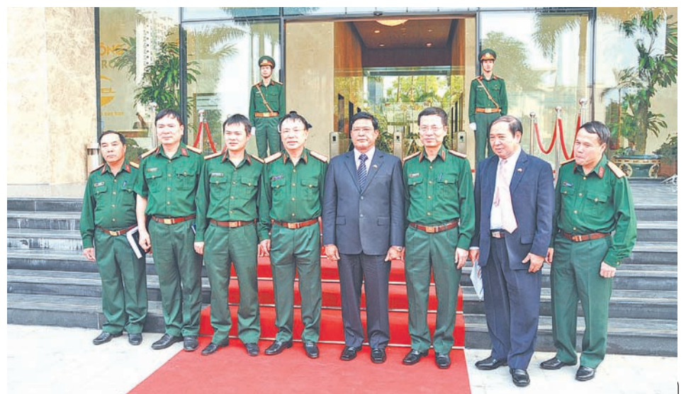
Vice-President U Nyan Tun and leaders of Viettel pose for documentary photo. (News on page 16)—MNA

Around 1 pm, a group that was dissatisfied with dispute gathered near the shop and some destroyed six shops, one religious building near the market and four