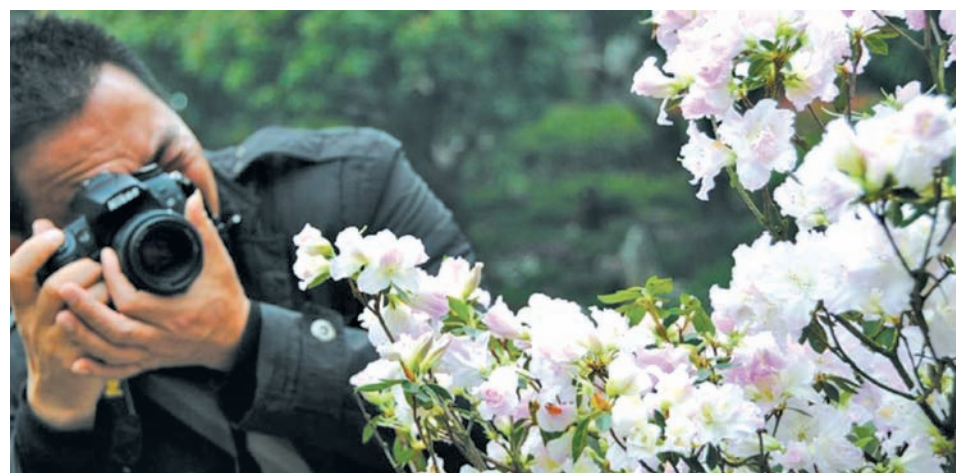
A visitor takes photos of azalea flowers at the first Fuzhou Azalea Cultural Festival in Fuzhou, capital of southeast China's Fujian Province, on 19 March, 2013.

Indonesia, an archipelago country, is homed by 129 active volcanoes.—Xinhua