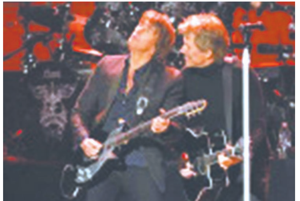
Jon Bon Jovi (R) performs with Richie Sambora during the "12-12-12" benefit concert for victims of Superstorm Sandy at Madison Square Garden in New York on 12 Dec 2012.

LOS ANGELES, 21 March— US rock band Bon Jovi beat British singer David Bowie to the top of the Billboard 200 album chart on Wednesday.