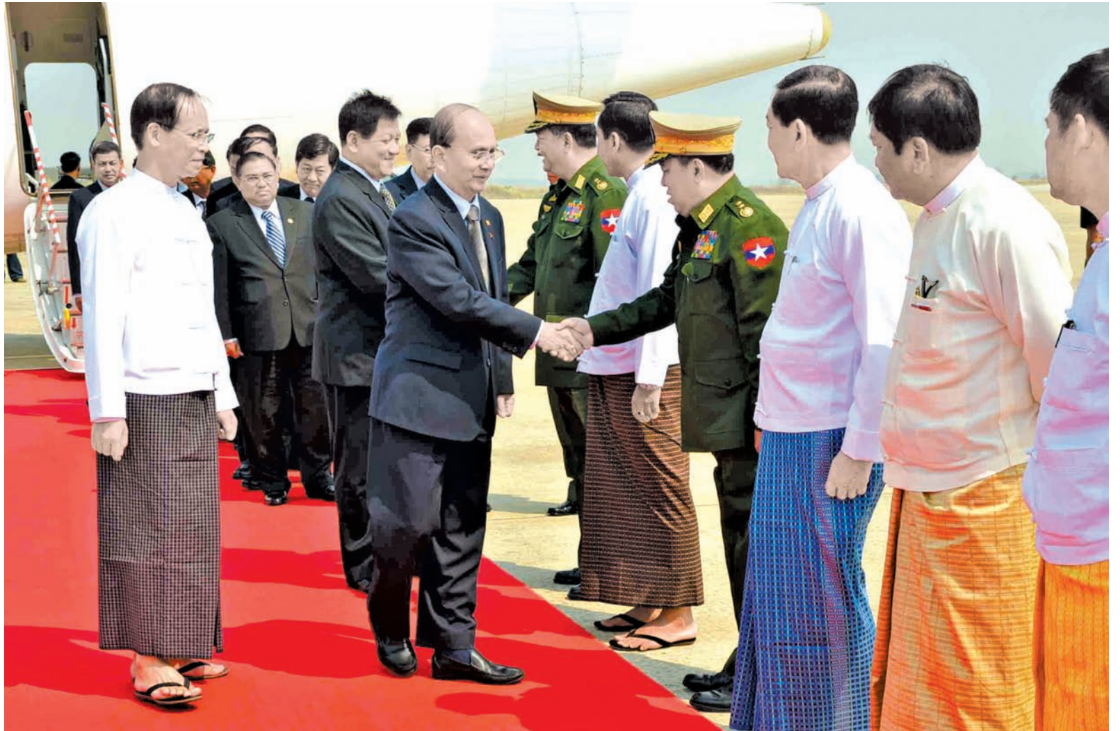
President U Thein Sein being welcomed back at Nay Pyi Taw Airport on his return from goodwill visits to New Zealand and Australia.—MNA