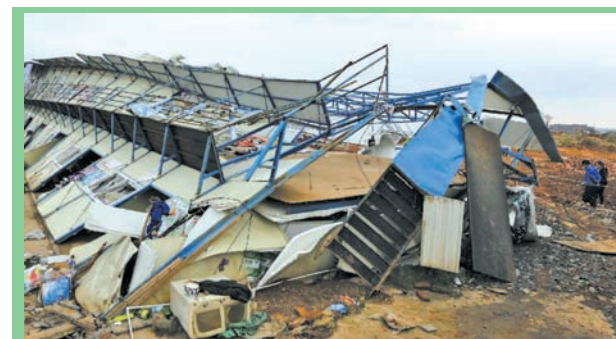
A collapsed shed is seen in Daoxian County, central China's Hunan Province, on 20 March, 2013. Three people were killed and 52 others were injured by a tornado that struck the county before dawn on Wednesday. The local meteorological observatory said the wind speed of the tornado reached 30.7 meters per second, a record for the observatory.