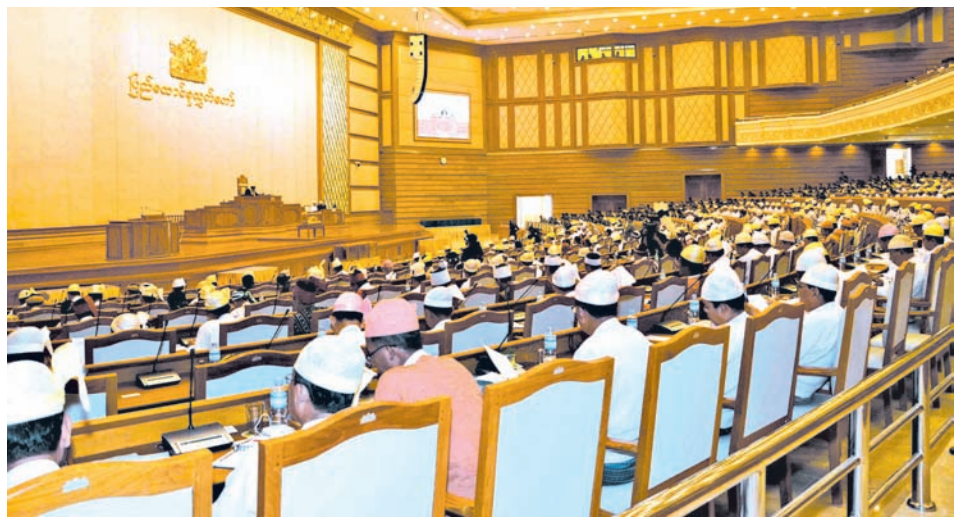
Hluttaw Representatives today seen at Pyidaungsu Hluttaw.

Six laws were approved and signed by the President