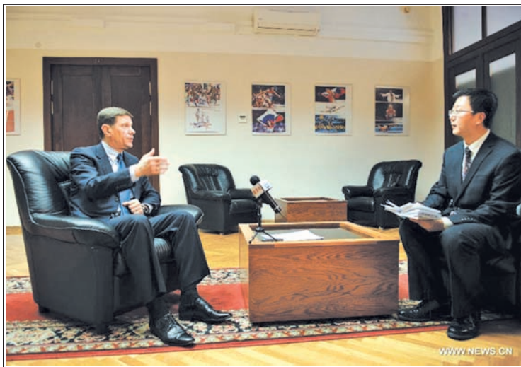
Russian Deputy Chairman of the State Duma Alexander Zhukov (L) receives an interview with Xinhua News Agency in Moscow, Russia, on 5 March, 2013, ahead of Chinese President Xi Jinping's upcoming visit to Russia.