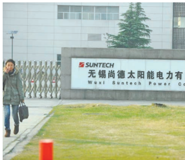
Photo taken on 17 March, 2013 shows a solar-panel-covered building at the Suntech Power headquarters in Wuxi, east China's Jiangsu Province. China's leading solar panel maker Suntech Power, a New York-listed private company based in Wuxi, declared bankruptcy on Wednesday.

The banks said since the outstanding loans have been overdue and the company did not render a feasible repayment programme,