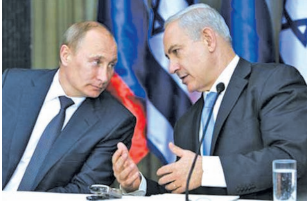
Russian President Vladimir Putin (L) listens to Israel's Prime Minister Benjamin Netanyahu as they speak after delivering their joint statements following their meeting in Jerusalem on 25 June, 2012.

JERUSALEM, 21 March—Russian President Vladimir Putin has invited Israeli Prime Minister Benjamin Netanyahu to visit Russia, an Israeli official said on Wednesday.