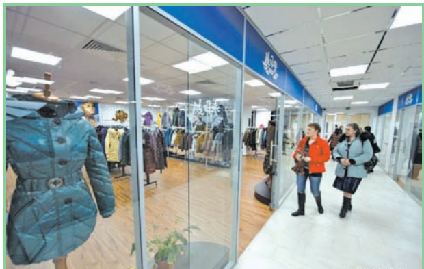
File photo taken on 28 Feb, 2012 shows Russians visiting a shop of a Chinese clothing brand at the Greenwood International Trade Centre in Moscow, Russia. The Greenwood International Trade Centre, a 350-million-US-dollar program financed by China Chengtong Development Group, started operation in Moscow in Sep 2011. The Greenwood covers an area of 200,000 square metres, with a total construction area of 132,600 square meters. The trade center, the largest Chinese investment project in the field of commerce in Russia, serves as a platform for Chinese products to enter the Russian market.—XINHUA

Xanana's visit to Jakarta also includes attending the Jakarta International Defence Dialogue 2013, said Natalegawa.—Xinhua