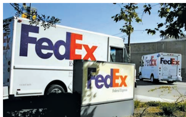
Federal Express trucks head out for deliveries from a FedEx station in Los Angeles, California.