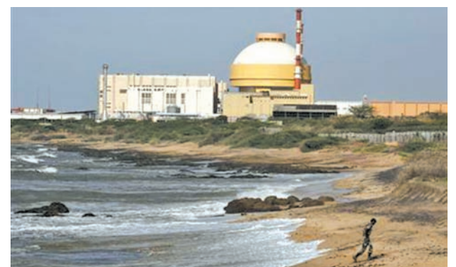
A policeman walks on a beach near Kudankulam nuclear power project in the southern Indian state of Tamil Nadu on 13 Sept, 2012.