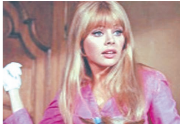
Britt Ekland starred in the 1974 Bond film The Man with the Golden Gun opposite Roger Moore.

LONDON, 21 March— Former Bond Girl Britt Ekland feels the current generation of female stars are very insecure. The 70-year-old, who starred in the 1974 Bond film The Man with the Golden