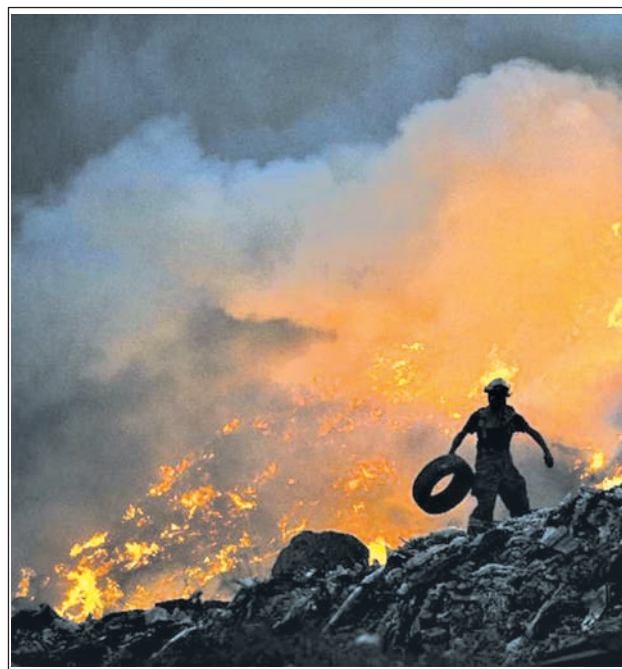
A firefighter tries to extinguish a fire at Petacon Hill's dump in Panama City, capital of Panama, on 19 March, 2013.

He added the new system will first take effect in several cities, including Port Fouad and Port Said. The government's move came amid protests of bakery owners against soaring flour prices induced by a previous change of the subsidy policy. The Ministry of Supply and Internal Trade recently stopped subsidizing flour and demanded designated bakeries hand in bread in exchange for flour supplies by the government, as a new way to provide cheap staple food for the poor.—Xinhua