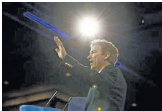
Senator Rand Paul of Kentucky gestures at the Conservative Political Action Conference (CPAC) at National Harbour, Maryland on 14 March, 2013.

Former Florida Governor Jeb Bush, the son of a president and brother to another, asked that his name be removed from consideration, citing the distance until the 2016 campaign will begin in earnest. He