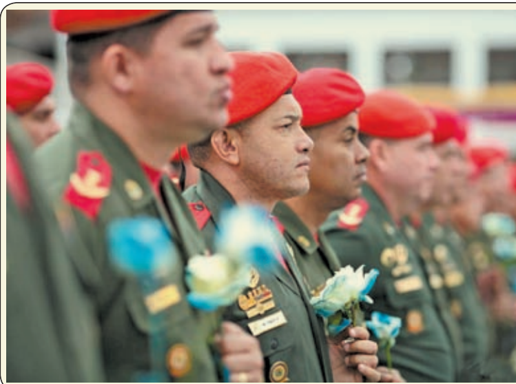
shows soldiers attending a ceremony commemorating the 14 years of the late Venezuelan President Hugo Chavez, in Caracas, capital of Venezuela, on 17 March, 2013.