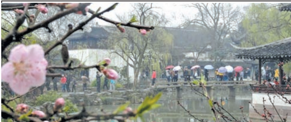
People enjoy early spring scenery in rain at Zhuozheng Garden (Humble Administrator's Garden) in Suzhou, east China's Jiangsu Province, on 17 March, 2013.

Oman would be in charge of the Iranian interests section in London while Sweden would represent the British interests in Teheran, Iranian Foreign Minister Ali-Akbar Salehi was quoted by Press TV as saying.—Xinhua