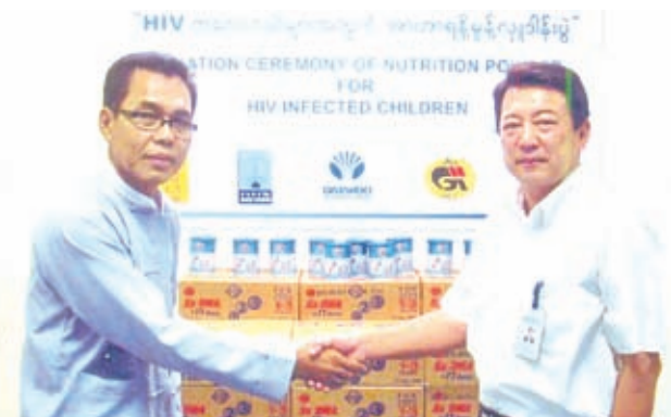
Photo shows a donation of nutrition powder for HIV infected children which was in progress at the Head Office of Daewoo Exploration and Production International Ltd recently. Boxes of nutrition powder worth K 35,016,300 were handed over to a responsible person of Special Hospital (Mingaladon).—KYEMON