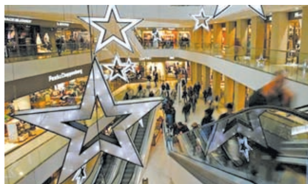
People walk through a shopping mall in the western Austrian city of Innsbruck on 20 Dec, 2012.

CANNES, 18 March— As growing numbers of shoppers move online, European mall owners are looking to pull in customers by including services that can't be replicated on the Web like hospital care and government offices.