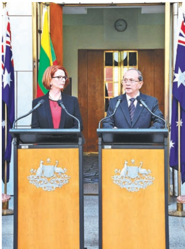
President U Thein Sein and Prime Minister of the Commonwealth of Australia Ms. Julia Gillard meet the press.