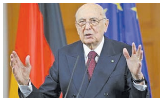
Italy's President Giorgio Napolitano gestures during a news conference following talks with German counterpart Joachim Gauck in Berlin on 28 Feb, 2013.