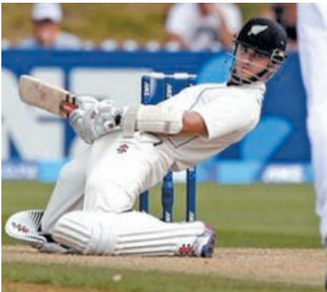
New Zealand's Kane Williamson looks up at England's Steven Finn (R) after he avoided being hit by a bouncer during the second day of the second test at the Basin Reserve in Wellington on 15 March, 2013.

The hosts were on 162 for two after the rain had disrupted