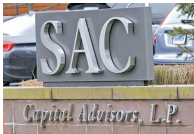
An exterior view of the headquarters of SAC Capital Advisors, LP in Stamford, Connecticut, in this picture taken on 13 Dec, 2010.

The settlements involves two subsidiaries of SAC: CR Intrinsic agreed