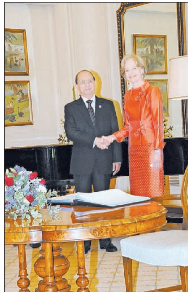
President U Thein Sein shakes hands with Governor-General of the Commonwealth of Australia Ms. Quentin Bryce ACCVO at the Government House in Canberra.