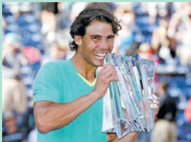
Rafael Nadal of Spain poses with his trophy after he defeated Juan Martin Del Potro of Argentina in the men's singles final match to win the BNP Paribas Open ATP tennis tournament in Indian Wells, California, on 17 March, 2013.

INDIAN WELLS, (California), 18 March—Rafa Nadal added another triumphant chapter to his remarkable comeback story by beating Juan Martin Del Potro in the BNP Paribas Open final on Sunday to win his third title of the year. The Spanish left-hander was sidelined for seven months last year with a left knee injury but has been in stunning form since he returned, reaching four straight finals and compiling a 17-1 record to start the year.