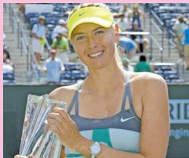
Maria Sharapova of Russia poses with a smaller replica trophy after defeating Caroline Wozniacki of Denmark in their women's singles final match at the BNP Paribas Open WTA tennis tournament in Indian Wells, California on 17 March, 2013.