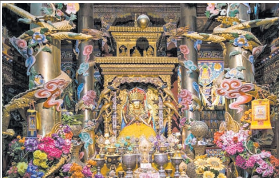
Photo taken on 17 March, 2013 shows the statue of the Four-Armed Avalokitesvara at the Guanyin Temple in Jinchuan County, Aba Tibetan Autonomous Region, southwest China's Sichuan Province. The temple was first built in the seventh century and hosts the shrine to the Four-Armed Avalokitesvara bodhisattva.