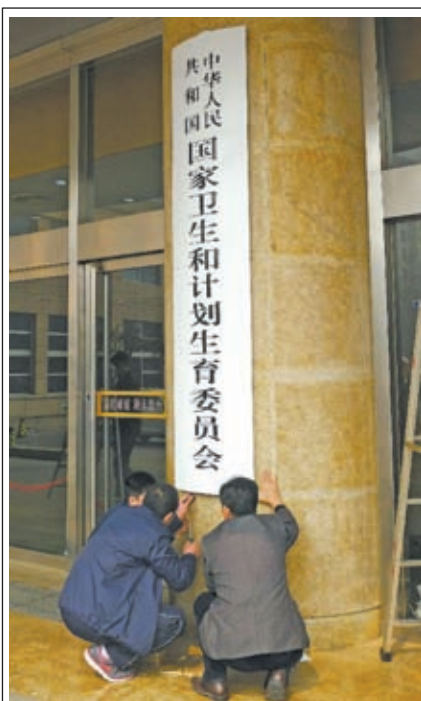
Workers install the name plaque of the National Health and Family Planning Commission in Beijing, capital of China, on 17 March, 2013. The newly-founded National Health and Family Planning Commission hung out its name plaque on Sunday morning, replacing the name plaque of the now-defunct Ministry of Health.