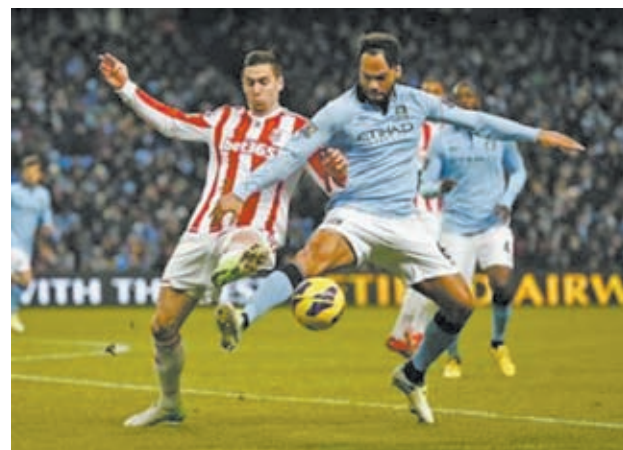
Manchester City's Joleon Lescott (R) is challenged by Stoke City's Geoff Cameron during their English Premier League soccer match at The Etihad stadium in Manchester, northern England, on 1 January, 2013.