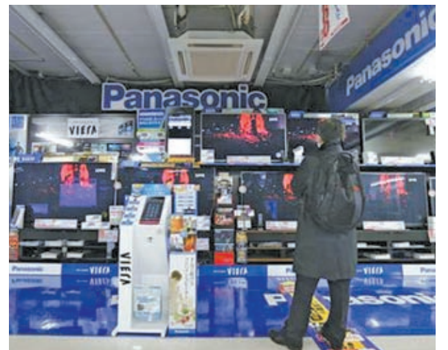
A man looks at Panasonic TV sets at an electronic shop in Tokyo on 22 Nov, 2012.

Panasonic's healthcare business involves electronic medical chart systems and blood-sugar monitoring devices. The company this month sold a central Tokyo building for around 50 billion yen to two Japanese investors, the third such sale in recent months.—Reuters