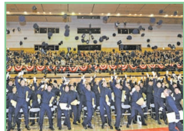
Graduating cadets toss their caps in the air during a commencement ceremony at Japan's National Defense Academy in Yokosuka, Kanagawa Prefecture, near Tokyo on 17 March, 2013.