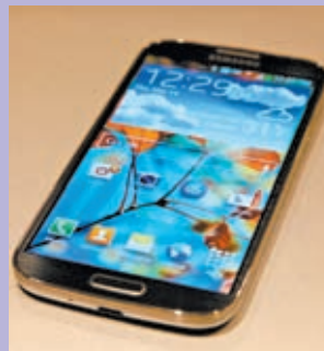
Samsung Galaxy S4

mail, contacts, calendars, documents, and more — and wirelessly pushes it to all your devices.