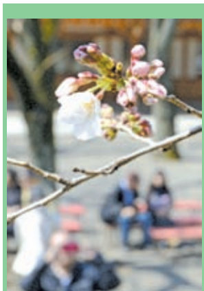
The someiyoshino variety of cherry blossoms begin to bloom at Yasukuni Shrine in Tokyo on 16 March, 2013.

The incumbent executive head, acting chief justice of Supreme Court and three ministers will be the members of the Council, which has the full authority of making new constitutional appointments.—Xinhua