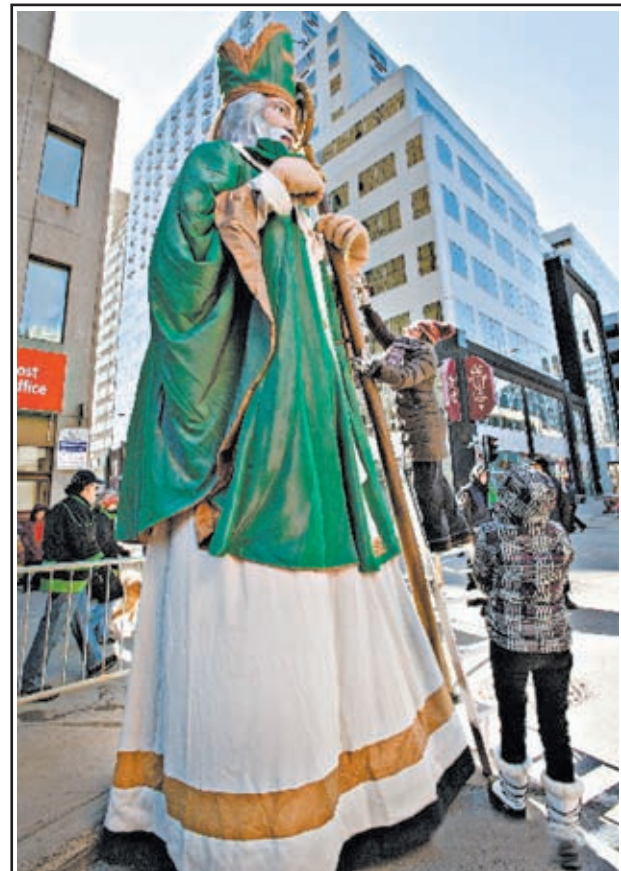
Staff put the finishing touches on the giant effigy of St Patrick a saint from Ireland who according to legend drove snakes away from Ireland.