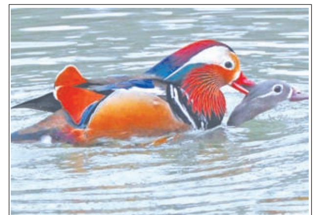
A pair of mandarin ducks play in a pond at Zhuozheng Garden (Humble Administrator's Garden) in Suzhou, east China's Jiangsu Province, on 17 March, 2013.

For the first time at the festival, visitors could try chocolate cocktails at a "research lab" and the usual show-cooking session was held, in which chocolates were used even in meat and fish recipes.—Xinhua