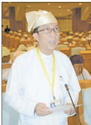
Union Minister for Finance and Revenue U Win Shein submits proposal.