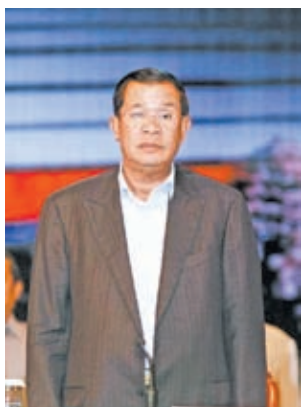
Cambodian Prime Minister and Cambodian People's Party (CPP) Vice President Hun Sen attends the closing ceremony of the party congress in Phnom Penh, Cambodia, on 17 March, 2013.

"The congress unanimously supports the candidacy of Hun Sen, CPP's Vice-President, as Prime Minister of Cambodia for the fifth legislative term of the