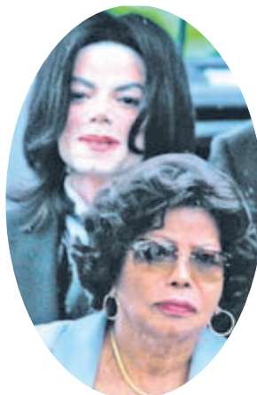
Singer Michael Jackson died after suffering a cardiac arrest on 25 June, 2009. Seen here, with his mother Katherine Jackson, in a file photo.

she could beaver away on new music without having to worry."