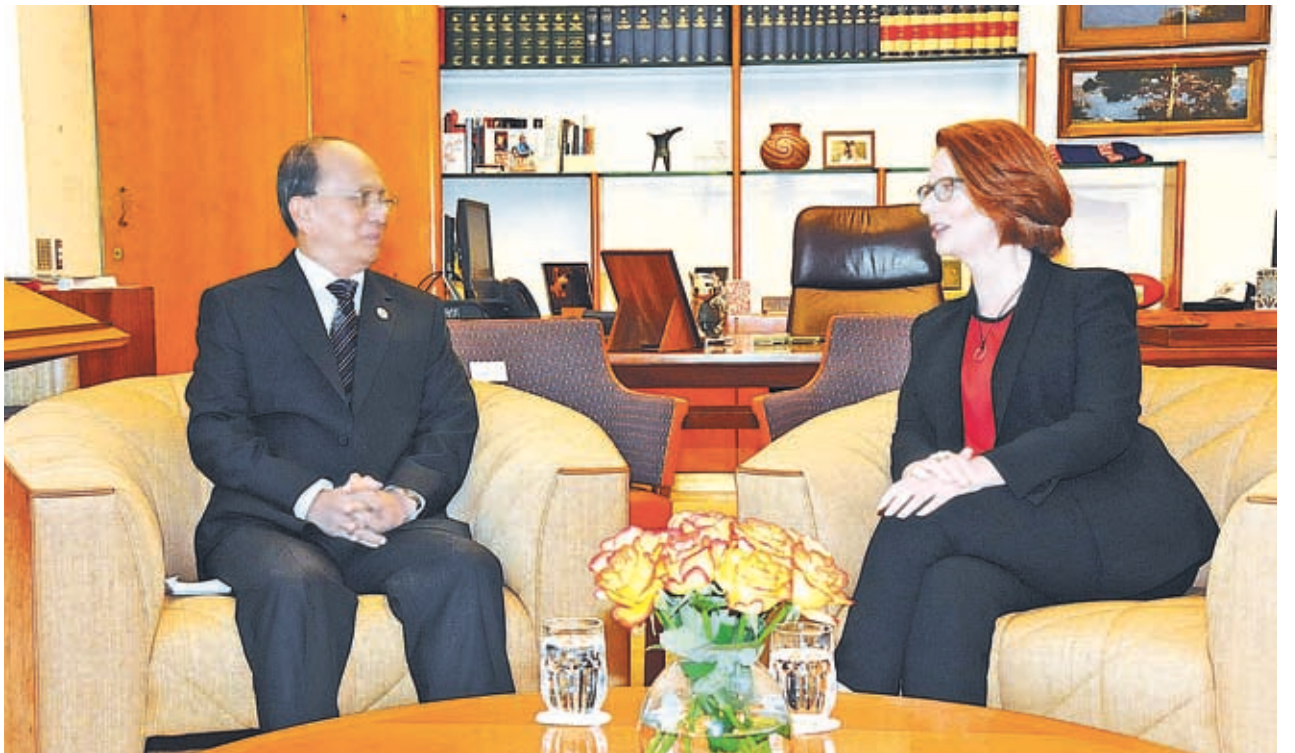
President U Thein Sein holds talks on further bilateral cooperation with Prime Minister of the Commonwealth of Australia Ms. Julia Gillard at the Prime Minister Office inside Parliament Building in Canberra.—MNA

The Australian PM said that the President's visit to Australia reflected Myanmar reform processes