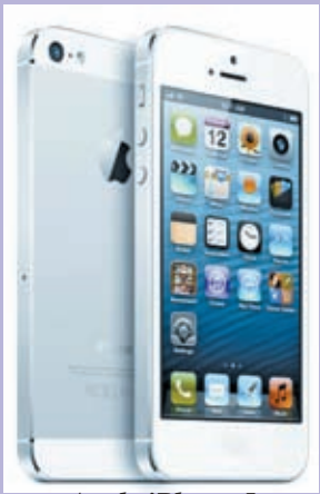
Apple iPhone 5

NEW DELHI, 18 March— After Samsung unveiled its new flagship smartphone, Galaxy S4, Apple released a webpage explaining why the iPhone 5 is better than smartphones from its rivals. The webpage's banner says, "There's iPhone. And then there's everything else."