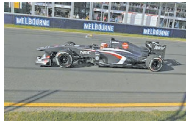
Sauber Formula One driver Nico Hulkenberg of Germany drives during the second practice session of the Australian F1 Grand Prix at the Albert Park circuit in Melbourne on 15 March, 2013.—REUTERS

The race starts at 5:00 pm local time (0600 GMT).—Reuters