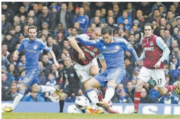
Eden Hazard (17) of Chelsea shoots to score against West Ham during their English Premier League soccer match at Stamford Bridge in London, on 17 March, 2013.

The Canaries battled for more than an hour for their point after they were reduced