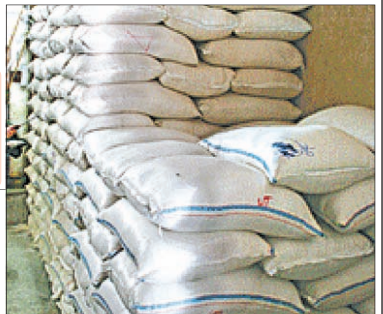
Photo shows bags of rice being kept at warehouse before exporting them.