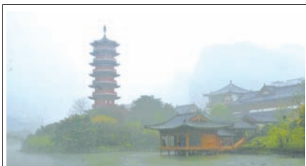
Photo taken on 17 March, 2013 shows a pagoda in light fog in Guilin, southwest China's Guangxi Zhuang Autonomous Region. Guilin, a famous tourist resort, boasts of numerous cultural relics and various Karst land features.