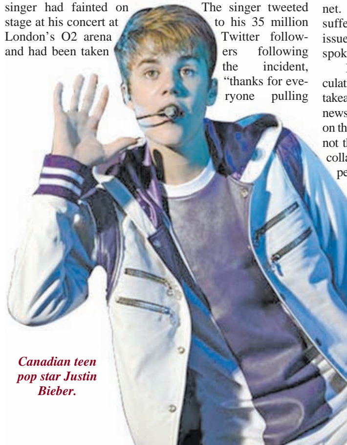
Canadian teen pop star Justin Bieber.