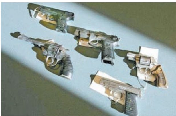
Recently-seized handguns are displayed at the Boston police headquarters in Boston, Massachusetts on 7 Dec, 2005.

Based on data from 2007 through 2010, the study looked at the