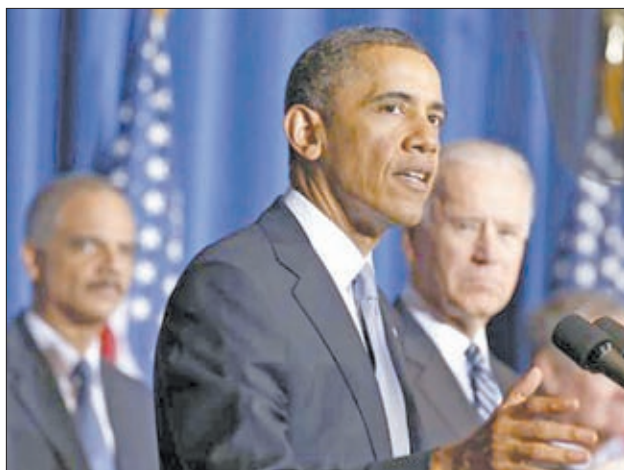
US President Barack Obama speaks before he signs the Violence Against Women Act while at the Department of Interior in Washington, on 7 March, 2013.

WASHINGTON, 8 March—President Barack Obama's abrupt shift to a schmooze offensive—dining and visiting with Republican lawmakers—reflects a need for some resolution in the budget wars so he can move on