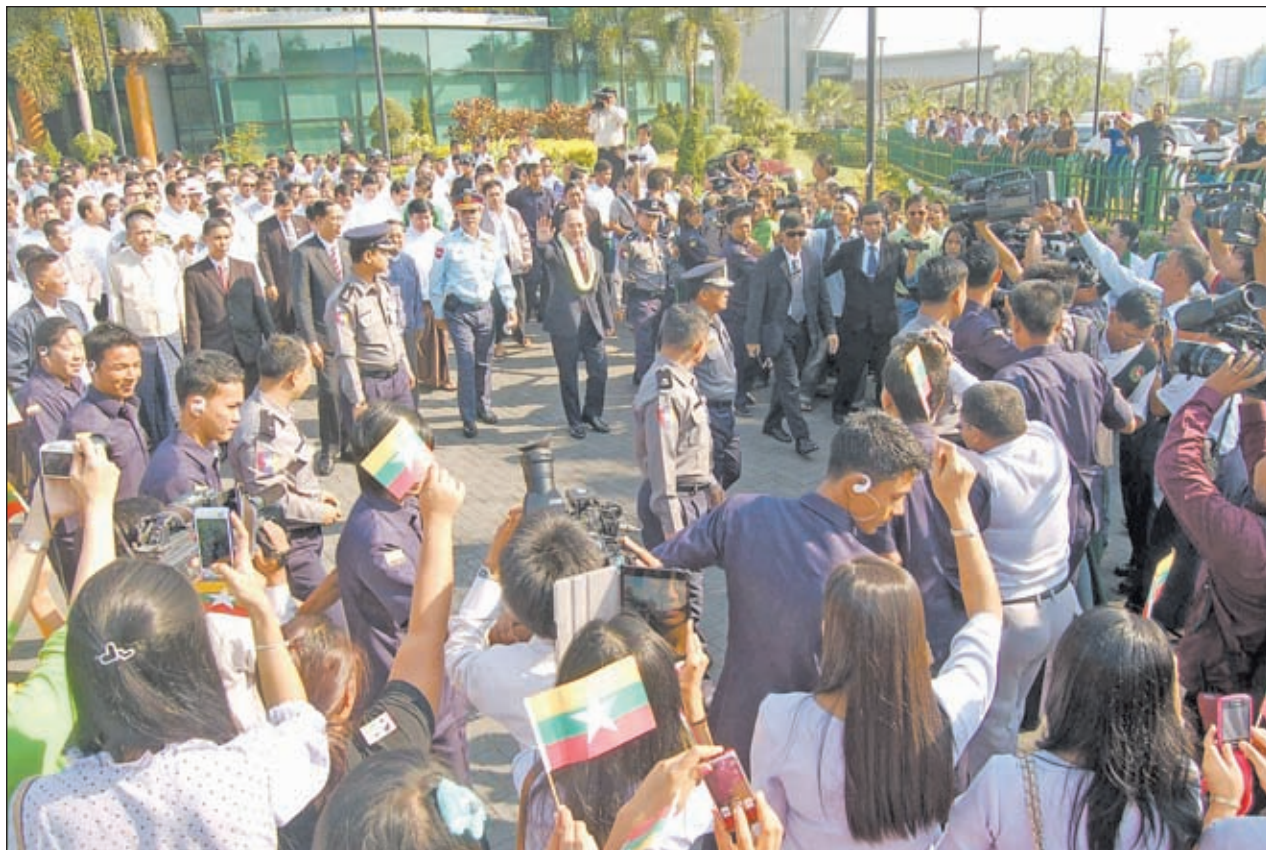
President U Thein Sein being welcomed back by local people and social organization members at Yangon International Airport. (News on page 1)