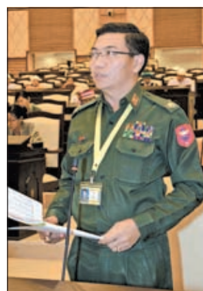
Deputy Home Affairs Minister Brig-Gen Kyaw Zan Myint making clarification.

Constituency No(5) proposed the Union government to provide free medical service to the poor as part of poverty alleviation scheme amidst the increasing number of health projects in country. U Nyunt Hlaing of Ayeyawady Region Constituency No