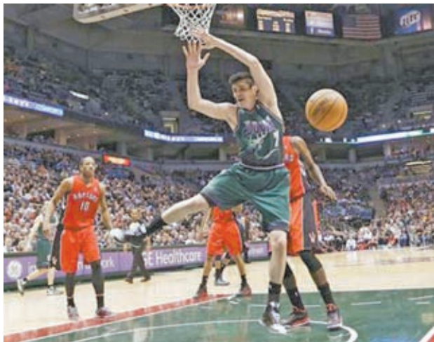
Milwaukee Bucks forward Ersan Ilyasova loses the ball as he drives to the basket against the Toronto Raptors during the second half of their NBA basketball game in Milwaukee, Wisconsin on 2 March, 2013.

in both departments. On some nights, the 6-foot-10 (2.08m) Ilyasova resembles a Turkish Dirk Nowitzki, with his high-arching jumper appearing as endless as his potential. There are also