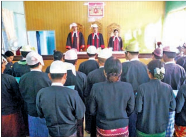
SITTWAY, 8 March — An oath-taking ceremony of judges and judicial officials in Rakhine State took place at