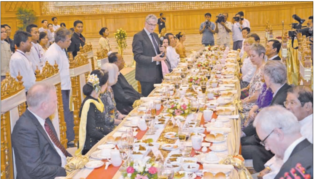
Speaker of Danish Parliament Mr. Mogens Lykketoft extends greetings at the luncheon hosted by Pyithu Hluttaw Speaker Thura U Shwe Mann.

Afterwards, representatives of the respective working groups presented challenges and gaps needed to be remedial,