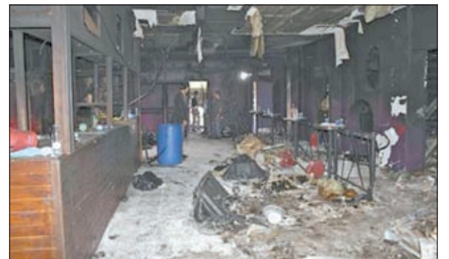
People inspect the Boate Kiss nightclub in the southern city of Santa Maria, 187 miles (301 km) west of the state capital Porto Alegre in this handout released by the Policia Civil (Civil Police) on 29 Jan, 2013.

tim, but cautioned the medicine would not deal with other toxins they inhaled while trying to flee the party through a single exit in the wealthy university town of Santa Maria.