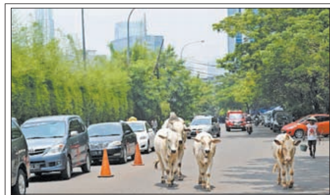
A group of cattle pass a downtown street at Kuningan in Jakarta, Indonesia, on 7 March, 2013. Government is planning to develop cattle centres to accommodate the hundreds of thousands of cows in Indonesia, with an aim to maintain national beef prices.

Firemen took over four hours to douse the flames, he said, adding that a probe has been ordered. Mumbai houses a number of slums though it is the country's financial capital.—Xinhua