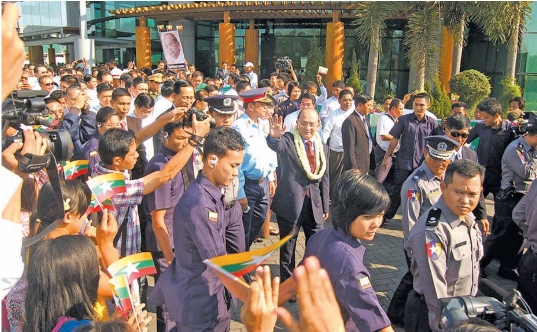
President of the Republic of the Union of Myanmar U Thein Sein being warmly welcomed back by people at Yangon International Airport. MNA

NAY PYI TAW, 8 March—President of the Republic of the Union of Myanmar U Thein Sein arrived back here by special aircraft at 8:45 pm today