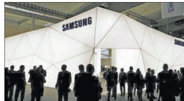
Visitors are seen in front of the Samsung stand during the Mobile World Congress at Barcelona, on 27 Feb, 2013.

LONDON, 8 March— Apple won a patent infringement lawsuit on Thursday in an English court, which exonerates the iPhone maker from charges it unlawfully used Samsung technology.