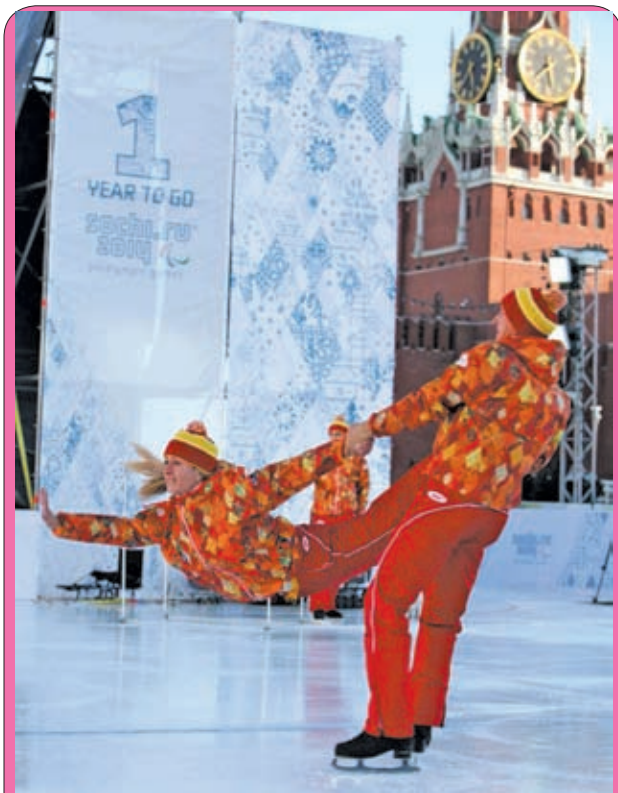
Skaters perform during the celebration for the countdown of 1 year to go until the first Paralympic Winter Games in the history of the country in Moscow, Russia, on 7 March, 2013. The Games will be held in Sochi on 7-16 March, 2014.

MIAMI, 8 March—Looking confident and in control, Tiger Woods shot an impressive six-under-par 66 for a share of the lead in the first round of the WGC-Cadillac Championship as world number one Rory McIlroy struggled again on Thursday. Woods was perched atop the leaderboard with Sweden's Freddie Jacobson, Spain's Sergio Garcia, Northern Ireland's Graeme McDowell and American Bubba Watson, the defending Masters champion. Phil Mickelson was one of four players a stroke behind the leaders as the elite field took advantage of easy scoring conditions.