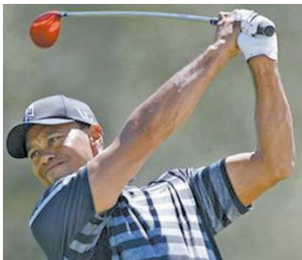
Tiger Woods of the US hits from the 12th fairway during first round play in the 2013 WGC-Cadillac Championship PGA golf tournament in Doral, Florida on 7 March, 2013.

The Blue Monster course at Doral was once considered a beast but has become a toothless resort course over the years, tamed by equipment changes as players deal comfort-