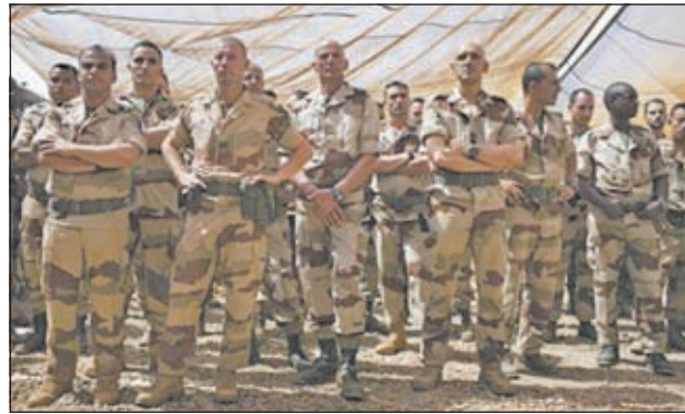
Soldiers listen to France's Defence Minister Jean-Yves Le Drian (not pictured) speak at a French military encampment at a Malian air base in Gao on 7 March, 2013.—REUTERS

GAO, 8 March—France will only hand over to African troops in Mali when security is restored, French Defence Minister Jean-Yves Le Drian told his forces during a surprise visit to the rugged north of the country where they are battling Islamist rebels. Reviewing the ranks of French soldiers in the dusty Adrar des Ifoghas mountains, Le Drian paid homage to the courage of troops engaged in fierce fire-fights with al Qaeda militants in the