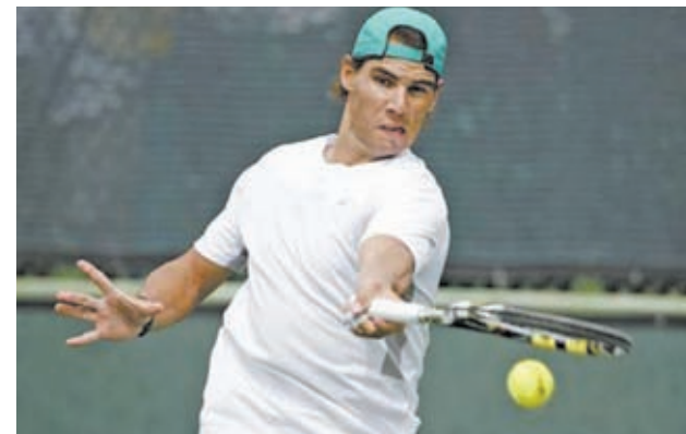
Rafael Nadal of Spain hits the ball during a practice session at the BNP Paribas Open ATP tennis tournament in Indian Wells, California, on 7 March, 2013.

INDIAN WELLS, (California), 8 March—Buoyant after a successful tournament run on clay in recent weeks, Rafa Nadal knows he will face the toughest test of his injury comeback at the BNP Paribas Open starting on Thursday. Following a shock second-round exit at Wimbledon last year, the Spanish left-hander was sidelined for seven months by a left knee injury and he now returns to the hard courts of Indian Wells, a surface where his all-action, fist-pumping game has always been most vulnerable. "I am just here to try my best," world number five Nadal told reporters after practicing on one of the outside courts at the Indian Wells Tennis Garden. "We will see how the knee answers on hard."