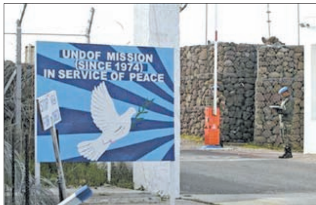
Indian United Nations peacekeepers stand at the gate to a UN base near the Kuneitra border crossing between Israel and Syria, in the Israeli occupied Golan Heights on 7 March, 2013.