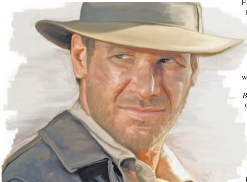
US actor Harrison Ford.

Thursday. The source, who spoke on condition of anonymity, said lawyers had the contracts for all three actors and that an announcement would be made soon. Representatives for Ford, who played Han Solo in the first three