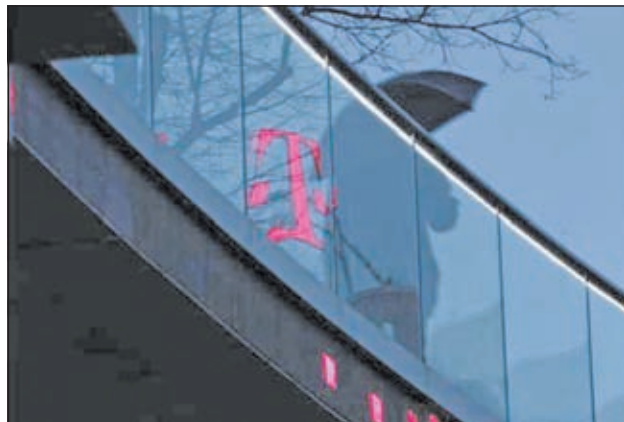
A man walks past the logo of Deutsche Telekom AG that is reflected on glass at their headquarters, in this file photo taken in Bonn on 5 Dec, 2012.