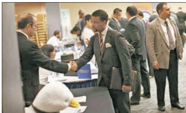
A job seeker (R) meets with a prospective employer at a career fair in New York City, on 24 Oct, 2012.