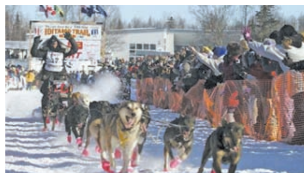
Defending Iditarod Champion Lance Mackey runs his team up the starting chute of the official start of Iditarod Trail Sled Dog Race in Willow, Alaska, on 6 March, 2011.

ANCHORAGE, (Alaska), 8 March—A four-time champion of Alaska's Iditarod Trail Sled Dog Race was first to reach the halfway point at a one-time gold mining settlement for which the wilderness trail is named, before quickly losing his nominal lead to another musher, race officials said on Thursday. Lance Mackey, the only musher to win the 1,000-