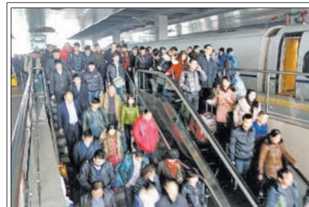
Passengers queue to leave the platform at the Tianjin Railway Station in Tianjin, north China, on 6 March, 2013. China's 40-day travel period covering the Spring Festival ended 7 March with a record high of 3.42 billion trips being made by using public transport, according to the Ministry of Transport. The country's railways saw a total of 240 million trips, up from about 220 million in the same period last year, the railways authority said.

reans to retain or acquire a second citizenship is unlikely to enhance that commitment but could dilute it," he said. Singapore, a city state of ethnic diversity, has a total population of 5.31 million as of 2012, including 3.29 million citizens and 0.53 million permanent residents, or foreigners granted permanent long-term residency in Singapore. The rest are foreigners working, living or receiving education in Singapore.—Xinhua