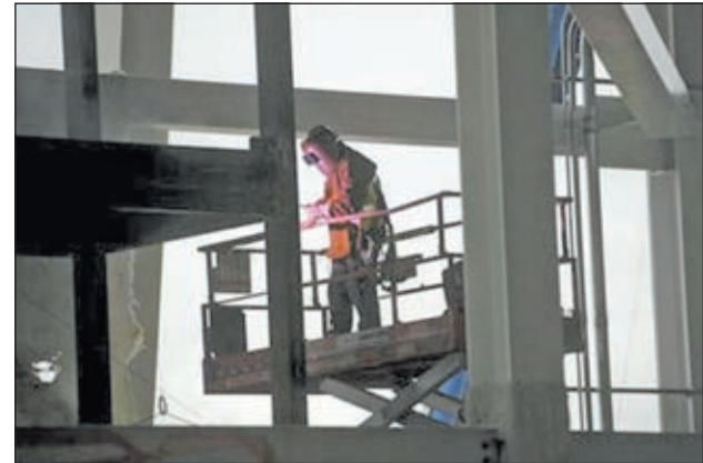
A worker welds a support at Santa Clara Stadium, the future home of the NFL's San Francisco 49'ers, in Santa Clara, California on 6 March, 2013. The stadium is scheduled to open in time for the 2014 NFL season.

Thai Beverage is controlled by Thai tycoon Charoen Sirivadhanabhakdi,