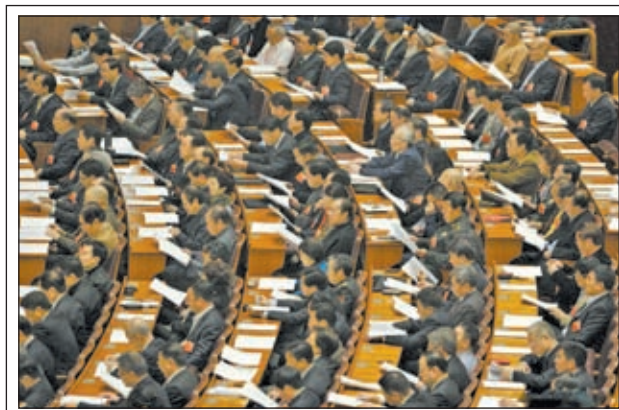
Members of the 12th National Committee of the Chinese People's Political Consultative Conference (CPPCC) listen at the third plenary meeting of the first session of the 12th CPPCC National Committee at the Great Hall of the People in Beijing, capital of China, on 8 March, 2013.

Responding to questions at weekly press briefing the spokesman said that no talks are yet scheduled