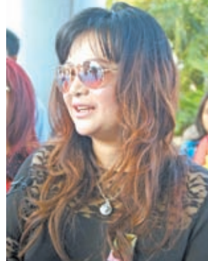
Actress Htet Htet Moe Oo.

I think that President's tour has achieved considerable success. But I don't know