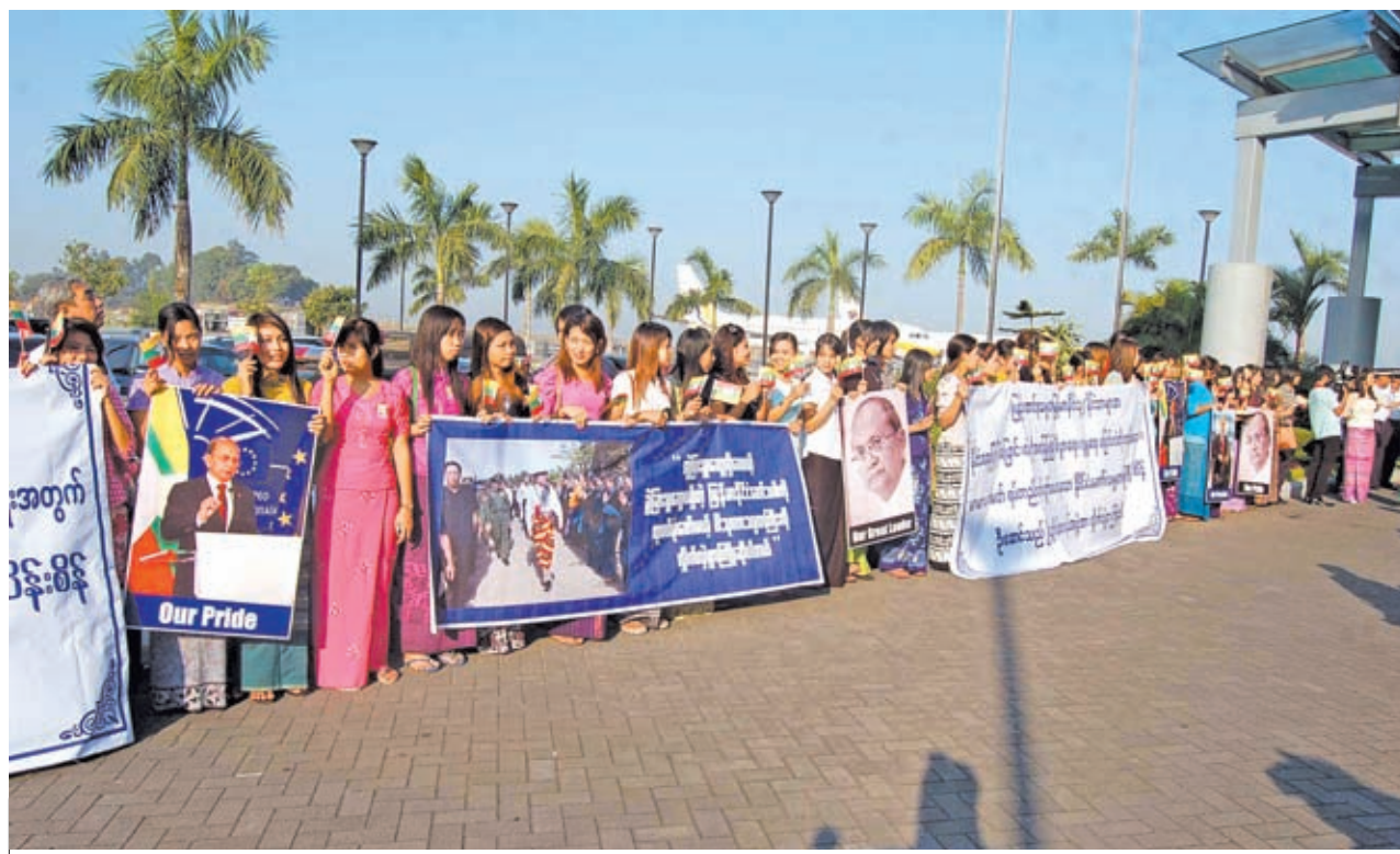
People waiting to welcome President of the Republic of the Union of Myanmar U Thein Sein at Yangon International Airport.—MNA