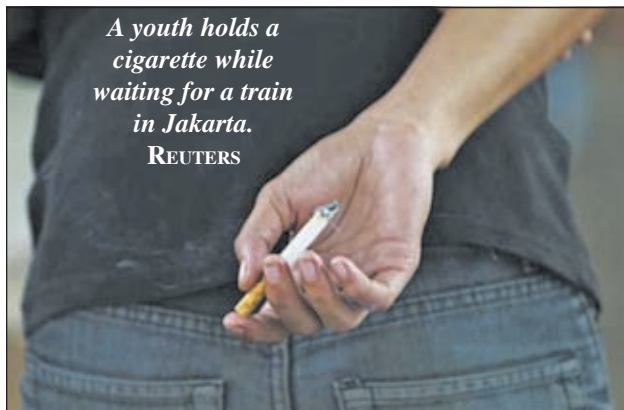
A youth holds a cigarette while waiting for a train in Jakarta.

LONDON, 8 March—Fighting the tobacco industry's tactics in the world's poorest countries and ensuring the best vaccines get to those most in need are key to cutting the number of cancer deaths worldwide, according to a report by specialists in the disease.