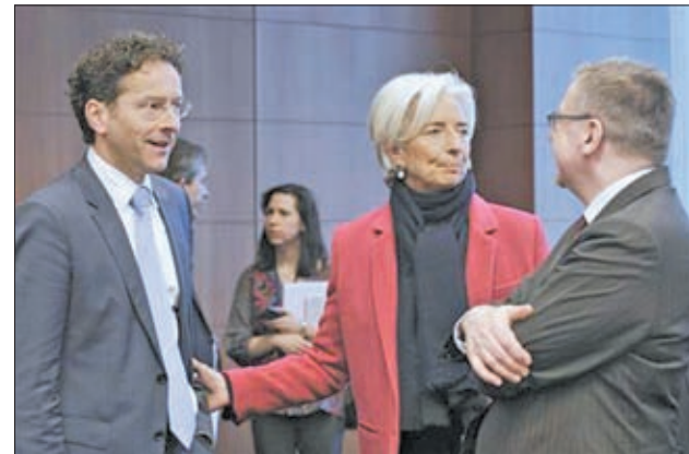
Netherlands' Finance Minister and Eurogroup Chairman Jeroen Dijsselbloem (L), with International Monetary Fund (IMF) Managing Director Christine Lagarde and Belgium's Finance Minister Steven Vanackere (R) attend a euro zone finance ministers meeting at the European Union Council in Brussels on 4 March, 2013.

European Union finance ministers sought advice on Tuesday on how to help the countries demonstrate the success of their bailout programmes by returning to