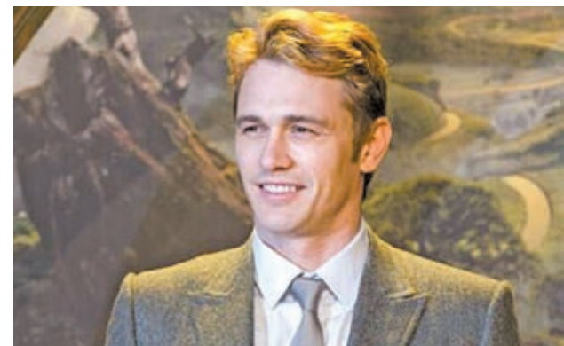
Actor James Franco poses for photographers at the European premier of Oz: The Great and Powerful in London on 28 Feb, 2013.

LONDON, 8 March— Actor James Franco, lauded for his serious roles and forays into art, was almost too earnest to land the lead in the big screen 3D adventure film “Oz the Great and Powerful,” which opens on Friday ahead of the summer blockbuster season. Filmmaker Sam Raimi, who directed Franco in the “Spider-Man” trilogy from 2002 to 2007, said he initially considered other heavyweight actors such as Johnny Depp and Robert Downey Jr for the lead role in Disney’s big-budget unofficial prequel to the 1939 classic “The Wizard of Oz.” Both Depp and Downey have already spearheaded two juggernaut Disney blockbuster franchises, with Depp as raucous Captain Jack Sparrow in “Pirates of the Caribbean” and Downey as the main character in “Iron Man.” Franco has not carried a blockbuster film alone, but Raimi told Reuters the 34-year-old actor’s maturation would enable him to do so in “Oz,” in which he plays the charming, morally dubious circus magician who cons others on and off stage.—Reuters