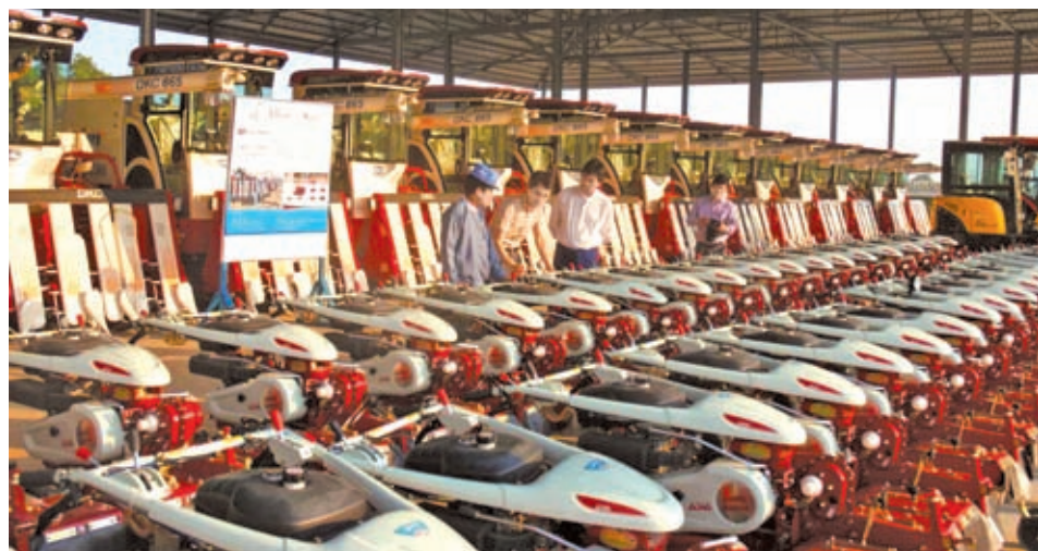
Union A&I Minister U Myint Hlaing views rice milling equipment.—MNA

The Union Minister visited the temporary warehouse in which Japan-made rice milling equipment are being kept.—MNA