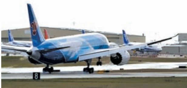
The Boeing 787 lands in Everett, Washington travelling with crew only from Fort Worth, Texas on 7 Feb, 2013.

"Boeing are still building up the 787 and at the moment they are still taking products for it but I guess when the car park is full that