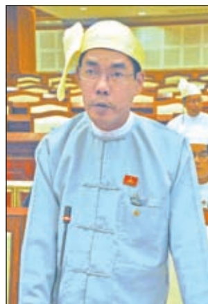
Hluttaw Representative U Aung Zin from Pazundaung Constituency raising queries.

provide low-interest loans to farmers against the security of their farms as farmers currently are only allowed to take out loans at the State-recognized banks while the procedures are complicated and there are no such banks opened near