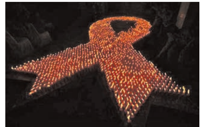
About 2880 candles are seen lit during a World AIDS Day event in Jakarta on 1 Dec, 2009.