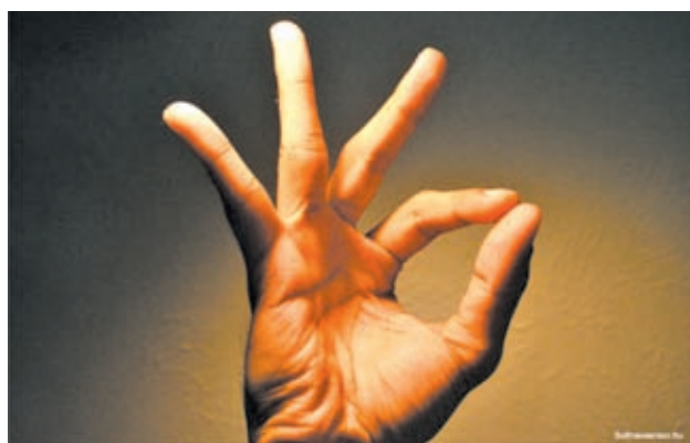
When the wearer of the gloves draws letters in the air with their hand, the system can identify which letters are being drawn.—PTI

The system then identifies which letters are being drawn and converts them into digital text, which can then be wirelessly entered into an email, text message or other mobile apps. Once