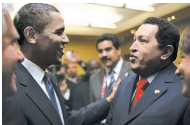
US President Barack Obama (L) greets his Venezuelan counterpart Hugo Chavez before the opening ceremony of the 5th Summit of the Americas in Port of Spain in this 17 April, 2009 file photo.

WASHINGTON, 6 March — President Barack Obama on Tuesday said the United States is interested in starting a new relationship with Venezuela after