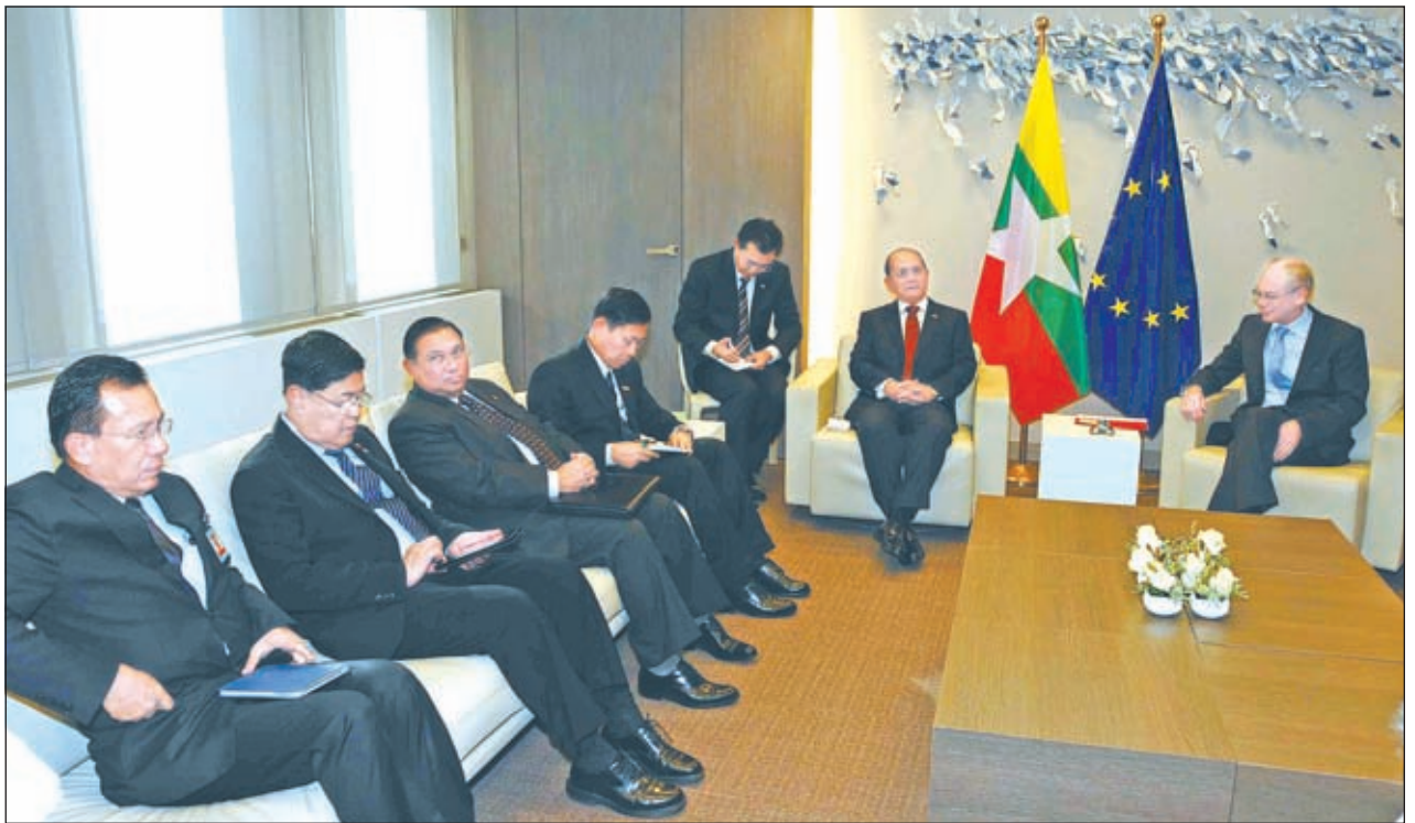
President U Thein Sein meets President of European Council Mr Herman Van Rompuy at the office of the European Council.—MNA

At 6.15 pm, the President received Deputy Prime Minister and Minister