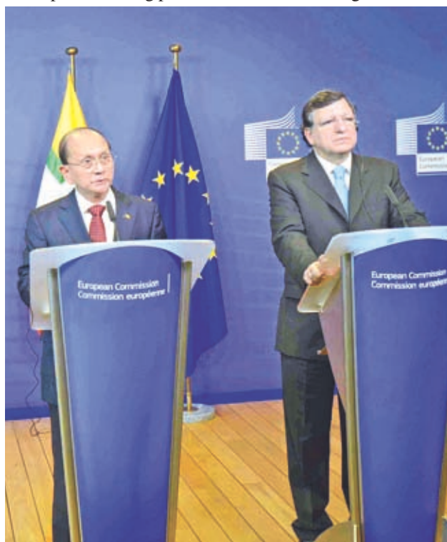
President U Thein Sein holds press conference.

We are thankful for the relaxation of sanctions and the increase in development cooperation. But we should say already that we have no desire to become an aid-dependent country, with tremendous natural resources, and that our economy must learn to harness these resources in the interest of all its peoples, whilst also creating the level playing field that will allow entrepreneurship to thrive and businesses, especially small and medium businesses to grow. We need help now, during this transition, help with healthcare, education and livelihoods, targeted to the poorest, help in training and retraining our people, and help in building the infrastructure we need urgently to turn our economy around. We need help now, but, we hope for in future is cooperation, trade and investment that will help all our economies.