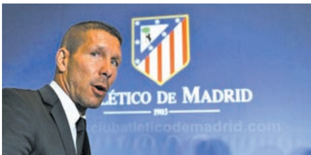
Atletico Madrid coach Diego Simeone

MADRID, 6 March— Atletico Madrid have announced an agreement to extend the contract of coach, Diego Simeone for a further four seasons. The Argentinean, whose current deal was due to expire at the end