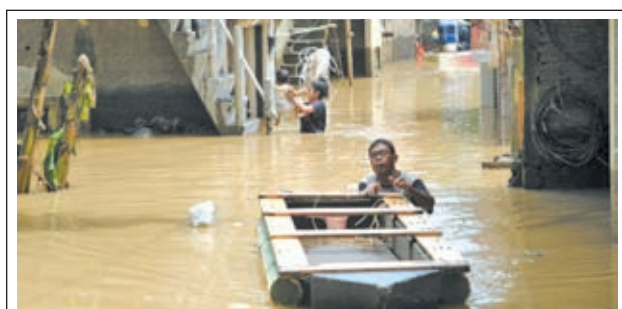
A man walks through a flooded area with a boat in Cawang, East Jakarta, Indonesia, on 5 March, 2013. The National Disaster Mitigation Agency (BNPB) on Tuesday warned that Jakarta could experience another big flood this week, as many areas in the city have already been swamped after the water level at Bogor's Katulampa dam reached 250 centimetres on Monday.

The premier said that China is the only developing country among the permanent members of the United Nations Security Council, and China has provided the importance for the weak voice of developing countries.—Xinhua