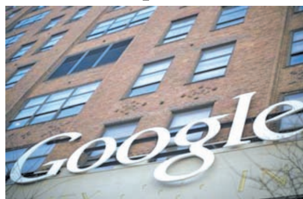
The Google signage is seen at the company's headquarters in New York on 8 Jan, 2013.

Analysts said the white paper, which lauded Chi-