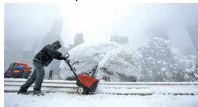
A worker uses a snow blower to clean the steps in front of the Cloud Gate Sculpture, also known as “The Bean” during snow in Chicago on 5 March, 2013.

Southwest Airlines, which cancelled nearly 250 flights out of Chicago’s Midway Airport, resumed flight operations at 6 pm on Tuesday, the city aviation department said. But delays of an hour or more were common.—Reuters