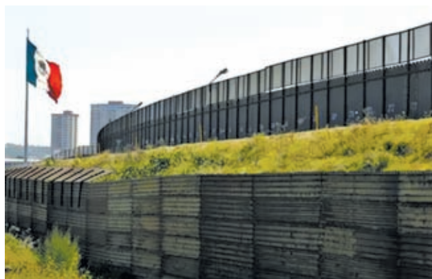
A Mexican flag flies over the border fence between Tijuana, Mexico and San Ysidro, California, on 1 March, 2013.