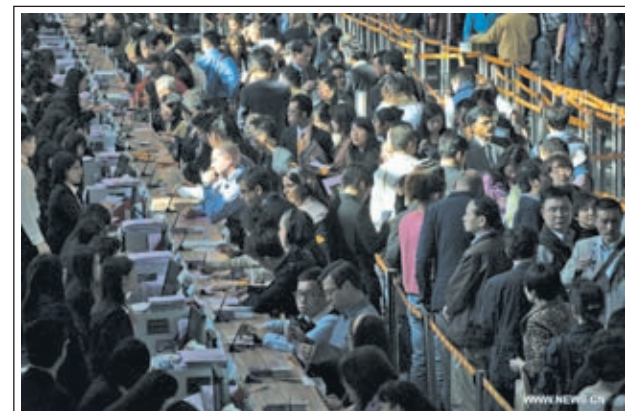
Visitors wait to enter the 30th Hong Kong International Jewellery Show in Hong Kong, south China, on 5 March, 2013. The jewellery show held by Hong Kong Trade Development Council kicked off on Tuesday. More than 3,300 jewelers from 49 countries and regions attended the show.

The epicentre, with a depth of 31.60 km, was initially determined to be at 27.6324 degrees north latitude and 128.2323 degrees east longitude.—Xinhua