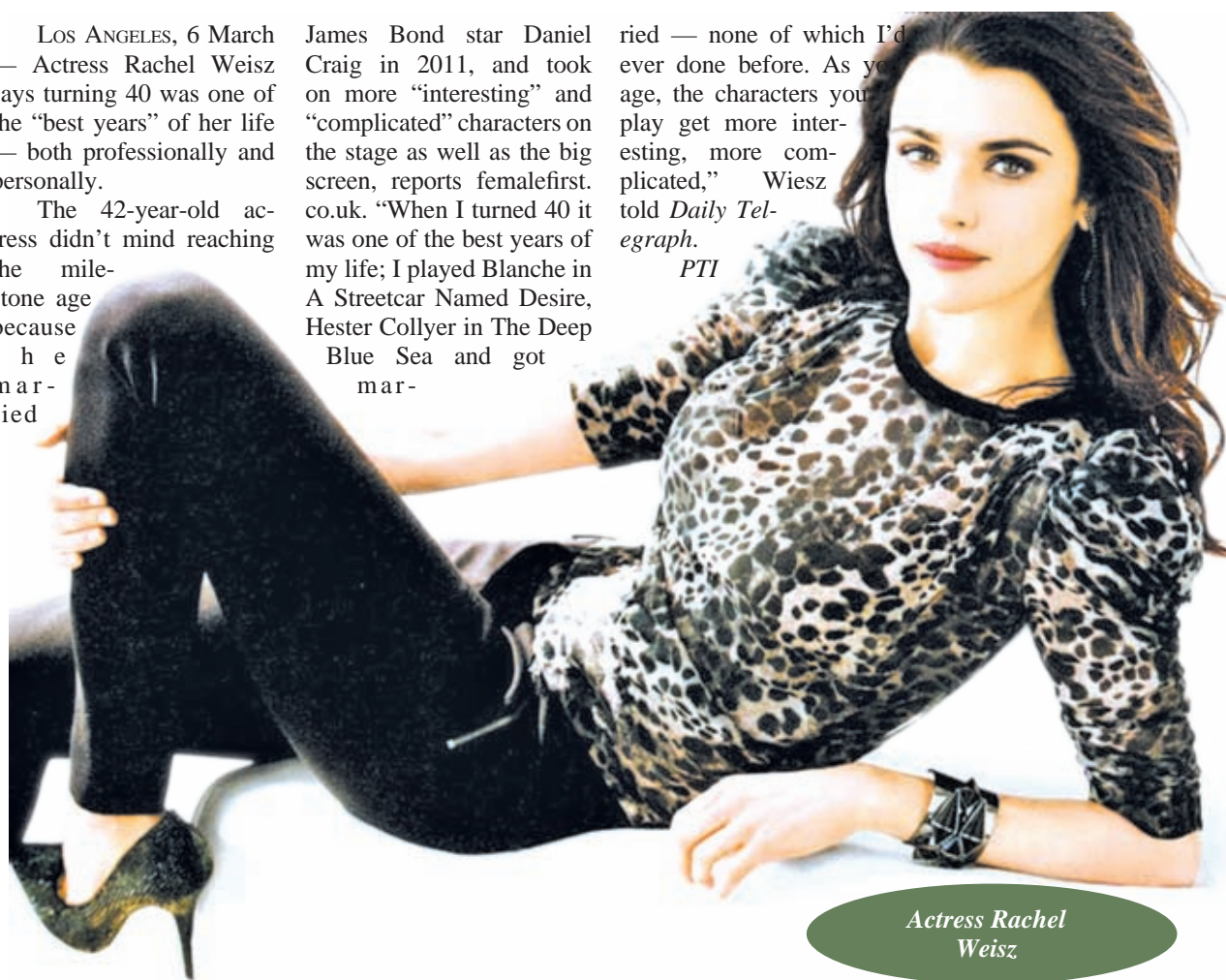
Actress Rachel Weisz

R Balki has already directed Amitabh Bachchan in critically acclaimed films like Cheeni Kum and Paa . Reportedly, the movie will be a short film dealing with a sensitive issue and Shah Rukh Khan will be the face of the project.—PTI