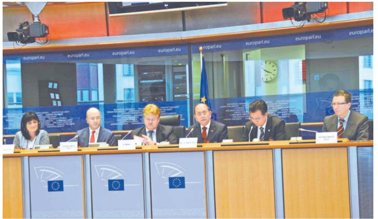
President U Thein Sein explains Myanmar's reform processes in meeting with the Chairman of European Parliament Committee on Foreign Affairs.

I would also like to take this time to discuss the steps my government is taking to build investor confidence and promote responsible investment in Myanmar. Myanmar is ready to work with the international investors as an equal partner. My office worked hand in hand with the legislative branch to promulgate the Foreign Direct Investment Law in the later part of last year. We are currently