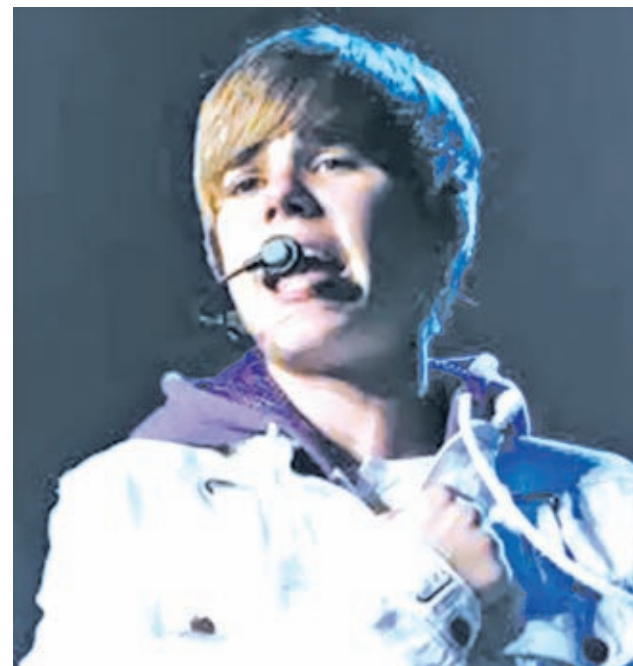
Canadian singer Justin Bieber

Many fans, and the venue itself, appeared not to have got the message after complaints poured in that Bieber was nearly two hours late when he finally appeared at around 10.20 pm. "Last night I was scheduled after 3 opening acts to go on stage at 935 not 830 but because of some technical issues," Bieber wrote on Twitter, the micro-blogging