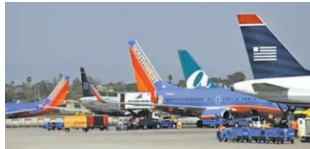
Airplanes are seen parked at Los Angeles International Airport in Los Angeles, California on 4 March, 2013.

Castelvetter said the TSA has implemented a number of safety measures including reinforced cockpit doors, allowing some pilots to be armed and federal air marshals on board airplanes. He said those measures would help ensure safety of the passengers and crew.—Reuters