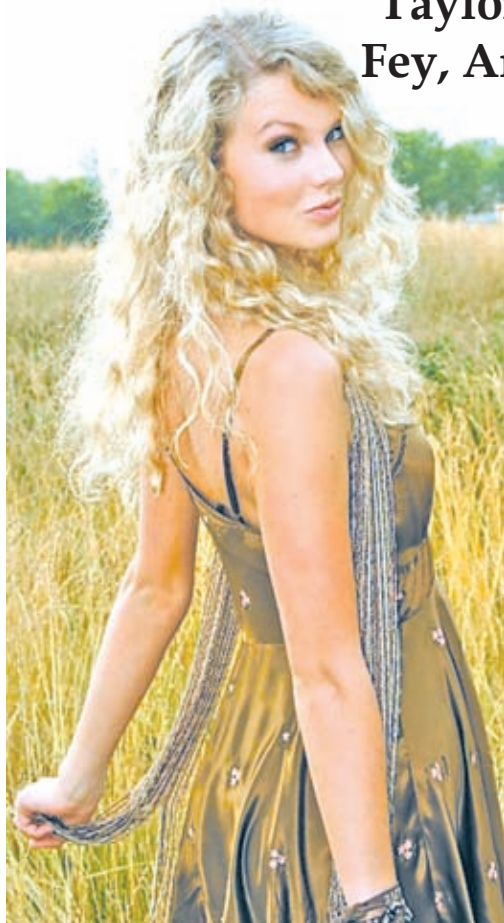
Country pop singer Taylor Swift

LOS ANGELES, 6 March — Country pop singer Taylor Swift hit back at comedians Tina Fey and Amy Poehler for mocking her love life at Hollywood's Golden Globe Awards this year, calling the jab sexist in an interview with magazine Vanity Fair on Tuesday. During the awards broadcast, hosts Fey and Poehler threw a barb at the singer, telling her to "stay away" from actor Michael J Fox's 23-year-old son. The Grammy-winning singer is well known for documenting her personal relationships in her songs, often leaving little clues in the lyrics that hint at the subject.