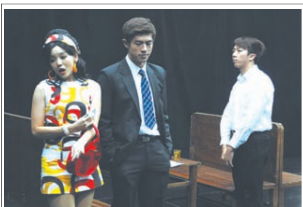
Artists from Greenray Theater perform during a rehearsal press conference of the play "Temperature of a Single Man" in Taipei of southeast China's Taiwan, on 3 March, 2013. Greenray Theater's play, "Temperature of a Single Man", will debut here on 15 March, 2013.