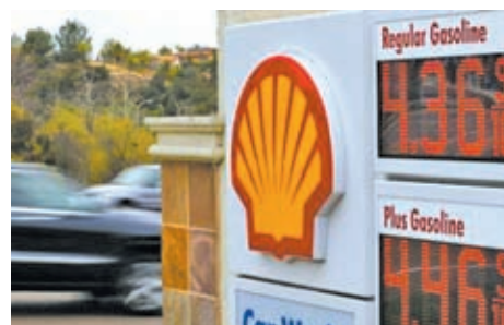
Gasoline prices are displayed on a sign-board at a Shell gas station in Encinitas, California, on 19 Feb, 2013.

Shell, which has bet the most heavily of all the top oil firms on a future for cleaner-burning natural gas, said it is using its expertise to make LNG a viable fuel option for the commercial market.