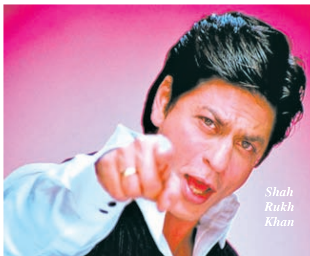
Shah Rukh Khan