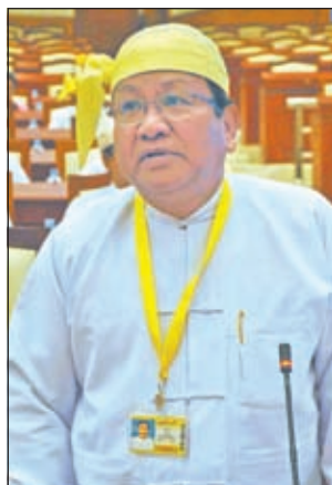
Union Minister U Soe Maung making clarification.—MNA

“statistics-citing” parliament, making clear that ministries still cannot walk out of the conception of “quantities measurement”.