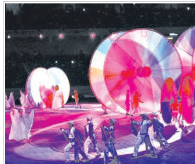
Costa Rican artists perform during the opening ceremony of the 2013 San Jose Central American Games at the National Stadium in San Jose, Costa Rica, on 3 March, 2013.

between 1994-97 and 2003-05 into his squad, which became incredibly difficult to beat. This season's work with Atletico Madrid has been equally impressive and his side is currently second in the BBVA Primera Liga table, all be it 11 points behind league leaders FC Barcelona. However, importantly for Atletico fans the club is ahead of bitter local rivals, Real Madrid in the classification and under Simeone's leadership the club last week qualified for the final of the Copa del Rey after defeating Sevilla in the semi-final.