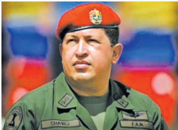
Venezuela's President Hugo Chavez wears an army uniform and the red beret of his parachute regiment while attending a military parade in Caracas in this 13 April, 2005 file photo.