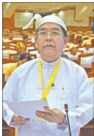
A&I Deputy Minister U Ohn Than making clarification.

called for embracing “Let bygones be bygones” attitude on the road forward. Though the blunt answer of the Union minister just