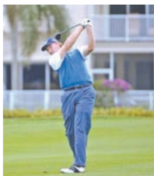
Ernie Els of South Africa hits the ball on the 18th green during second round play in the Honda Classic PGA golf tournament in Palm Beach Gardens, Florida on 1 March, 2013.