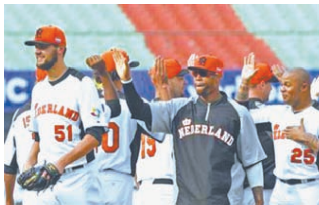
Netherlands' players celebrate after defeating Australia at their World Baseball Classic (WBC) qualifying first round game in Taichung on 5 March, 2013.