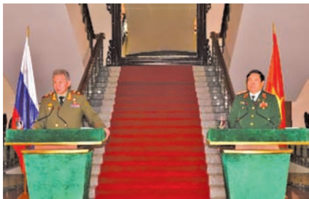
Russian Minister of Defence General Sergei Shoigu (L) and Vietnamese Minister of National Defence General Phung Quang Thanh attend a Press briefing after holding talks in Hanoi, Vietnam, on 5 March, 2013.