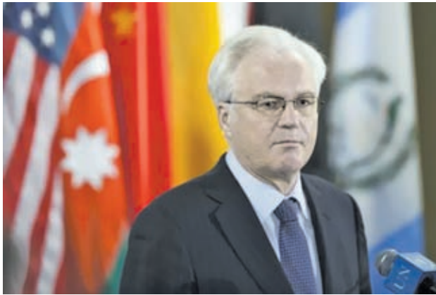
Russian Ambassador to the United Nations Vitaly Churkin speaks to the media after a Security Council meeting at the United Nations in New York on 21 April, 2012.

UNITED NATIONS, 6 March—The UN Security Council hopes to approve by the end of March a special force to combat rebels in the Democratic Republic of Congo, but some members have concerns that need to be addressed first, Russia's UN envoy Vitaly Churkin said on Tuesday.