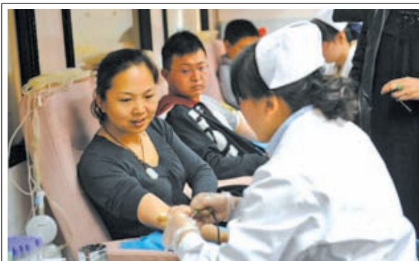
A citizen donates blood in Taiyuan, capital of north China's Shanxi Province, on 5 March, 2013, as an effort to learn from Lei Feng, a young Chinese soldier in the 1960s, who is known for devoting almost all of his spare time and money to selflessly helping the needy. Lei died after being hit by a falling pole while helping a fellow soldier direct a truck on 15 Aug, 1962. A year later, late Chinese leader Chairman Mao Zedong called on the nation to follow Lei's example, and 5 March of every year is designated as "Lei Feng Day."