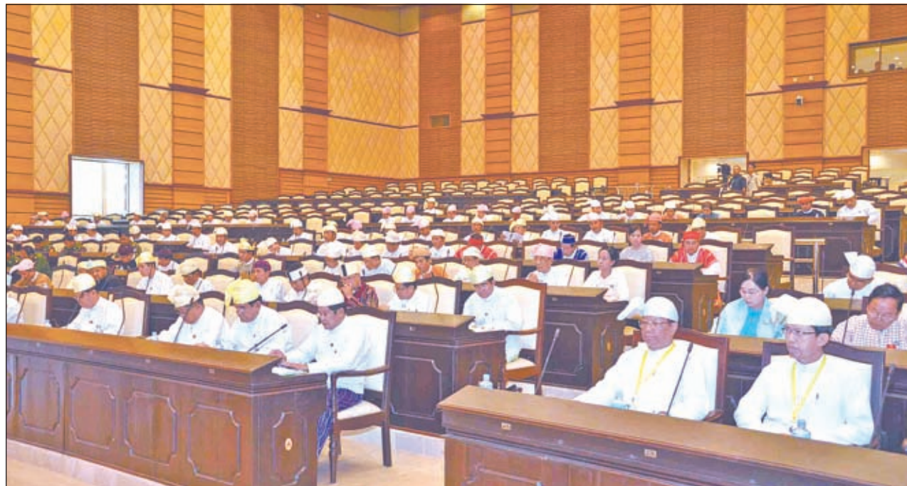
Amyotha Hluttaw representatives attends 22 nd day session.—MNA