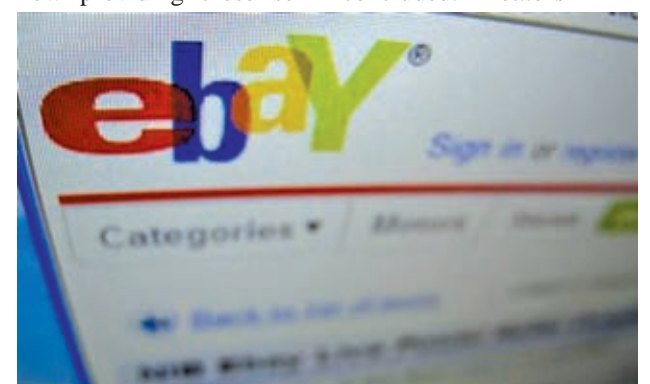
A photograph of a computer screen showing the website eBay is shown here in Encinitas, California on 22 April, 2009.