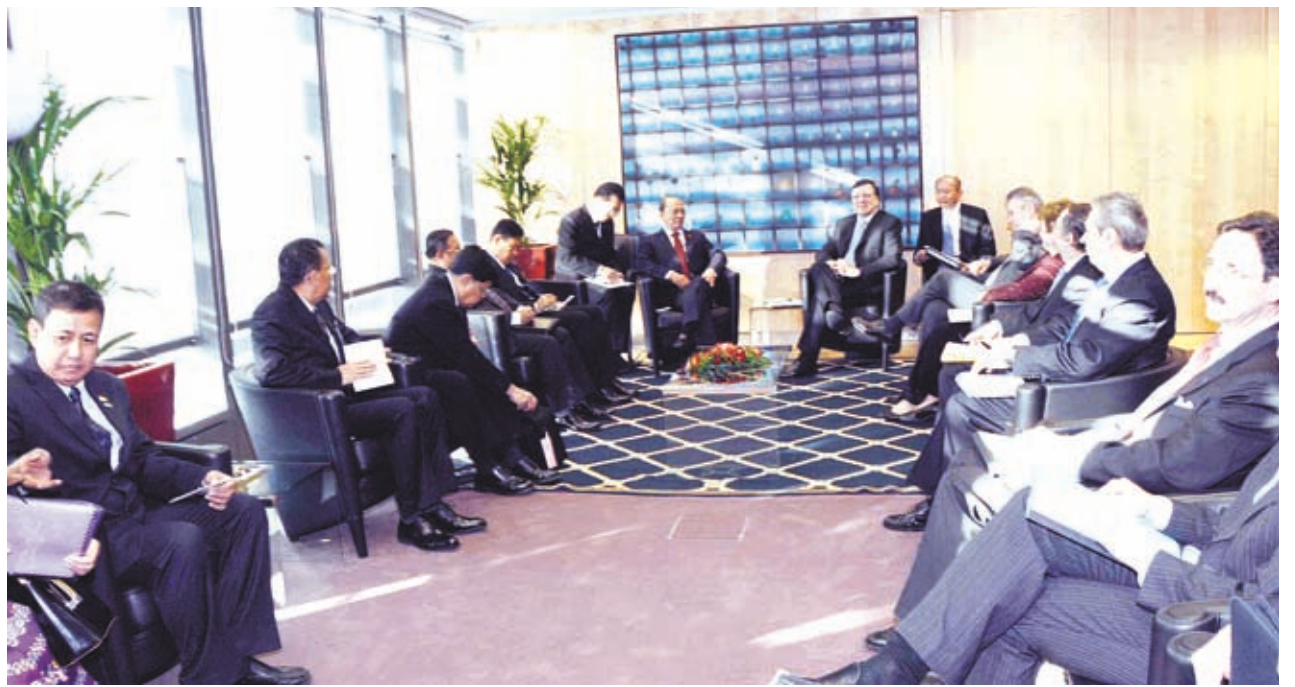
President U Thein Sein meets with European Commission President Mr. Jose Manuel Barroso at office of European Commission in Brussels of Belgium.

Recent political progress can be attributed to four crucial factors: building confidence