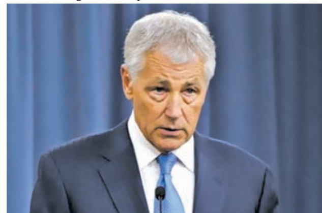
US Secretary of Defence Chuck Hagel speaks during a news conference about the effects of the ‘sequester’ on military operations, at the Pentagon in Arlington, Virginia, on 1 March, 2013.