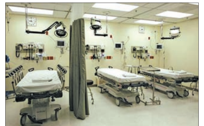
Hospital beds in a file photo.

And insurance plan premiums—which won't be known until this fall—could reflect the decline in drug prices. Although some Part D premiums jumped sharply in 2013, average rates have been flat for several years, ranging from $37 to $40,