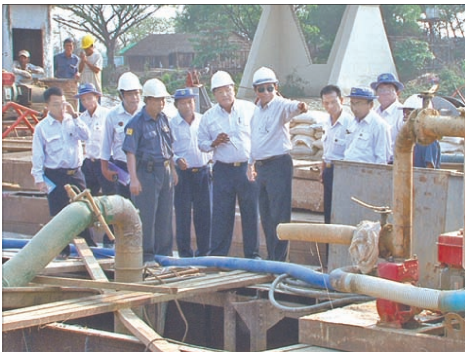
Union Minister for Construction U Kyaw Lwin at bridge construction site.