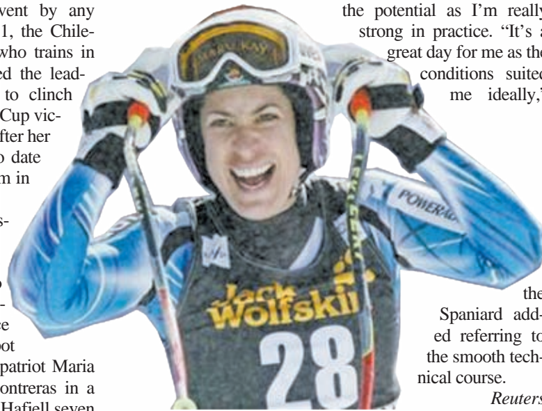
Carolina Ruiz Castillo of Spain reacts after winning the Women's World Cup Downhill skiing race in Meribel, in the French Alps, on 23 Feb, 2013.