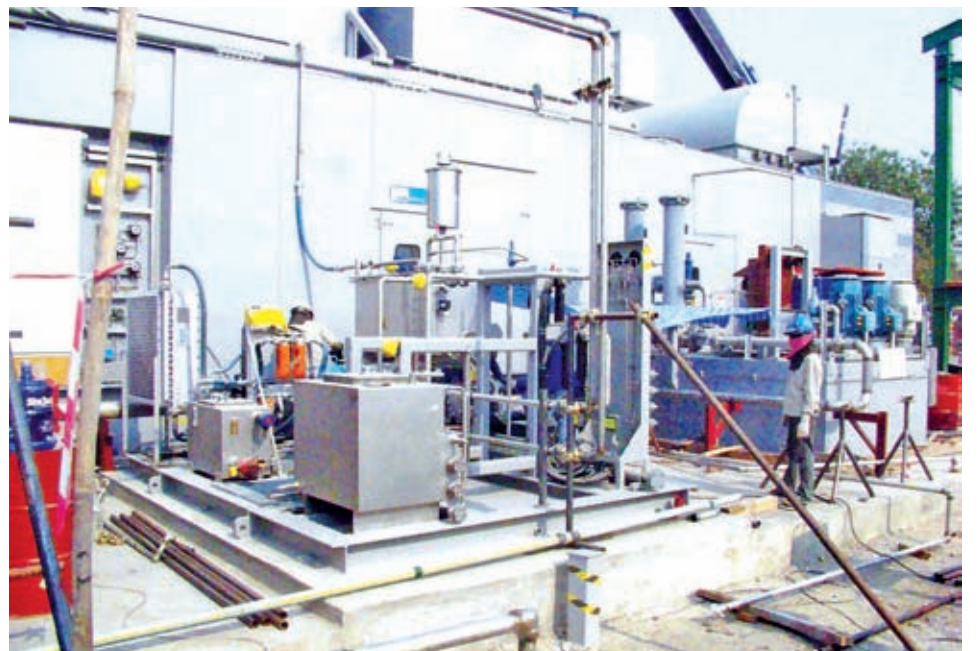
Photo shows new generator being installed at yard of Ahlon Power Station.

the fixing of gas turbine yesterday morning.