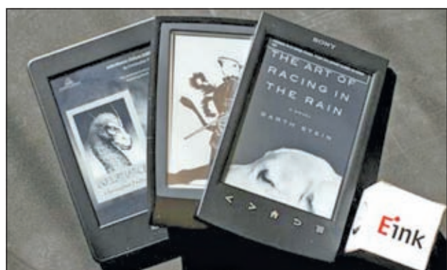
An Amazon Kindle (L-R), a Bookeen Cybook Odyssey, and a Sony Reader, all of which use technology developed by E Ink, are pictured at E Ink Corporation in Cambridge, Massachusetts on 25 Oct, 2012.

BRUSSELS, 24 Feb — The European Commission is taking France and Luxembourg to court for applying reduced tax rates on the sale of electronic books, which the EU executive says breaks current EU rules. Since January 2012, France and Luxembourg have applied reduced value added tax (VAT) rates to the sale of e-books of 7 percent and 3 percent respectively. Under EU rules, governments can apply reduced VAT rates to a limited list of goods and services which includes books, but currently not e-books.