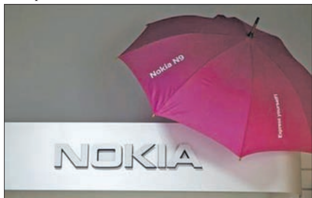
Picture shows a Nokia logo at a shop in Warsaw, on 26 Jan, 2012.