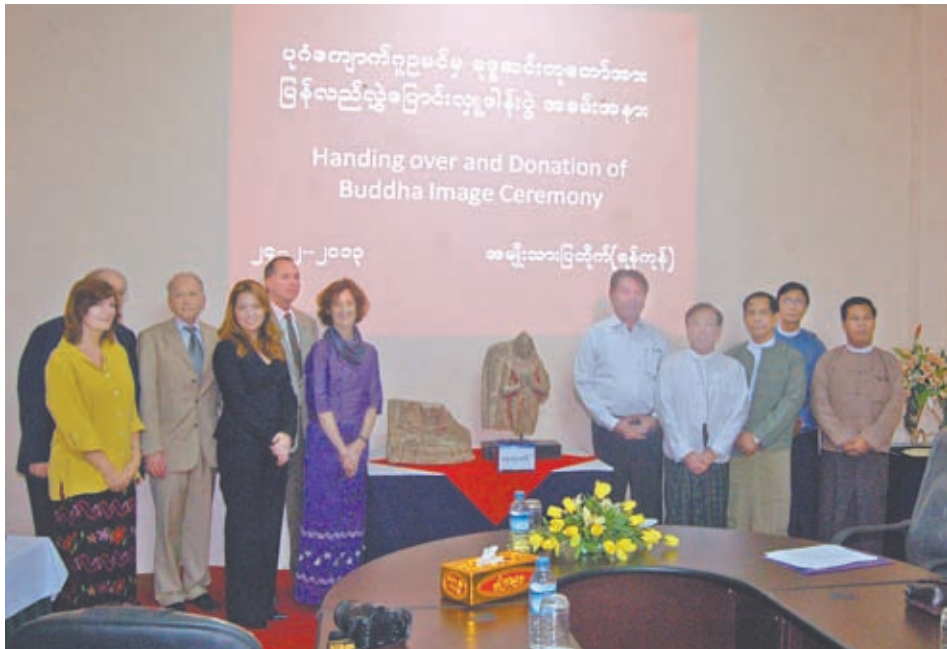
The handing over and Donation of Buddha Image to National Culture and Fine Arts University in progress.