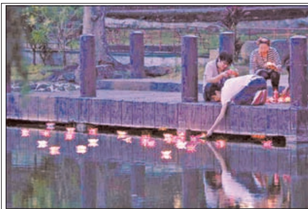
People light floating Chinese lotus lights during the 12th China-Philippines Traditional Cultural Festival and Suzhou Cultural Exhibition at the Rizal Park in Manila, the Philippines, on 23 Feb, 2013. The 12th China-Philippines Traditional Cultural Festival and Suzhou Cultural Exhibition opened here on Saturday, one day ahead of the Chinese Lantern Festival.

Two people also drowned in the towns of New Bataan and Montevista as the storm hit land on Tuesday, lashing the province with moderate to heavy rains. Elsewhere in Mindanao, five others were injured in a landslide in Lanao del Norte Province, officials said.— Xinhua