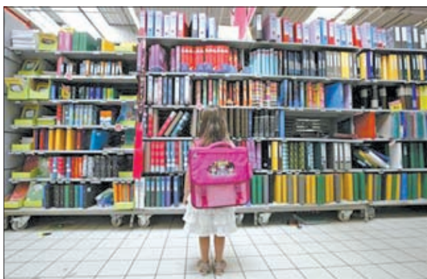
A young girl looks at school stationery in a supermarket in Nice on 23 August, 2012.

NEW YORK, 24 Feb—Groups representing pediatricians and geneticists issued new recommendations on Thursday to provide doctors with guidance about when to test a child's DNA for genetic conditions. The recommendations are the first collaboration between the American Academy of Pediatrics and the American College of Medical Genetics and Genomics. Neither organization has issued guidelines for genetic testing of kids in over a decade, according to one