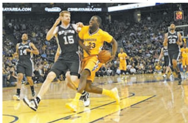
San Antonio Spurs Matt Bonner (L) guards Golden State Warriors Draymond Green (23) during the first half of their NBA basketball game in Oakland, California 22 Feb, 2013.

David Lee broke loose for 25 points and 22 rebounds for the Warriors, who trailed by 13 points midway the fourth quarter. Stephen Curry added 19