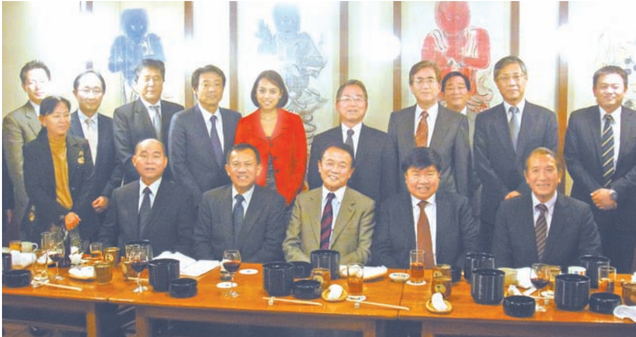
Union Minister Dr Kan Zaw and delegates to the Third Mekong-Japan Meeting: Forum for Promotion of Public-Private Cooperation in the Mekong Region pose for documentary photo.

NAY PYI TAW, 24 Feb— Myanmar delegation led by Union Minister for National Planning and Economic Development Dr Kan Zaw attended the Third Mekong-Japan Meeting: Forum for Promotion of Public-Private Cooperation in the Mekong Region organized by the Ministry of Foreign Affairs of Japan and Seminar on Myanmar Investment Bylaws organized by Japanese Chamber of Commerce and Industry from 19 to 20 February.