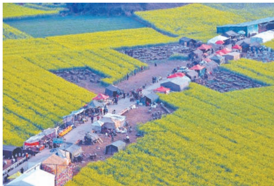
Tourists visit a market fair in the field of cole flowers in Luoping County in Qujing City, southwest China's Yunnan Province, on 19 Feb, 2013. Luoping County is well-known for its cole flower scenery with its 800,000 mu (53,333 hectares) of cropland planted with cole. In 2012, the county saw its cole flowers industry bring more than one billion yuan (about 16 million US dollars) of revenues.

MINSK, 24 Feb—Gas explosion killed at least two people in a nine-storied building in Minsk, capital of Belarus, on Saturday. Two were killed and five injured on Saturday in an apartment building in Minsk, presumably as a result of the explosion of domestic gas, Emergency Ministry press-service said. The Emergency Ministry received the report of an explosion and fire in several apartments on the ninth floor of the house on Plekhanova Street on Saturday evening. Representatives of the Emergency Ministry arrived at scene of accident immediately and rescued from the fire 9 people while evacuating 22. In one of the apartments the bodies of two people were found. They are badly burnt and are impossible to identify visually, not even their gender.—Xinhua