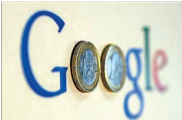
An illustration picture shows a Google logo with two one Euro coins, taken in Munich in this 15 Jan, 2013 file photograph. Google Inc shares rose 1 percent to hit $800 per share on 19 Feb, 2013.