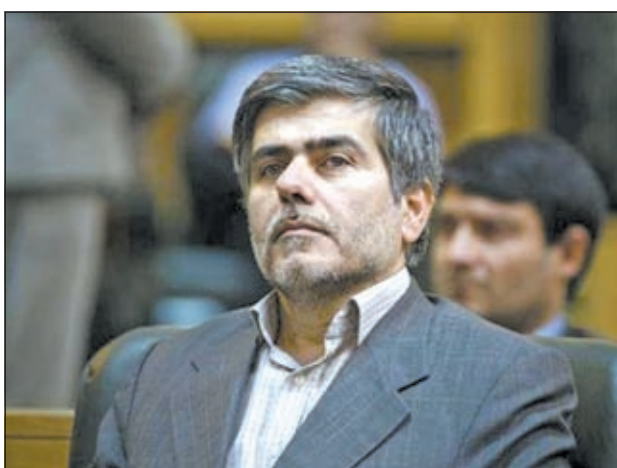
Head of Iran's Atomic Energy Organization Fereydoun Abbasi-Davani attends a conference to mark the martyrs of terrorism in Teheran, on 6 Sept, 2011.

The timing of the announcement suggested Iran, by talking up its reserves and nuclear ambitions, may hope to strengthen its negotiating hand at talks in Kazakhstan on Tuesday with the United States, Russia, China, Britain, France and Germany. Diplomats say the six powers, known as the P5+1, are set to offer Iran some relief from international sanctions if it agrees to curb its production of higher-grade enriched uranium. The West says Iran's enrichment of uranium to a fissile purity