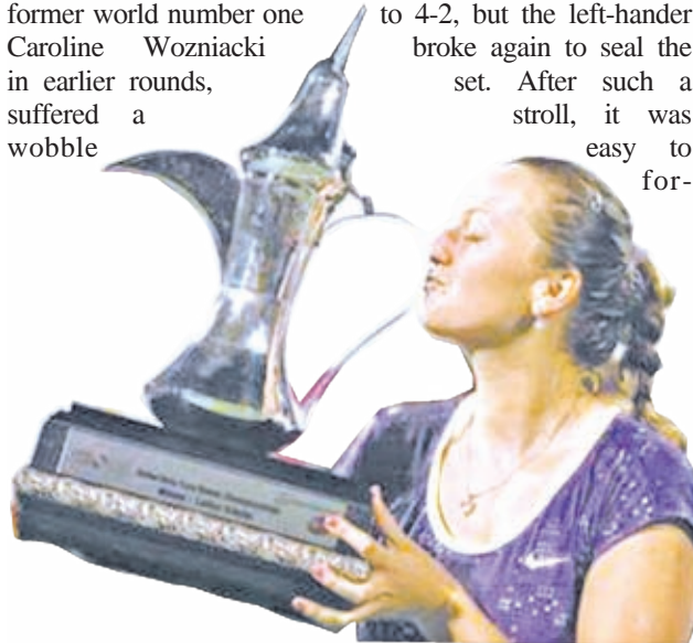
Petra Kvitova of the Czech Republic kisses the winner's trophy after her women's singles final match against Sara Errani of Italy during the WTA Dubai Tennis Championships, on 23 Feb, 2013.