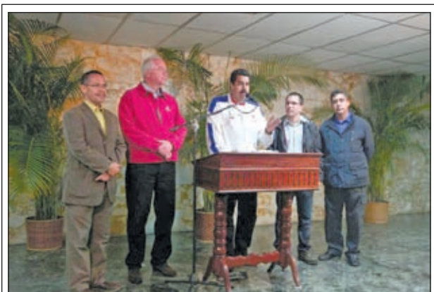
Venezuelan Vice President Nicolas Maduro (C) delivers an announcement in the facilities of the Military Hospital after a meeting with President Hugo Chavez in the city of Caracas, capital of Venezuela, on 22 Feb, 2013. Hugo Chavez held a meeting with Nicolas Maduro, during which Chavez gave instructions on economy, according to the official news agency AVN.

A day earlier, the main umbrella of the Syrian opposition in exile said that it would not attend next month's Friends of Syria meeting in Rome.—Xinhua