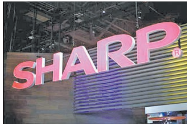
A sign hangs in the Sharp booth on the first day of the Consumer Electronics Show (CES) in Las Vegas on 8 Jan, 2013.