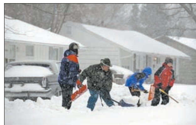
A family digs snow out of their driveway during a blizzard in Overland Park, Kansas, on 21 Feb, 2013.