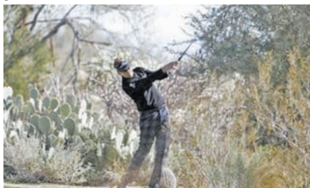
Ian Poulter of England watches his approach shot on the 11th hole during the quarterfinal round of the WGC-Accenture Match Play Championship golf tournament in Marana, Arizona on 23 Feb, 2013.