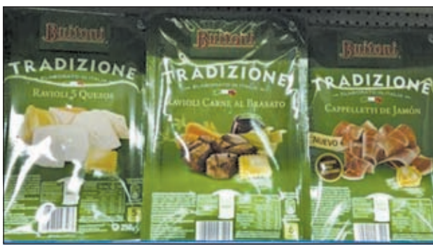
Packages of Buitoni meat ravioli are pictured on display on a supermarket shelf in Madrid, on 19 Feb, 2013.