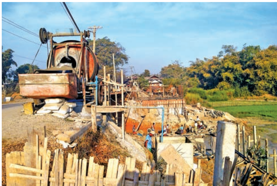
BHAMO, 24 Feb—A construction near the wooden concrete bridge is under one in Hante Ward of Bhamo. The 90 feet long concrete floor bridge can withstand 60