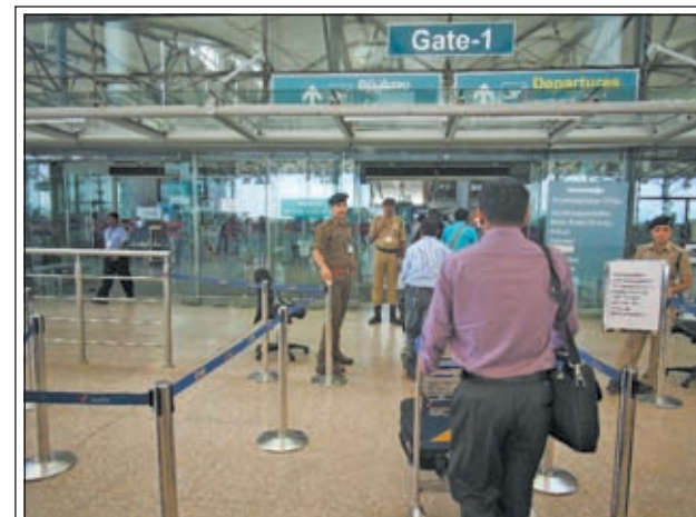
Security personnel perform security checks at the entrance of Hyderabad Airport in Hyderabad, capital city of south Indian state Andhra Pradesh, on 23 Feb, 2013. At least 16 were killed and over 110 injured in the twin blasts in downtown Hyderabad’s crowded Dilsukhnagar commercial area. Hyderabad and other cities in India have tightened security.