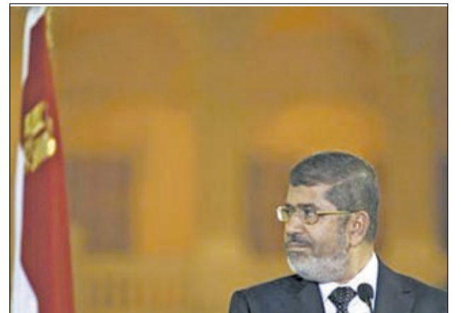
Egyptian President Mohamed Mursi attends a news conference with Turkish President Abdullah Gul (not pictured) after their meeting at Presidential Palace "Qasr Al Quba" in Cairo on 7 Feb, 2013.