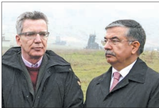
Germany's Minister of Defence Thomas de Maiziere (L) and his Turkish counterpart Ismet Yilmaz, with the Patriot system in the background, are seen during their visit NATO German patriot troops at a Turkish military base in Kahramanmaras on 23 Feb, 2013.