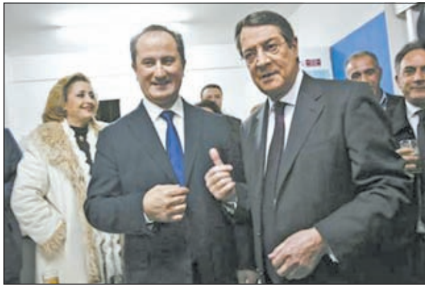
Cyprus presidential candidate Nicos Anastasiades of the right wing Democratic Rally party (R) talks with left-wing backed independent Stavros Malas (L) before a televised debate in Nicosia on 22 Feb, 2013.

The 66-year-old lawyer took more than 45 percent of the vote in last Sunday's first round, easily beating Malas who took 27 percent. An anti-austerity candidate who finished third refused