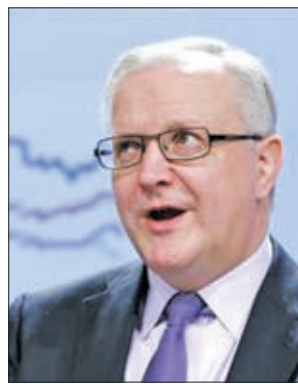
European Economic and Monetary Affairs Commissioner Olli Rehn presents the EU Commission's interim economic forecast during a news conference at the EU Commission headquarters in Brussels on 22 Feb, 2013.