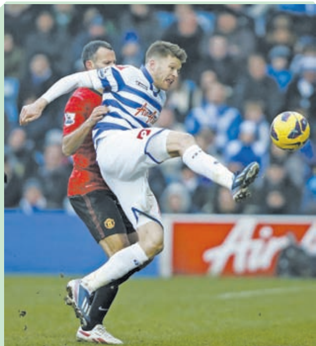
Ryan Giggs(L) of Manchester United vies with Jamie Mackie of Queens Park Rangers during the Barclays Premier League match between Queens Park Rangers and Manchester United at Loftus Road Stadium in London, Britain on 23 Feb, 2013. Manchester United won 2-0.