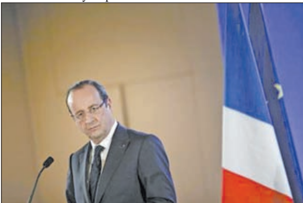
French President Francois Hollande attends a news conference during his visit to the 50th International Agricultural Show in Paris, on 23 Feb, 2013.—REUTERS

Islamists have threatened to strike back at anyone who supports the mission.—Reuters