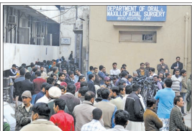
Relatives of injured children gather outside emergency ward of a hospital in Lahore, eastern Pakistan, on 21 Feb, 2013. At least 21 school children and a teacher were treated for burn injuries as fire erupted in a classroom at a school in Shadara area of Lahore on Thursday, local media reported.

Once implemented, the MoU will facilitate the movement of the three countries' vehicles from the East-West Economic Corridor to Vietnam's Hanoi and Hai Phong cities, Vientiane of Laos and Lam Chabang of Thailand. The ministers also agreed on an action plan to realize the agreement between the three governments on land tourism transport which mentions the establishment of subcommittees on transport, tourism, immigration and customs to assist the operation of the three countries' joint committee.—Xinhua