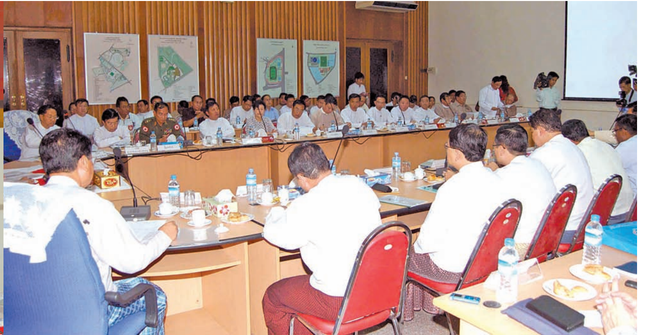
Patron of XXVII SEA Games Organizing Leading Committee Vice-President U Nyan Tun meets with presidents of sports federations.

YANGON, 22 Feb— Patron of XXVII SEA Games Organizing Leading Committee Vice-President U Nyan Tun met with presidents of sports federations in Myanmar at National Indoor Stadium (1) here this afternoon.