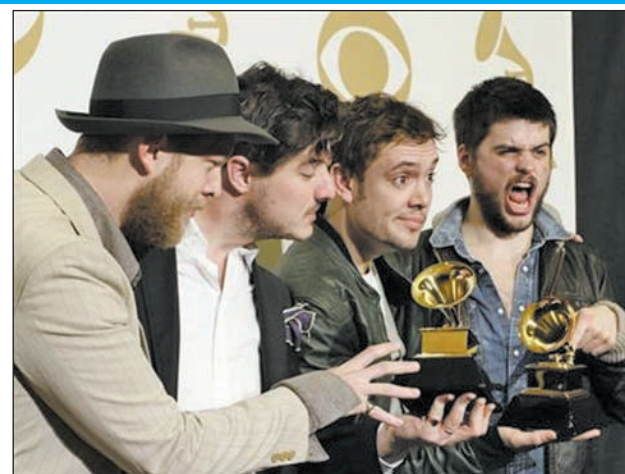
Mumford & Sons pose with their awards for Album of the Year for “Babel” and Best Long Form Music Video for “Big Easy Express” backstage at the 55th annual Grammy Awards in Los Angeles, California on 10 Feb, 2013.

“That was just a really bad situation that sucked”. PTI