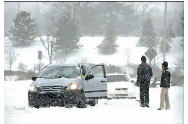
Stranded motorists are seen during a blizzard in Overland Park, Kansas, on 21 Feb, 2013.