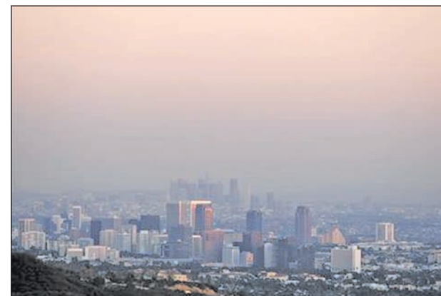
Century City and downtown Los Angeles are seen through the smog on 31 Dec, 2007.