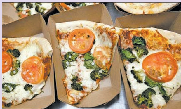
Pizza is shown for sale in the cafeteria at a middle school in San Diego, California on 7 March, 2011.—REUTERS

Americans’ diets and weight is a source of constant scrutiny and research in a country where two-thirds of the population is considered overweight or obese. According to the CDC, 36 percent of US adults, or 78 million, and 17 percent of youth, or 12.5 million, are obese. Another third are overweight. The slight decline in fast food consumption among adults reflects a growing trend toward healthier options. Many food and beverage companies have revamped their products or created new, healthier options to account for the shift in consumer tastes.— Reuters