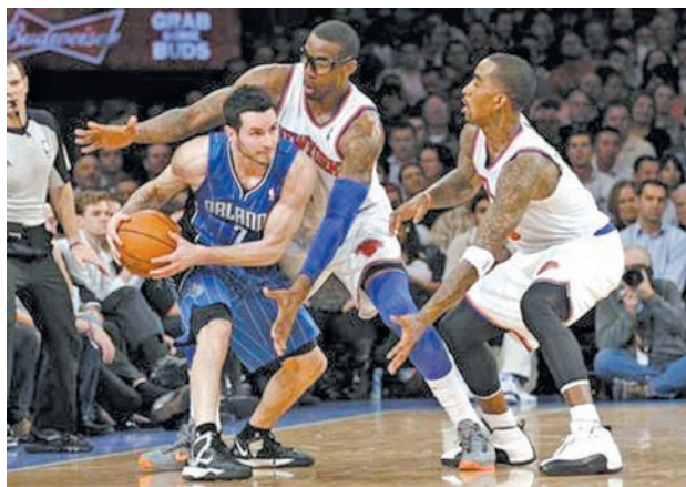
Orlando Magic's guard JJ Redick (L) looks to pass the ball while being defended by New York Knicks' guard JR Smith (R) and Knicks forward Amar'e Stoudemire in the fourth quarter of their NBA basketball game at Madison Square Garden in New York, on 30 Jan, 2013.