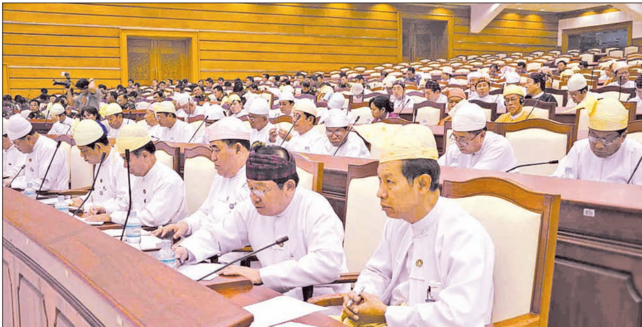
19 th day session of Pyithu Hluttaw in progress.

"Our stand is to help small holder farmers establish joint ventures with foreign investors," he added.