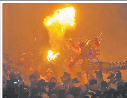
People perform dragon dance in firecrackers in Binyang County of south China's Guangxi Zhuang Autonomous Region, on 20 Feb, 2013. The Binyang-style dragon dance is a derivative of traditional dragon dance in which performers hold dragon on poles and walk through floods of firecrackers. The dance, dating back to over 1,000 years ago, was listed as a state intangible cultural heritage in 2008.

Detailed information can be obtained from : http://www.aseanfoundation.org Only short listed candidates will be notified.