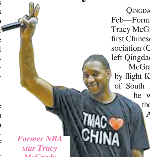
Former NBA star Tracy McGrady