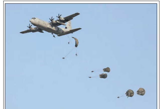
Photo taken on 21 Feb, 2013 shows an aircraft during the full dress rehearsal for the Indian Air Force's Iron Fist 2013 military exercise in Pokhran of the state of Rajasthan, India.