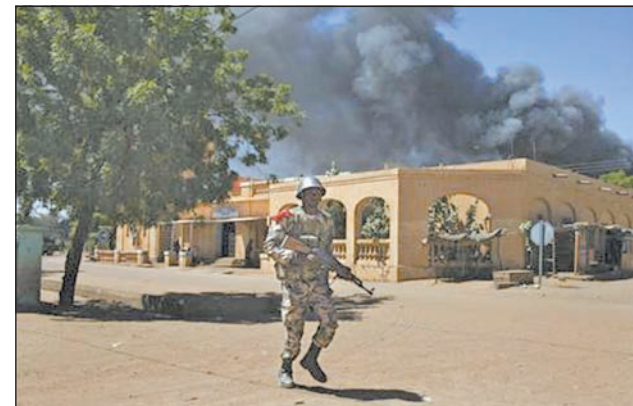
A Malian soldier runs past smoke from a petrol station on fire during fighting with rebels in Gao on 21 Feb, 2013.