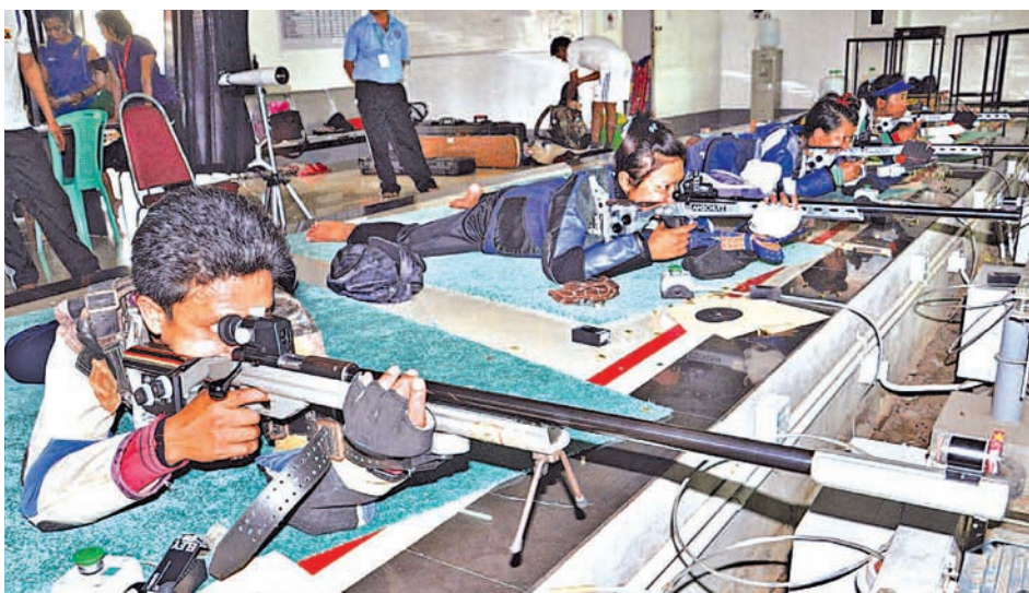
Shooting is one of the sports which is always sure to bag gold medals for the Myanmar sports contingent in SEA Games which is held every two years. But

Myanmar shooting team failed to bring success in 2011 Indonesian SEA Games. That's why, athletes are under intensive training for the XXVII SEA Games that Myanmar will host to be able to achieve success.