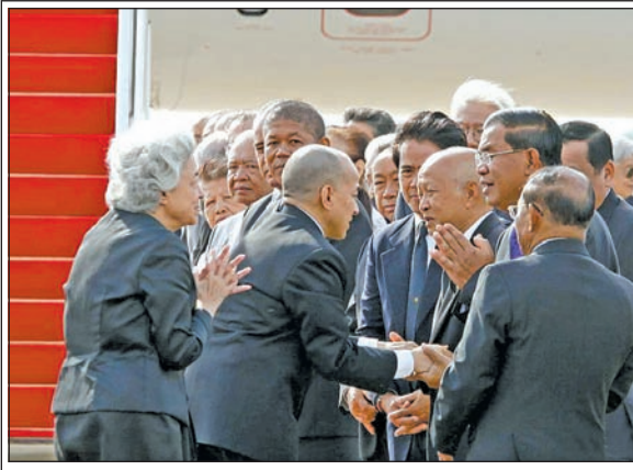
Cambodian King Norodom Sihamoni (2nd L) and his mother, former Queen Norodom Monineath (1st L) are seen off at Phnom Penh International Airport in Phnom Penh, capital of Cambodia, on 21 Feb, 2013. Cambodian King Norodom Sihamoni and his mother, former Queen Norodom Monineath left here on Thursday morning for Beijing for routine medical checkup.