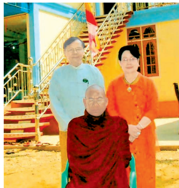
Pyomei Traditional Mandalay. Medicine Industry) from