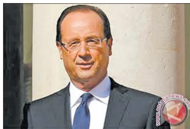
French President Francois Hollande

of the peace diploma and the laureate." the statement gold medal Prize "will be said.