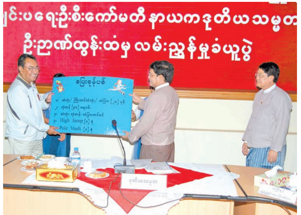
Vice-President U Nyan Tun presents sports gear to officials of respective sports federations.—MNA

from 2012-2013 to 2016-2017 financial years. The Union Minister replied that the ministry has already arranged to construct eleven basic education primary schools, nine rural health care centers and five bridges above 180-ft in Chin State and ten BEPSs, eight rural health care centers and three bridges above 100-ft in Naga Self-Administered Zone.—MNA