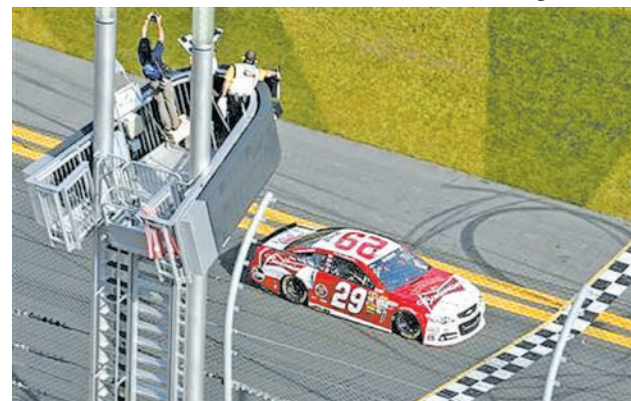
Kevin Harvick takes the checkered flag in his number 29 Chevrolet to win the first NASCAR Sprint Cup Series Budweiser Duel at the Daytona International Speedway in Daytona Beach, Florida on 21 Feb, 2013.

Scott Speed finished 15th, the final spot that