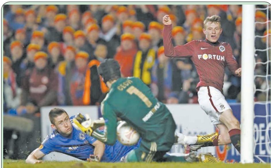
Gary Cahill (L) of Chelsea defends Ladislav Krejci (R) of Sparta Prague as Peter Cech, goalie of Chelsea saves during the UEFA Europa League round of 32 second leg match between Chelsea and Sparta Prague at Stamford Bridge in London, Britain on 21 Feb, 2013. The match ended with a 1-1 draw and Chelsea reached the last 16 with a 2-1 score in total.