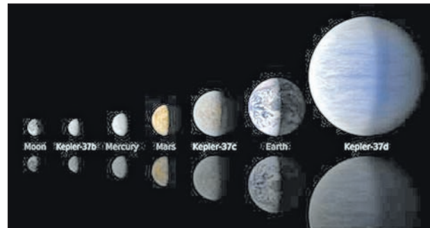
NASA's artist's illustration compares the planets in the Kepler-37 system to the moon and planets in the solar system.