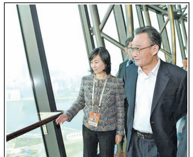
Wu Bangguo (R), chairman of the National People's Congress (NPC) Standing Committee, listens to the introduction on the city planning in Macao Tower in Macao, south China, on 21 Feb, 2013. Wu is in Macao to attend celebrations of the 20th anniversary of the promulgation of the Basic Law of the Macao Special Administrative Region.