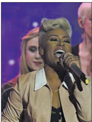
British singer Emeli Sande performs during the BRIT Awards, celebrating British pop music, at the O2 Arena in London on 20 Feb, 2013.

LONDON, 22 Feb — Scottish singer Emeli Sande won the coveted best album honour at the BRIT Awards on Wednesday for “Our Version of Events”, confirming her status as favourite going into British pop’s big night of the year.