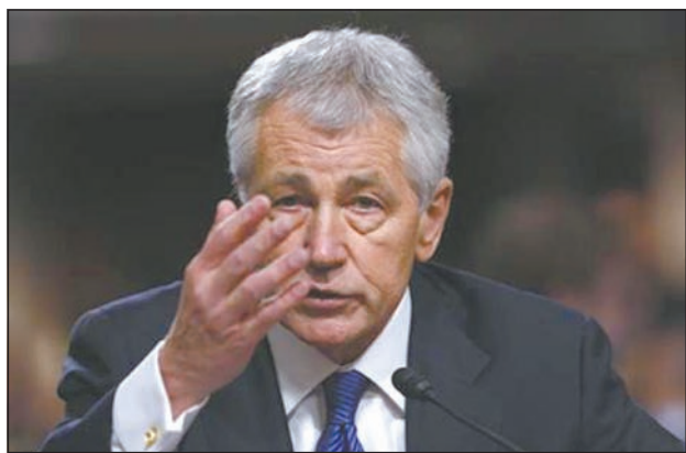
Former US Senator Chuck Hagel (R-NE) testifies during a Senate Armed Services Committee hearing on his nomination to be Defence Secretary, on Capitol Hill in Washington, on 31 Jan, 2013.