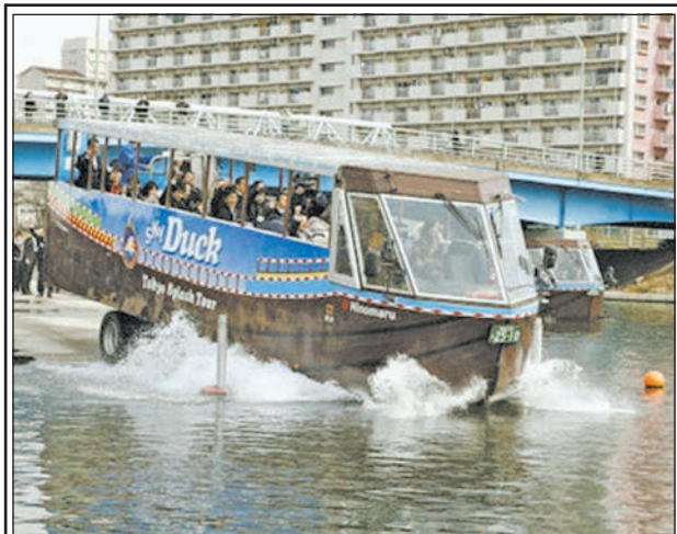
An amphibious tourist bus enters the water in Tokyo's Koto Ward on 22 Feb, 2013, as reporters were offered a ride before the vehicle is put into service in March.