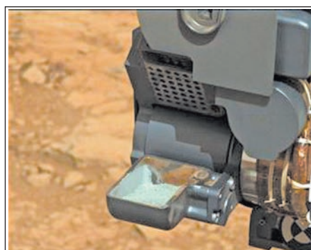
The first sample of powdered rock from Mars extracted by the NASA's Curiosity rover drill is pictured in this 20 Feb, 2013 NASA handout photo.