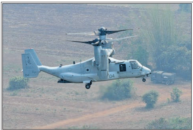
A MV-22 Osprey tilt-rotor Aircraft is seen during the Cobra Gold exercise in Sukhothai, Thailand, on 21 Feb, 2013. The 11-day multinational military exercise ended on Thursday. An estimated 13,000 servicemen from seven countries were participating in the Cobra Gold exercise, including those from Singapore, Malaysia, Indonesia, Japan, South Korea, the United States and Thailand.

In April, the new Christchurch Airport terminal would be officially opened after an overhaul costing 237 million NZ dollars. And the government was planning the largest hospital build in the history of New Zealand's public health system, "costing more than half a billion dollars," he said.—Xinhua