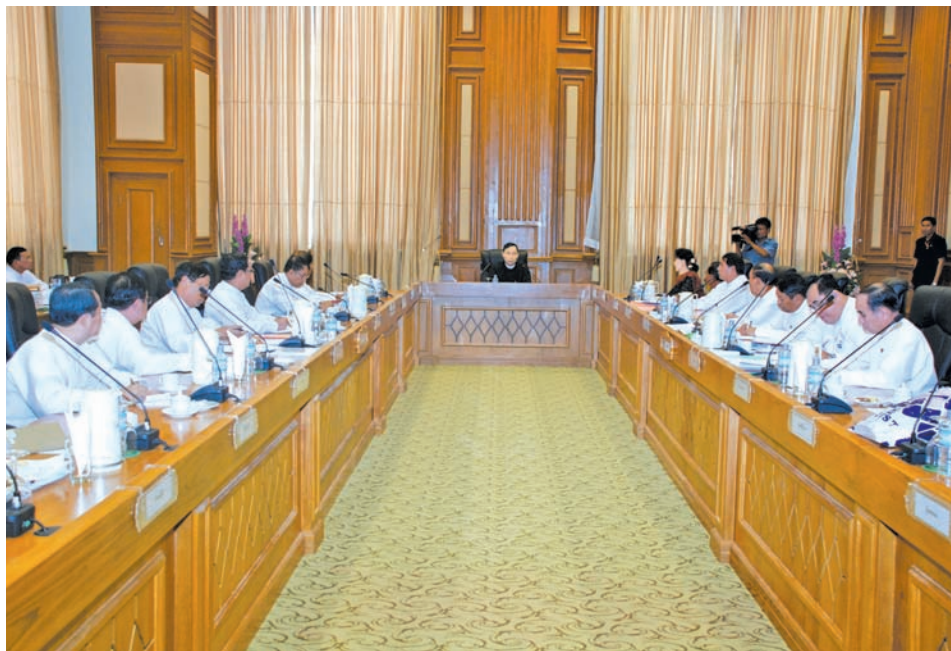
Pyithu Hluttaw Speaker Thura U Shwe Mann meets committee chairmen, secretaries and commission members at Zabuthiri Hall of Hluttaw Building.