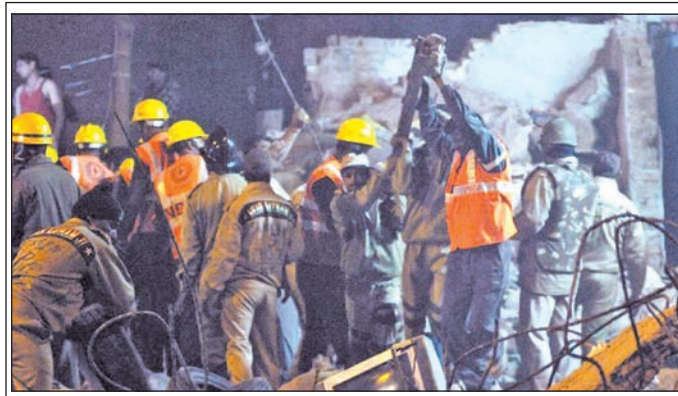
Rescue workers look for survivors after a two-storey building collapsed at the Tahirpur area, east of New Delhi, India, on 20 Feb, 2013. A man and his daughter were killed and another dozen people were injured in the incident.