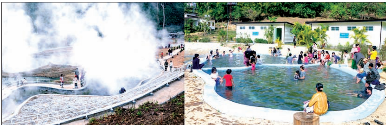
Photo shows a flock of visitors refreshing their mind and body at Nay Pyi Taw Hot Spring situated at an altitude of 1500 ft near Taungkya village on Pynmana-Pinlaung motorway.