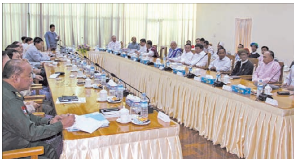
Vice-Chairmen of Union level Peace-making Committee Union Minister U Aung Min and U Thein Zaw meet responsible persons of Peace Groups.