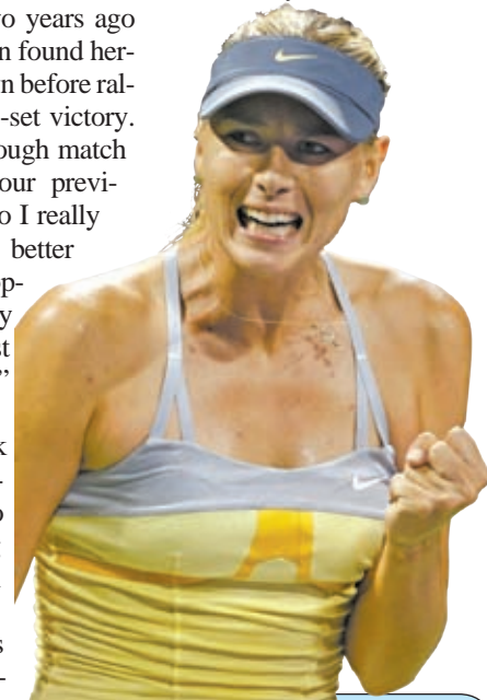
Maria Sharapova of Russia reacts as she celebrates a point against Caroline Garcia of France during their women's match at the Qatar Open tennis tournament in Doha on 12 Feb, 2013.

world number one Victoria Azarenka fails to reach the final. Belarussian Azarenka gets her campaign underway with a second round match against Romina Oprandi on Wednesday.—Reuters