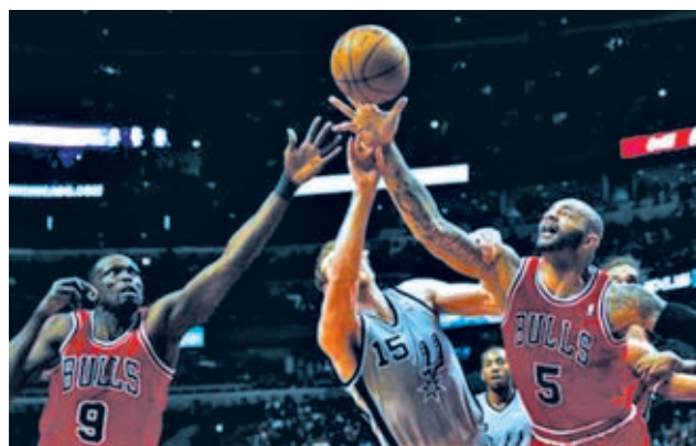
Chicago Bulls' Carlos Boozer (R) and teammate Luol Deng (L) battle San Antonio Spurs' Matt Bonner for a rebound during the first half of their NBA basketball game in Chicago, on 11 Feb, 2013.

Nate Robinson scored 20 points to pace the Bulls while Joakim Noah added seven and 15 rebounds for the home team, who faded down the stretch. The Bulls had dominated inside and outbounded the visitors 49-26 but it did not seem to matter.—Reuters