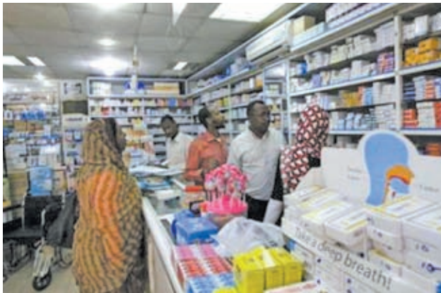
A customer buys medication at a pharmacy in Khartoum on 13 Jan, 2013.