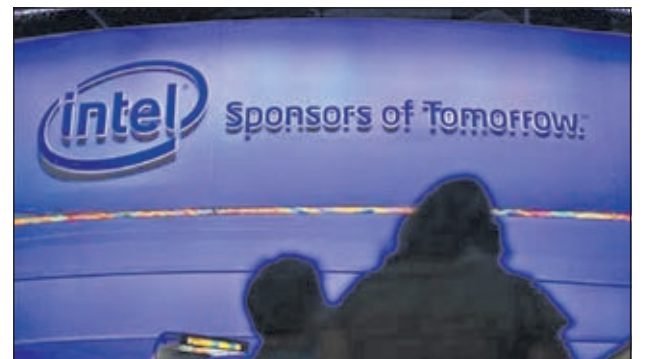
Showgoers visit the Intel booth on the first day of the Consumer Electronics Show (CES) in Las Vegas on 8 Jan, 2013.