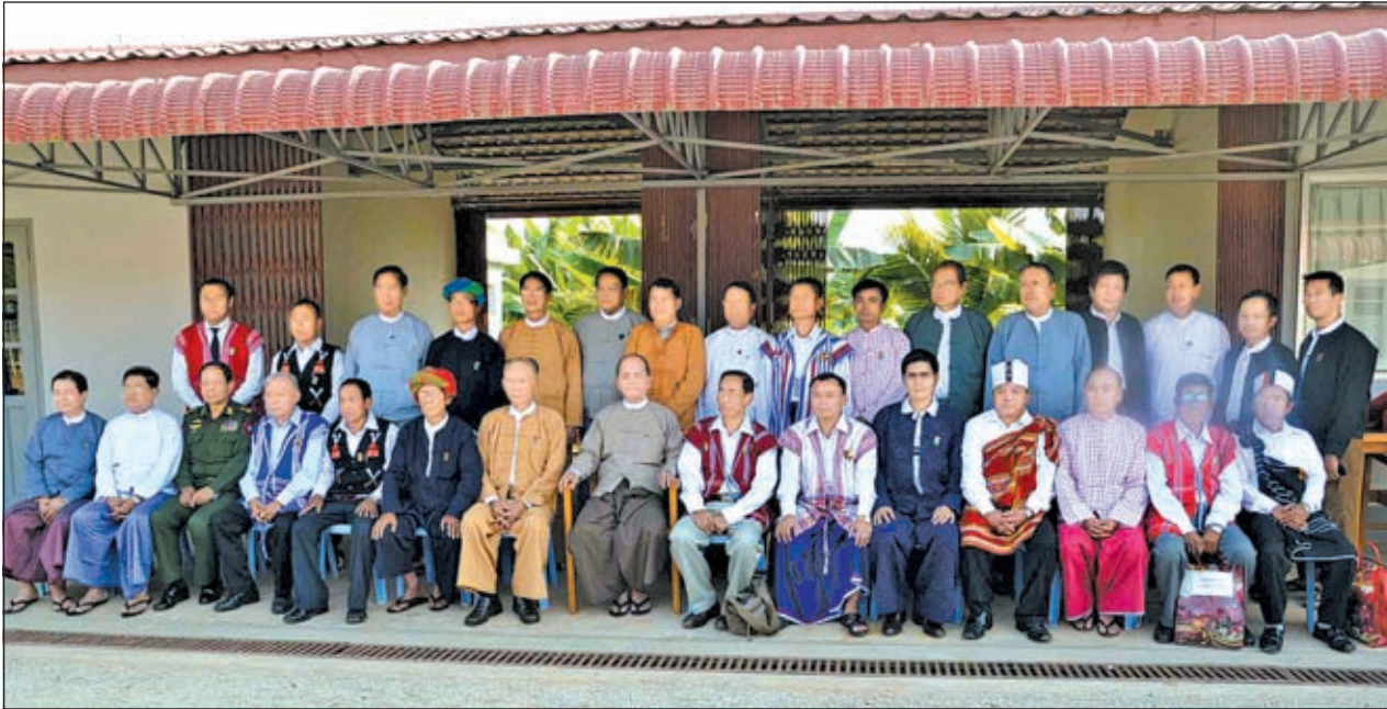
President U Thein Sein poses for documentary photo with responsible persons of peace groups who attended the 66 th Anniversary Union Day celebration.

NAY PYI TAW, 13 Feb — President U Thein Sein received responsible persons of peace groups who attended the 66 th Anniversary Union Day celebration at the meeting hall of 500-acre farmer