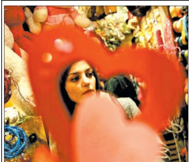
An Iranian woman chooses gifts for the upcoming Valentine's Day at a store in Teheran, on 12 Feb, 2012.

In October, 2007, Chadian officials arrested Zoe's Ark staff for attempting to fly illegally children who were mostly Chadian and had at least one living parent. (1 euro = 1.34 US dollar)