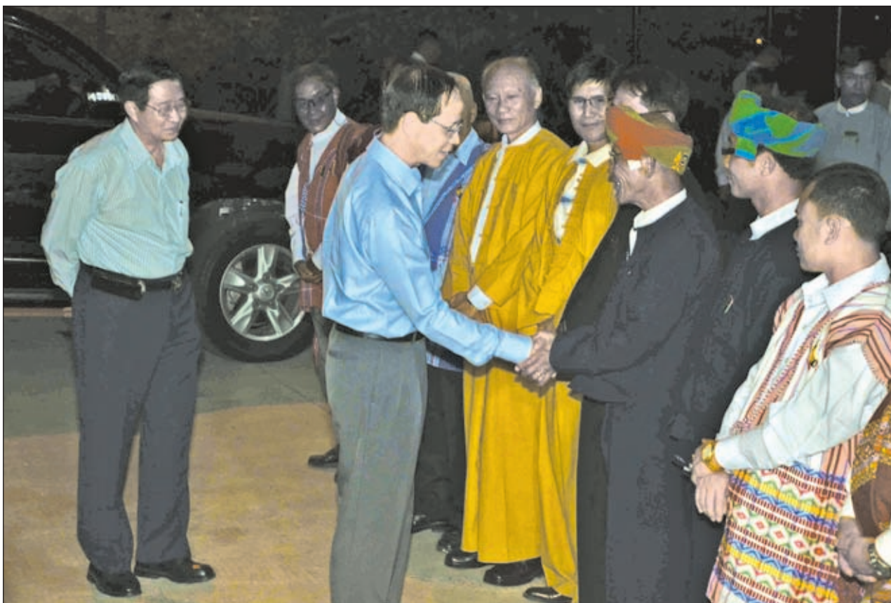
Vice-President Dr Sai Mauk Kham cordially greets responsible persons from the peace groups at the dinner.—MNA