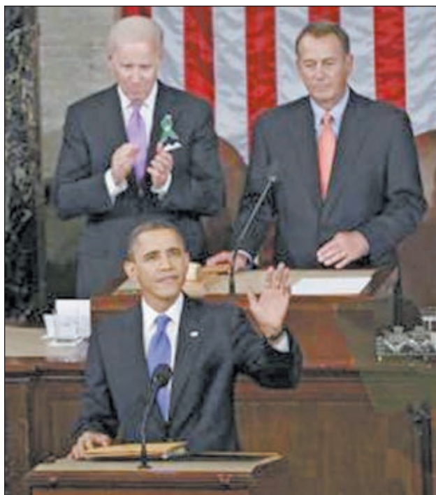
US Vice President Joe Biden (L) applauds and House Speaker John Boehner (R-OH) looks on as President Barack Obama waves prior to delivering his State of the Union Speech on Capitol Hill in Washington, on 12 Feb, 2013.