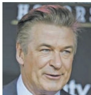
Actor Alec Baldwin

LOS ANGELES, 13 Feb — Actor Alec Baldwin and his new wife Hilaria Thomas Baldwin are expecting their first child together, a representative for the "30 Rock" star said on Tuesday. "If I really shared