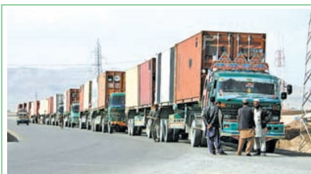
NATO supply trucks carrying NATO equipment park at a checkpoint in Quetta, southwest Pakistan on 12 Feb, 2013. United States says it has started using the land route through Pakistan to pull US military equipment out of Afghanistan.