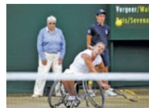
Esther Vergeer of the Netherlands

LONDON, 13 Feb -- One of the most dominant records in sport came to an unblemished conclusion when Dutch wheelchair tennis player Esther Vergeer hung up her racket after an unbeaten decade on Tuesday. The 31-year-old, who claimed four Paralympic singles gold medals