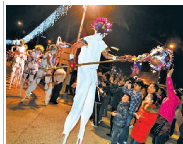
Performers on stilts participates in the Spring Festival parade in Macao, south China, on 12 Feb, 2013.