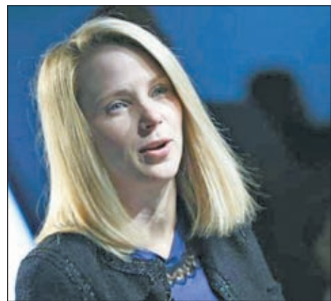
Yahoo Inc Chief Executive Marissa Mayer attends the annual meeting of the World Economic Forum (WEF) in Davos on 25 Jan, 2013.