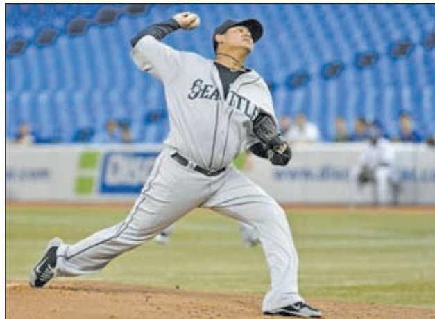
Seattle Mariners pitcher Felix Hernandez throws against the Toronto Blue Jays during the first inning of their MLB American League baseball game in Toronto on 13 Sept, 2012.

Greinke signed the highest average-annual-value deal at $24.5 million with his six-year, $147 million contract in December. Three-time All-Star Hernandez pitched a perfect game last season while posting a 13-9 record with a 3.06 earned run