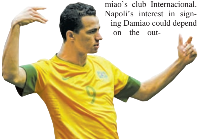
Brazil international striker Leandro Damiao

The Italian Serie A club is looking for a possible replacement for Uruguayan forward Edinson Cavani,