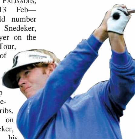
US golfer Brandt Snedeker

PACIFIC PALISADES, (California), 13 Feb—American world number four Brandt Snedeker, the hottest player on the 2013 PGA Tour, has pulled out of next week's WGC-Accenture Match Play Championship in Arizona because of sore ribs, organizers said on Tuesday. Snedeker, who clinched his second victory in his last six starts on the US circuit with a win at the Pebble Beach National Pro-Am on Sunday, has been receiving treatment on his ribs since last month's Humana