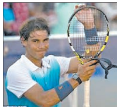
Former world No 1 Rafael Nadal

a Press conference on Tuesday. "I know it's a long way from now but it is also a real objective for me." Nadal will be aged 30 years and two months