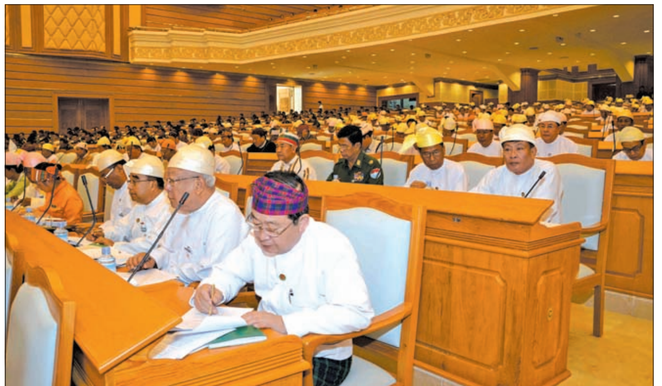
The 8 th day Pyidaungsu Hluttaw regular session in progress.

“What’s the point is reclaiming the farmland into mechanized one is simply not enough. We need to adopt a master plan