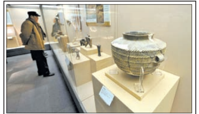
Citizens view artworks at the Shanxi Museum in Taiyuan, capital of north China's Shanxi Province, on 12 Feb, 2013. Some citizens spent their Spring Festival holiday by viewing exhibitions in museums.

to feature Iran, Syria and kick-starting the peace process between Israel and the Palestinians. Yediot Aharonot reported Monday that the visit is primarily intended to stop any intention by Netanyahu to launch an independent attack on Iran in the spring, with Obama expected to reiterate his administration's support for continued international diplomacy and sanctions on Teheran.—Xinhua