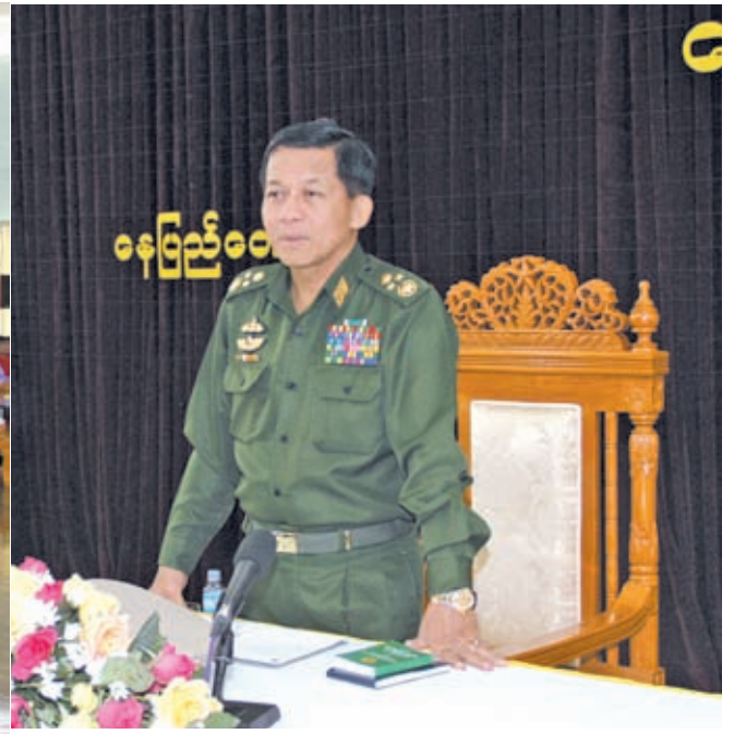
Commander-in-Chief of Defence Services Vice-Senior General Min Aung Hlaing meets senior military officers from National Defence College, officers and other ranks from Nay Pyi Taw Command.

NAY PYI TAW, 13 Feb—Commander-in-Chief of Defence Services Vice-Senior General Min Aung Hlaing has invited KIA to hold peace talks with the Tatmadaw.