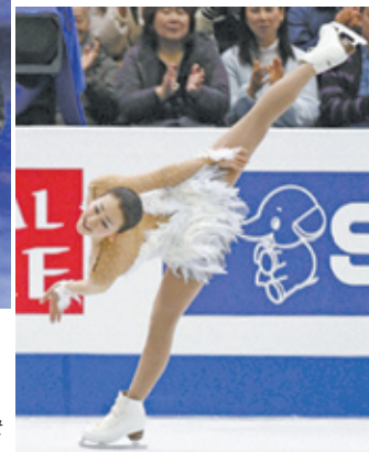
Japan's Mao Asada performs in the women's free skate at the Four Continents Figure Skating Championships at Osaka Municipal Central Gymnasium in Osaka on 10 Feb, 2013. Asada won the competition with a total of 205.45 points, the world's highest score of the season.