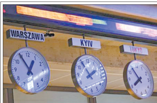
The WIG20 index is seen reflected in clocks showing the time of the different cities in the world at the Warsaw Stock Exchange on 3 Jan, 2013.

Foreign exchange trading was choppy in thin volumes, with what traders interpreted as slightly dovish comments from the European Central Bank last week also weighing on the euro, which has shed around 2.5 percent since reaching a 15-month high above $1.37 on 1 February.—Reuters