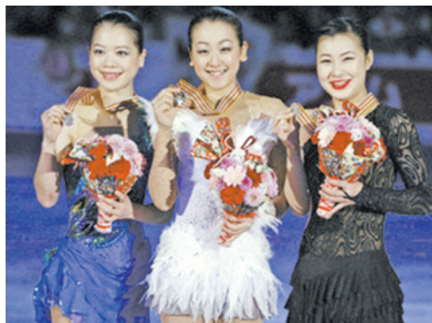
Japan's three figure skaters, (from L) Akiko Suzuki, Mao Asada and Kanako Murakami hold up the silver, gold and bronze medals respectively on the podium at the Four Continents Figure Skating Championships at Osaka Municipal Central Gymnasium in Osaka on 10 Feb, 2013. Asada won the competition with a total of 205.45 points, the world's highest score of the season.

OASKA, 11 Feb—Two-time world champion Mao Asada lived up to her billing, leading a trio of Japanese to a sweep of the Four Continents Figure Skating Championships women's medals on Sunday.