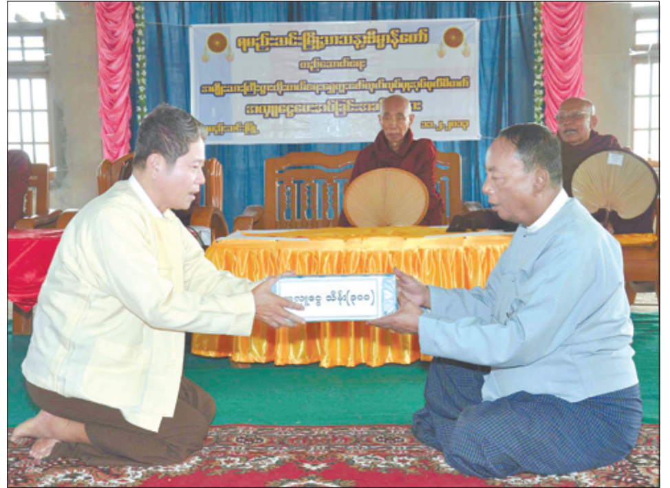
Speaker of Pyidaungsu and Amyotha Hluttaws U Khin Aung Myint accepts cash donation for construction of Sasana Beikman in Yamethin.

The managing board will select the school children who are eligible to receive the stipend. The eligible students must be the ones who are learning at the basic education middle and high school level, who are not being provided stipends from the government and other organizations. Those who are orphans or disabled will be put on top priority