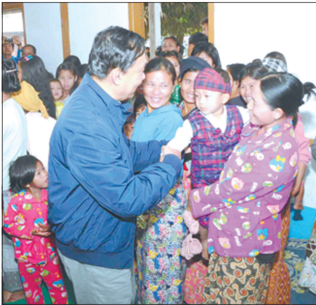
Speaker Thura U Shwe Man cordially greets local people at Hsutngaingtaung relief camp in Myitkyina.