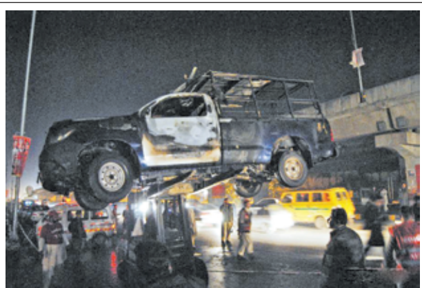
Policemen lift a damaged police van from a blast site in northwest Pakistan's Peshawar on 10 Feb, 2013. At least five policemen were injured in the bomb attack targeting the police van patrolling on road in Peshawar on Sunday night, local media said.—XINHUA