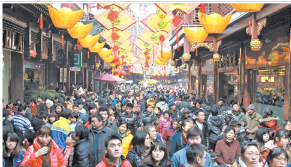
Tourists swarm the Yuyuan Garden in east China's Shanghai Municipality, on 10 Feb, 2013. Shanghai saw a tourist peak on Sunday, the first day of the 2013 Spring Festival holiday. The city is estimated to receive more than three million tourists during the week-long holiday.