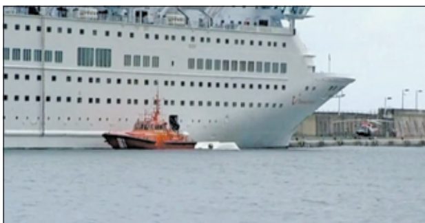
A plunging lifeboat kills five crew members of a cruise ship during an emergency drill in the Canary Island.