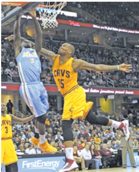
Denver Nuggets Ty Lawson (3) is fouled by Cleveland Cavaliers Marreese Speights (15) during the third quarter of their NBA basketball game in Cleveland, on 9 Feb, 2013.

LOS ANGELES, 11 Feb—The Denver Nuggets have continued their sparkling form with a 111-103 victory over the Cleveland Cavaliers on Saturday, extending their winning streak to nine games. Denver have averaged 114.6 points per game during the streak to move to 33-18, and fourth