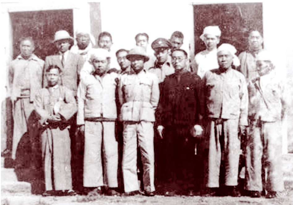
General Aung San and national race representatives posed for documentary photo after signing Panglong Agreement in Panglong on 12 February 1947.