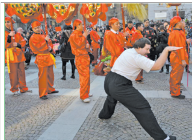
People take part in a parade celebrating the Chinese Lunar New Year in Milan, Italy, on 10 Feb, 2013.

"It was not terrorism, conflict among dancers was suspicious of the attack. We are investigating into the case in order to arrest the perpetrator for legal punishment," he said.— Xinhua