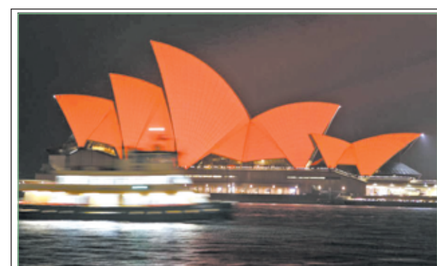
A ferry boat moves in the front of the Sydney Opera House, which is lit up in red to celebrate the Chinese Lunar New Year, in Sydney, Australia, on 10 Feb, 2013. The Chinese Spring Festival falls on 10 February this year, marking the start of the Chinese Year of the Snake.

the sangam, the confluence of the river Ganges and Yamuna, on the occasion of the Hindu holy festival of Maha Kumbh which started last month. "The stampede broke out after a railing of an over-bridge at the station collapsed suddenly. While 22 people were killed on the spot, some 14 others succumbed to their injuries. The other injured have been admitted to local hospitals where the conditions of some are said to be serious," the official said on condition of anonymity.