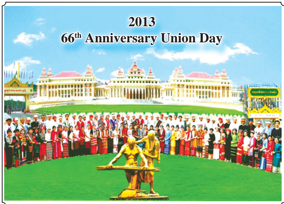
2013 66 th Anniversary Union Day

Thanks to the new bridge, local people from AungHlaing,Lapwatkwetchaung, Nonekyun, Nyaung-ywaphyar and Nyaung-ywawa villages will be able to travel from one place to another at any time.