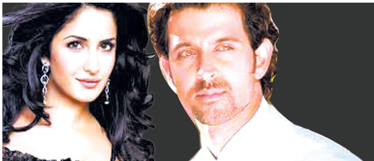
Hrithik Roshan and Katrina Kaif will be performing power-packed stunts in their next film.

broadcast on CBS on Saturday on the eve of this year's Grammy Awards ceremony. The singer, known both for her soaring ballads and well-chronicled history of drug abuse, is also expected to be remembered at the