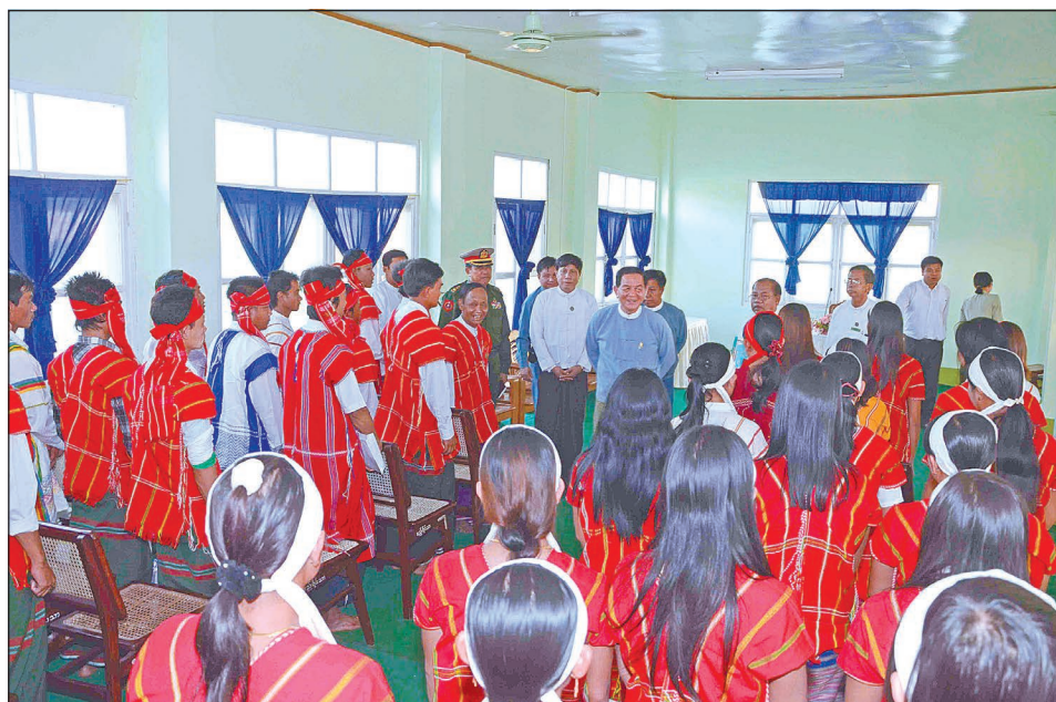
Union Minister at the President Office Chairman of Nay Pyi Taw Council Mayor U Thein Nyunt converses ethnic people.

NAY PYI TAW, 11 Feb—Nay Pyi Taw Council will promote the socio-economy of the ethnic people from the eastern hilly areas in Nay Pyi Taw Council Area.