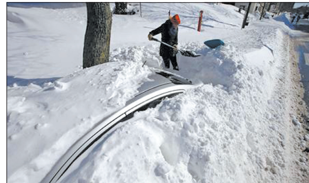
Julie MacDonald starts to dig her car out from snow in Somerville, Massachusetts on 10 Feb, 2013 following a winter blizzard which dumped up to 40 inches of snow with hurricane force winds, killing at least nine people and leaving hundreds of thousands without power.—REUTERS