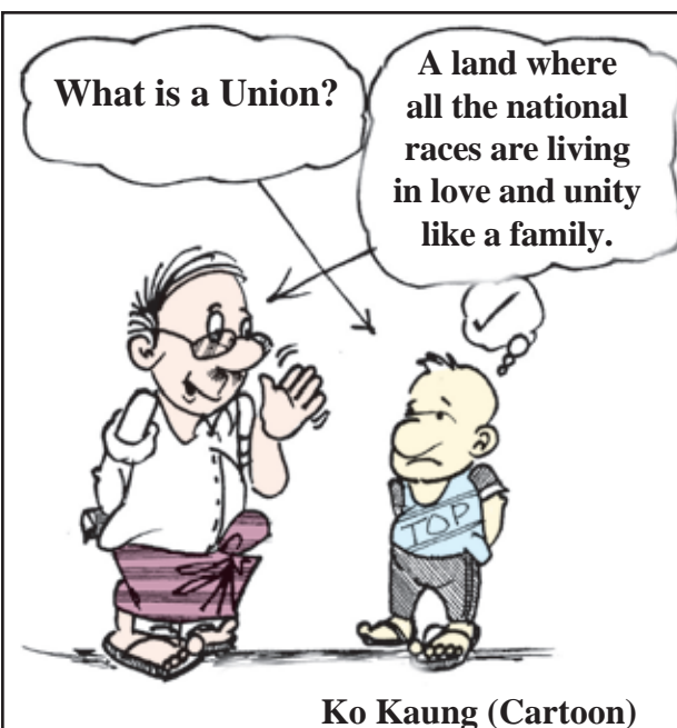
Ko Kaung (Cartoon)

“As it is required to implement nation-building tasks and national reconciliation and peace-making processes simultaneously, community-based civil societies and the entire national races are to actively take part in their respective roles as a national duty.”