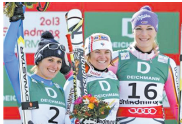
Second placed Nadia Fanchini of Italy (L), first placed Marion Rolland of France (C) and third placed Maria Hoeffl-Riesch of Germany celebrate on the podium during the flower ceremony after the women's Downhill race at the World Alpine Skiing Championships in Schladming on 10 Feb, 2013.

is widely considered as the winner of the 1966 downhill world crown after a gender test the following year showed that the champion on the day, Erika Schinegger, was actually a man. The Austrian was never officially disqualified. "I wanted a medal here at all costs," Rolland, 30, told reporters. "I gave it my all because I believed in my chances. I had good feelings on this piste, which I liked very much since last season," she said. Rolland has never won a World Cup event but earned her first two podiums last season on Schladming's Streicher piste, finishing second in