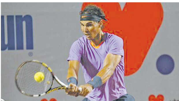
Spain's Rafael Nadal returns the ball to France's Jeremy Chardy during their men's singles match at the Chilean Open tennis tournament in Vina del Mar city on 9 Feb, 2013.

Zeballos was competitive from the outset, but failed to exploit two break-points in the first set to allow Nadal a tiebreak, which the Spaniard comfortably wrapped up 7-2. Zeballos hit back to win the second set tiebreak 8-6 and showed great poise to level at 1-1 in the decider after being broken before proceeding to an inspiring victory.