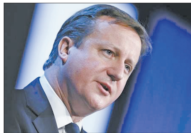
Britain’s Prime Minister David Cameron speaks during the annual meeting of the World Economic Forum (WEF) in Davos on 24 Jan, 2013.