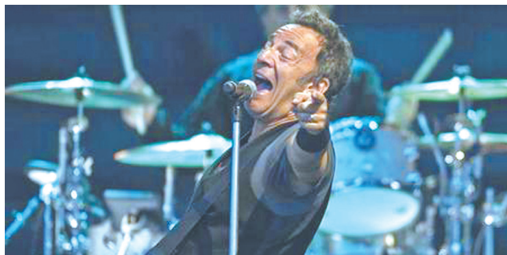
US musician Bruce Springsteen performs with the E Street Band during a tour to promote their latest album "Working on a Dream", at Zorrilla stadium in Valladolid on 1 Aug, 2009.

Earlier in the night, he helped boost the value of an auctioned signed guitar. "With this guitar comes one free guitar lesson with me," he said to the audience to trigger more bids. Then he