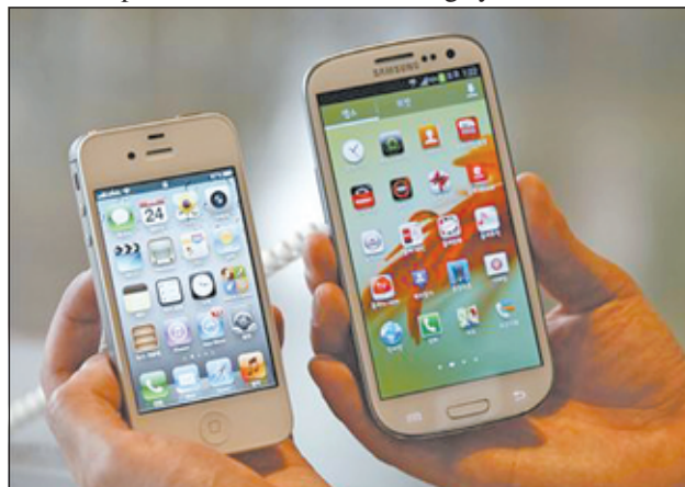
An employee holds Apple's iPhone 4s (L) and Samsung's Galaxy S III at a store in Seoul in this file photo from 24 Aug, 2012.