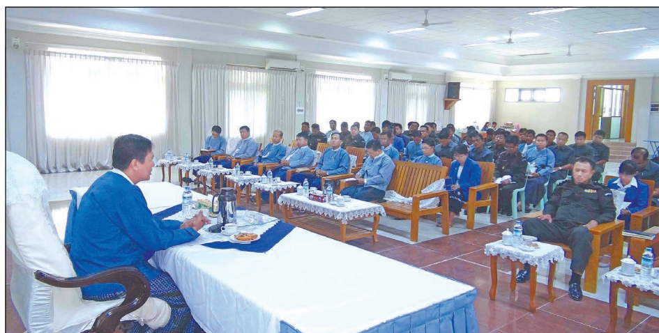
Chairman of Overseas Jobs Supervisory Committee Union Minister for Labour, Employment and Social Security U Maung Myint meets officers/other ranks from eleven working groups.—MNA

Speaking on the occasion, the Union Minister instructed them to discharge duties there for about three months.