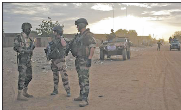
French soldiers speak to a Nigerian soldier on patrol in the northern city of Gao, Mali on 9 Feb, 2013.

French helicopters clattered overhead and fired on al-Qaeda-allied rebels armed with AK-47s and rocket-propelled grenades who had infiltrated the central market area and holed up in a police station, Malian and French officers said.