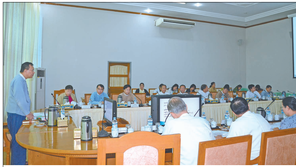
Work committee holds its meeting on making preparations for ASEAN Economic Community 2015 in progress.

NAY PYI TAW, 11 Feb—The work committee held its meeting on making