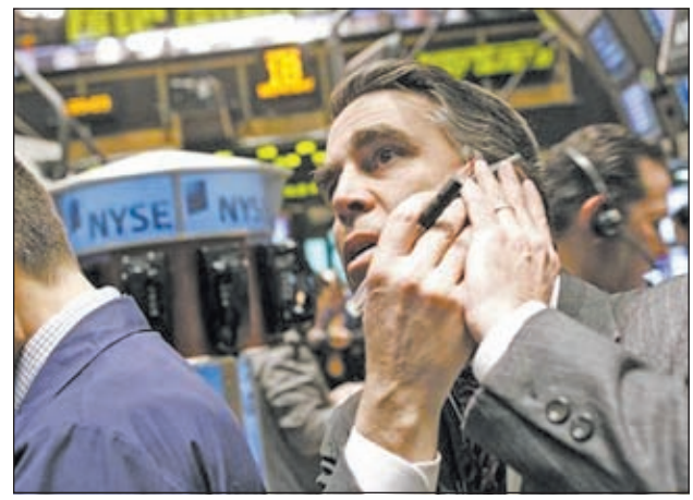
Traders work on the floor of the New York Stock Exchange on 18 March, 2009.

The Nasdaq composite stock index closed at a 12-year high and the S&P 500 index at a five-year high, boosted by gains in technology shares and stronger overseas trade