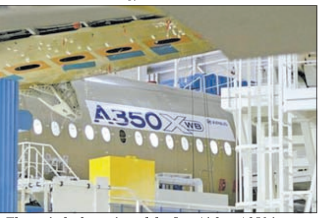
The main body section of the first Airbus A350 is seen on the final assembly line in Toulouse, southwestern France, on 23 Oct, 2012. — REUTERS

spond to any rule changes. However, industry sources said that following the NTSB's latest comments, the odds are shortening that Airbus will switch to nickel-cadmium technology used on jets like the A380. "It is a classic riskmanagement problem. If you don't know the cause of something you can't quantify the risk that it will happen again," an international safety official told Reuters. "In that case, you have little choice but to take a temporary step back and rely on something better understood."— Reuters