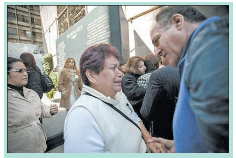
Authorities and family members take part in the ceremony to honour the victims of the explosion at the building of the headquarters of Mexico's state-owned oil firm Pemex that killed 37 people, in Mexico City, capital of Mexico, on 8 Feb, 2013.