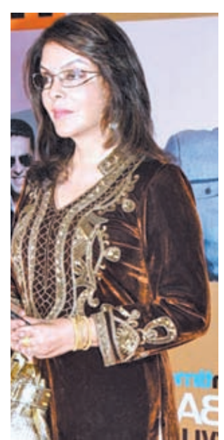
Zeenat Aman was recently rumoured to be dating and contemplating marrying a real-estate dealer.

actresses have been friends ever since they met on the sets of Flirting in 1991.