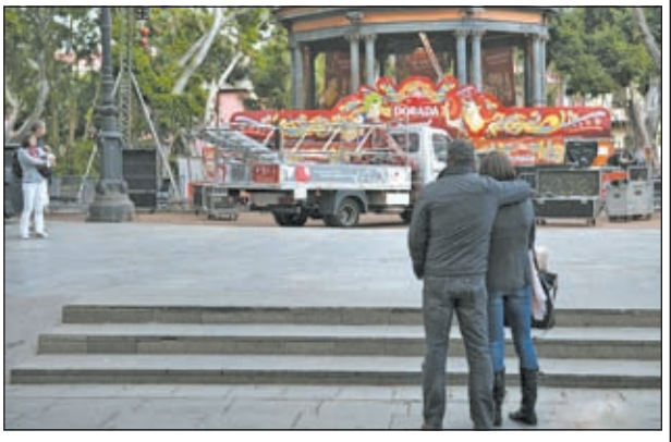
A stage for Santa Cruz carnival is stopped construction in Santa Cruz, Spain, on 8 Feb, 2013. The float parade and relevant events of Santa Cruz carnival is called off after a reveller was seriously burnt on 6 Februay.