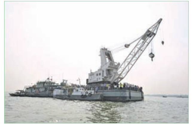
A rescue ferry is seen on the river Meghna after a ferry sank in Munshiganj on 8 Feb, 2013.

Unregulated and overcrowded ferries often run into trouble on low-lying Bangladesh's extensive network of rivers. Hundreds of people are killed in accidents every year despite government vows to crack down on unlicensed operators.