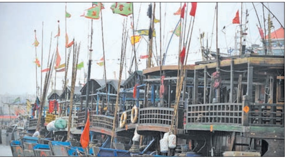
Cargo ships and fish boats stop at an anchorage in Haikou, capital of south China's Hainan Province, on 9 Feb, 2013. Fishermen and ship crew all went ashore and rushed back home to spend the Spring Festival with family members.