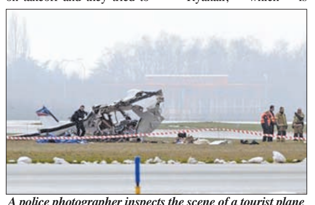
A police photographer inspects the scene of a tourist plane crash at Charleroi airport on 9 Feb, 2013.