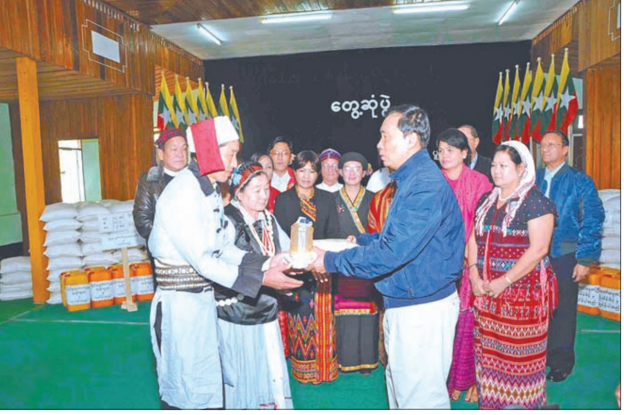
Pyithu Hluttaw Speaker Thura U Shwe Mann presents gifts to local people at Phonkanrazi Hall in Putao.