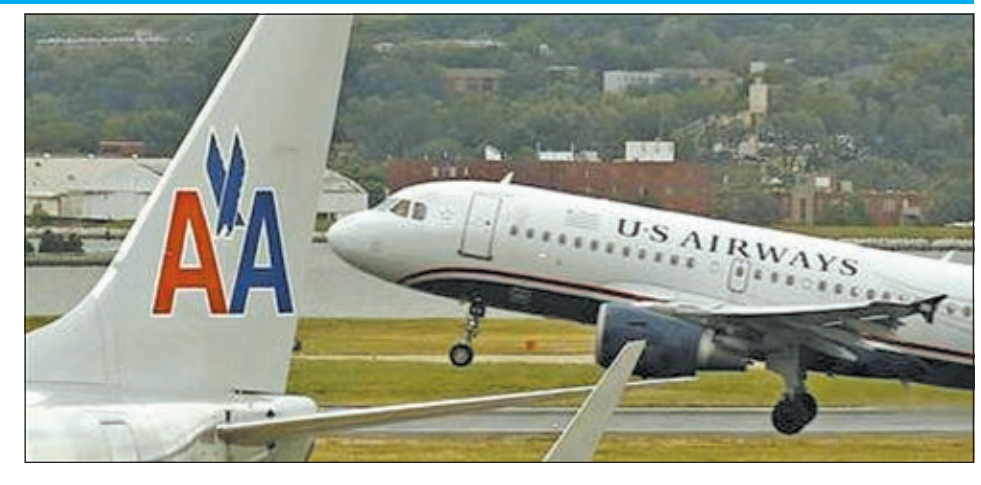
A US airways plane takes off behind an American Airlines jet at Ronald Reagan National Airport in Washington on 23 April, 2012.

mark the last combination of legacy US carriers, following the Delta-Northwest United-Continental mergers. The all-stock merger is expected to value the combined carrier at between $10.5 billion and $11 billion, and would give AMR creditors 72 percent of the ownership in the new company and US Airways shareholders the rest, they said.—Reuters