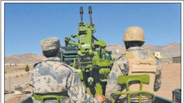
Afghan border police sit on their military vehicles during their training in border police headquarters in Herat Province in western Afghanistan on 9 Feb, 2013. The Afghan government and NATO Training Mission in Afghanistan (NTM-A) have stepped up efforts to train and equip Afghan police and army after NATO-led International Security Assistance Force (ISAF) handed over the security responsibilities to Afghan security forces, part of a process which will run through 2014 when Afghanistan takes over the full leadership of its own security duties.

The EU decided to dispatch hundreds of trainers to reinforce the capacity of the Malian army, following a request for support by the country's senior military officials, who wanted their soldiers to be well trained and equipped to fight against rebel groups in northern Mali.