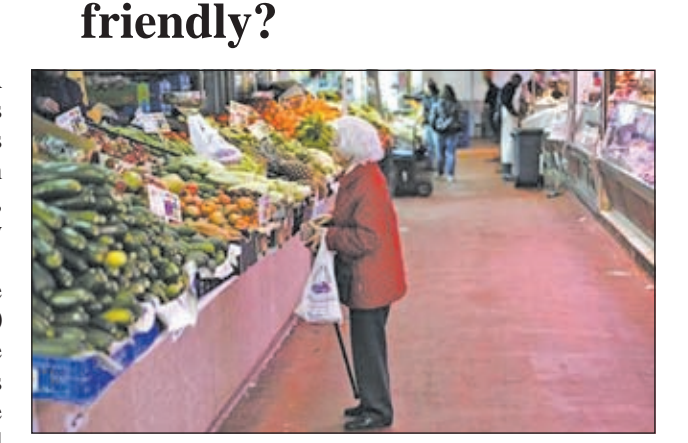
A woman looks at fruits and vegetables at a market stall in Madrid on 29 Jan, 2013.

Growing fruit and vegetables doesn't produce as much greenhouse gas as