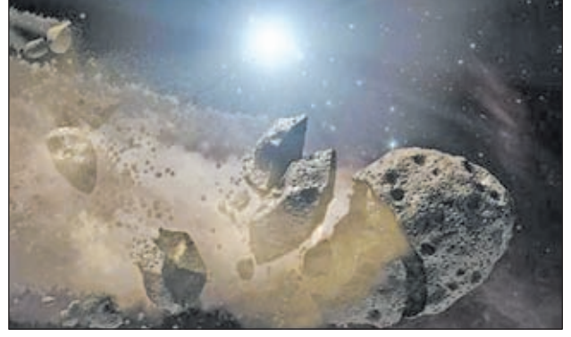
shows an artist's concept of a broken-up asteroid. Scientists think that a giant asteroid, which broke up long ago in the main asteroid belt between Mars and Jupiter, eventually made its way to Earth and led to the extinction of the dinosaurs.

asteroid's arrival, marked by a 110-mile-(180-km-) wide crater near Chicxulub, Mexico, and the dinosaurs' demise was believed to be as long as 300,000 years. The study, based on highprecision radiometric dating techniques, said the events occurred within 33,000 years of each other.