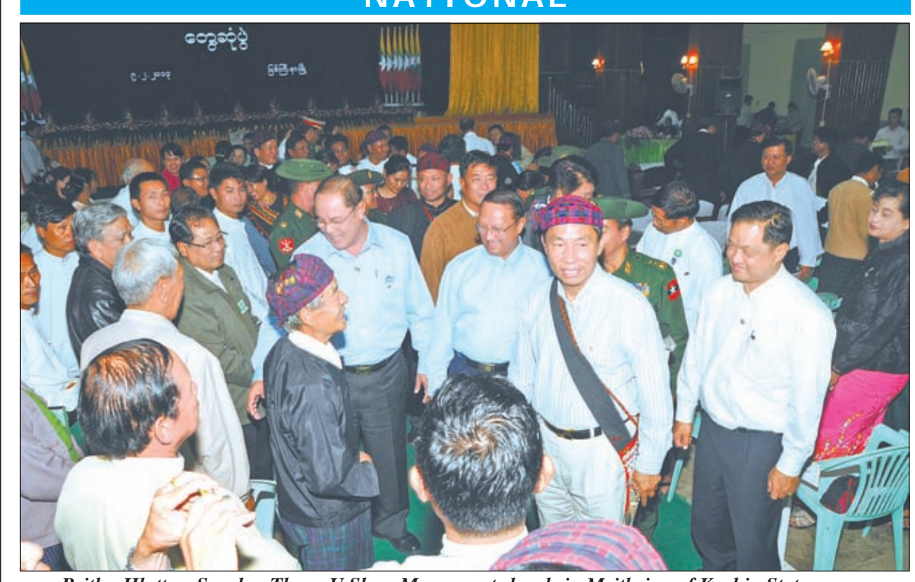
Pyithu Hluttaw Speaker Thura U Shwe Mann meets locals in Myitkyina of Kachin State.