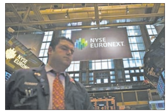
Traders work on the floor of the New York Stock Exchange in New York on 20 Dec, 2012

Traditionally, block trades were done on physical trading floors, they