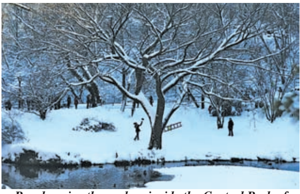
People enjoy themselves inside the Central Park of New York City, on 9 Feb, 2013. A massive blizzard dumped as much as three feet (one metre) of snow in parts of the Northeastern United States, leaving some 650,000 households and businesses without power and two dead by Saturday.

ing of commercial flights between Mogadishu and Beledweyne, the regional capital of Hiiran and between Mogadishu and the southern port City of Kismayo in December 2012.