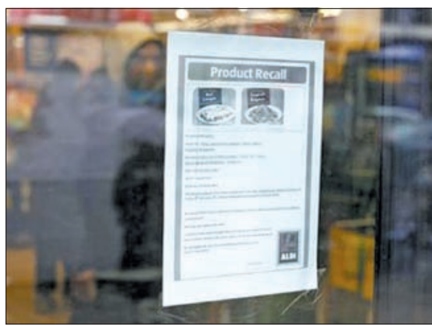
A recall notice for frozen meals which had tested positive for horse meat is seen at an Aldi supermarket in northwest London on 9 Feb, 2013.