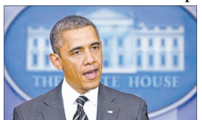
US President Barack Obama speaks from the briefing room of the White House in Washington on 5 Feb 2013.

Washington, 10 Feb— President Barack Obama will describe his plan for spurring the economy in his State of the Union address on Tuesday, offering proposals for investments in infrastructure, manufacturing, clean energy and education, a senior administration official said on Saturday.