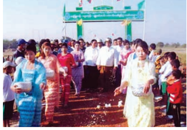
long and 10 feet wide and built DAC with the contribution by Nyaunglebin Township of K 21.2 million.— NLM

The Bago Region Hluttaw representative and officials formally opened the new road which is 3040 feet