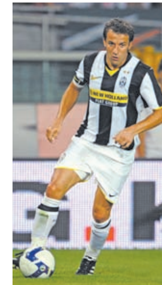
Former Juventus star Alessandro Del Piero

"This is new for me, different," said the Italian 2006 World Cup winner. "I'm involved with a team which has a big challenge ahead.Our start hasn't been good due to injuries and the