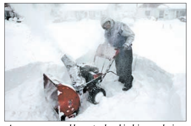
A man uses a snowblower to clear his driveway during a blizzard in Medford, Massachusetts on 9 Feb, 2013.