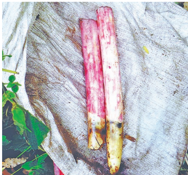
Ivory tusks seized from poachers.

Likewise, an elephant was found killed near Kyaukpya Village, in Taunggalay Village-tract in