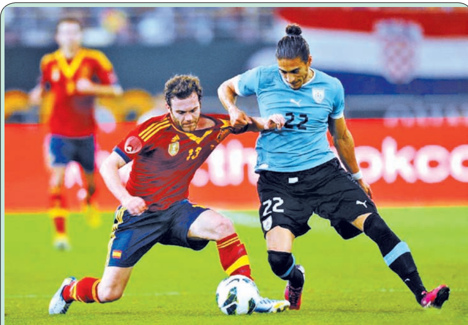
Juan Mata (L) of Spain vies with Martin Caceres of Uruguay during an international friendly soccer match between Spain and Uruguay in Doha, Qatar, on 6 Feb, 2013. Spain won 3-1.