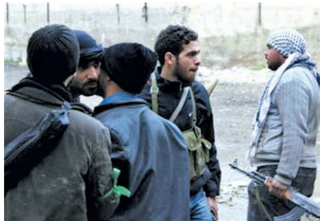
Free Syrian Army members greet each other after heavy fighting between the Free Syrian Army and President Bashar al-Assad's forces, in the Jobar area of Damascus on 6 Feb, 2013.

"The heaviest fighting is taking place in Jobar because it is the key to the heart of Damascus," he said. Assad, battling to crush a 22-month-old uprising in which 60,000 people have died, has lost control of large parts of the country but his forces, backed by air power, have so far kept rebels on the fringes of the capital. Despite the setbacks, Assad has remained defiant, telling a visiting senior Iranian official on Sunday that Syria was able to confront "current threats ... and aggression". That visit came just after Iranian Foreign Minister Ali Akbar Salehi met Syrian opposition leader Moaz Alkhatib in Moscow.—Reuters