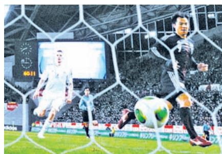
Shinji Okazaki (9) scores his second and Japan’s third goal during the second half of a friendly against Latvia in Kobe on 6 Feb, 2013. Japan won 3-0 ahead of a World Cup qualifier in March away to Jordan.

KOBE, 7 Feb—Shinji Okazaki struck twice as Japan made a winning start to 2013 with a comprehensive 3-0 victory over Latvia on Wednesday in a tune-up for next month’s crunch World Cup qualifier away