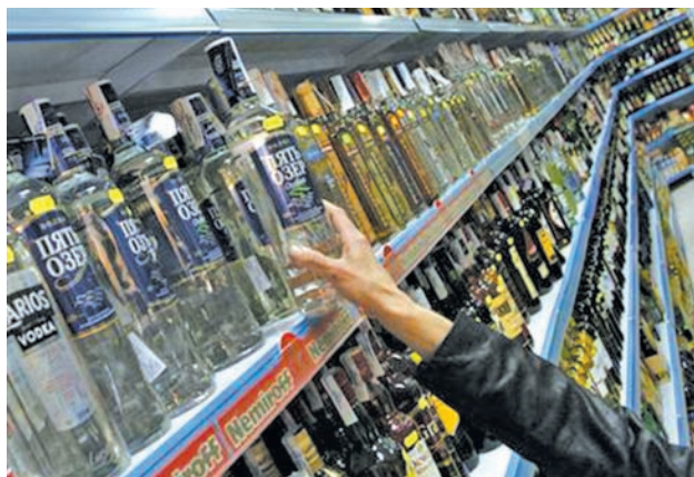
A customer takes a bottle of vodka from a shelf at a Russian supermarket in Benidorm, on 26 Nov, 2012.