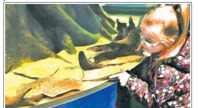
A girl looks at a swimming ray at Vancouver Aquarium in Vancouver, Canada, on 6 Feb, 2013. The Secret World of Sharks and Rays exhibition showcased different rare species of the ocean animals to boost the awareness of protecting endangered marine life.—XINHUA

India became the world's biggest arms importer in recent years. It plans to spend 120 billion US dollars by 2017, on new defence acquisitions, which will make India the third largest defense spender after the US and China.—Xinhua