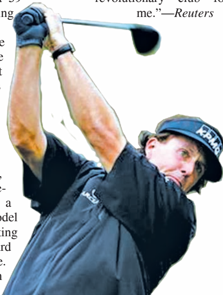
U.S. golfer Phil Mickelson hits off the 11th tee of the north course at Torrey Pines during first round play at the Farmers Insurance Open in San Diego, California on 24 Jan, 2013.

the same golf swing as my irons. It really could be a revolutionary club for me.”—Reuters