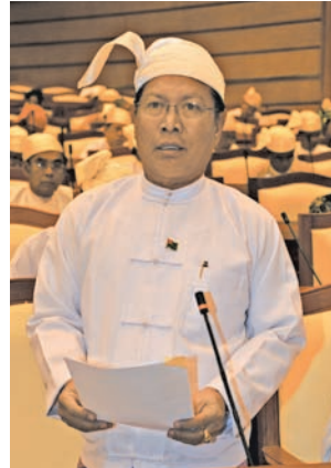
Thura U Aung Ko of Kanpetlet Constituency submits proposal.

the proposal on promulgating a law to ensure and protect standard fundamental rights