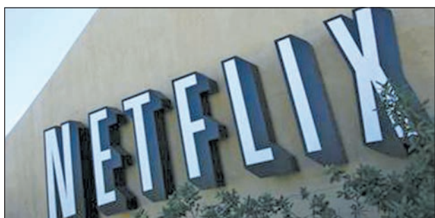
The headquarters of Netflix is shown in Los Gatos, California on 20 Sept, 2011.