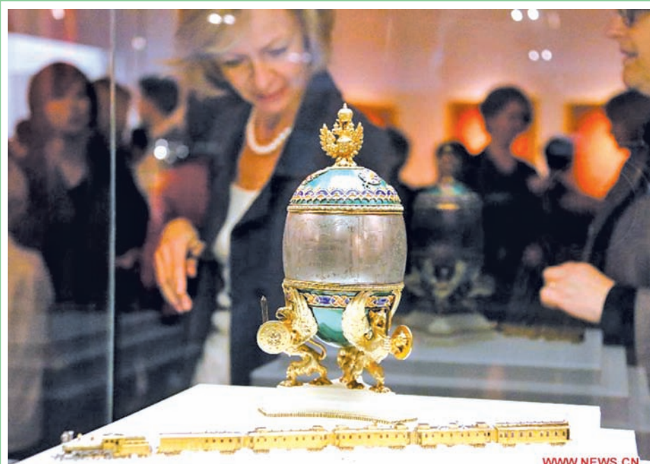
A visitor looks at an Easter egg presented on the exhibition of "Fabergé: Legacy of Imperial Russia" in the Hong Kong Heritage Museum in south China's Hong Kong, on 6 Feb, 2013. The exhibition features the achievements of the jewellery industry of Russia from the 19th to the 20th centuries, and Peter Carl Fabergé (1846-1920) is the most successful jeweller of the period.