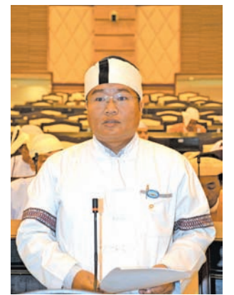
U Zong Hle Htan of Chin State Constituency No. (2) submits a proposal.—MNA

Deputy Minister for Immigration and Population U Win Myint proposed the Hluttaw to approve the proposal and U Soe Win from Ayeyawady Region Constituency No. (2) seconded the proposal. The bill was approved as amended.