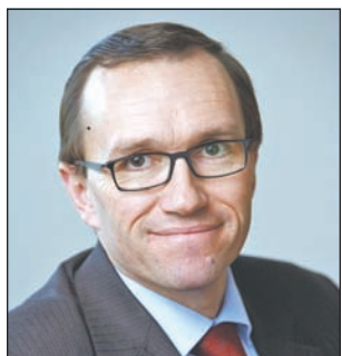
Minister of Foreign Affairs of Norway Espen Barth Eide.

NAY PYI TAW, 7 Feb—The Ministry of Foreign Affairs of Norway issued a statement that the Myanmar government has reached an agreement with KIO on 4 February.