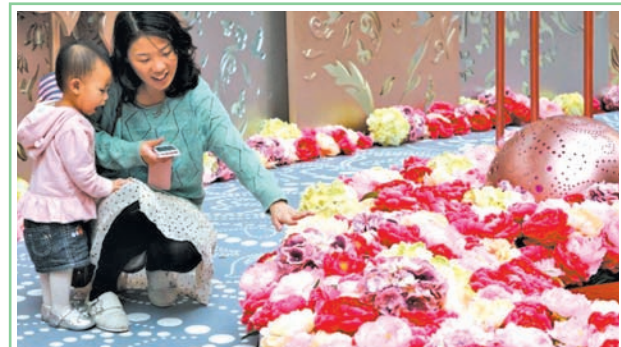
A woman and her child look at flower settings in a shopping mall in south China's Hong Kong, on 6 Feb, 2013. As the Spring Festival draws near, many shopping malls in Hong Kong started using flowering settings to create the festival atmosphere. The Spring Festival, or the Chinese lunar New Year, falls on 10 February this year.