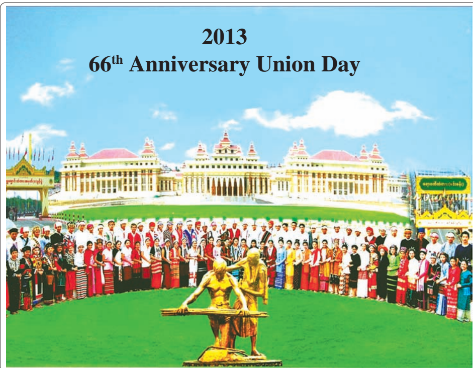
2013 66 th Anniversary Union Day