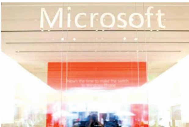
The interior of a Microsoft retail store is seen in San Diego on 18 Jan, 2012.

Boscovich told Reuters that he had "a high degree of confidence" that the operation had succeeded in bringing down the cyber crime operation, known as the Bamital botnet. "We think we got everything, but time will tell," he said. The servers that were pulled off line on Wednesday had been