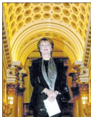
British television chef Delia Smith arrives at a reception hosted by Britain's Queen Elizabeth II and the Duke of Edinburgh to pay tribute to the contribution of more than 400 pioneers to British life at Buckingham Palace in London, on 13 Oct, 2003.

The chef said she is still passionate about teaching people how to cook in a no-nonsense style but she wanted to work online with her followers who have coined the phrase "doing a Delia" to refer to preparing one of her recipes. "This is the future for me and the population. It's miles ahead. If you do a TV program now, it's got to entertain," Smith was quoted by the Telegraph