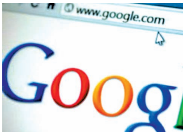
Google to buy e-commerce firm Channel Intelligence for 125 mln USD.—XINHUA

of Florida, Channel Intelligence provides technology to other companies to drive product sales online. According to information posted on its website, Channel Intelligence has been working with over 850 retailers worldwide and drives 2 billion dollars in sales online annually in computing, home improvement, appliances, consumer electronics, toys and other goods.—Xinhua