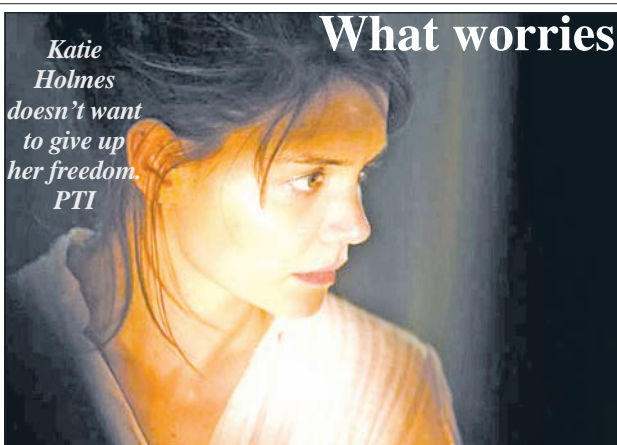
Katie Holmes doesn't want to give up her freedom.

NEW DELHI, 7 Feb—Katie Holmes is worried about dating again. The former Dawson's Creek actress has been single since splitting from ex-husband Tom Cruise last June and while she is keen to start seeing new guys, she doesn't want to lose her new-found freedom. A source said: "Katie's in a dilemma, because