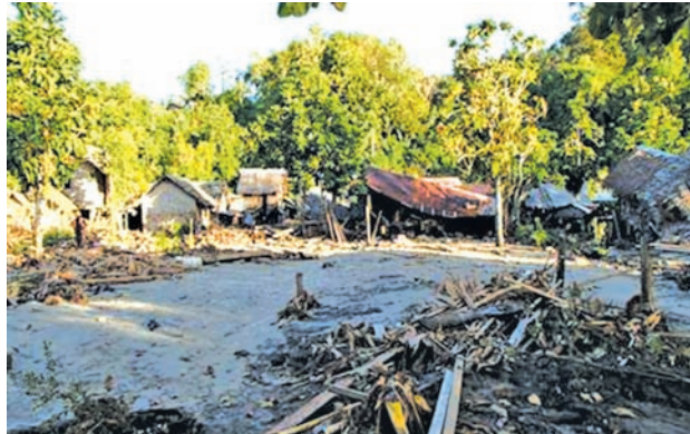
Partially destroyed houses are seen after a tsunami hit in the Venga village in Solomon Islands in this picture provided by World Vision on 6 Feb, 2013.

HAWAII, 7 Feb—A powerful 8.0 magnitude earthquake set off a tsunami that killed at least five people in a remote part of the Solomon Islands on Wednesday and triggered evacuations across the