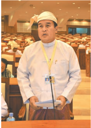
Deputy Minister for Sports U Thaung Htaik responds to questions.

NAY PYI TAW, 7 Feb—Six questions were raised and one proposal submitted at today's Pyithu Hluttaw Session.