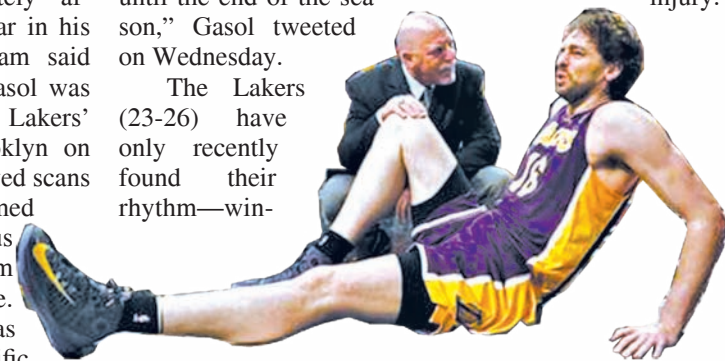
Los Angeles Lakers’ Pau Gasol sits on the floor with a member of the Lakers medical staff after suffering an injury to his right leg in the fourth quarter of their NBA basketball game against the Brooklyn Nets in Brooklyn, New York, on 5 Feb, 2013.

three games while nursing a shoulder ailment, and can hardly afford another injury.