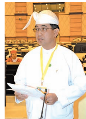
Union Minister for Rail Transportation U Zeyar Aung answering questions.—MNA

U Naing Tun Ohn of Mon State Constituency No (5) asked whether there is any plan to prohibit under-age driving. Union Minister for Rail Transportation U Zeyar Aung replied that 85 percent of the total number of licensed vehicles at present in Myanmar is motor bikes. Those who have attained the age of 16 are given licenses to ensure that students can ride motor bikes, the major mode of transportation for