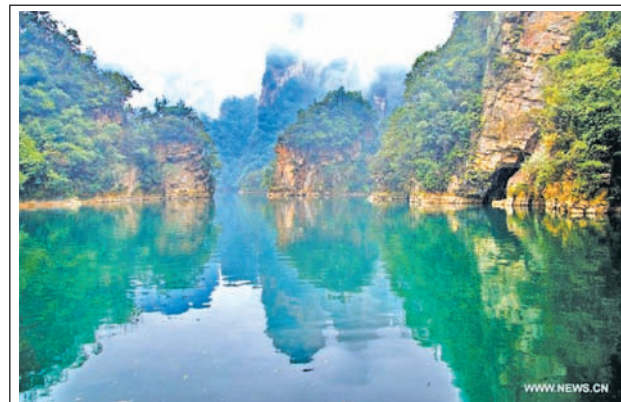
Photo taken on 1 Feb, 2013 shows the scenery of the Baofeng Lake scenic spot in Zhangjiajie City, central China's Hunan Province.