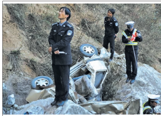
Policemen inspect the site of road accident in Wumeng Township under an industrial and tourist development zone near Kunming, capital of Yunnan, on 6 Feb, 2013. Twelve people were killed and three others injured after a vehicle fell off a mountain cliff in Yunnan Province on Wednesday afternoon.