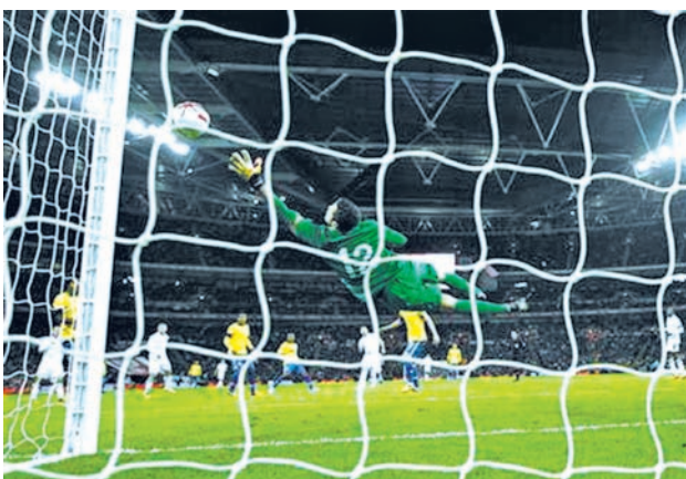
England's Frank Lampard (C) scores past Brazil's goalkeeper Julio Cesar during their international friendly soccer match at Wembley stadium in London on 6 Feb, 2013.

"If he does follow David (Beckham) and goes further afield it complicates things but it doesn't necessarily mean your career ends. "But he of course he understands that the further afield you go the more problematic it does become for him and for the media to follow you and the national team manager." With Arsenal's Jack Wilshere producing a classy midfield display alongside Steven Gerrard, Lampard's place in the starting team is no longer assured but as he proved his eye for goal is undiminished.—Reuters