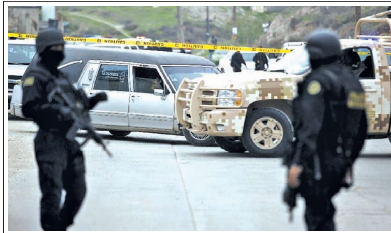
Policemen guard the site where an officer was killed by an alleged drug dealer when he tried to stop him in the city of Tijuana, Mexico, on 5 Feb, 2013.

Morsi, belonging to Muslim Brotherhood party, became Egypt's President in 2012 a year after the Arab Spring toppled Hosni Mubarak who had ruled the country for over three decades.—Xinhua