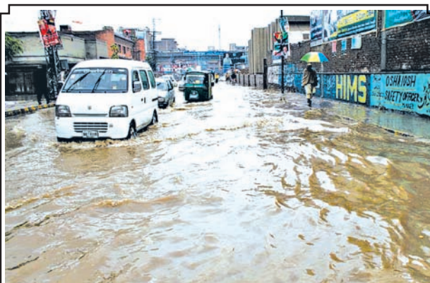
Vehicles run on a flooded street in northwest Pakistan's Peshawar on 6 Feb, 2013. At least 17 people were killed, 31 injured and many others displaced after moderate to heavy rainfall lashed several areas of Pakistan over the last 72 hours, local TV Dunya reported on Tuesday.

As of end 2011, security officials pegged the strength of the NPA at 4,043 men. The NPA, the armed wing of the Communist Party of the Philippines-National Democratic Front, has been waging war against the government for over four decades.—Xinhua