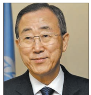
UN Secretary General Mr Ban Ki-moon.