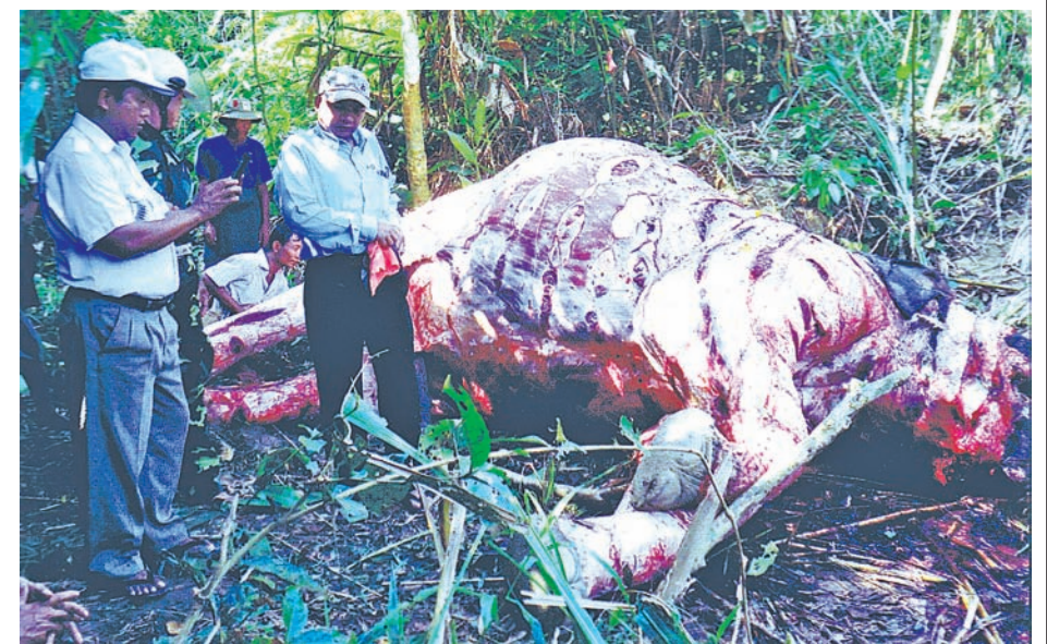
Dead body of an elephant after removing skin.

An agreement was reached at the ministerial level