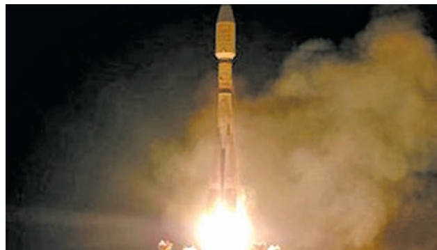
Russia launches six communication satellites with Soyuz rocket.

The government also wants to expand the network of laboratories at state universities, Raupp added, saying that "the federal university system is expanding and we need to equip labs, (and students) need to learn by doing experiments, using laboratories." Meanwhile, the National Industry Confederation released a statement Wednesday describing 2012 as "a lost year" for a 2.7-percent slip in Brazil's industrial production, which grew 10.5 percent in 2010 and a scant 0.4 percent in 2011.— Xinhua