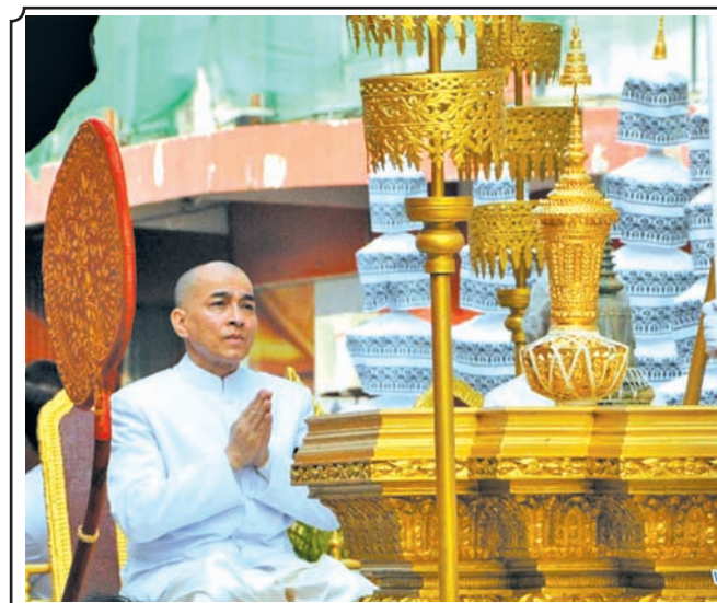
Cambodian King Norodom Sihamoni escorts the ashes of late King Father Norodom Sihanouk during a procession in Phnom Penh, Cambodia, on 7 Feb, 2013. A week-long royal funeral of Cambodia's late King Norodom Sihanouk came to an end on Thursday when part of his cremains were taken from the cremation site to keep in the royal palace in a procession.