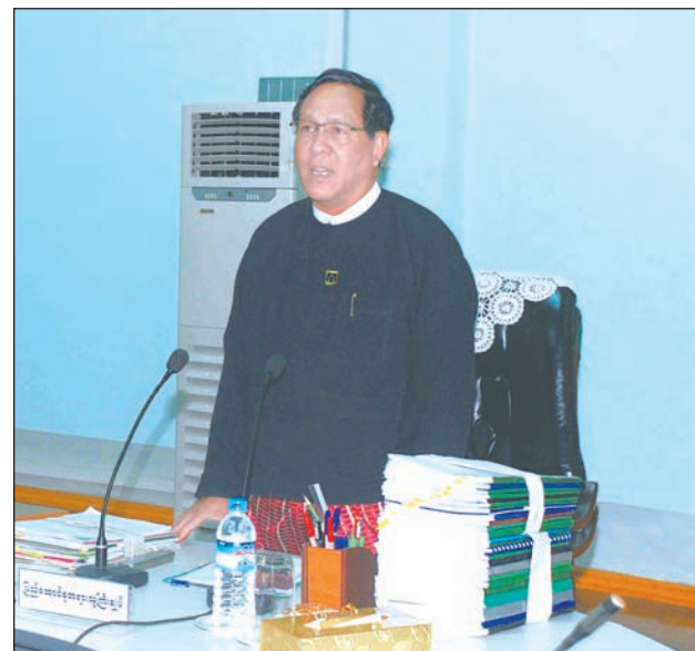
Present at the meeting were judges of the supremecourt, chief judges of region/state high courts, region/state judicial officers and district court judges. The meeting concludes tomorrow.—MNA

NAY PYI TAW, 7 Feb—Chief Justice of the Union U Tun Tun Oo called for making rational decision based on virtue, probity and expertise in jurisdiction at the fourth coordination meeting of the Supreme Court of the Union with region/state high courts and district courts at the meeting hall of the Supreme Court here yesterday morning. He called for logical consistency in making judgement of a case, urging them to cultivate moral courage to resist outside influences. He demanded emergence of reliable jurisdiction in line with principles embodied in Bangalore Principles of Judicial Conduct.