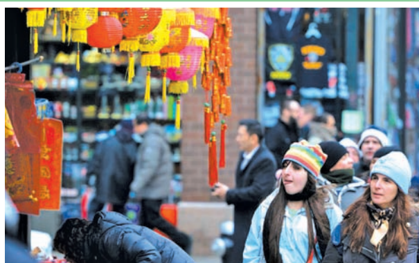
Local residents look at the traditional decorations for the upcoming Chinese Lunar New Year in China Town, New York, the United States, on 6 Feb, 2013. The Chinese Lunar New Year, or Spring Festival, starts on 10 February this year.

During the meeting, the Secretary-General shared with the CPR his perspectives on the progress and challenges in ASEAN Community building efforts in the ASEAN Political-Security Community (APSC), the ASEAN Economic Community (AEC) and the ASEAN Socio-Cultural Community (ASCC). The secretary general and CPR also agreed to hold frequent and regular consultations in order to enhance their coordination and cooperation. The CPR expressed their full support and cooperation to assist the secretary general throughout his tenure.—Xinhua