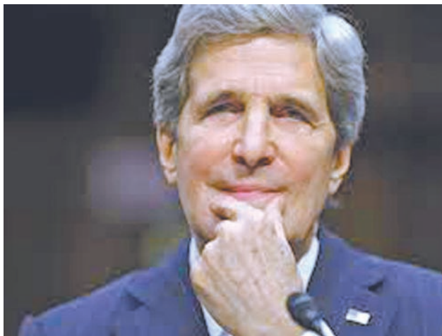
US Secretary of State John Kerry

WASHINGTON, 7 Feb—John Kerry on Wednesday vowed to resolve conflicts by peaceful means in the first place as he was publicly sworn in as the US secretary of state.