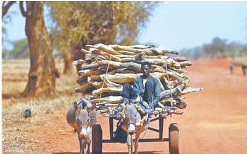
A Malian transports wood with a donkey cart on the road between Timbuktu and Douentza on 4 Feb, 2013.

Earlier Wednesday, Fabius said France will start to withdraw its troops from Mali in March. “We will continue to act in the north where some terrorist havens remain. I think that from March, if everything goes according to plan, the number of French troops should decrease,” the top diplomat told the free daily Metro .