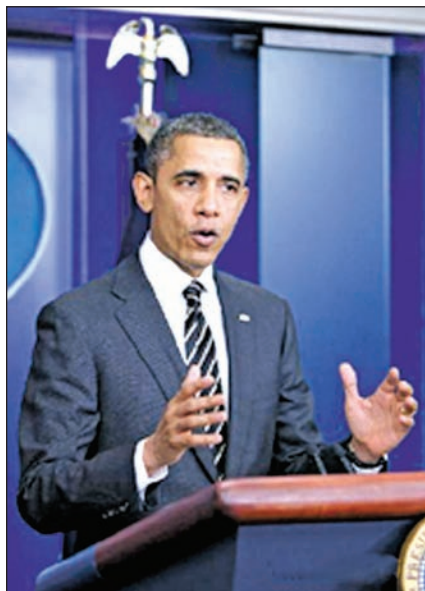
US President Barack Obama briefs press at the White House in Washington DC on 5 Feb, 2013. Obama on Tuesday urged Congress to delay massive government spending cuts in the near term, saying government budget policies will have effects on US economic growth. XINHUA

WASHINGTON, 6 Feb—US President Barack Obama on Tuesday urged Congress to delay massive government spending cuts in the near term to boost economic growth despite the spiking government debt, adding twists to the government's debt reduction efforts.