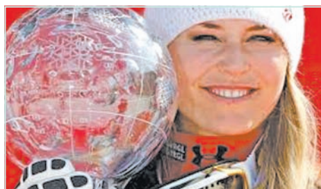
American Lindsay Vonn

and crashed into a safety gate as she landed on the side of her ski. She was