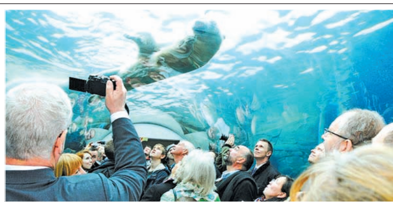
People watch a polar bear as they visit the newly inaugurated Arctic Circle at the Copenhagen Zoo in Copenhagen, Denmark, on 5 Feb, 2013.

whether any arms or documents were seized during the raid. Police Brigadier Lindela Mashigo told Xinhua that the South African Police Service's Counter Terrorism Unit was involved in an intelligence collection initiative focusing on the alleged rebel activities. The 19 suspects being charged with transgressing the Foreign Military Assistance Act will appear in court on Wednesday.—Xinhua