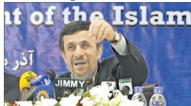
Iran's President Mahmoud Ahmadinejad speaks during a media conference at Iran's embassy after he attended the Developing-8 summit in Islamabad on 22 Nov, 2012.

DUBAI, 6 Feb—President Mahmoud Ahmadinejad said on Monday he was ready to be the first human sent into orbit by Iran's fledgling space programme, Iranian media reported. Iran declared last week that it had successfully launched a monkey into space and retrieved it alive, which officials hailed as a major step towards their goal of sending humans into space. The launch added to Western concerns about Iran's space programme because the same rocket technology could potentially be used to deliver a nuclear warhead on a ballistic missile. "I am ready to be the first human to be sent to space by Iranian scientists," Ahmadinejad said on Monday, on the sidelines of an exhibition of space achievements in Teheran, according to the Mehr news agency. "Sending living things into space