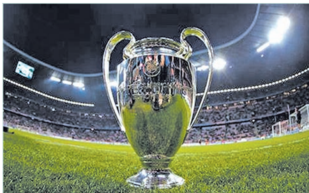
The trophy for the UEFA Champions League is seen on the pitch prior to the Champions League quarter-final second leg soccer match between Bayern Munich and Olympique Marseille in Munich, on 3 April, 2012.