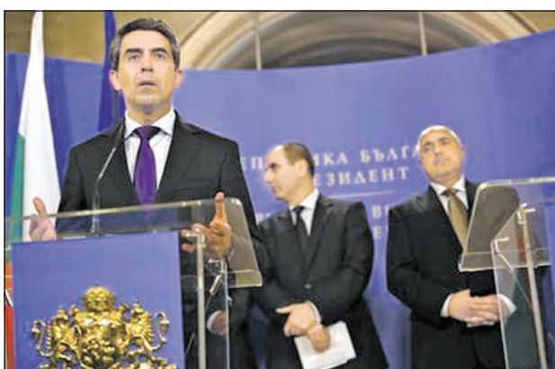
Bulgarian President Rosen Plevneliev (L) speaks during a joint news conference with Prime Minister Boiko Borisov (R) and Interior Minister Tsvetan Tsvetanov in Sofia on 5 Feb, 2013.

"What can be established as a well-grounded assumption is that the two persons whose real identity has been determined belonged to the military wing of Hezbollah." Israel blamed the attack in Burgas, which killed five Israeli tourists, their Bulgarian driver and the bomber, on Iran and Hezbollah, a