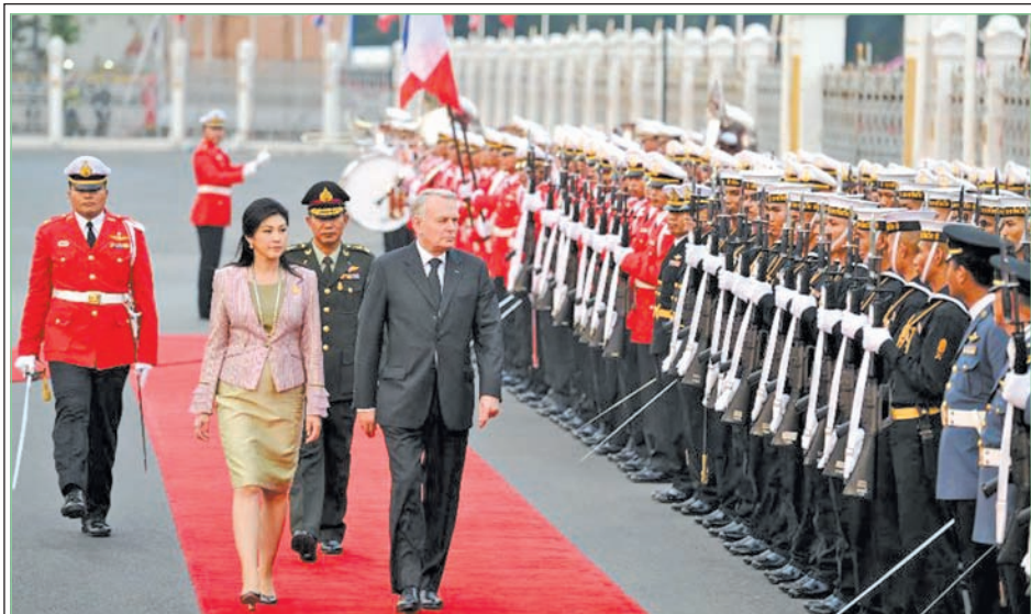
Thai Prime Minister Yingluck Shinawatra (L, front) and French Prime Minister Jean-Marc Ayrault (R, front) review the guard of honour during a welcoming ceremony at the Government House in Bangkok, capital of Thailand, on 5 Feb, 2013.