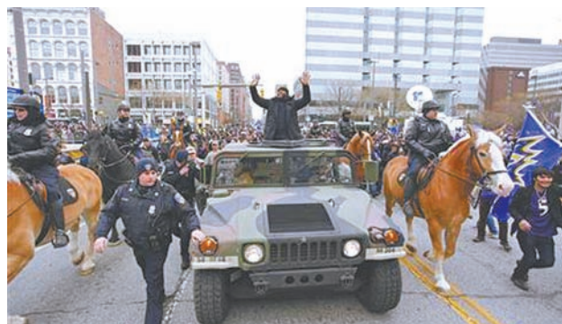
Baltimore Ravens retiring linebacker Ray Lewis waves to fans on the team's parade route in Baltimore, Maryland on 5 Feb, 2013.

Super Bowl Most Valuable Player Joe Flacco, who has been on the talk-show circuit and at Disney World in Florida since the game, told the stadium crowd, "Baltimore, we did it!" "Super Bowl champs, baby," he said.—Reuters