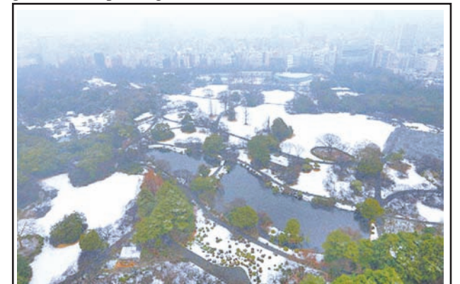
Photo from a Kyodo News helicopter shows Shinjuku Gyoen National Garden in Tokyo covered by snow on 6 Feb, 2013.

The UN Political Office in Somalia (UNPOS) last week said it was concerned over the handling of the pre-trial phase, particularly the prolonged detention of the accused and the lacked legal counsel until recently which UNPOS said could “negatively impact on the conduct of the judicial proceeding.”—Xinhua