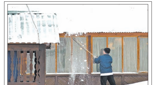
A man cleans snow from the roof of his house in Moscow, capital of Russia, on 5 Feb, 2013. A heavy snowfall hit Moscow on Sunday.