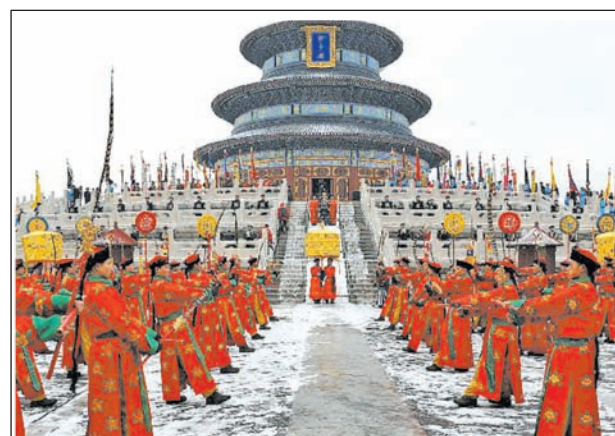
Performers dressed in costumes of the Qing Dynasty (1644-1911) act during a rehearsal of a performance presenting the ancient royal ritual to worship heaven at the Temple of Heaven in Beijing, capital of China, on 5 Feb, 2013. The Temple of Heaven, used to be the imperial sacrificial altar in ancient China, will witness the heaven worship performance during the upcoming Spring Festival holiday. The Spring Festival, or the Chinese Lunar New Year, falls on 10 February this year.