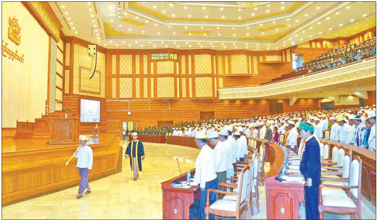
15 th day session of Pyithu Hluttaw in progress.—MNA

Deputy Minister for Home Affairs Chief of Myanmar Police Force Brig-Gen Kyaw Kyaw Tun and Deputy Attorney-General U Tun Tun Oo discussed