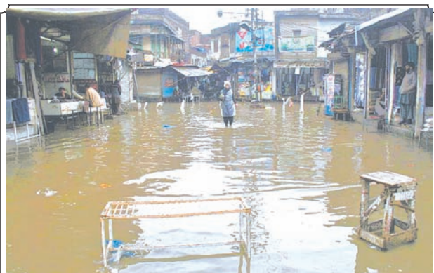
A man walks on a flooded street in northwest Pakistan's Peshawar on 6 Feb, 2013. At least 17 people were killed, 31 injured and many others displaced after moderate to heavy rainfall lashed several areas of Pakistan over the last 72 hours, local TV Dunya reported on Tuesday.

"The only way on my last ride to repay Baltimore to give back for all the