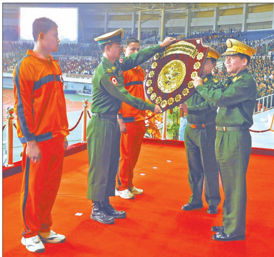
Vice-Senior General Min Aung Hlaing presents championship shield to Yangon Command team.

Chairman of Tatmadaw Sports and Physical Education Management Committee Adjutant-