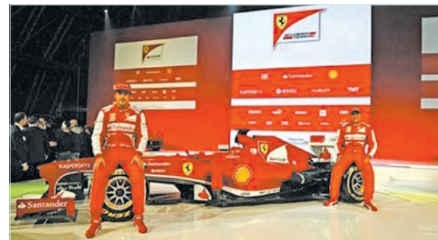
Ferrari Formula One driver Fernando Alonso (L) of Spain and Felipe Massa of Brazil pose near the new Ferrari F138 Formula One car is seen in this official undated handout image distributed by the Ferrari Press Office on 1 Feb, 2013.

because of bad weather. Just 36 of the 59 runners finished the race when the International Ski Federation (FIS) called an end and handed the gold to Slovenia's Tina Maze. Switzerland's Lara Gut took silver and Vonn's teammate Julia Mancuso bronze, but two favorites who raced immediately after Vonn both failed to finish in the tough conditions.—Xinhua