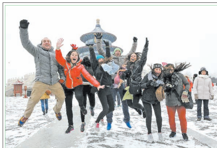
Foreign tourists pose for photo in front of the Hall of Prayer for Good Harvests in the Temple of Heaven in Beijing, capital of China, on 5 Feb, 2013.