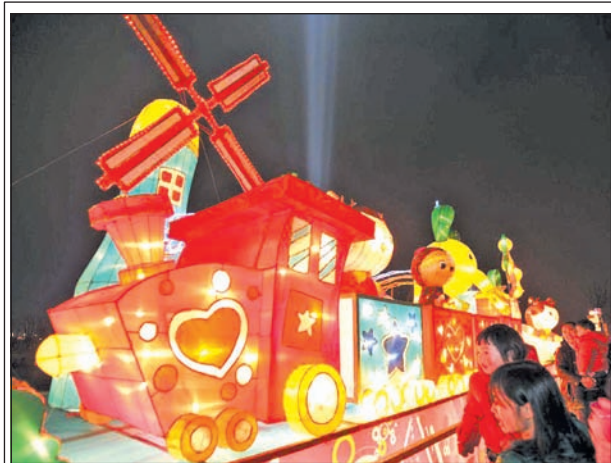
Visitors view festive lanterns during a lantern show in Changsha, capital of central China’s Hunan Province, on 5 Feb, 2013. The lantern show was held to greet the upcoming Spring Festival, or the Chinese Lunar New Year, which falls on 10 February this year.