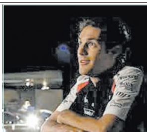
Brazilian driver Bruno Senna