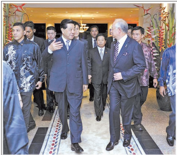
Jia Qinglin, chairman of the National Committee of the Chinese People's Political Consultative Conference, meets with Malaysian Prime Minister Najib Razak in Kuala Lumpur, Malaysia, on 5 Feb, 2013.