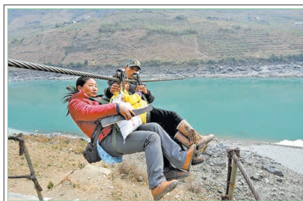
Residents from Shuangmidi Village cross the Nujiang River via a zip-line in Liuku County of Nujiang Lisu Autonomous Prefecture, southwest China’s Yunnan Province, on 2 Feb, 2013. More than 98 percent of Nujiang Lisu Autonomous Prefecture is occupied by mountains and valleys. The zip-lines have been quite popular transportation method along the Nujiang River since the ancient time. However, as transport conditions improve in recent years, a growing number of traditional zip-lines along the Nujiang River Valley have been dismantled or replaced by bridges.