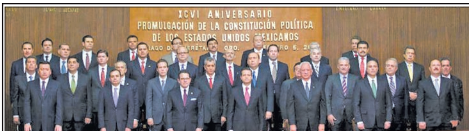
Image provided by Mexico’s Presidency shows Mexican President Enrique Peña Nieto (C Front) attending the commemoration ceremony of the 96th anniversary of the Mexican Constitution in Queretaro city, Mexico, on 5 Feb, 2013.