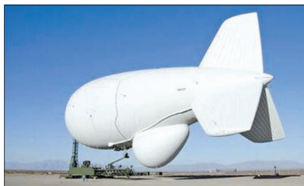
A Raytheon Joint Land Attack Cruise Missile Defence Elevated Netted Sensor System (JLENS) aerostat is pictured at the White Sands Missile Range, New Mexico, in this 24 Feb, 2012 photo obtained on 1 Feb, 2013.

The coming addition to the umbrella over Washington is known as Joint Land Attack Cruise Missile Defence Elevated Netted Sensor System, or JLENS. Raytheon Co is the prime contractor. "We're trying to determine how the surveillance radar information from