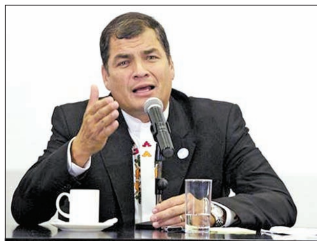
Ecuador's President Rafael Correa addresses the media during a bilateral summit in Cuenca on 23 Nov, 2012.

The incident occurred ahead of a campaign rally in Quinde, a town in the western Esmeraldas Province. The event was canceled following the attack and Correa suspended his campaign on Tuesday in solidarity with the victims.—Reuters