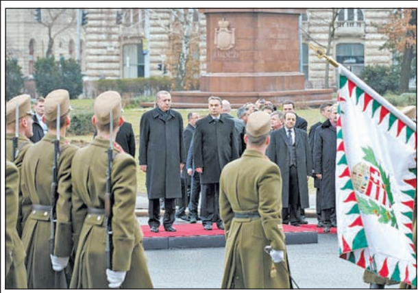
Visiting Turkish Prime Minister Recep Tayyip Erdogan (L) and his Hungarian counterpart Viktor Orban (R) inspect the guard of honor in Budapest, Hungary on 5 Feb, 2013. Erdogan is on a one-day official visit to Hungary.