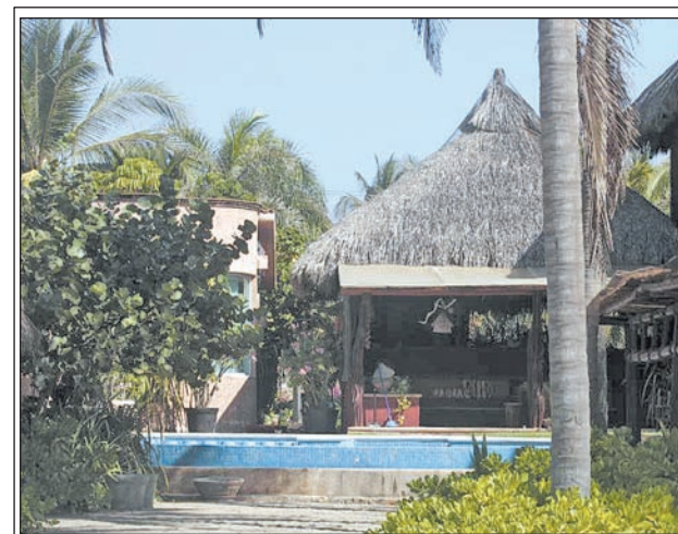
Photo taken on 5 Feb, 2013 shows the general view of the place where six Spanish woman tourists were raped by masked gunmen early Monday, in Barra Vieja, a resort in Acapulco, Guerrero state, south Mexico.—XINHUA