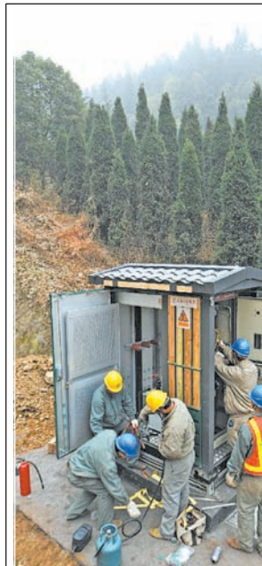
Electricians install electrical equipment at Liyushan Village in a remote mountain area in Yiwu City, east China's Zhejiang Province, on 4 Feb, 2013, as an effort to ensure power supply for villagers during the upcoming Spring Festival, which falls on 10 February this year.