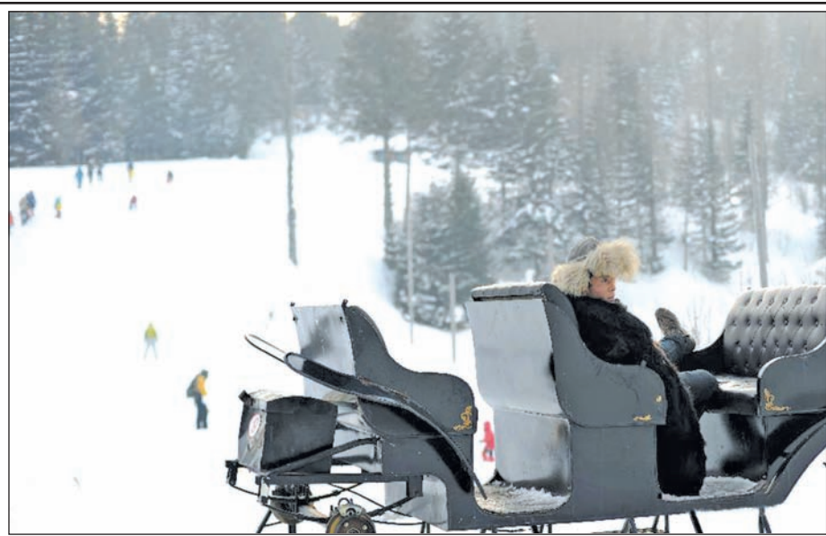
A coachman waits for tourists at the Shuangfeng Forest Farm in Mudanjiang City, northeast China’s Heilongjiang Province, on 2 Feb, 2013. The Shuangfeng Forest Farm, located in an intersection of two mountains, witnesses frequent snowfalls and is covered with snow for most of the year.