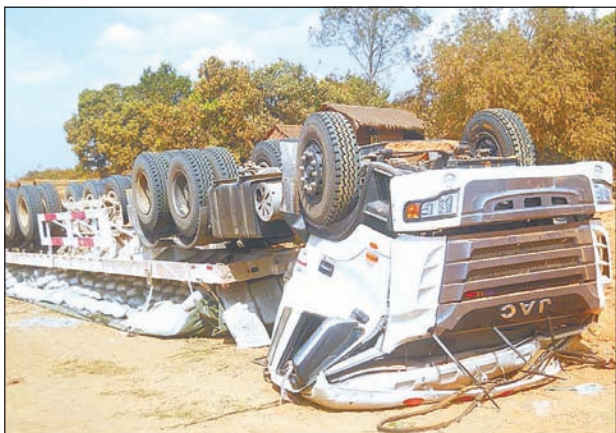
A truck with 33 tons of cement bags on its way from Kyangin Cement Plant to Nay Pyi Taw turns over on Pyinmana-Taungnyo concrete road near Maulay Village of Mingon Village-tract near Ottarathiri Township on 29 January.