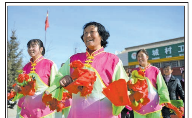
Villagers perform a folk dance to celebrate the coming Spring Festival in Haiyuan County, northwest China’s Ningxia Hui Autonomous Region, Feb. 5, 2012. The Chinese Lunar New Year, or Spring Festival, falls on 10 February this year.—XINHUA

Speaking to local news channel BFMTV, Le Drian drew a “positif stock” of French military operation after inflicting “heavy losses” on al-Qaeda-linked insurgents. “We reported one victim and three slight injuries but we have provoked many hundreds of dead (rebels) and heavy logistic and technical damage in camp trainings,” the minister said.—Xinhua