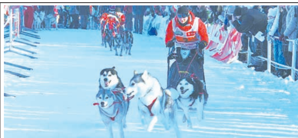
A participant competes during the third International dog sled race held at the suburbs of Minsk, Belarus, on 27 Jan 2013. About 150 participants from Belarus and neighbouring Russia, Latvia and Lithuania took part in the competition.