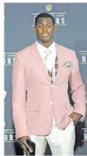
San Francisco 49ers Aldon Smith arrives for the Inaugural National Football League Honours at Super Bowl XLVI in Indianapolis, Indiana, on 4 Feb, 2012.

"There are so many great players on this team it really is an honour to get this award. To come here in my second year and get MVP, it means a lot to me," Smith told reporters. Al-