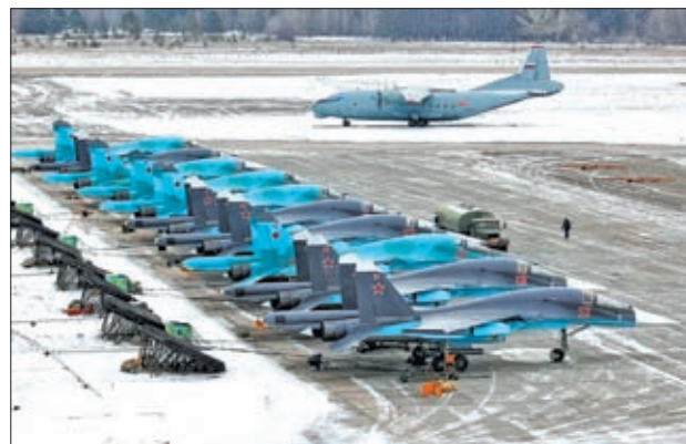
Five Su-34 frontline bombers will be deployed in an air base near the city of Voronezh in southwest Russia.