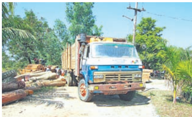
onboard the trucks escaped from the scene. Bawnatgyi Police Station opened files of lawsuit against illegal timber traffickers.

BAGO, 29 Jan—A team led by the Head of Township Forest Department, acting on tip-off, seized three trucks without number plates with the load of illegal square pieces of teak near mile post 49 near Wagadok on Yangon-Nay Pyi Taw Expressway in the area of Bawnatgyi Police Station in Bago Township at about 7 pm on 25 January.