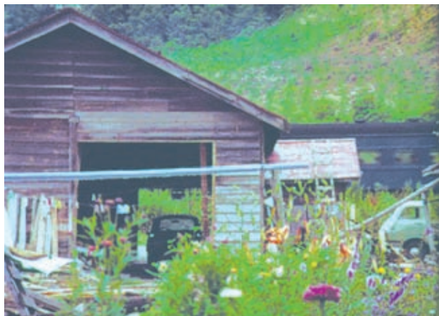
Films on death penalty to be screened in Tokyo. Supplied photo shows a clip from the 1969 documentary film “Serial Killer,” which will be screened in “Death Penalty Movie Week” in Tokyo from Feb. 2, 2013.