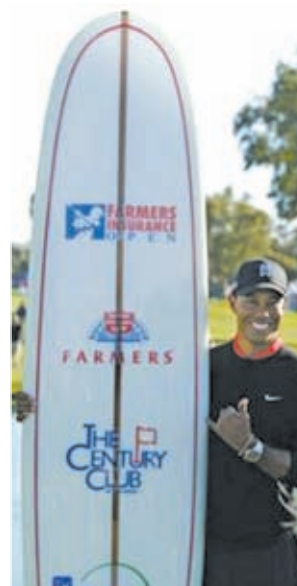
US golfer Tiger Woods poses with a surfboard as one of his prizes after winning the Farmers Insurance Open in San Diego, California on 28 Jan, 2013.

The 14-times major champion briefly moved eight ahead before his unexpected stumble in increasingly difficult conditions over the four-hole stretch from the 14th but he parred the last to post a 14-under total of 274. Defending champion Brandt Snedeker dropped one shot in the five holes