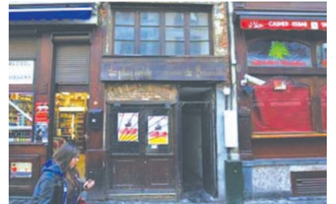
A woman walks past the smallest house in Brussels (C) on a street just off Brussels' main square on 22 Jan, 2013.

It is not Europe's narrowest however, which tourist officials in Slovakia believe could be a 1.3 metre wide house in its capital Bratislava. The Brussels house, squeezed between a pizzeria and a souvenir shop, has floors each of