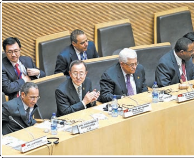
UN Secretary-General Ban Ki-moon (2nd L, front) and Palestinian President Mahmoud Abbas (3rd L, front) attend the opening ceremony of the 20th African Union (AU) summit in Addis Ababa, Ethiopia, on 27 Jan, 2013. The 20th AU summit opened on Sunday in Addis Ababa, as Africa leaders gathered to discuss prominent issues facing the continent.