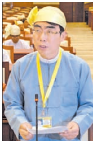
Deputy C & IT Minister U Thaung Tin responds to question.