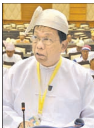
Deputy Health Minister Dr Win Myint replies to question.