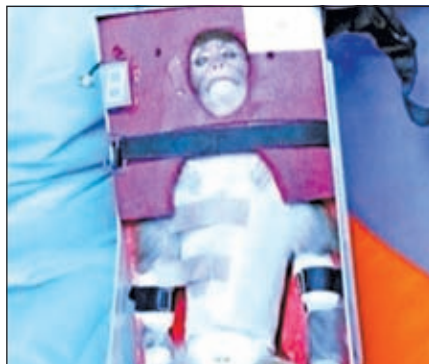
A still image from an undated video footage released on 28 Jan, 2013 by Iran's state-run English language Press TV shows a monkey that was launched into space.