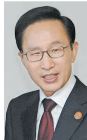
President Lee Myung Bak

SEOUL, 29 Jan — President Lee Myung Bak, whose term ends next month, granted special pardons on Tuesday to a long-time friend, close associates and others.