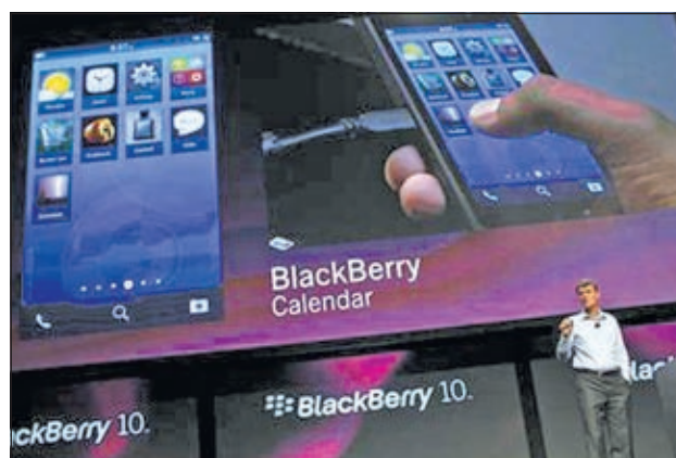
Research In Motion CEO Thorsten Heins displays features of the BlackBerry 10 during his keynote address during the BlackBerry Jam Americas in San Jose, California on 25 Sept, 2012.

"Until we start to see the devices sell to consumers, the stock will remain