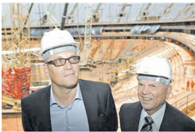
FIFA Secretary General Jerome Valcke (L) and Brazilian Football Confederation (CBF) President Jose Maria Marin visit the construction site of the National Stadium, which will host the 2014 World Cup, in Brasilia on 28 Jan, 2013.

BRASILIA, 29 Jan — With just 500 days to go until the 2014 World Cup kicks off in Brazil, soccer's world governing body FIFA warned that the hosts cannot afford any further delays in getting their venues ready. The global soccer tournament, followed by the Olympic Games in Rio de Janeiro two years later, will test Brazil's aspiration to become a developed nation. But delays in building stadiums and preparing hotels and airports to receive more than half a million soccer fans could turn the event into an embarrassment. In June