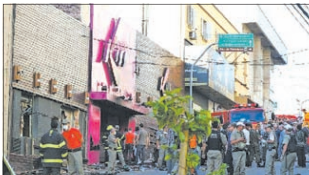
Rescue workers gather at the fire site in Santa Maria, southern Brazil, on 27 Jan 2013. A fire in a crowded nightclub in Santa Maria killed at least 245 people and injured more than 200 others on early Sunday, local television reports said.