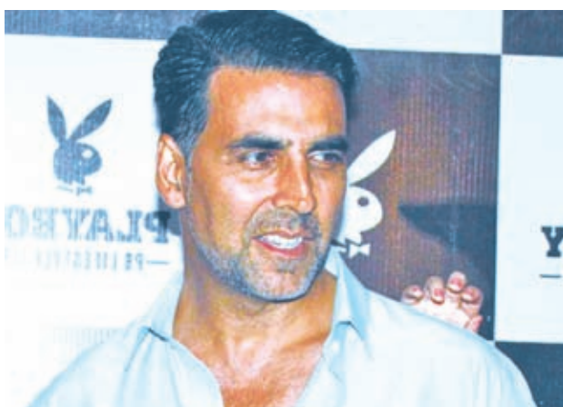
Akshay Kumar will next be seen in Special Chabbits.

Akshay, an avid sport follower, is the latest celebrity to back the ongoing HIL, saying that the event has the potential to change the face of the sport. “I am a sportsperson by heart and it is good to see world class hockey action across cities in the country. I have seen some of the matches and loved what I saw,” he had