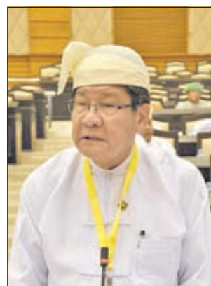
Deputy Agriculture and Irrigation Minister U Khin Zaw replies to queries.