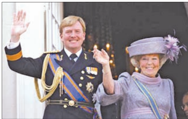
Netherlands' Queen Beatrix (R) and her son Crown Prince Willem-Alexander are seen waving to well-wishers from the balcony of the Royal Noordeinde Palace after opening the new parliamentary year in The Hague on this 15 April, 2011 file photo.