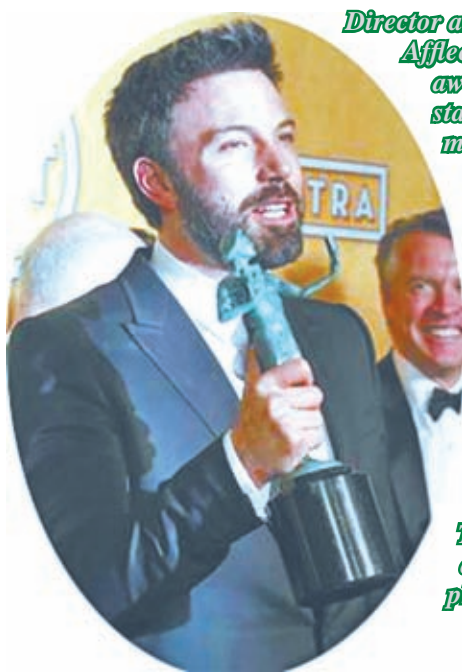
Director and actor Ben Affleck holds the award for outstanding performance by a cast in a motion picture for “Argo” at the 19th annual Screen Actors Guild Awards in Los Angeles, California on 27 Jan, 2013. In the background are Tate Donovan and Christopher Denham (R).

LOS ANGELES, 29 Jan—Iran hostage drama “Argo” won its second big award in two days on Sunday, boosting its chances of winning a best picture Oscar next month in a race that had been considered wide open.