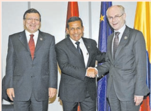
Peru’s President Ollanta Humala (C) poses for photographs with European Council President Herman Van Rompuy (R) and European Commission President Jose Manuel Barroso, during a Press conference marking the first summit of the Community of Latin American and Caribbean States (CELAC) and the European Union (EU) in Santiago, capital of Chile, on 27 Jan, 2013.

Europe remains the largest foreign direct investor in Latin America and the Caribbean, with 43 percent of the total, EU President Herman Van Rompuy told a