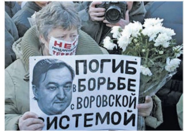
A woman holds a placard with a portrait of Sergei Magnitsky during an unauthorised rally in central Moscow on 15 Dec, 2012.

Relatives and former colleagues including Hermitage owner William Browder, who also faces trial in absentia, say Magnitsky was investigated and jailed by some of the same mid-level officials he told authorities had defrauded the state.