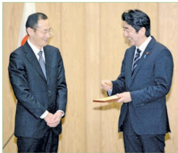
Japanese Prime Minister Shinzo Abe (R) holds the medal for the 2012 Nobel Prize in medicine won by Shinya Yamanaka (L) at the premier's office in Tokyo on 13 Jan, 2013.

The letter states that Yamanaka's receiving the Nobel Prize is a great contribution to the development of science. It was issued after the government unveiled earlier this month a plan to spend 110 billion yen over the next decade to promote regenerative medicine using iPS cell technology. "It's now our duty as researchers to (seriously) take this assistance and truly move forward (in iPS-related research)," Yamanaka told reporters after meeting the premier.