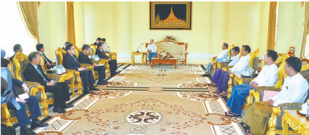
President U Thein Sein receives Chairman of National Policy Committee of National Assembly of ROK and Myanmar-Korea Economic Exchange Association Mr Kim Jung-hoon and party.

NAY PYI TAW, 29 Jan— President of the Republic of the Union of Myanmar U Thein Sein received a delegation led by Chairman of National Policy Committee of National Assembly of the Republic of Korea and Myanmar-Korea Economic