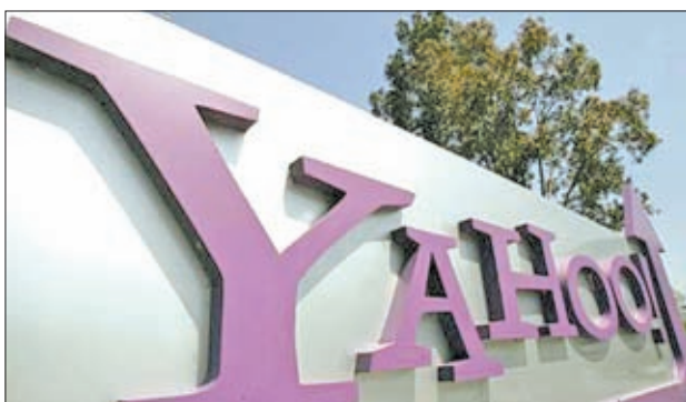
The headquarters of Yahoo Inc. is pictured in Sunnyvale, California in this file photo taken on 5 May, 2008.

NEW YORK, 29 Jan—Yahoo Inc forecast a modest uptick in revenue for the current year as it revamps its family of websites but Chief Executive Marissa