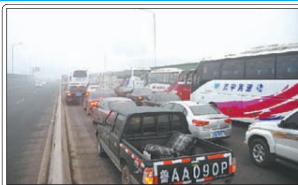
Vehicles queue outside an entrance of a highway in Jinan, capital of east China's Shandong Province, on 29 Jan, 2013. The province closed 186 highway entrances due to poor visibility as a result of foggy weather.—XINHUA

The two airlines are also planning "code-sharing" on JAL's Tokyo-Moscow services as well as S7's some other domestic flights in Russia, where the airlines sell seats on each other's flights as their own by adding their own flight numbers.—Kyodo News