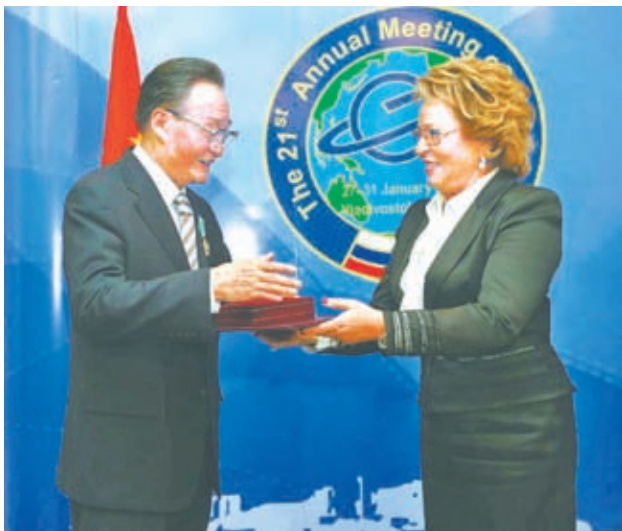
Wu Bangguo (L), chairman of the Standing Committee of the National People's Congress of China, is presented the medal "Order of Friendship" by Valentina Matvienko, chairwoman of Russia's Federation Council, on behalf of Russia's President Vladimir Putin, in Vladivostok, Russia, on 28 Jan, 2013.

VLADIVOSTOK, 29 Jan— Top Chinese legislator Wu Bangguo and senior Russian parliamentarian Valentina Matvienko pledged to strengthen bilateral ties during a meeting on Monday.