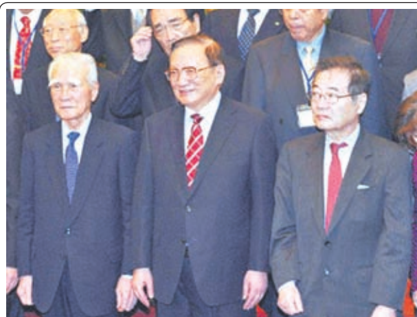
Former Japanese Prime Minister Tomiichi Murayama (front L), former Chinese State Councilor Tang Jiaxuan (front C) and Koichi Kato (front R), former secretary general of Japan's Liberal Democratic Party, attend a photo session in Beijing on 28 Jan, 2013.