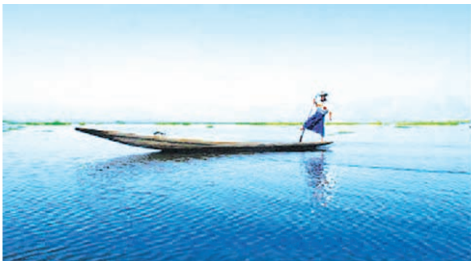
A leg-rower in search of Fish at Inlay Lake in Shan State.