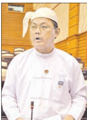
Dr Htay Win of Ayeyawady Region Constituency No.5 participates in discussion.—MNA

The 11 th day session of the Hluttaw continues tomorrow.—MNA