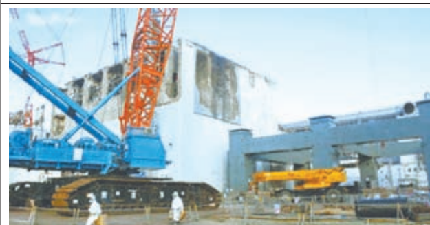
Photo shows the base of a crane facility (R) under construction at the Fukushima Daiichi Nuclear Power Station that will be used to remove spent fuel from the pool of the No 4 reactor building (L) in Fukushima Prefecture on 28 Jan, 2013.