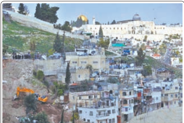
An Israeli army bulldozer uproots trees in the eastern Jerusalem's Arab neighbourhood of Silwan on 28 Jan, 2013. Nine people were injured and seven arrested in Silwan after clashes broke out as Israeli forces demolished several structures on Monday.

Earlier, the US Geological Survey measured the quake at 6.0 on the Richter scale. Almaty is located in a seismically active zone.—Xinhua