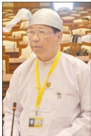
Union Minister for Mines Dr Myint Aung replying to queries.