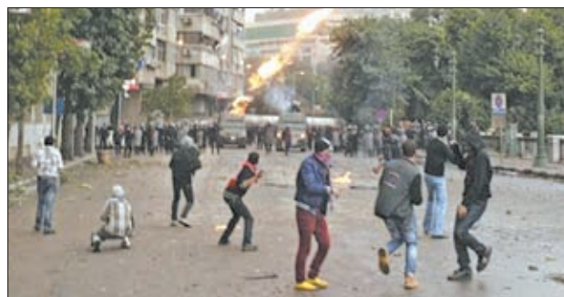
Protesters opposing Egyptian President Mohamed Mursi throw a Molotov cocktail towards riot police during clashes along Qasr Al Nil bridge leading to Tahrir Square in Cairo on 28 Jan, 2013.

CAIRO/ISMAILIA, 29 Jan —Egyptian protesters defied a nighttime curfew in restive towns along the Suez Canal, attacking police stations and ignoring emergency rule imposed by Islamist President Mohamed Mursi to end days of clashes that have killed at least 52 people.