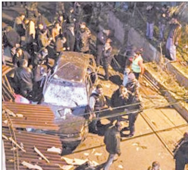
Security policemen inspect a damaged car in the suburbs of Beirut on 28 January, 2013.

The bomb destroyed the car and damaged buildings in the residential area of Hay al-Sellom but there were no casualties, the