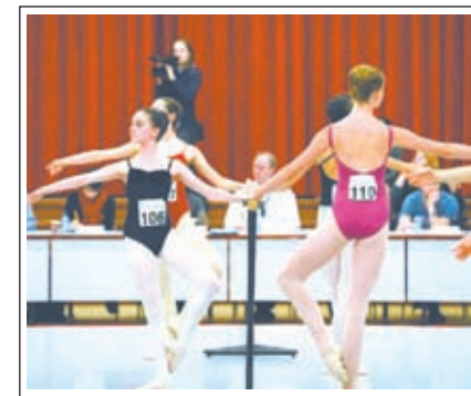
41st international ballet competition held in Switzerland Dancers take part in the 41st international ballet competition in Lausanne, Switzerland, on 28 Jan, 2013. XINHUA