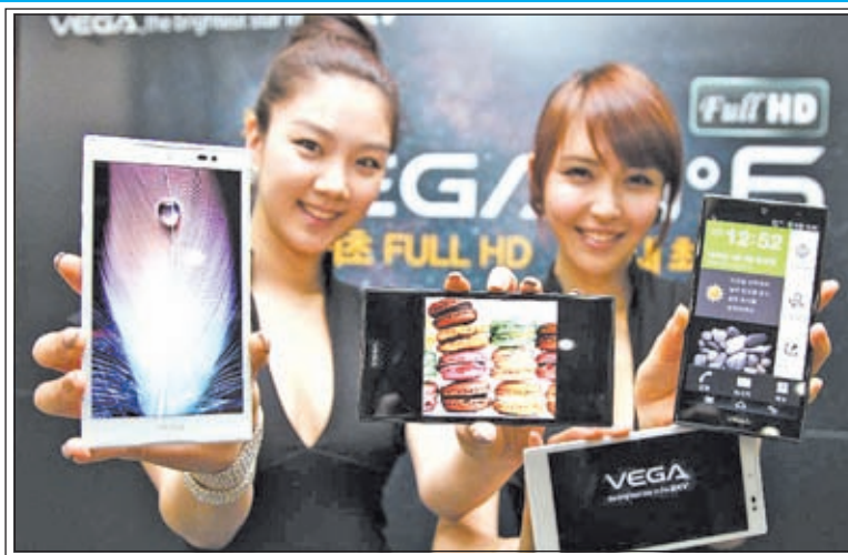
Models present Pantech's new LTE smart phone "VEGA No 6 Full HD" during the launching event in Seoul, South Korea, on 28 Jan, 2013.