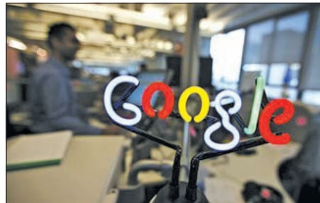
A neon Google logo is seen as employees work at the new Google office in Toronto, on 13 Nov, 2012.

pany, and we don't want our services to be used in harmful ways. But it's just as important that laws protect you against overly broad requests for your personal information," Drummond said in the post. The US Electronic Communications Privacy Act, passed in the early days of the Internet, does not require government investigators to have a search warrant when requesting access to old emails and messages that are stored online, providing less protection for them than, say, letters stored in a desk drawer or even messages saved on a computer's hard drive. The current system also makes complex distinctions, many disputed in courts, between emails saved as drafts online, in transit, unopened or opened.—Reuters