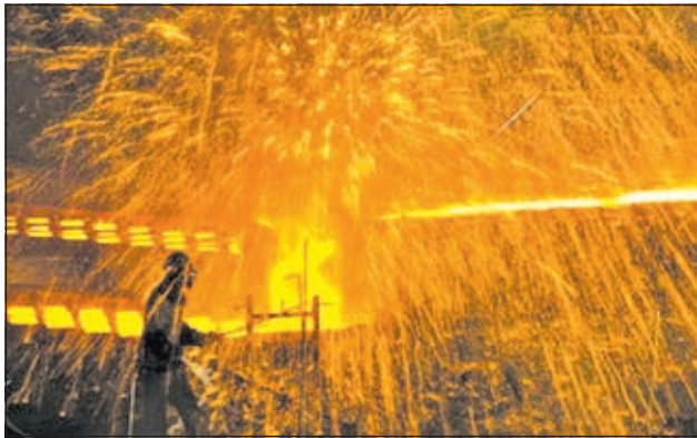
A labourer works at a steel factory in Dalian, Liaoning Province on 4 Dec, 2012.

BEIJING, 23 Jan — China, the world's largest steel producer, aims to bring around 60 percent of total steel capacity under the control of its top 10 steel mills by 2015 as part of a wide-ranging plan to restructure its industries.