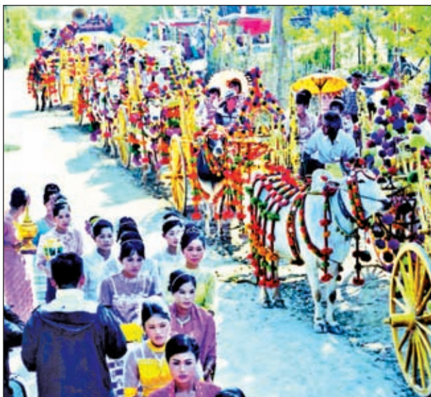
Photo shows a conveyance of novices by bullock carts at Latpan village which is situated near the road to Mingun Pahtodawgyi in Mingun region recently.