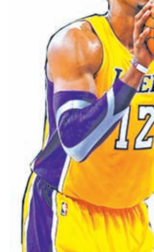
Los Angeles Lakers centre Dwight Howard

Teammate Kobe Bryant did not hold back on his opinion of the play and was furious of the second technical foul issued to Howard.