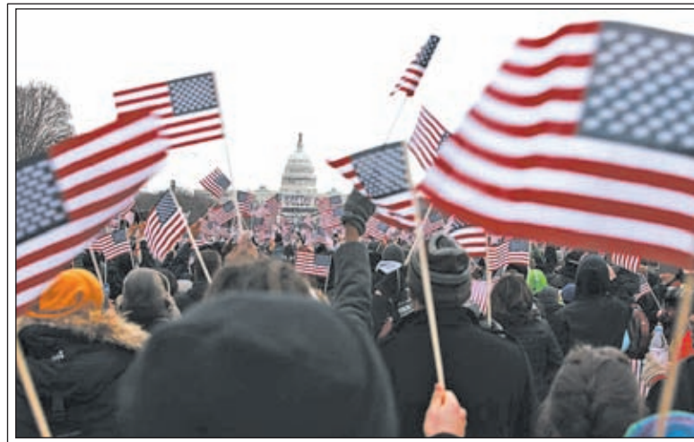
Spectators holding US national flags watch the presidential inauguration ceremony on the West Front of the US Capitol in Washington DC, the United States, on 21 Jan, 2013.

of public use and commit murder. The guilty pleas included plotting an attack on a Danish newspaper. He was arrested in October 2009. After pleading guilty in March 2010 he has been cooperating with US investigators ever since to avoid the death penalty and in exchange for a pledge that he would not to be extradited to India, Pakistan or Denmark.—Reuters