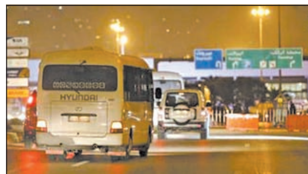
Russian nationals evacuated from Damascus arrive in a convoy at Beirut international airport on 22 Jan, 2013.

Moscow, 23 Jan— Russia said on Tuesday it had started evacuating scores of citizens who wanted to leave Syria but denied the move was the start of a mass exodus. Two senior diplomats played