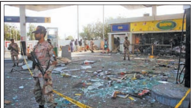
Security officials inspect the blast site in southern Pakistani port city of Karachi on 22 Jan, 2013. At least two people were killed and seven others were injured in gas cylinder blast on a fuel station in Karachi on Tuesday, local media reported.