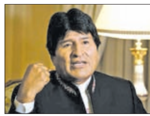
Bolivia's President Evo Morales speaks during an interview with journalists at the presidential residence in La Paz on 13 Jan, 2013.

"With the investigation having only recently concluded, no decisions have been made on moving the nomination forward," the official said, speaking on condition of anonymity.