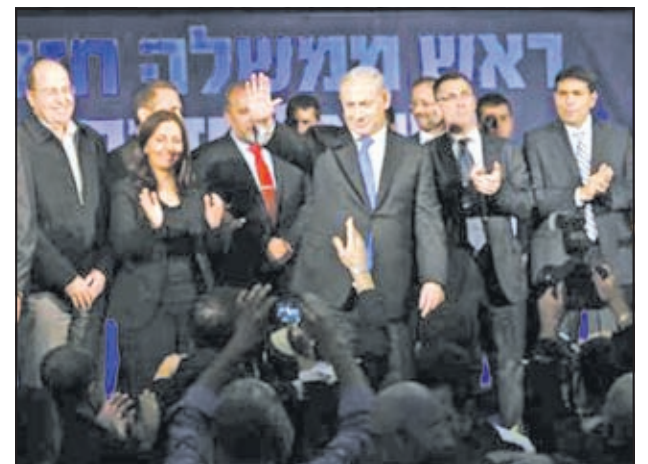
Israel's Prime Minister Benjamin Netanyahu (C) waves to supporters as he stands with his party members at the Likud party headquarters in Tel Aviv on 23 Jan, 2013.

he had called nine months early in the hope of a strong mandate for his struggle with Iran, could complicate his