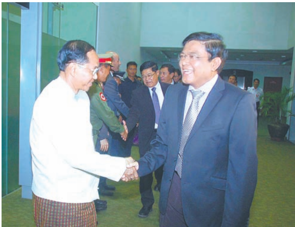
Myanmar delegation led by Vice-President U Nyan Tun being seen off by Yangon Region Chief Minister U Myint Swe at Yangon International Airport.

BSRU established in 1896 is a university offering courses in management and administration. It has become a royal university since 14 June 2004.