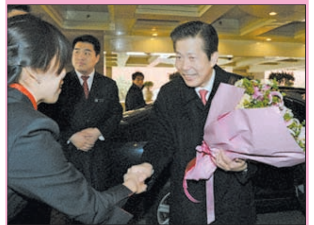
New Komeito party leader Natsuo Yamaguchi receives flowers upon arrival at a hotel in Beijing on 22 Jan, 2013. Yamaguchi, carrying a letter from Prime Minister Shinzo Abe, was the first senior lawmaker of the new Japanese government to travel to China since its establishment in late December 2012.