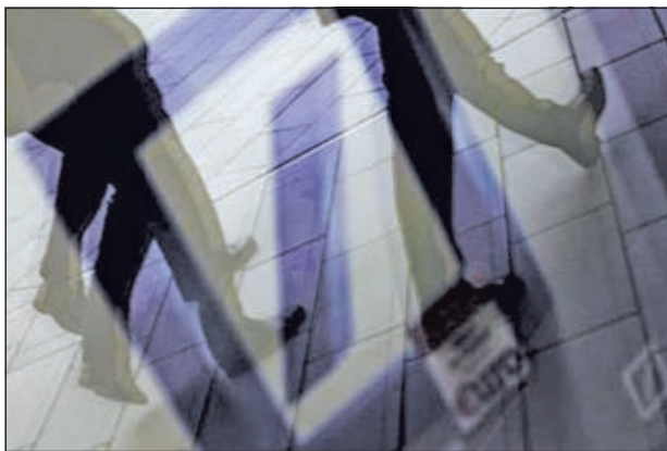
Pedestrians are reflected in a window as they walk in front of the headquarters of Deutsche Bank AG in Frankfurt on 5 Sept, 2011.

The action is part of a larger crackdown by the regulator targeting electricity trading schemes that it says resemble the market manipulations that caused California's energy crisis more than a decade ago, the