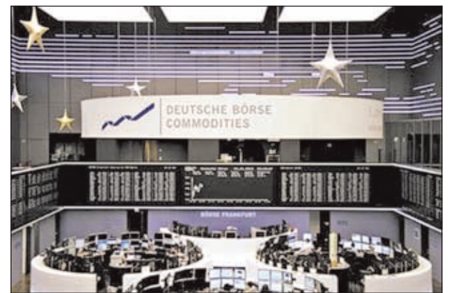
Traders are pictured at their desks in front of the DAX board at the Frankfurt stock exchange on 4 Jan, 2013.

The Bank of Japan, which has been under intense political pressure to overcome deflation, hiked its inflation target to 2 percent and said that from 2014 it would adopt an open-ended commitment to buy assets. The move surprised markets, which had expected another incremental increase in its 101 trillion yen ($1.12 trillion) asset-buying and lending programme, though the delay until the easing measures kick in dulled the impact and saw the yen edge higher against the dollar. "From 2014 onwards it's positive ... (but)