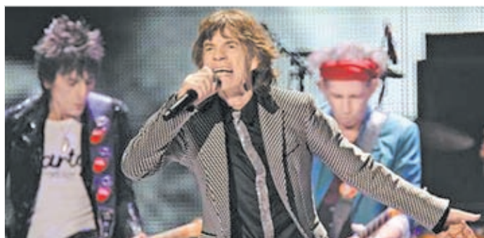
Ronnie Wood (L) Mick Jagger and Keith Richards perform onstage during the Rolling Stones final concert of their "50 and Counting Tour" in Newark, New Jersey, on 15 Dec, 2012.