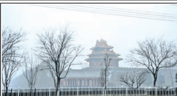
Photo taken on 23 Jan, 2013 shows the Forbidden City enveloped in mist in Beijing, capital of China. A fog hit the capital city on Wednesday, and Beijing meteorological observatory issued a yellow alert for heavy fog on Tuesday.