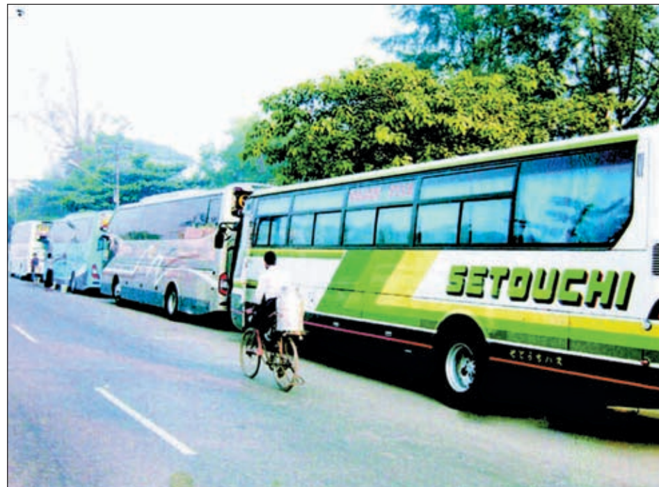
Photo shows express cars which were in the wash by roadside on Thudamma Road in North Okkalapa Township on 14 January. While doing car wash on the motorway with no pavements, pedestrians are to walk along the middle of the road to avoid them, feeling afraid of being hit by motorbikes, passenger buses, bicycles and trishaw running behind.