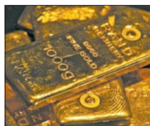
Gold bars are displayed at a gold jewellery shop in Chandigarh on 8 May, 2012.—REUTERS

Rising import of the yellow metal has been worrying the government battling with a record high cur-