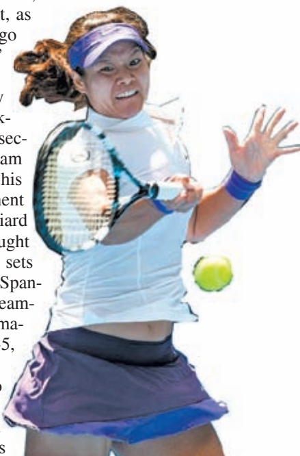
China's Li Na

But the Spaniard wasted the opportunity and ailed