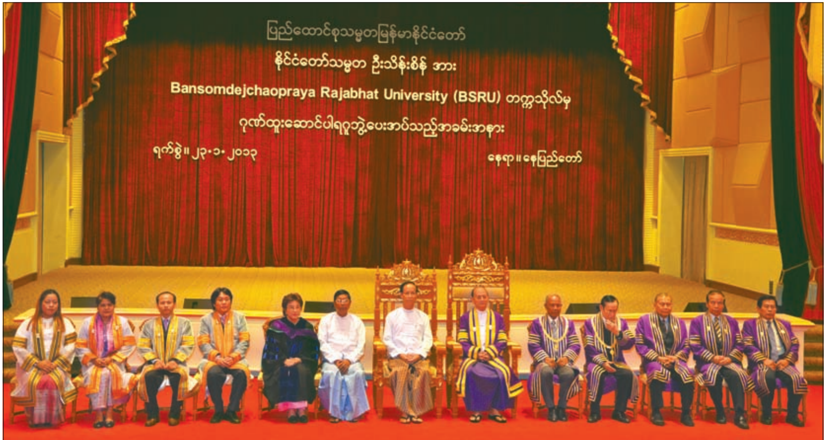
President U Thein Sein poses for documentary photo together with officials of Bansomdejchaopraya Rajabhat University (BSRU) at honorary doctorate degree presentation ceremony.