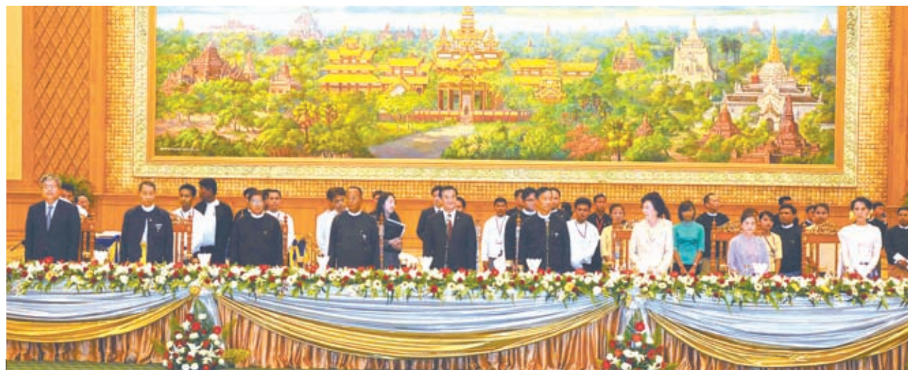
Pyithu Hluttaw Speaker Thura U Shwe Mann and wife, Amyotha Hluttaw Speaker U Khin Aung Myint at the dinner hosted to Speaker of National Assembly of the Republic of Korea Mr. KANG Chang-Hee and wife.

Next, the Pyithu Hluttaw Speaker and wife and party posed for a documentary photo together with South Korean National Assembly Speaker and wife and party.