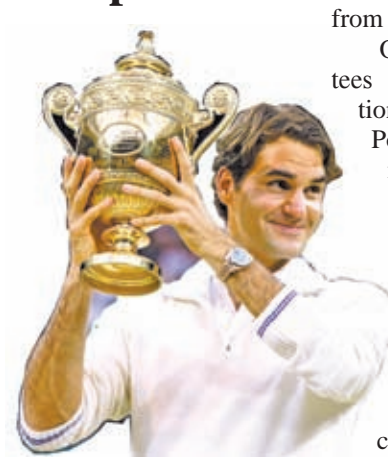
Roger Federer of Switzerland

spearhead the Czech challenge in the tie taking place