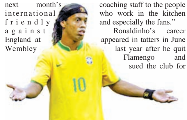
File photo of Brazilian soccer star Ronaldinho.

next month's international friendly against England at Wembley