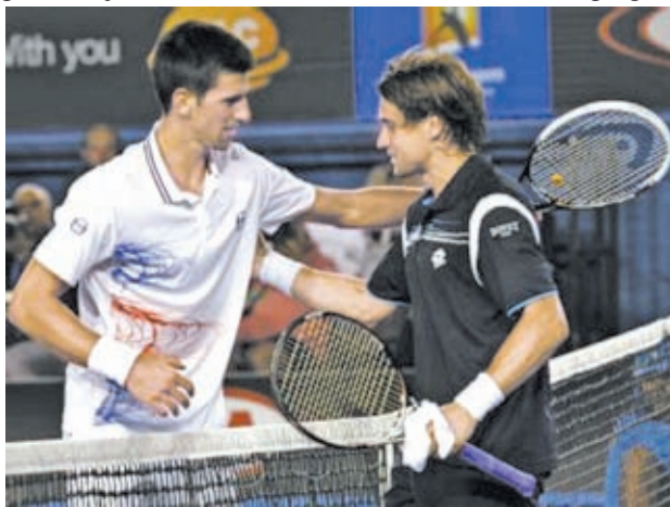
Djokovic and David Ferrer