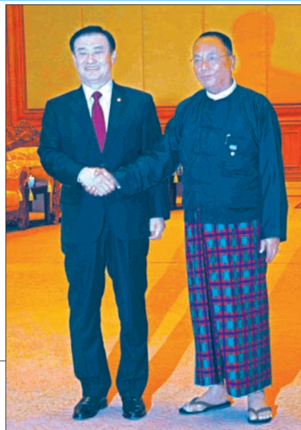
Pyidaungsu Hluttaw Speaker U Khin Aung Myint shakes hands with Speaker of National Assembly of ROK Mr KANG Chang-Hee.