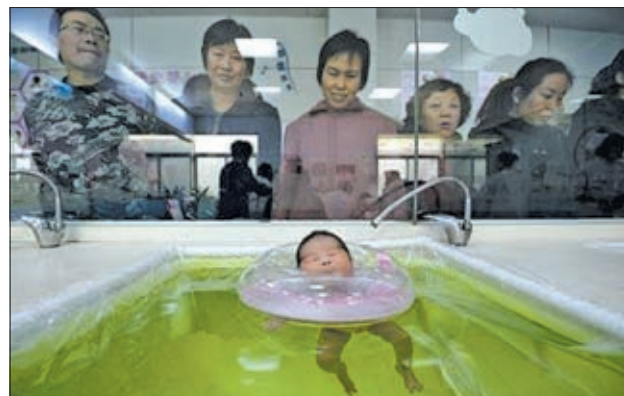
People watch an infant go through swimming exercise at a maternal and child health care hospital in Taiyuan, Shanxi Province, on 3 Dec, 2012.