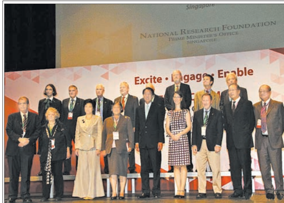
Science and technology leaders and guests pose for photos during the opening ceremony of the Global Young Scientists Summit in Singapore, on 20 Jan, 2013.

As a senior vice president in charge of a crucial part of the company's business with direct access to co-founder Bill Gates,