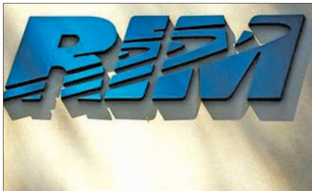
A logo of the BlackBerry maker's Research in Motion is seen on a building at the RIM Technology Park in Waterloo on 18 April, 2012.