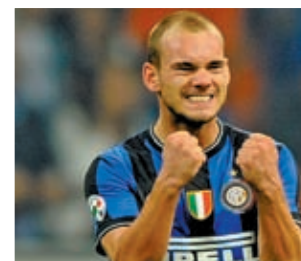
Dutch midfielder Wesley Sneijder

Earlier this month, Galatasaray announced to reach an agreement with Inter on