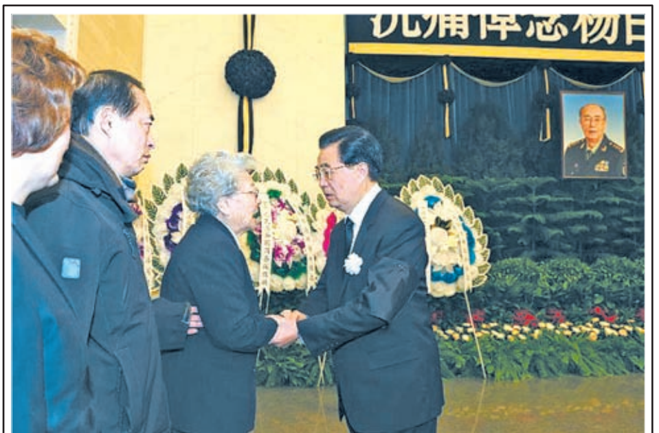
Hu Jintao (1st R) shakes hands with a relative of Yang Baibing, at the Babaoshan Revolutionary Cemetery in Beijing, capital of China, on 21 Jan, 2013. The body of Yang Baibing, former director of the General Political Department of the Chinese People's Liberation Army (PLA), was cremated in Beijing on Monday. Yang, also former secretary-general of the Central Military Commission, passed away due to illness on 15 January. He was 93.

The local guerilla group since 2008 has been linked with firebombings at police, political and business targets and the parcel bomb thriller targeting European leaders and foreign embassies in November 2011.—Xinhua