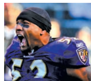
Baltimore Ravens linebacker Ray Lewis

"To do it for (Joe Flacco), to do it for Sizzle (Terrell Suggs), to do it for Ray Rice, to do it for Ed Reed ... I really wanted them to feel what that confetti felt like, just hearing your name being announced going to the Super Bowl," Lewis said after Sunday's 28-13 win over