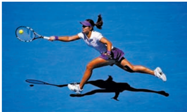
Li Na of China hits a return to Agnieszka Radwanska of Poland during their women's singles quarter-final match at the Australian Open tennis tournament in Melbourne on 22 Jan, 2013.

Li survived a late wobble conceding two break points when serving for