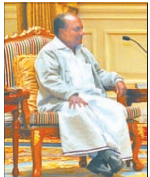
Mr AK Antony.—MNA

Also present at the call were Union Minister for Home Affairs Lt-Gen Ko Ko, Union Minister for Defence Lt-Gen Wai Lwin,