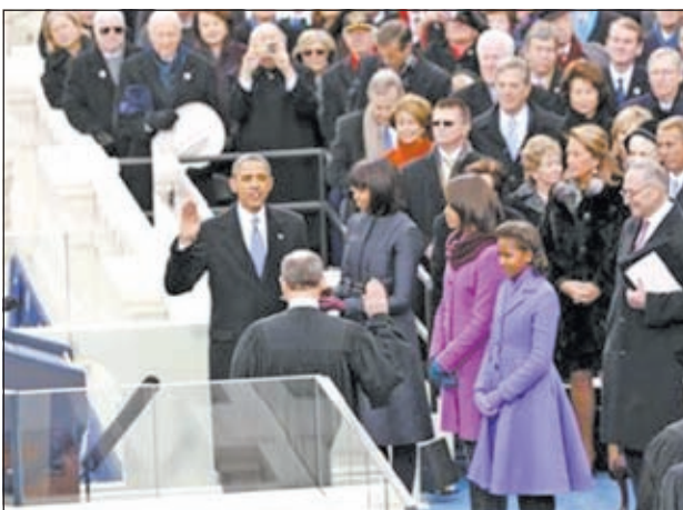
US President Barack Obama (L) takes the oath from US Supreme Court Justice John Roberts as his wife Michelle Obama and daughters Malia Obama (2nd R) and Sasha Obama (R) watch during swearing-in ceremonies on the West front of the US Capitol in Washington, on 21 Jan, 2013.