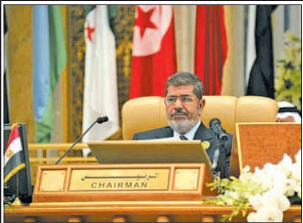
Egyptian President Mohamed Morsi attends the 3rd Arab Economic and Social Development Summit held in the Saudi capital of Riyadh on 21 Jan, 2013.