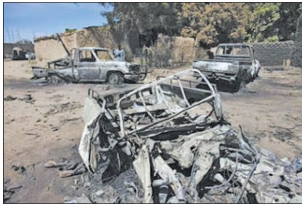
Charred pickup trucks destroyed by French airstrikes are seen in Diabaly, Mali, on 21 Jan, 2013.

DIABALY, 22 Jan—French and Malian armored columns rolled into the towns of Diabaly and Douentza in central Mali on Monday after the al Qaeda-linked rebels who had