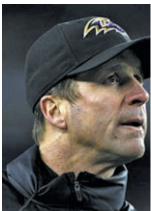
Baltimore Ravens head coach John Harbaugh directs his team against the New England Patriots in the NFL AFC Championship football game in Foxborough, Massachusetts, on 20 Jan, 2013.