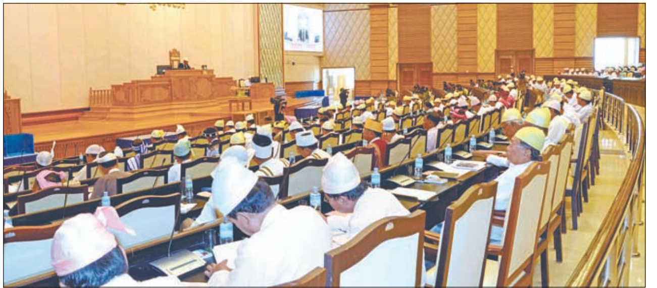
Fifth day sixth regular session of First Amyotha Hluttaw in progress.

regions with social barriers than relatively developed regions.