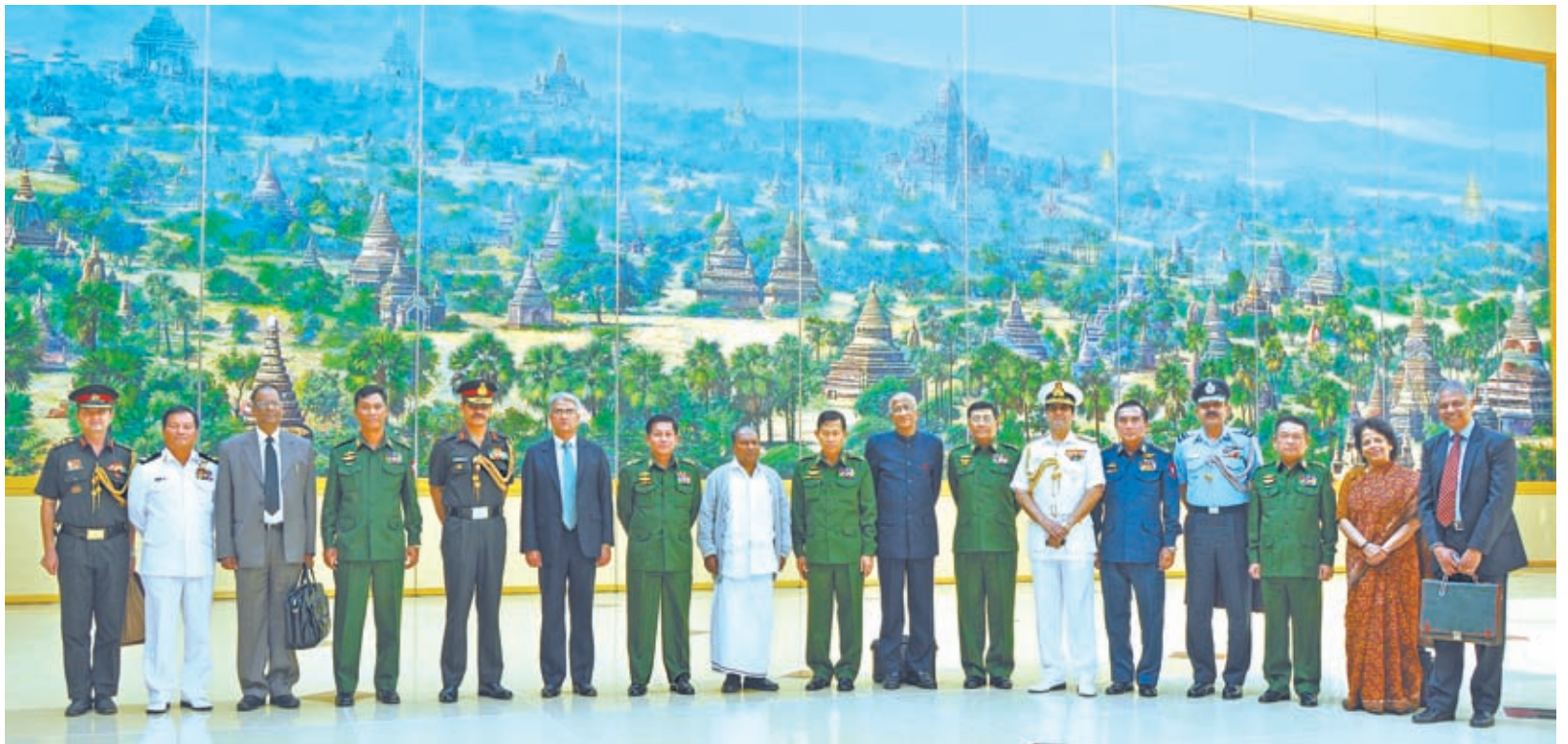
Vice-Senior General Min Aung Hlaing and party pose for documentary photo together with Indian Defence Minister Mr AK Antony and party.

They exchanged gifts and posed for documentary