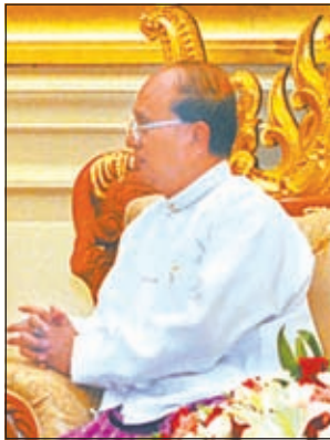
President of the Republic of the Union of Myanmar U Thein Sein.—MNA