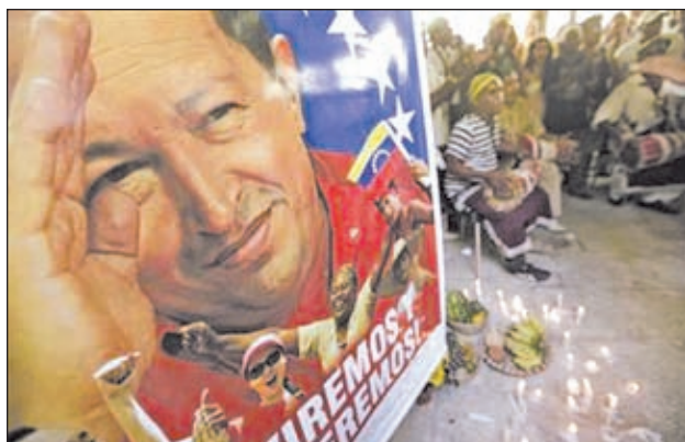
A poster of Venezuela's President Hugo Chavez is seen during a Afro-Cuban Santeria ceremony to pray for his recovery, in Havana on 10 Jan, 2013.