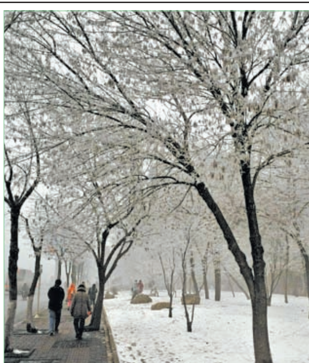
Photo taken on 22 Jan, 2013 shows the frost on the trees in north China’s Tianjin Municipality. Dense fog hit Tianjin on Tuesday.