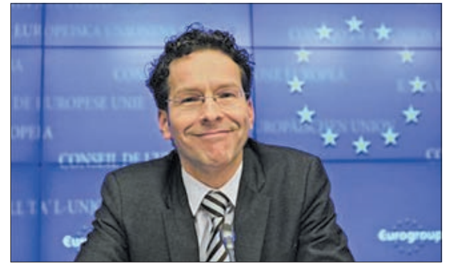
Netherlands' Finance Minister Jeroen Dijsselbloem holds his first news conference after being appointed new Eurogroup Chairman during a euro zone finance ministers' meeting in Brussels on 21 Jan, 2013.

The Dutch minister, who took his national post three months ago, said the euro zone should continue with reforms and fiscal consolidation that have pleased investors. "We now need to keep the momentum going, to ensure we retain the