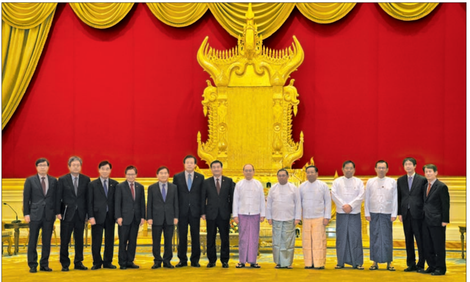
President of the Republic of the Union of Myanmar U Thein Sein and delegation led by ROK National Assembly Speaker Mr. KANG Chang-Hee pose for documentary photo.