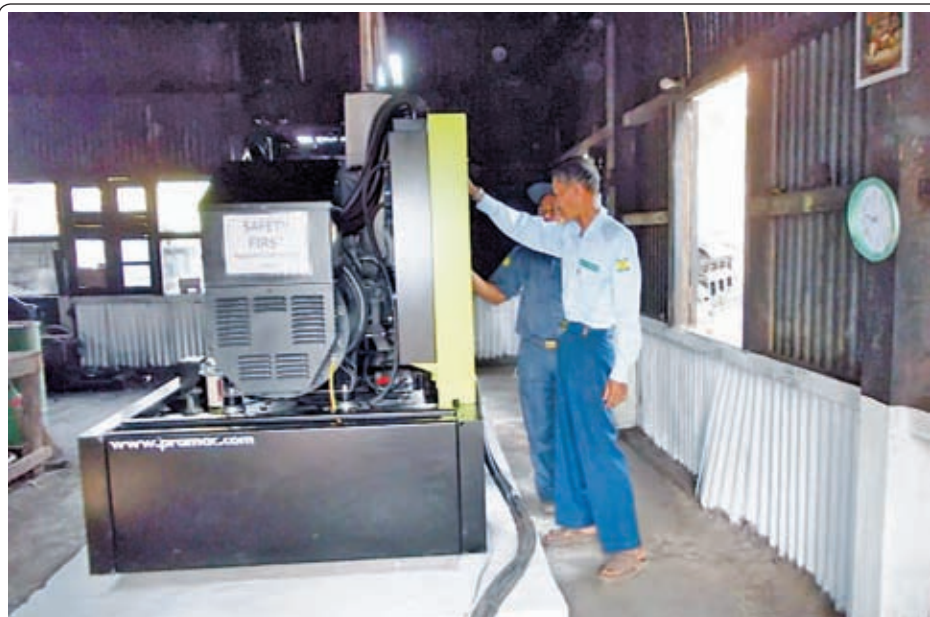
Myanmar Electric Power Enterprise distributed electricity with 300 KVA transformer at Kyon Doe in Kawkareik District on 6 January.