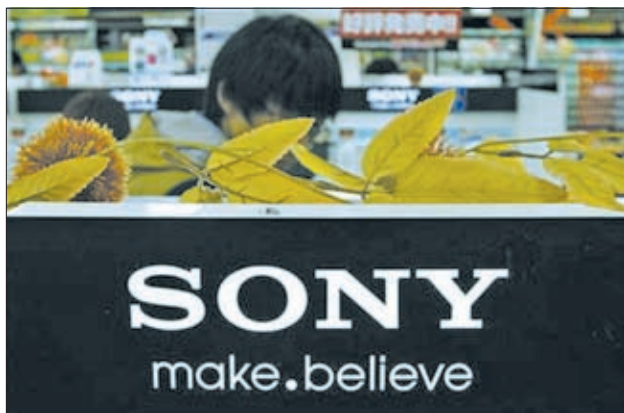
A man stands behind Sony Corp's logo at an electronics store in Tokyo on 31 Oct, 2012.