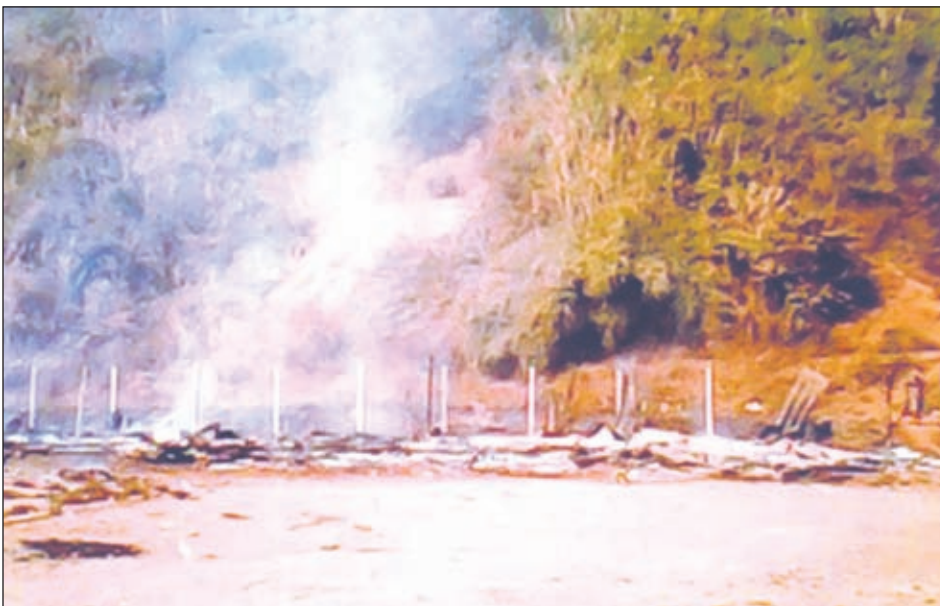
Building of Kyaing Gems Company is on fire set by KIA group.

NAY PYI TAW, 22 Jan— Buildings of Max Myanmar and Kyaing gems companies which are in joint venture with the government in Phakant Township were attacked by KIA on 20 January. Fifty KIA members ambushed the convoy loaded with food and consumer goods for departmental personnel and local people yesterday afternoon, injuring some members of security forces and destroying one vehicle.