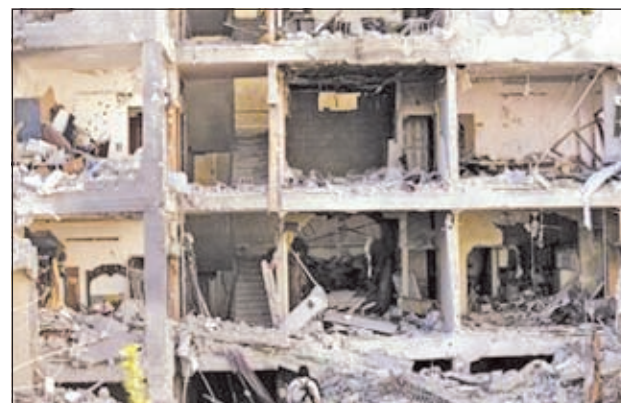
A fighter from the Free Syrian Army's Tahrir al Sham brigade looks at a building destroyed during yesterday's Syrian Air force air strike in Mleha suburb of Damascus on 21 Jan, 2013.

ISTANBUL, 22 Jan— Syrian opposition leaders said on Monday they had failed to put together a transitional government