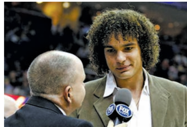
Cleveland Cavaliers Anderson Varejao talks with a TV reporter during the second quarter of the team's NBA basketball game against the Detroit Pistons in Cleveland on 9 Feb, 2011.