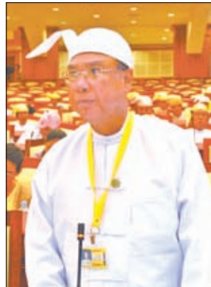
Union Minister U Win Tun. MNA

NAY PYI TAW, 22 Jan—Four questions were answered at fifth day sixth regular session of First Amyotha Hluttaw.