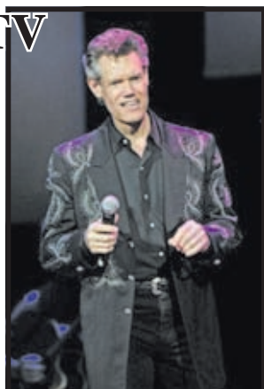
Country music singer Randy Travis.