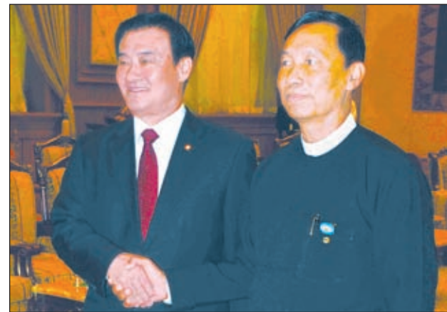
Pyithu Hluttaw Speaker Thura U Shwe Mann shakes hands with Korean National Assembly Speaker