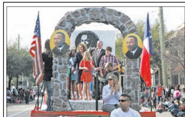
People take part in the Martin Luther King Parade in Houston, the United States, on 21 Jan, 2013.