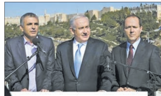
Israel's Prime Minister Benjamin Netanyahu (C) stands with Jerusalem Mayor Nir Barkat (R) and Communications Minister Moshe Kahlon outside the Menachem Begin Heritage Centre in Jerusalem on 21 Jan, 2013. Netanyahu made an election eve appeal to wavering supporters to “come home”, showing concern over a forecast far-right surge that would keep him in power but weaken him politically.

The former commando has traditionally looked to religious, conservative parties for backing and is widely expected to reach out to the surprise star of the campaign, self-made