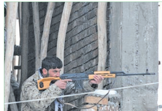
Afghan security force take position near the Kabul traffic police headquarters during militants attack, in Kabul, Afghanistan, on 21 Jan, 2013. Operations against Taliban gunmen who seized a traffic police facility in western Kabul ended Monday afternoon, with all the militants having been killed, the Kabul police chief said.

Early reports by local media Tolo News suggested that the militants have held hostages an undermined number of traffic police employees causing the operations to last for long hours, however, no official has confirmed the hostage taking incident in the attack.