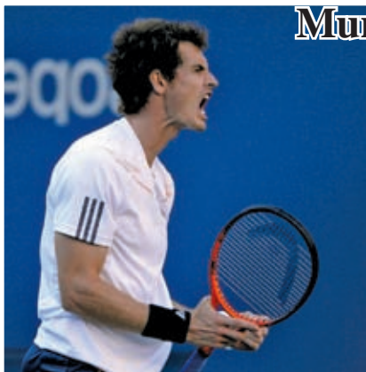
Third-seeded Andy Murray

However, Murray still made into the last eight with his eighth break after a 95-minute encounter.—Xinhua