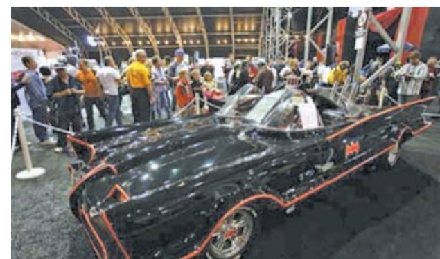
The original Batmobile is displayed during the Barrett-Jackson collectors car auction in Scottsdale, Arizona on 19 Jan, 2013. The vehicle was sold for $4,200,000 according to the auction company.