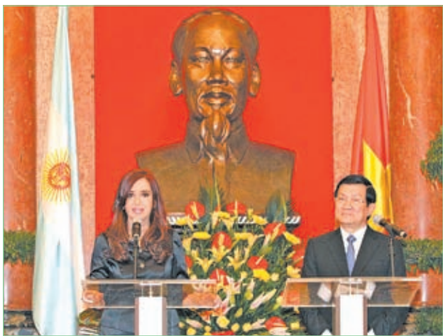
Vietnamese President Truong Tan Sang (R) and visiting Argentine President Cristina Fernandez de Kirchner attend a Press conference at the Presidential Palace in Hanoi, capital of Vietnam, on 21 Jan, 2013.

HANOI, 22 Jan— Vietnam wants to deepen the all-sided relations and cooperation at strategic partnership level with Argentina, Vietnamese President Truong Tan Sang said here on Monday during talks with his Argentine counterpart Cristina