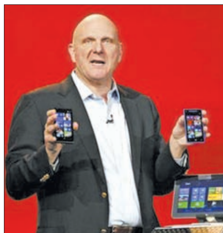
Microsoft CEO Steve Ballmer displays Phone 8 devices at the Qualcomm pre-show keynote at the Consumer Electronics Show (CES) in Las Vegas on 7 Jan, 2013.