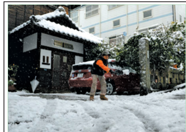
A boy shovels the pavement in Tokyo, capital of Japan, on 14 Jan, 2013. A storm system hit eastern Japan on Monday resulting in heavy snow fall that had impacted on traffic in many prefectures, including the capital city of Tokyo.—XINHUA

According to police and various data, the number of daily fatality varies from 15 to 50, about 75 percent of which occur in rural areas.—Xinhua