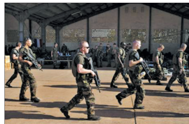
French soldiers walk past a hangar they are staying at the Malian army air base in Bamako on 14 Jan, 2013.