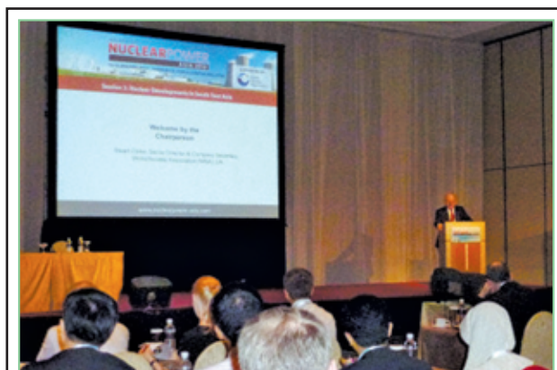
The two-day annual Nuclear Power Asia Conference of the World Nuclear Association begins in Kuala Lumpur, Malaysia, on 15 Jan, 2013.—KYODO NEWS

A total of 560 parliamentary seats will be contested by those parties in 2014, followed by an election of a new president to replace Susilo Bambang Yudhoyono whose two five-year terms will expire that year.—Xinhua