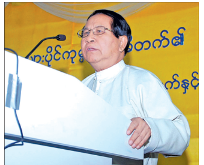
Union Cooperatives Minister U Kyaw Hsan speaking at paper-reading session on cooperative network and the role of banks.