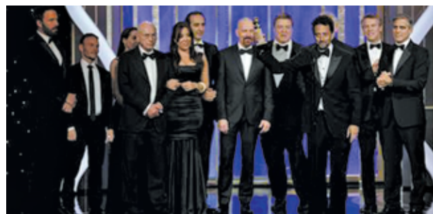
"Argo" Producer Grant Heslov, with trophy, and cast and crew accept the award for Best Motion Picture, Drama, for "Argo" at the Golden Globe Awards in Beverly Hills, California on 13 Jan, 2013

BEVERLY HILLS, 15 Jan—Iran hostage drama "Argo" scored a sweet dou-