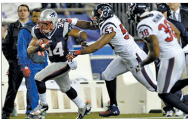
New England Patriots running back Shane Vereen (34) runs away from Houston Texans' Bradie James (53) for a first down during the first quarter of their NFL AFC Divisional playoff football game in Foxborough, Massachusetts on 13 Jan, 2013.

back into zone pass coverage. Shame on Houston for not being ready and credit the Pats, who have cleverly retooled and thrived over a remarkable run that could bring them a sixth trip to the Super Bowl in the 12 years since the partnership of coach Belichick and Brady. The big surprise of Sunday's contest was how the Patriots made up for injuries during the game to key offensive players Rob Gronkowski and Danny Woodhead as third-string running back Shane Vereen scored three touchdowns to tame the Texans. The Patriots scraped by last year's AFC title game with a 23-20 victory over the Ravens, who had a potential game-winning touchdown pass dropped in the end zone and a 32-yard game-tying field goal missed.—Reuters