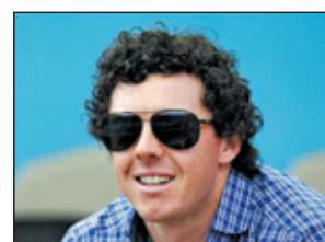
Golfer Rory McIlroy of Northern Ireland

World number three Luke Donald also voiced his support for McGinley when the Englishman wrote on Twitter on Monday: "I hope Paul McGinley gets