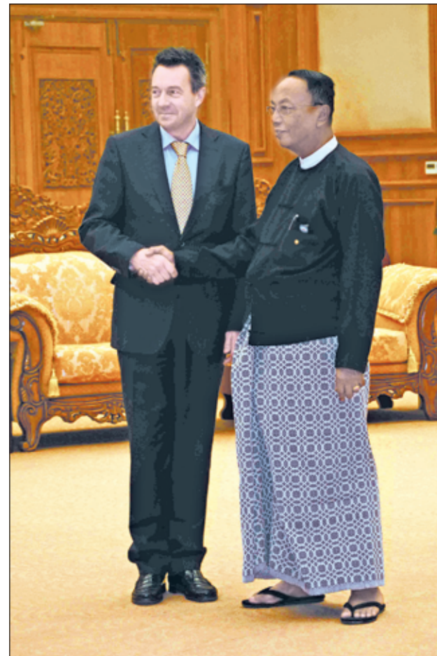
Pyidaungsu Hluttaw Speaker U Khin Aung Myint welcomes President of ICRC Mr Peter Maurer at Amyotha Hluttaw Hall.