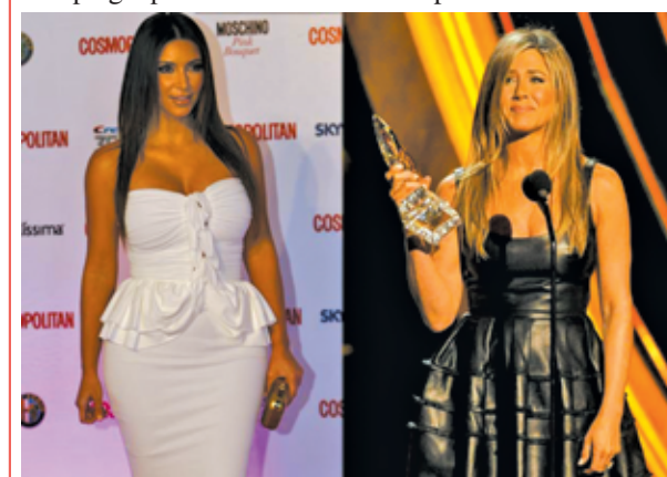
Speaking in new documentary $ellebrity, she said: "There's nothing wrong with Kim Kardashian and all those people."

He later added that he didn't want to be known simply as a sex symbol because then he "might as well be a Kardashian and have a sex tape", a reference to Kim's leaked erotic video with former boyfriend Ray J. Jon said: "The sexy thing is so ephemeral and meaningless other than in the world of selling magazines. Who cares, when it's reduced to just that? You might as well be a Kardashian and have a sex tape."