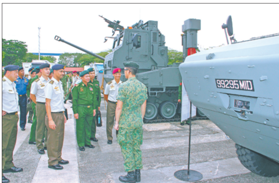
Commander-in-Chief of Defence Services Vice-Senior General Min Aung Hlaing visits 2 nd Defence Force of Singapore.