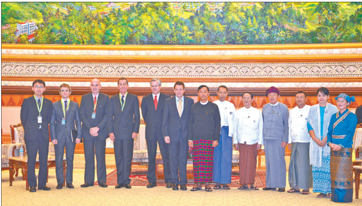
Pyithu Hluttaw Speaker Thura U Shwe Mann receives a delegation led by President Mr. Peter Maurer of International Committee of the Red Cross.

NAY PYI TAW, 15 Jan — Pyithu Hluttaw Speaker Thura U Shwe Mann received a delegation led by President Mr. Peter Maurer of International Committee of the Red Cross at Zabuthiri Hall in Hluttaw Building here this morning.