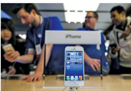
An Apple iPhone 5 phone is displayed in the Apple Store on 5th Avenue in New York, on 21 Sept, 2012.