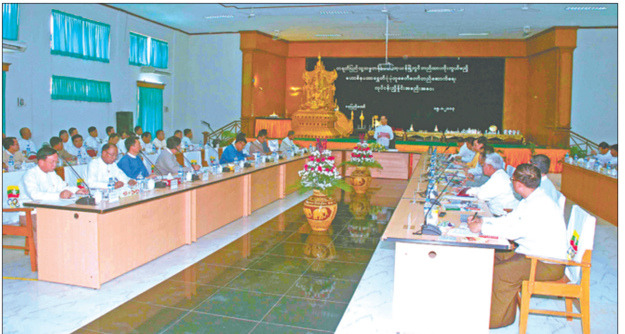
Vice-President Dr Sai Mauk Kham delivers a speech at coordination meeting on construction of a replica of Shwedagon Pagoda.

The pagoda is being built with the donations collected during last three days of the 48-day tour of a sacred tooth relic of Buddha for public obeisance in Myanmar last year.