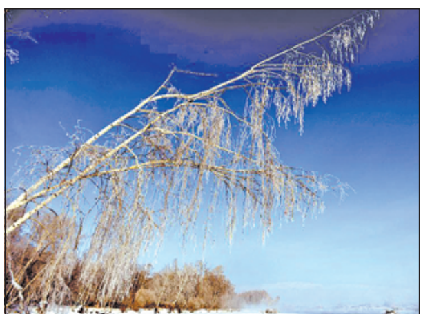
Photo taken on 10 Jan, 2013 shows rime scenery in Chonghu'er Township of Burqin County, northwest China's Xinjiang Uygur Autonomous Region.