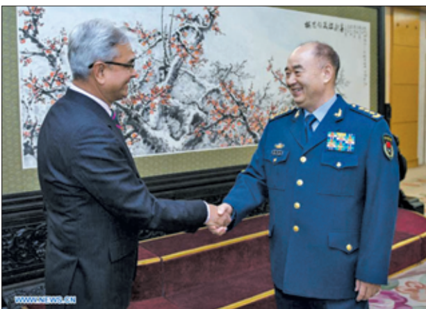
Xu Qiliang (R), vice chairman of China's Central Military Commission, shakes hands with Indian Defence Secretary Shashi Kant Sharma during a meeting in Beijing, capital of China, on 14 Jan, 2013.