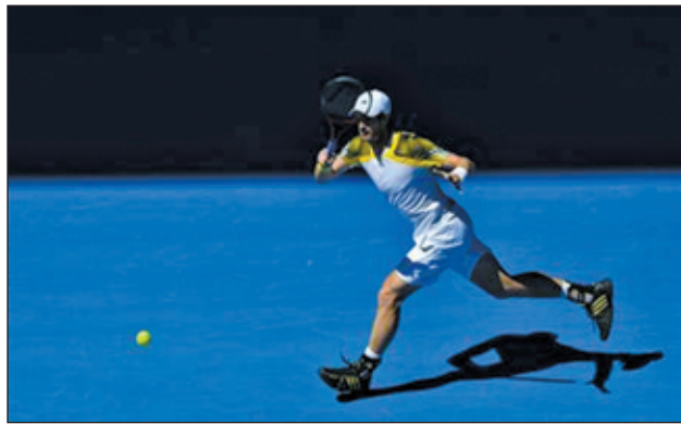
Andy Murray of Britain hits a return to Robin Haase of Netherlands.