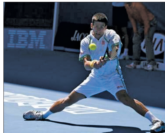
Novak Djokovic of Serbia hits a return to Paul-Henri Mathieu of France during their men's singles match at the Australian Open tennis tournament in Melbourne, on 14 Jan, 2013.

"It was a good performance for a first round," said the top seed, who will play American Ryan Harrison in the second round. "There are some few adjustments that I need to make and get a little bit sharper on the court. But it's expected in the first match you're still not a 100 percent on