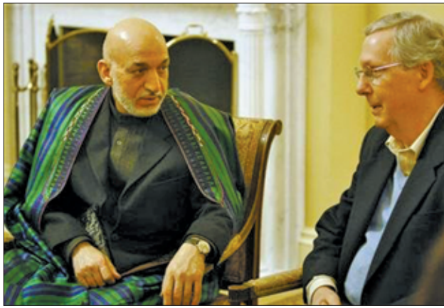
Afghan President Hamid Karzai (L) meets with Senate Minority Leader Mitch McConnell (R-KY) (R) at the US Capitol in Washington on 9 Jan, 2013.

Russia and China oppose sending the case to the court. The 2 permanent council members have close ties with President Assad's regime. The letter notes that the council should send a strong message to all the warring parties in Syria and call on them to observe international law.—NHK