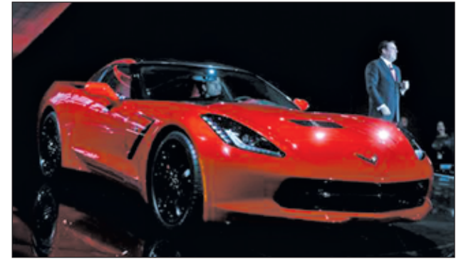
General Motors Corp President of North America Mark Reuss introduces the Chevrolet 2014 Corvette vehicle during a Press event in an old industrial centre in advance of Press preview days of the North American International Auto show in Detroit, Michigan on 13 Jan, 2013.

DETROIT, 15 Jan—The sale of the US Treasury's stake in General Motors and a possible credit rating upgrade of the US automaker in 2013 will help distance the company from the stigma of its 2009 bankruptcy restructuring.