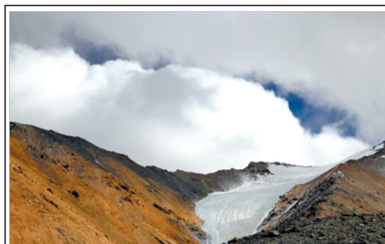
Photo taken on 14 Jan, 2013 shows the winter scenery of "Qiyi" Glacier, or "July 1st" Glacier, some 130 kilometres southwest of Jiayuguan City, northwest China's Gansu Province.

efit if Indonesia reduce its CPO export tax. "Malaysia has an interest to process raw palm oil from Indonesia, but the raw palm oil exported by Malaysia to overseas is not much," said Wirjawan. Indonesia trimmed export tax for CPO to 7.5 percent in January from 9 percent in December, according to the trade ministry.—Xinhua