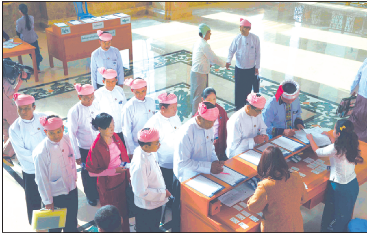
Pyidaungsu Hluttaw representatives sign attendance book.—MNA

Today's session came to an end at 3.45 pm and the session will continue tomorrow.—MNA