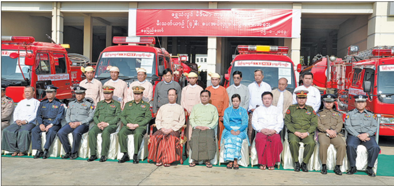
Vice-President Dr Sai Mauk Kham and officials with Shwe Than Lwin Media Co., Ltd pose for a documentary photo.

NAY PYI TAW, 15 Jan—A ceremony to donate four fire engines to Fire Services Department under the Ministry of Home Affairs by Sky Net TV channel of Shwe Than Lwin Media Co., Ltd, was held at Fire Services Department, here, this morning, with an address by Vice-President Dr Sai Mauk Kham.