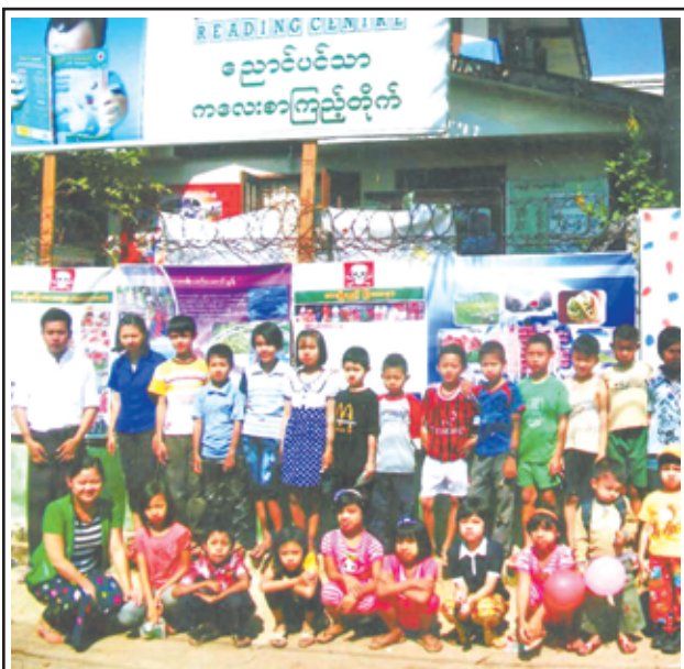
Photo shows responsible persons of the library and children posing for a documentary photo at the opening ceremony of Nyaungbintha Children Library in Taungthugon ward of Insein Township on 4 January. The library is being kept open for promoting the reading habit of children.