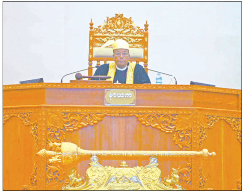
Pyidaungsu Hluttaw Speaker U Khin Aung Myint.—MNA

Daw Khin Than Myint of Ngapudaw Constituency held discussion on high school drop rate that has reached 80 per cent and above among students in rural area and she called for more appointment of skilled and qualified health staff based on transportation and the area of the region and more opening of hospitals in the country based on the