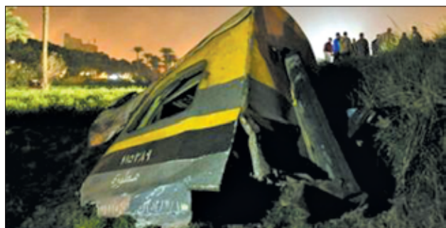
People stand around the wreckage of a military train crash in the Giza neighbourhood of Badrashin, about 40 km (25 miles) west of Cairo on 15 Jan, 2013.