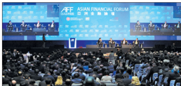
Asian Financial Forum is held in Hong Kong, south China, on 14 Jan 2013.

Chief executive of the Hong Kong Special Administrative Region C Y Leung said despite the global financial crisis, Asia has achieved stable employment conditions, maintained prudent fiscal policies and continued to focus on fostering economic development. Leung said Asia is no longer simply a "factory of the world", but a facilitator of inclusive