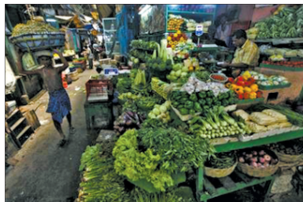
A labourer carries a packed basket of vegetables as a vendor waits for customers at his vegetables stall at a market in Kolkata on 14 May 2012.

In an anticipation of an interest rate cut, financial markets rallied after the data.