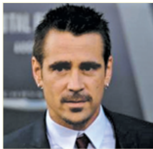
The event was created by the non-profit US-Ireland Alliance to recognize the contributions of the Irish in film and television and as a glitzy networking event.

LOS ANGELES, 11 Jan — Irish actor Colin Farrell is set to be honoured at a pre-Oscars bash next month. The 36-year-old Total Recall star will be celebrated at the eighth annual Oscar Wilde: Honouring the Irish in Film party at in Santa Monica on 21 February, reported E! online.