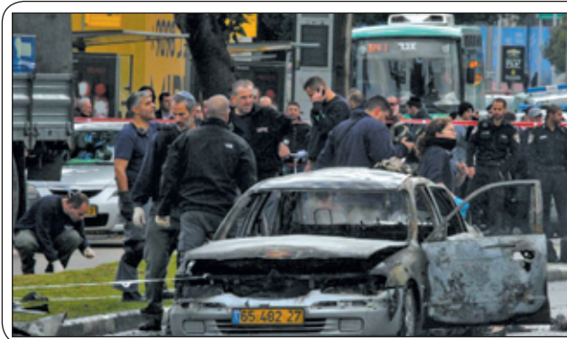
Working staff gather at the site of explosion in Tel Aviv, Israel, on 10 Jan, 2013. A loud explosion rattled Tel Aviv on Thursday noon in what appears to be part of a feud between criminals, police sources confirmed to Xinhua. Two people were lightly injured.

Hundreds of people were gathering inside the preaching centre for Friday prayers when the blast went off. Initial reports said that it was a gas cylinder blast, but local officials later confirmed it was a blast of terrorist nature.—Xinhua