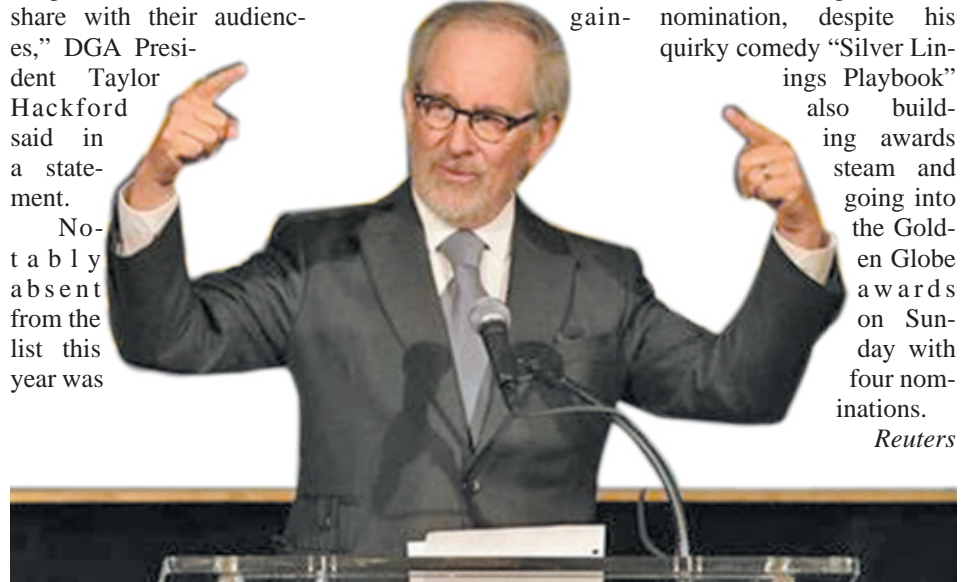
Director Steven Spielberg speaks at The Hollywood Foreign Press Association's (HFPA) annual luncheon to announce financial grants to film schools and non-profit organizations at the Beverly Hills hotel in Beverly Hills, California on 9 Aug, 2012.