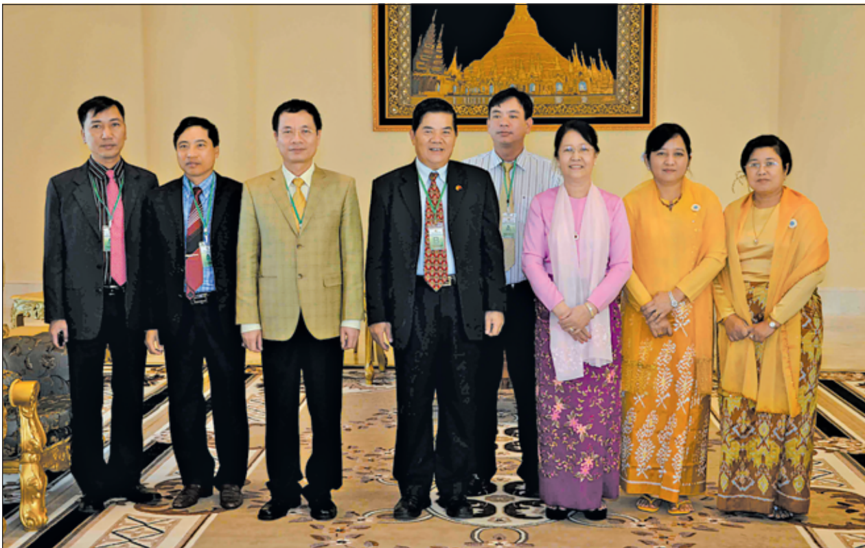
Daw Khin Khin Win, wife of the President of the Republic of the Union of Myanmar U Thein Sein, patron of MMCWA and Vietnamese delegation pose for documentary photo.—MNA

Committee Secretary Union Minister at the President Office U Soe Thein elaborated on nature of small and medium enterprises and inbound investments, followed by discussions between Union ministers and region/state chief ministers. Their discussions ranged from formation of new villages to agricultural development.—MNA