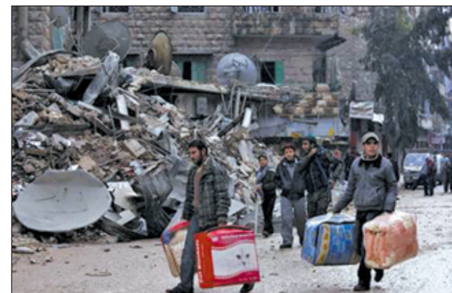
Residents evacuate their houses after being targeted by missiles fired by forces loyal to Syria's President Bashar al-Assad, in Aleppo's al-Mashhad District on 9 Jan, 2013.