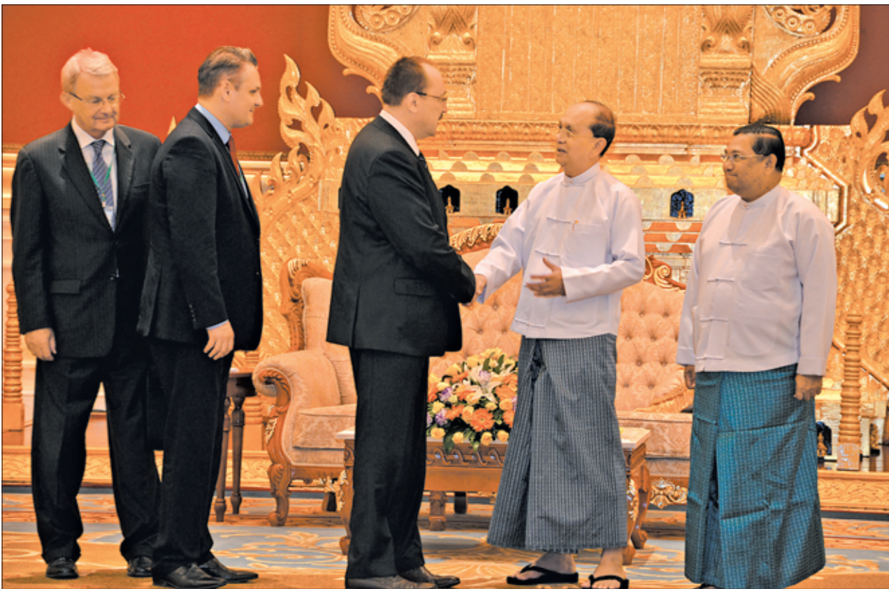
President of the Republic of the Union of Myanmar U Thein Sein greets Minister of State for Hungarian Parliamentary Affairs of the Ministry of Foreign Affairs Mr Zsolt Nemeth.

NAY PYI TAW, 11 Jan— President of the Republic of the Union of Myanmar U Thein Sein received a Hungarian delegation led by Mr Zsolt Nemeth, Minister of State for Hungarian Parliamentary Affairs of Ministry of Foreign Affairs, at the Credentials Halls of the Presidential Palace here today.