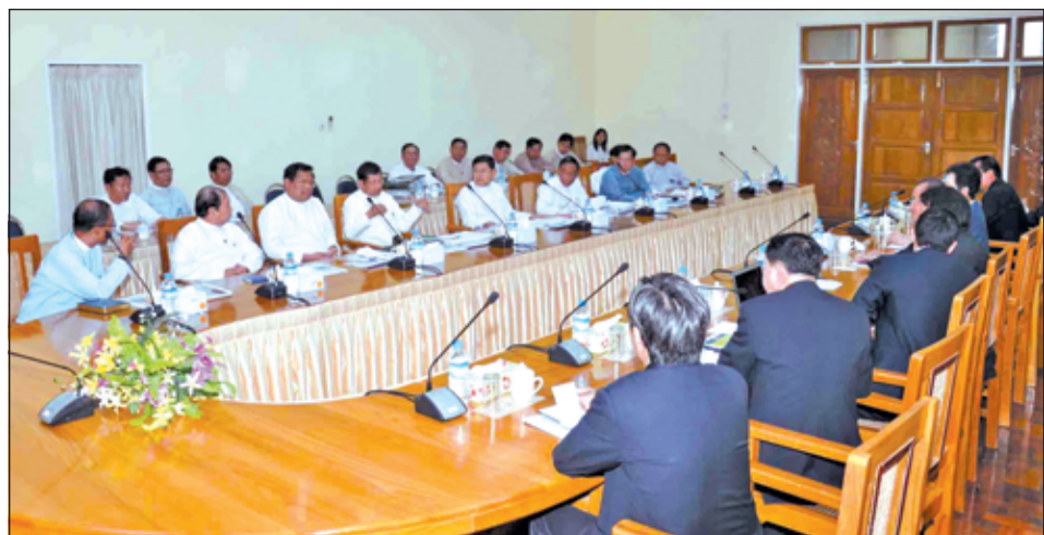
Union Minister at President Office U Soe Thein makes discussion with Singaporean delegation.—MNA

Commerce U Win Myint, Union Minister for Hotels and Toursim U Htay Aung, Union Minister for Industry U Aye Myint, region/state chief ministers, deputy ministers and responsible personnel.—MNA