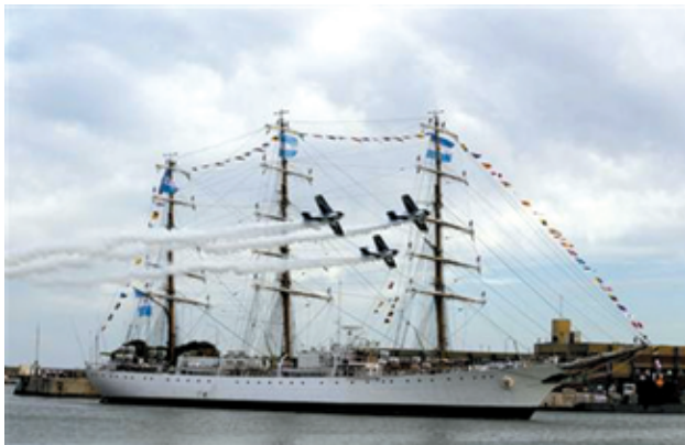
Acrobatic aircrafts perform a flypass as Argentine navy vessel ARA Libertad arrives at the harbour of the seaside resort of Mar del Plata on 9 Jan, 2013.