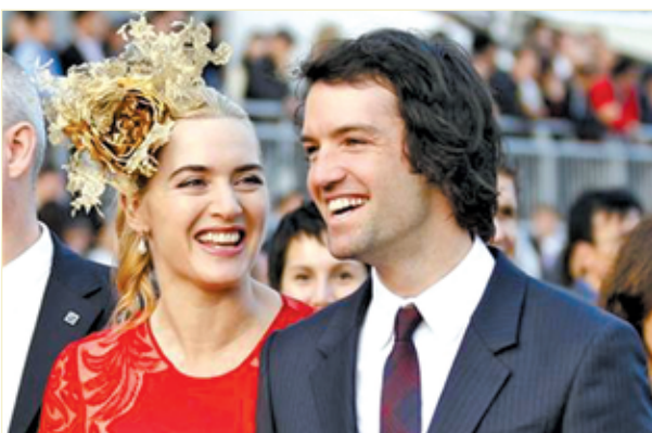
British actress Kate Winslet (L) and her husband Ned Rocknroll attend a promotional event for the Hong Kong international races in Hong Kong in this 9 Dec, 2012 file photo.