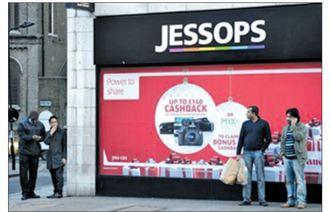
Men stand outside a Jessops shop in central London on 9 Jan, 2013.

"Trading in the stores is hoped to continue today but is critically dependent on these ongoing discussions," he said. "However, in the current economic climate it is inevitable that there will be store closures."