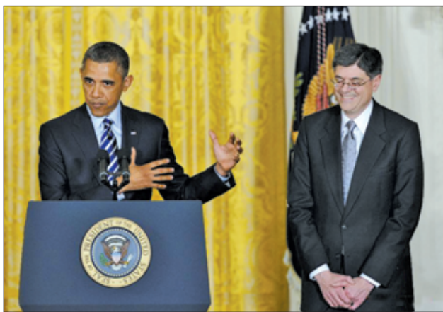
US President Barack Obama (L) speaks while White House Chief of Staff Jacob Lew stands by during a nomination ceremony in the East Room of the White House in Washington DC, capital of the United States, on 10 Jan, 2013.

Lew, a budget expert, served as the Director of the Office of Management and Budget (OMB) in US President Bill Clinton's cabinet from 1998 to 2001. During his tenure at the OMB, he helped the US federal government achieve