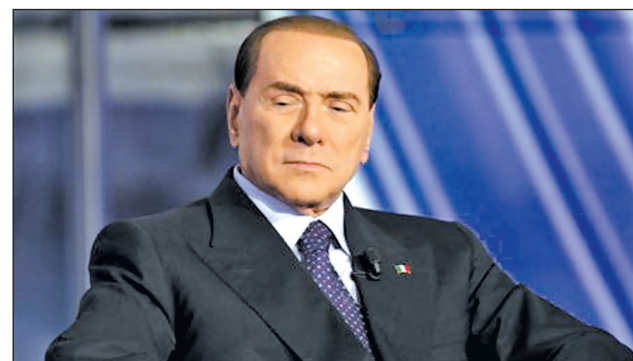
Italy's former Prime Minister Silvio Berlusconi appears as a guest on the RAI television show Porta a Porta (Door to Door) in Rome on 9 Jan, 2013.

In particular, it said Monti was being given too much air time on the news programmes of two of RAI's three channels and was also getting the lion's share of coverage on private broadcasters Sky Italia and La7.