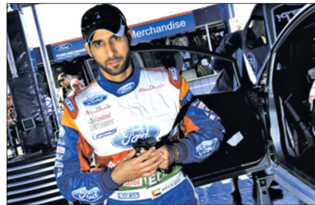
Qatari auto racer Prince Nasser Al Attiyah

Al Attiyah won the sixth stage of the rugged off-road race, between the Chilean cities of Arica and Calama, knocking French rival Stephane Peterhansel (Mini) out of the lead. The Qatari competitor covered the day's 455-kilometer tract in 3 hours, 32 minutes and 8 seconds, followed by Peterhansel, the 2012 rally champion, who trailed 8 minutes and 36 seconds behind.