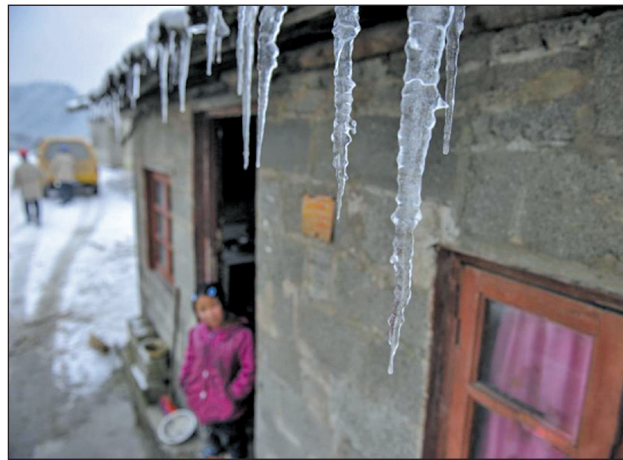
Photo taken on 10 Jan, 2013 shows the ice on the roof in Yongsha Village of Shuangliu Township in Kaiyang County, southwest China's Guizhou Province. Lingering cold along with freezing rain and snowfall have left 17 counties in Guizhou in a state of disaster and forced local governments to relocate over 4,470 people, according to the provincial civil affairs authorities.