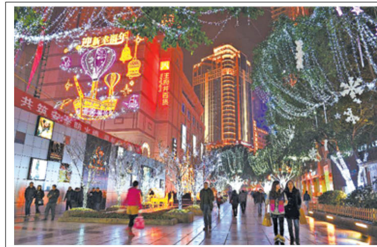
Citizens walk on the Jiefangbei Street in south-west China's Chongqing, on 7 Jan, 2013.

Many roads and squares in the city were decorated with lights to greet the Spring Festival which falls on 10 February this year.