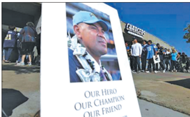
A picture of former San Diego Chargers and NFL linebacker Junior Seau is displayed as fans (rear) arrive at Qualcomm Stadium to participate in a “Celebration of Life” memorial, held in Seau’s memory in San Diego, California on 11 May, 2012.

CTE can be diagnosed only after death. Tissue from Seau’s brain was sent to the National Institutes of Health for analysis in July, at the request of Seau’s family, amid growing concern over the long-term effects of football-related head injuries. “The final