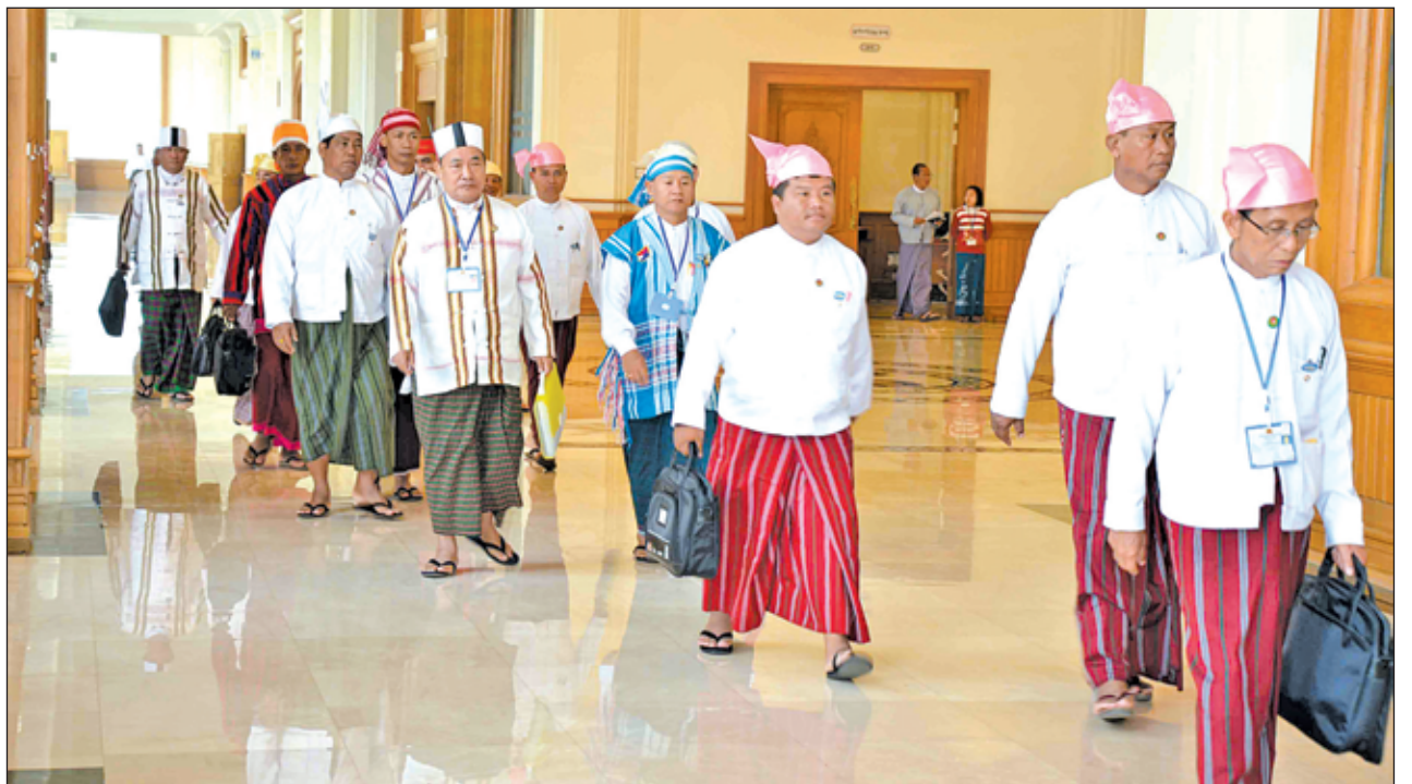
Photo shows arrival of Amyotha Hluttaw representatives at Amyotha Hluttaw hall.—MNA

NAY PYI TAW, 11 Jan—Sixth regular session of first Amyotha Hluttaw continued for the second day today. With regard to the question of U Win Tint of Sagaing Region Constituency No.1, Deputy Minister for Home Affairs Brig-Gen Kyaw Zan Myint replied that there was no plan to move Region offices in Sagaing Region to Sagaing. Bill Committee submitted Anti-Corruption Bill sent back by Pyithu Hluttaw. And Amyotha Hluttaw approved