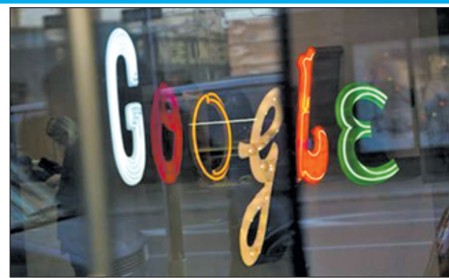
The Google signage is seen at the company's headquarters in New York on 8 Jan, 2013.