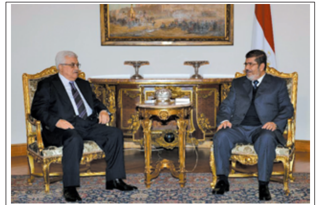
Egyptian President Mohamed Morsi (R) meets with Palestinian President Mahmoud Abbas at the Presidential Palace in Cairo, Egypt, on 9 Jan, 2013.

In order to avoid the risk of having the presidential plane seized by holdout creditors, Fernandez has hired a private aircraft for a four-nation tour of Asia and the Middle East at a cost of $880,000, the government said this week.—Reuters