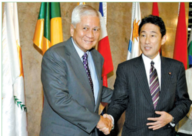
Philippine Foreign Secretary Albert del Rosario (L) shakes hands with Japanese Foreign Minister Fumio Kishida in the Department of Foreign Affairs building in Pasay City, the Philippines, on 10 Jan, 2013.

MANILA, 11 Jan—Philippine and Japanese foreign ministers agreed on Thursday to enhance maritime security cooperation.