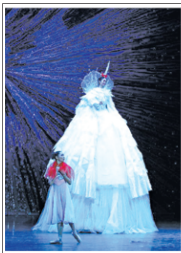
Artists of the National Ballet of China (NBC) perform the Chinese version of "The Nutcracker" at the Tianqiao Theatre in Beijing, capital of China, on 8 Jan, 2013. The Chinese version of "The Nutcracker" is prepared by the NBC for the upcoming Spring Festival which falls on 10 February this year.