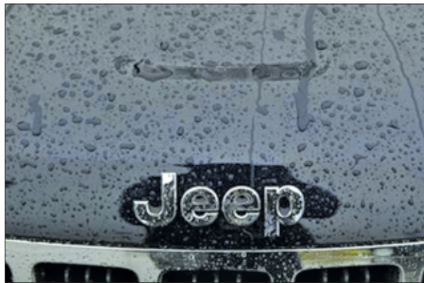
A wet Jeep logo and grill is shown at the Criswell Chrysler-Dodge-Jeep-Fiat-Ram truck dealership in Gaithersburg, Maryland on 7 Oct, 2012.

full-sized SUV, the compact SUV Compass, and the Wrangler, are the three nameplates of Jeep that are most aggressively marketed outside Jeep's North American base. Sales