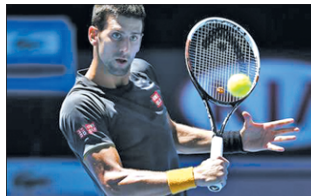
Serbia's Novak Djokovic hits the ball during a practice session at Melbourne Park on 10 Jan, 2013, ahead of the Australian Open tennis tournament which begins on Monday.

MELBOURNE, 11 Jan — World number one Novak Djokovic will kick off the defence of his Australian Open title with a first round tie against unseeded Frenchman Paul-Henri Mathieu after the draw was made for the first grand slam of the season on Friday.