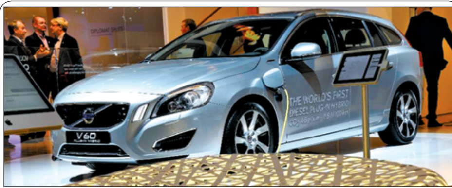
A Volvo hybrid vehicle is seen on the media day of the Brussels Motor Show at the Expo Centre in Brussels, capital of Belgium, on 10 Jan, 2013. The Brussels Motor Show, presenting 10 concept or prototype cars this year, serves as the first show of the European important motor shows. The 10-day Brussels Motor Show will be opened to the public on 11 January.—XINHUA

Gun owners have long been skeptical of the government exercising what they view as too much control over their constitutional right to bear arms. Any bill seen as too heavy handed is unlikely to pass the GOP-controlled House of Representatives in a bitterly partisan Congress.—Xinhua