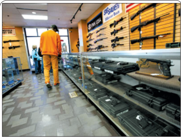
People look around at a gun shop in Chantilly, Virginia, the United States, on 10 Jan, 2013. US Vice President Joe Biden said on Thursday he will present proposals of the White House gun-control task force to President Barack Obama by next Tuesday.