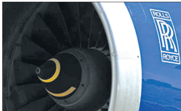
A Rolls-Royce aircraft engine of a British Airways (BA) Boeing 747 passenger aircraft is seen at Heathrow Airport in west London on 7 April, 2011.—REUTERS

Aerospace and defence companies use intermediaries, which can be individuals or companies, in countries where they do not have a large presence. Intermediaries cover tasks from sales to coordinating maintenance and support contracts. Rolls-Royce's operations span the civil aerospace, defense, marine and energy sectors. The company has not disclosed which units are involved in the probe.— Reuters