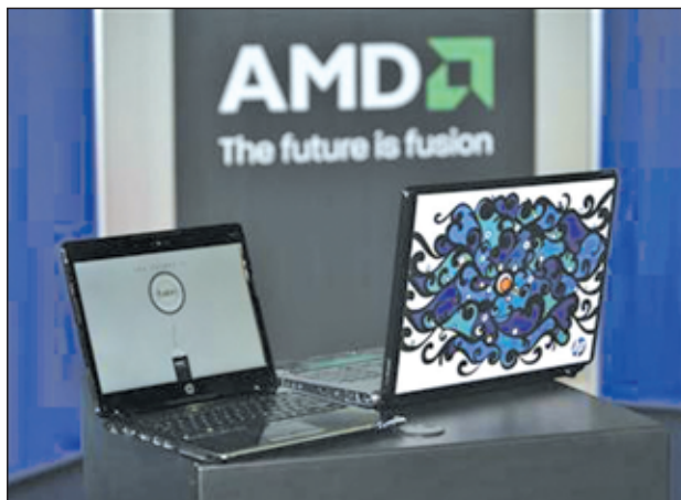
A Hewlett-Packard Pavilion dv2 laptop with an AMD Yukon platform (L) is shown next to a laptop displaying the "Engine Room" Notebook Design Contest winning design during an Industry Insider session on the first day of the 2009 International Consumer Electronics Show (CES) in Las Vegas, Nevada, on 8 Jan, 2009.