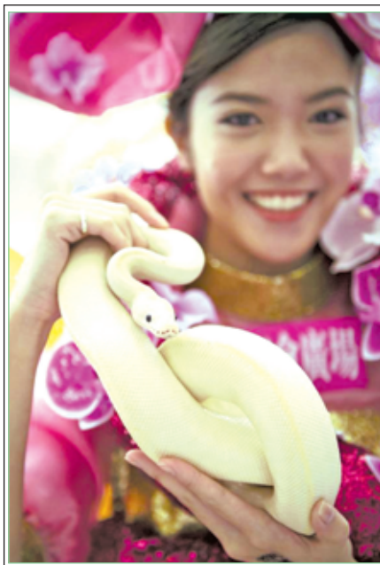
A model presents a white python during a snake show held in a shopping mall in Hong Kong, south China, on 10 Jan, 2013. The snake show was held here to welcome Chinese lunar new year, the Year of Snake on the Chinese Zodiac.

The Japanese foreign minister also paid a courtesy call on Philippine President Benigno Aquino III at noon on Thursday.