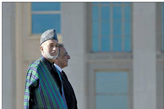
President of Afghanistan Hamid Karzai (L-R) and US Defence Secretary Leon Panetta stand for a full honours welcome at the Pentagon in Arlington, Virginia, on 10 Jan, 2013.

Panetta said both sides were committed to the goals approved at the NATO summit in Chicago in May, which calls for a continuing effort by members of the alliance to train, advise and assist Afghan forces.—Reuters