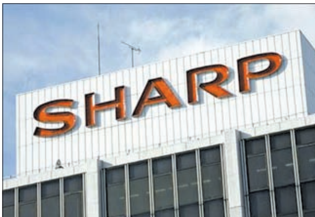
The Sharp Corp logo is seen at the company's showroom in Tokyo.

LAS VEGAS, 9 Jan—Sharp Corp is considering new ways to shore up its crumbling finances but is not talking with Intel Corp at the moment about any investment from the US chip-maker, a senior executive