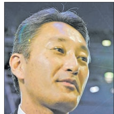
Sony Corp's President and Chief Executive Officer Kazuo Hirai speaks to reporters at CEATEC JAPAN 2012 electronics show in Chiba, east of Tokyo, on 2 Oct, 2012.

LAS VEGAS, 9 Jan—Sony Corp is considering the sale of its battery business but has made no decision yet, Chief Executive Kazuo Hirai said on Monday, as the company seeks to offload non-core assets and revive its consumer electronics business.