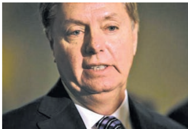
US Senator Lindsey Graham (R-SC) speaks to the Press following his private meeting with United States UN Ambassador Susan Rice about the attack on US diplomats in Benghazi, Libya, on Capitol Hill in Washington, on 27 Nov, 2012.

The president is focused on ensuring that those who are responsible for the deaths of the Americans in Benghazi should be brought to justice "not the political fascination of appearances on Sunday shows," he told a News briefing.—Reuters