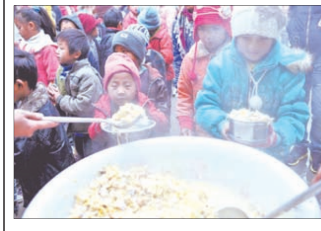
Pupils wait to get nutritious lunch at Longdong Primary School in De'e Township of Longlin Autonomous County of All Nationalities, southwest China's Guangxi Zhuang Autonomous Region, on 8 Jan, 2013. Nutritious lunch has been provided for 1.16 million pupils and students of elementary and middle schools in 40 counties and districts of the region.—XINHUA

There are reports of shortages of bread, wheat flour and cooking gas caused by deteriorating security situation in the country, Byrs said.—Xinhua