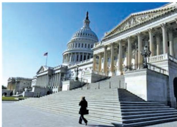
The US Capitol Dome is seen behind the entrance to the US Senate (R) on Capitol Hill in Washington, on 9 Nov, 2012.

But the deal did little to instill confidence about the nation's economic direction as Republicans and Democrats prepare for more showdowns over taxes and spending in the