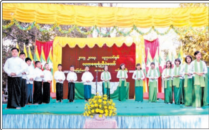
Students from BEHS(2) Tatkon opened the 2012-2013 School Family Day Festival on 6 January.