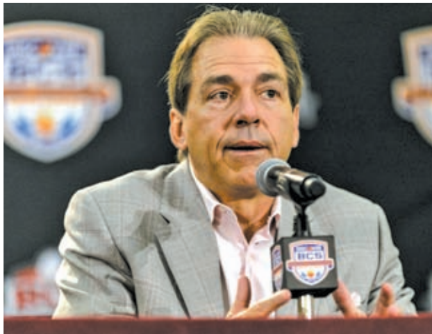
University of Alabama head coach Nick Saban

very difficult time thinking that I could impact the organization in the way that I wanted to or the way that I was able to in college," he said before highlighting some of the reasons he prefers working with student athletes. "It was very difficult for me, because there's a lot of parity in the NFL, there's a lot of rules in the