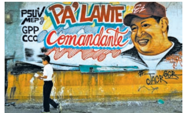
A child walks past a mural depicting Venezuela's President Hugo Chavez in Caracas on 8 Jan, 2013.

Opposition leaders argue that Congress chief and Chavez ally Diosdado Cabello should take over,