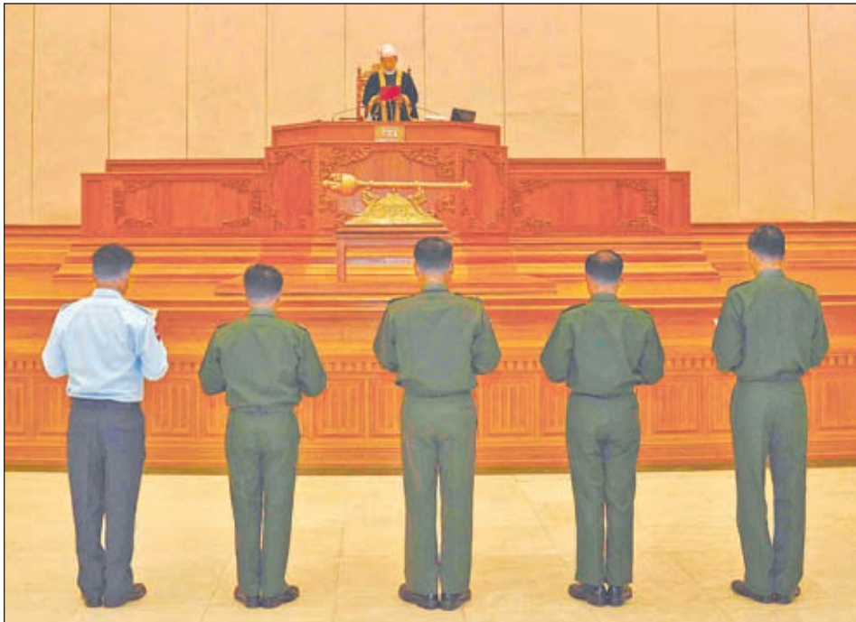
Five Pyithu Hluttaw representatives take affirmation in the presence of Pyithu Hluttaw Speaker.

NAY PYI TAW, 9 Jan— Speaker of Pyithu Hluttaw Thura U Shwe Mann. In his opening address of the sixth regular session of Pyithu Hluttaw here today, Thura U Shwe Mann also called for coordination and cooperation between the