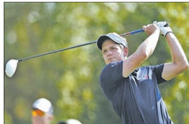
Luke Donald of England watches his shot from the third tee during the final round of the DP World Tour Championship at Jumeirah Golf Estates in Dubai on 25 Nov, 2012.

had told associates and anti-doping officials he was considering an admission of using banned drugs. The Times said Armstrong hoped to persuade anti-doping officials to allow him to resume competition in athletic events that adhere to the World Anti-Doping Code, under which the Texan is currently subject to a lifetime ban. Reuters