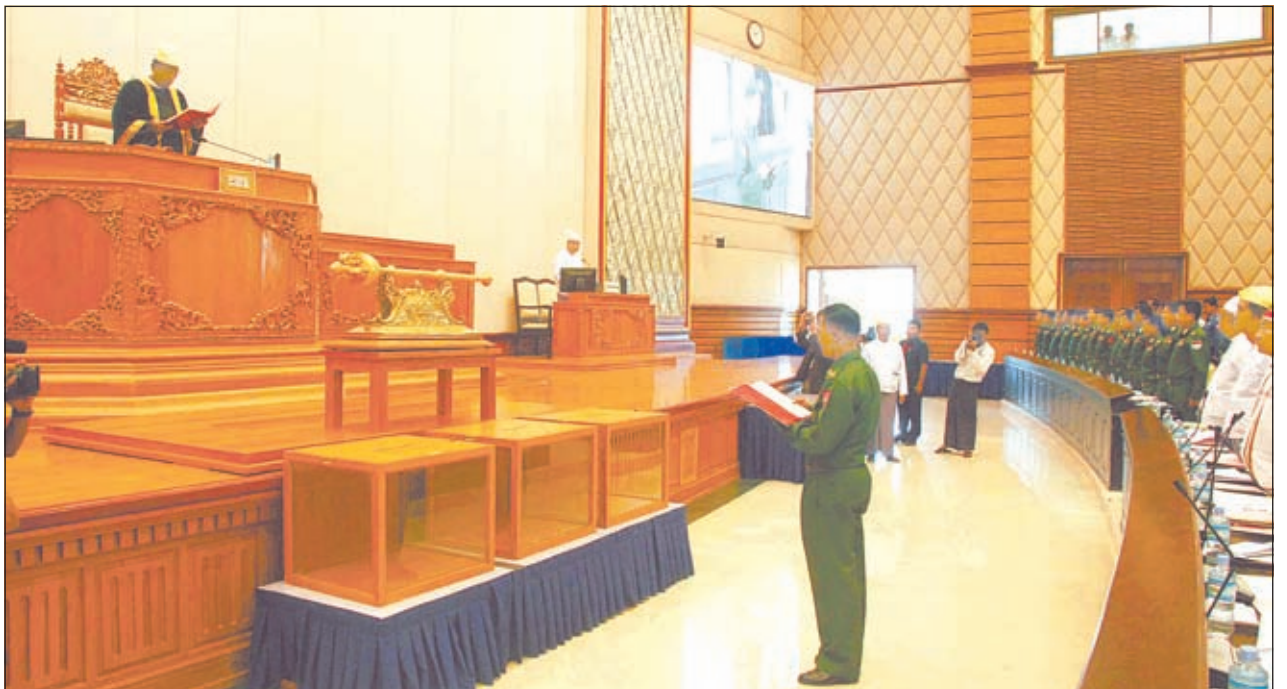
An Amyotha Hluttaw representative takes affirmation at Amyotha Hluttaw.