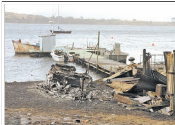
Photo taken on 8 Jan, 2013 shows a burnt house at Boomer Bay of the southeastern island state of Tasmania, Australia. The fires in Tasmania are reported to have destroyed about 100 homes, and other parts of Australia are on high alert as temperatures soar.

What you can do today, don't postpone until tomorrow.