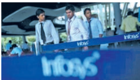
Employees of software company Infosys walk past Infosys logos at their campus in the Electronic City area in Bangalore on 4 Sept, 2012.—REUTERS

Infosys is due to post October-December results on Friday after issuing a series of disappointing growth targets last year. Infosys shares fell 16.2 percent in 2012 underperforming peer Tata Consultancy Services (TCS.NS) which rose 8.2 percent in the same period.— Reuters