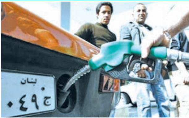
A worker pumps petrol into a customer's car at a fuel station in Sidon, southern Lebanon, on 25 Feb, 2011.

Fourth-quarter GDP data due next week may give a brighter picture. A Reuters poll showed the economy may have grown 7.8 percent in October-December versus 7.4 percent in the previous quarter, snapping seven quarters of weaker