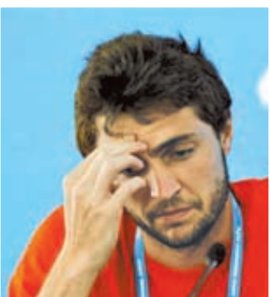
Gilles Simon of France talks during a news conference at the Sydney International tennis tournament on 9 Jan, 2013. Simon withdrew from the tournament due to a neck injury.