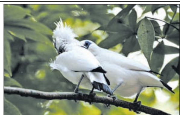
Two birds play on branches in the aviary of Hong Kong Park in south China's Hong Kong, on 8 Jan, 2013. The aviary, covering an area of 3,000 square meters, is located on a valley in the south of the park.