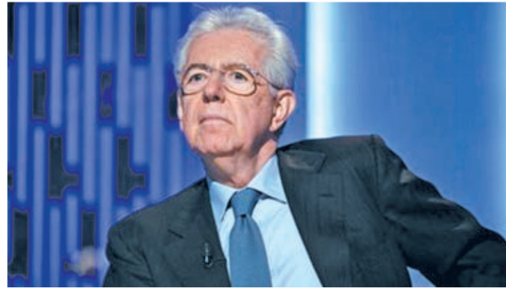
Italy's outgoing Prime Minister Mario Monti poses before the taping of the talk show "Otto e mezzo" (Eight and a half) at La7 television in Rome on 4 Jan 2013.

The billionaire media owner's biggest problem in implementing his strategy is Monti, whose centrist alliance has the same aim as Berlusconi: winning