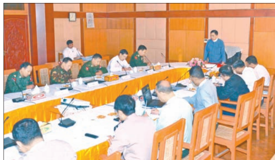
Meeting of Printers, Publishers, Registration and Distribution Supervisory Central Committee in progress.—MNA

The Union Minister and officials held a press conference on preparation on the SEA Games and training of athletes.—MNA