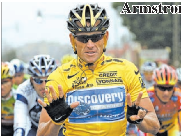
Seven-time Tour de France winner Lance Armstrong