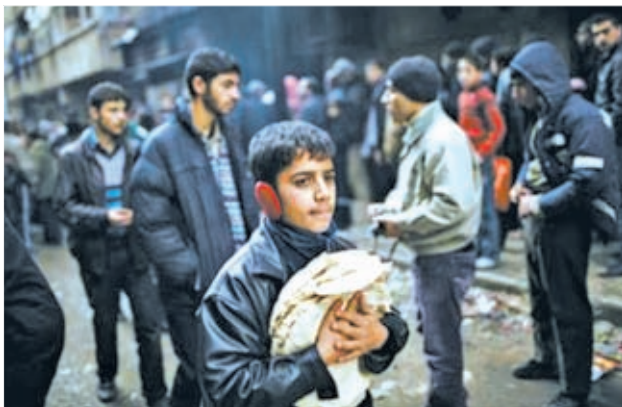
A boy holds pita bread as others stand in line outside a bakery in Aleppo in this 21 Dec, 2012 file photo.

ALEPPO, 9 Jan—At a crowded market stall in Syria, a middle-aged couple, well dressed, shuffle over to press a folded note, furtively, into the hand of a foreign reporter. It is the kind of silent cry for help against a reign of fear that has been familiar to journalists visiting Syria over the past two years. Only this is not the Damascus of President Bashar al-Assad