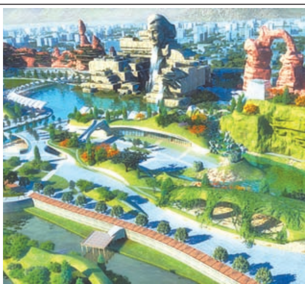
The design sketch shows the scenery of the "Yellow River Mother" cultural theme park, which is located in Lanzhou, the capital of Gansu Province.