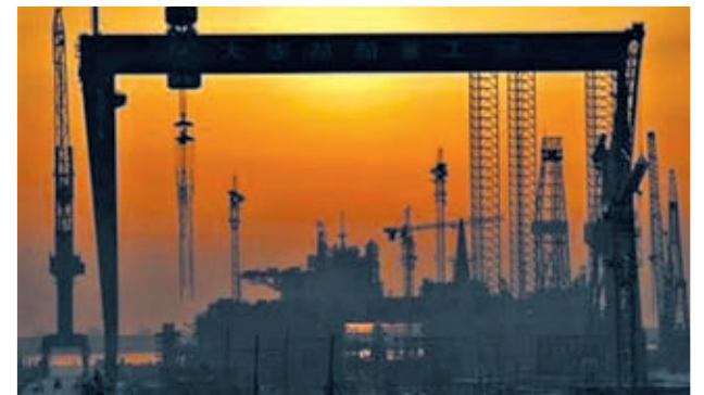
The Dalian Shipbuilding Industry Co, Ltd working area is seen at sunrise in Dalian, Liaoning Province, on 1 Jan, 2013.

Economic activity has picked up since September, supported by faster infrastructure investment and a heating up of the housing market. The factory sector is also picking up as the de-stocking cycle, during which firms ran down