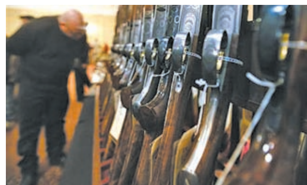
A man looks at a shotgun during the East Coast Fine Arms Show in Stamford, Connecticut, on 5 Jan, 2013. The show is being held despite the mayor’s plea that the event not be held so soon after last month’s massacre at an elementary school in nearby Newtown.