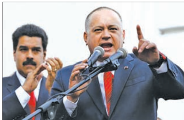
Venezuelan Vice President Nicolas Maduro (L) listens to National Assembly President Diosdado Cabello speak during the assembly inauguration in Caracas on 5 Jan, 2013.

Late on Friday, Maduro gave the clearest indication yet that the government was preparing to delay Chavez’s inauguration for a new six-year term, which is sched-