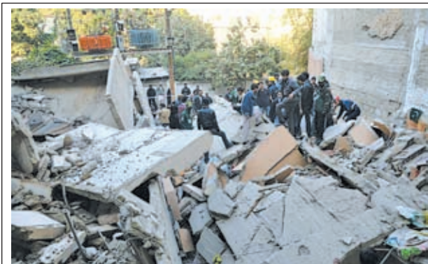
Rescuers work at the blast site in southern Pakistani port city of Karachi on 5 Jan, 2013. Three explosions struck central locations in the city including a grenade attack on a police van and a remote controlled bomb blast outside the office of a political party leader on Saturday, local media reported.