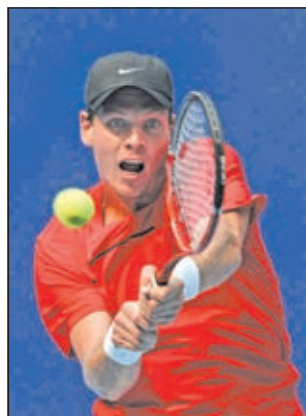
World number six Tomas Berdych

Berdych, however, who reached the quarter-finals in Chennai earlier this week,