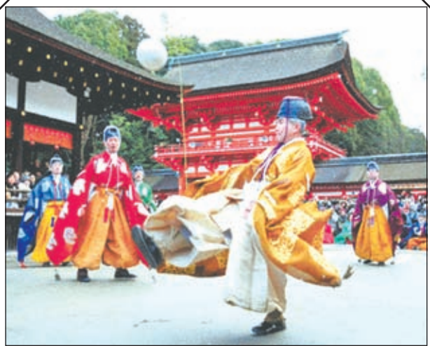
Men in Heian era (eighth to 12th centuries) aristocratic attire demonstrate “kemari” (ancient football) in an event at Shimogamo Shrine in Kyoto on 4 Jan, 2013.