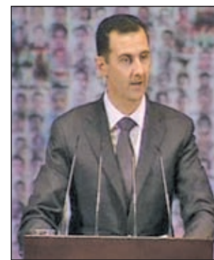
Syria’s President Bashar al-Assad speaks at the Opera House in Damascus in this still image taken from video on 6 Jan, 2013.

“The first stage of a political solution would require that regional powers stop funding and arming (the op-