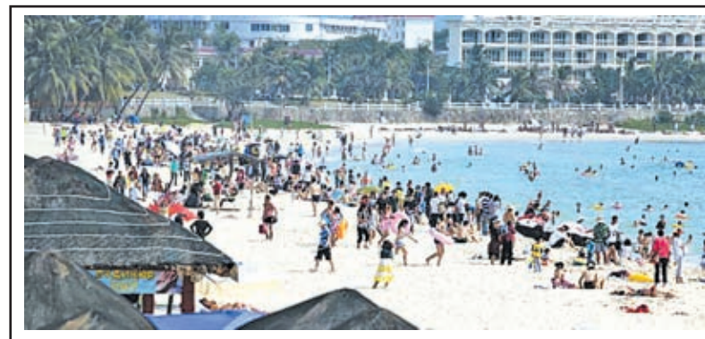
Tourists enjoy sunbath at a beach in Sanya, a popular winter tourism destination in south China's Hainan Province, on 5 Jan, 2013.

Li promised to investigate these issues and called on rural doctors to protect themselves during their work. Three of the doctors also attended a meeting held by the State Council's leading group for medical and health care reform to provide their opinions on policies.—Xinhua