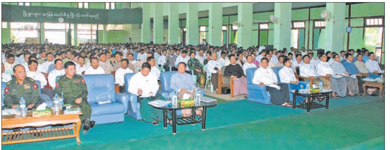
Speaker of Pyithu Hluttaw Thura U Shwe Mann meeting with departmental personnel and local people at Toe Shwewah Hall in Maubin.

party also attended state-level prize awarding ceremony and presented prizes to winners at essay, poem, computer-paintings contests, sport events and performing arts competitions.