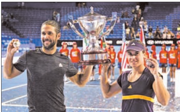
Fernando Verdasco (L) and Anabel Medina Garrigues of Spain hold up the Hopman Cup and their diamond encrusted silver balls after defeating Novak Djokovic and Ana Ivanovic of Serbia in the final of the Hopman Cup tennis tournament in Perth on 6 Jan, 2013.

PERTH, 6 Jan — Spain secured a surprise victory in the Hopman Cup with a comeback triumph against