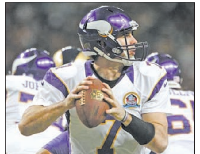
Minnesota Vikings quarterback Christian Ponder looks for a pass during the first half of their NFL football game against the St Louis Rams in St Louis, Missouri, on 16 Dec, 2012.