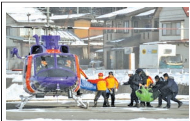
Police officers transport a climber (R) recovered in a rescue operation by helicopter from a mountain in Takayama, Gifu Prefecture, on 5 Jan, 2013. The climber, a 50-year-old man, was later confirmed dead due to exposure.

Authorities in Handan did not say how many households were affected by the cut-off. Residents in several parts of Handan told Xinhua reporters that the water supply had not resumed on Saturday evening.—Xinhua