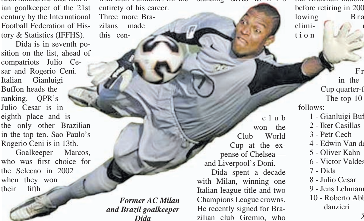
Former AC Milan and Brazil goalkeeper Dida