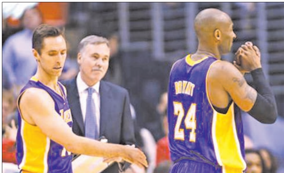
Los Angeles Lakers' Steve Nash (L), head coach Mike D'Antoni (C) and Kobe Bryant react after losing possession of the ball in the final minute of the fourth quarter against the Los Angeles Clippers in their NBA basketball game in Los Angeles on 4 Jan, 2013.

some pain. Howard skipped team practice on Saturday and received treatment from the Lakers' training staff but D'Antoni was not too worried, saying the centre's chances of playing on Sunday were "good." Bench player Jordan Hill,