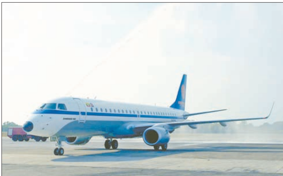
Second Embraer 190-AF XY-AGP for Myanmar Airways arrives at Yangon International Airport.—MNA