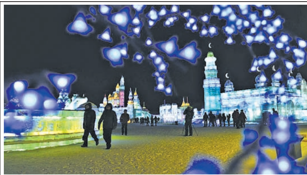
Photo taken on 5 Jan, 2013 shows the night scenery of the Ice and Snow World during the 29th Harbin International Ice and Snow Festival in Harbin, capital of north-east China's Heilongjiang Province. The festival kicked off on Saturday.