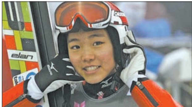
Japanese teenager Sara Takanashi

SCHONWALD, (Germany), 6 Jan—Japanese teenager Sara Takanashi returned from a training crash in spectacular form on Saturday, with her third victory this season on the women's World Cup ski jump circuit in Schonwald, Germany.