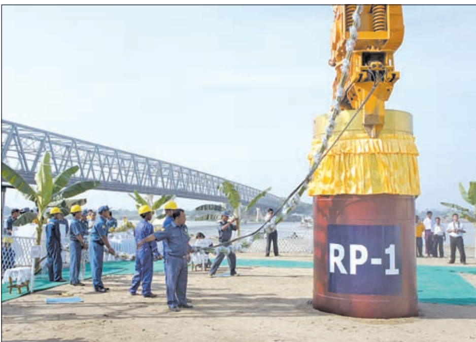
A ceremony to launch driving of stake for construction of Bayintnaung Bridge-2 in progress.

In point of fact, vultures are just like other wintering birds. They do not bring or represent any bad omen or good sign for any particular place or person. The six vultures were visitors taking a short refuge at our sacrosanct pagoda as the fast growing city has less trees and more high-rise concrete buildings. There should not be any illogical fear because vultures are only birds.