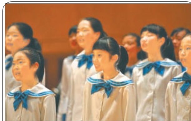
Members of the chorus of Beijing Fuxue Lane Primary School sing a song at the New Year’s Concert in Beijing, capital of China, on 5 Jan, 2013.