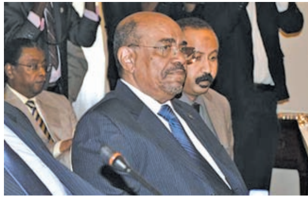
Sudan's President Omar Hassan al-Bashir attends a meeting with leaders from South Sudan at the National Palace in the Ethiopian capital Addis Ababa on 5 Jan, 2013.

"The presidents have also agreed that ... the necessary decisions are taken to create the safe demilitarized border zone," Mbeki told reporters. The AU would present a time frame