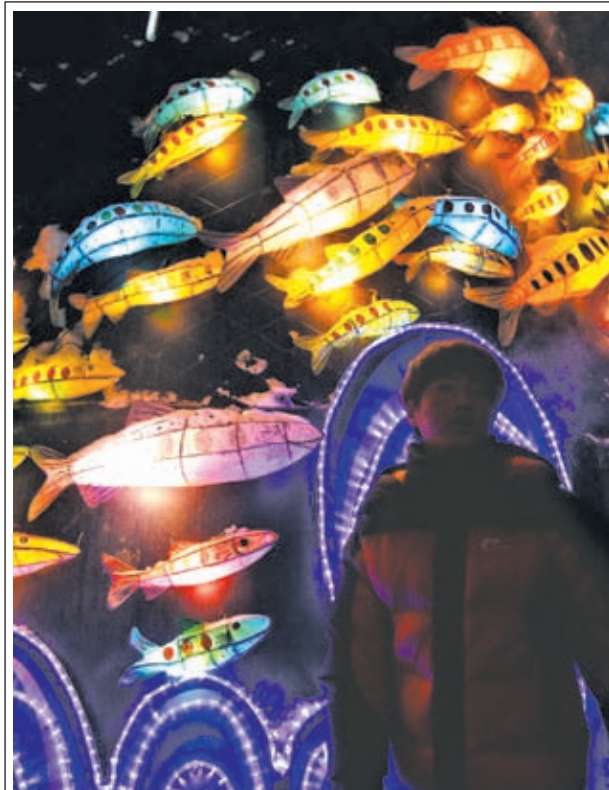
A man views fish-like lanterns during Hwacheon Sancheoneo Ice Festival in Hwacheon, Gangwon-do Province of South Korea, on 5 Jan, 2013. The annual Hwacheon Sancheoneo Ice Festival held here from 5 to 27 January attracts over one million people every year.