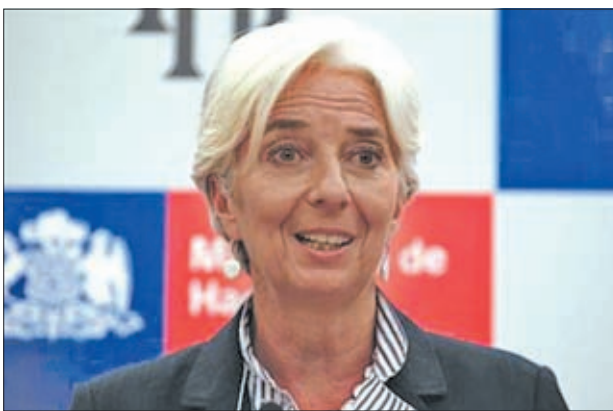
International Monetary Fund (IMF) chief Christine Lagarde at a news conference at the Finance Ministry building in Santiago, on 13 Dec, 2012.

"The Portuguese authorities and the Portuguese have been extremely courageous and