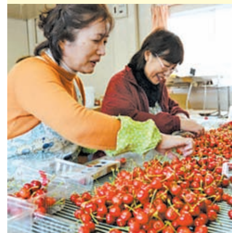
Women put greenhouse-grown cherries into packs in Tendo, Yamagata Prefecture, on 4 Jan, 2013, for the season's first shipment.