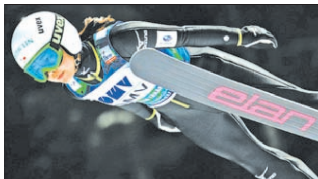
Japanese teenager Sara Takanashi