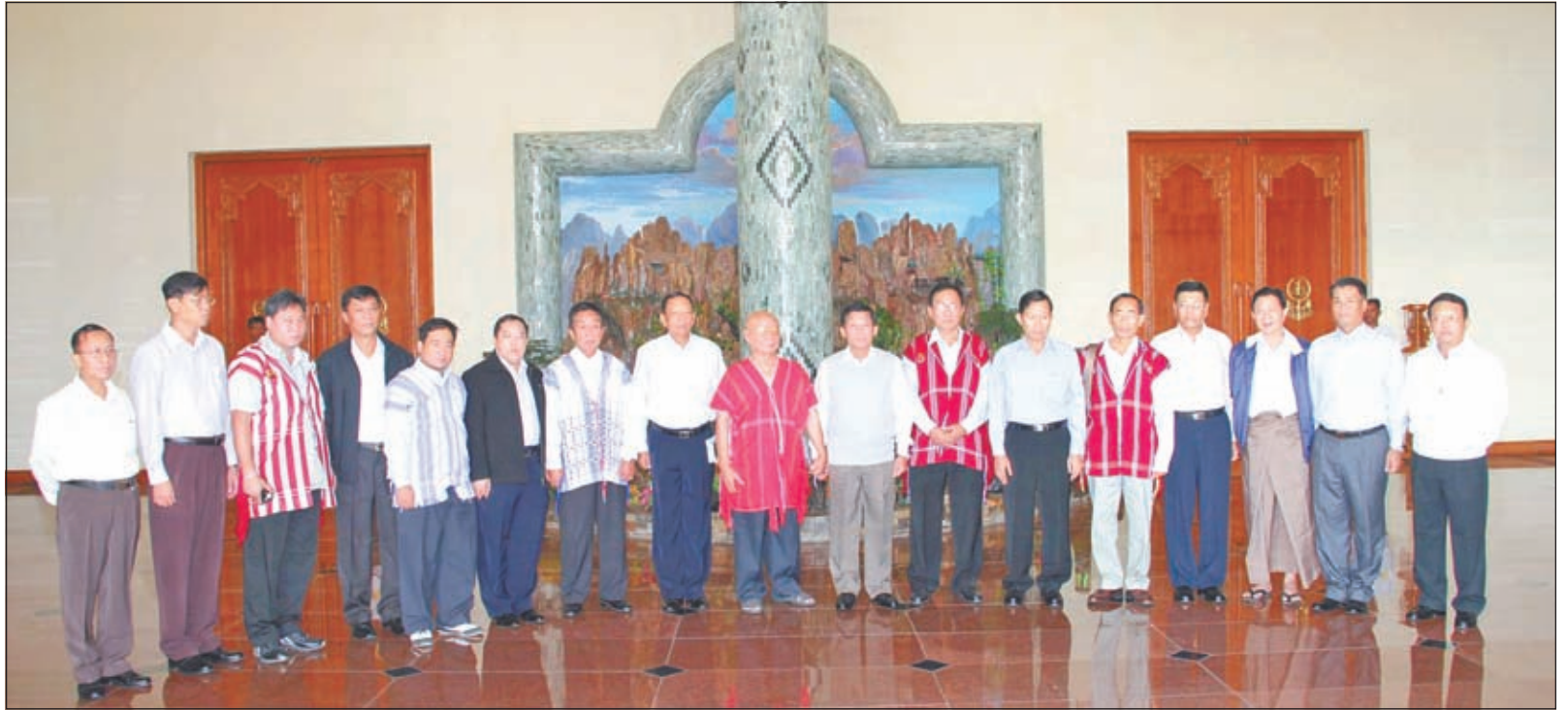
Commander-in-Chief of Defence Services Vice-Senior General Min Aung Hlaing, KNU Chairman General Mutu Sae Phoe and party pose for documentary photo.

peace and stability of Kayin State, vowing to strengthen the prevailing peace for development of the nation. He added that the military has dispatched mobile medical teams to stable regions to provide health care to local national races and the work has achieved considerable success. Those mobile medical teams are