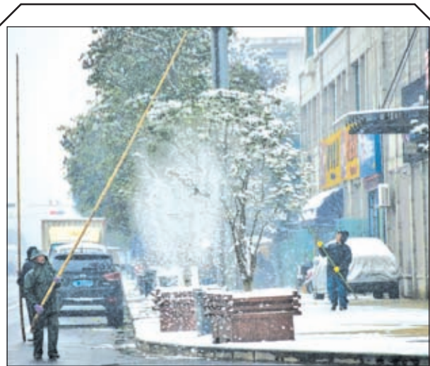
Sanitationmen clear the snow on the trees in Ji’an County, east China’s Zhejiang Province, on 4 Jan, 2013. Zhejiang Weather Bureau on Friday issued the first orange alert for road icing after the heavy snow and freezing weather since Thursday.

to Morocco and was due to make a stop in Spain, police sources said. The plane was registered in Morocco.— Xinhua