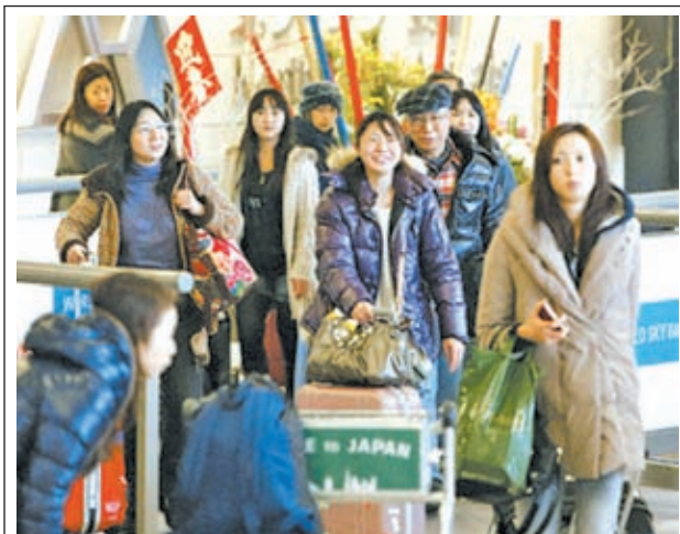
Travelers arrive at Narita Airport near Tokyo on 5 Jan, 2013, after spending the year-end and New Year holidays abroad.