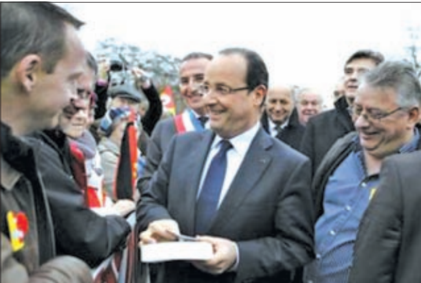
France's President Francois Hollande (C), flanked by Foreign Minister and local representative Laurent Fabius (C Rear), Val-de-Reuil's Mayor Marc-Antoine Jamet (L Rear) and French Minister for Industrial Recovery Arnaud Montebourg (R Rear), talks with Swiss Petroplus Petit-Couronne refinery workers in Val-de-Reuil, near Rouen, on 5 Jan, 2013.