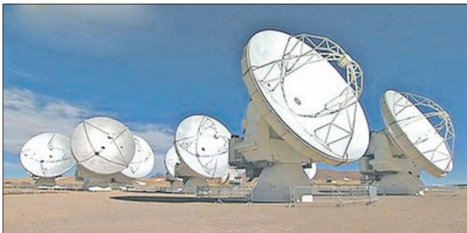
Photo shows the Alma radio telescope observatory in Chile, which will begin full-scale space observations in this month.

TOKYO, 6 Jan—The world's largest radio telescope is about to begin full-scale space observations this month.