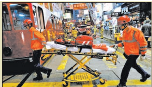
Rescuers work at a fire accident scene in Causeway Bay, south China's Hong Kong, on 5 Jan, 2013. A fire broke out from the top of a building in Causeway Bay, a shopping centre of Hong Kong on Saturday afternoon. There is no immediate report of casualties.