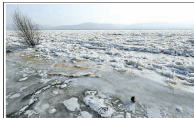
The Shizuishan segment of the Yellow River is frozen due to persisting cold weather in northwest China's Ningxia Hui Autonomous Region, on 5 Jan, 2012. Two segments of the Yellow River in Ningxia region have been frozen up due to low temperature.