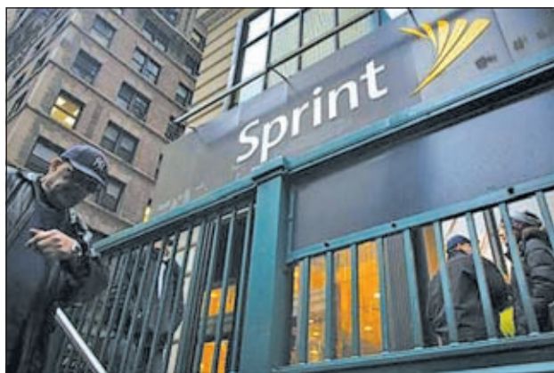
People walk past a Sprint store in New York on 17 Dec, 2012.